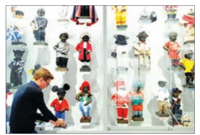
An employee adjusts one of the costumes of the famous Belgian statue Manneken Pis at the museum called GardeRobe MannekenPis in central Brussels, Belgium on 2 February, 2017.

The museum, called Garderobe MannekenPis