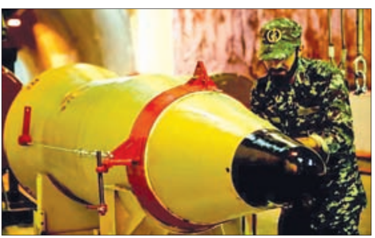
A member of the Iranian Revolutionary Guards checks a missile inside an underground depot in an undisclosed location, Iran, in this handout photo released by the official website of Islamic Revolutionary Guard Corps (IRGC) on 8 March 2016.

during his election campaign that he would stop Iran's missile programme.—Reuters