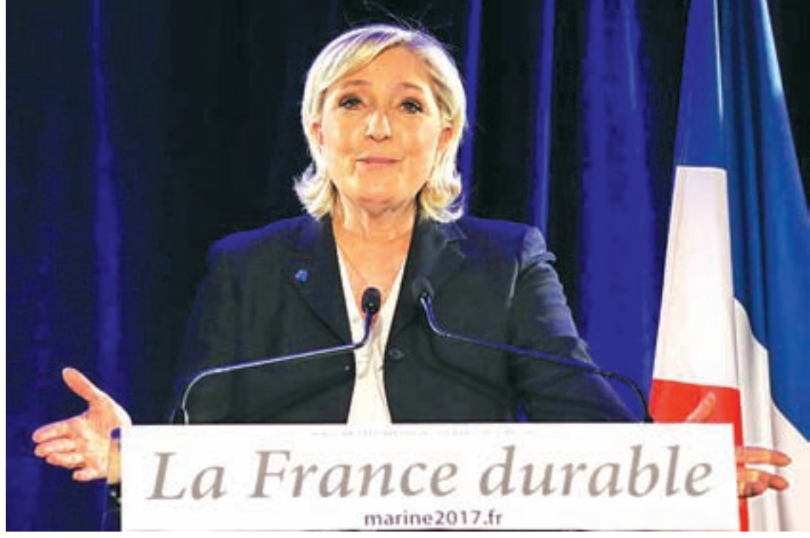
Marine Le Pen, French National Front (FN) political party leader and candidate for French 2017 presidential election, attends a news conference in Paris, France, on 26 January, 2017.

"The aim of this programme is first of all to give France its freedom back and give the people a voice," Le Pen said in the intro-