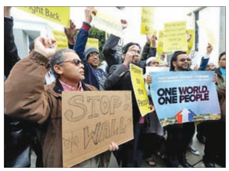
People hold protest signs after attending Friday prayers, to show solidarity with the Muslim community, at the Islamic Center of Southern California in Los Angeles, California, US on 3 February, 2017.

tice Department lawyer on what he called the "litany of harms" suffered by Washington state's universities, and also questioned the administration's use of the 11 September, 2001, attacks on the United States as a justification for the ban.