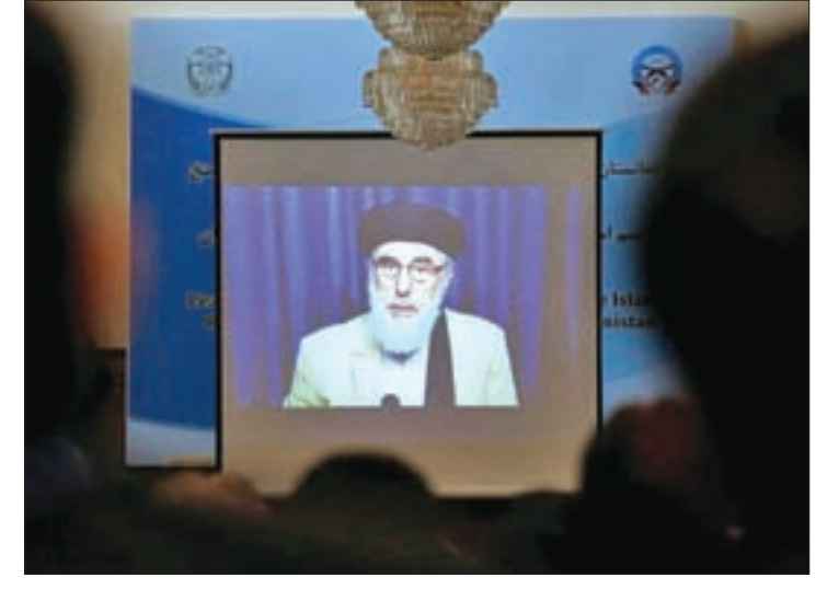
A screen shows the broadcast of Gulbuddin Hekmatyar during a signing ceremony with Afghan government at the presidential palace in Kabul, Afghanistan, on 29 September, 2016.

While playing only a small role in the current insurgent conflict in Afghanistan, Hekmatyar was a major figure during the bloody civil war of the 1990s, when he was accused of indiscriminately firing rockets into Kabul, as well as other human rights abuses.