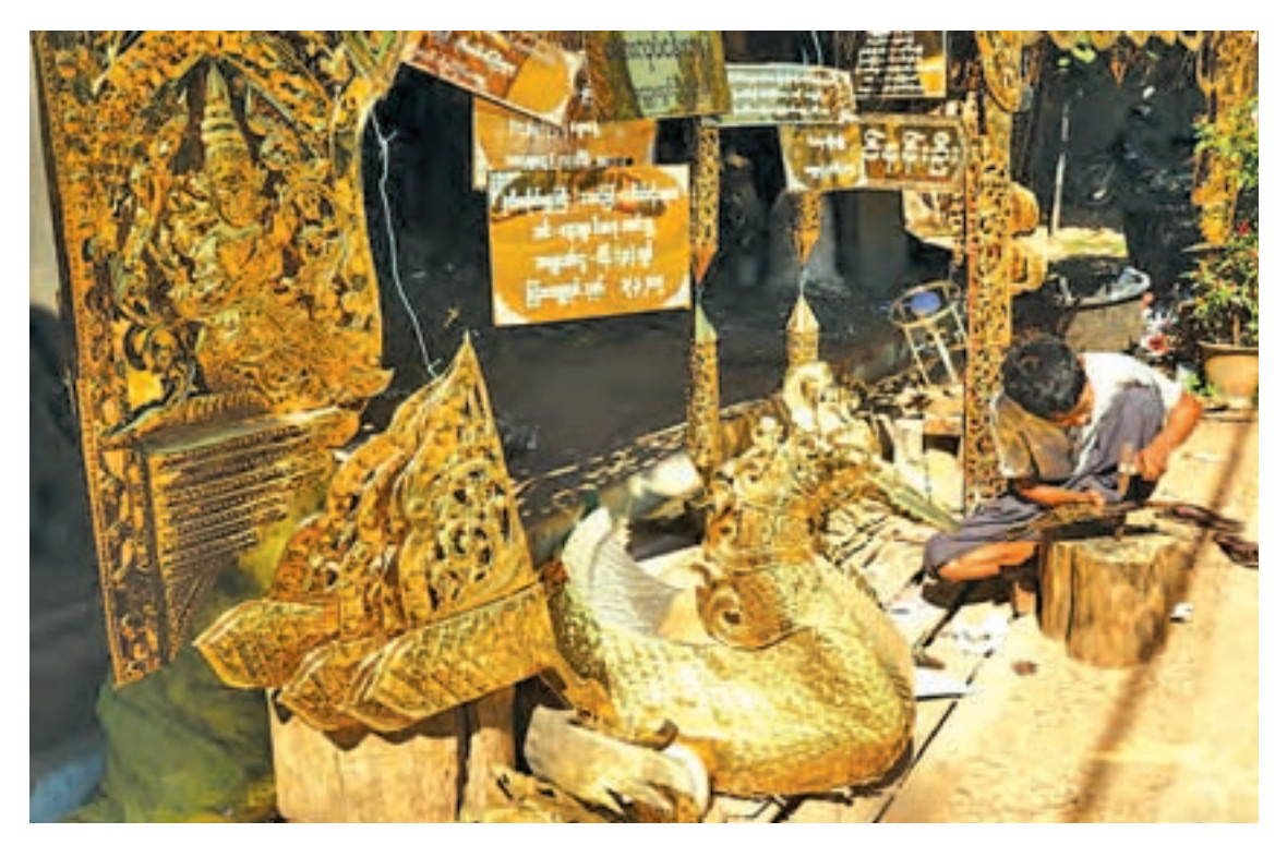
A worker creates a traditional floral design for religious edifice.

An artisan making item cast or wrought from bronze, copper, and brass is hired at Ks12,000 to 15,000 a day. Those assistants who are still learning are paid Ks8,000 a day. This job allows them to earn well, it is learnt. — Min Ma Haw (IPRD)