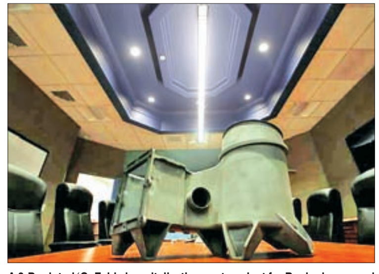
A 3-D printed 'OxFab' air revitalization system duct for Boeing's manned Starliner spacecraft made of 'OXPEKK' material by an EOS 3-D printer unit is seen at Oxford Performance Materials Inc., the maker of more than 600 parts to be used on the Starliner in South Windsor, Connecticut, US, on 31 January, 2017.

What really makes it valuable to NASA and Boeing is this