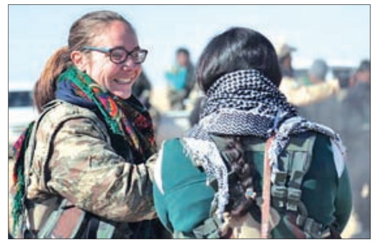
A volunteer British fighter talks with Syrian Democratic Forces (SDF) in the north of Raqqa city, Syria, on 3 February 2017.

the action was being undertaken with "increasing support from the (US-led) international coalition forces through guaranteeing air cover for our forces' advances, or via the help provided by their special teams to our forces on the battle ground".