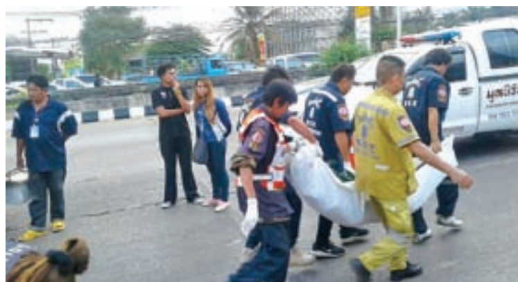
Bodies of Myanmar workers are taken by Thai police from the hospital to Thailand monastery.

Three Myanmar workers in Thailand were killed when a 10-wheeled vehicle struck them as they were riding their bicycles to work at 6 am yesterday.