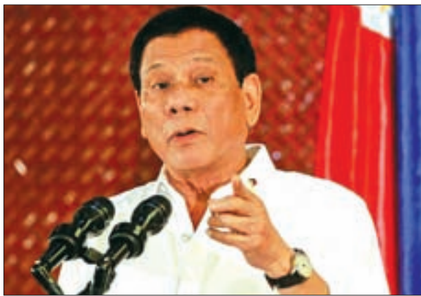
Philippine President Rodrigo Duterte gestures while addressing families of the 44 Philippine National Police-Special Action Force (PNP-SAF) members who were killed in a 2015 police operation, during a dialogue at the presidential palace in Manila, Philippines, on 24 January 2017.

Duterte's declaration follows his defence minister's assurance on Wednesday that the government would stick to a unilateral truce. The communists ac-