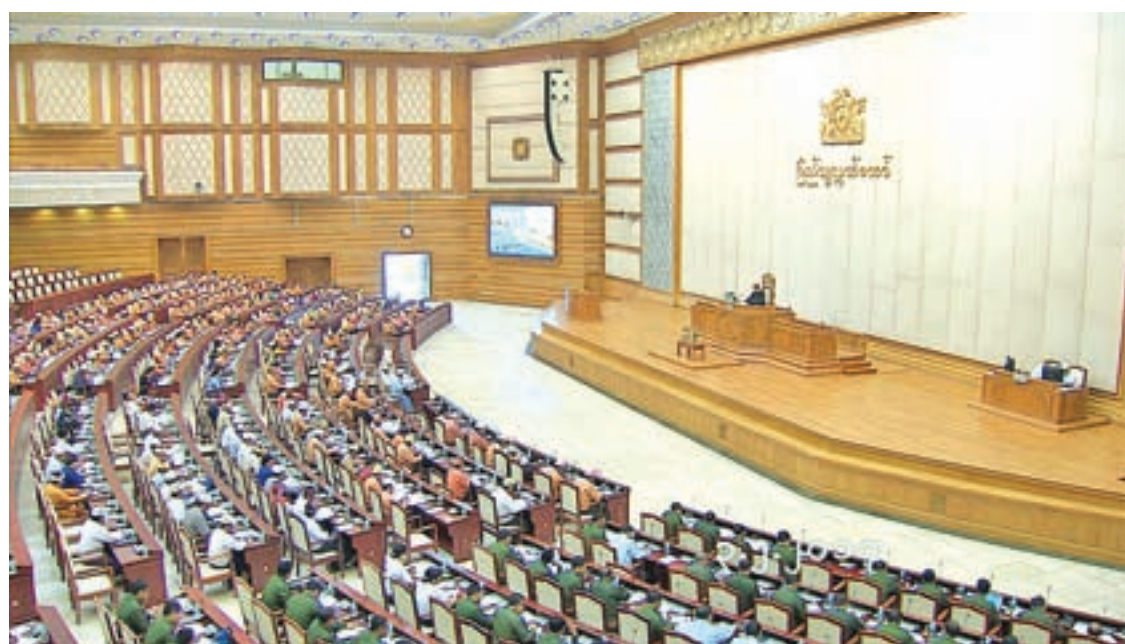
Pyithu Hluttaw is being convened in Nay Pyi Taw.

PYITHU Hluttaw continued its 3rd Day Meeting yesterday, in which 4 questioning, putting 2 motions to the Hluttaw, putting one revised motion and acquisition of Hluttaw's decision were made.