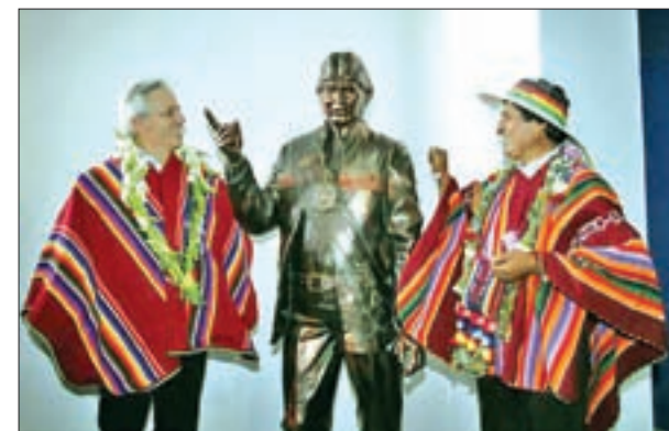
Bolivia's President Evo Morales (R) and Vice President Alvaro Garcia Linera pose with a statue of Morales after the inauguration of the Orinoca Museum in Orinoca, Bolivia, on 2 February 2017.

ORINOCA, (Bolivia) — Bolivia on Thursday opened a $7 million (£5.6 million) museum dedicated to President Evo Morales and indigenous peoples in Morales's birthplace of Orinoca high up in the deserts of the Bolivian antiplano.