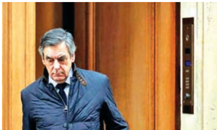
Francois Fillon, former French prime minister, member of The Republicans political party and 2017 presidential candidate of the French centre-right, leaves home in Paris, France, on 1 February 2017.

A daily IFOP poll of voting intentions for the 23 April first round showed Fillon down one percentage point since Wednesday to be level with Macron. Either