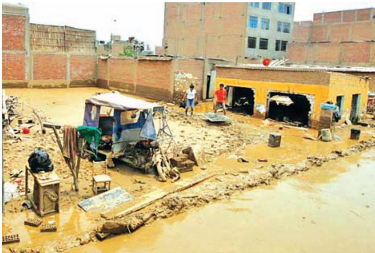
People walk on debris next to damaged houses after a landslide and flood in Lurigancho district in Chosica, Peru, on 2 February 2017.

"We definitely were not prepared for this type of thing," Prime Minister Fernando Zavala told reporters from a working-class neighbourhood in Lima, where dozens of houses were damaged by floods.