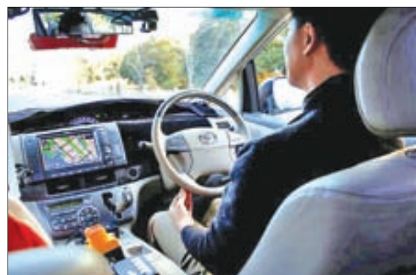
A worker of ZMP leaves his hands under the steering wheel in a RoboCar while the autonomous car makes its way during its demonstration in Tokyo, Japan, on 31 January 2017.

TOKYO — Japanese robotics startup ZMP Inc hopes to list on the Tokyo Stock Exchange in the coming months, after a delay late last year due to client information being leaked on to the internet, the firm's founder and CEO told Reuters on Friday.