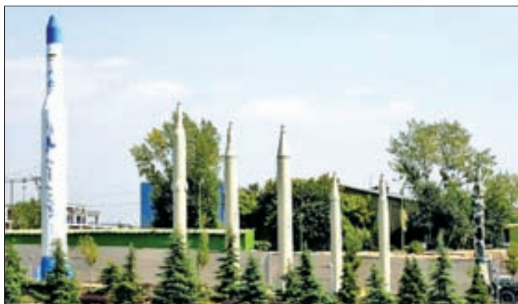
Iranian-made missiles are pictured at Holy Defence Museum in Tehran in 2015.

But the package, targeting both entities and individuals, was formulated in a way that would not violate the 2015 Iran nuclear deal negotiated between Iran and six world powers including Trump's predecessor, Barack Obama, they added.—Reuters