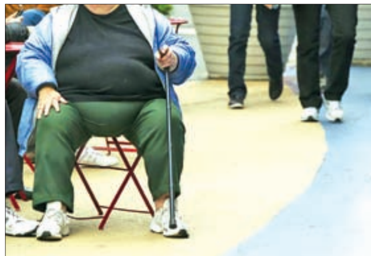
An overweight woman sits on a chair in Times Square in New York, in 2012.

Participants who internalized weight-related stigma were 41 per