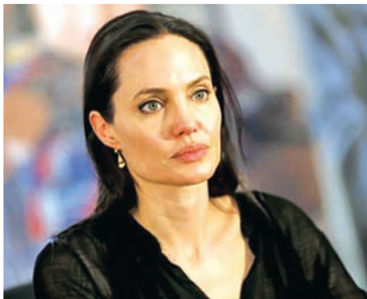
Angelina Jolie.

Jolie’s op-ed is the first comment she has made publicly since filing for divorce in September from her husband, actor Brad Pitt. The former couple share three adopted children from Cambodia, Viet Nam and Ethiopia, and three biological children, who were born in France and Namibia.—Reuters