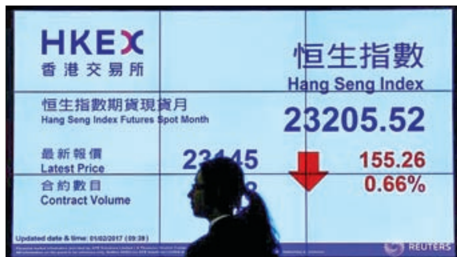
A billboard displays the morning trading on the first day of trade after Lunar New Year at the Hong Kong Exchanges in Hong Kong, on 1 February 2017.

HONG KONG — Chinese stocks slumped on Friday, sending Asian markets skidding for their biggest losses in two weeks after Beijing unexpectedly raised short-term interest rates, adding to growing concerns about US President Donald Trump's aggressive policies.