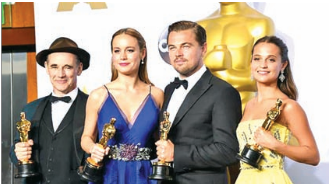
Oscars 2017: Academy Award winners Leonardo DiCaprio, Brie Larson, Mark Rylance and Alicia Vikander will return to the Oscars stage as presenters.

Vikander won a supporting role gong for her performance in “The Danish Girl.” The Oscars, produced by Michael De Luca and Jennifer Todd and hosted by Jimmy Kimmel, will be telecast on 26 February.—PTI