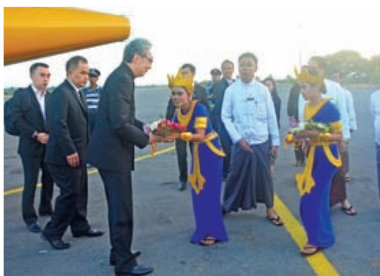
Deputy Minister HE Dr Somkid Katusripitak is welcomed by women in Bagan-era dress at the NyaungU Airport.

The delegation was welcomed at Bagan-Nyaung-U Airport by Mandalay Region Planning and Finance Minister U Myat Thu and Permanent Secretary of the Ministry of Hotels and Tourism U Ye Mon.— A-one Soe