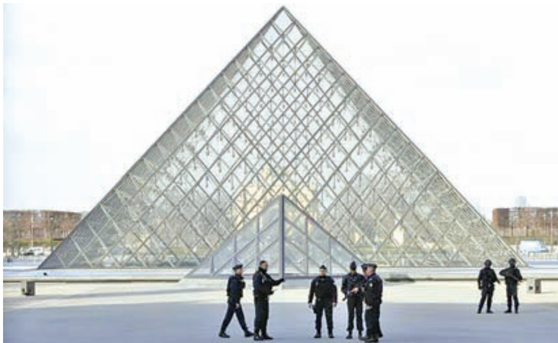
French police secure the site near the Louvre Pyramid in Paris, France, on 3 February 2017 after a French soldier shot and wounded a man armed with a knife after he tried to enter the Louvre museum in central Paris carrying a suitcase, police sources said.