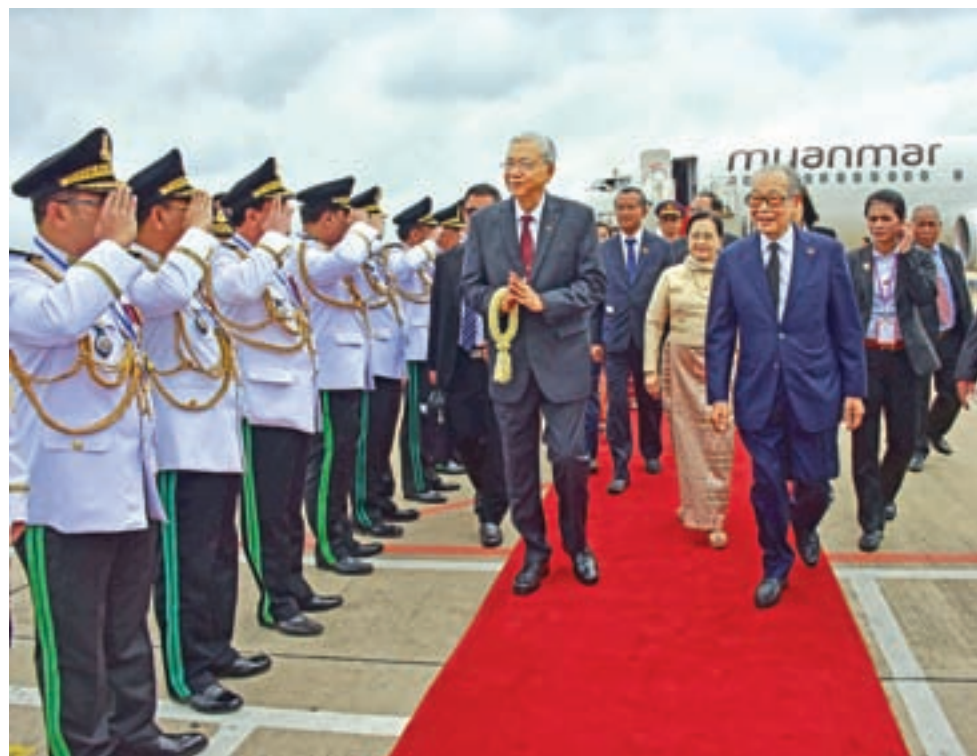
President U Htin Kyaw and the First Lady receive a red-carpet welcome on their arrival at Phnom Penh, Cambodia.

"We firmly believe that bilateral cooperation will bring about the remaining opportunities to be implemented in multi-sector cooperation. Myanmar is always ready to cooperate closely with Cambodia in the international sphere for the preservation of regional and global peace, stability and development," the President said.— Myanmar News Agency