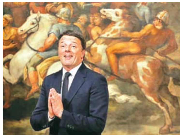
Former Italian Prime Minister Matteo Renzi gestures during a ceremony at the Chigi Palace in Rome, Italy, on 12 December 2016.

The anti-system 5-Star Movement is polling roughly level with the PD, and would beat it by a wide margin if the PD's