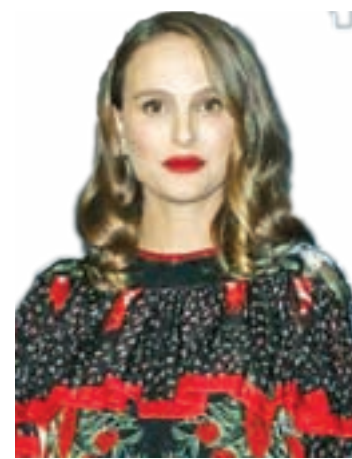
Natalie Portman has praised John Hurt for his “incredible” performance in “Jackie” saying she was impressed by his willingness to learn.

Hurt, who had starred in more than 200 films and televi-