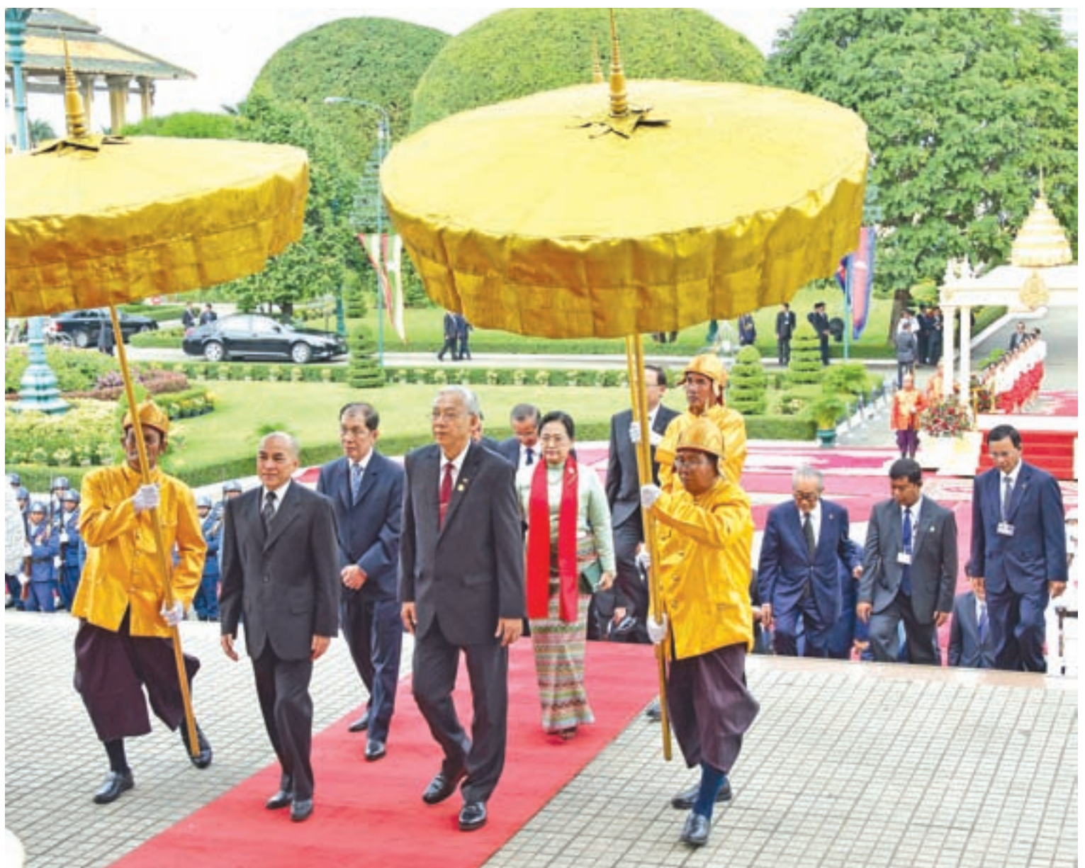
SEE PAGE 3 >> President U Htin Kyaw and First Lady receive a ceremonial welcome in Phnom Penh, Cambodia at the Palace of the King.

The President and the First Lady were then taken to the Intercontinental Hotel, where the Deputy Prime Minister presented a floral basket from the King of Cambodia.