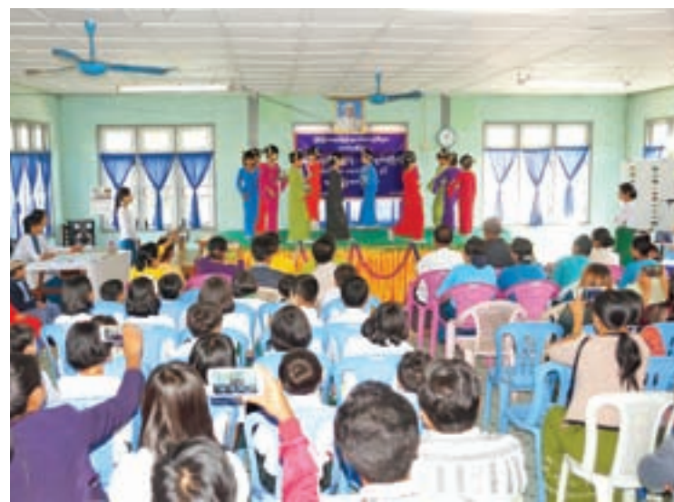
Children perform dance and songs at the Public Library of Toungoo District.

As part of the event, students performed songs and officials offered presents to the students.