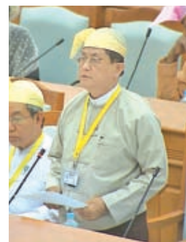
U Maung Maung Win, Deputy Minister for Finance and Planning.