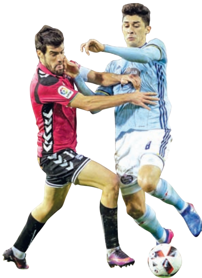
Celta Vigo's Pablo Hernandez (R) and Alaves' Manu Garcia in action during Spanish King's Cup Sem-final first leg at Balaidos stadium, Vigo, Spain, on 2 February 2017.

MADRID — Celta Vigo rattled the crossbar, but could not find a breakthrough as they were held to a goalless draw at home in the first leg of their King's Cup semi-final against Alaves on Thursday.