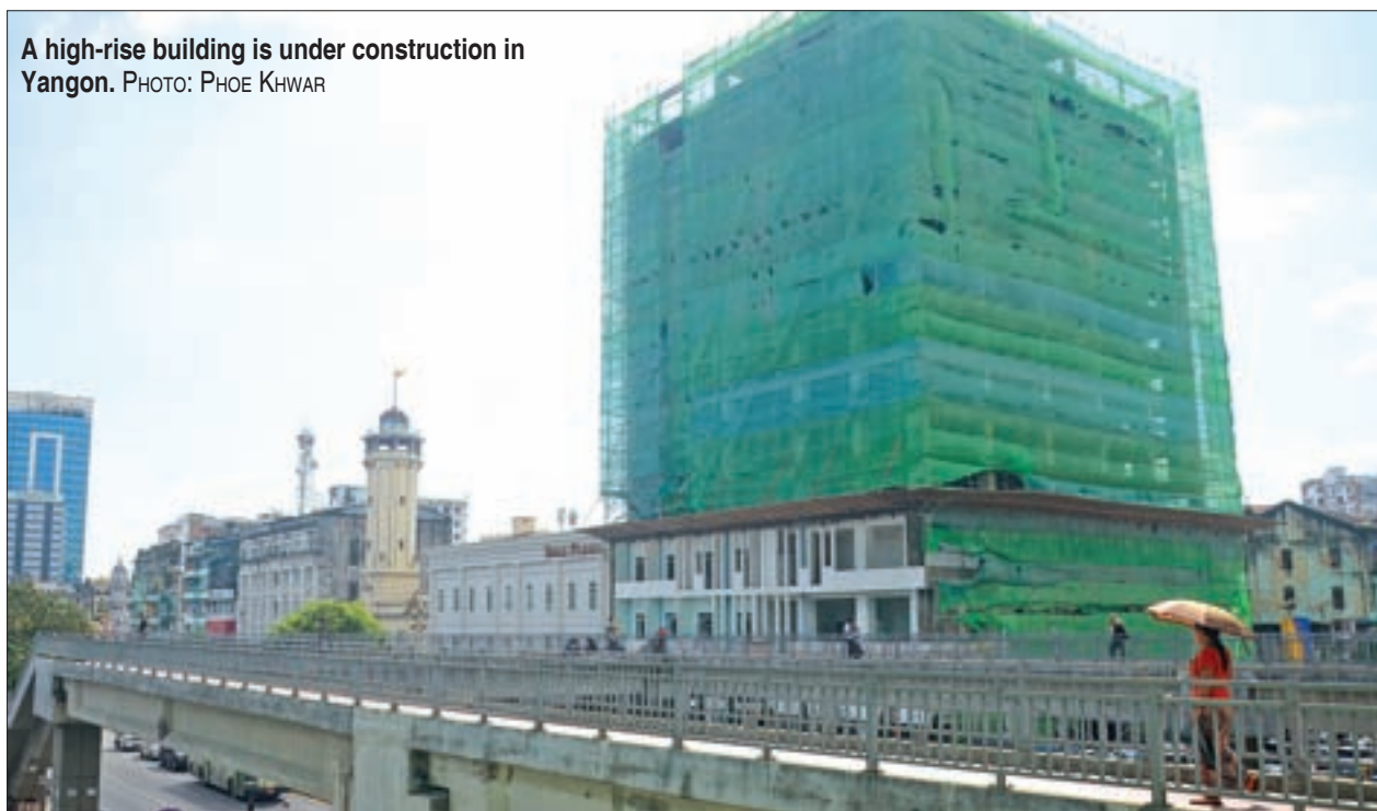
A high-rise building is under construction in Yangon.

Farmers who have traditionally plowed and harvested their land using traditional manual methods face financial hardships when purchasing tractors and agricultural machines.—200