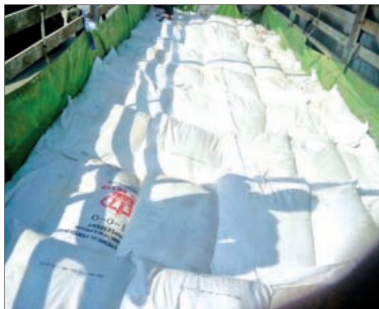
Seized bags of Crown Brand chemical fertilizer.