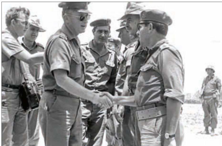
FILE PHOTO: Israeli military Chief of Staff Yitzhak Rabin (C) shakes hands with soldiers stationed in the Negev Desert on 30 May, 1967 before the Middle East War, in this handout picture released by the Israeli Government Press Office (GPO). PHOTO: REUTERS

In the film Rabin says that based on the chance encounter with Nasser months after Israel’s founding in 1948, he had high hopes Nasser’s overthrow of Egypt’s monarchy in 1952