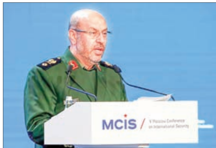
Iranian Defence Minister Hossein Dehghan delivers a speech as he attends the 5th Moscow Conference on International Security (MCIS) in Moscow, Russia, on 27 April 2016.

DUBAI — Iran said on Wednesday it had test-fired a new ballistic missile, prompting a tough response from a senior adviser to US President Donald Trump.