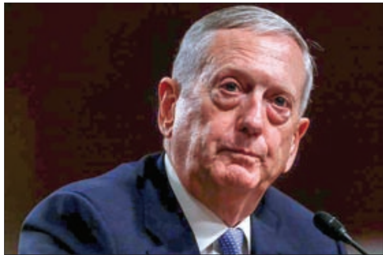
Retired US Marine Corps General James Mattis testifies before a Senate Armed Services Committee hearing on his nomination to serve as defence secretary in Washington, US, on 12 January 2017.

The US defence chief will also hold talks with his South Korean counterpart Han Min-koo on Friday morning in the South Korean defence ministry's headquarters in Seoul, before traveling to Japan for another two-day trip.