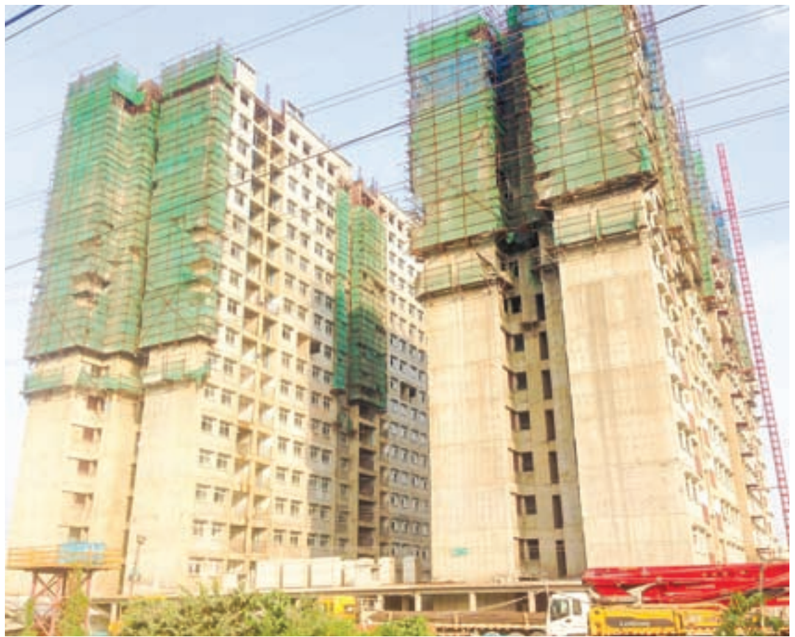
Ayeyawun and Yadana housing projects is under construction at Dagon Seikkan, Yangon.

The housing complex was designed by Surbana Jurong and the project includes 49 eighteen-storeyed buildings, according to the Urban and Housing Development Department. Private businessmen have been invited to take part in this housing development project, it is learnt.