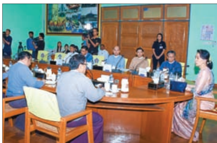
State Counsellor Daw Aung San Suu Kyi stresses need to provide health care services to temporally displaced persons.

The State Counsellor went on to say that she hoped the