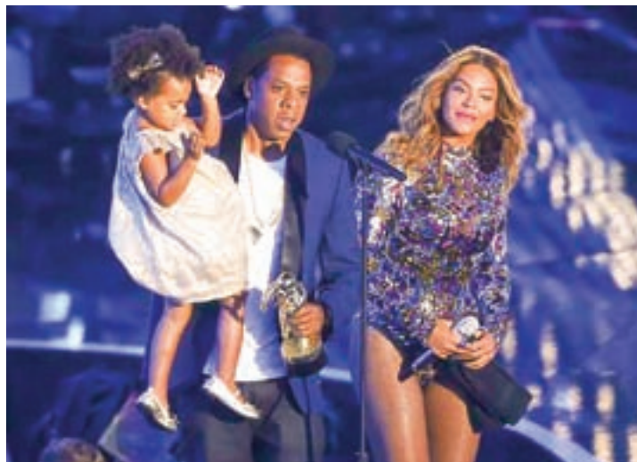
Jay-Z presents the Video Vanguard Award to Beyonce as he holds their daughter Blue Ivy during the 2014 MTV Video Music Awards in Inglewood, California in 2014.

a year after the release of Beyonce's album "Lemonade," in which she appeared to address long-standing rumors of trouble in her eight-year marriage.