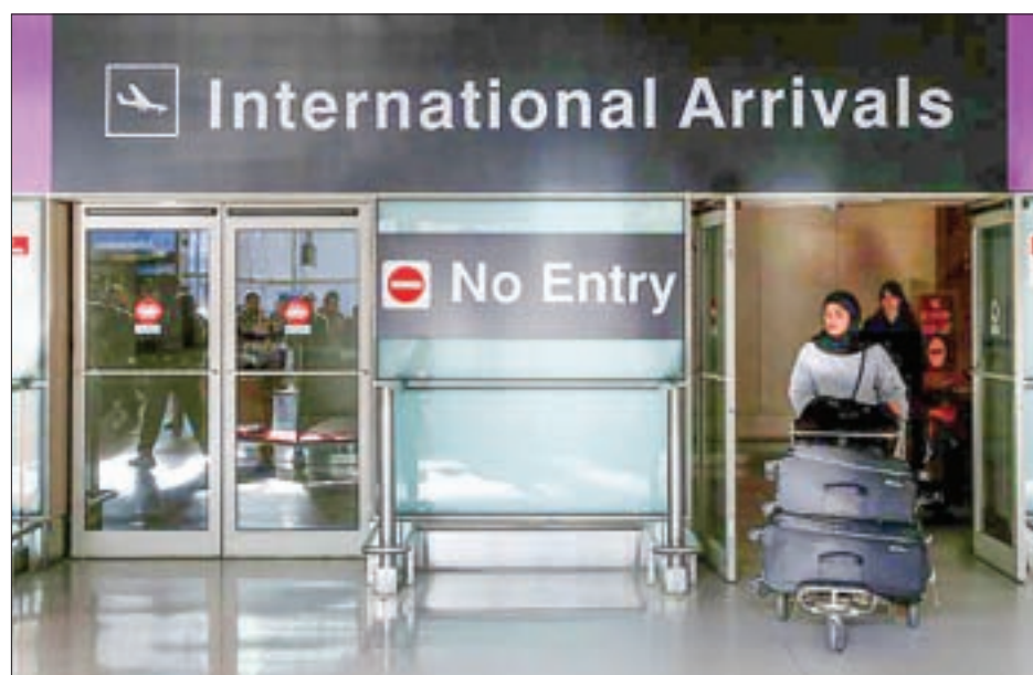
An international traveler arrives after US President Donald Trump's executive order travel ban at Logan Airport in Boston, Massachusetts, US on 30 January 2017.

Oxfam provides humanitarian aid to families in five of the countries on the travel ban — Syria, Iraq, Somalia, Yemen, and