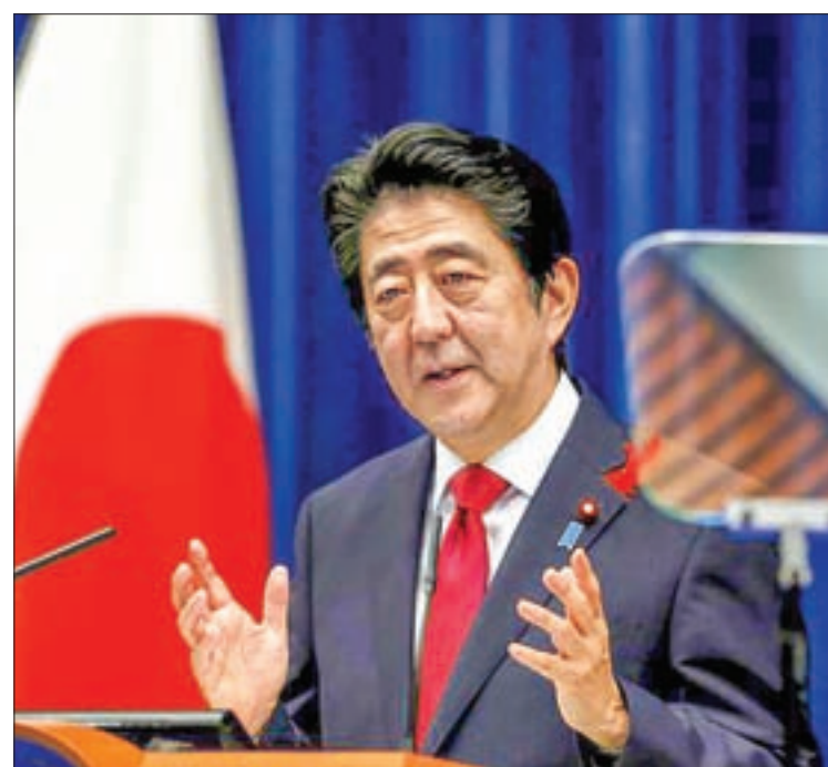
Japan's Prime Minister Shinzo Abe.

Japan is expected to defend its auto sector, which has built many manufacturing plants in the United States. Japan is also ex-