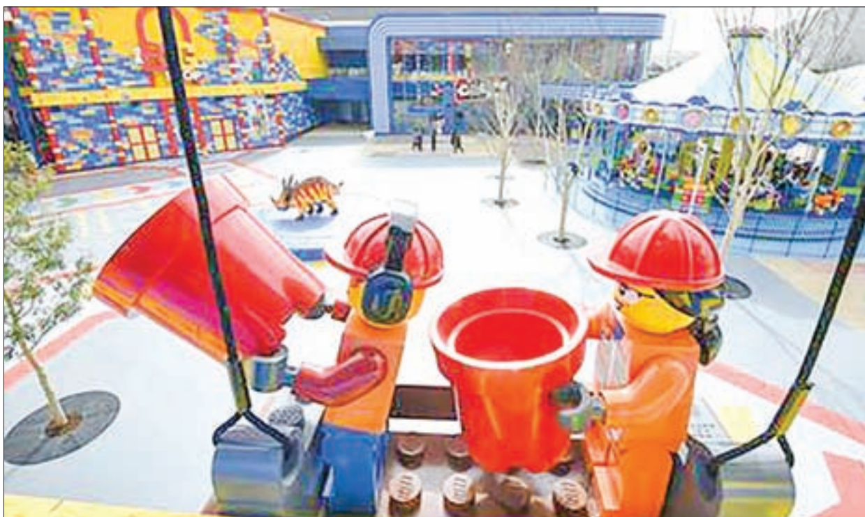
Reporters are allowed to visit new entertainment park “Legoland Japan” in the central Japan city of Nagoya, on 2 February 2017, prior to its opening in April. It is Japan's first outside Legoland facility.

Children aged 2 or younger can enter the park for free. Indoor Lego-block parks operate in Tokyo and Osaka. —Kyodo News