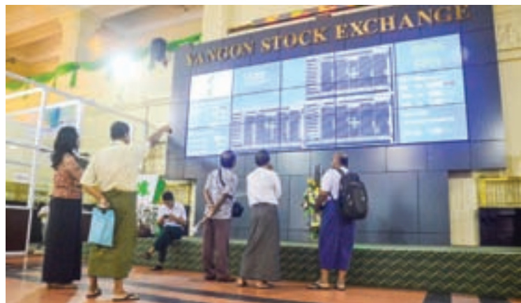
Visitors look at the electronic board showing the stock informations on 11 November 2016.

Stock trading at the Yangon Stock Exchange (YSX) reached over Ks73billion by the end of January with 300,107 shares worth Ks 2,824,520,800 traded last month, according to the statistics of YSX.