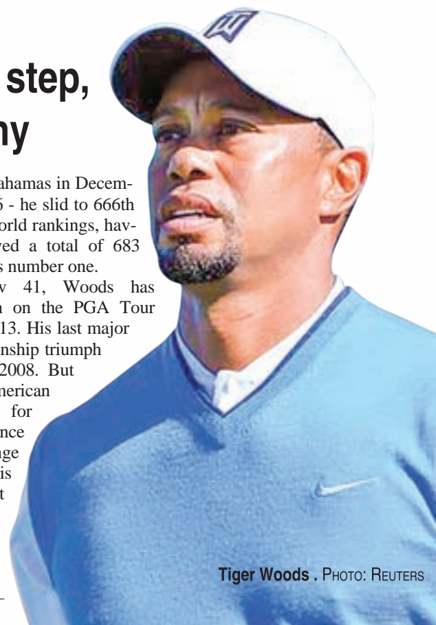
Tiger Woods.

Now 41, Woods has not won on the PGA Tour since 2013. His last major championship triumph was in 2008. But the American is glad for the chance to change that this week, at a tournament he has won twice.—Reuters