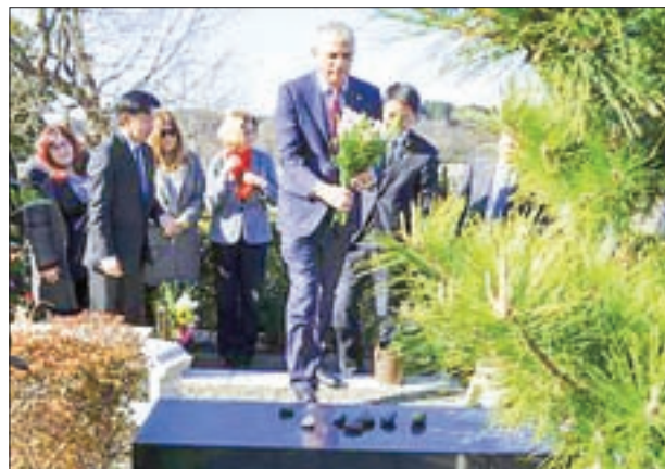
Israeli Finance Minister Moshe Kahlon (C) offers flowers at the grave of the late Japanese diplomat Chiune Sugihara, who saved thousands of Jews from Nazi persecution during World War II, in Kamakura, southwest of Tokyo, on 1 February 2017.

Although he was pressured to leave the ministry upon his return to Japan, his act was praised by Israel and the United States.— Kyodo News