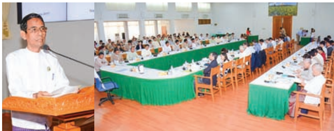
Union Minister Dr Aung Thu delivers an opening speech at the MoALI meeting in Nay Pyi Taw.

The company pledged to share agricultural techniques to the local farmers, planning to extend the market for their organic products.—Than Oo (Laymyathnar)