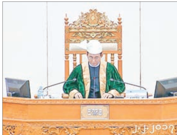
Speaker U Win Myint.

U Win Myint Oo, also known as U Ne Myo of Nyaungshwe and parliamentarians constituency