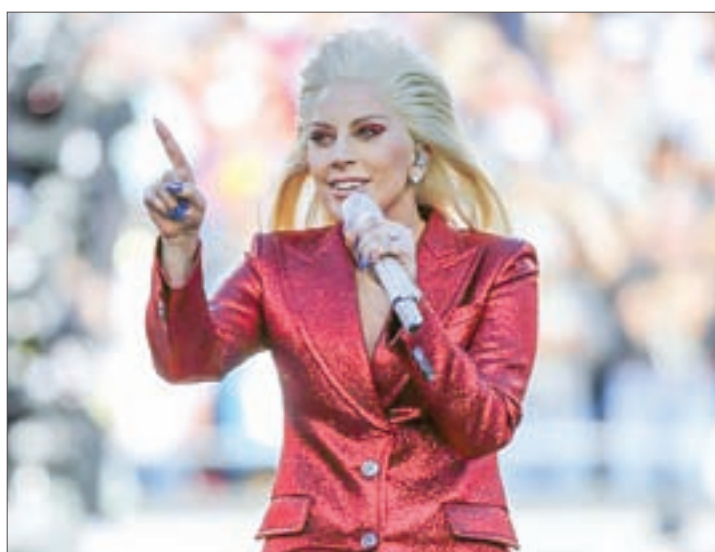
Lady Gaga sings the US National Anthem before the start of the NFL's Super Bowl 50 between the Carolina Panthers and the Denver Broncos in Santa Clara, California in 2016.

When it comes to the Super Bowl's 100 million-plus television audience, the 30-year-old