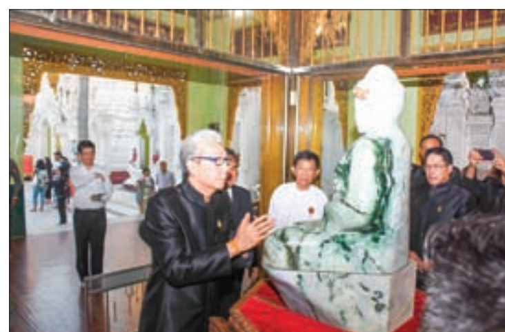
Deputy Prime Minister Dr Samkid Jatusripitak pays homage to Jade Buddha Image at the Shwedagon Pagoda.