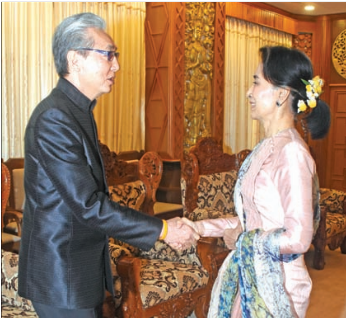
State Counsellor Daw Aung San Suu Kyi welcomes Deputy Prime Minister of Thailand Dr Somkid Jatusripitak yesterday in Nay Pyi Taw after talks on bilateral cooperation.

Thai Commerce Minister Apiradi Tantraporn, who is part of a trade mission to Myanmar, said that under their close strategic partnership, Thailand and Myanmar