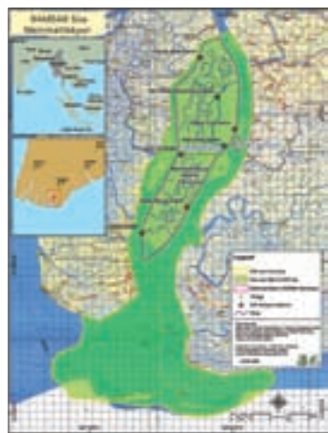
Maps of Meinmahla Kyun.

Indawgyi lake is Myanmar's second Ramsar site, which is located in Mohnyin township in the Kachin state in 2015. The country's first Ramsar site was Moeyungyi Wetland in Bago region, designated in 2004. There are now three listed Ramsar sites in Myanmar, accomplished with the assistance of Switzerland. Additionally, there are 14 places in Thailand, four places in Cambodia, eight places in Viet Nam and two places in Laos.—GNLM