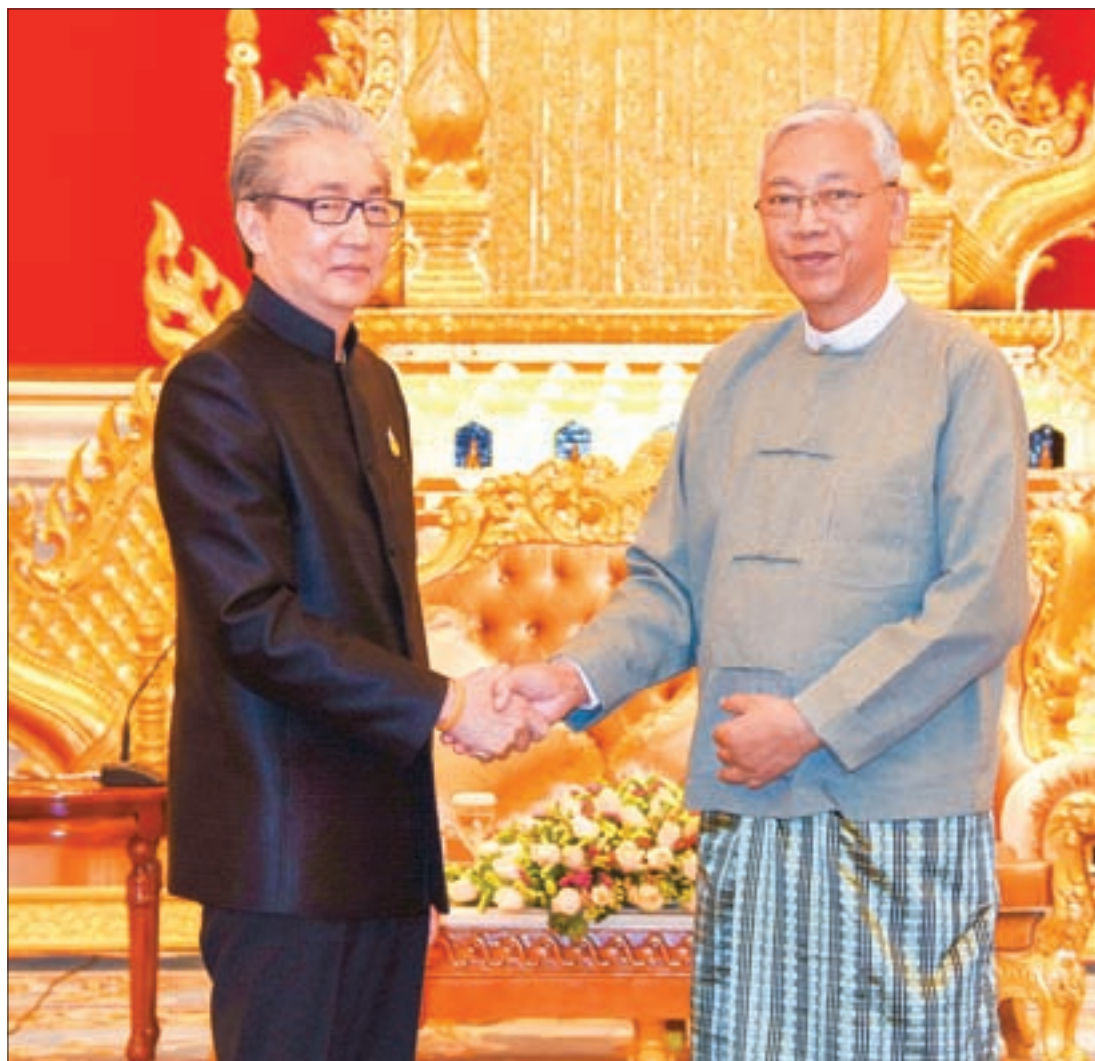
President U Htin Kyaw welcomes Deputy Prime Minister of Thailand Dr. Somkid Jatusripitak.

Also present were Union Minister for Electricity and Energy U Pe Zin Tun, Minister of State for Foreign Affairs U Kyaw Tin and Deputy Minister for Planning and Finance U Maung Maung Win and officials. — Myanmar News Agency