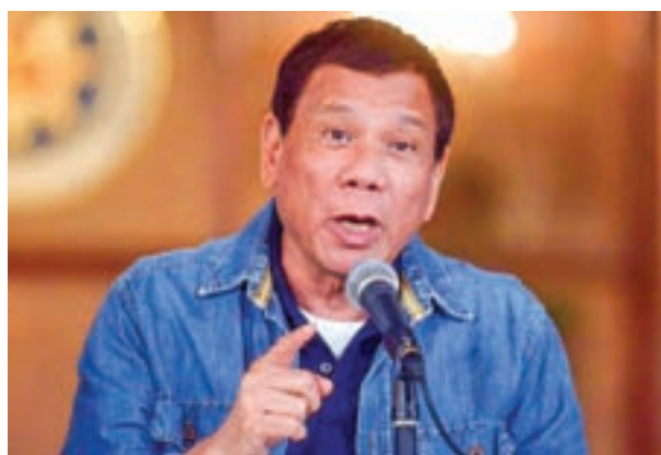
Philippine President Rodrigo Duterte gestures while speaking during a late night news conference at the presidential palace in Manila, Philippines, on 30 January 2017.

"I still have to write the, whether it is a proclamation or an executive order, but I've taken in the AFP and raised the issue of drugs as a national se-