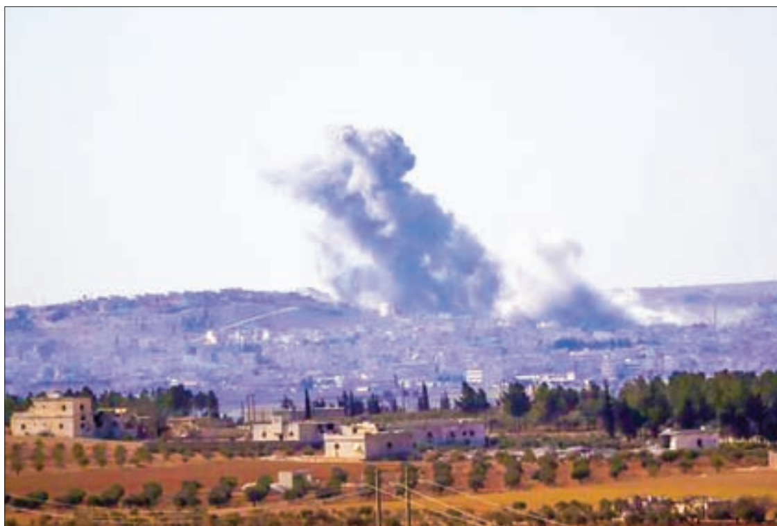
Smoke rises from the northern Syrian town of al-Bab, Syria on 1 February 2017.

If a clash does occur, it would be the first time Syrian government forces have confronted the Turkish army on the ground in northern Syria since