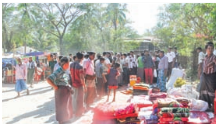
Villagers check out goods sold by a mobile shop.

The committee set Kyeingyaung, Ngakhuya, Khamaung-