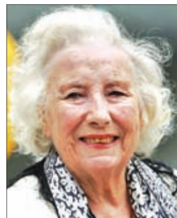
Second World War British Forces Sweetheart Vera Lynn attends the Battle of Britain commemoration outside the Churchill War Rooms in London in 2010.

came the oldest living artist to land a UK No.1 album with a compilation release called "We'll Meet Again: The Very Best of Vera Lynn".