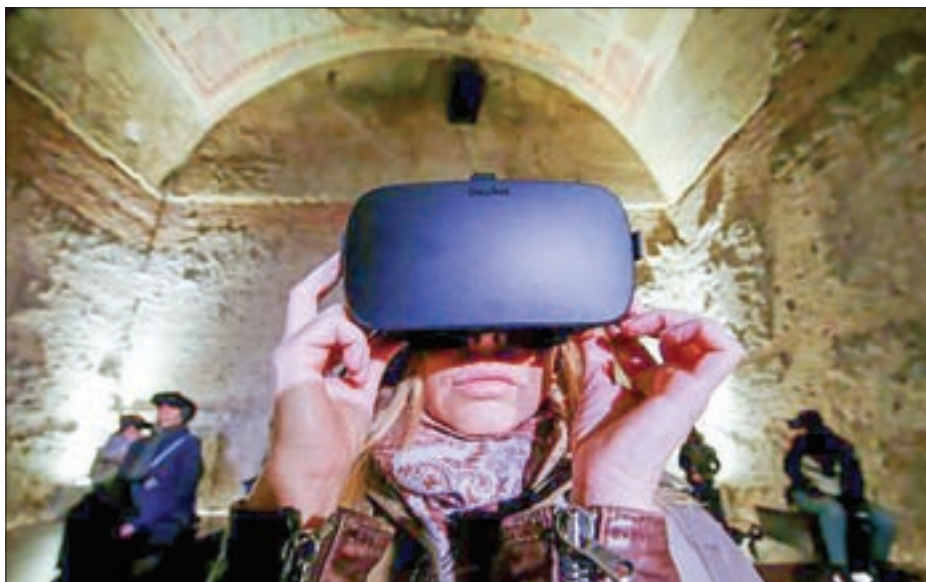
A woman wears a virtual reality device during a visit at the Domus Aurea, built by Roman Emperor Nero in 64 AD and later buried by Emperor Trajan in Rome, Italy, on 31 January 2017.

the later Emperor Trajan, who built his baths on top, the palace was rediscovered in the 15th century. It has been undergoing restoration in recent years.