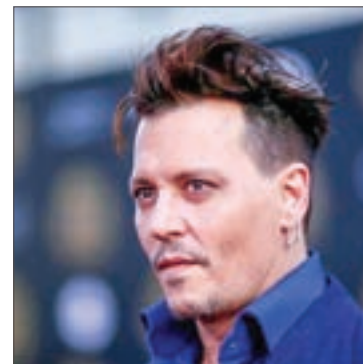
Johnny Depp.