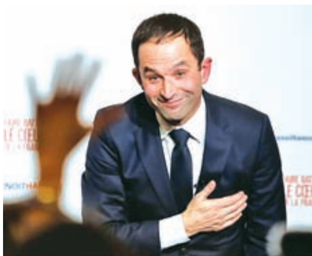
Former French education minister Benoit Hamon reacts after partial results in the second round of the French left's presidential primary election in Paris.

Socialist politicians Christophe Carlesche and Gilles Savary, from the right wing of the Socialist party, wrote an article in