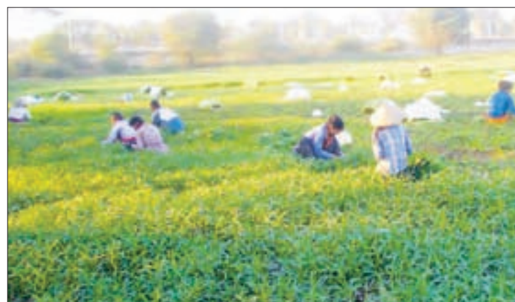
Growers are planting water spinach in Mandalay. PHOTO: THE MIRROR

A basket of water spinach sells for about Ks6,000. — Nway Nadi/Myit Nge