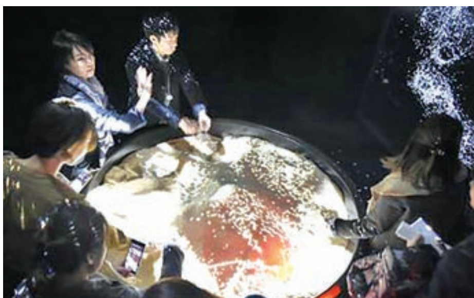
Visitors to a Tokyo exhibition learn about the richness of Japanese food culture through a digital exhibit on 27 January, 2017. The event runs through 21 May in Tokyo's Kayabacho area.