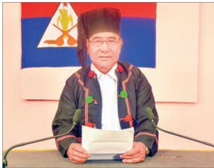
U Shee Mon of Lahu National Development Party.

U SHEE MON, Secretary for Social Affairs of the Lahu National Development Party presented the policy, philosophy and programs of their party on Radio and TV on 31 January 2017.