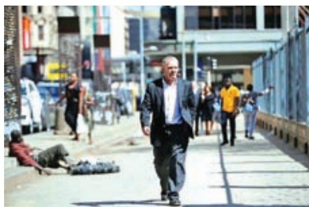
State prosecutor Gerrie Nel arrives for an appeal hearing brought by prosecutors against the six-year jail term handed to Oscar Pistorius for the murder of his girlfriend Reeva Steenkamp in Johannesburg, South Africa on 26 August, 2016.

During the Pistorius trial, Nel painstakingly crafted a picture of Pistorius as a cold-blooded killer who fired through a door at his cowering girlfriend. For his no-non-