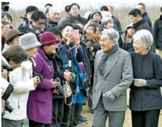
Emperor Akihito and Empress Michiko talk with local people on 31 January, 2017, in Hayama, near Tokyo, where they are staying at an imperial villa to rest after attending a series of official and festive events during the year-end and New Year period.