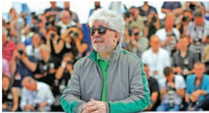
Director Pedro Almodovar poses during a photocall for the film "Julieta" in competition at the 69th Cannes Film Festival in Cannes, France, on 17 May, 2016.

"The Festival de Cannes is delighted to welcome a unique and hugely popular artist. His works have already carved out an eternal niche in the history of film," festival organisers said in a statement.— Reuters