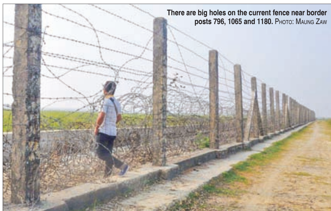
There are big holes on the current fence near border posts 796, 1065 and 1180.

"We have reported to the Ministry of Home Affairs about the damaged fences, which will allocate funds for the upgrading of the fence. We will upgrade the border fence in accordance with the budget allocation of the ministry. But everything depends on the budget allocation," said an official who was involved in the erection of the fence at its first stage.