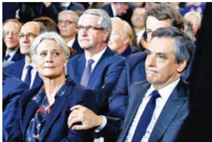
Francois Fillon (R) former French prime minister, member of The Republicans political party and 2017 presidential candidate of the French centre-right, reacts as he touches his wife Penelope Fillon they attend at political rally in Paris.

Separately from the search of his office, Fillon's lawyer