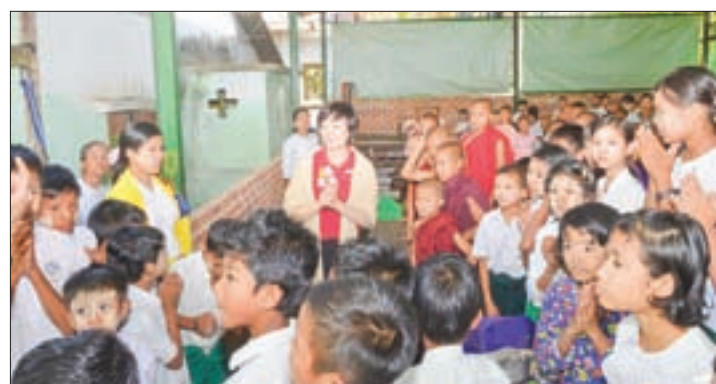
Mrs Akie Abe, wife of the Prime Minister of Japan talks to school children at a Monastic Education School.

During their visit, the wife of the Prime Minister of Japan and party donated Ks 50 lakhs each and stationery to the schools.— Myanmar News Agency