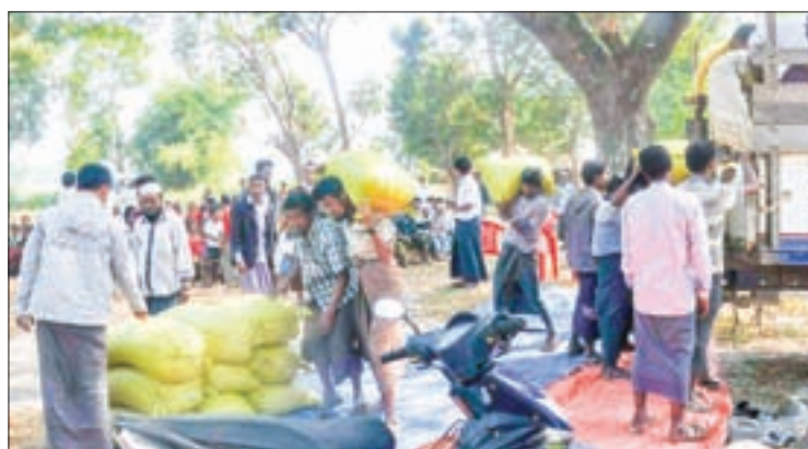
Bags of rice from Muslim for Peace Foundation are delivered to villages yesterday in Maungtaaw, Rakhine State.