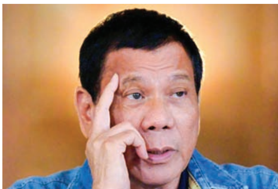
Philippine President Rodrigo Duterte.

"We would be glad if they have their presence there ... just to patrol,"