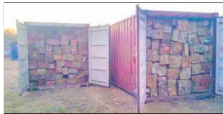
Illegal timber containers are seen.

Police seized 280 tonnes of illegal Padauk square timber and 3 tonnes of Tamalan. Police have taken action against the illegal timber owner and other people involved in the case in accordance with the law, according to the forest department.— Myanmar News Agency