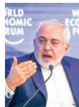
Javad Zarif, Minister of Foreign Affairs of the Islamic Republic of Iran.

The United States, Russia, China, Britain, Germany and France were parties to the deal. Paris took one of the hardest lines against Tehran in the negotiations, but has been quick to restore trade relations since then.—Reuters