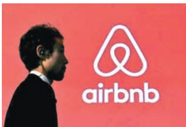
A man walks past a logo of Airbnb after a news conference in Tokyo, Japan, on 26 November, 2015.

Representatives for Google and Netflix could not immediately be reached for comment. An Airbnb spokesman declined to