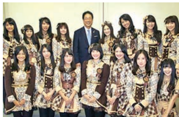
Hakodate Mayor Toshiki Kudo (back C) poses for photos with members of Jakarta-based all-girl pop group JKT48, a sister unit of Japan's AKB48, at the Hakodate municipal office in Hokkaido on 30 January, 2017. JKT48 was appointed as the city's tourism ambassador and will promote Hakodate in Southeast Asia.

"I've heard the number of people traveling abroad has been increasing as the Indone-