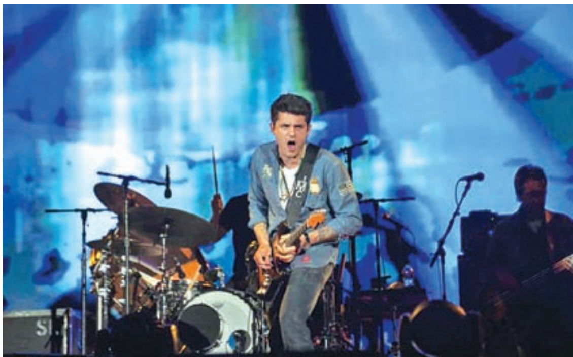
Musician John Mayer performs during the Global Citizen Festival in New York on 28 September, 2013. The festival is an initiative of the Global Poverty Project, which is a movement to end extreme poverty.