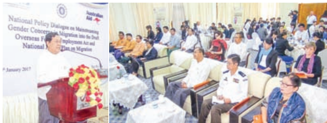
Union Minister for the Labour, Immigration and Population U Thein Swe addresses the national-level policy discussion in Nay Pyi Taw.

THE Ministry of Labour, Immigration and Population held a national-level policy discussion on Monday at Hotel Amara in Nay Pyi Taw to include gender affairs into amendments of the law relating to employment and a national project concerning migration.