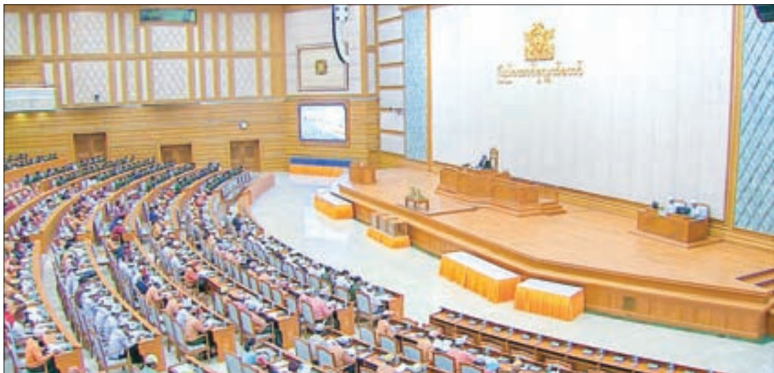
Pyidaungsu Hluttaw is being convened in Nay Pyi Taw.

Later, the Deputy Minister explained the purposes of their