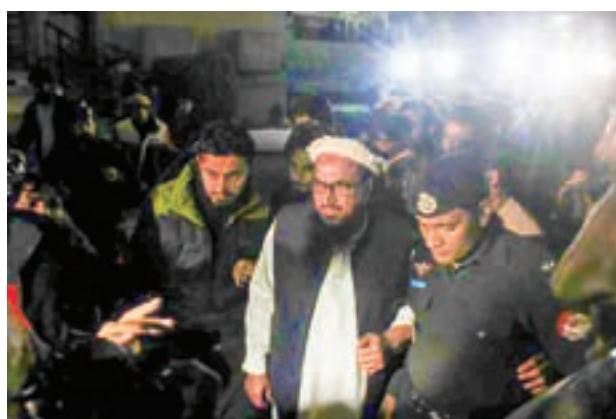
Hafiz Muhammad Saeed, chief of the banned Islamic charity Jamat-ud-Dawa, is escorted to his home where he will be under house arrest in Lahore, Pakistan on 30 January, 2017.

founder of the Lashkar-e-Taiba (LeT) militant group that India blames for the bloodshed, at the headquarters of his charity, the Jamaat-ud-Dawa (JuD), late on Monday.