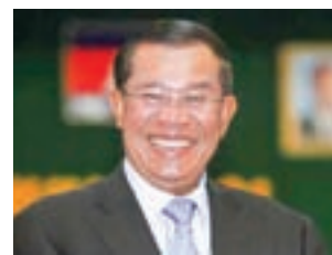
Cambodian Prime Minister Hun Sen.

Thy Sovantha, Heng Samrin, president of the