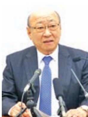
Nintendo Co President Tatsumi Kimishima.

The consumer electronics and game software maker said it booked a foreign exchange-related gain of 1.4 billion yen in the nine-month period as the value of its foreign-denominated assets rose due to a weaker yen. On the other hand, Nintendo cut its operating profit projection to 20 billion yen, against an earlier forecast of 30 billion yen, on projected sales of 470 billion yen, un-