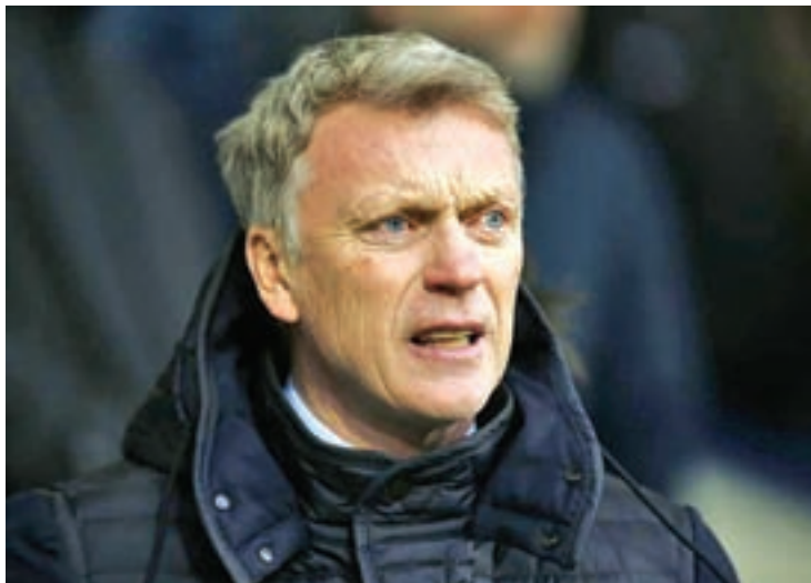
Sunderland manager David Moyes.

know the way I manage and the way I work. They will know what to expect. Sometimes for them, that makes the move easier. I hope it shows.