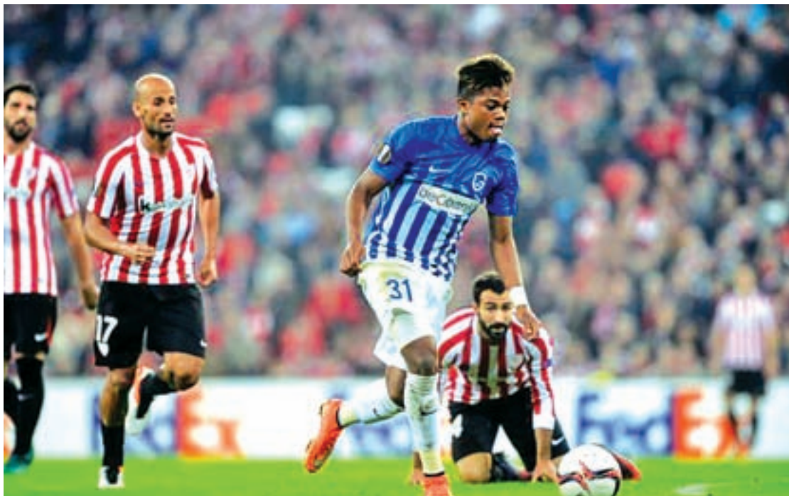
KRC Genk's Leon Bailey prepares to shoot during the match of UEFA Europa League group stage between Athletic Bilbao v KRC Genk at San Mames, Bilbao, Spain on 3 November, 2017.

BERLIN — Bayer Leverkusen have signed 19-year-old Jamaican winger Leon Bailey from Belgium's Racing Genk on a contract to 2022, the German club said on Tuesday. Bailey, who played for Genk in the Europa League and scored four goals in six matches, is also eligible for the Champions League, the German club said. Leverkusen are through to the round of 16 in Europe's top club competition and face Spain's Atletico Madrid next month. "He is an unusually quick and very cunning player, who gives our attack an added push," Leverkusen sports director Rudi Voeller said in a statement. "We are certain he will prove to be a huge win for us." Bailey, who joined Genk in 2015 and has played once for Jamaica's under-23 team, was reportedly a target for several top European clubs before being signed by Leverkusen.—Reuters