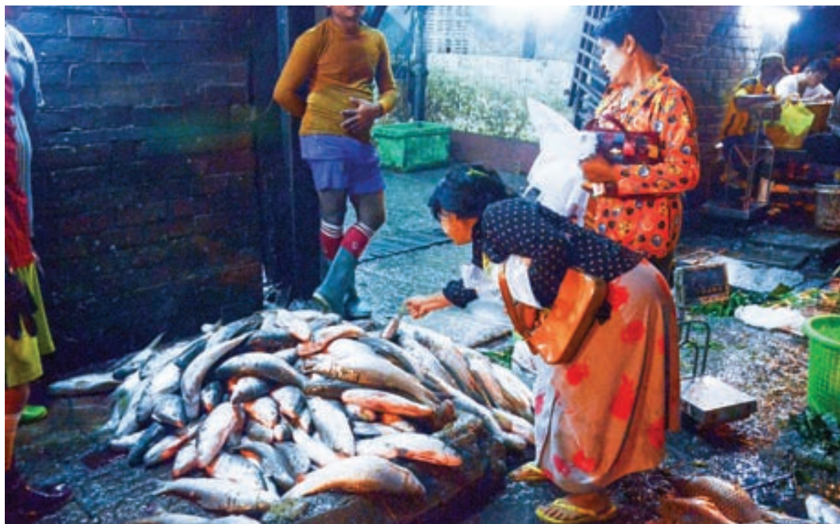
Merchants check fishes at Sanpya fish market in Yangon, early morning on 7 January, 2017.