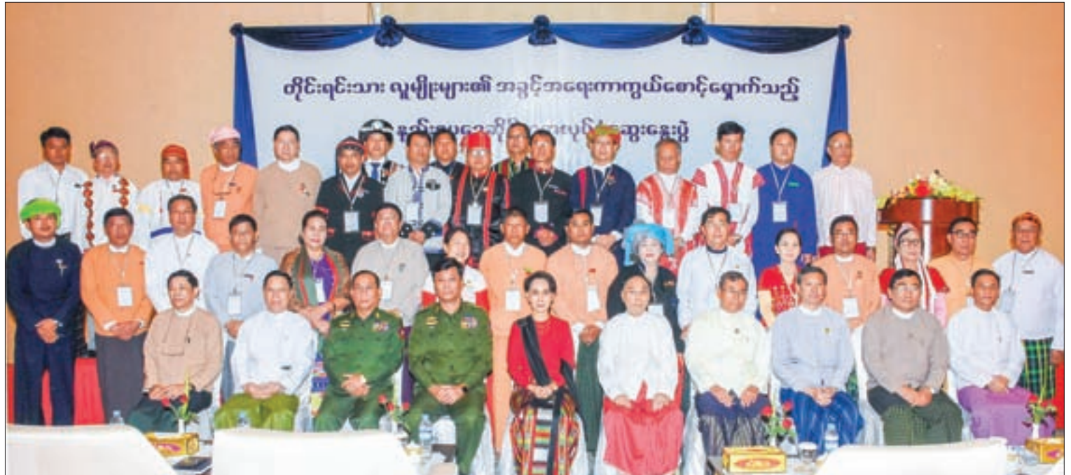
State Counsellor Daw Aung San Suu Kyi, centre, front row, poses for a photo with participants at the workshop in Nay Pyi Taw.

Officials from the Office of the Attorney General, legal experts and scholars also participated in the workshop to address the legal aspect of the draft rules.