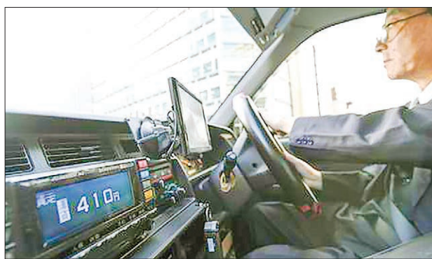
A meter in a taxi shows a starting fare of 410 yen (around $3.60) in Tokyo on 30 January, 2017. Most taxi operators in Tokyo began the lower starting fare the same day to attract foreign visitors and elderly people traveling short distances.

After the first 1,052 metres, passengers will be