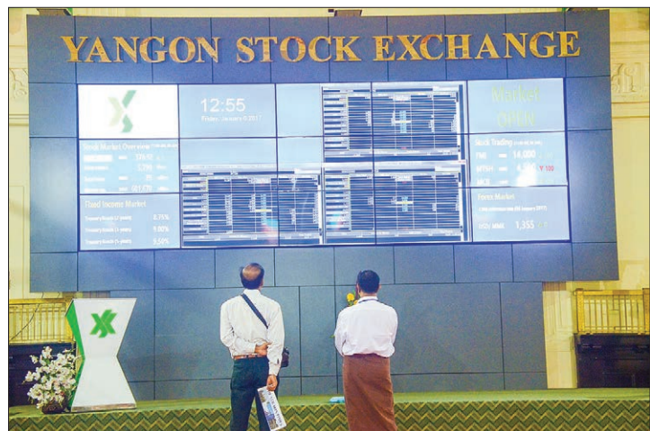
Visitors look at the electronic board showing the stock information at Yangon Stock Exchange on 6 January 2017.

The share prices on 30th Jan were Ks14,000 for FMI, Ks4,100 for MTSH, Ks8,700 for MCB and Ks32,000 for FPB.— Ko Htet