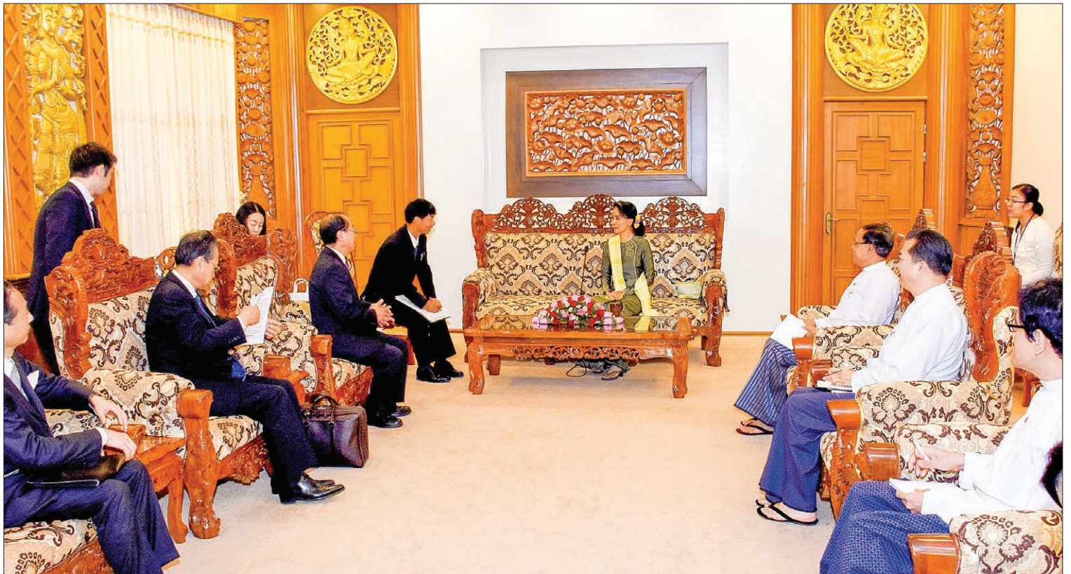
State Counsellor Daw Aung San Suu Kyi speaks with the special adviser to Japanese Prime Minister H.E. Mr. Hiroto Izumi, fifth from left.

During the meeting, they exchanged views on the nine sectors currently being implemented cooperatively by Myanmar and Japan as well as future projects. The nine sectors of cooperation between Myanmar and Japan are: development of rural agriculture and infrastructure; promotion of the quality of education and creation of job opportunities; urban industrial development; development of transportation connectivity between rural and urban areas; energy co-operation to effectuate industrial development; development of urban structures; development of public finance and private finance structures; improvement of post and telecommunications services and promotion of the health care sector.— Myanmar News Agency