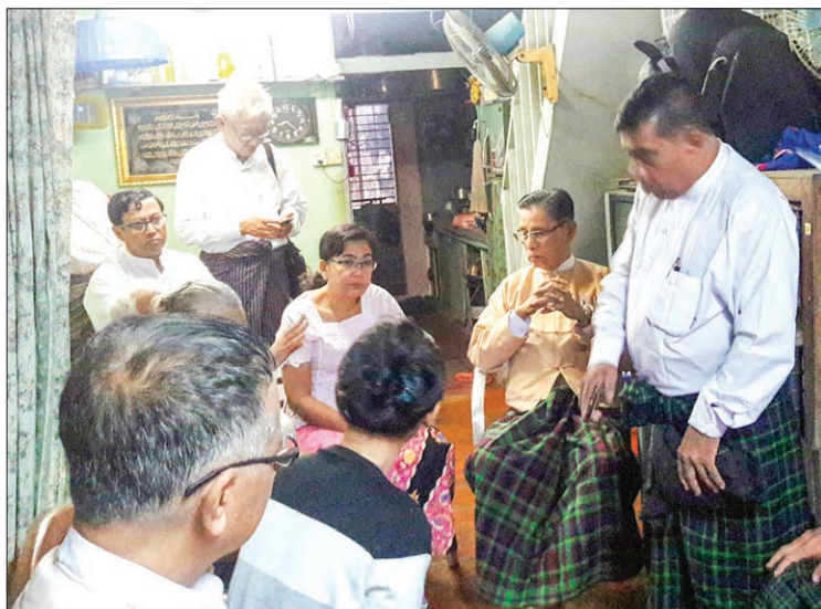
NLD Patron Thura U Tin Oo comforts the family of U Ko Ni at the victim's apartment in Botahtaung, Yangon.

NATIONAL League for Democracy Patron Thura U Tin Oo met with the family of U Ko Ni and spoke words of condolence at the deceased's apartment on 42nd street in Botahtaung Township yesterday morning.