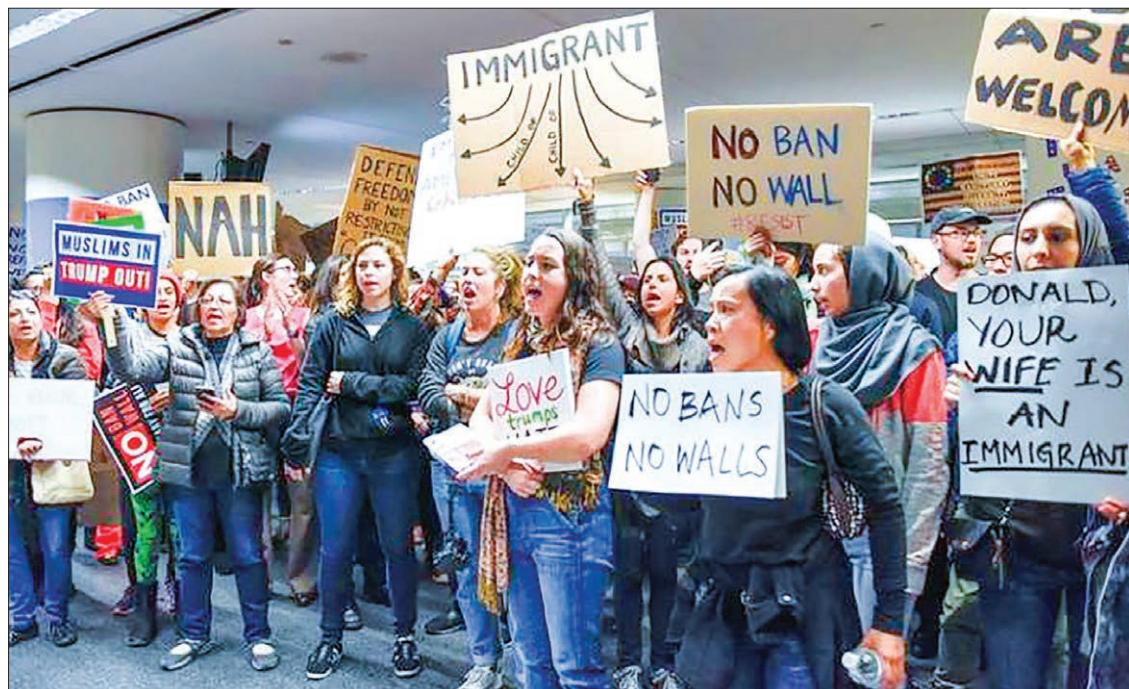
Demonstrators during anti-Donald Trump immigration ban protests in Terminal 4 at San Francisco International Airport in San Francisco, California, US, on 29 January, 2017.

NEW YORK/WASHINGTON — Tens of thousands of people rallied in US cities and at airports on Sunday to voice outrage over President Donald Trump's executive order restricting entry into the country for travelers from seven Muslim-majority nations.