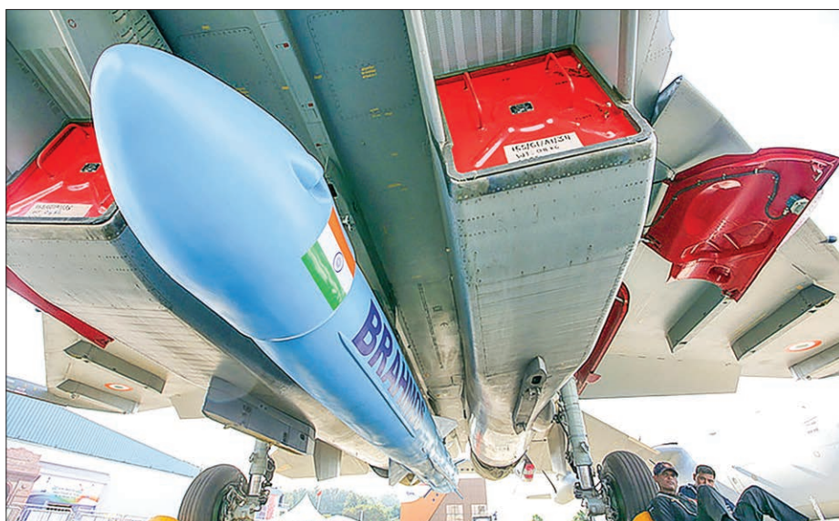
The missile has a range of 290 km and carries a warhead weighing from 200 to 300 kg.

sonic cruise missile is the product of Russia's Machine-Building Research and Development Consortium and India's Defence Research and Develop-