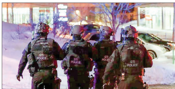
Swat team police officer walk around a mosque after a shooting in Quebec City.

an important part of our national fabric, and these senseless acts have no place in our communities, cities and country.”