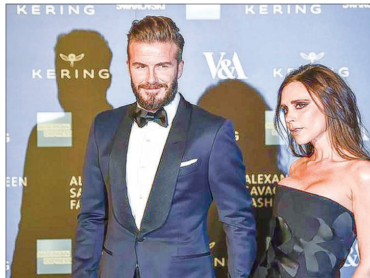
Victoria and David Beckham arrive for the Alexander McQueen: Savage Beauty exhibition gala at the Victoria & Albert Museum in London, on 12 March, 2015.