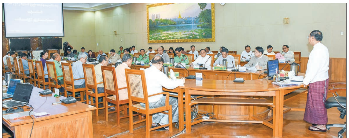
Vice President U Myint Swe, right, addresses the 3 rd co-ordination meeting of the 70 th anniversary of the Union Day Convening Central Committee 2017 at the Office of the President in Nay Pyi Taw.

He added that conservation of food and thrifty allocation of funds