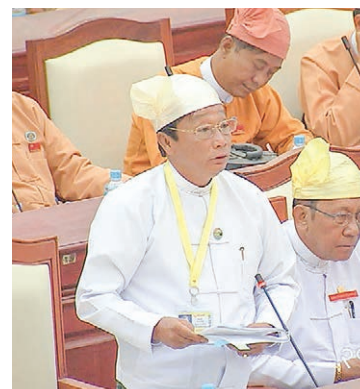
U Hla Kyaw, deputy minister for agriculture, livestock breeding and irrigation.

U Hla Kyaw, deputy minister, then replied to questions raised by U Lin Lin Kyaw, the Pyithu Hluttaw representative from Myitha Constituency, Daw Thandar of Einme constituency, U Thein