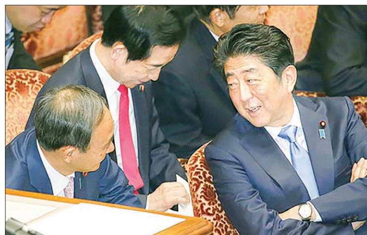
Japanese Prime Minister Shinzo Abe (R) and Chief Cabinet Secretary Yoshihide Suga (far L) attend a meeting of the House of Councillors Budget Committee in Tokyo on 30 January, 2017. Abe said he is in "no position to comment" on Trump's travel ban, but that the "international community should work together to deal with refugees."

Trump took aim at Toyota Motor while he was president-elect, threatening to impose a "big border tax" on Japan's top automaker if it proceeds with its plan to build a new plant in Mexico to produce Corolla cars for the US market.—Reuters