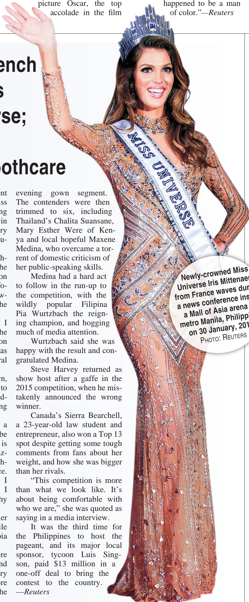
Newly-crowned Miss Universe Iris Mittenare from France waves during a news conference inside a Mall of Asia arena in metro Manila, Philippines on 30 January, 2017.