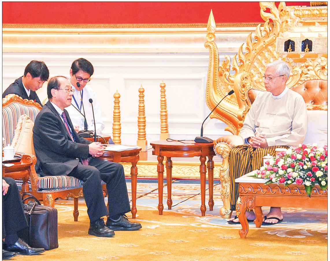
President U Htin Kyaw holds talks with Mr. Hiroto Izumi, special adviser to the Prime Minister of Japan.

Japan, enabling higher investments in Myanmar by Japanese entrepreneurs and providing assistance programs for development of Myanmar. Also present at the meeting were Union Ministers U Thant Zin Maung, U Kyaw Win, U Win Khaing and Minister of State for Foreign Affairs U Kyaw Tin.— Myanmar News Agency