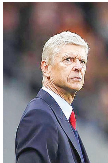
Arsenal manager Arsene Wenger.

LONDON — Arsenal manager Arsene Wenger brushed off suggestions that his four-match touchline ban for pushing a fourth official was too lenient, saying his critics would still not be satisfied if he was put behind bars.