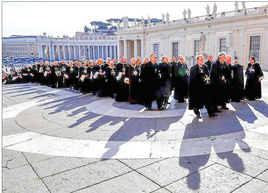
Members of the Order of the Knights of Malta arrive in St Peter Basilica for their 900th anniversary at the Vatican on 9 February, 2013.

VATICAN CITY — The Knights of Malta, an ancient Catholic order which operates as global charity, has its headquarters on one of Rome's most exclusive streets, the cobble-stoned Via Condotti where red-and-white flags bearing the Maltese Cross fly above the entrance.