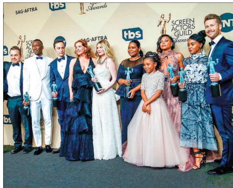
The cast of "Hidden Figures" poses backstage with the award for Outstanding Performance by a Cast in a Motion Picture during the 23rd Screen Actors Guild Awards in Los Angeles, California, US, on 29 January, 2017.

A surprised Denzel Washington won best actor for "Fences," beating out front-runners Casey Affleck for "Manchester By the Sea" and Ryan Gosling for "La La Land." Washington's co-star Viola Davis, who won best supporting actress, thanked the late playwright Wilson for honoring "the average man, who happened to be a man of color." —Reuters