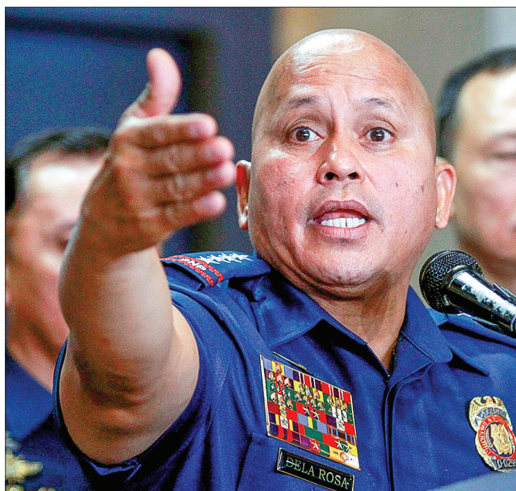
Philippine National Police (PNP) Director General Ronald Dela Rosa gestures during a news conference at the PNP headquarters in Quezon city, Metro Manila, Philippines on 30 January, 2017.

More than 7,000 people have since been killed, about 2,250 during police operations. The remainder are being investigated.