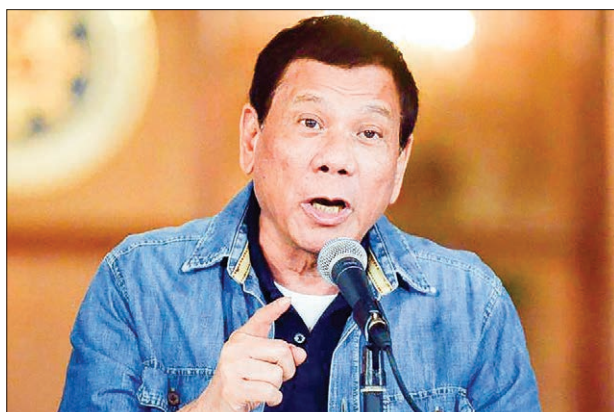
Philippine President Rodrigo Duterte gestures while speaking during a late night news conference at the presidential palace in Manila, Philippines on 31 January, 2017.