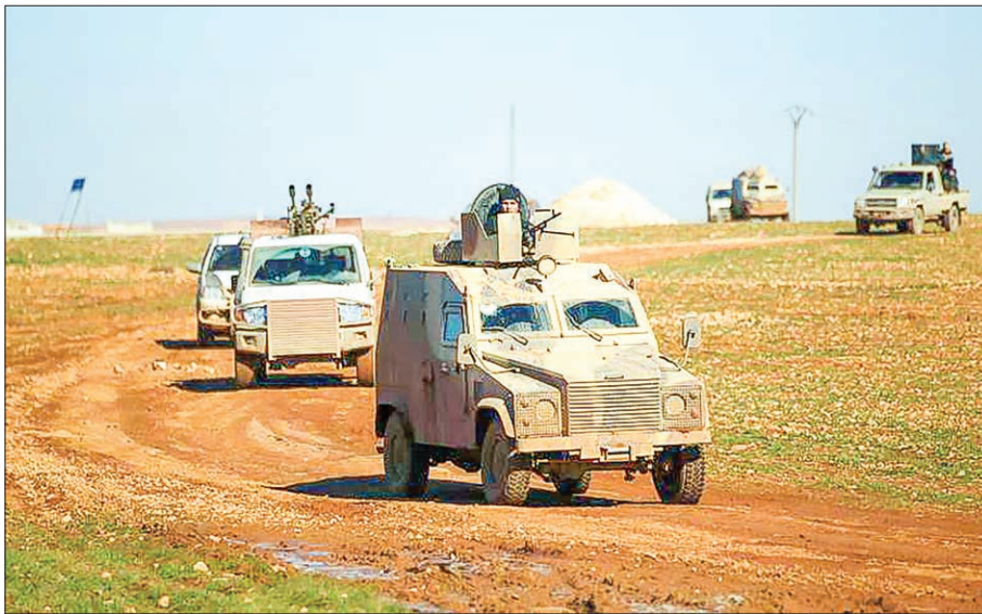
Rebels drive their vehicles on the outskirts of the northern Syrian town of al-Bab, Syria on 29 January, 2017.

Fighting and air strikes have plagued the ceasefire between the government and rebel groups since it took effect in late December.