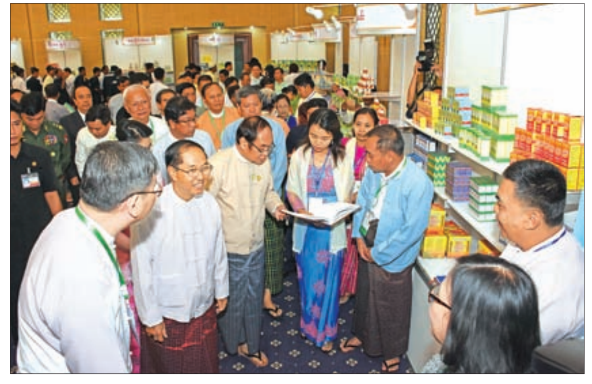
Vice President U Myint Swe visits booth showcasing traditional medicine at 17th Anniversary Myanmar Traditional Medicine Practitioners' Conference.

medicine, there are several important factors - revival of extinct Myanmar traditional medicines and pharmacy, eternal survival of the Myanmar traditional pharmacy and implementation of systematic research works on Myanmar traditional medicines so that Myanmar's younger generations can be well educated on traditional medicine, up to reaching the level of standing tall in the midst of other countries. Today, the world's health and medical realm rely more and more on herbal medicines rather than chemical drugs. Departments of traditional medicine are performing research work on Myanmar traditional medicines more than ever and modernising techniques by linking with foreign universities. It is of great importance to discover workable herbs in Myanmar, to systematically breed herbs and produce for utili-