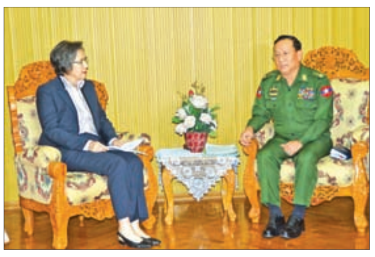
Ms Yanghee Lee holds talks with Union Minister for Border Affairs Lt-Gen Ye Aung in Nay Pyi Taw.

The Education Ministry's current activities for educational development in the country, provision of subsidies to basic education schools in Rakhine State and activities for increasing access to learning education were discussed in the meeting with Dr Myo Thein Gyi, Union Minister for Education.—Myanmar News Agency