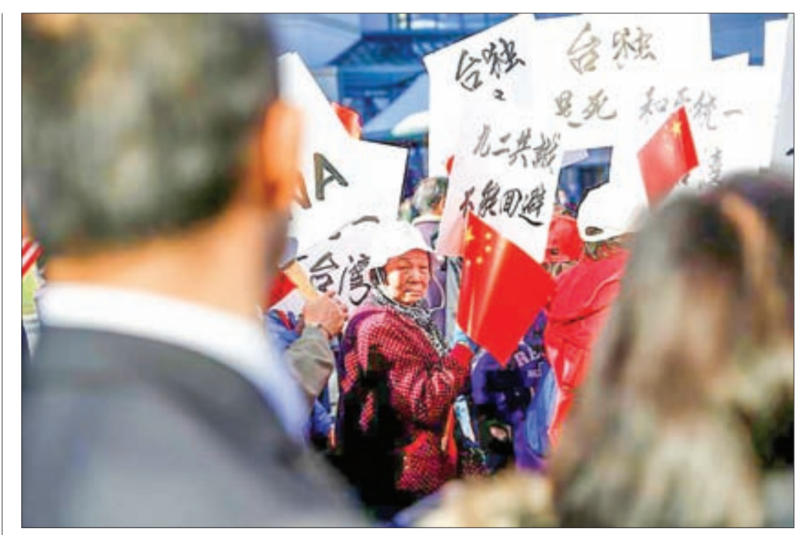
A demonstrator in support of China looks at a group of supporters of Taiwan President Tsai Ing-wen during a stop-over after her visit to Latin America in Burlingame, California, US, on 14 January, 2017.

NPS chairman Moon Hyung-pyo was arrested in December after acknowledging ordering it to support the controversial $8 billion merger in 2015 of the two Samsung Group affiliates while heading the health ministry, which oversees the NPS .- Reuters