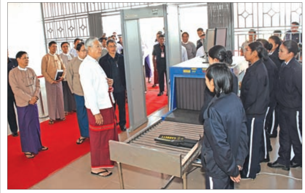
President U Htin Kyaw inspects National Reconciliation and Peace Centre in Nay Pyi Taw.

PRESIDENT U Htin Kyaw visited the National Reconciliation and Peace Centre in Nay Pyi Taw yesterday, inspecting the preparations for conducting the Peace Process Orientation Course and for holding the Union Peace Conference-21st Century Panglong.