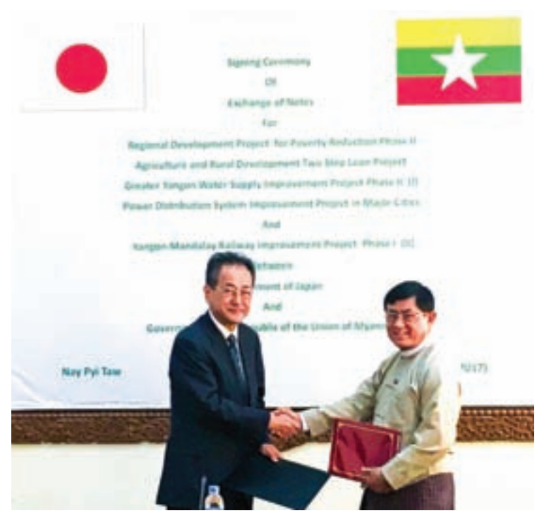
Deputy Minister for Planning and Finance U Maung Maung Win and Japanese Ambassador Mr. Tateshi HIGUCHI exchange notes after signing the ODA loans agreement.

According to the agreement, the five projects include Regional Development Project for Poverty Reduction Phase II with Japanese Yen 23,979 million, approx. US$ 210 million, Yangon-Mandalay Railway Improvement Project Phase I (II) with Japanese Yen 25,000 million, approx. US$ 219 million, Greater Yangon Water Supply Improvement Project (Phase II) (I) with Japanese Yen 25,000 million, approx. US$ 219 million, Power Distribution System Improvement Project in Major Cities with Japanese Yen 4,856 milliom, approx. US$ 43 million and Agriculture and Rural Development Two Step Loan Project with Japanese Yen 15,135 million, approx. US$ 133 million