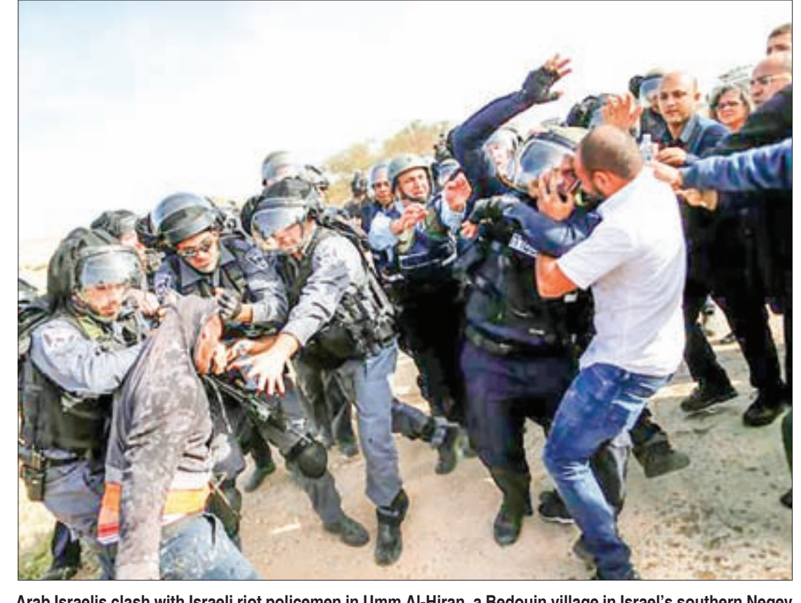
Arab Israelis clash with Israeli riot policemen in Umm Al-Hiran, a Bedouin village in Israel's southern Negev Desert, on 18 January 2017. PHOTO: REUTERS

A French-led military intervention in 2013 drove back Islamist militants, including al Qaeda-linked groups, which had seized northern Mali a year earlier. -Reuters