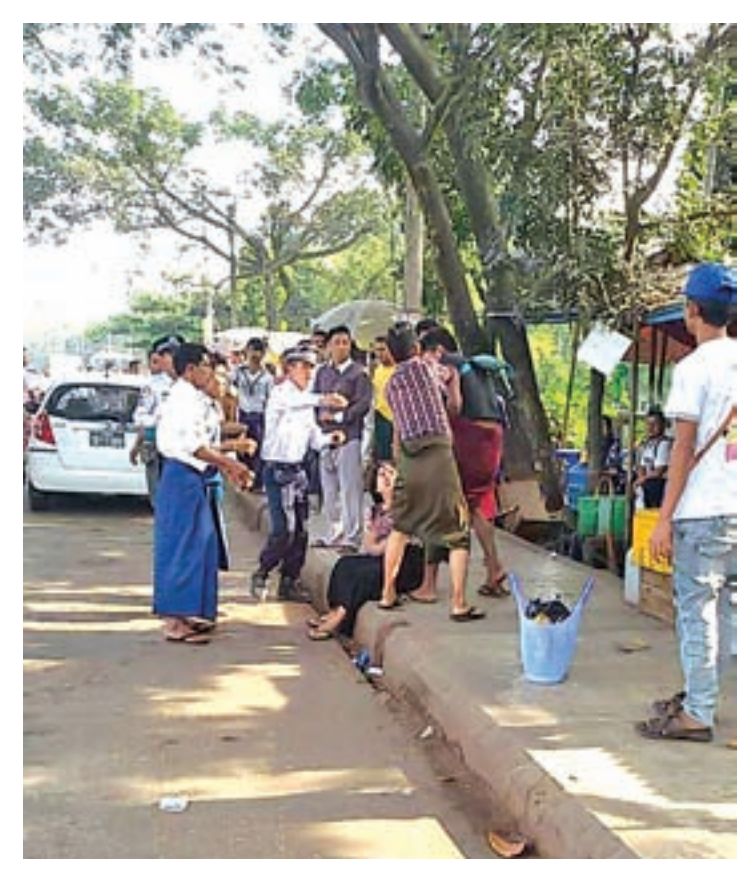
Police and volunteers manage to detain the conductor at the Sawbwargyigone bus stop.

Police have charged the conductors according to the law as they failed to change their mentality despite the bus system already being reformed, according to Hluttaw representative U Thar Aung. — Min Thit (MNA)