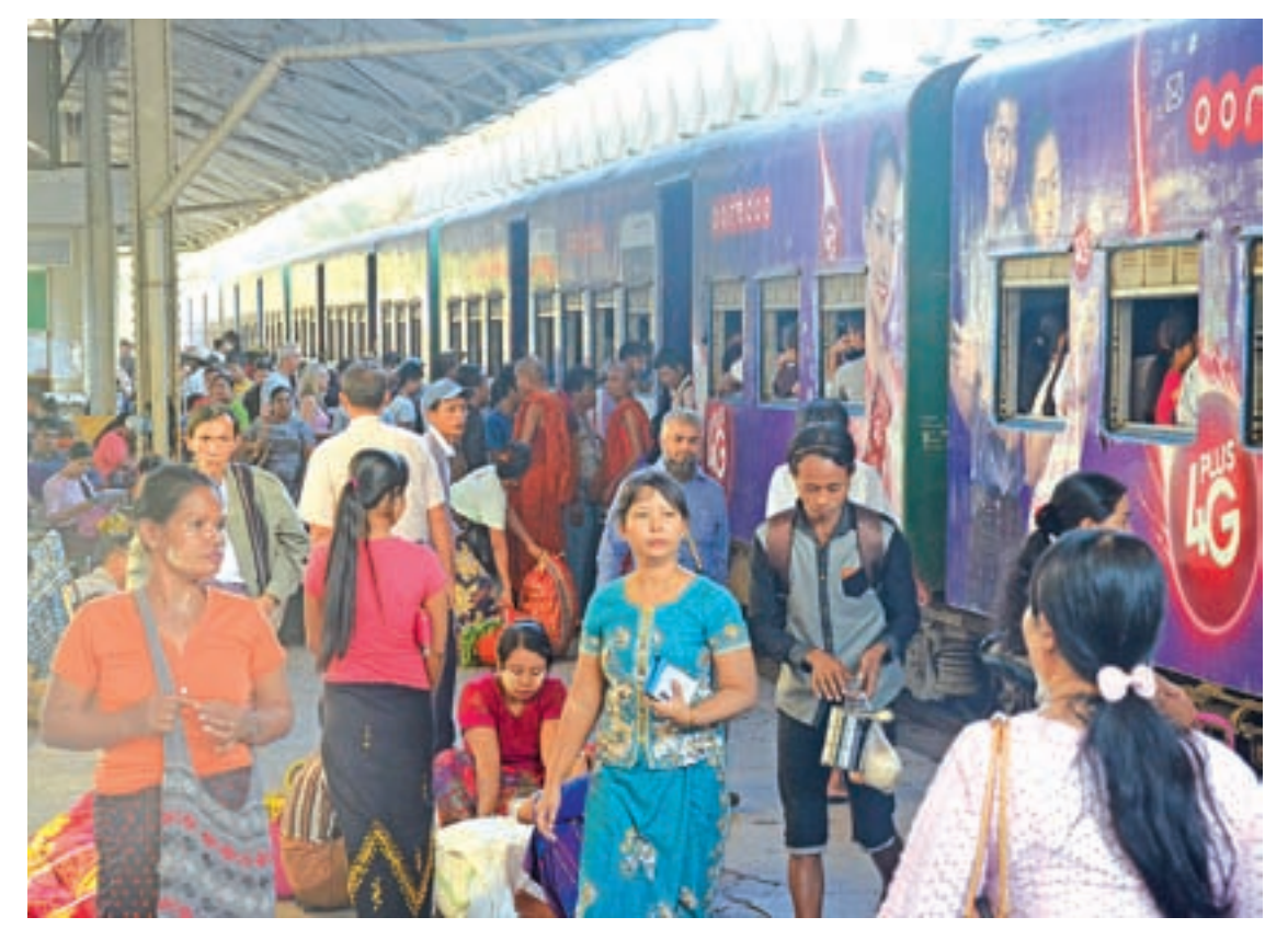
Commuters are struggling to ride a circular train at Yangon Railway Station.

THE number of circular trains will be increased for the convenience of passengers during the time when passengers are becoming accustomed to the new YBS bus lines, said the traffic manager from Division 7 of Myanma Railways.