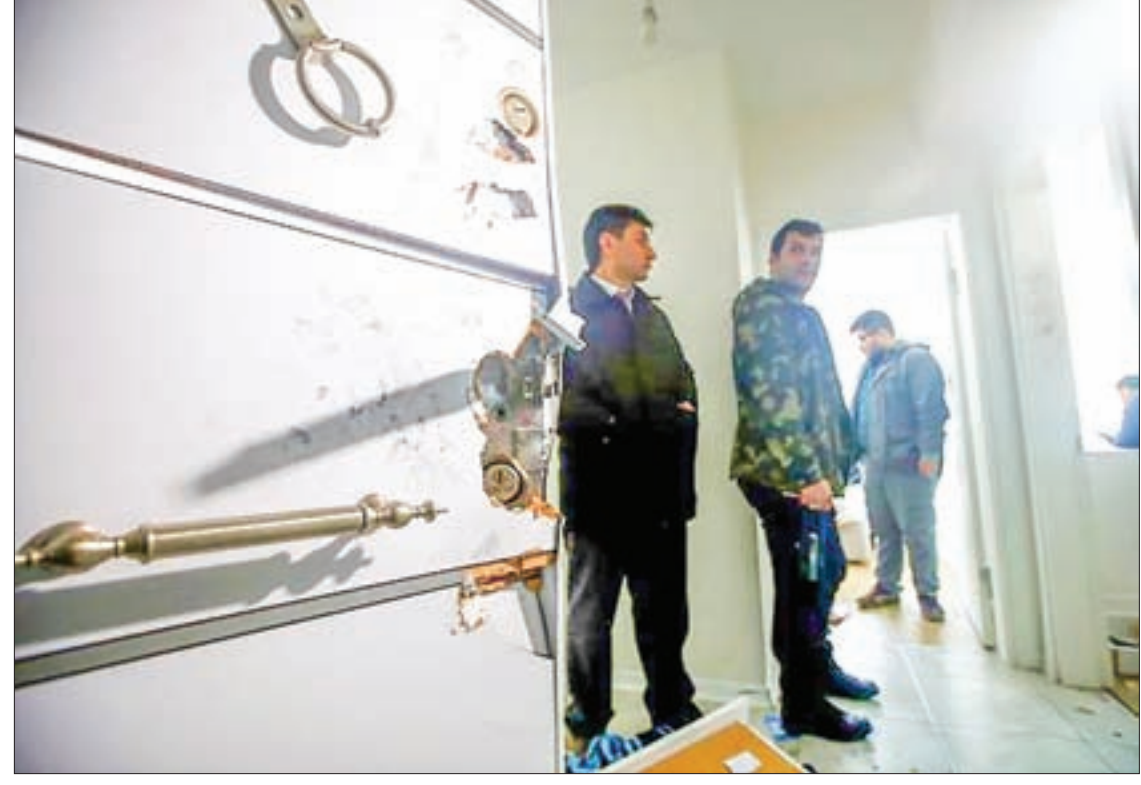
The door of a hideout where the alleged attacker of Reina nightclub was caught.

"Reina looked suitable for the attack. There didn't seem to be