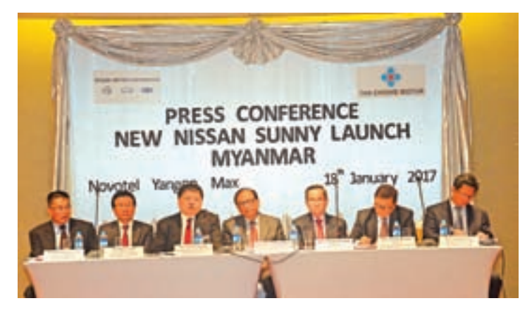
A press conference of launching new Nissan Sunny held in Yangon on 18 January 2017.

Earlier in February 2016, Nissan and Tan Chong executives joined Bago government officials to sign a land lease agreement with representatives of the country's Bago Region.- GNLM