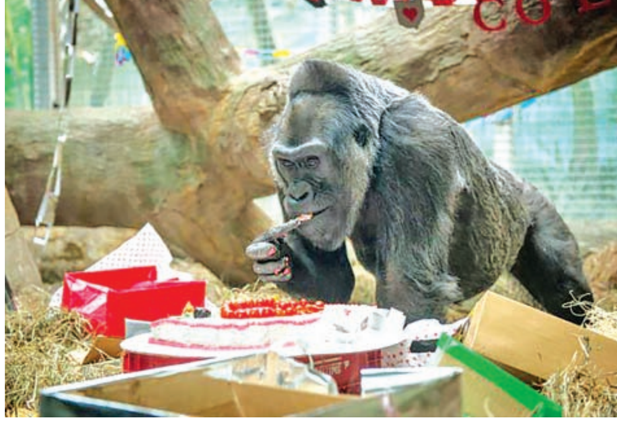
Colo, the oldest gorilla born in captivity, looks over a cake during her 58th birthday at Columbus Zoo in Columbus, Ohio, US on 22 December, 2014.

There had been no sign that Colo was unwell as