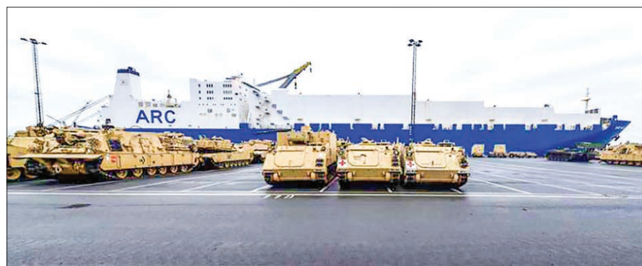
US tanks, trucks and other military equipment, which arrived by ship, are unloaded in the harbour of Bremerhaven, Germany on 8 January, 2017.

Ray said the US military's nearly 70,000 service members in Europe were adapting to rapidly changing strategic challenges such as Russia's military operations in Ukraine, migrant flows from Syria, and Islamist radicalism, as evidenced by a truck attack in Berlin that killed 12 people in December. The US military and NATO are seeking to boost their ability to quickly respond to emerging threats by pre-positioning supplies and equipment across Europe, while upgrading airfields, ranges and other infrastructure after years of neglect.—Reuters