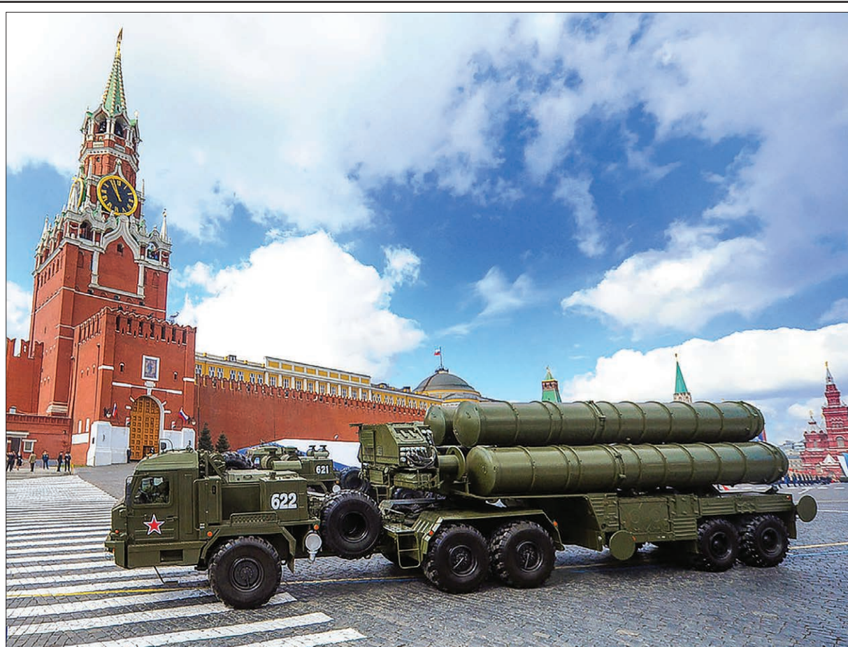
Photo shows S-400 missile system in the Red Square during the Victory Day military parade.

"North Korea will face much stronger and more thorough sanctions and pressure by us and the international community if it ignores our warnings and launches an ICBM," Moon said.—Kyodo News