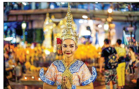
A Thai classical dancer poses for photos at the Erawan shrine in central of Bangkok, Thailand, on 30 August, 2016.

BANGKOK — Thailand expects revenue from foreign tourists to rise 8.5 per cent to 1.78 trillion baht ($49.8 billion) this year, a deputy prime minister said on Monday.