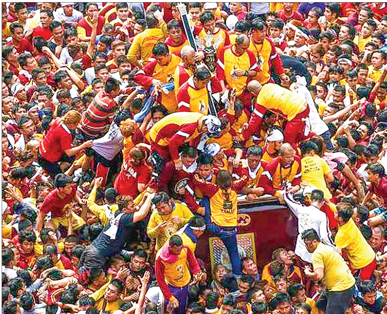
Devotees jostle to touch the image of Black Nazarene as they parade a black statue of Jesus Christ during the annual Catholic religious feast in Manila, Philippines on 9 January, 2017.

MANILA — About a million and a half barefoot Philippine devotees praying for miracles joined a procession on Monday for a black statue of Jesus Christ being paraded through the old commercial centre of the capital, Manila.