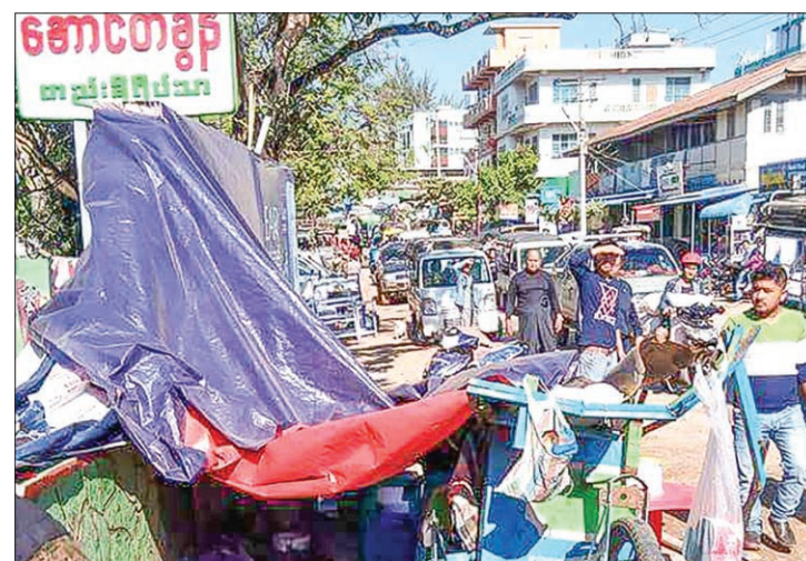
Hawker dies after being struck by car in Lashio.

The reckless truck driver has been charged under Section 304 (a) of the Penal Code. — Myitmakha News Agency