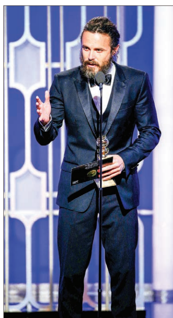
Casey Affleck.

talie Portman ("Jackie") are widely expected to take home Golden Globes, while the revered Meryl Streep will get the annual lifetime achievement award.