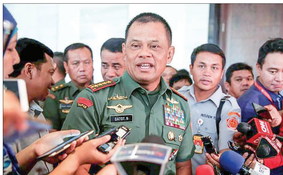
Indonesian military Chief Gatot Nurmantyo talks to reporters in Jakarta, Indonesia, on 5 January, 2017.

Analysts and some of Widodo's aides are also concerned that Nurmantyo is laying the groundwork for an expansion of the military's role in civilian affairs in the world's third-largest democracy and may have political ambitions himself. Widodo, the first president from outside the military and political establishment, needed to move quickly to