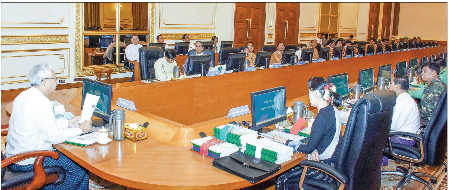
President U Htin Kyaw, left, addresses the meeting of the National Planning Commission of the Union Government in Nay Pyi Taw.

THE National Planning Commission of the Union Government held a meeting this month to seek approval for its plan for the 2017-2018 fiscal year before it is submitted to the parliament.