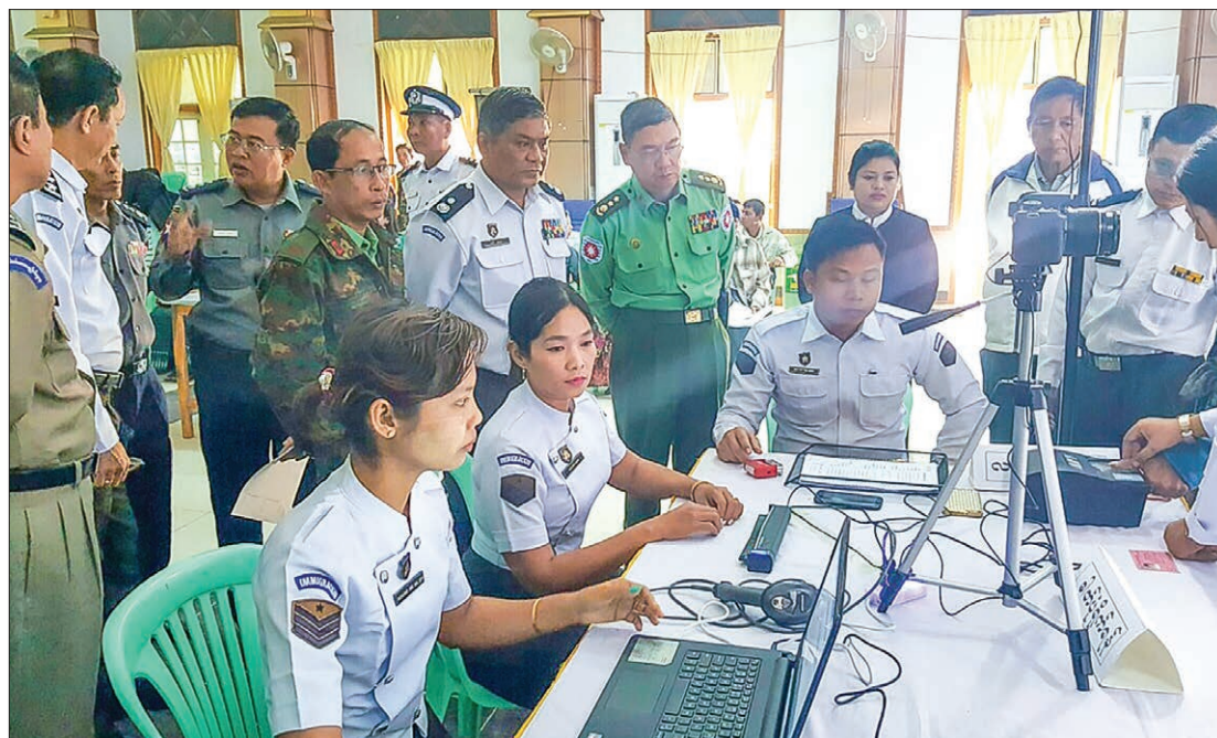
Immigration officials participate in course in collecting statistics for a National Electronic ID (NeID) in Rakhine State.

A TRAINING course in collecting statistics for a National Electronic ID (NeID) in Rakhine State was opened at the Rakhine State Immigration and Population Department in Sittway on Sunday, with an opening address by Director-General of the Immigration and Population Department U Aye Lwin.