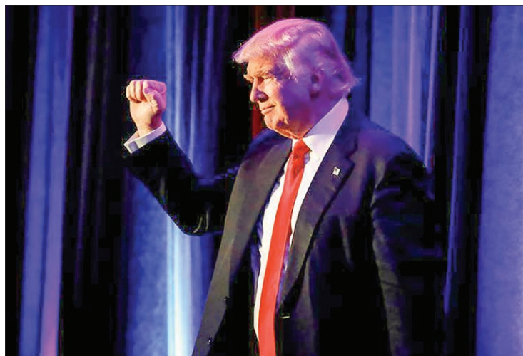
US President-elect Donald Trump.

It was the first acknowledgment from a senior member of the