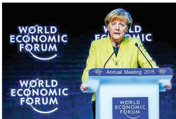
German Chancellor Angela Merkel makes a speech during the session "Global Responsibilities in a Digital Age" in the Swiss mountain resort of Davos on 22 January, 2015.

Signaling a readiness for change, Vice Chancellor Sigmar Gabriel (SPD), told Der Spiegel magazine: "We don't want a new edition of the grand coalition."