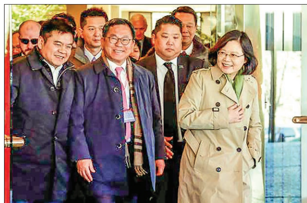
Taiwan President Tsai Ing-wen exits at the Omni Houston Hotel during a ‘transit stop’ enroute to Central America, in Houston, Texas, US, on 7 January, 2017.

“If Trump reneges on the one-China policy after taking office, the Chinese people will demand the government to take revenge. There is no room for bargaining,” said the Global Times.— Reuters