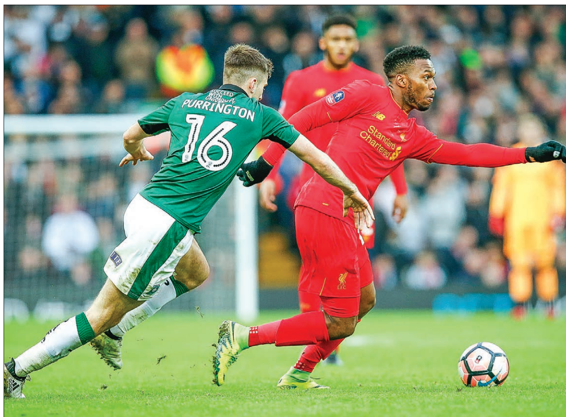
Liverpool's Daniel Sturridge in action with Plymouth Argyle's Ben Purrington during the match between Liverpool v Plymouth Argyle at FA Cup Third Round - Anfield on 8 January 2017.

The visitors had only 23 per cent of the possession, not managing a shot for 60 minutes and finally bringing a save from Liverpool goalkeeper Loris Karius five minutes later.