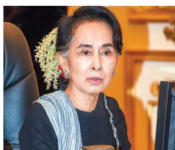
State Counsellor Daw Aung San Suu Kyi.

President U Htin Kyaw, in his capacity as Chairman of the commission, called on regional and state governments to attach importance to projects in their respective regions and states in order to be in