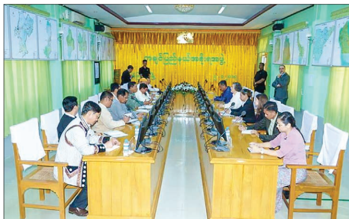
Ms Yanghee Lee meeting with authorities at Kachin State Government Office.

During the visit, Ms Yanghee Lee will visit Internally Displaced Persons' camps in Myitkyina and Waingmaw.