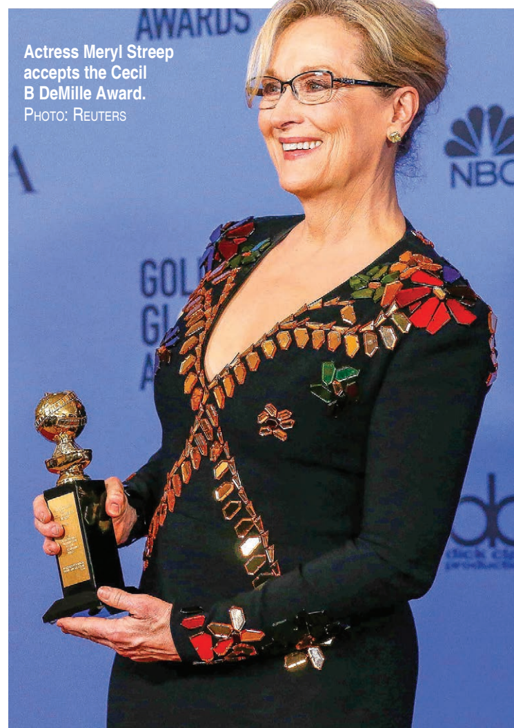
Actress Meryl Streep accepts the Cecil B DeMille Award.

Streep has been nominated for a Golden Globe 30 times and won eight times. She joins Denzel Washington, George Clooney, Woody Allen and Jodie Foster as recipients of the Cecil B DeMille award.—Reuters