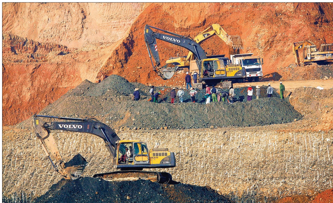
A file photo shows people gather around machines at a jade mine in Pharkant, Kachin state.

The ministry would neither allow license renewal nor grant permits for new jade blocks in Hpakant area.— Khine Khant