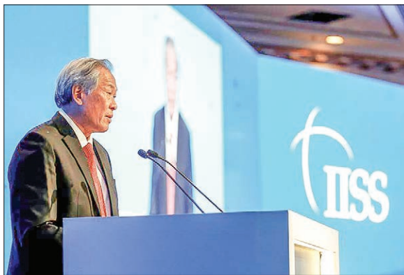
Singapore's Defence Minister Ng Eng Hen speaks at the International Institute for Strategic Studies (IISS) Manama Dialogue Regional Security Summit in Manama, Bahrain on 10 December, 2016.

SINGAPORE — Singapore's defence minister said on Monday that the nine armoured vehicles seized in Hong Kong could not be detained or confiscated but that he welcomed Hong Kong's pledge that the dispute would be handled in line with its laws.