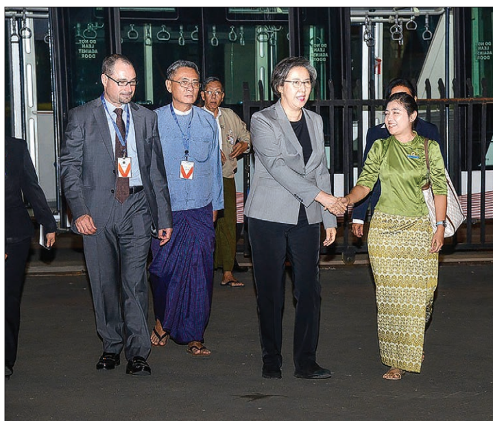
Ms Yanghee Lee is welcomed by an official at the Yangon International Airport.

During her visit she will visit Rakhine State and meet with the Myanmar Human Rights Commission and Myanmar media council. In addition, she will meet with Hluttaw Affairs Committees