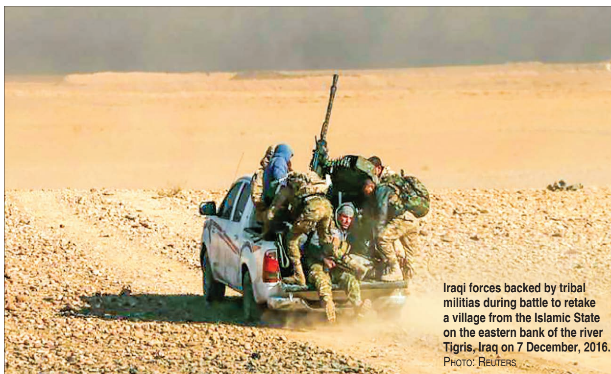
Iraqi forces backed by tribal militias during battle to retake a village from the Islamic State on the eastern bank of the river Tigris, Iraq on 7 December, 2016.

It was the first time Iraqi troops in the city itself have reached the river, which bisects Mosul, since the offensive to drive out Islamic State was launched in October. Iraqi forces already control the Tigris to Mosul's south.