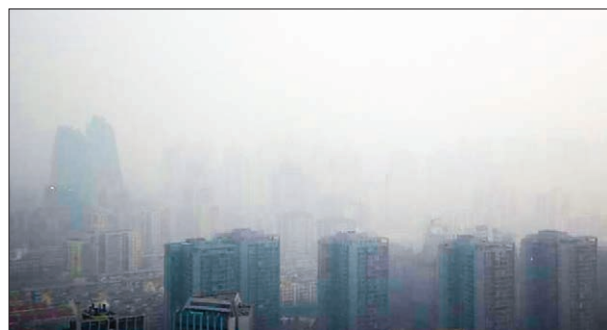
Buildings are seen among smog during a polluted day in Beijing, China, January 6, 2017.

The smog-hit Chinese capital of Beijing will establish a police force to deal specifically with environmental offences as part of its efforts to clean up its air and crack down on persistent polluters.