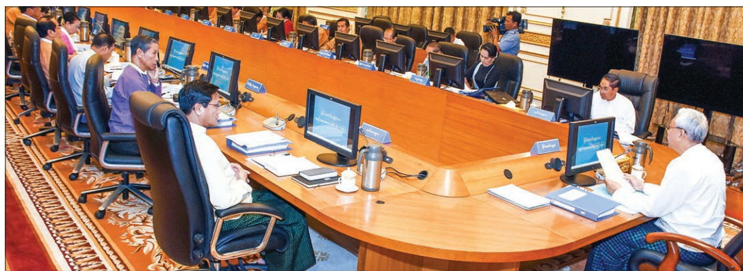
The finance commission holds its meeting in Nay Pyi Taw.

Present at the meeting were President U Htin Kyaw, the President of the State and Chairman of the Finance Commission, Daw Aung San Suu Kyi, State Counsellor, Vice-Presidents and Vice-Chairmen of the Finance Commission U Myint Swe and U Henry Van Thio, Secretary of the Finance Commission and Union Minister for Planning and Finance U Kyaw Win and Union Ministers, Chief Ministers of Regions and States, Union Attorney General, Union Auditor General and