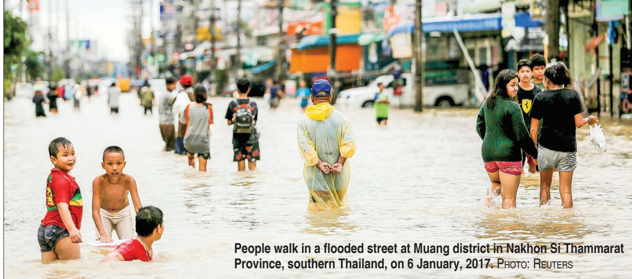
People walk in a flooded street at Muang district in Nakhon Si Thammarat Province, southern Thailand, on 6 January, 2017.

BANGKOK — Widespread flooding in Thailand’s south has killed 21 people, hit rubber production in the region and shut down infrastructure, officials said on Monday, as the military government increased aid to flood-affected areas.