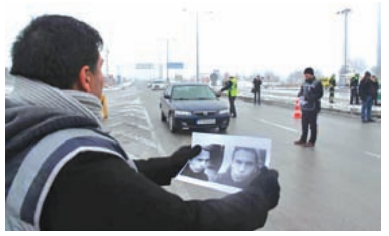
A Turkish police holds pictures of the suspected gunman behind the attack at Reina nightclub in Istanbul, during a security control near the Kapikule border crossing between Turkey and Bulgaria, in Edirne province, on 4 January, 2017. Photo: Reuters

The CTS and federal police are part of a 100,000-strong Iraqi force made up of the military, Kurdish fighters and Shi'ite militias, backed by US-led air power.—Reuters