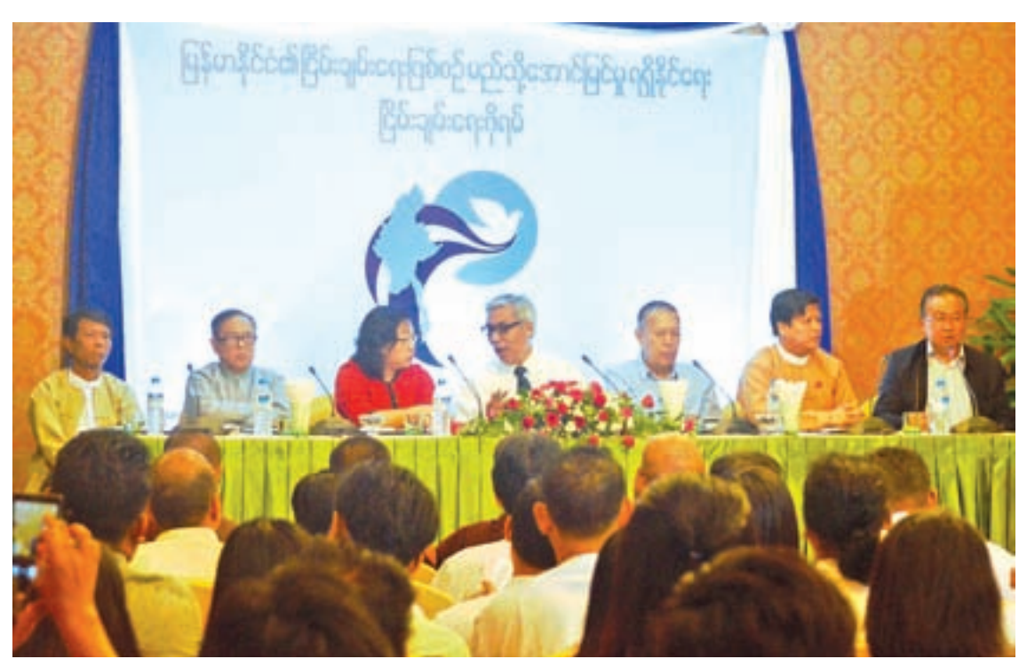
Peace forum in progress in Yangon.

A forum aiming at finding ways to achieve peace in Myanmar was held at the Green Hill Hotel in Yangon yesterday.