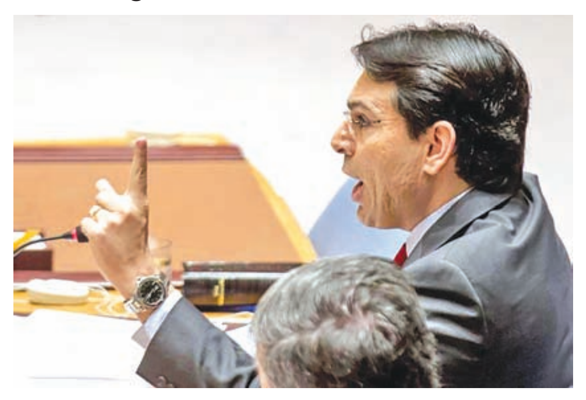
Israel's Ambassador to the United Nations Danny Danon speaks during a United Nations Security Council meeting on the Middle East at the United Nations Headquarters in New York, on 22 October, 2015.

Israel disputes that settlements are illegal and says their final status should be determined in any future talks on Palestinian statehood. The last round of USled peace talks between the Israelis and Palestinians collapsed in 2014. The Security Council last adopted a resolution critical of settlements in 1979, with the United States also abstaining.— Reuters