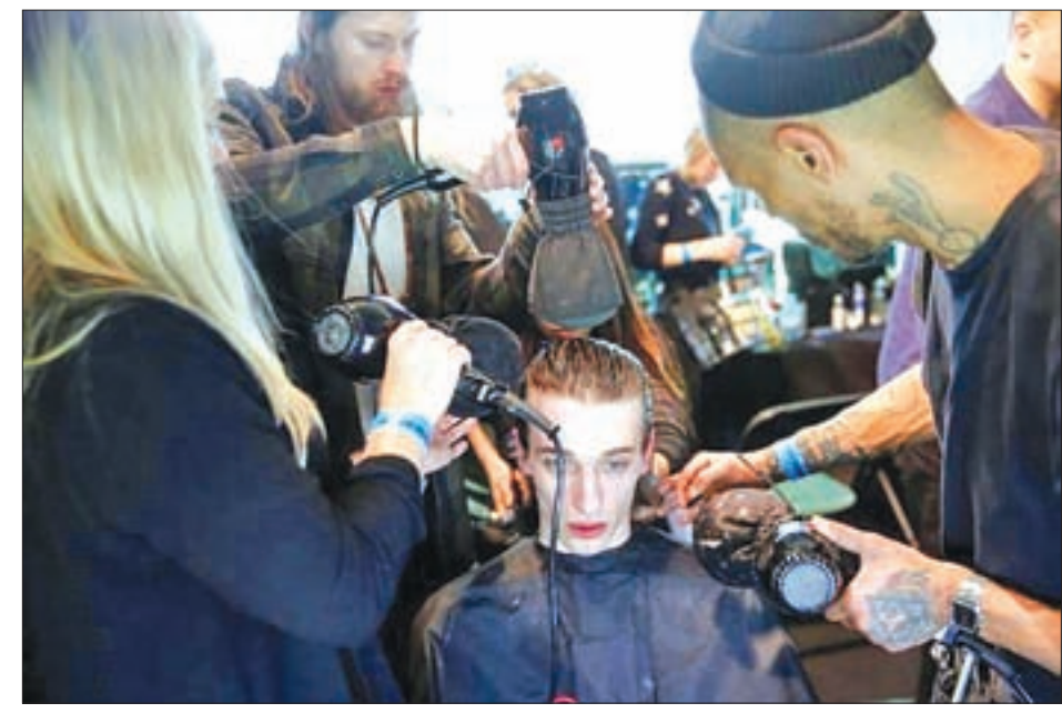
A model is styled backstage of the Xander Zhou catwalk show during London Fashion Week Men's 2017 in London, Britain, on 6 January 2017.

"We've got to abide by the results and make sure