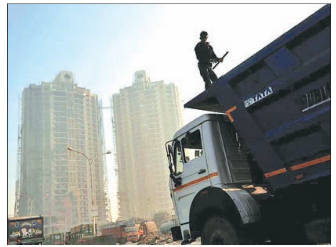
A labourer stands on a truck carrying construction materials at a construction site of residential buildings in Noida on the outskirts of New Delhi on 29 November 2013.

He added only 5 per cent of private lands had been used and all agreements would be signed on a 99 year lease. Sri Lanka is expecting 2 to 3 billion worth of foreign investments this year and expects a total of 50 billion dollars or more worth of investments to come in in the future. —Xinhua