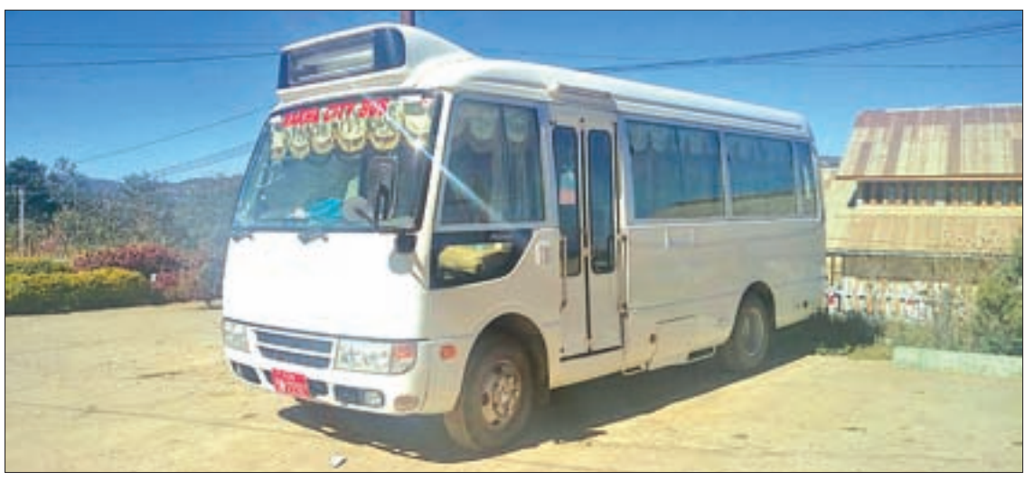
A bus from Haka city bus line stands at the bus-stop in Haka town.

THE Haka City Bus Line running within Haka town, Chin state, is operating at a loss because of the decrease in the number of passengers, it is learnt.