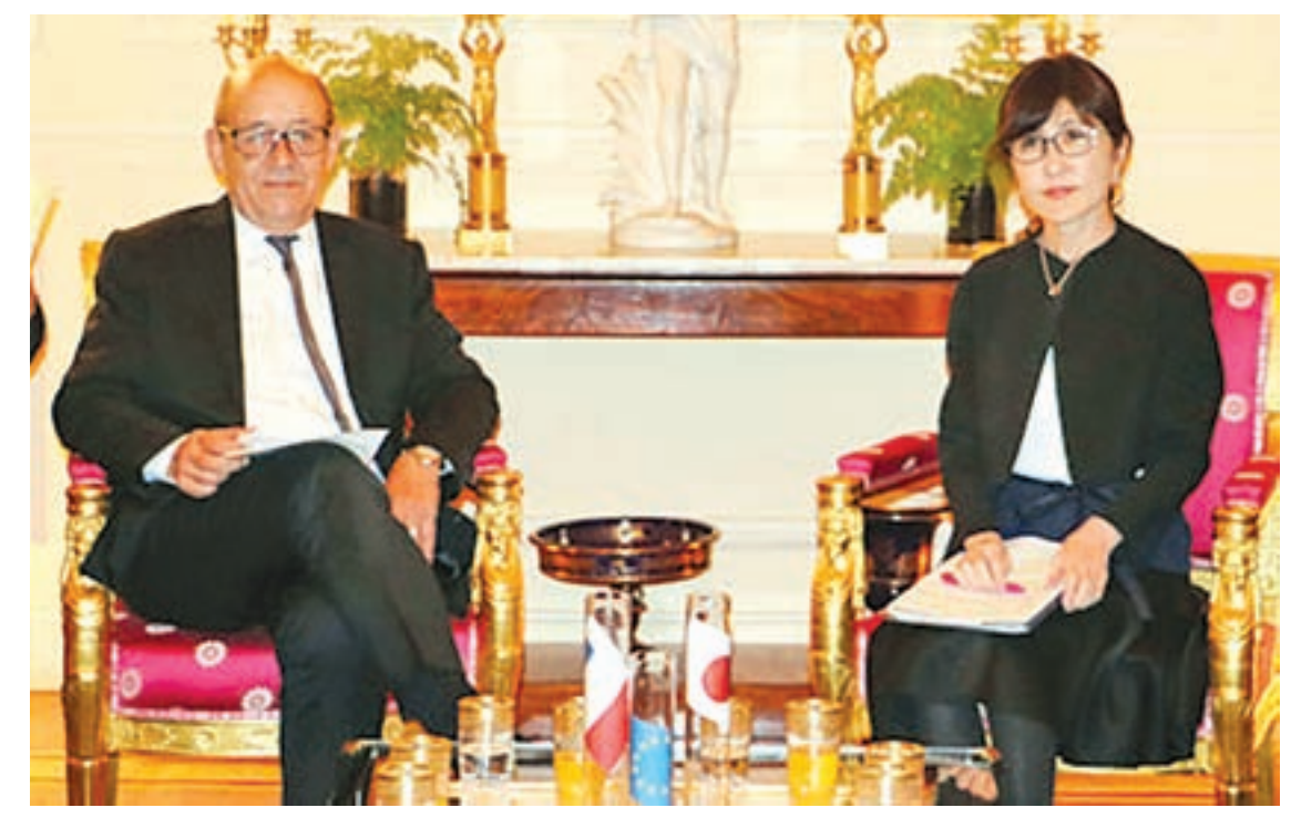
French Defence Minister Jean-Yves Le Drian (L) and his Japanese counterpart Tomomi Inada agree in Paris on 5 December 2017 to strengthen bilateral cooperation ahead of the "two-plus-two" talks involving the countries' foreign ministers.

Under the envisioned acquisition and cross-servicing agreement, Japan's Self-Defence Forces and the French military would provide each other with supplies, such as water and food, and services, including equipment transportation and repair work.