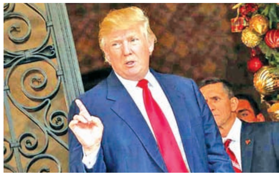
US President-elect Donald Trump talks to members of the media at Mar-a-Lago estate in Palm Beach, Florida, US, on 21 December, 2016.

grants, which they say are a magnet for migration.