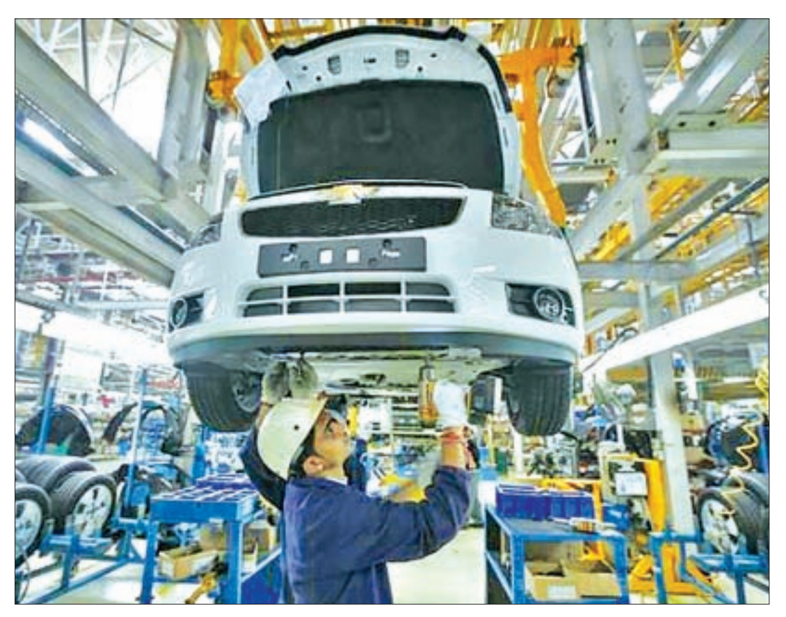
Sources familiar with the Employees work on the Chevrolet Cruze assembly line inside a plant of General Motors India Ltd at Halol, east of Ahmedabad, on 22 September, 2010.

Between April and November, GM's India sales fell 19 percent to 17,868 vehicles, while total passenger vehicle sales in India rose 10 percent over the same period, industry data showed.—Reuters