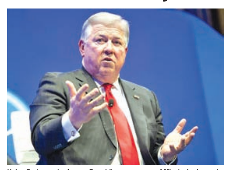
Haley Barbour, the former Republican governor of Mississippi, speaks at the GE conference on "American Competitiveness: What Works" in Washington on 13 February, 2012.

WASHINGTON — Haley Barbour, former Republican Party leader and Mississippi governor, has been hired by the Ukrainian government to lobby US politicians, according to documents filed this week.