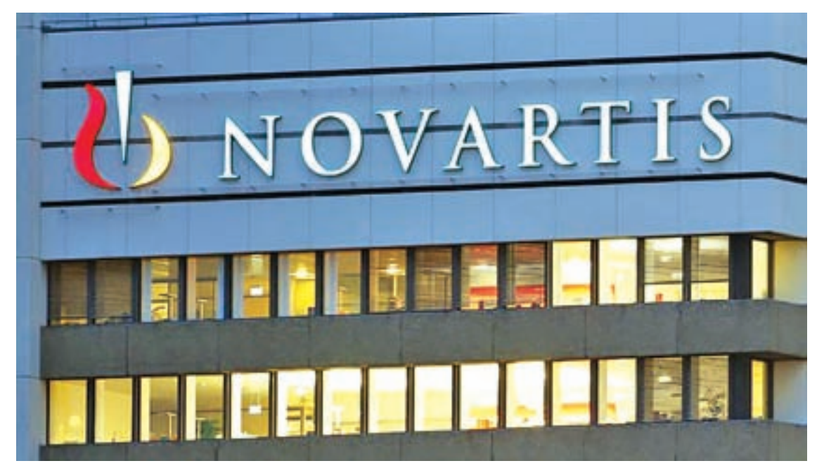
The logo of Swiss drugmaker Novartis is seen at its headquarters in Basel on 22 October, 2013.