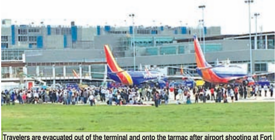
Travelers are evacuated out of the terminal and onto the tarmac after airport shooting at Fort Lauderdale-Hollywood International Airport in Florida, US, on 6 January, 2017.

Santiago, who had served in the US military,