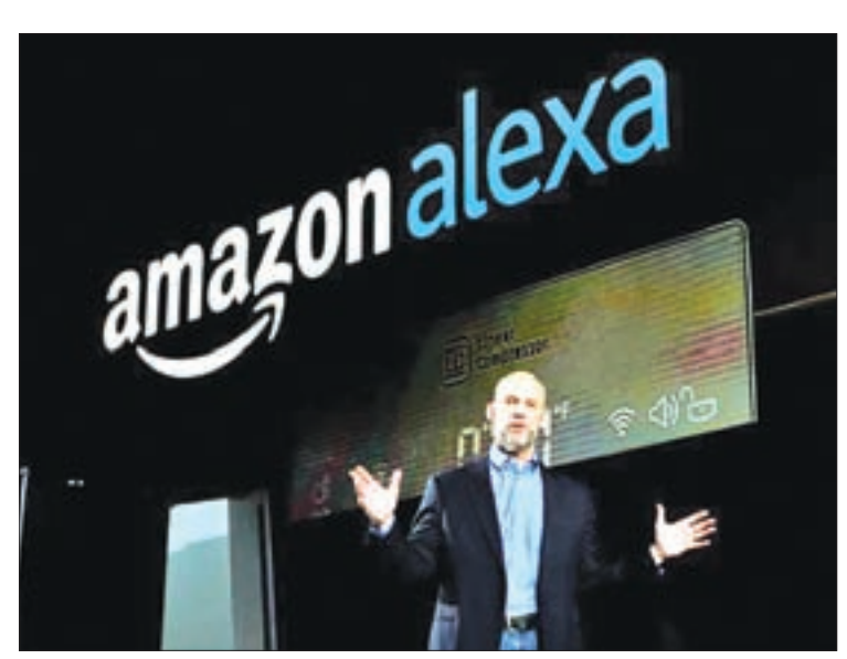
Mike George, VP Alexa, Echo and Appstore for Amazon, speaks during the LG press conference at CES in Las Vegas, US, on 4 January 2017.

The adoption of Alexa by a prominent Android manufacturer indicates that Amazon may have opened up an early lead