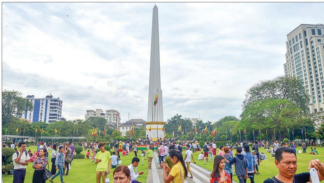
People visit the Independence Monument in the Maha Bandoolla Park in Yangon.