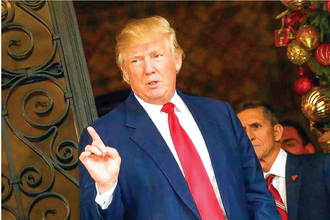
US President-elect Donald Trump talks to members of the media at Mar-a-Lago estate in Palm Beach, Florida, US, on 21 December, 2016.