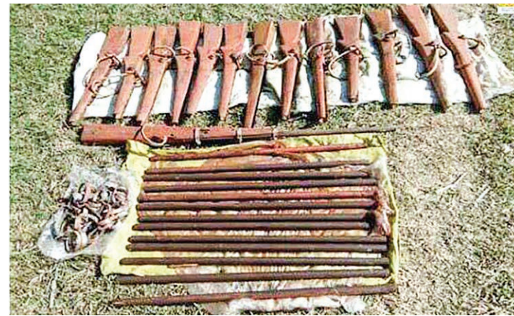
Four suspects and 14 hand-made guns seized in Buthidaung.