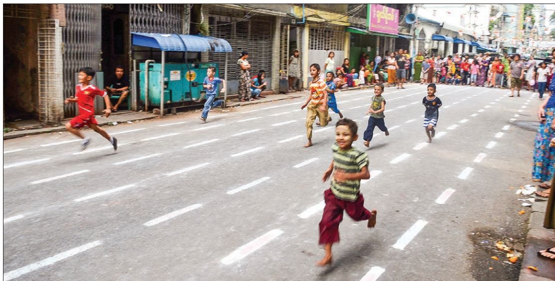
Children take part in the sports activity marking the 69 th Anniversary Independence Day in Yangon.