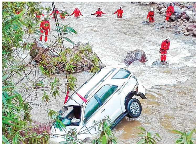
The Toyota Fortuner SUV that overturned into the Nantlon Creek in Mongphyat Township.

carrying six people en route from Kengtung to Tachilek slid out of control and overturned into the Nantlon Creek near the road on 3 January evening. According to investigators, apart from the child, four other people sustained serious injuries and were sent to Kengtung General Hospital after the crash. The young girl named Ma Mari is still missing.