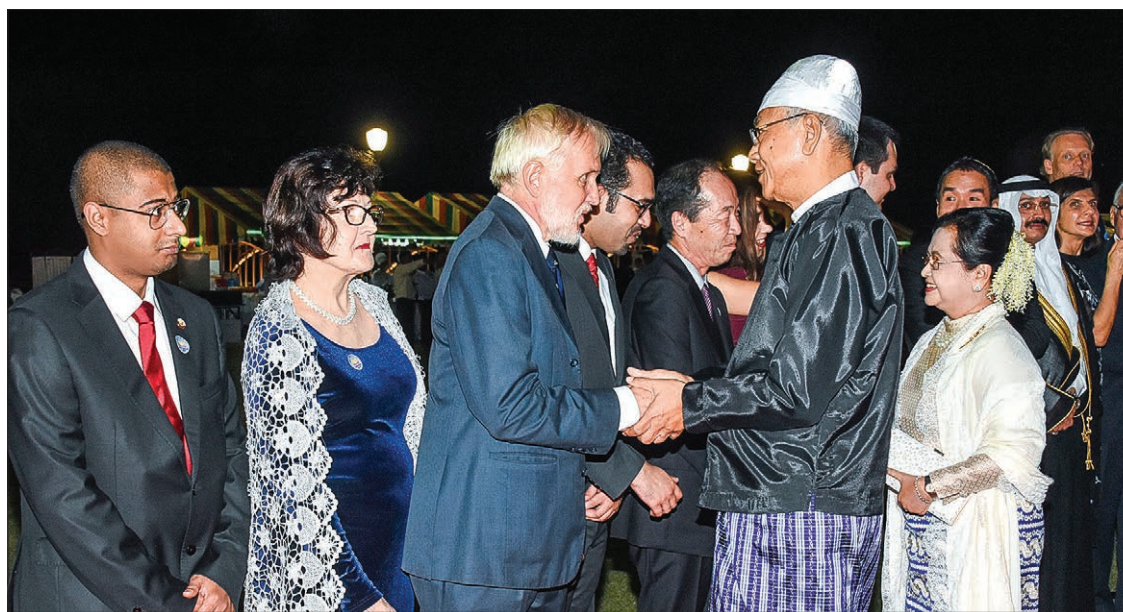
President U Htin Kyaw and his wife Daw Su Su Lwin greet dignitaries at a dinner to mark 69 th Anniversary Independence Day.