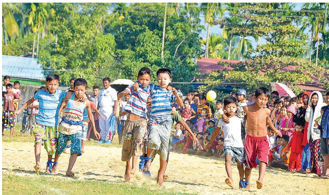
Children participate in 100-meter running event to mark 69th Independence Day.

A state flag-hoisting ceremony to celebrate the 69th Anniversary of Independence Day was held at 4:20 am in the Township General Administrative Office in Maungtaw, Rakhine State, yesterday with district and township department officials, ward and village administrators and local people in attendance. The attendees saluted the state flag at the event.