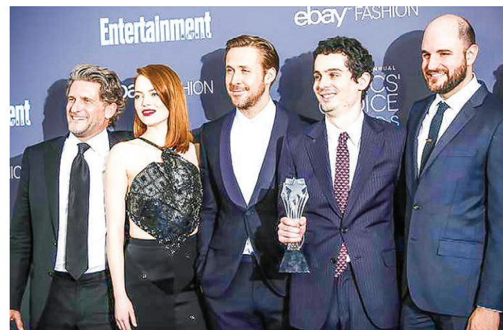
(L-R) Producer Gary Gilbert, actors Emma Stone and Ryan Gosling, director Damien Chazelle and producer Jordan Horowitz pose backstage with their award for Best Picture for ‘La La Land’ during the 22nd Annual Critics’ Choice Awards in Santa Monica, California, US, 11 December, 2016.

Founded in 1935, the New York Film Critics Circle is among the oldest critics groups in the United States, and its awards are seen as a bellwether for the Oscars.—Reuters