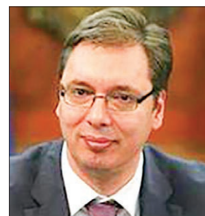
Aleksandar Vucic.

pct of the votes if he were to face Seselj in a run-off vote, and 68 pct or 74 pct in a race against Jeremic or Jankovic, respectively.