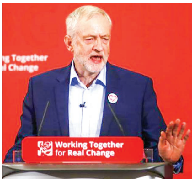
Jeremy Corbyn, the leader of Britain's opposition Labour Party reacts as demonstrators protesting about Syria disrupt his speech on human rights in central London, on 10 December 2016.

of Britain's biggest trade union and Labour's largest financial backer was reported as saying he did not think Corbyn would seek to cling on to power if the party's opinion poll ratings were