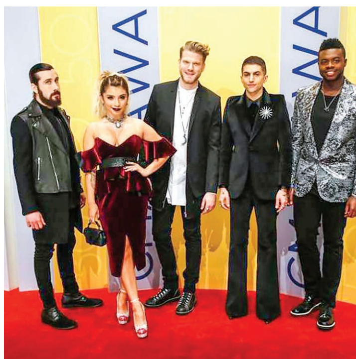
Pop group Pentatonix arrives at the 50th Annual Country Music Association Awards in Nashville, Tennessee, US, on 2 November, 2016.

British singer George Michael, who was found dead on Christmas Day, saw a surge in popularity. His 1984 hit “Careless Whisper” entered the digital song charts in spot 21, and other hits including “Faith” and “Freedom” found their way into the top 30.—Reuters