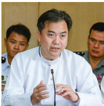
U Kyaw Zeya.

Vice President U Myint Swe also read a message sent by President U Htin Kyaw on the occasion of the 69 th Independence Day. — Myanmar News Agency