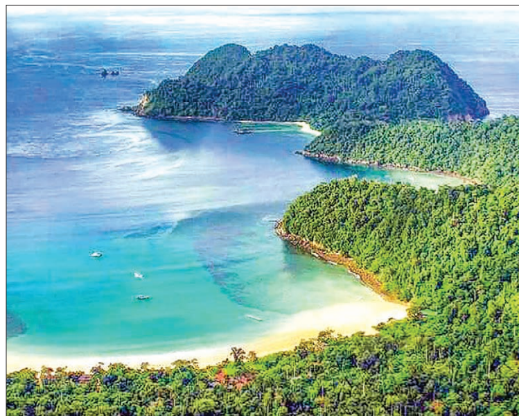
Myeik archipelago in Taninthayi region a new tourist destination within the first six months of 2017.

“Our Taninthayi regional government will cooperate with other ministers to implement the development of Taninthayi region. There are a lot of beautiful places in Myeik archipelago, but we haven’t taken people there yet. The new designation will create job opportunities for the local people, said U Myint Maung, Taninthayi region minister for natural resources and environmental conservation.— Soe Win (MLA)