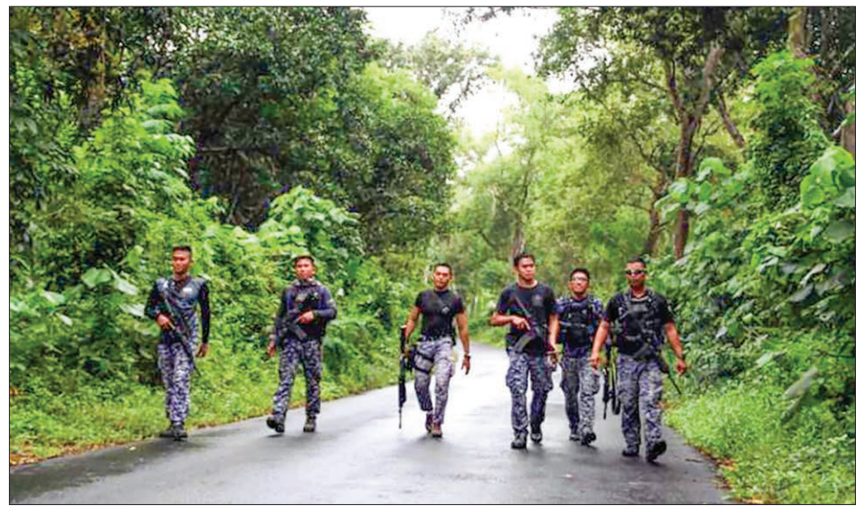
Prison personnel patrol during a manhunt for more than 150 inmates who escaped after gunmen stormed a prison in North Cotabato province, southern Philippines on 4 January, 2017.

Some members of the MILF and BIFF were said to be behind the killing of 44 police commandos in a secret mission two years ago to capture a Malaysian