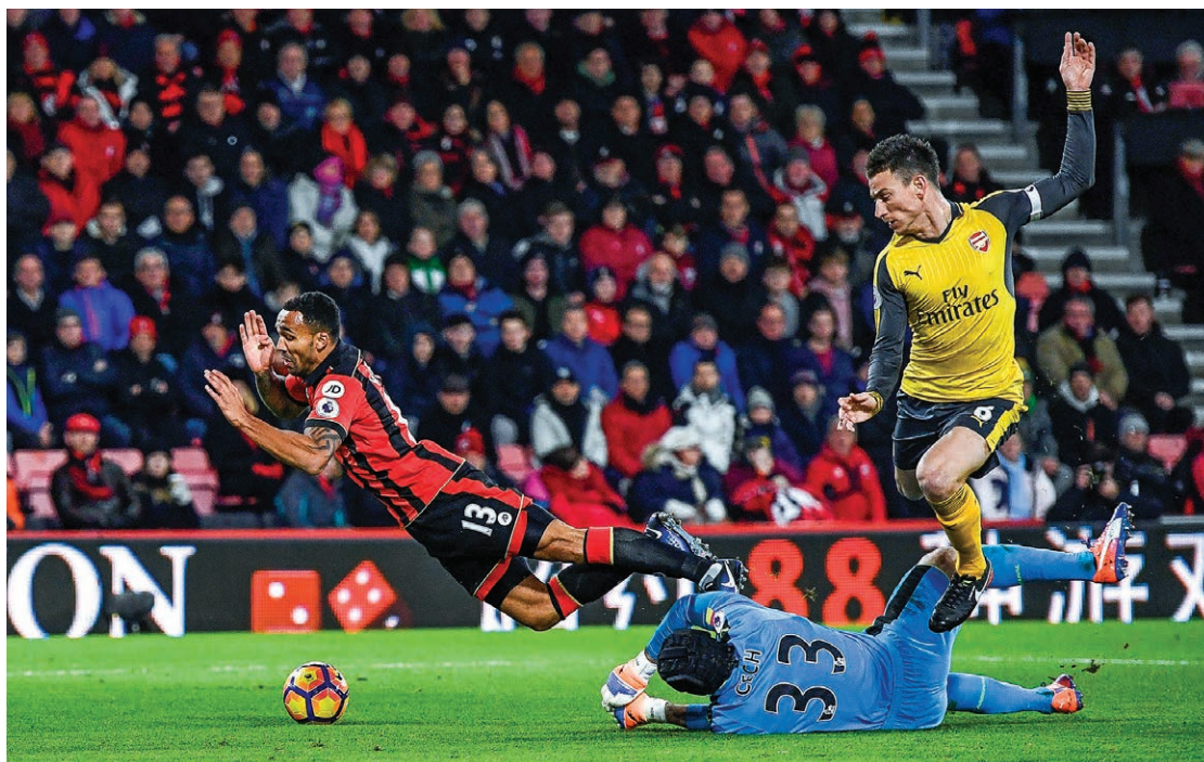
Bournemouth's Callum Wilson goes down under challenge from Arsenal's Petr Cech leading to penalty appeals during the match between AFC Bournemouth and Arsenal at the Vitality Stadium on 3 January, 2017.

"It was not a result we wanted before the game but at 3-0 down we'd have signed for 3-3," Wenger, whose side will slip out of the top four if Tottenham beat Chelsea, said.