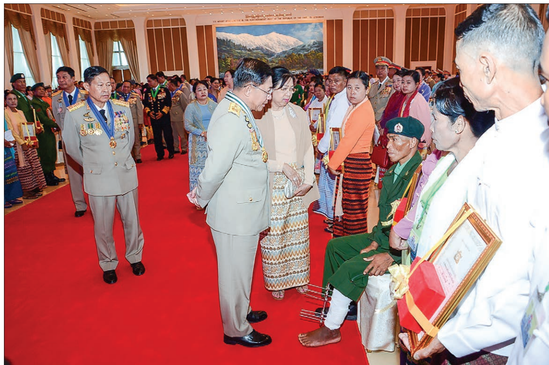
Senior General Min Aung Hlaing greets bravery title winners and relatives of those who were conferred on posthumous titles by the Tatmadaw.

A ceremony to confer honorary medals and posthumous titles to officers and other ranks was held at the Zeyarthiri Beikman in Nay Pyi Taw yesterday afternoon.