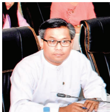
U Kyaw Moe Tun.