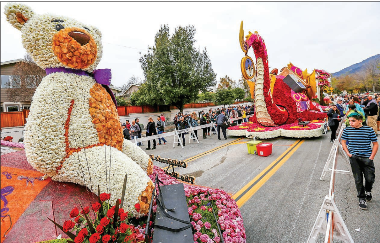
Floats which were featured in the 128th annual Rose Parade are pictured in Pasadena, California US, on 3 January, 2017.