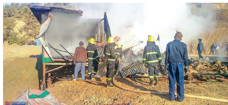
Firefighters putting out a blaze that occurred in Hakha Township on Wednesday.

Only five fire incidents have occurred in the capital of Chin State during the whole 2016. The Wednesday morning incident is the very first one for the city this year.—Myitmakha News Agency