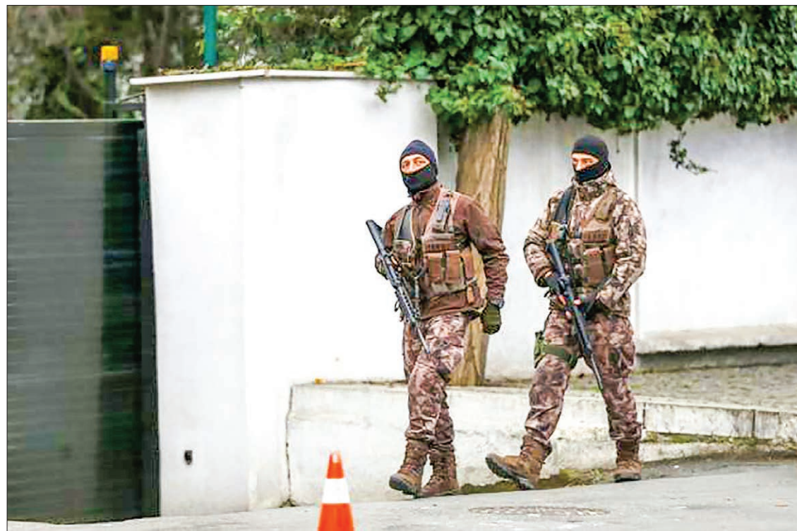
Police special forces patrol outside the Reina nightclub which was attacked by a gunman, in Istanbul, Turkey, on 3 January, 2017.

More than 41,000 people have been jailed pending trial in connection with the attempted coup out of 100,000 who have faced investigation. Some 120,000 people, including soldiers, police officers, teachers, judges and journalists, have been suspended or dismissed since the coup, although thousands of them have since been restored to their posts.—Reuters