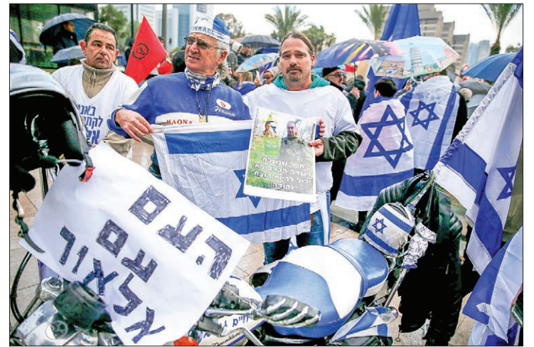
Supporters of Israeli soldier Elor Azaria, who is charged with manslaughter by the Israeli military, hold a poster which reads in Hebrew "A soldier that was sent to the battle field cannot be a murderer full stop" during a protest outside the military court in Tel Aviv on the verdict day for the soldier, Tel Aviv, Israel, on 4 January, 2017.

After redeploying forces, Iraqi forces have been advancing on three fronts toward the Tigris river that bisects Mosul, in a second phase of the offensive. Victory in Mosul would probably spell the end for Islamic State's self-styled caliphate but in recent days the militants have displayed the tactics to which they are likely to resort when they lose the city, with bomb attacks in Baghdad, and attacks on security forces in territory they have lost.—Reuters