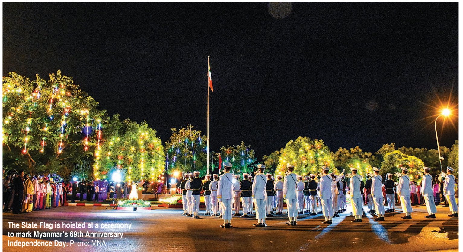
The State Flag is hoisted at a ceremony to mark Myanmar's 69th Anniversary Independence Day.

The flag was raised at 4:20 am, followed by the arrival of departmental personnel, military officials and the rank and file of