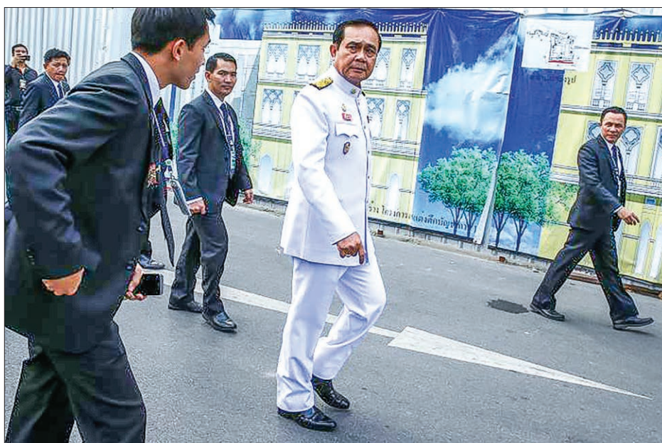
Thailand's Prime Minister Prayuth Chan-ocha (R) and Deputy Prime Minister and Defence Minister Prawit Wongsuwan greet government officers before a weekly cabinet meeting at Government House in Bangkok, Thailand, on 4 January, 2017.

Prime Minister Prayuth Chan-ocha, a former army chief who led the 2014 overthrow of the last