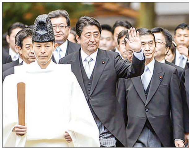
Japanese Prime Minister Shinzo Abe visits the Ise Jingu shrine in Ise, Mie Prefecture, on 4 January, 2017.

self-reliant Japan, Abe said “our future is not something we are given by (other) people.”