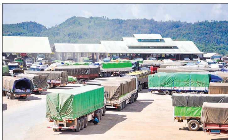
A file photo shows 105-mile border trade zone. PHOTO: PHOE KHWAH

The values of trade through border trade camps as of 23 rd December in this FY were $3482.520mil at Muse, $123.349mil at Lweje $415.873mil at Chin Shwe Haw, $66.626mil at Kanpikete, $3.596mil at Kengtung, $52.801mil at Tachilek, $641.522mil at Myawady, $77.871mil at Kawthaung,