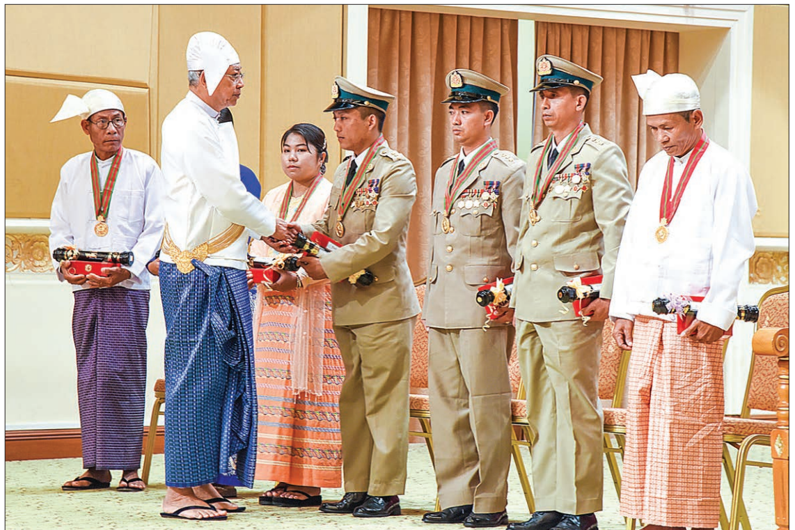
President U Htin Kyaw greets bravery titles winners at the ceremony to confer honorary titles on those who served the country bravely.

"In building up the nation into a peaceful and modern federal democratic Union, it is a great virtue to honour those who