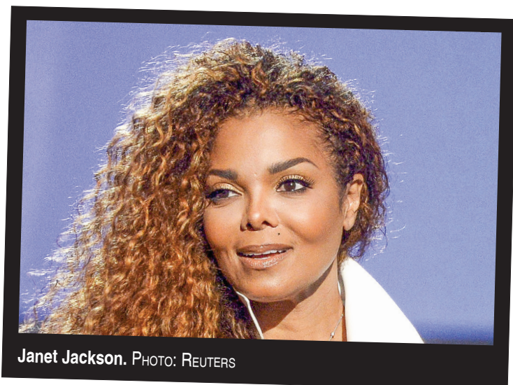
Janet Jackson.