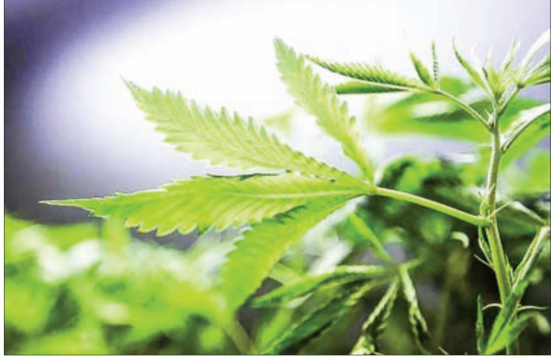
Marijuana plants for sale are displayed at the medical marijuana farmers market at the California Heritage Market in Los Angeles, California, in 2014.