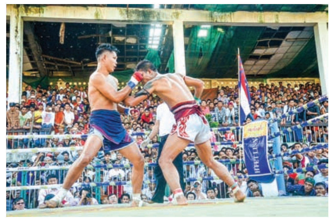
Traditional fighters take part in the traditional Letwai challenge fight marking the Kayin National New Year Festival at the Myanma Railway Football Playing Ground in Insein, Yangon.