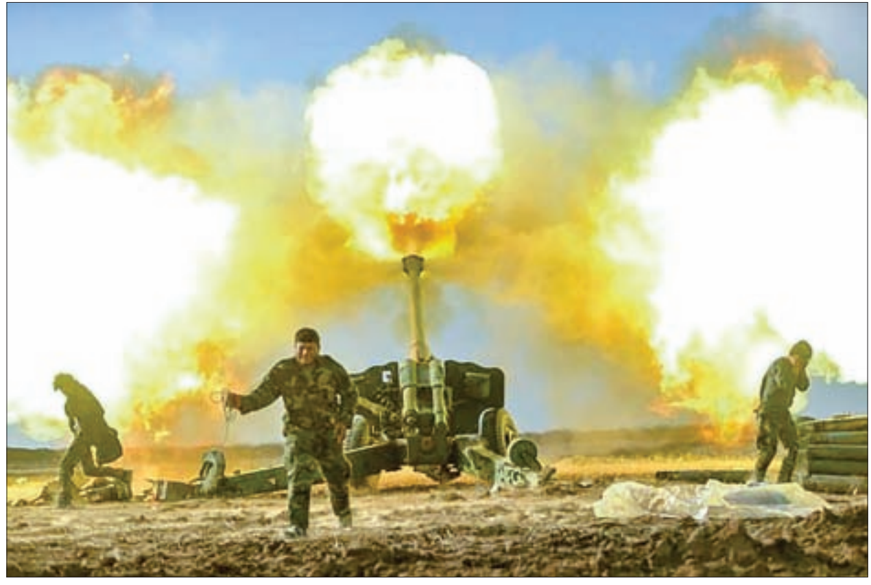
Members of Hashid Shaabi or Popular Mobilisation Forces (PMF) fire towards Islamic State militant positions in west of Mosul, Iraq, on 28 December 2016.

An officer from an elite Interior Ministry unit said on Thursday it was advancing