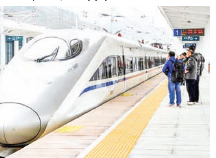
A high-speed railway train linking Shanghai and Kunming, of Yunnan Province, is seen at a station during a partial operation, in Anshun, Guizhou province, China, on 28 December 2016.

and aims to criss-cross the country with four northsouth and four east-west bullet train connections and expand its total network to 150,000 km (93,200 miles)