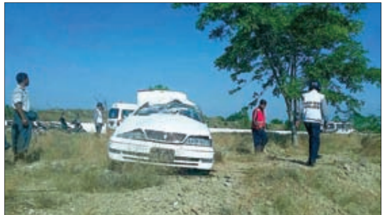
Police are inspecting scene of accident on Ygn-Mdy highway.

The Probox was en route from Nay Pvi Taw to Yangon when it hit the road divider be-