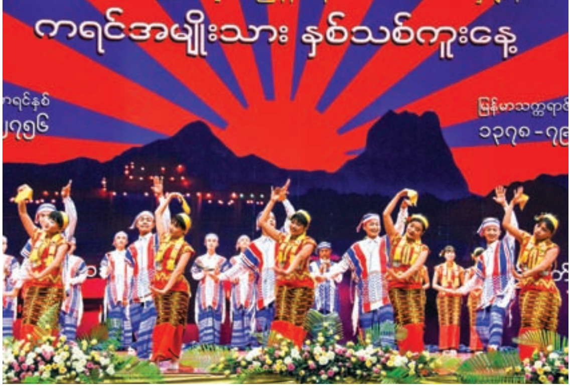
Kayin women perform a traditional Kayin dance at a Kayin New Year Day celebration yesterday.

The Speaker of the Amyotha Hluttaw also used the occasion to appeal for peace and unity in the