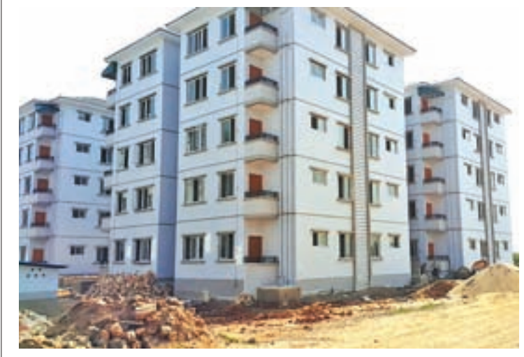
Apartments are seen in Ye township.

In the downtown area, apartments are being sold for Ks400 million these days. Ten years ago, they were sold for only around Ks10 million. Flats out of town are available at a price of Ks10 million or more.— The Mirror