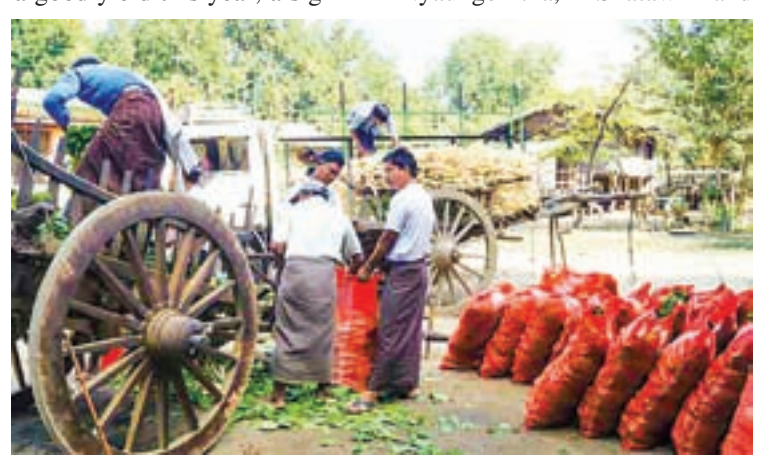
Carrot growers are packaging carrots for selling.

Different kinds of winter crops developed in villages located near Hsinthe Creek— Nweyit, Kyartheai, Hsinthe, Chonegyi, Ywaysu, Shweudaung, Paukpintha, Gwaybin, east and west Kinmuntan, Nyaungbintha, Shataw