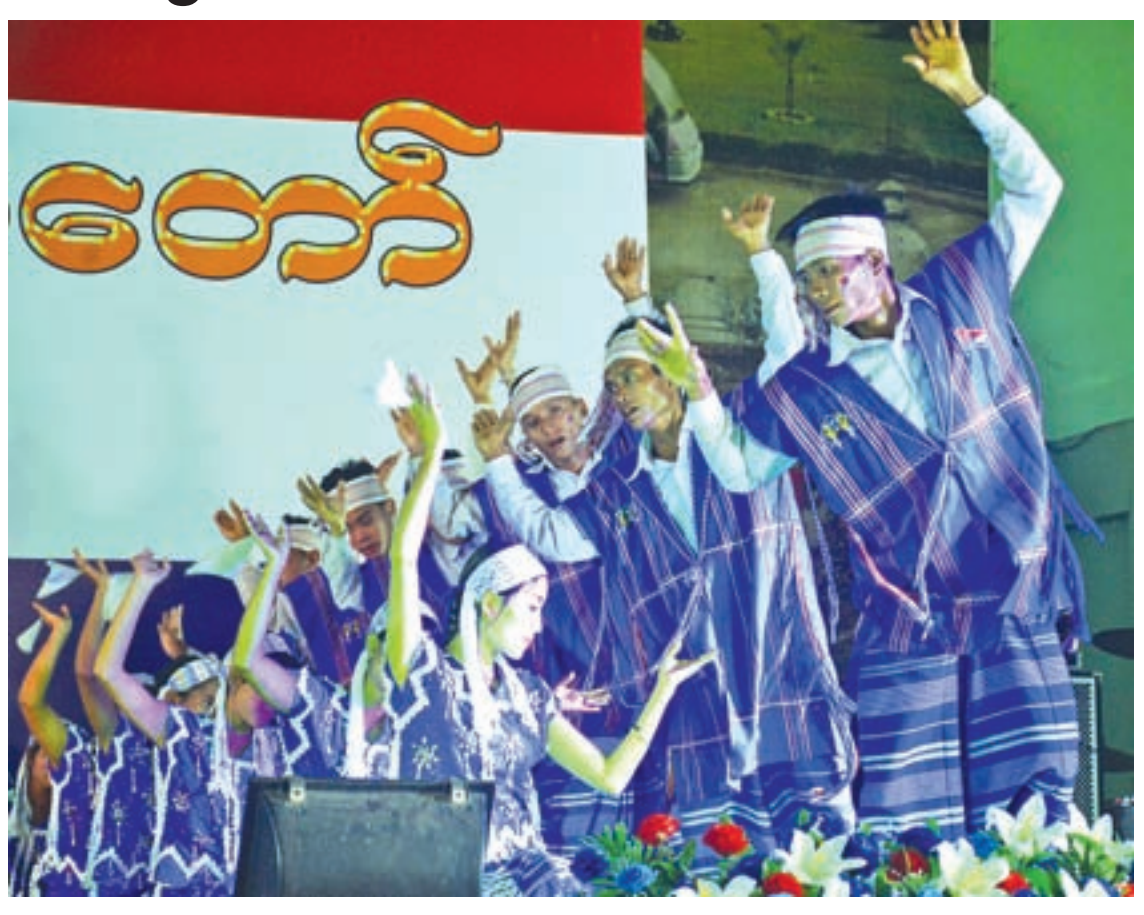
Kayin nationals are performing to mark Kayin New Year Festival at National Races Village.

A FESTIVAL marking the Kayin New Year for 2756 Kayin Era was held by the Organizing Committee for East Yangon Kayin New Year at the National Races Village in Tharketa in Yangon yesterday.