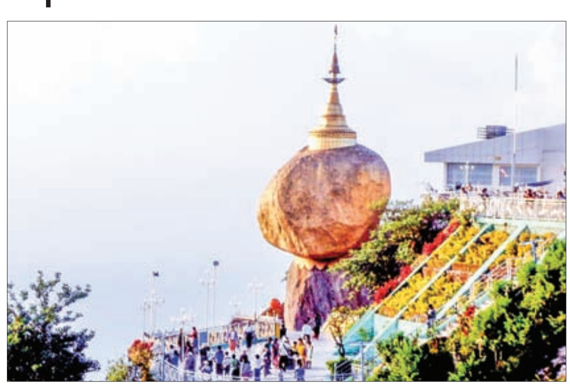
Kyaikhtiyo pagoda is seen precariously located on a stone.

VISITORS to Kyaikhtiyo, the legendary pagoda on the golden rock, are likely to reach about 3 million next year, according to the Myanmar Hoteliers Association.