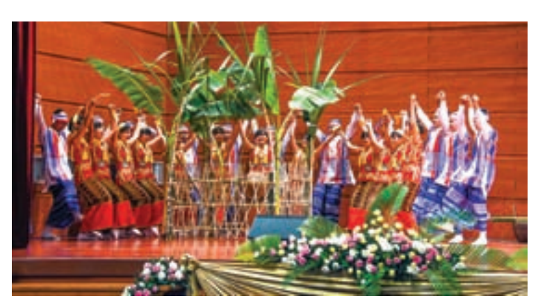
Kavin dancers perform a traditional Kavin dance at a Kavin New Year Day celebration at the MICC 2 in Nay Pyi Taw yesterday.

"Not only for our hope of extinguishing the flames of our 60-year-long civil war after gaining Independence in the near future in order to survive, but also for our expectations to come into existence. Let us cultivate the practice of mutual respect and understanding among our brethren nationals. We hope our special wish for our saplings of peace planted this year will bring about the feast of eating the first crop of the harvest — Peace across the nation," said the State Counsellor in her message sent on the occasion of the Kayin New Year Day previous day.— Myanmar News Agency