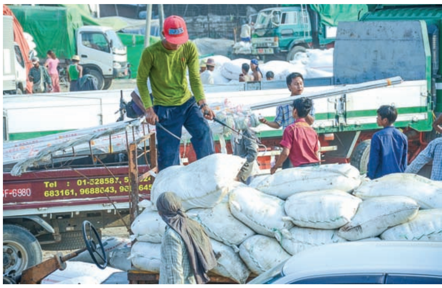
Workers load goods onto a car at Bayintnaung Market in Yangon.

Businessmen from China and Thailand will come to invest in construction and other businesses in Shan State, it is learnt.—200