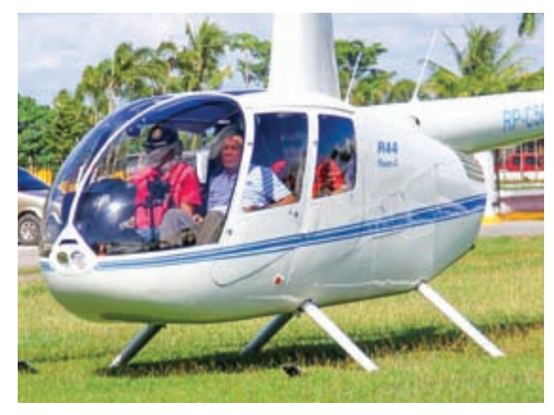
Then-local mayor of Davao city Rodrigo Duterte (R), aboard a helicopter, arrives at the provincial capitol in Tagum city, Davao del Norte, southern Philippines for the Regional Peace and Order Council meeting, on 20 April, 2015.

The United Nations' top human rights envoy has called for an investigation into Duterte's claims of killing people, to which Duterte last week responded by calling him "stupid", an "idiot" and a "son of a bitch" who should go back to school.—Reuters