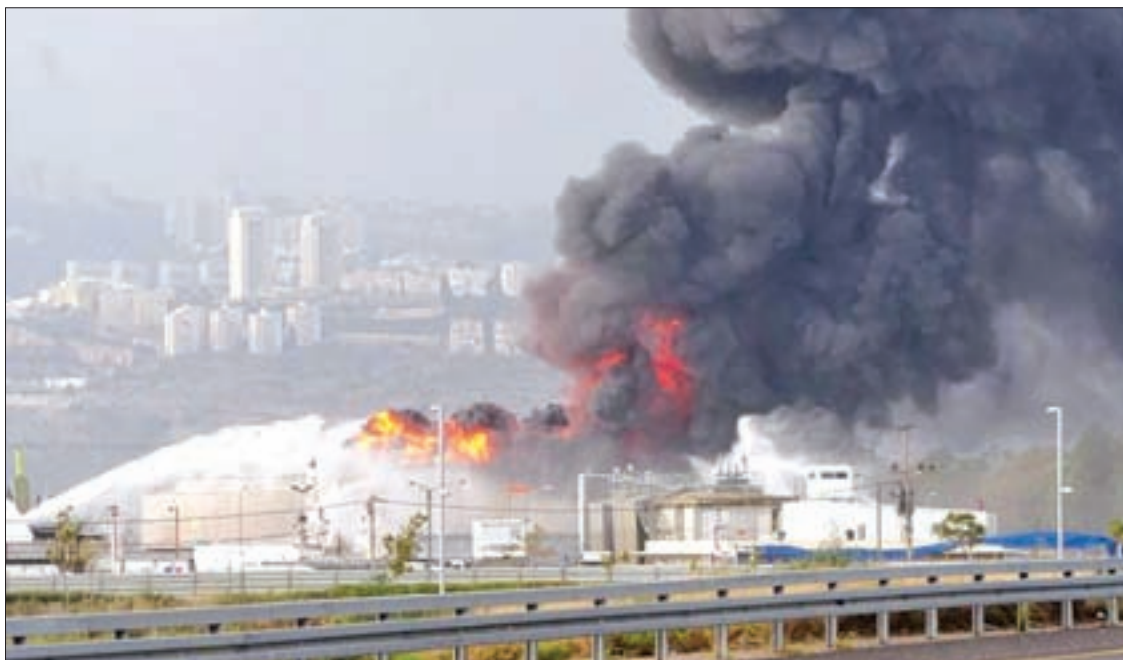
A blaze can be seen after fire erupted in a fuel tank at Oil Refineries Ltd in the Israeli northern city of Haifa on 25 December 2016.

Israel’s largest oil refinery is controlled by holding company Israel Corp.—Reuters