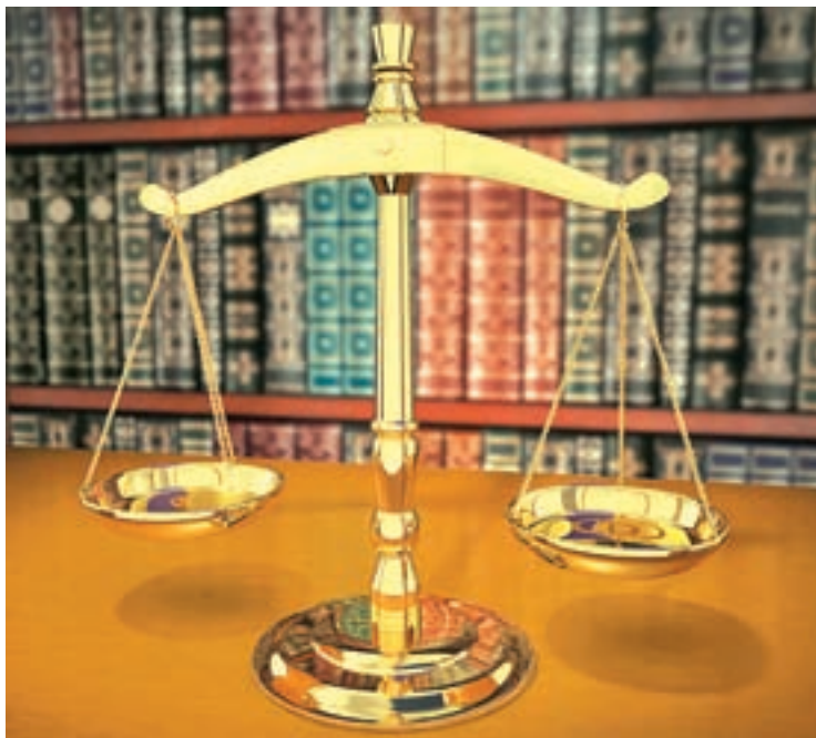
The symbol of administration of justice used around the world.

(d) on the management of a hospital or being on the staff of a hospital, abuses such a position or fiduciary relationship to induce or seduce any woman either in his custody or under his charge or present in the premises to have sexual intercourse with him, such sexual intercourse not amounting to rape, shall be punished with