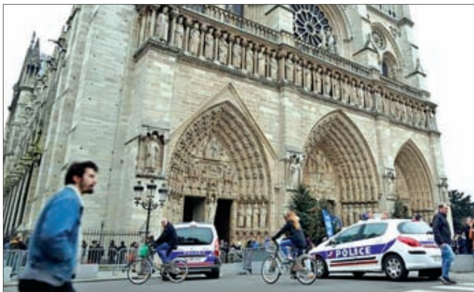
French police cars are parked in front of the Notre Dame Cathedral as emergency security measures continue during the holiday season in Paris, France, on 23 December 2016.

Security was also stepped up in central Milan and other Italian cities, particularly near major churches where the faithful were attending Christmas services.