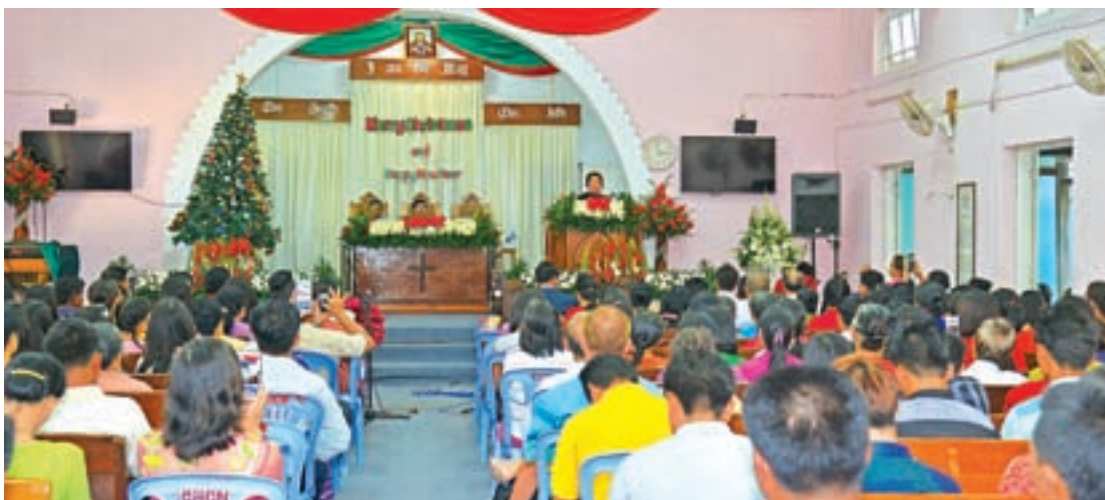
Vice president U Henry Van Thio attends the Christmas prayer service at the Chin Baptist Christian Church in Pyinmana.