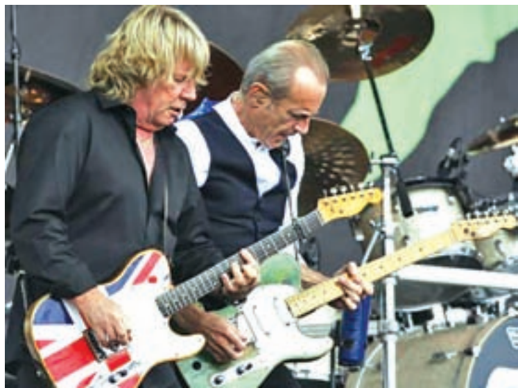
Rick Parfitt (L) and Francis Rossi of British rock group Status Quo perform at the Glastonbury Festival 2009 in south west England, on 28 June 2009.

LONDON — Rick Parfitt, the guitarist of British rock group Status Quo, died in hospital on Saturday in Spain aged 68 after suffering from a severe infection.