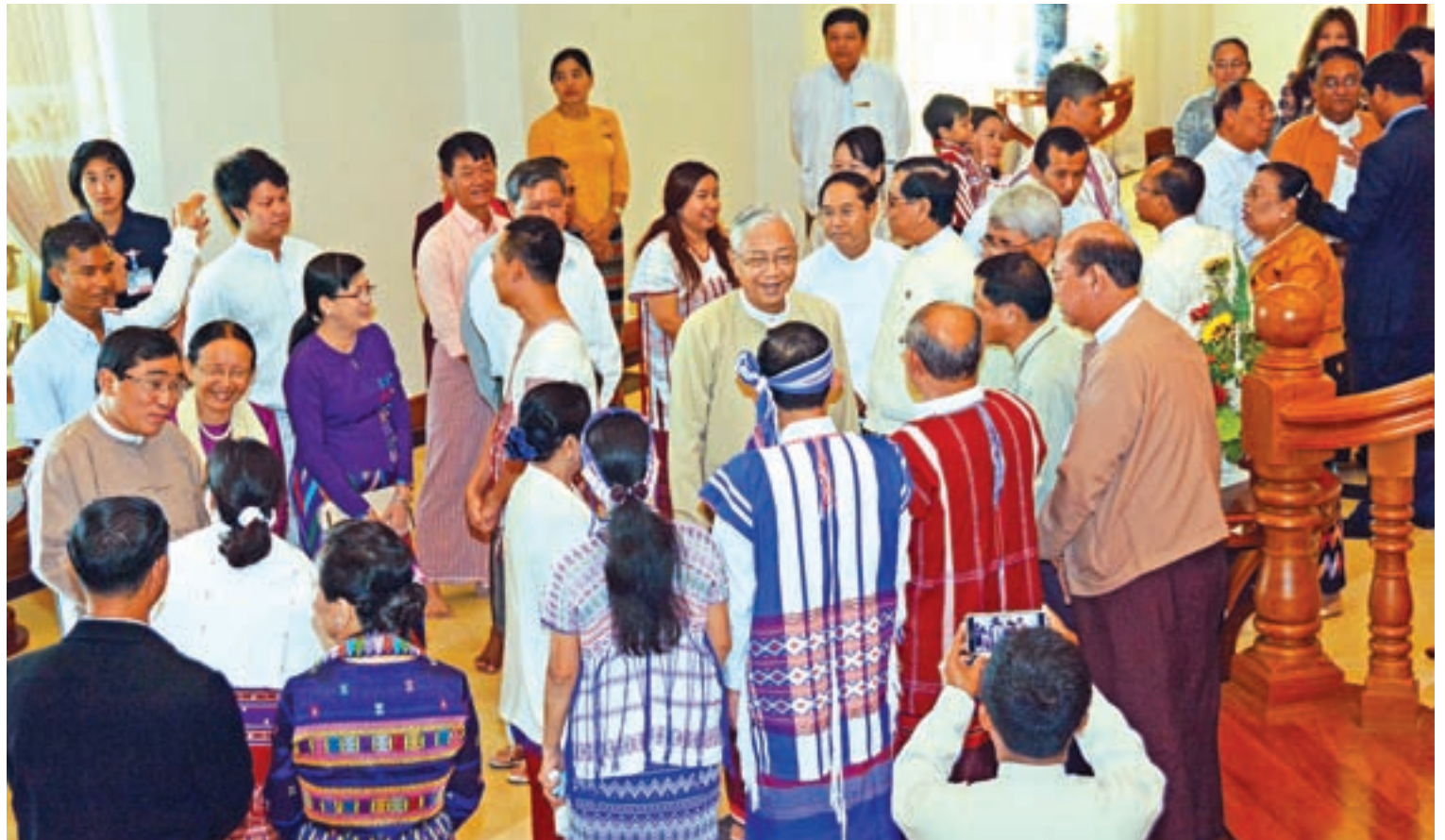
President U Htin Kyaw and wife Daw Su Su Lwin are welcomed by Amyotha Hluttaw Speaker Mann Win Khaing Than and family.

Later, the President and his wife enjoyed Christmas lunch with the guests and said prayers before posing for documentary photos.