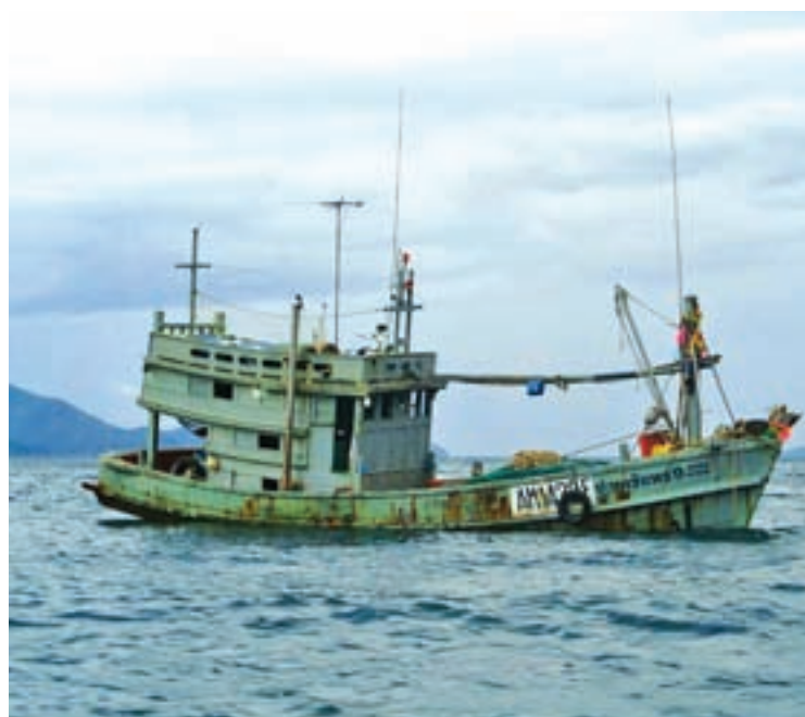
The illegal fishing boat from Thailand.

The boat turned and attempted to escape, but the naval ship was able to intercept it at about 9:30 am. Action is being taken against the five in accordance with the law.— Myanmar News Agency