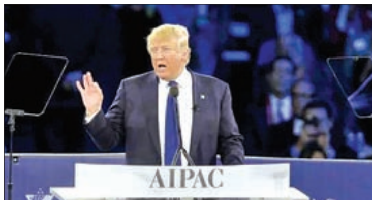
Republican US presidential candidate Donald Trump addresses the American Israel Public Affairs Committee (AIPAC) afternoon general session in Washington, on 21 March 2016.

“The Trump Foundation is still under investigation by this office and cannot legally dissolve