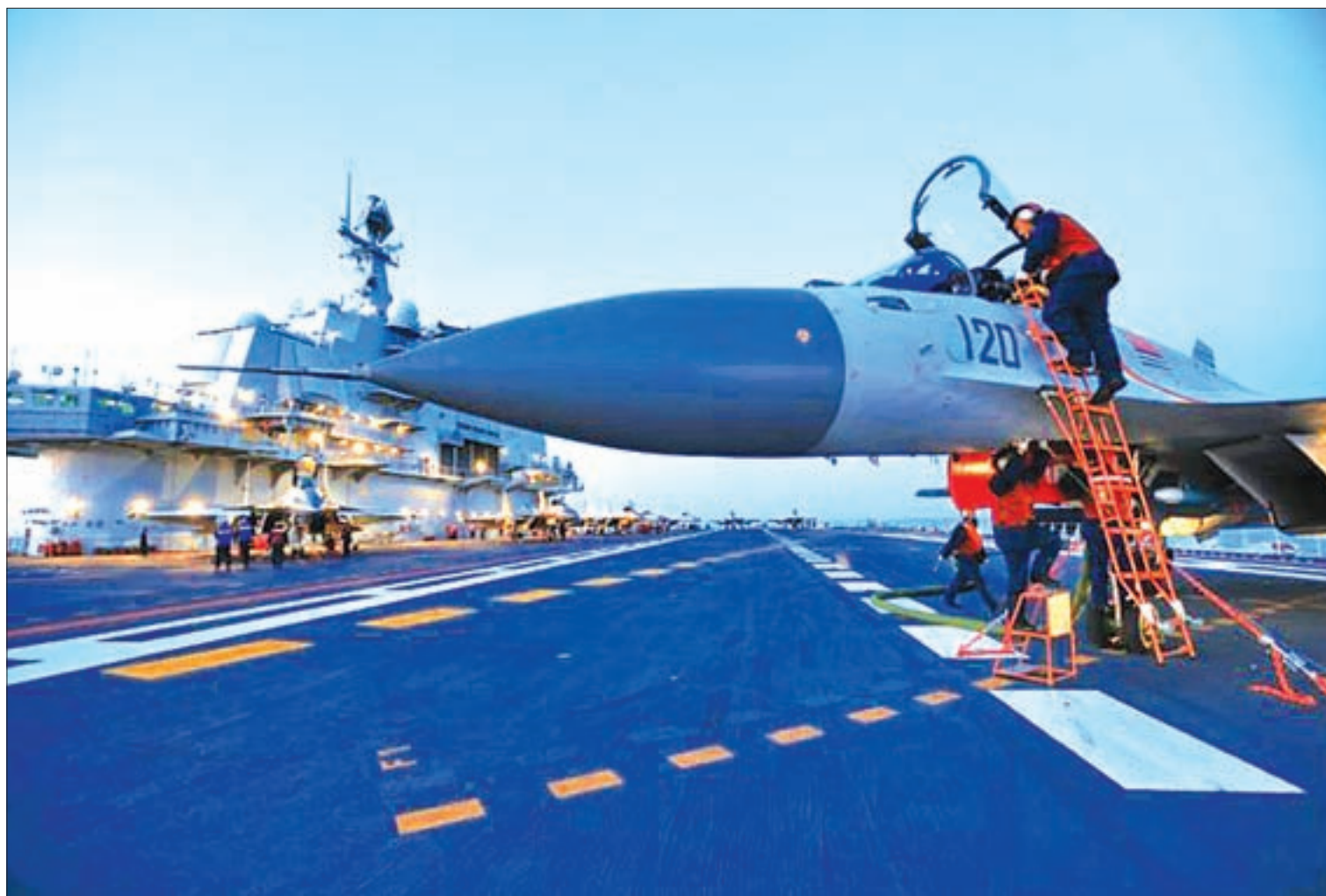
A live-fire drill using an aircraft carrier is seen carried out in the Bohai sea, China, on 11 December 2016.

China's successful operation of the Liaoning is the first step in what state media and some military experts believe will be the deployment of domestically built carriers by 2020.—Reuters