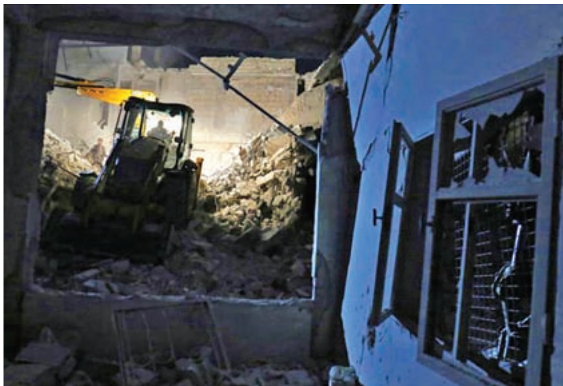
Civil defence members work at a site hit at night by an airstrike in Saraqeb, in rebel-held Idlib province, Syria on 11 December 2016.

Although the Syrian army, with the help of Iranian-backed