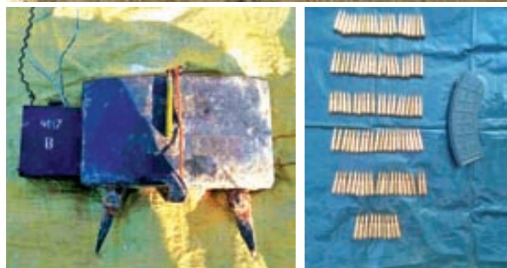
Land mines and ammunition seized in Mongko.