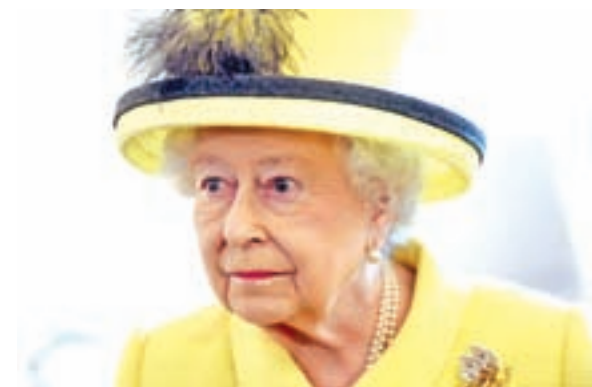
Queen Elizabeth II visits Goodenough College, the leading residential community for British and international postgraduate students studying in London, during a visit in London, Britain, on 1 December 2016.

LONDON — Britain’s Queen Elizabeth, 90, will miss a traditional Christmas church service on Sunday for the first time in nearly 30 years due to a heavy cold, a Buckingham Palace spokesman said.