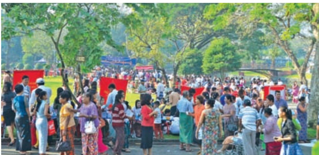
Rakhine communities participate in their gathering at U Ottama Park in Yangon.

THANDWE District Association (Yangon) held its annual gathering yesterday at the U Ottama Park in Yangon.