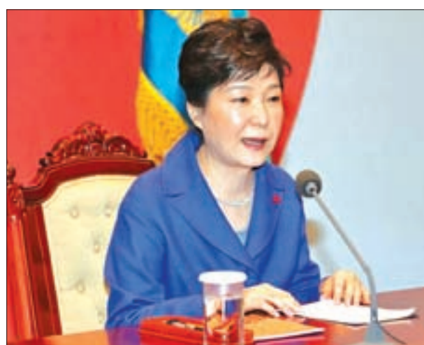
South Korean President Park Geun-hye speaks during an emergency cabinet meeting at the Presidential Blue House in Seoul, South Korea, on 9 December 2016.