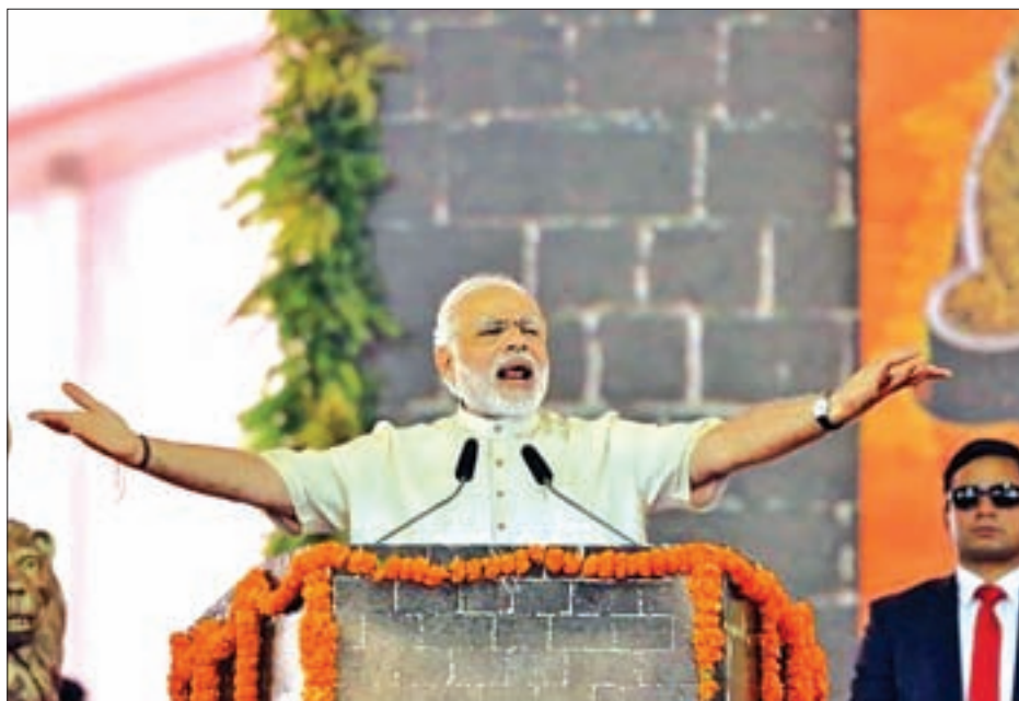
India's Prime Minister Narendra Modi speaks after laying the foundation for the memorial of Chhatrapati Shivaji Maharaj, in Mumbai, India, on 24 December 2016.

"We will not take decisions for short-term political point scoring . . . We will not shy away from taking difficult decisions if those decisions are in the interests of the country," Modi said.