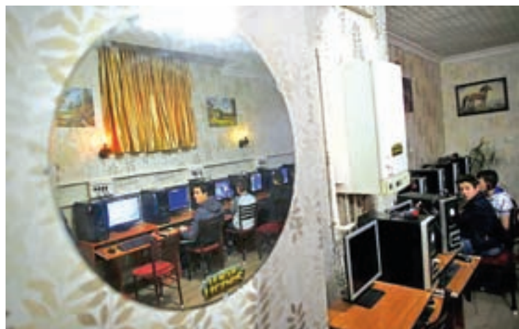
People use computers at an internet cafe in Ankara on 6 April 2015.

Technical experts at watchdog groups say the blackouts on social media are intentional, aimed in part at stopping the spread of militant images and propaganda. —Reuters