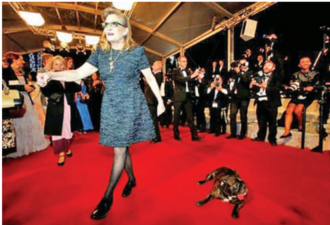
Actress Carrie Fisher arrives with her dog on the red carpet for the screening of the film “The Handmaiden” (Agassi or Mademoiselle) in competition at the 69th Cannes Film Festival in Cannes, France, on 14 May, 2016.

Fisher caused a stir in November with the disclosure that