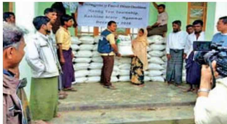
Donation of rice by Mauk being handed over.