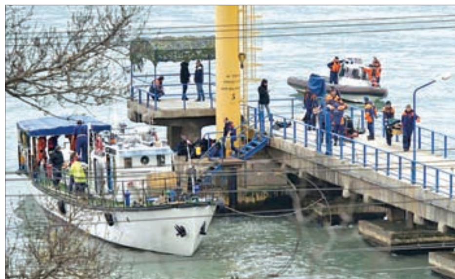
Russian Emergencies Ministry members work at a quay of the Black Sea near the crash site of Russian military Tu-154 plane, in the Sochi suburb of Khosta, Russia, on 25 December 2016.

MOSCOW — A Russian military plane with 92 people on board has crashed into the Black Sea on its way to Syria, Russian news agencies reported on Sunday, and it was unlikely there would be any survivors.