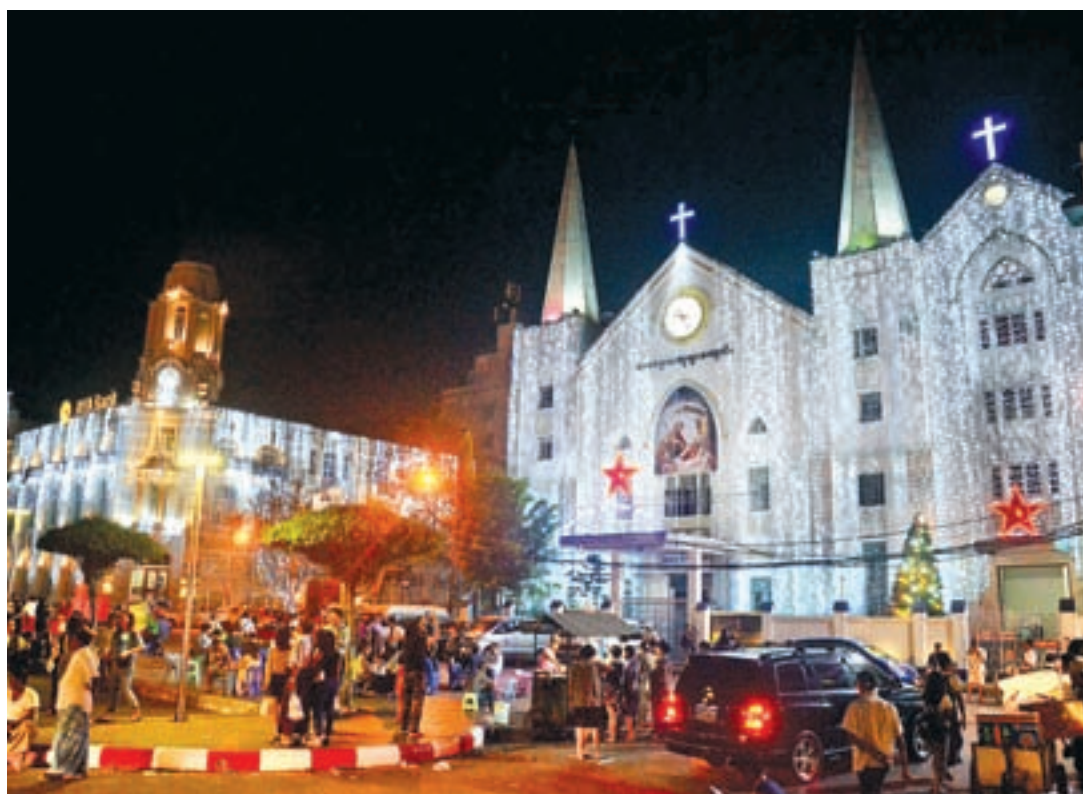
Immanuel Baptist Church is illuminated on Christmas Day in Yangon.