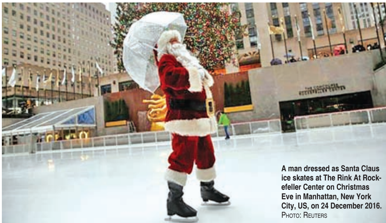
A man dressed as Santa Claus ice skates at The Rink At Rockefeller Center on Christmas Eve in Manhattan, New York City, US, on 24 December 2016.

DENVER— A powerful Christmas Eve snowstorm descending on much of North America will not slow Santa Claus as he delivers presents to good girls and boys, US military officials who track his annual flight said on Saturday.