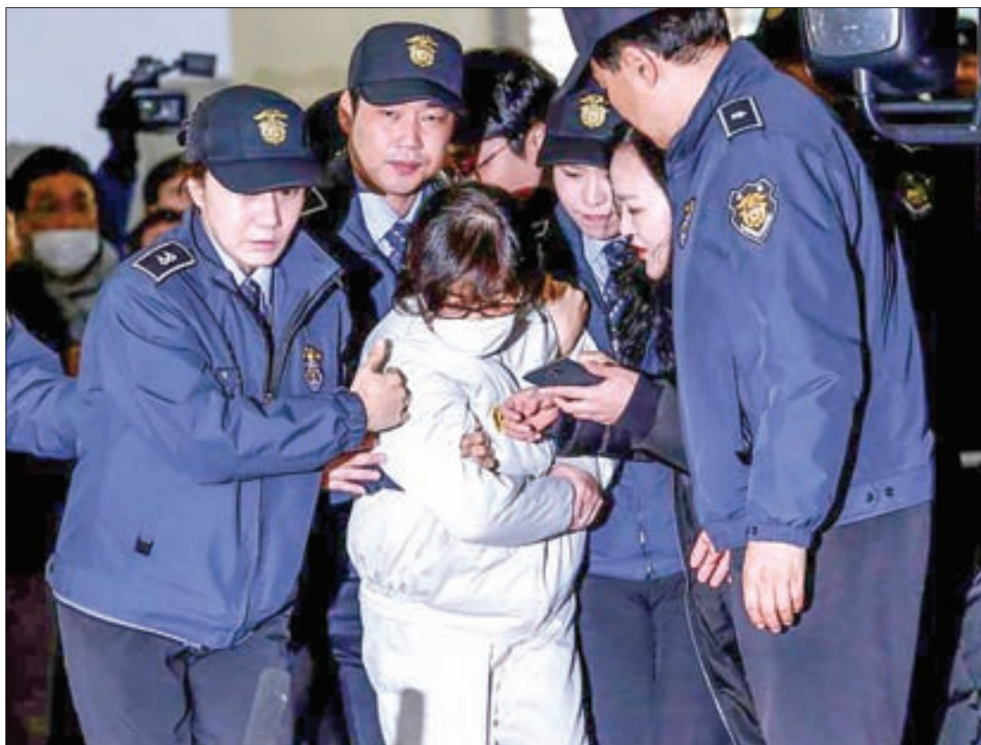
Choi Soon-sil, the jailed confidante of disgraced South Korean President Park Geun-hye, centre, arrives for questioning into her suspected role in political scandal at the office of the independent counsel in Seoul, South Korea, on 24 December 2016.

up to 100 days to investigate allegations that Park colluded with Choi and her aides to pressure big conglomerates to contribute 77 billion won ($64 million) to foundations set up to back her policy initiatives.