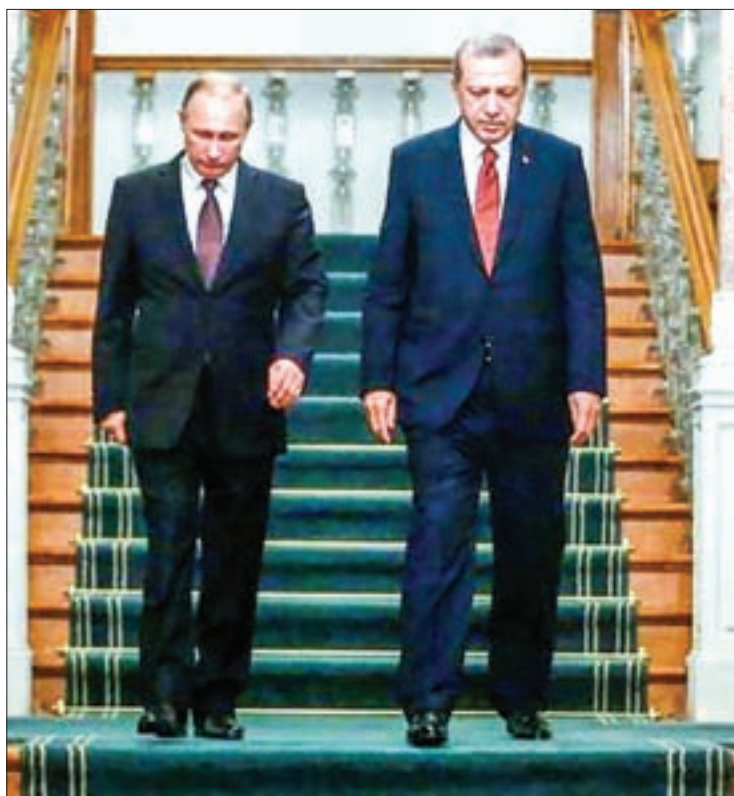
Russian President Vladimir Putin (L) and his Turkish counterpart Tayyip Erdogan arrive for a news conference following their meeting in Istanbul, Turkey, on 10 October 2016.

The battalion will help local officials with law enforcement, the defense ministry was quoted as saying by RIA news agency.— Reuters