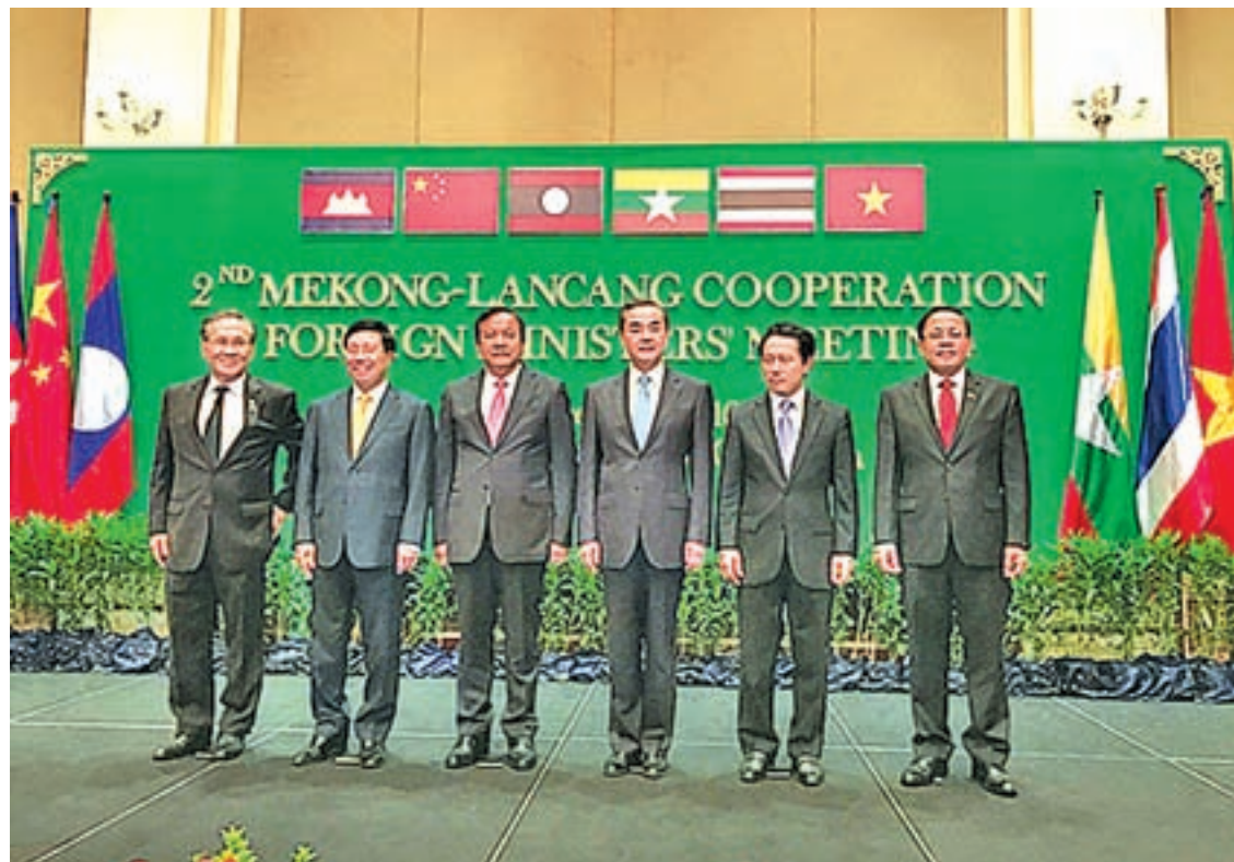
Minister of State for Foreign Affairs U Kyaw Tin is seen together with other foreign ministers attending the 2nd Mekong-Lancang Cooperation (MLC) Foreign Ministers' Meeting.

While in Siem Reap, Minister for Foreign Affairs met with Mr. Wan Yi, Foreign Minister of the Peoples' Republic of China and discussed matters on Mekong subregional cooperation and bilateral relations. —Myanmar News Agency