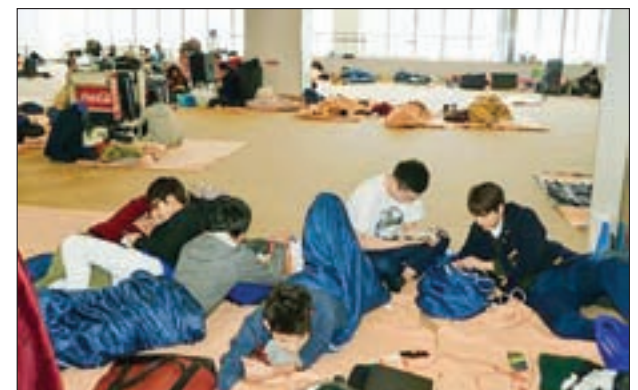
Passengers remain stranded at New Chitose Airport in Hokkaido on 24 December 2016, having spent the night at the airport after heavy snowfall cancelled hundreds of flights.

ro Station, on Saturday as the task of clearing snow took longer than predicted.—Kyodo News