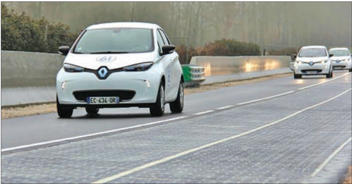
Automobiles drive on a solar panel road during its inauguration in Tourouvre-au-Perche Village, north France, on 22 December, 2016. France installed the world's first solar road in Normandy in north France, which aims to provide power to the local streetlights and encourage renewable energy use needed to combat climate change.

His new chocolate factory taking shape in the town of Hatvan, about 60 km (40 miles) east of Budapest, will become operational towards the end of 2017, giving jobs to 540 people and pro- ducing about 7,500 tonnes of chocolate per year. —Reuters