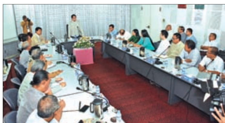
Information minister speaking at the second co-ordination meeting.

Participants at the meeting discussed production of seven full-length movies and television series, the formation of a committee for production of them, selection of directors, actors, ac-