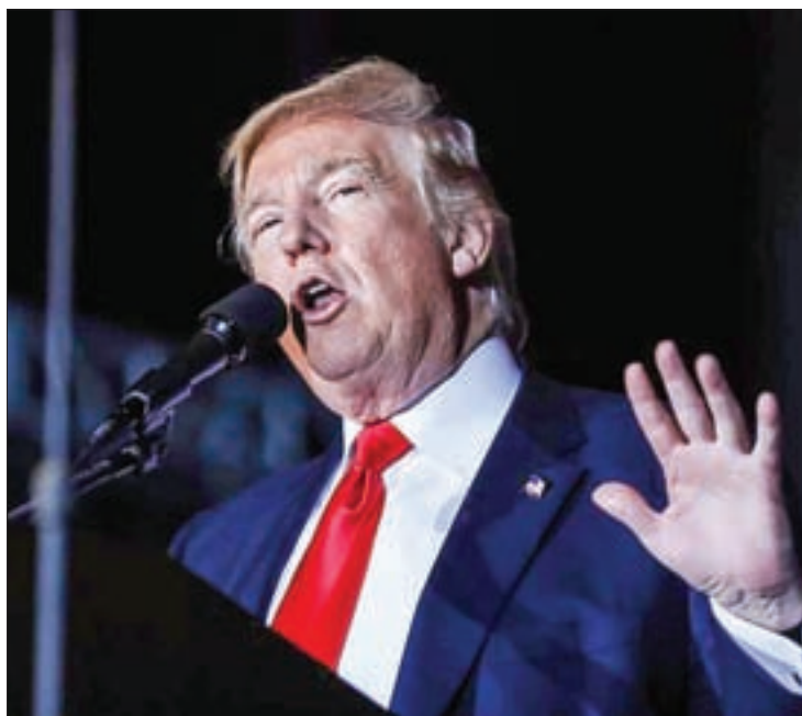
US President-elect Donald Trump speaks during a USA Thank You Tour event in Orlando, Florida, US, on 16 December 2016.

The broadsides from Trump's resort in Florida appeared to be aimed mostly at Putin even though the two men have vowed to patch up relations between their countries once the Republican enters the White House.