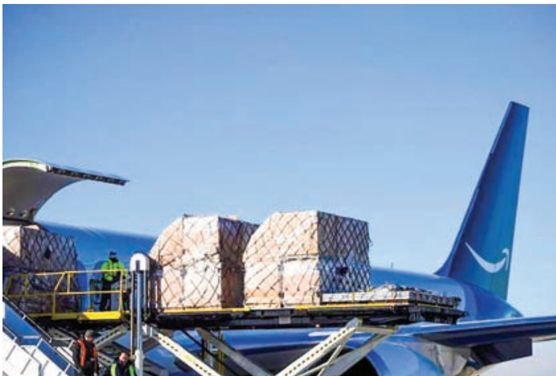
A wide body aircraft emblazoned with Amazon’s Prime logo is unloaded at Lehigh Valley International Airport in Allentown, Pennsylvania, US, on 20 December 2016.

Bulky boxes with goods once purchased in stores, like toilet paper, are a revenue driver at UPS