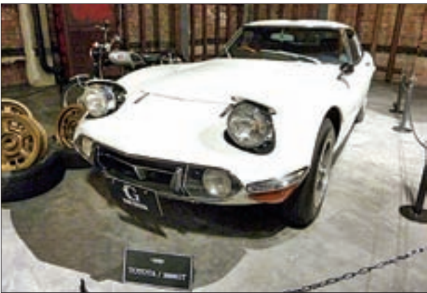
Photo taken on 29 November 2016, shows a Toyota 2000GT sports car displayed at Glion Museum, a century-old warehouse-turned museum for vintage cars, in Osaka.

Examples from approximately 100 years of motoring history, from the early 1900s