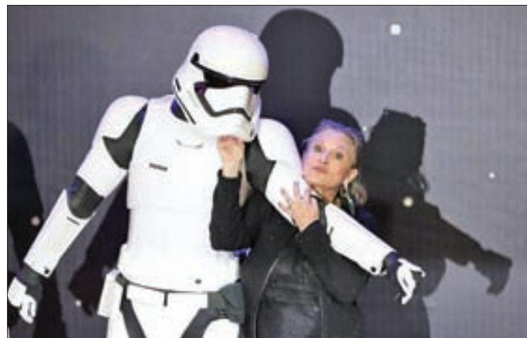
Carrie Fisher poses for cameras as she arrives at the European Premiere of Star Wars, The Force Awakens in Leicester Square, London, on 16 December 2015.

Two passengers who said they were aboard the flight and sitting near Fisher posted messages on Twitter reporting that she had fallen ill.— Reuters