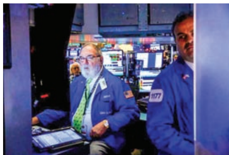
Traders work on the floor at the opening of the day’s trading at the New York Stock Exchange (NYSE) in Manhattan, New York City, US, on 22 December 2016.

Analysts calculate that, all else being equal, a 5 per cent increase in the dollar translates into about a 3 per cent negative earnings revision for the S&P 500 .SPX and a half-point drag on