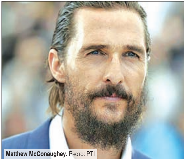
Matthew McConaughey.