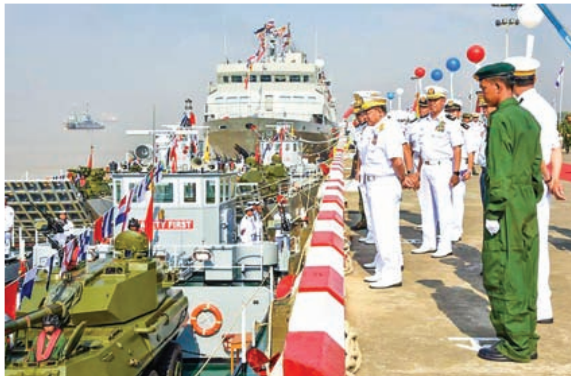
Commissioning ceremony of new vessels for marking the 69 th anniversary Myanmar Navy Day in progress.

MYANMAR NAVY commissioned its new vessels at the No 3 jetty in Yangon yesterday for marking the 69th anniversary Day of Myanmar Navy.