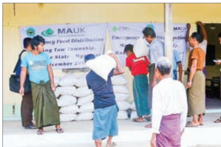
Villagers carry rice bags donated by MAUK.