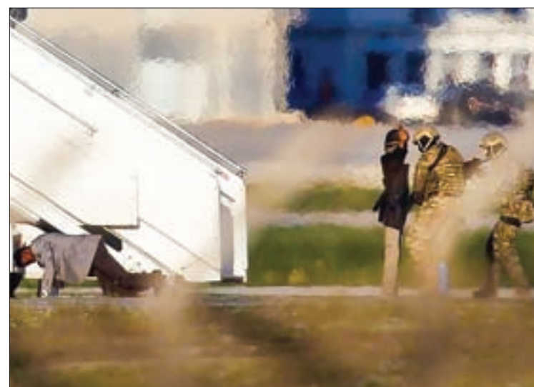
Two hijackers of a Libyan Afriqiyah Airways Airbus A320 surrender to Maltese military on the runway at Malta Airport, on 23 December 2016.

With troops positioned a few hundred meters (yards) away, buses were driven onto the tarmac at Malta International Airport to carry away 109 passengers, as well as some of the crew. Television footage showed no signs of strug-