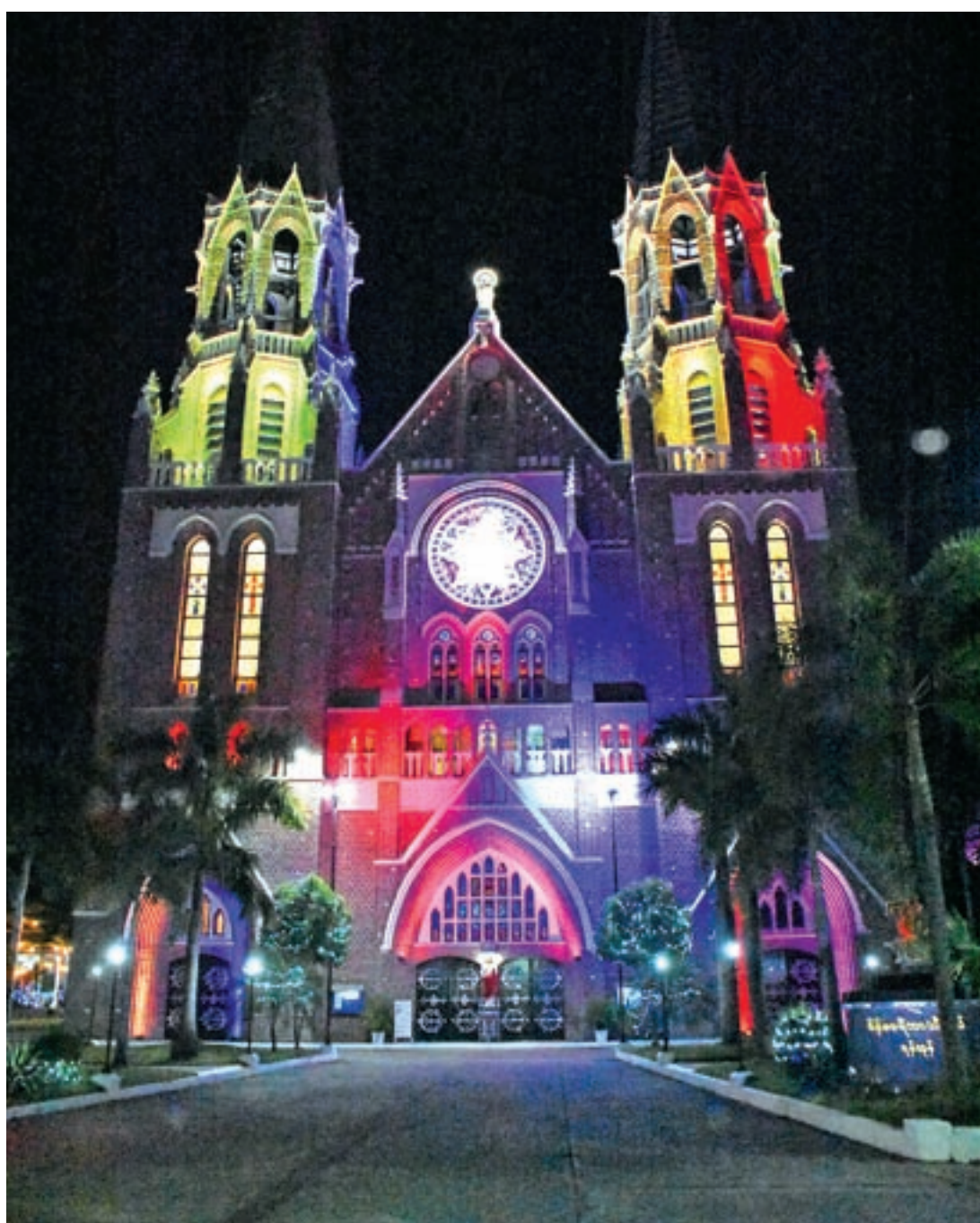
St. Mary's Cathedral, at the corner of Bogyoke Aung San Road and Bo Aung Kyaw Street in Botahtaung, the largest Catholic church in Yangon, is illuminated by holiday lighting on Christmas Eve, 24th December.