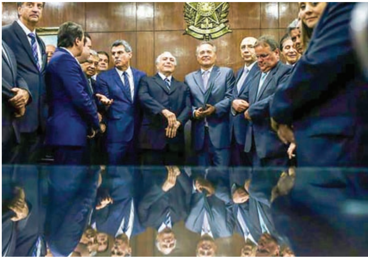
FILE PHOTO: Brazil's interim President Michel Temer (C) attends a meeting with Brazil's Senate President Renan Calheiros (centre, R) and Planning Minister Romero Juca (centre, L) in Brasilia, Brazil, on 23 May 2016.

BRASILIA — Corruption allegations implicating Brazilian President Michel Temer and his party are casting doubt on his ability to remain in office and causing the first cracks in his coalition amid growing calls for early elections.