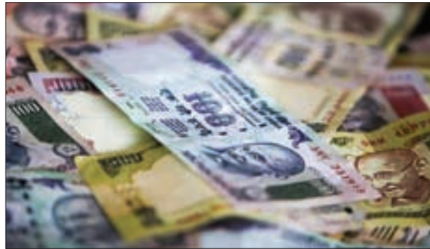
Rupee notes of different denominations are seen in this picture illustration taken in Mumbai.

done." India has been the world's fastest growing major economy over the past two years, but that rapid expansion has done little to broaden the government's revenue base. At nearly 21 per cent of gross domestic product (GDP), India's revenues are lower than the 27.1 per cent median for Baa-rated countries. India is rated at Baa3 by Moody's, the agency's lowest notch for debt considered investment grade.—Reuters