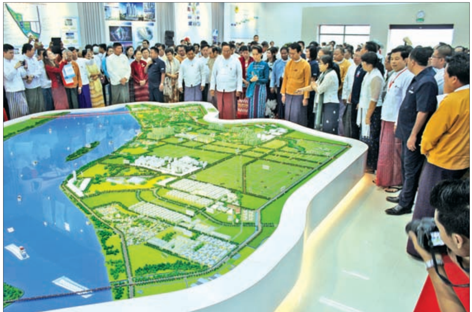
State Counsellor Daw Aung San Suu Kyi views the scale model of Yadana Hninsi Housing Complex.

She also requested the people to work together with the