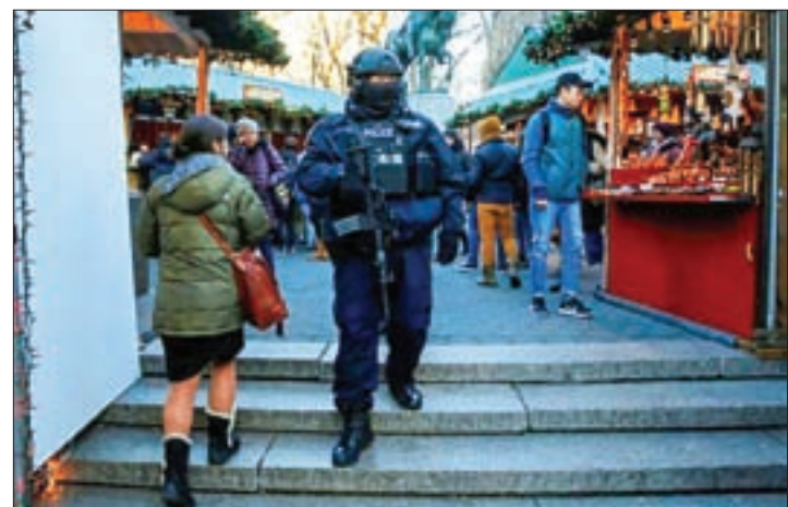
A member of the New York Police Department's Counterterrorism Bureau patrols the Union Square Holiday market following the Berlin Christmas market attacks in Manhattan, New York City, US, on 20 December 2016.

Islamic State sympathizers "continue aspirational calls for attacks on holiday gatherings, including targeting churches," CNN quoted the bulletin as saying. The notice describes different signs of suspicious activity for which police should be alert, it said. —Reuters