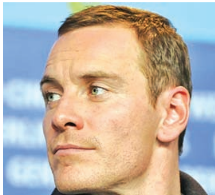
Michael Fassbender says he has been working continuously since past five years and now plans to take a break from films.

Nakai, Takuya Kimura, Goro Inagaki, Tsuyoshi Kusanagi and Shingo Katori — were written at the end of the letter. NHK’s public relations department commented that although NHK was disappointed by the decision, the broadcaster is grateful for SMAP having appeared on “Kohaku” 23 times in the past and added excitement to the show. SMAP X SMAP, which started in April 1996 and has been broadcast every Monday night by Fuji Television Network, has remained popular, often referred to as “Suma Suma.” American singer-songwriter Lady Gaga and Australian model Miranda Kerr were among the guests who appeared on the show earlier this year.— Kyodo News