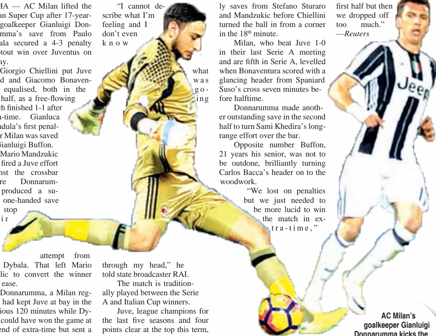
AC Milan's goalkeeper Gianluigi Donnarumma kicks the ball during Italian Super Cup Final, in Doha, Qatar on 23 December 2016.

first half but then we dropped off too much." —Reuters