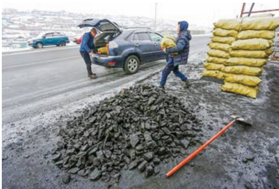
People load coal into a car in Ulaanbaatar, Mongolia as the wave of extreme cold hits the country December 22, 2016. Picture taken on 22 December 2016.

"Officially, conditions are very difficult in Mongolia. Mostly we talk about livestock because it's the main income of herder