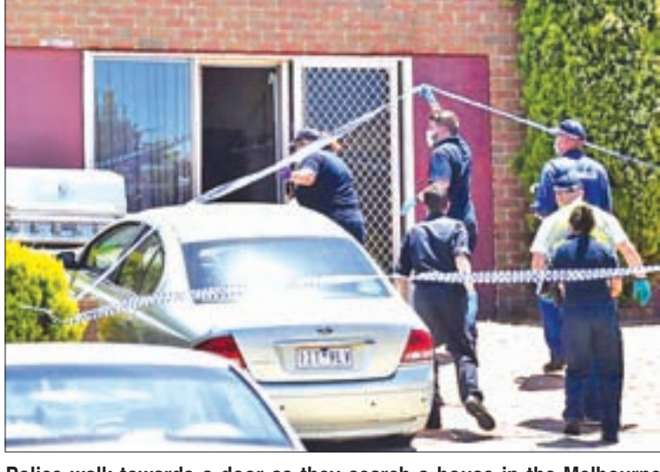
Police walk towards a door as they search a house in the Melbourne suburb of Meadow Heights, Australia, on 23 December 2016 during an operation regarding a plot to attack prominent sites in central Melbourne with a series of bombs on Christmas Day that authorities described as 'an imminent terrorist event' inspired by Islamic State.

The plot targeted high-profile locations in Melbourne, including Federation Square, Flinders Street Station and St Paul's Cathedral "possibly on Christmas Day", act-