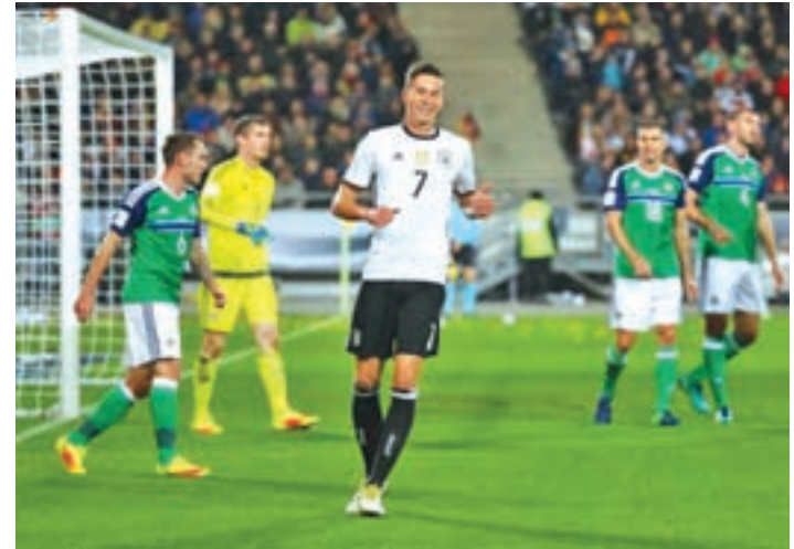
Germany's Julian Draxler celebrates scoring their first goal

Draxler's signing will help strengthen PSG for the second half of the season, after a tricky start to the defence of their Ligue 1 title. They are currently third, five points behind league leaders Nice.—Reuters