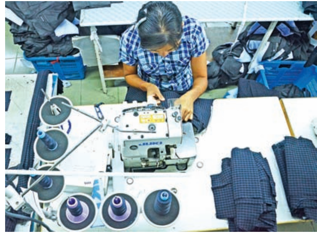
An employee works on a production line at a garment factory in Hlaingthaya, Yangon.

The types of new investment businesses includes construction of water treatment plant and supply of water in Monywa under B.O.T, hotel services by B.O.T, manufacturing of Coach Bus, City Bus and Body Building, production and marketing of all