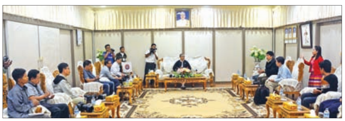
Chief Minister U Nyi Pu clarifies stability and development in Rakhine State to journalists.