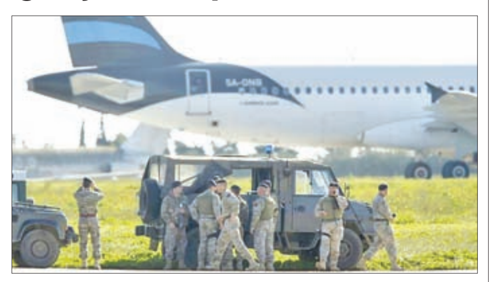
Maltese troops survey a hijacked Libyan Afriqiyah Airways Airbus A320 on the runway at Malta Airport, on 23 December 2016.

"The pilot reported to the control tower in Tripoli that they were being hi-