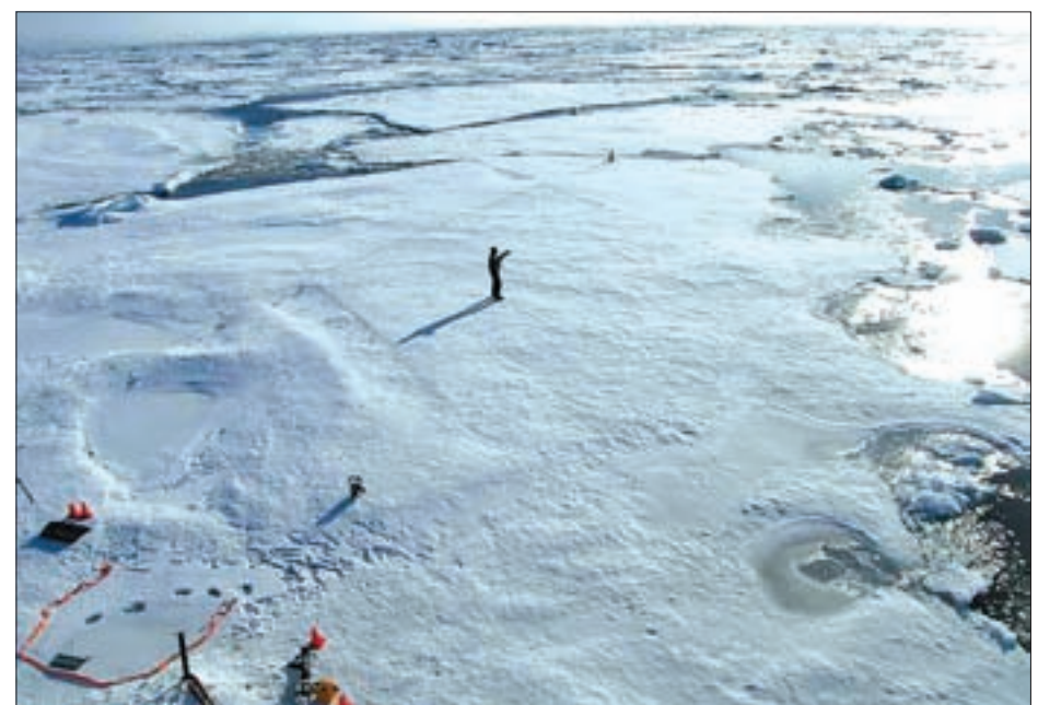
A member of a team of Cambridge scientists walks on some drift ice 500 miles (800 km) from the North Pole on 3 September 2011. Photo: Reuters

A UN panel of climate scientists says it is at least 95 per cent likely that manmade greenhouse gas emissions are the main cause of climate change, disrupting food and water supplies with more floods, heat waves and rising sea levels.— Reuters