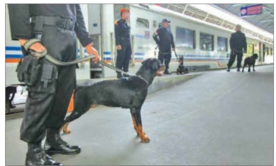
Indonesian police stand guard with their sniffer dogs providing security ahead of the Christmas and New Years holiday at Gubeng station, Surabaya, East Java, Indonesia, on 23 December 2016.

Mostly Buddhist Thailand plans to have more than 100,000 police on patrol until mid-January, police said, adding it was an increase from last year, without giving details.— Reuters