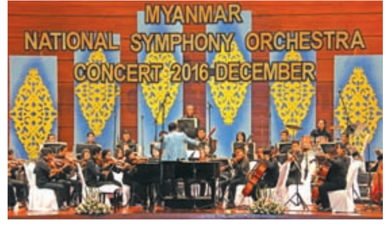
Myanmar National Symphony Orchestra Concert 2016, December, at the MICC-II in Nay Pyi Taw.

The Myanmar National Symphony Orchestra Concert 2016, December staged a performance at the National Theatre in Yangon on 17 December.— Myanmar News Agency