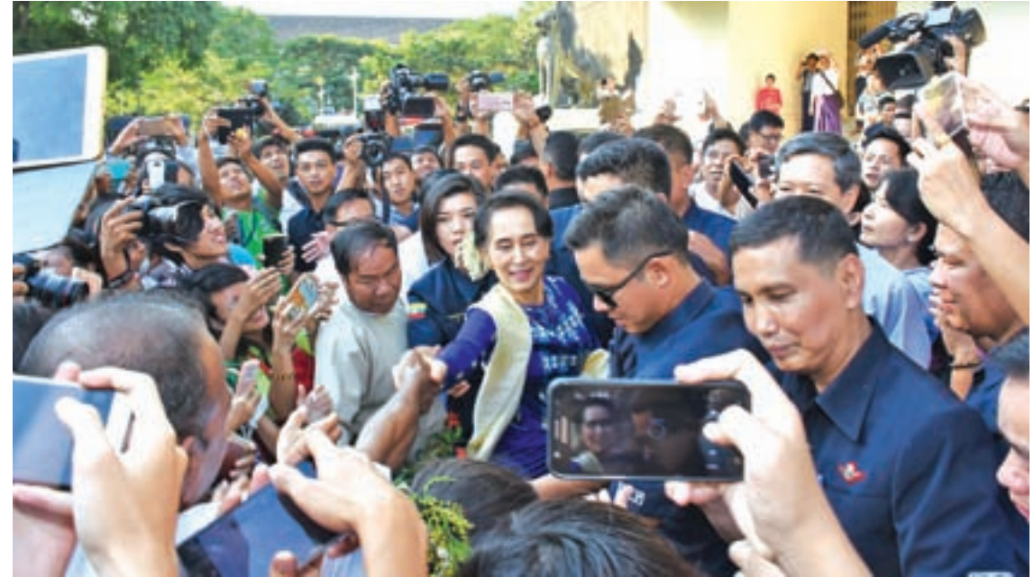
The State Counsellor is met by a throng of people in front of the Convocation Hall.

Afterwards, the State Counsellor made the closing speech.