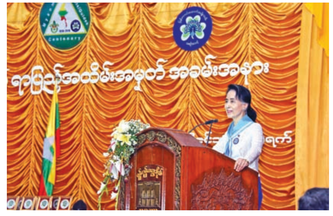
State Counsellor Daw Aung San Suu Kyi addresses the Myanmar Scout Centenary at the diamond jubilee hall of Yangon University.

sede collective contribution in a good cause. Therefore, I am very glad to see our Scout Youths assemble like this. Standardized attitudes and mindsets indoctrinated since young age can impress anyone's mind for ever. These will