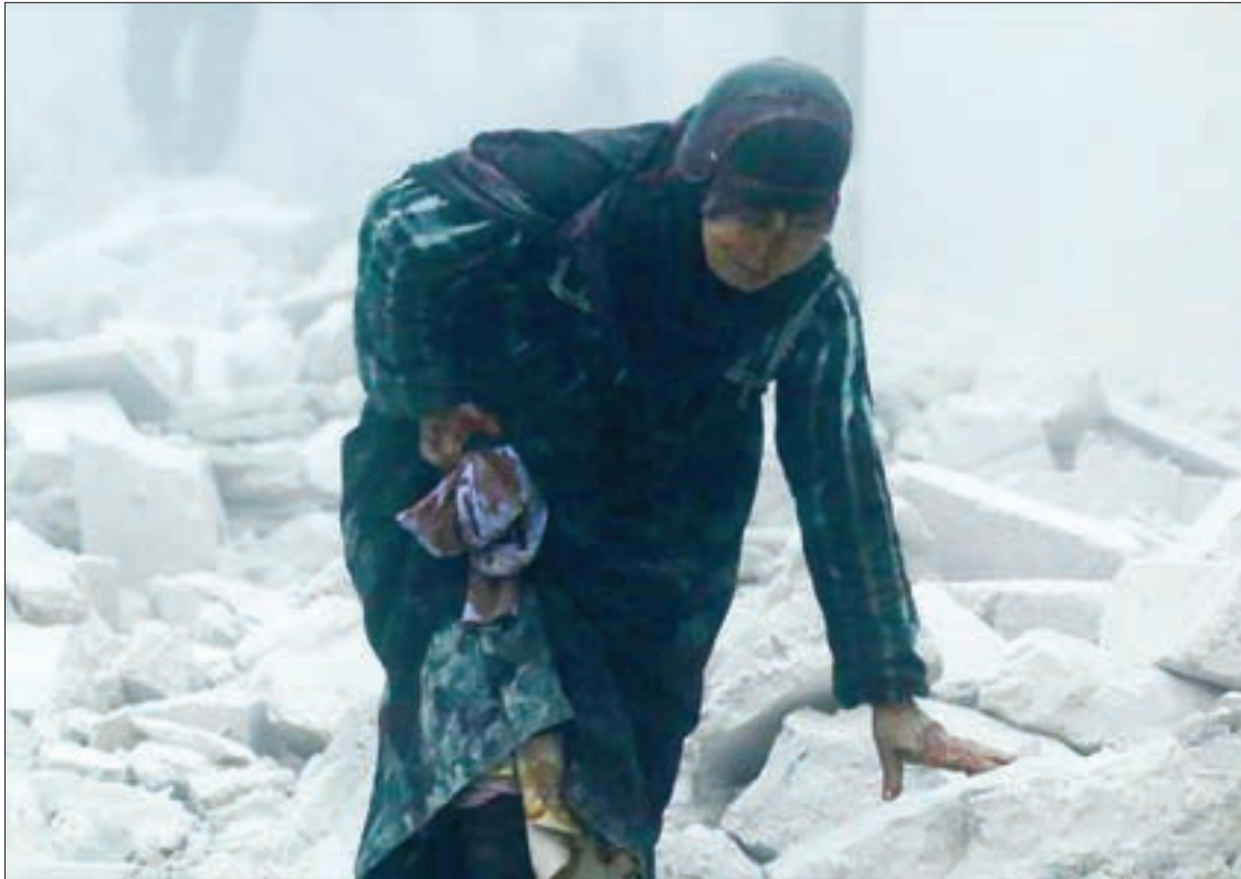
An injured woman walks at a site hit by an airstrike in the rebel-held al-Ansari neighbourhood of Aleppo, Syria, on 7 December 2016.

GENEVA — Nearly 150 civilians, most disabled or in need of urgent medical care, were evacuated overnight from a hospital in Aleppo's Old City, the first major evacuation from the eastern sector, the International Committee of the Red Cross said on Thursday.