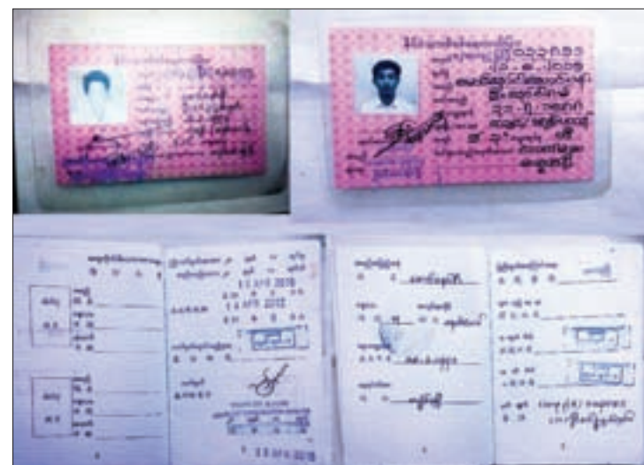
Border passes found during the area clearance operation in Mongko.

According to the news release of the Office of the Commander-in-Chief of Defence Services, the documents are evidence that the attackers were members of a KIA armed group from the region of Karmai and Tanai in Kachin State, holding border passes in order to trespass for armed attacks. —Myanmar News Agency