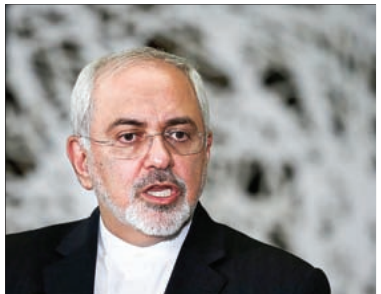
Iranian Foreign Minister Mohammad Javad Zarif attends a joint news conference with Japanese Foreign Minister Fumio Kishida in Tokyo, Japan, on 7 December 2016.

But Iran's nuclear energy chief, Ali Akbar Salehi, who played a central role in reaching the nuclear deal, described the extension as a "clear violation", if implemented.— Reuters