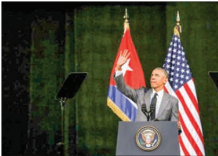
US President Barack Obama waves as he arrives to deliver a speech at the Gran Teatro in Havana, Cuba, on 22 March, 2016.