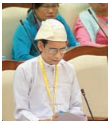
Union Minister for Agriculture and Irrigation Dr Aung Thu.

EXTENDING agricultural loans through a door-to-door system and public security were discussed at the Pyithu Hluttaw session yesterday.