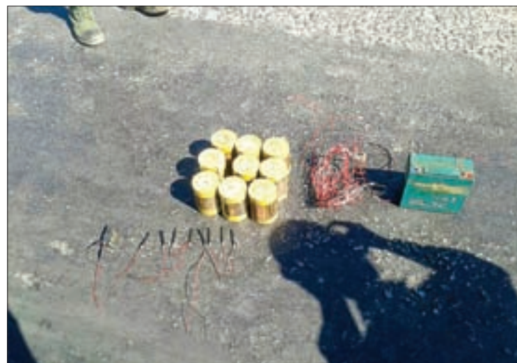
Improvised Explosive Devices seized by the government troops.

The IEDs were made of iron containers, 6-inch in height and 4-inch in diameter and they were found together with one 14.8 volt battery, nine detonators and one circuit-board for remote control. The security force defused all IEDs. — Myanmar News Agency