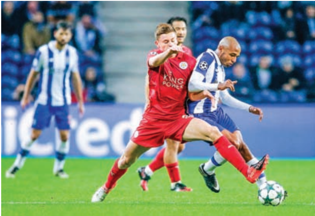
FC Porto's Yacine Brahimi in action with Leicester City's Harvey Barnes during UEFA Champions League Group Stage, Group G, at Dragao Stadium, Porto, Portugal, on 7 December 2016.