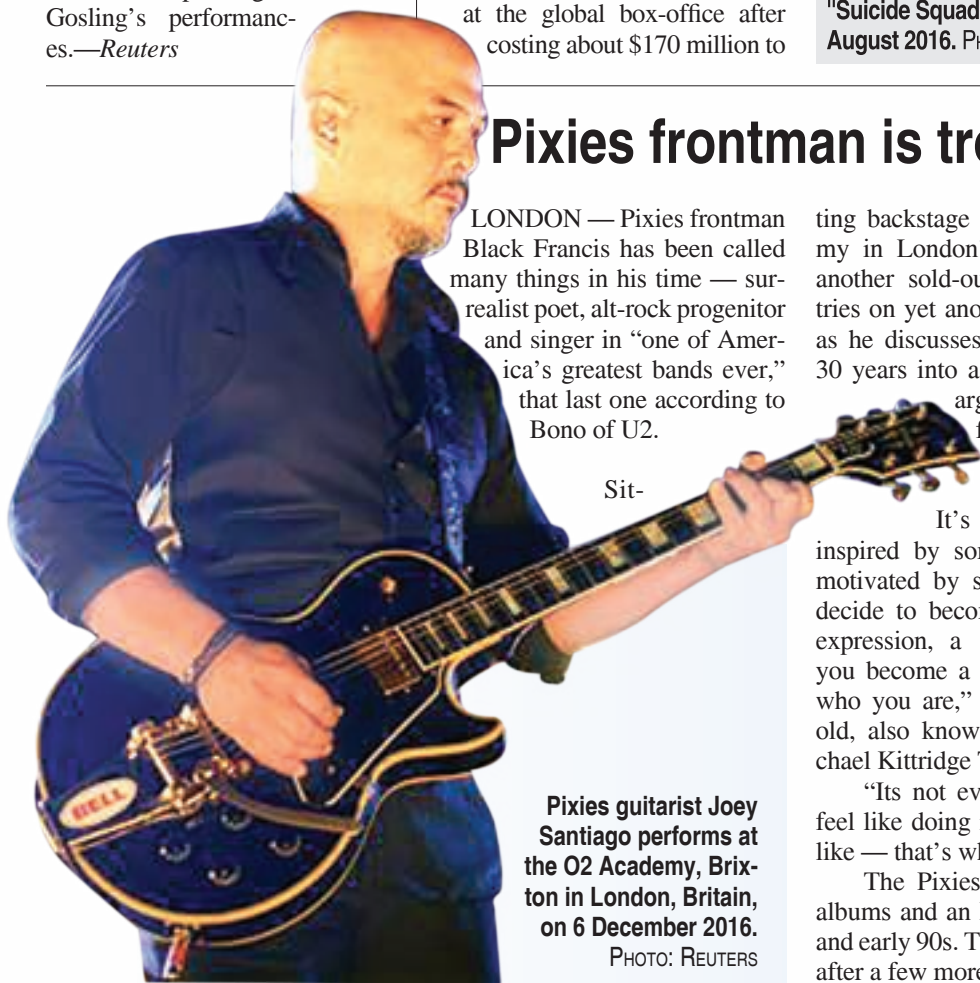
Pixies guitarist Joey Santiago performs at the O2 Academy, Brixton in London, Britain, on 6 December 2016.

"She completes the band because without her we're just like three dudes who just used to be in a band," says Thomson. "We're a band again. We're Pixies again."—Reuters