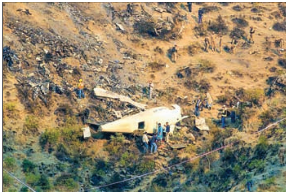
Rescue workers survey the site of a plane that crashed a day earlier near the village of Saddha Batolni, near Abbotabad, Pakistan, on 8 December 2016.

Remains are being brought by helicopter to Islamabad, where DNA tests will be used to identify them, authorities said.—Reuters