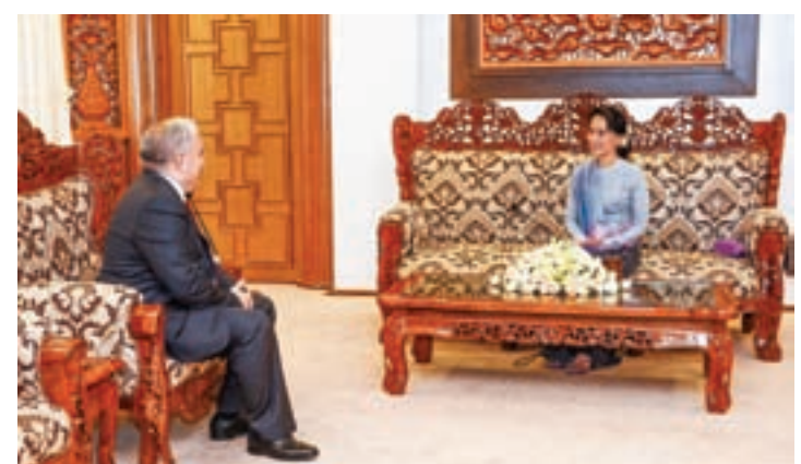
State Counsellor Daw Aung San Suu Kyi holds talks with Turkish Ambassador Mr Kerem Divanhoglu.

Also present on the occasion were Minister of State for Foreign Affairs U Kyaw Tin and officials.— Myanmar News Agency