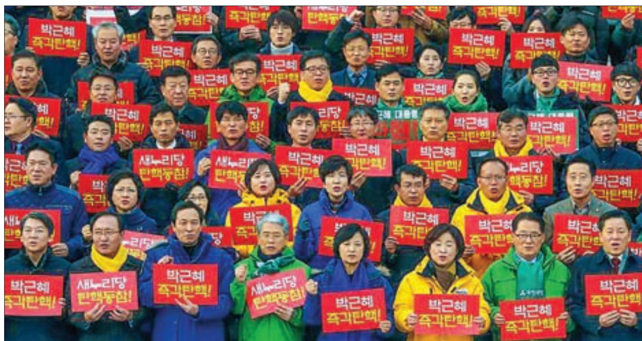
Lawmakers and members of opposition parties chant slogans during a rally demanding the impeachment of South Korean President Park Geun-hye at the National Assembly in Seoul, South Korea, on 7 December 2016. The signs read 'Impeach Park Geun-hye immediately!'.

Park, the daughter of a former military ruler, is under intense pressure to resign immediately, with big crowds taking to the streets of the capital, Seoul, every