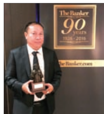
Bank Chairman U Aung Ko Win.

KBZ Bank was chosen as the winner for its important role in improvement of the economy of Myanmar, being the most reliable bank for the people in Myanmar, achievements in im-