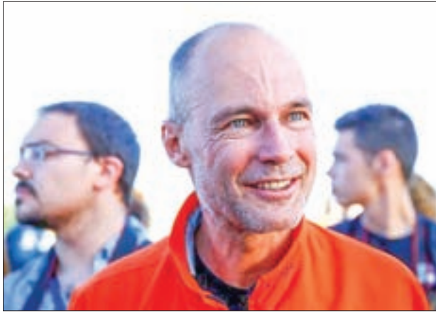
Swiss aviator of the solar-powered plane Solar Impulse 2 Bertrand Piccard, speaks after landing at San Pablo airport in Seville, southern Spain, on 23 June 2016.

GENEVA — The co-founder of a project that saw a solar-powered aircraft complete the first fuel-free flight around the world this year expects electric passenger planes to operate in just under 10 years.