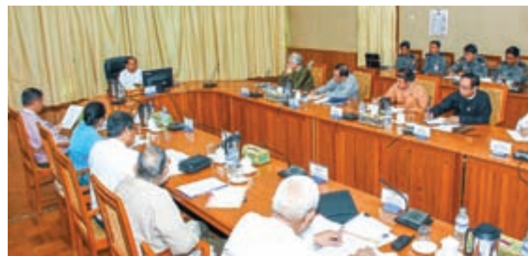
Vice President U Myint Swe addresses the first meeting of the Investigation Commission on Rakhine State.

Then commission members discussed based on their respective experiences.— Myanmar News Agency