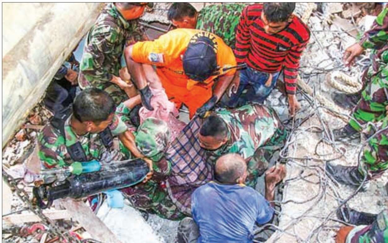
Indonesian rescue workers carry a survivor from a fallen building after an earthquake in Trienggadeng, Pidie Jaya, in the northern province of Aceh, Indonesia.

Television images showed some patients being treated in makeshift tents in car parks because hospitals were full. Indonesia's national disaster management agency put the death toll at