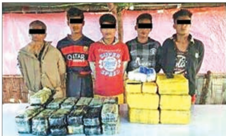
Five men with stimulant tablets pose for a photo in Maungtaw.

Security forces continued to take measures that will ensure that the suspects will be able to appear in court in accordance with the law.— Myanmar News Agency