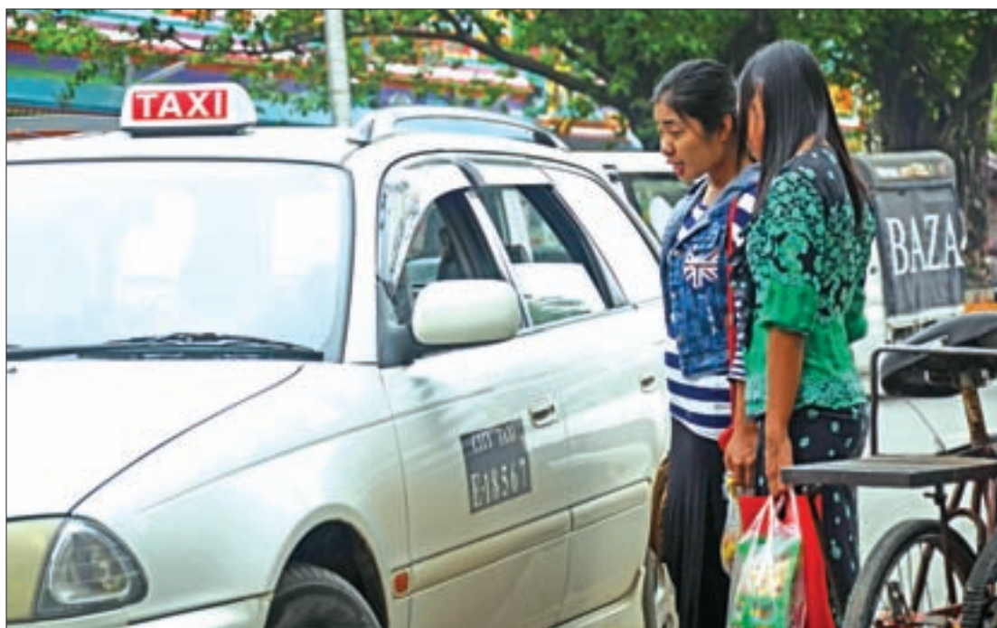
A city taxi is being hired by passengers in Yangon.

Modern Traffic Control Centers, CCTVs and traffic lights are being installed around the city of Yangon to help control the traffic problems.— Myitmakha News Agency