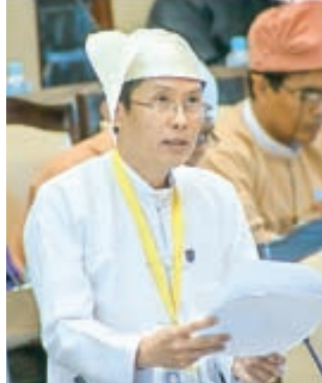
Deputy Minister for Electric Power and Energy Dr Tun Naing.

OVER 31,000 households in the towns of Minbya, Pauktaw, Kandaunggyi, Kyaukpuru and Tuttaung in Rakhine State will be supplied with electricity starting from early 2017, Deputy Minister for Electric Power and Energy Dr Tun Naing told the Amyotha Hluttaw session yesterday.