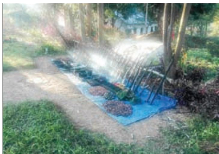
Arms and ammunition seized by the government forces are seen in Mongko.

AFTER reinforced troops had arrived in Mongko, security forces conducted area clearance operations around Mongko in eastern Shan State. On 7th December evening, the security forces seized eight M-22s, one cartridge, six revolvers and 200 rounds of bullets and one magazine of bullets from the Mongko Police Station.