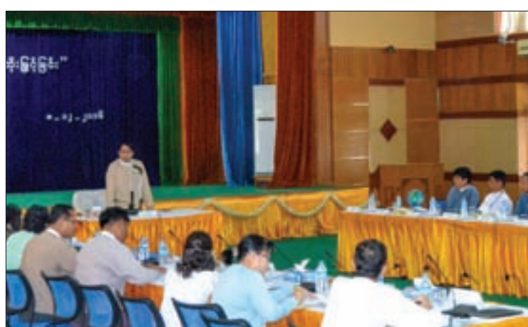
Union Minister Dr Pe Myint addressing Workshop on promotion of media freedom.

It is thus necessary to carry out infrastructural reform properly so that the transition can be smooth