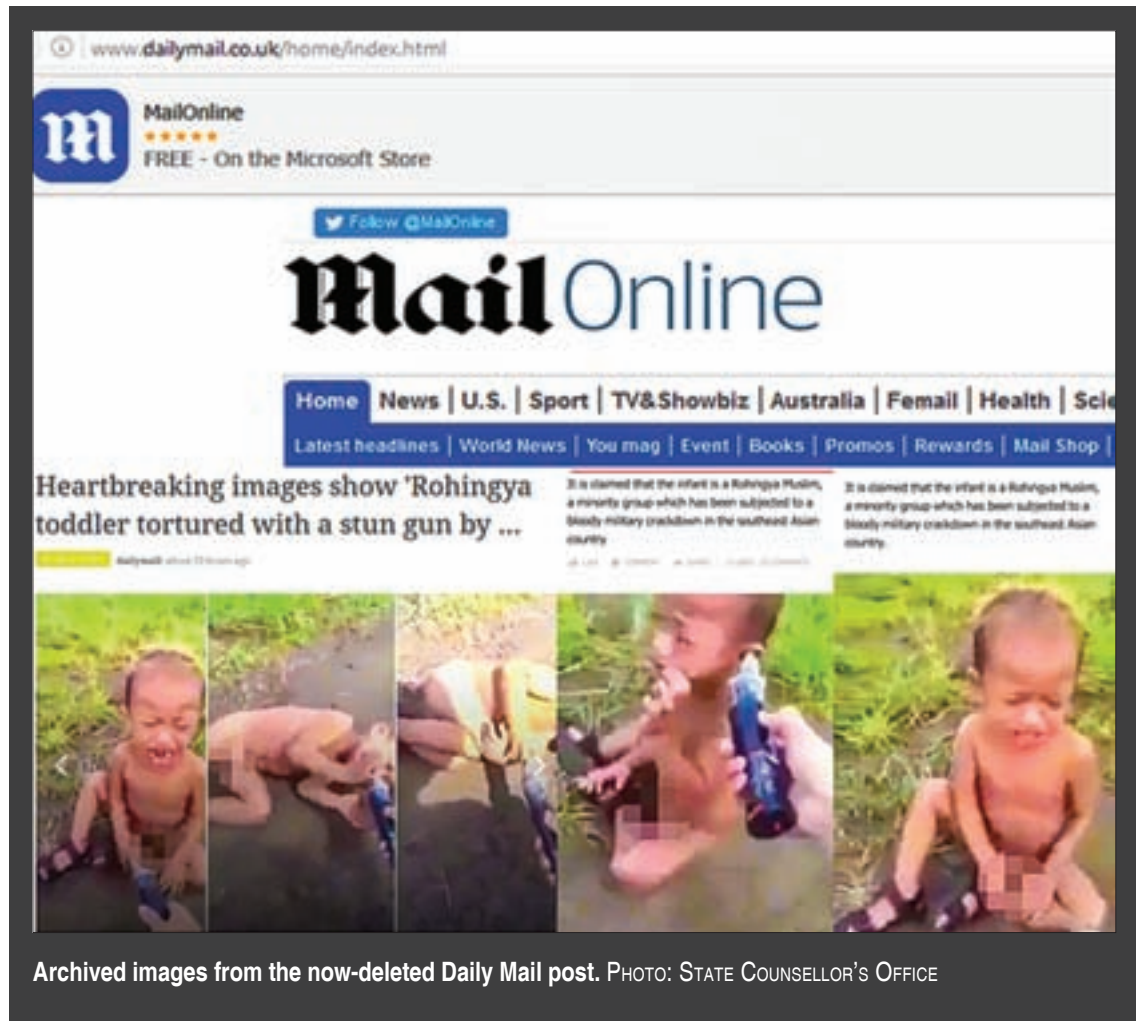
Archived images from the now-deleted Daily Mail post.

San Suu Kyi and presidential spokesperson U Zaw Htay have consistently stated that inaccurate, manufactured news that is being fed to international news organisations is being disseminated without appropriate vetting.