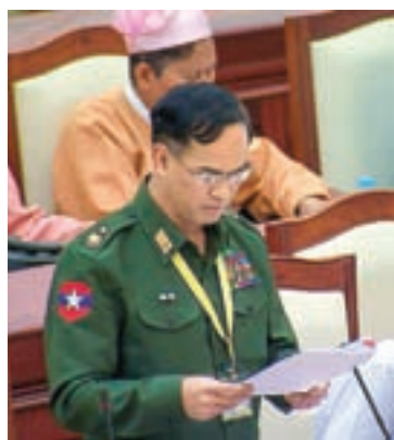
Deputy Minister for Home Affairs Maj-Gen Aung Soe.