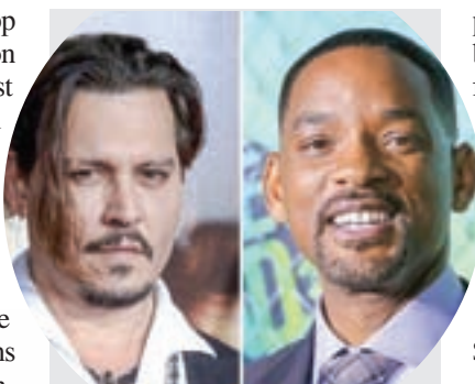
A combination photo showing actors Johnny Depp (L) posing during premiere of "The Danish Girl" in Los Angeles, California, on 21 November 2015 and Will Smith attending the premiere of the film "Suicide Squad" in New York, on 1 August 2016.

Depp led the list for the second straight year after his movie "Alice Through The Looking Glass" brought in just $300 million at the global box-office after costing about $170 million to