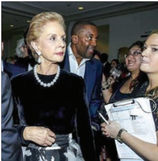
Fashion designer Carolina Herrera arrives for the National Portrait Gallery's presentation of the inaugural American Portrait Gala in Washington in 2015.

NEW YORK — Veteran designer Carolina Herrera spoke about the interconnectivity of fashion and art as she was honored by a New York arts organisation for her leadership and longevity in the fashion industry.