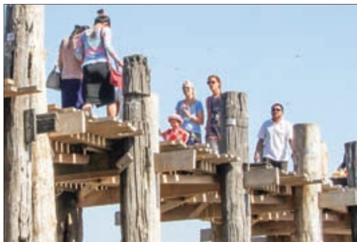
Tourists cross U Bein bridge over Taungthaman Lake in Mandalay, on 27 November, 2016.