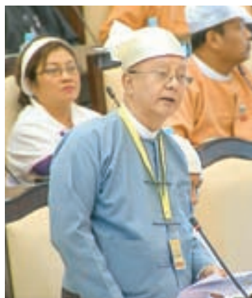
Judge of the Union Supreme Court U Soe Nyunt.