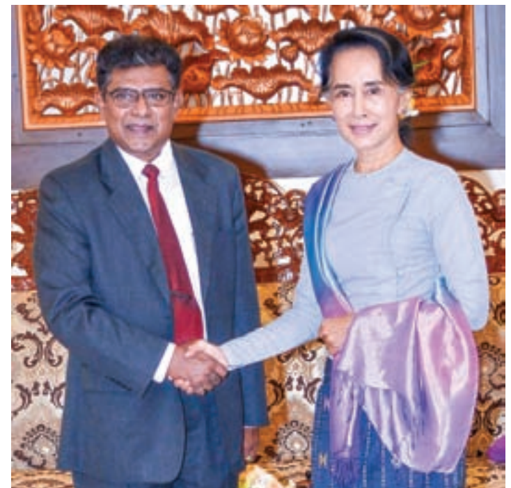
State Counsellor Daw Aung San Suu Kyi meets Mr Sumith Narkandala, Secretary-General of (BIMSTEC).

DAW Aung San Suu Kyi, State Counsellor and Union Minister for Foreign Affairs of the Republic of the Union of Myanmar, received Mr Sumith Narkandala, Secretary-General of Bay of Bengal Initiative for Multi-Sectoral Technical and Economic Cooperation (BIMSTEC) Permanent Secretariat based in Dhaka, Bangladesh, at 10 am on 8th December 2016 at