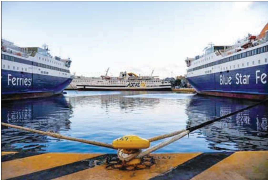
Anchored ships are seen during a 24-hour general strike against austerity, at the port of Piraeus, near Athens, Greece, on 8 December 2016.

Prime Minister Alexis Tsipras hopes a deal can be reached by the end of the year for the country's bonds to be included in the European Central Bank's bond buying programme by March 2017. This would help Greece return to markets next year, for the first time since 2014, and eventually reduce its dependence on bailout loans. Athens has rejected its creditors' demands for more austerity measures beyond 2018. —Reuters