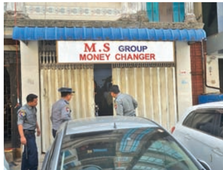
Local police arrive at money changer after the robbery.

The Police said that the gun used in the robbery was an airgun and an investigation has been launched into the robbery.