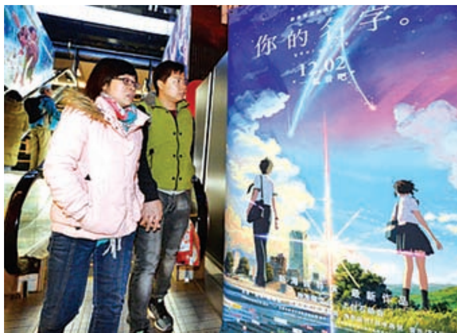
A billboard advertising “your name.”, a Japanese smash-hit animated film, is displayed at a movie theater in Beijing on 2 December 2016, the day when the film hit Chinese screens.

Jinping and other top Chinese officials have said the two Asian countries should expand positive aspects in the bilateral relationship, while acknowledging that more needs to be done to manage differences over territorial and wartime issues.