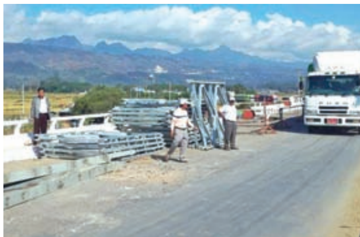
Preparations being seen to build the Bailey bridge.

About seven feet above the floor of the bridge there was damage from a mine planted by the Kachin Independence Army (KIA), the Ta'ang National Liberation Army (TNLA) and the Myanmar National Democratic Alliance Army (MNDAA) on the morning of 30 November morning. Government troops repaired the bridge for temporary use but only one vehicle could drive on it at a time.