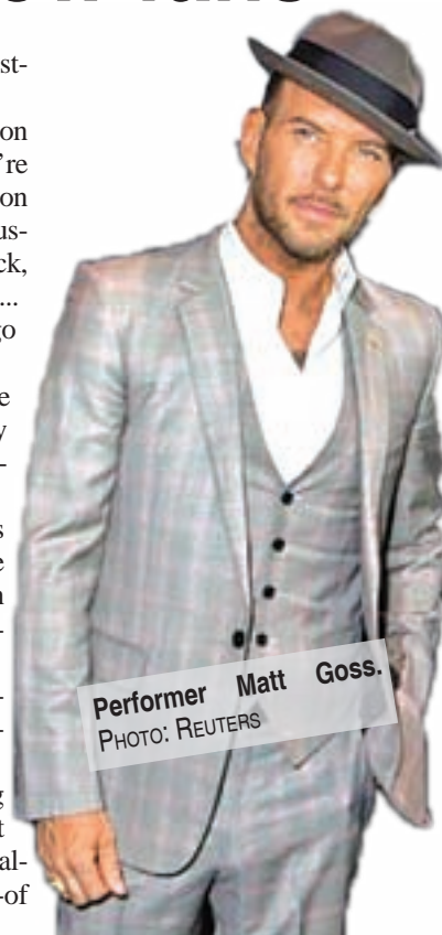
Performer Matt Goss.

“There’s definitely going to be some Christmas stuff - but it’s very smoky, easy, kind of almost like a New York jazz kind-of feel.”—Reuters