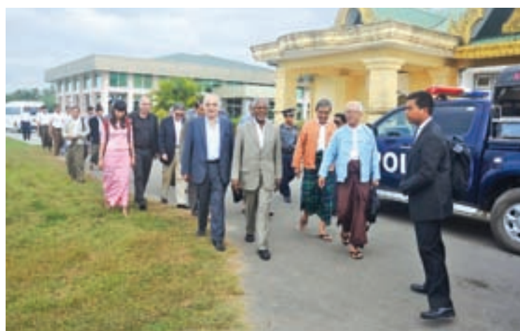
Former UNSG Kofi Annan and members of commission in Rakhine State.