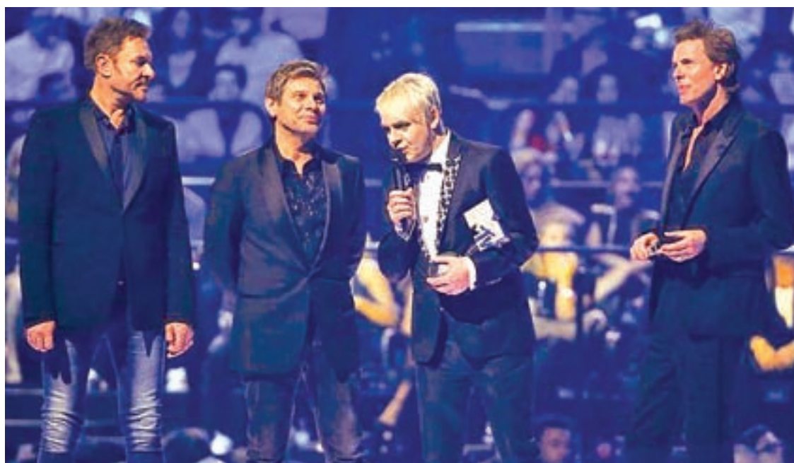
British band Duran Duran talk on the stage after receiving the “Video Visionary” award during the MTV EMA awards at the Assago forum in Milan, Italy, on 25 October 2015.

The band had served legal notices on Gloucester Place Music citing US copyright laws, which they argued gave them an “inalienable right” to call for the copy-