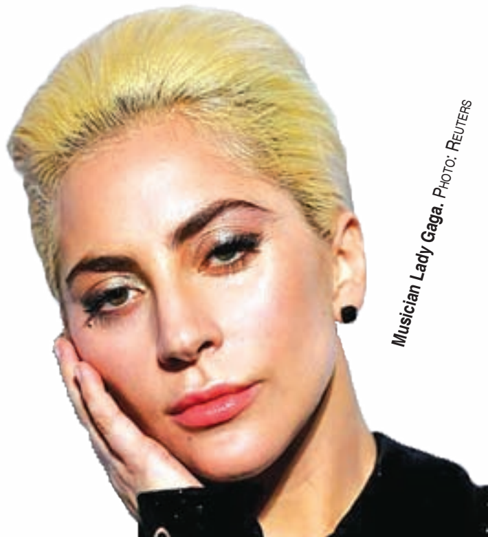
Musician Lady Gaga.