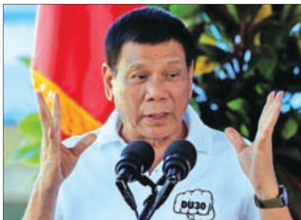
Philippine President Rodrigo Duterte gestures while delivering a speech during the inauguration of a drug abuse treatment and rehabilitation center inside the military headquarters in Fort Magsaysay, in the Nueva Ecija province, north of Manila, Philippines, on 29 November.

A statement issued by Trump’s transition team