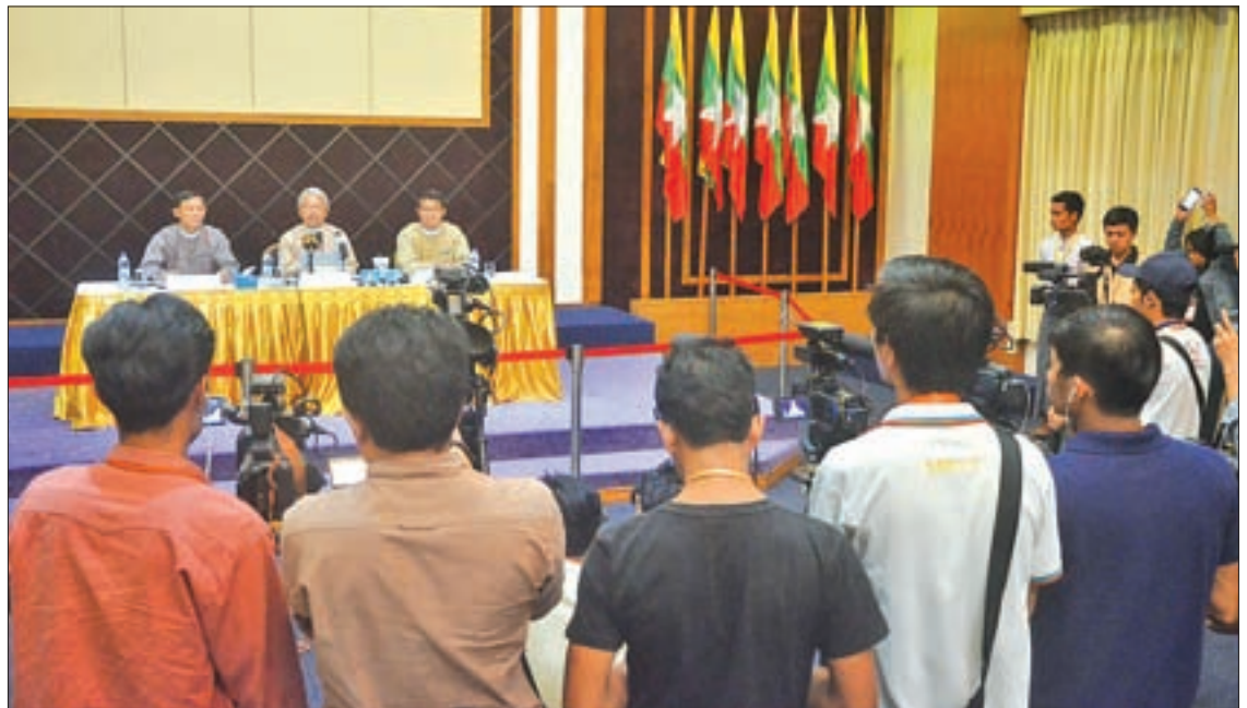
Officials of Peace Commission responding media questions at the press conference.

At the invitation of the Ministry of Foreign Affairs of China, a delegation of the Peace Commission visited China from 26 November to 2nd December and held a press conference on outcomes of negotiations among EAOs at the National Reconciliation and Peace Centre in Yangon yesterday.