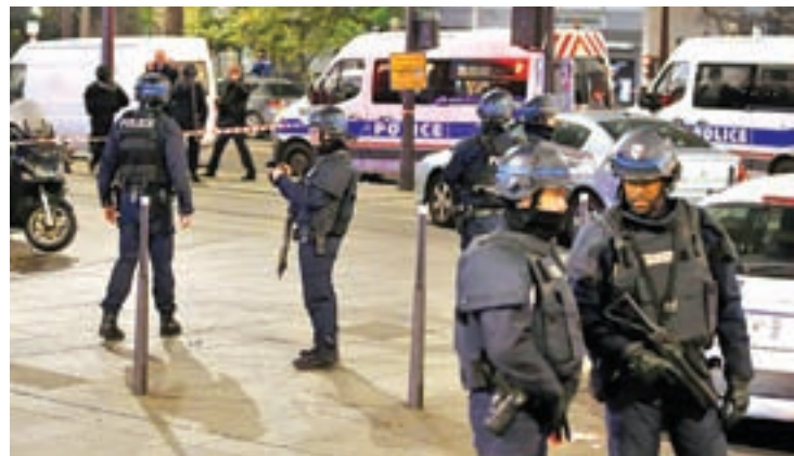
French police secure a street near the travel agency where a gunman has taken hostage about half a dozen people in what appears to be a robbery, a police source said, in Paris, France, on 2 December 2016.

PARIS — A gunman has taken hostage about half a dozen people at a travel agency in southern Paris in what appears to be a robbery, a police source said on Friday.