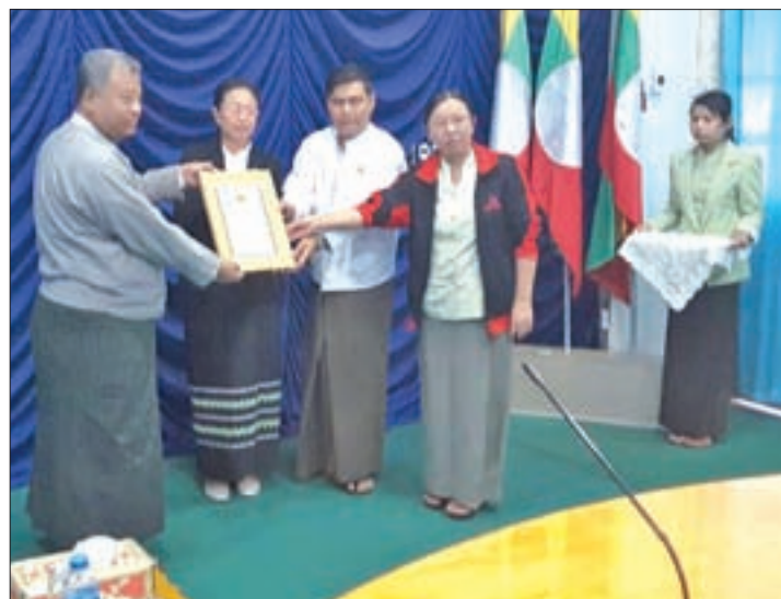
Donations of Kanbawza Brighter Future being handed over.

The foundation has donated cash for religious affairs, education, health and sports activities across the country and carried out relief work at places hit by natural disasters. The foundation imported 205,000 jumpers for IDPs.—Thura Lwin