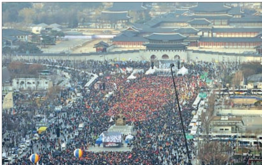
Protesters attend a rally against South Korean President Park Geun-hye in Seoul, South Korea, on 3 December 2016.

Some Saenuri members had earlier said they would join the opposition parties to impeach Park but changed their position after Park offered to quit, saying she should be given the chance to step down of her own accord by April.—Reuters