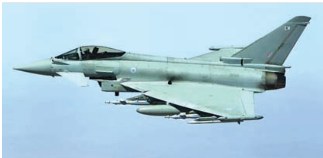
A British Royal Air Force Typhoon aircraft in flight during a mission over central Iraq, on 21 September 2016.

During the U.S. election campaign, Trump talked of building closer ties with Russian President Vladimir Putin. He questioned whether the United States should protect allies seen as spending too little on their defence, raising fears he could withdraw funding for NATO.— Reuters