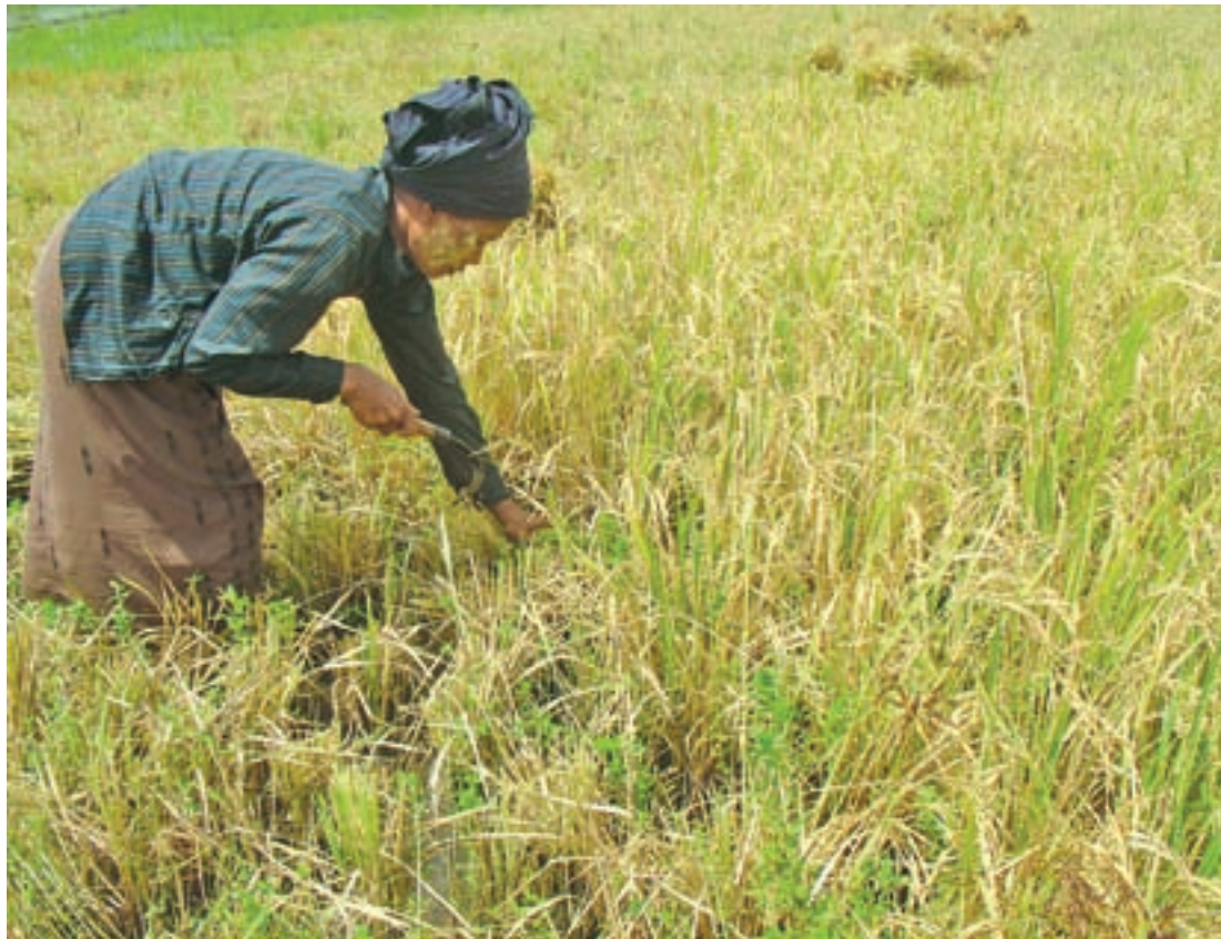
A female farmer harvests rice grown in irrigated field Monday, July 5, 2010, in a town near Nay Pyi Taw, Myanmar.

"For monsoon paddy, the growers received Ks100,000 for