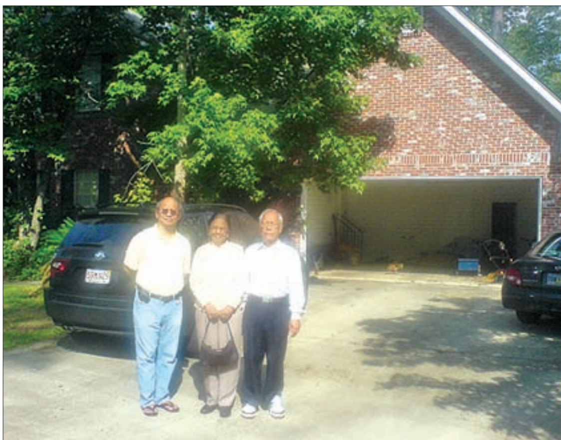
Phoeblaing and wife at KMM's home in Hattiesburg, USA (June 2010).

[To access the academic standings of KMM and KSM, I suggest the interested person to use internet; type in 'Khin Maung