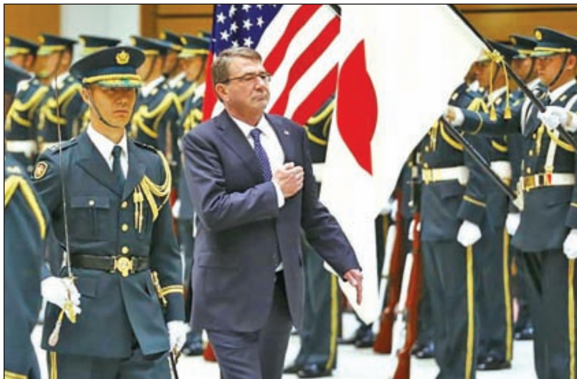
US Secretary of Defense Ash Carter (2nd L) inspects the honour guard before a meeting with Japan's Defence Minister Gen Nakatani (not pictured) at the defense ministry in Tokyo, on 8 April 2015.

shoulder a greater share of defence costs, but this would be a matter for negotiation, the source said.