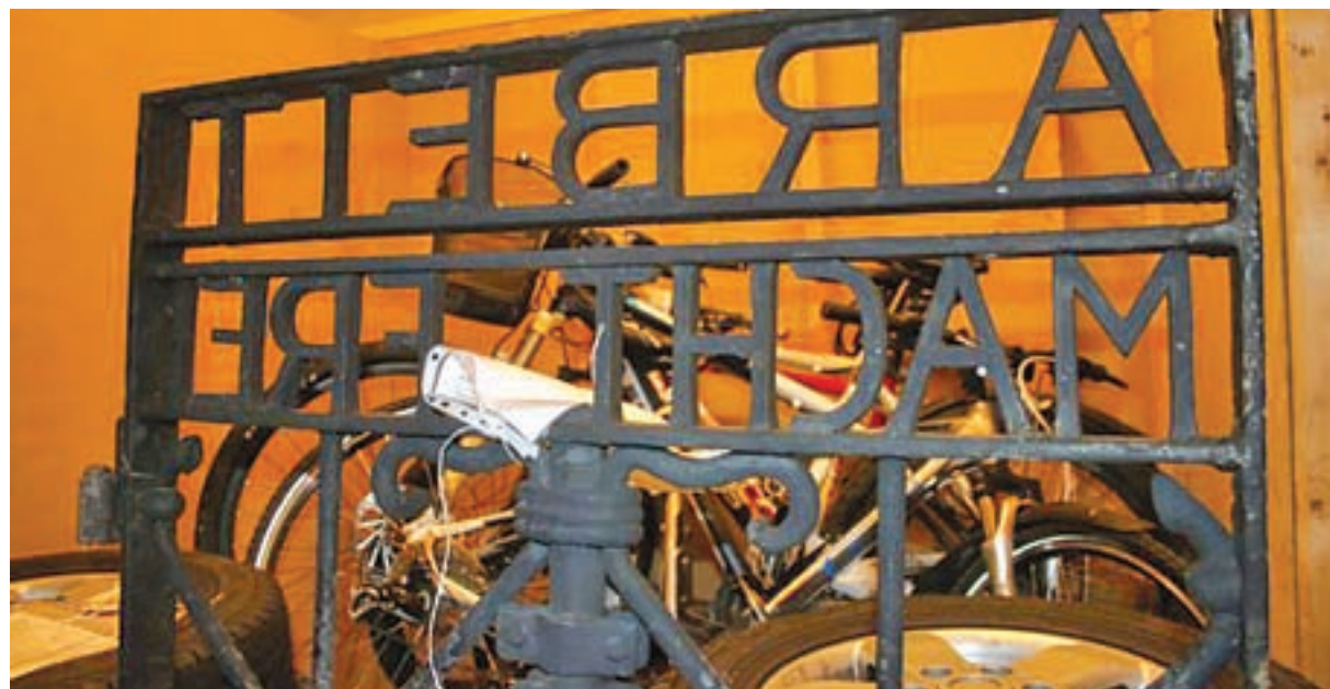
A handout picture made available to Reuters on 2 December 2016 shows the iron gate from the Dachau concentration camp in Germany bearing the notorious ‘Arbeit macht frei’ (work sets you free) slogan, which has been recovered in west Norway two years after it was stolen, police said.

In December 2009, a similar “Arbeit macht frei” sign was stolen from the entry gate of the former Nazi death camp of Auschwitz in Poland by a Swedish man with far-right ties.—Reuters