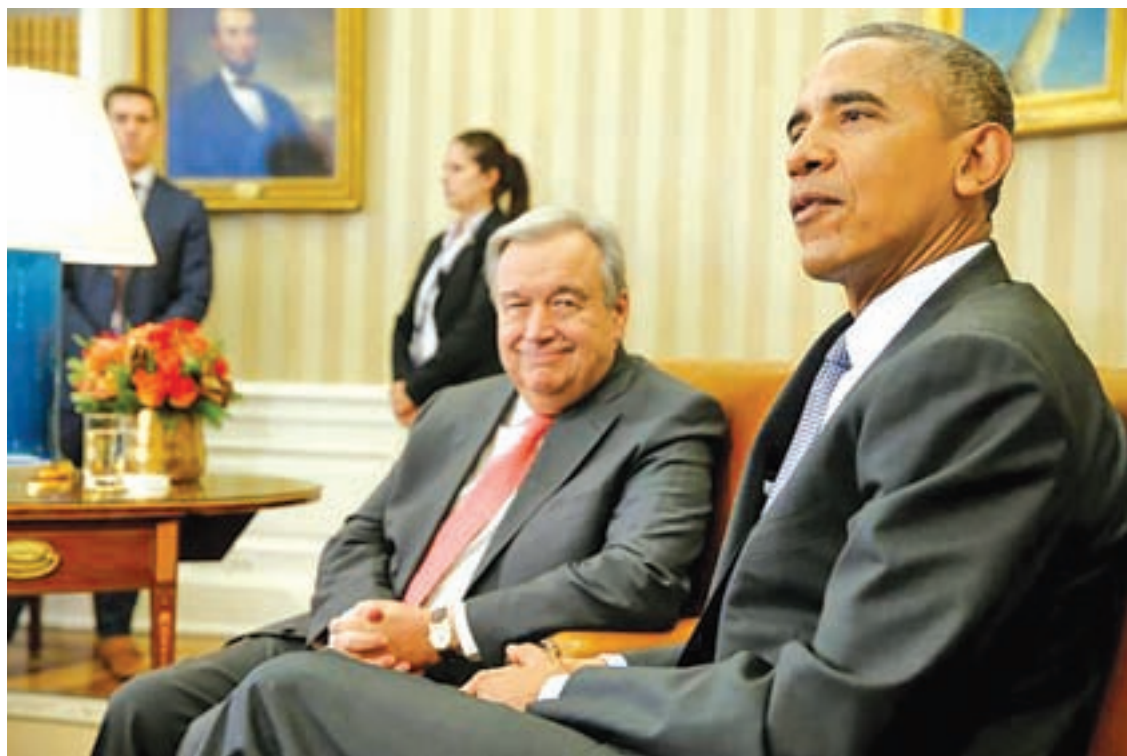
US President Barack Obama delivers remarks to reporters as he welcomes UN Secretary General-designate Antonio Guterres (C), of Portugal, in the Oval Office at the White House in Washington, US, 2 December, 2016.

Trump, who takes office 20 January, has named South Carolina Governor Nikki Haley, who has relatively little foreign policy