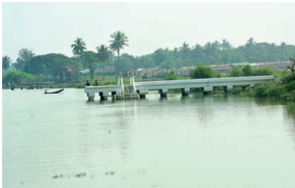
The newly built wharf in Kanyinchaung trade zone.

"Out of 9 border gates in the country, the Maungtaw border trade zone stood high on the totem pole of export, with 90 per cent export and 10 import import. Yet, as regards the trade amount, Maungtaw's border trade lagged behind Muse and Myawady. Export catches foreign currency from other countries with imports giving