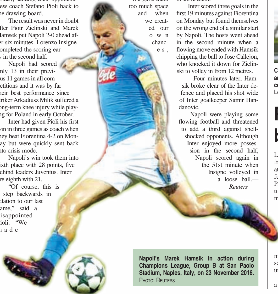
Napoli's Marek Hamsik in action during Champions League, Group B at San Paolo Stadium, Naples, Italy, on 23 November 2016.