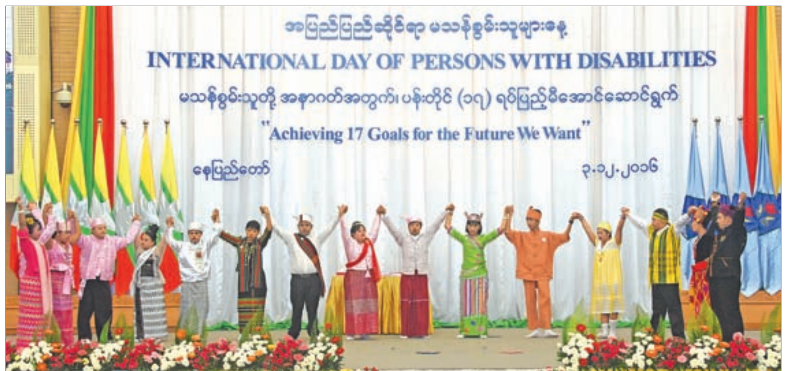
Children from schools for the disabled entertaining guests with performance of national dances on International Day of the Persons with Disabilities.

The minister for the State Counsellor's Office read out the message of the State Counsellor Daw Aung San Suu Kyi to the event before Resident Representative Mr Rory Mungoven read