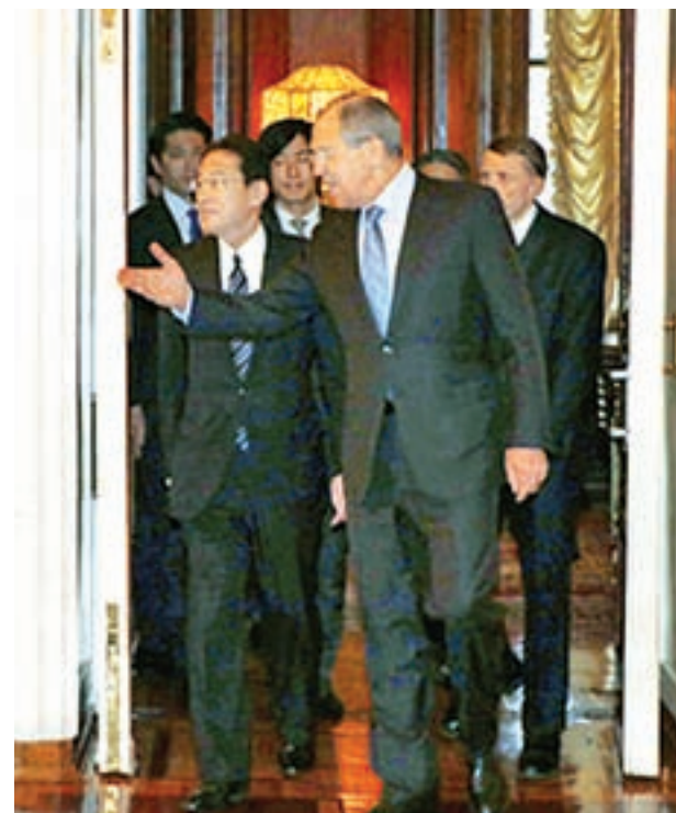
Japanese Foreign Minister Fumio Kishida (L, front) and his Russian counterpart Sergei Lavrov (R) meet in Moscow, on 3 December 2016, for the final bilateral political dialogue before a summit between Prime Minister Shinzo Abe and Russian President Vladimir Putin.

Japan lodged a protest last week in response to Russia's deployment of antiship missile systems on two of the disputed islands.— Kyodo News