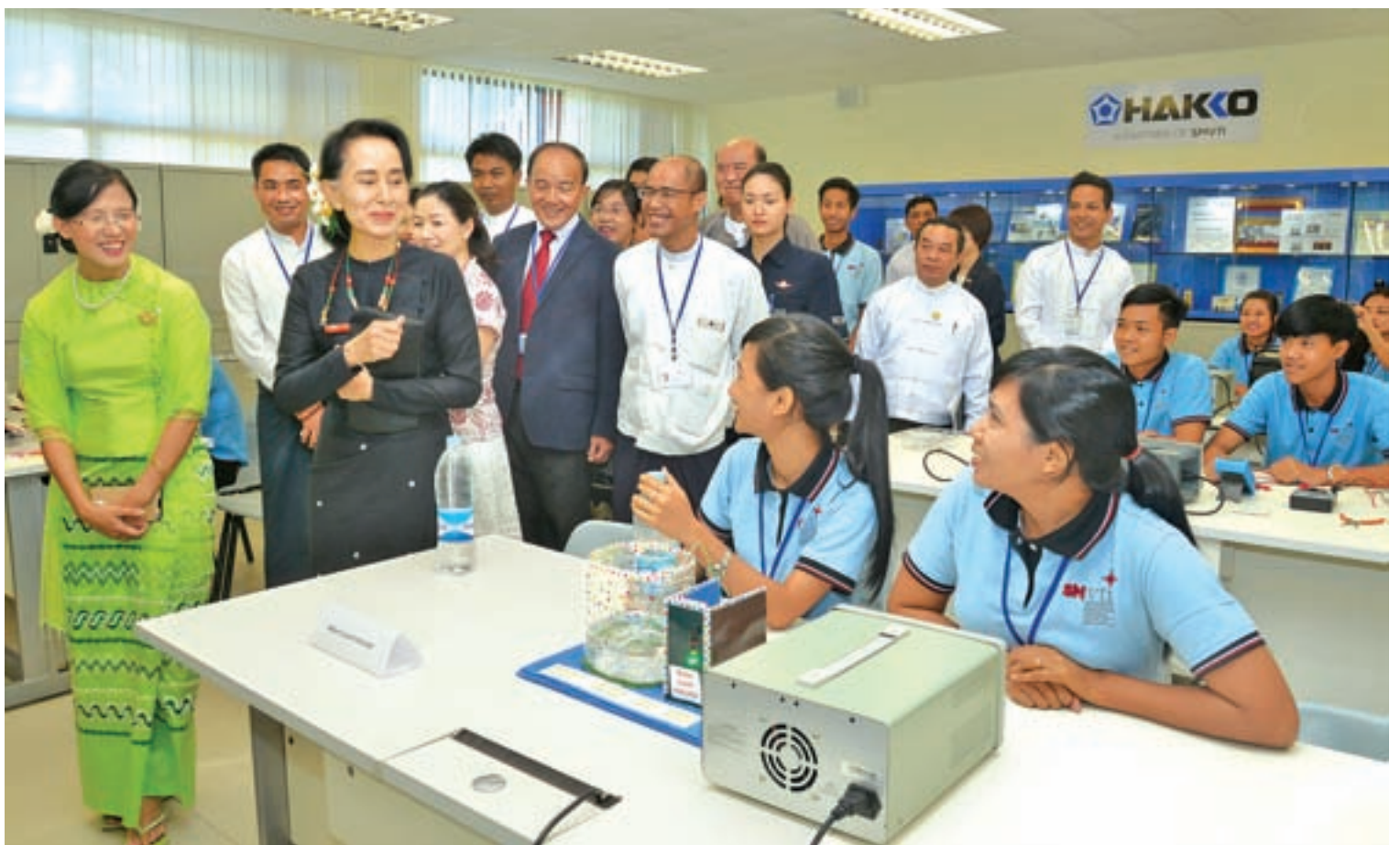
State Counsellor interacting with the students at SMVTI, Yangon.

The State Counsellor went on to say, "Today men as well as women need to work. Girls must stand on their own feet, that is, needn't depend on others for their living. As for students learning at