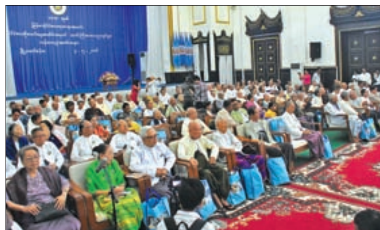
Doyen laterati at the homage-paying ceremony on Sarsodaw Day.

The International Day of Persons with Disabilities – 2016 was organized with the theme of achieving 17 goals for the future we want. —Maw Si (Myanmar News Agency)