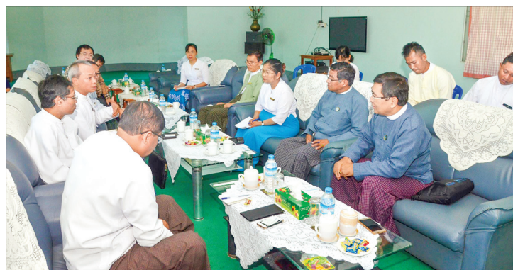
Union Minister Dr Win Myat Aye meets with officials of the Republic of the Union of Myanmar Garment Manufacturers' Association.

Later, the union minister met with entrepreneurs and discussed matters relating to supplying electricity, setting up of garment factories in every township in Rakhine State. The discussions took place with officials from the Republic of the Union of Myanmar Garment Manufacturers' Association in the day-care centre for the elderly at Gaba Aye Pagoda Road in Yangon.— Myanmar News Agency