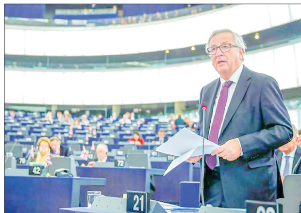
European Commission President Jean-Claude Juncker addresses the European Parliament during a debate on the last European Summit, in Strasbourg, France, on 26 October 2016.

"According to legal texts, I am in charge until the first of November 2019," Juncker said.—Reuters