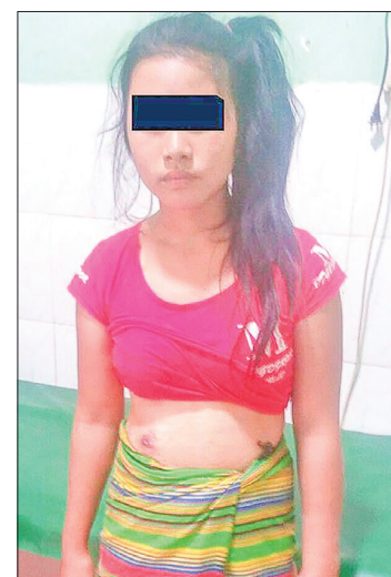
Ma Nam Phone. MNA

group No. 6 regiment comprising about 90 troops reportedly extorted yesterday morning. the people aboard motor vehicles traveling along Moegaung-Phakant Street near Namhai cemetery, charging Ks17,000 per lorry and Ks10,000 for each light truck that passed between the villages of Namhai and Seton in Moegaung township.