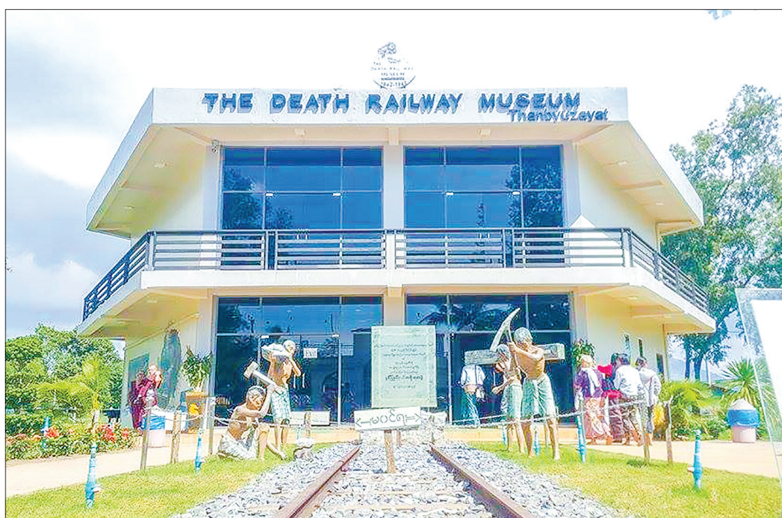
The front view of the death railway museum.

It is said that visitors to the museum also go to the war cemetery as well as the Kyaukme-Setse Beach.— Soe Win MLA