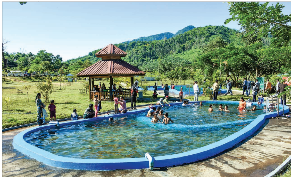
People are seen relaxing at the hot springs resort camp.

A RESORT camp that features saunas and hot springs as treatment for joint pain, skin diseases and female ailments was officially re-inaugurated in Nay Pyi Taw on Saturday.