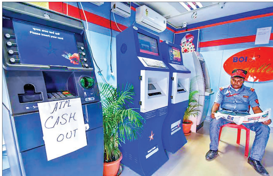
A security guard reads a newspaper inside an ATM counter as a notice is displayed on an ATM in Guwahati, India, on 27 November 2016.

been started and farmers badly need money. But I couldn't lend (to) them due to restrictions on withdrawal," Patil said.