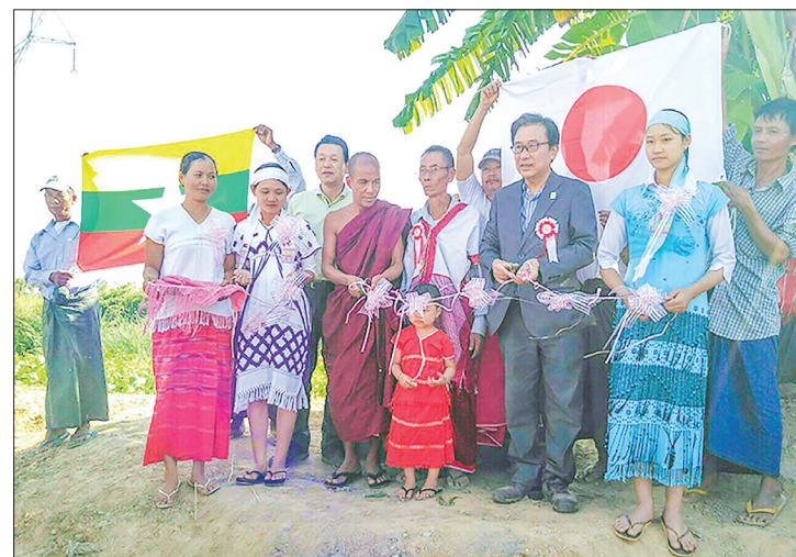
The War monument is being formally opened.

THREE cherry trees were planted at a village in Nyaunglebin at a ceremony on 25th November in dedication to the Japanese soldiers killed during 1945 battles.