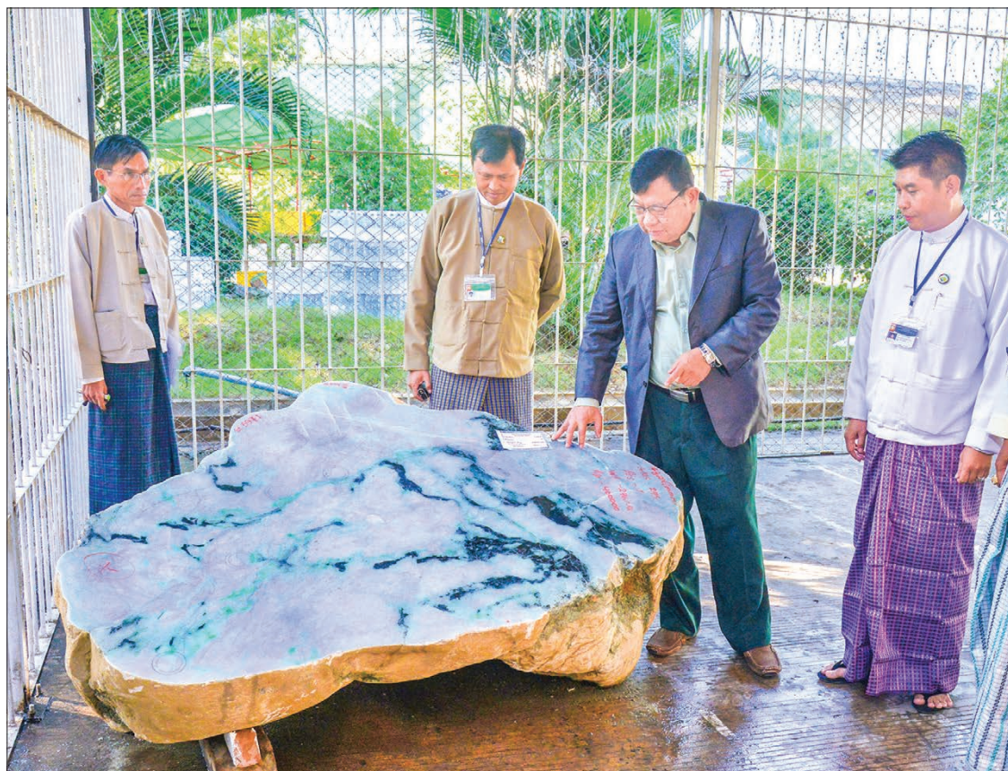
U H La Aung, Minister for Natural Resources and Environment of the Kachin State Government observes a jade stone.