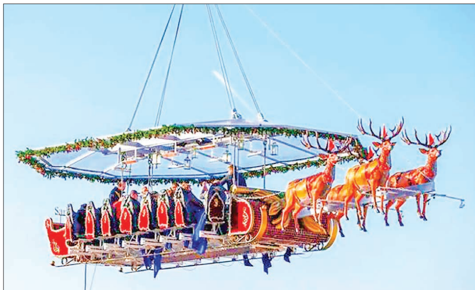
Guests enjoy dinner at the table 'Santa in the sky', lifted by a crane and decorated to match the appearance of a 'Santa Sleigh' as part as the Christmas festivities, in Brussels, Belgium, on 25 November 2016.

Diners, who sit strapped to chairs to eat at a