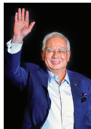
Malaysia's Prime Minister Najib Razak attends a Malaysia Digital Economy Corporation event in Kuala Lumpur, Malaysia, on 9 November 2016.