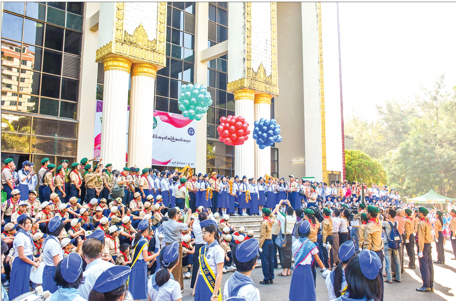
Boy Scouts, Girl Guides and students attend the ceremony in Yangon marking the centennial of scouting in Myanmar.