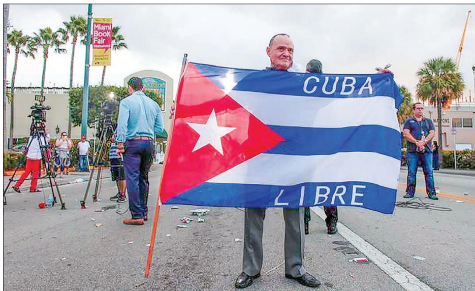
A man holds a Cuban flag after the announcement of the death of Cuban revolutionary leader Fidel Castro, in the Little Havana district of Miami, Florida, US on 26 November 2016.

But the crowd included many people too young to remember Castro in his heyday in the 1960s and 1970s, and many of them sounded more pragmatic than ideological when speaking about his death at the age of 90.