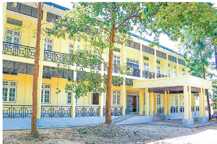
One of the new buildings in Thanlyin General Hospital compound.

THE construction of newly extended hospital facilities of Thanlyin General Hospital was recently completed, with plans to start operating early next month,