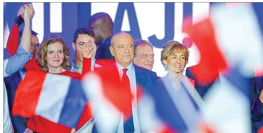
French politician Alain Juppe (C), current mayor of Bordeaux and member of the conservative Les Republicains political party, stands between his wife Isabelle (R) and former candidate Nathalie Kosciusko-Morizet (L) at a campaign rally in the second round for the French center-right presidential primary election in Vandoeuvre-les-Nancy, France, on 25 November 2016.

With France still under a state of emergency since Islamist militants killed 130 people in gun and bomb attacks in Paris in November 2015, and with soldiers on patrol in the capital's streets, security will be tight near polling points.—Reuters