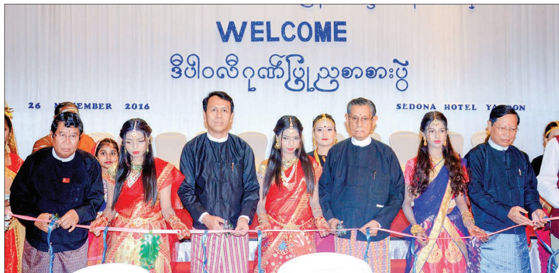
Myanmar India International Business Association (M.I.I.B.A) and Myanmar Indians Association (M.I.A) hosted Dipavali dinner on 26th evening at Sedona Hotel, Yangon.

MYANMAR India International Business Association (M.I.I.B.A) and Myanmar Indians Association (M.I.A) hosted Dipavali dinner on 26th evening at Sedona Hotel, Yangon.