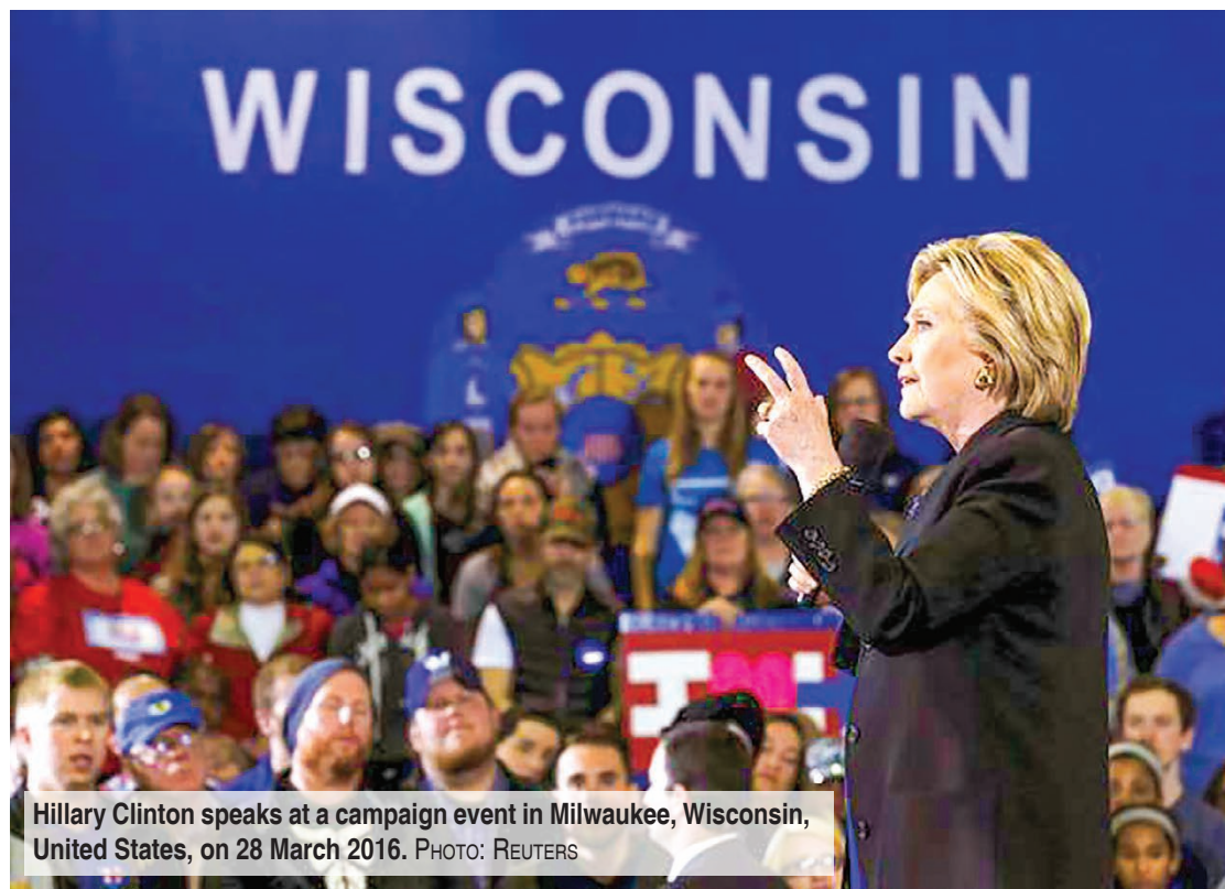
Hillary Clinton speaks at a campaign event in Milwaukee, Wisconsin, United States, on 28 March 2016.