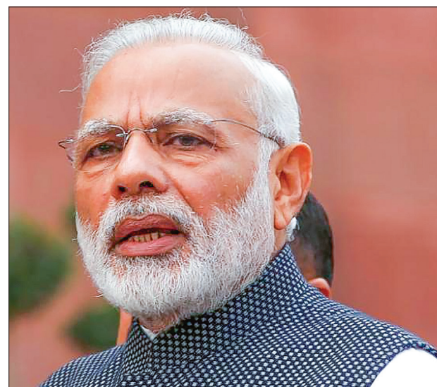
India's Prime Minister Narendra Modi speaks to the media inside the parliament premises on the first day of the winter session in New Delhi, India, on 16 November 2016.