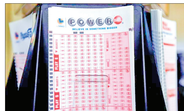
Lottery stubs are pictured at an ampm convenience store in Pasadena, California US, on 21 November 2016. PHOTO: REUTERS

For every $1 worth of Powerball sales, half goes to prizes, 40 per cent to state governments for causes such as education, and 10 per cent to retailers who sell the tickets and other administrative costs.—Reuters