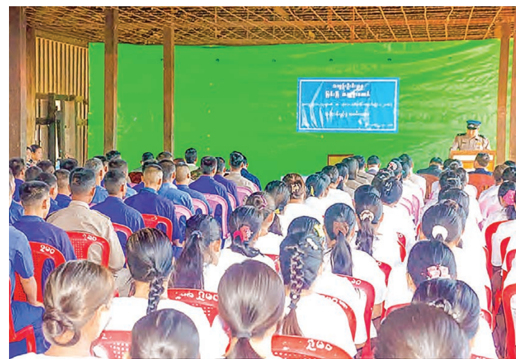
Trainee inmates at the opening ceremony of basic literacy training.

A BASIC literacy training course has recently been launched for prisoners of Myingyan Correctional Facility in Mandalay Region to improve their reading and writing skills during their incarceration.