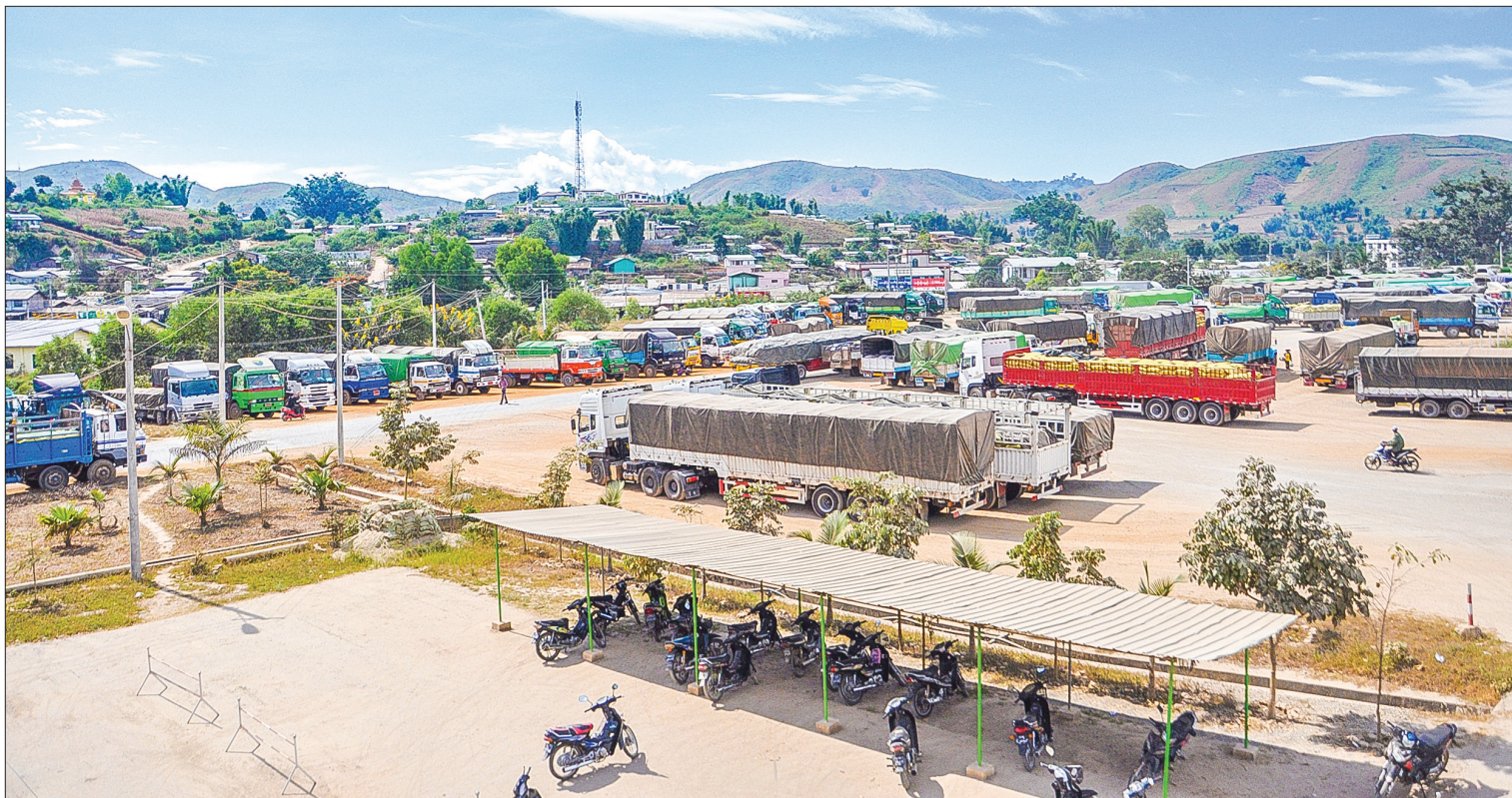
The border trade camp located at 205 Mile, Muse.

in the same period of last year was $3.326 billion, including $2.3 billion from the export sector and $1.005 billion from the import sector.