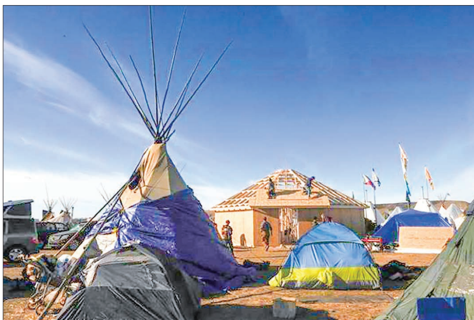
The Oceti Sakowin camp is seen during a protest against plans to pass the Dakota Access pipeline near the Standing Rock Indian Reservation, near Cannon Ball, North Dakota, US, on 26 November 2016.