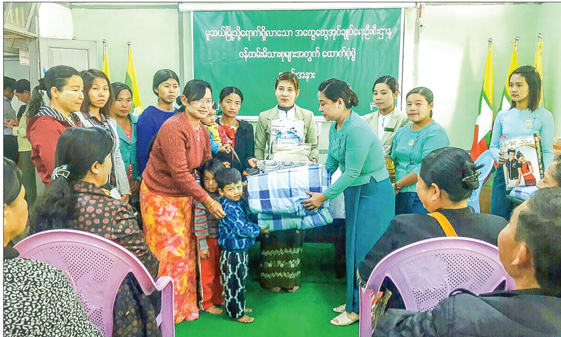
Humanitarian aid for General Administration Department being handed over.

THE recent armed attacks in the Muse area of northern Shan State forced locals and staff members residing in Mongkoe township and Pansang (Kyugok) to take shelter in a neighboring country, which caused some hardship.