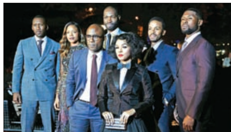
Cast members pose as they arrive for the gala screening of the film "Moonlight", on the second night of the 60 th British Film Institute (BFI) London Film Festival at Embankment Garden Cinema in London, Britain on 6 October 2016.

But this year, some of the films getting the most awards buzz were not eligible for the Spirit Awards, which is open to