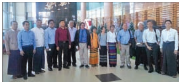
Myanmar writers are seen at the Yangon International Airport before departs for China.

They will be back Myanmar on 28 November.— Myanmar News Agency