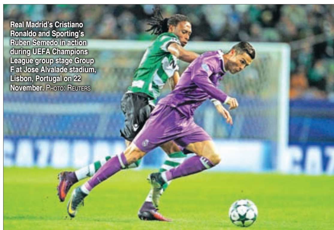
Real Madrid's Cristiano Ronaldo and Sporting's Ruben Semedo in action during UEFA Champions League group stage Group F at Jose Alvalade stadium, Lisbon, Portugal on 22 November.