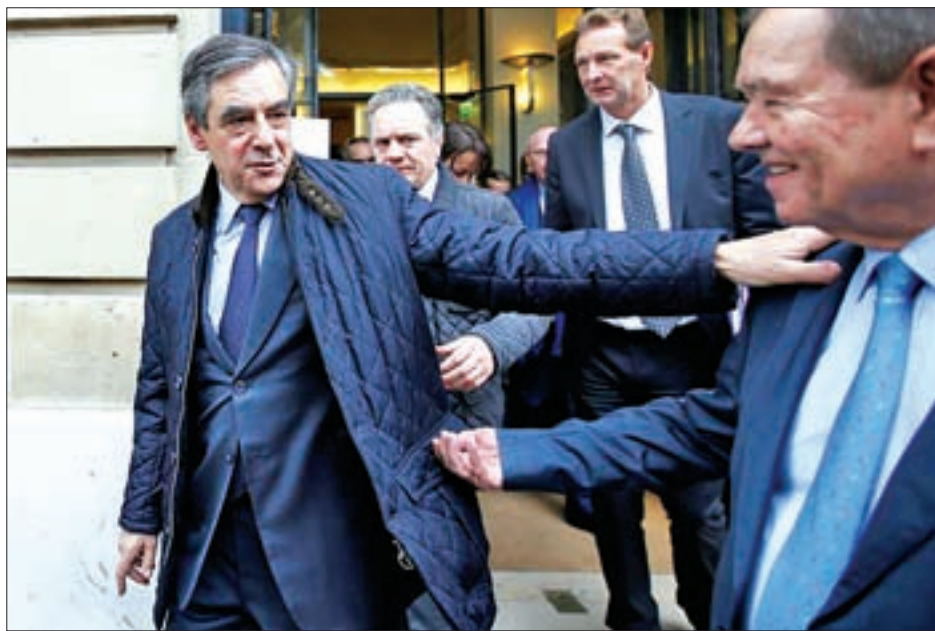
Francois Fillon, candidate in Sunday's second round of the French centre-right presidential primary elections, members of the conservative Les Republicains political party, leaves after a meeting with deputies in Paris, France, on 22 November 2016.

Speaking on Tuesday to lawmakers supporting him, Fillon retorted: "After