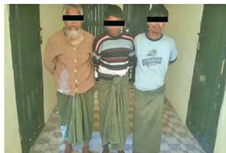
Three suspects for violent attacks are seen in Maungtaw.

It was found that arsonists set fire to the houses in tandem with the patrolling by the troops, according to the Information Committee.— Myanmar News Agency