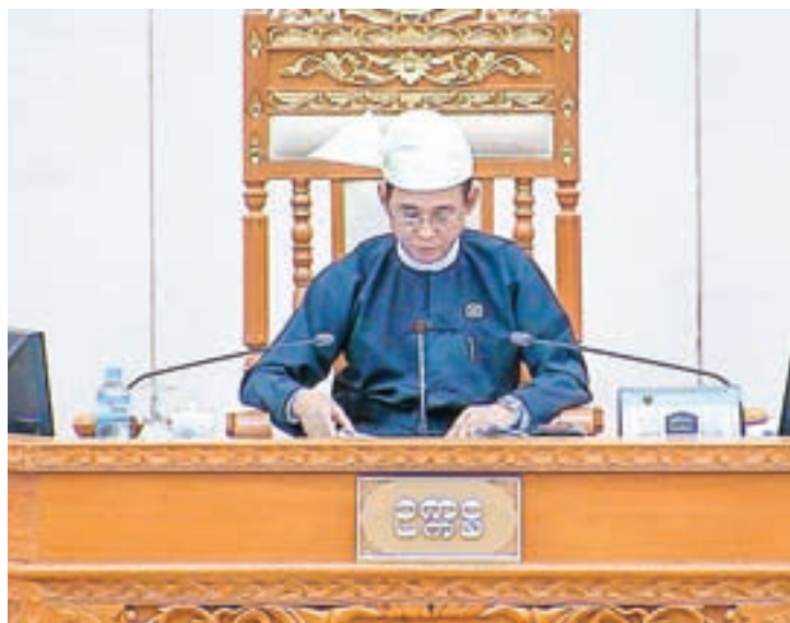
Pyithu Hluttaw speaker U Win Myint .PHOTO:MNA