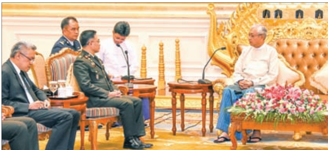
President U Htin Kyaw holds talks with General Surapong Suwana-Adth, Chief of the Defence Forces of the Royal Thai Armed Forces at the Presidential Palace in Nay Pyi Taw.

The meeting was attended by Commander-in-Chief of Defence Services Senior General Min Aung Hlaing, Union Minister for Defence Lt-Gen Sein Win and Minister of State for Foreign Affairs U Kyaw Tin.— Myanmar News Agency