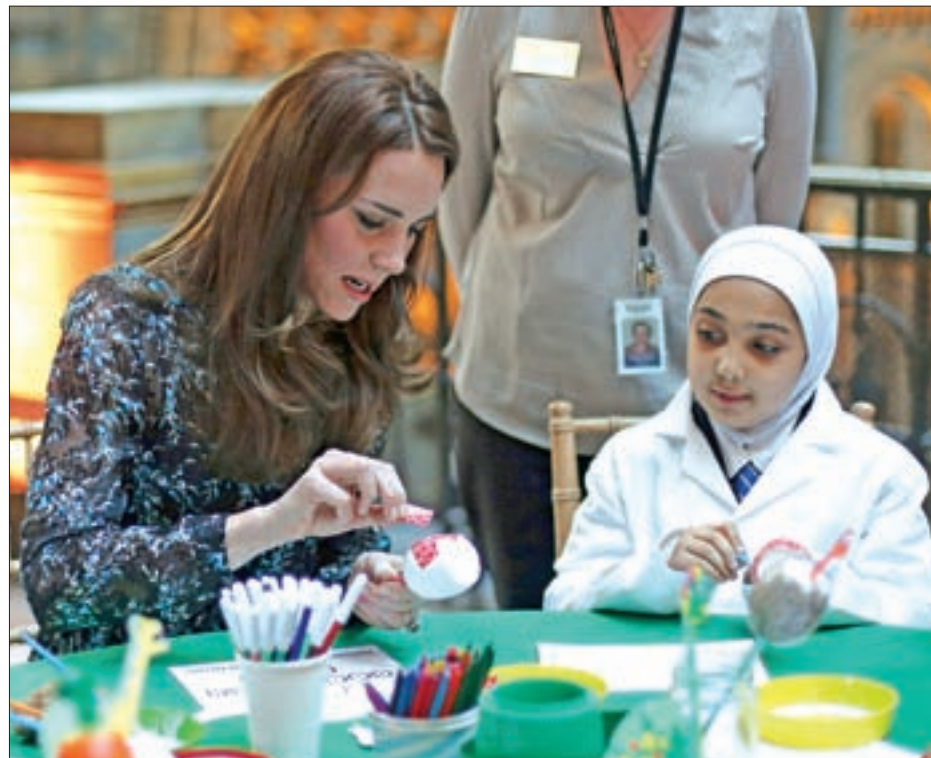
Britain's Catherine, Duchess of Cambridge makes a dinosaur egg whilst attending a children's tea party with pupils from Oakington Manor Primary School in Wembley, at the Natural History Museum in London, Britain, on 22 November 2016.

The museum plans to fill the dinosaur-sized gap in its entrance hall with a 100-year-old skeleton of a blue whale.—Reuters