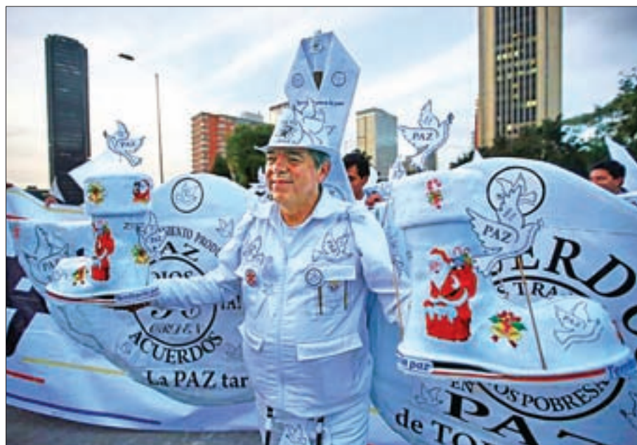
A supporter rallying for the nation's new peace agreement with FARC attends a march in Bogota, Colombia, on 15 November 2016.

An end to the war with the FARC is unlikely to end violence in Colombia as the lucrative cocaine business has given rise to dangerous criminal gangs and traffickers.—Reuters