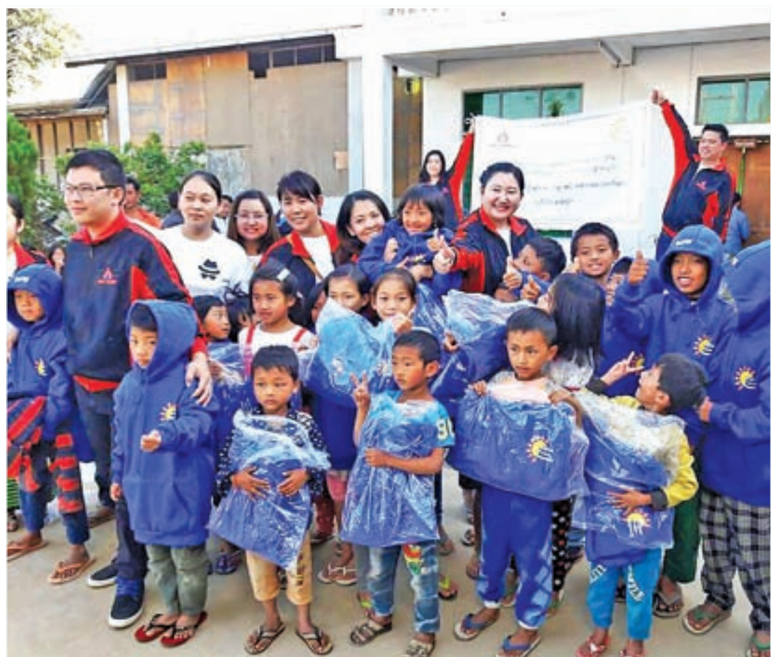
Internally displaced persons and their children display aid and supplies delivered yesterday to Shan State by donors. The food, clothing and supplies were donated by local citizens, NGOs, INGOs and international aid organisations.

"At a time when the people of Myanmar are in the process of striving for national reconciliation, it is extremely disappointing that these incidents are instigated".