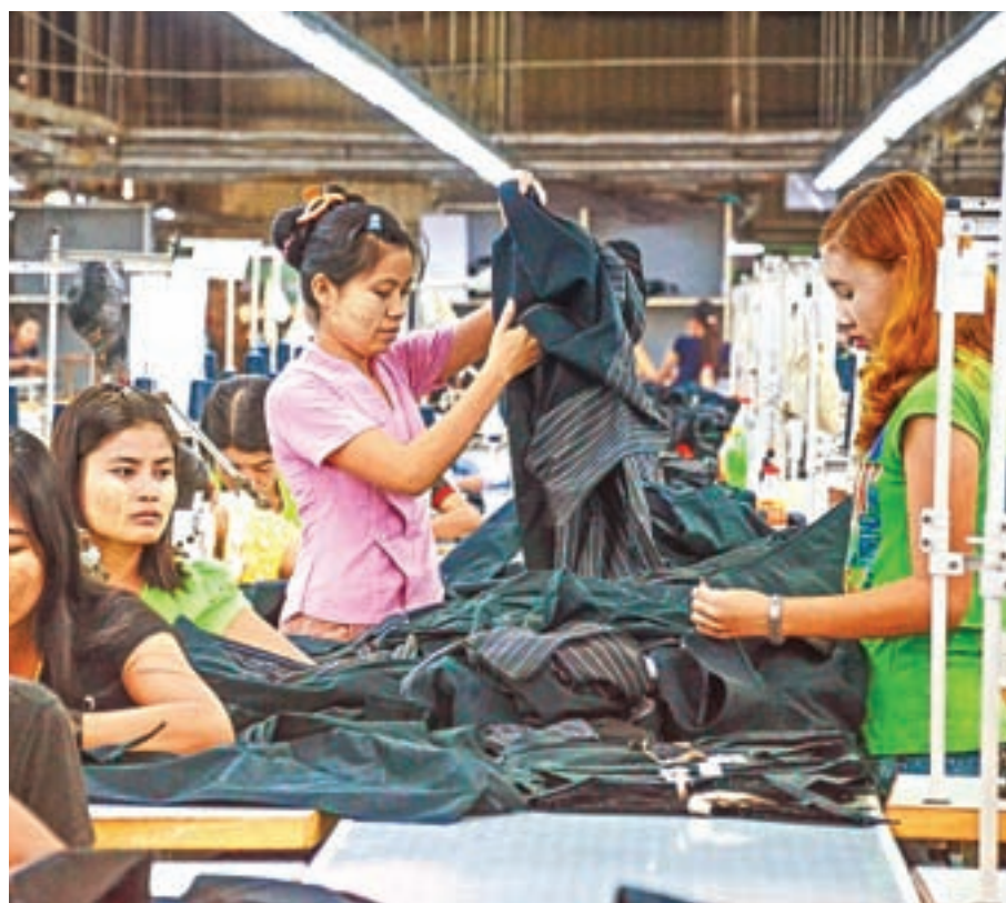
Women employees working on a production line at a garment factory in Hlinethaya. File photo taken on 11 December 2015

fisheries products worth US$652.840million in the 2012-2013 fiscal year whereas 34,567.36 tonnes of fishery products worth US$536.274million were exported the following year. During 2014-2015 fiscal year, 338,290.58 tonnes of fishery products worth US$482.2516million were exported, it is learnt.—Myit-makha News Agency