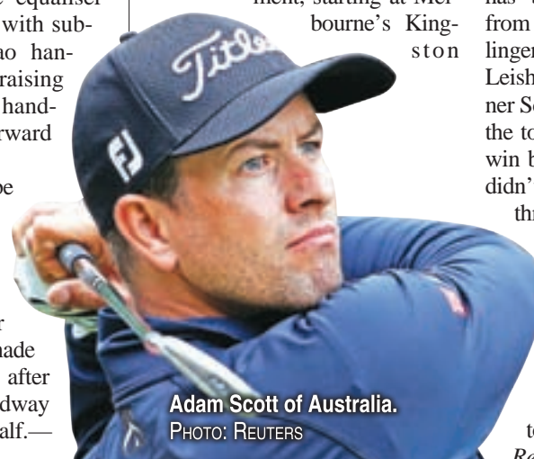
Adam Scott of Australia.