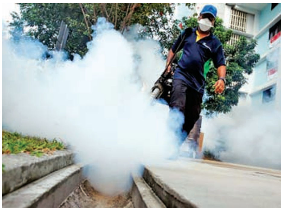
A worker fogs the common area of a public housing estate at a new Zika cluster in Singapore, on 1 September 2016.

Now, amid outbreaks in Singapore, Thailand, Viet Nam and other parts of Southeast Asia, a much graver explanation is taking shape: perhaps the menace has been there all along but neurological complications