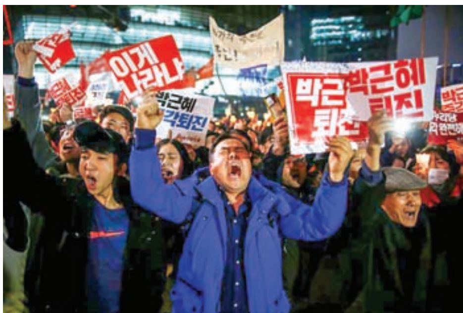
People chant slogans as they march toward the Presidential Blue House during a protest calling South Korean President Park Geun-hye to step down in Seoul, South Korea, on 19 November 2016.

Park has all but ceased public activities as president and has withdrawn to the secluded Blue House