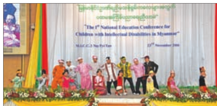
Performance of children with intellectual disabilities at the opening ceremony of the 1 st National Education Conference for Children with Intellectual Disabilities.

Daw Aung San Suu Kyi, U Henry Van Thio, Union Ministers and others posed for the documentary photos.