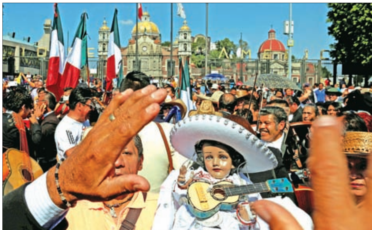
An image of baby Jesus dressed up as mariachi plays is seen at the Basilica of Our Lady of Guadalupe to celebrate Santa Cecilia, patron of musicians in Mexico City, Mexico, on 22 November 2016.

MEXICO CITY — Hundreds of mariachi folk musicians filled the streets of Mexico City on Tuesday to celebrate and serenade the feast day of Cecilia,