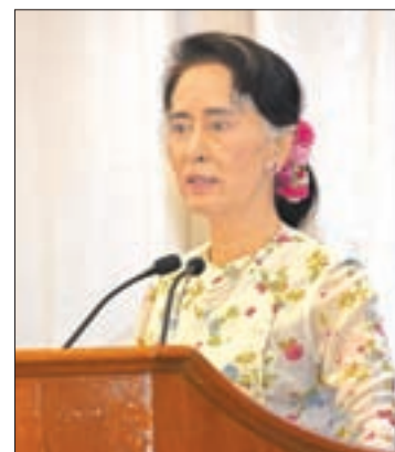
State Counsellor Daw Aung San Suu Kyi.

ation of the disabled children and adults should be concluded based on a word, 'Self.' The first thing which will occur in the mind of the disabled is discouragement. From there it changes into grievance and grief. If it occurs in that way, I want to say that it goes on astray from the beginning. Provided that the impression — it occurs only to me among all — will go through his life, they will find it difficult to improve in their life. So as not to reach the wrong way, it is necessary for us to control and lead them."