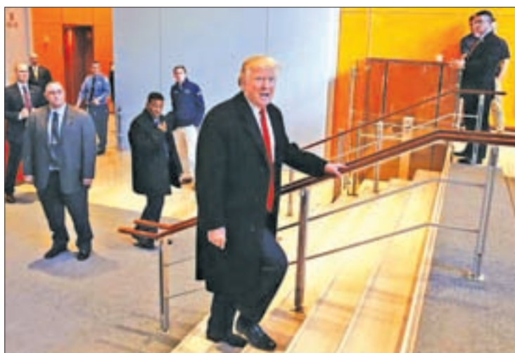
US President elect Donald Trump walks up a staircase to depart the lobby of the New York Times building after a meeting in New York, US, on 22 November 2016.

A shift on global warming is the latest sign Trump might be backing away from some of his