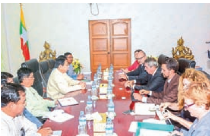
Union Minister Dr Pe Myint holds talks with Mr. Stavros Lambrinidis.

DR Pe Myint, the Union Minister for Information, received Mr. Stavros Lambrinidis, the Special Representative on Human Rights for the European Union, and his delegation at the Minister's Office yesterday.