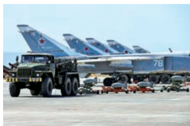
Russian military jets are seen at Hmeymim air base in Syria, on 18 June 2016.

course of the conflict in favour of Assad's government last year when it intervened with air strikes. Moscow says it targets only Islamic State militants and other jihadist fighters.