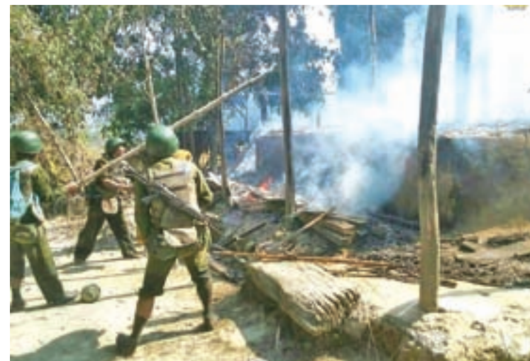
Security forces extinguish the fire in Dargyizar Village.

The Bailey bridge that links Monesein and Monetat villages is 60 feet in length and 15 feet wide and plays an important role for locals in transporting and trade. It is learnt that the government troops are making area clearance operations.— Myanmar News Agency