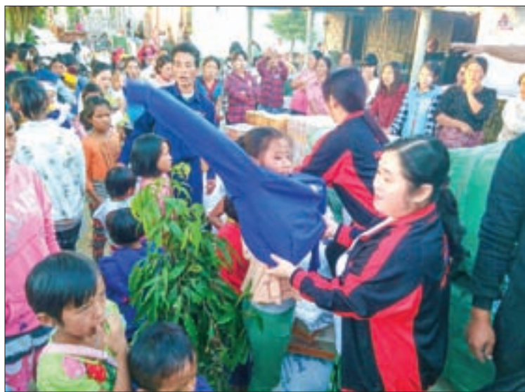
Children trying on warm clothes donated by BFM at IDPs in northern Shan State.

hsi and Mongkai townships in northern Shan State; more than 3,000 pieces of warm clothes and 10,080 packs of dried instant noodles to IDPs in Myaing Gyi Ngu and Maethawaw in Kayin State; more than 36,500 pieces of warm clothing to ethnic people including monks and nuns in the Mandalay Region; more than 3,500 pieces of imported warm clothing to Naga ethnic people in Lahe, Naga Self-administered Zone in Sagaing Region; more than 7,650 articles of warm clothing to IDPs in Namtu in northern Shan State and more than 470 pieces to the local people in uneasily accessible areas in Kalay Township. The foundation has carried out philanthropic works since the Cyclone Nargis hit the country in 2008. So far, the BFM it has spent more than K110 billion on evacuation, relief and resettlement of peoples nationwide who are affected by disasters. The money is also spent on disaster preparedness, education, health, religion and sports in communities across the country. —Thae Naing Oo (Myanmarsar)