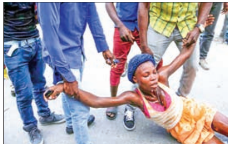
Men help a woman affected by tear gas used by National Police officers to disperse a demonstration of supporters of Fanmi Lavalas political party in the streets of Port-au-Prince, Haiti, on 22 November 2016. PHOTO: REUTERS

Electoral law bans the forecast of results before the electoral council proclaims a winner, as well as demonstrations for candidates, political parties or groups between Election Day and when the results are announced. —Reuters