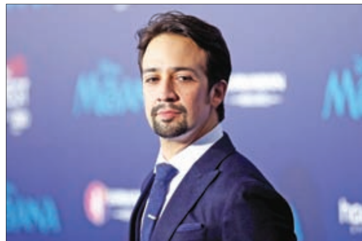
Actor and composer Lin-Manuel Miranda poses at the world premiere of Walt Disney Animation Studios' 'Moana' as a part of AFI Fest in Hollywood, California, US, on 14 November 2016.

Q: Speaking of "Mary Poppins," what can you tell us about your character Jack? Will we be hearing a Cockney accent?