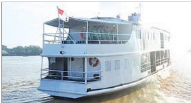
A vessel of military medical mobile team leaves for Ayeyawady Region.

The team is composed of specialists in eye diseases, bone diseases, childhood diseases, dental diseases, obstetrics, gynaecology and ear, nose and throat diseases. The team will also provide medical check ups using X-rays and ultrasound. —Office of Commander-in-Chief of Defence Services