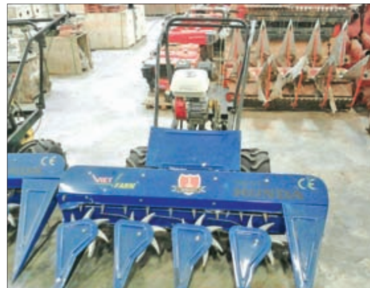
Harvesting machines are seen before being sent to Maungtaw.

As peace and stability are restored in the Maungtaw region, the Rakhine State Cabinet and ministry of agriculture, livestock and irrigation have sent harvesting machines to local farmers to reap the paddy in time, according to state head office of agricultural department.