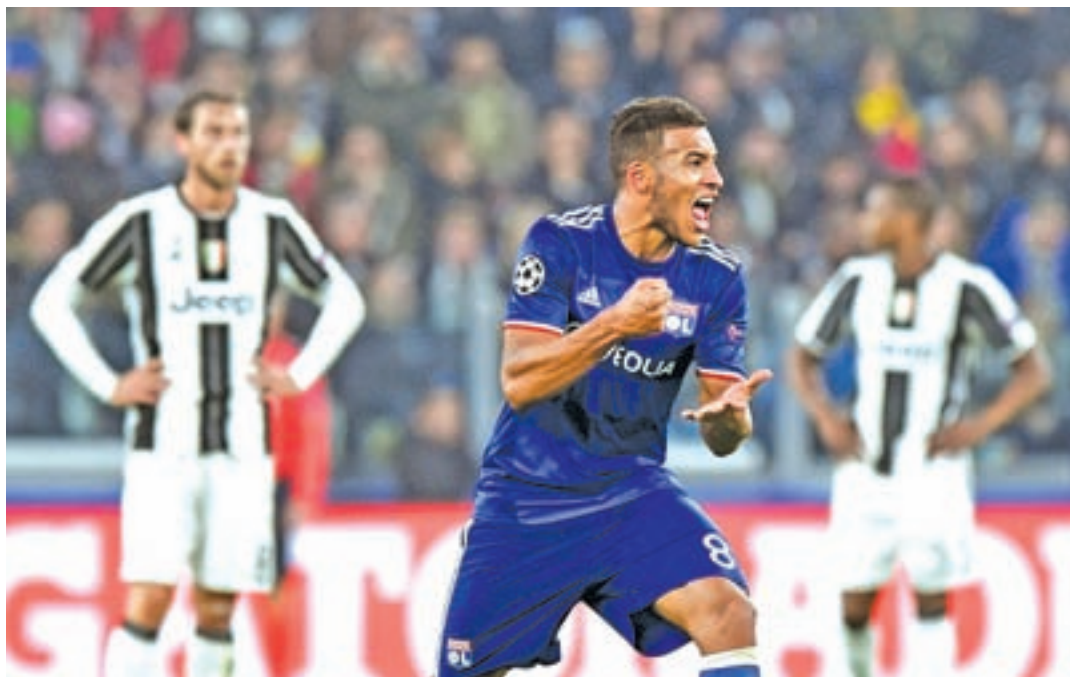
Olympique Lyon's Corentin Tolisso celebrates after scoring first goal during their UEFA Champions League Group Stage, Group H at Juventus stadium, Turin, Italy, on 2 November 2016.

The Argentine stepped up and sent Anthony Lopes the wrong way from the spot.