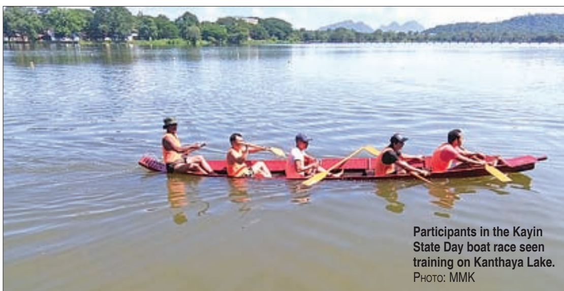
Participants in the Kayin State Day boat race seen training on Kanthaya Lake.

The boat race is scheduled to be held from 6 to 8 November at Kanthaya Lake. All participating teams have already begun their sports training activities at the lake. Audience will also see the five-day Lethwei (boxing) competition at the boxing stadium located in the west of Thiri Sports ground starting 7 November, according to organisers.—Myitmakha News Agency