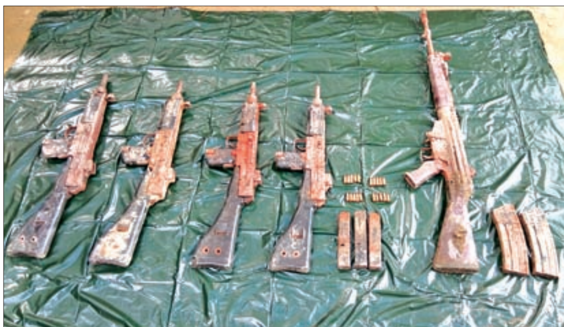
Arms and bullets discovered in Warpeik Village.

Troops comprising members of the Tatmadaw and police force yesterday discovered arms and ammunition looted by armed violent attackers in the October-9 attacks in Maungtaw Township.