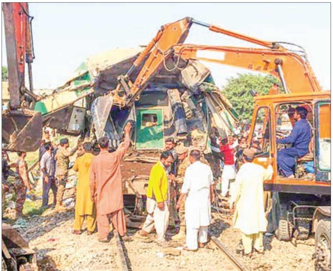
Rescue workers use heavy machinery on the car of a train which crashed outside Karachi, Pakistan, on 3 November 2016.

Pakistan's colonial-era railway network has fallen into disrepair in recent decades due to chronic under-investment and poor maintenance.—Reuters