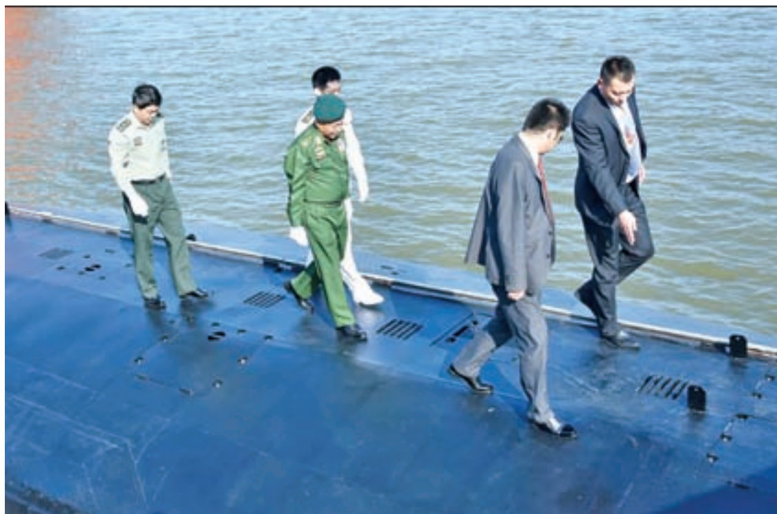
Senior General Min Aung Hlaing observes a submarine during his tour of China.