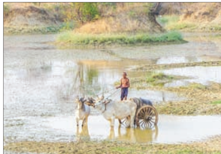
A villager seen standing on the water wagon at a rural village.

The door-to-door water supply project which was implemented in Paakokku district was a three-year project that started in 2014.— Myitmakha News Agency