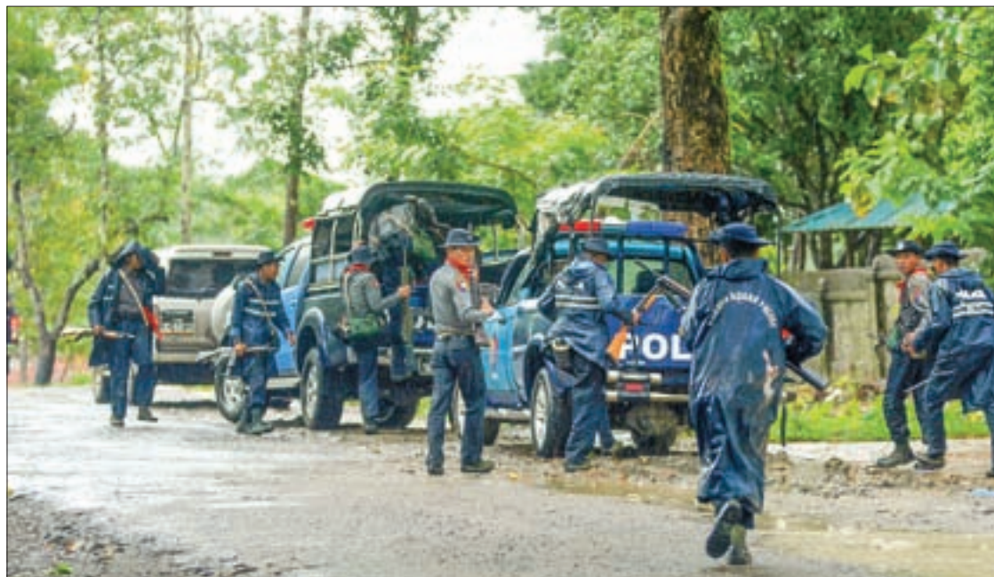
Police forces prepare to patrol in Maungdaw township at Rakhine State, northeast Myanmar, on 12 October 2016.

It is customary for every country and society to punish any-