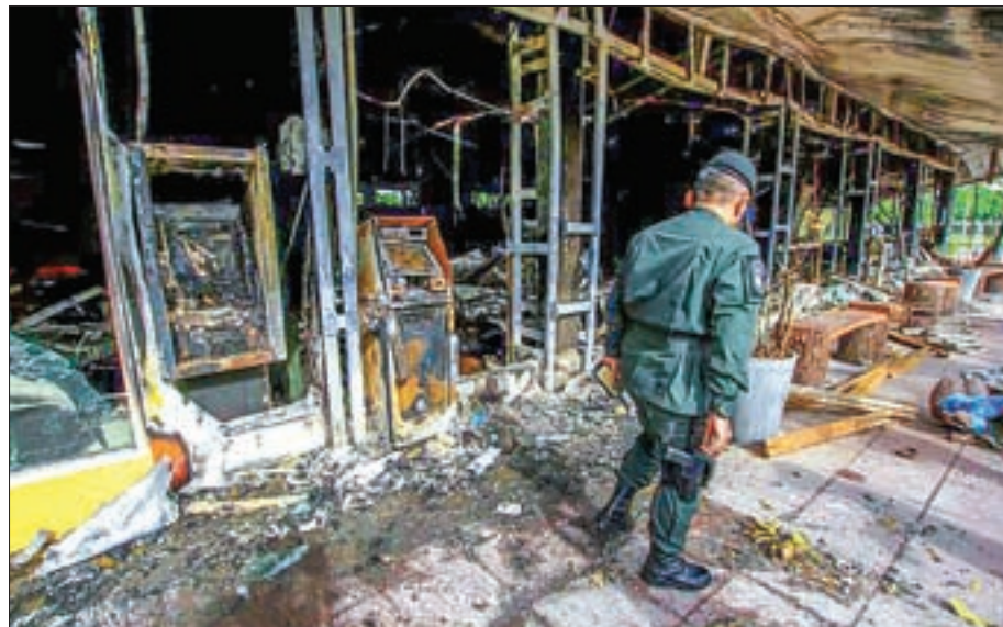
A military personnel inspects the site of a bomb attack in Nong Chik district in the troubled southern province of Pattani, Thailand, on 3 November 2016.

“Any request by the junta for a halt in the violence is unlikely to have any effect.”—Reuters