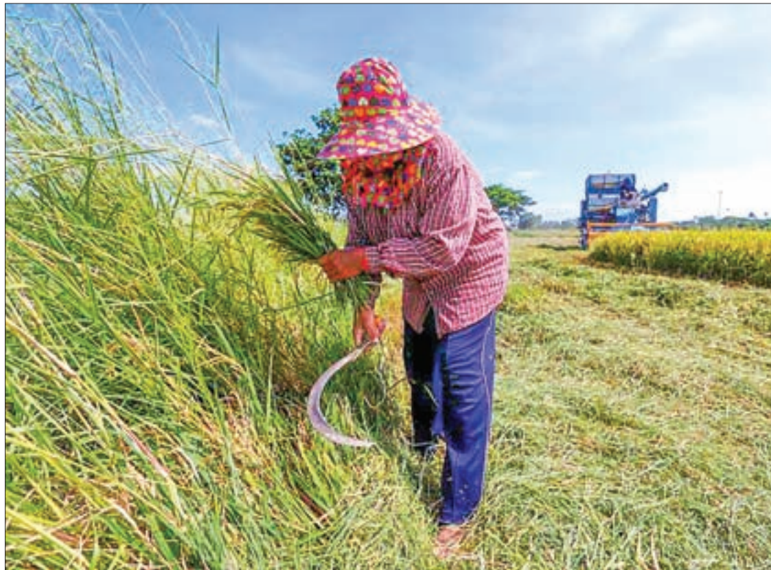
A farmer works in her rice field in Suphan Buri Province, north of Bangkok, Thailand, on 2 November 2016.

situation would get out of control, so they have to intervene," he said.