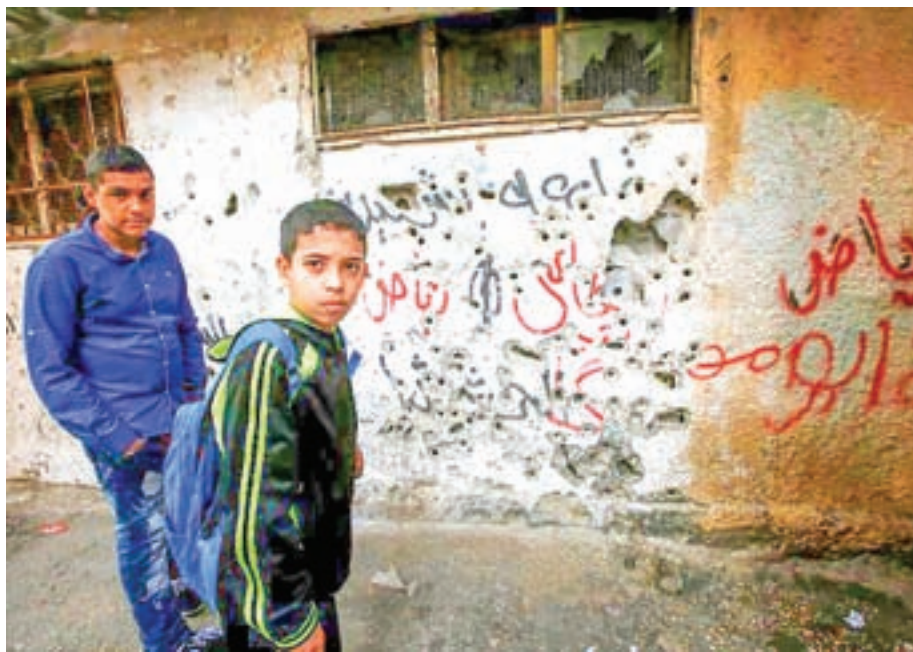
Palestinian school boys stand in front of a wall damaged by bullets during a clash between Palestinian security and gunmen, in Balata refugee camp near the West Bank city of Nablus, on 1 November 2016.