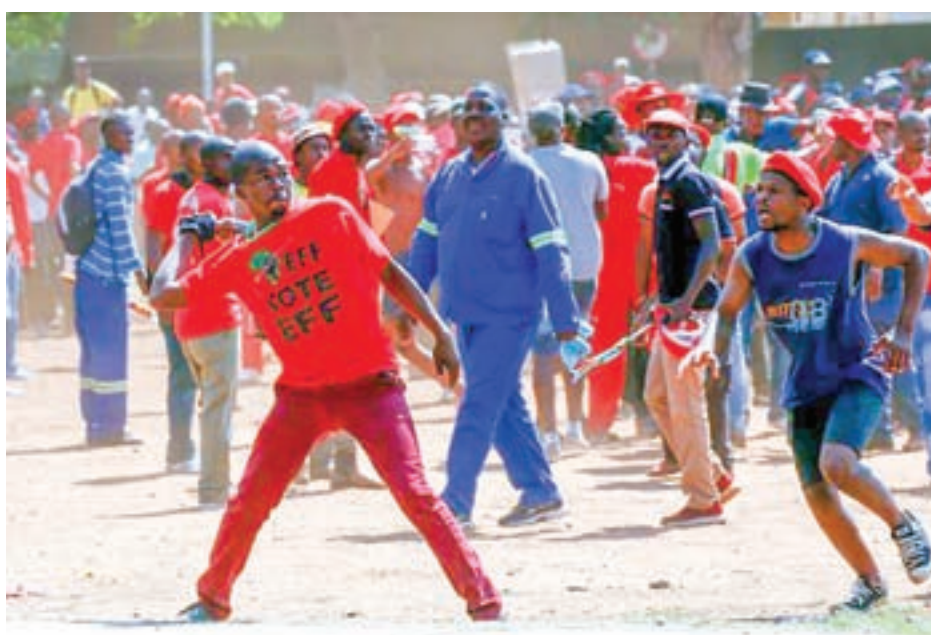
A protester throws a bottle at police during demonstrations calling for the removal of President Jacob Zuma outside the Union Buildings in Pretoria, South Africa, on 2 November 2016.

Police fired stun grenades and used water cannon to disperse demonstrators who had marched to the Union Buildings, where