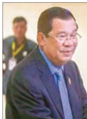
Cambodia's Prime Minister Hun Sen.

Most recently, the United States, European Union and United Nations have expressed concern about rising tension between Hun Sen's govern-