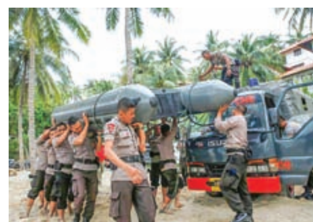
Police prepare a boat for a search and rescue operations after a boat capsized off Batam, in Nongsa, Batam, Indonesia, on 2 November 2016.

The accident happened as the boat was heading from the southern Malay-