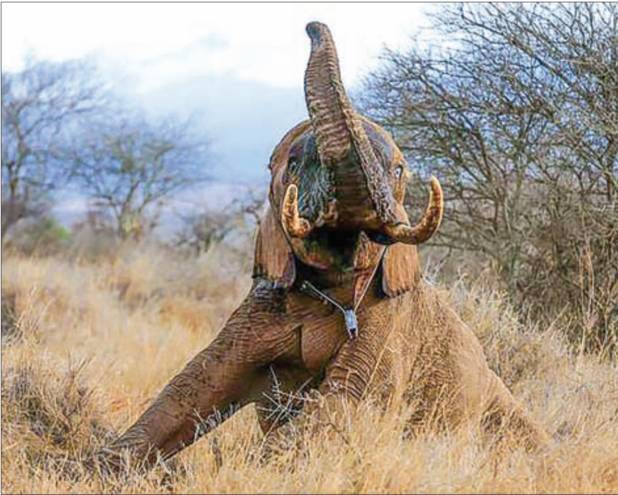
A male elephant attempts to stand on its feet after it was fitted with an advanced satellite radio tracking collar to monitor their movement and control human-wildlife conflict near Mt. Kilimanjaro at the Amboseli National Park, in Kenya, on 2 November 2016.

side the limits of Amboseli National Park in southern Kenya, in areas where herders were grazing livestock, underscoring the potential for conflict with humans. Elephants also often raid crops and farms as they migrate between parks, angering villagers who rely on their produce to feed their families. But tracking data from the IFAW project showed elephants could be deterred by electric fences around farms, suggesting a way for the animals and their human neighbors to live together more peacefully. The collars can also provide rangers with an early warning if the elephants are straying too close to human habitation. The Kenya Wildlife Service said elephant numbers had rebounded to 32,000 from a low of 16,000 in 1989, the year that the world conservation body CITES banned sales of ivory from African elephants. Kenya’s Wildlife Service was set up a year later. But elephants remain threatened by poaching and habitat loss. —Reuters