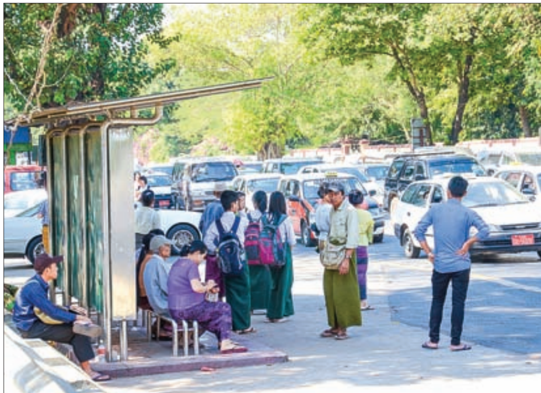
People are waiting for buses at a bus stop.

THE YANGON Region Transport Authority (YRTA) will invite tenders to implement the first stage of the project to install 250 new bus stops across Yangon this month, its spokesperson said.