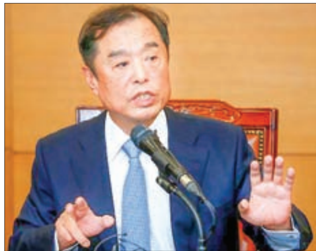
Kim Byong-joon, a nominee for South Korea's Prime Minister, speaks during a news conference in Seoul, South Korea, on 3 November 2016.

SEOUL — South Korea's new prime minister nominee said on Thursday it is his view that the country's president can be subject to prosecutors' ongoing investigation into an influence peddling scandal.