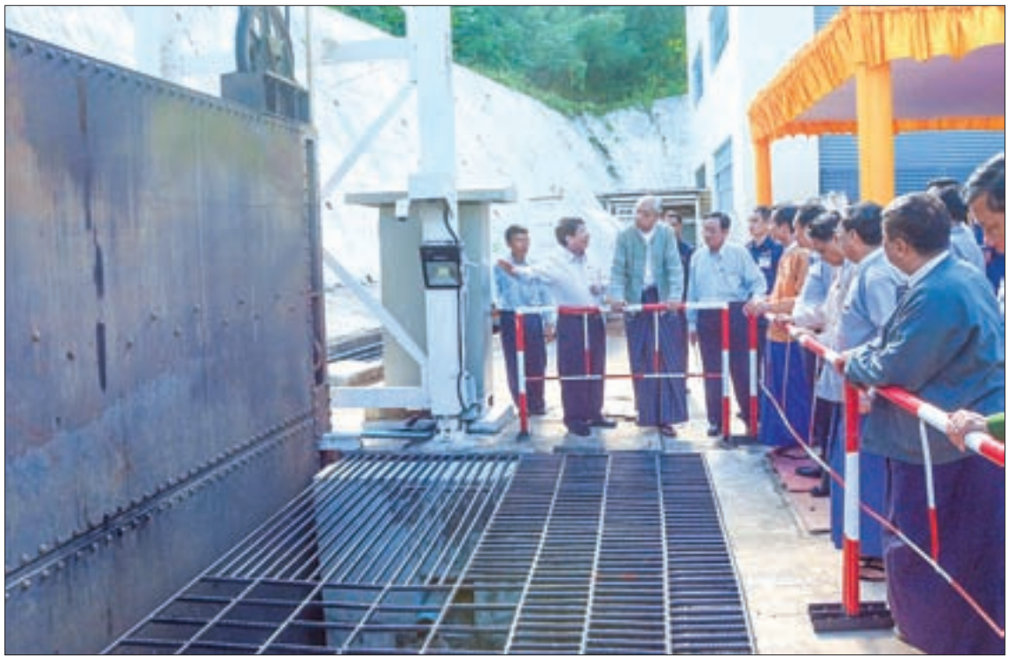
President U Htin Kyaw inspects the Sluice Gate of the No 2 Biluchaung Hydro-power Plant.

In the afternoon, the president and party arrived at Biluchaung Hydro-power Project,