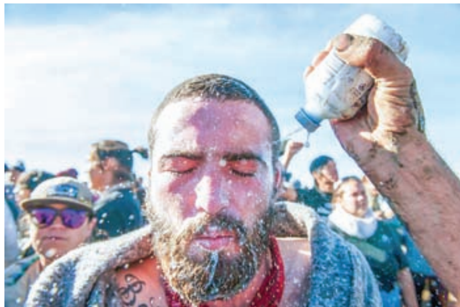
A person pours a pepper spray antidote into a protester's eyes during a protest against the building of a pipeline on the Standing Rock Indian Reservation near Cannonball, North Dakota.