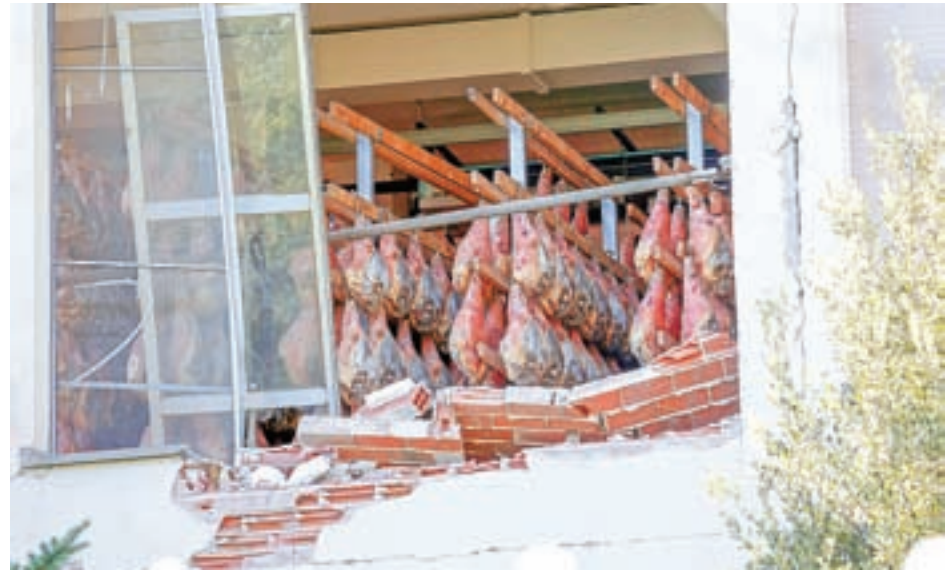
Hams are seen in a collapsed factory following an earthquake in Norcia, Italy, on 31 October 2016.

Governments should enforce laws and regulations, and crack down on the corruption that helps fuel deforestation, she added.— Reuters