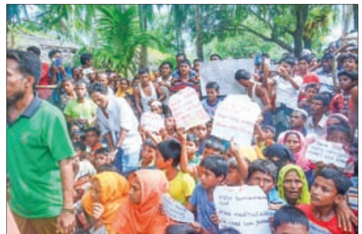
Placards held by Muslim villagers, are written in English with good hand writing, revealing the timed movement.

They also said that the government has abided by the international norms and they also urged it to continue to abide by the international norms. In addition, they said that the government allowed them to visit the villages they wanted to and imposed no restrictions on them, despite the accusations. They said they urged the government to allow international investigative bodies to refute the accusations and other international organisations, saying that every high-ranking official they met was ready to accept their opinions. They were also told to take the opportunity for observers to examine the situation.— Myanmar News Agency