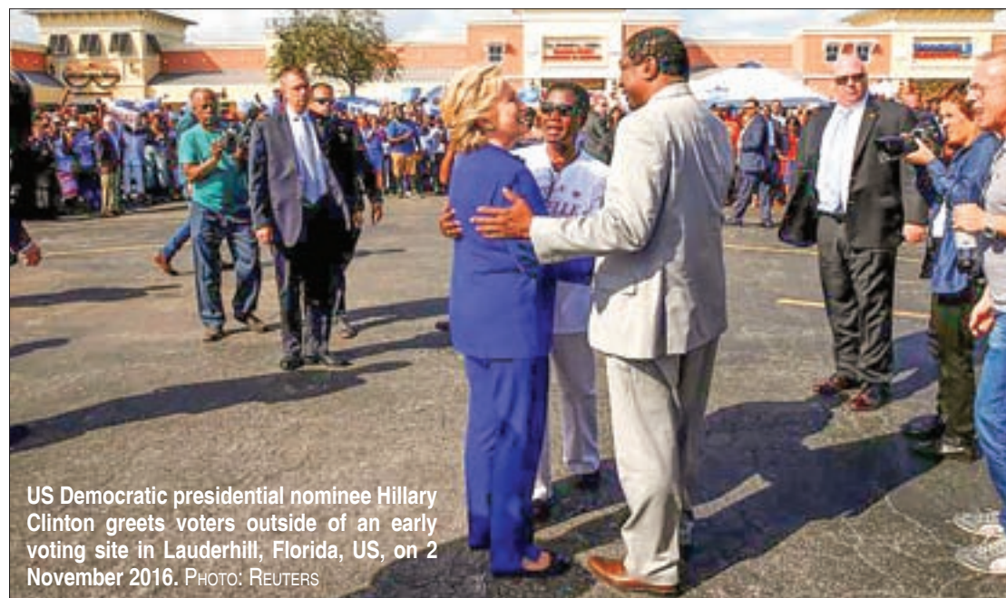
US Democratic presidential nominee Hillary Clinton greets voters outside of an early voting site in Lauderhill, Florida, US, on 2 November 2016.

He added that if Scotland were to vote for independence, they would probably get membership of the EU pretty quickly. —Reuters