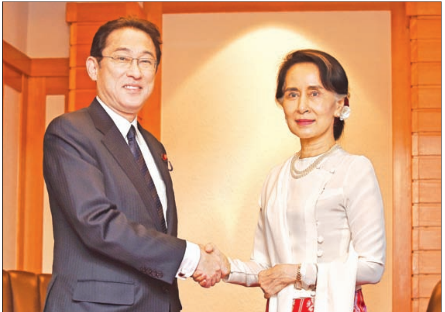
State Counsellor Daw Aung San Suu Kyi shakes hands with Japan's Foreign Minister Fumio Kishida prior to their talks at a hotel in Tokyo on 3 November.

Daw Aung San Suu Kyi said the situation in Rakhine state is extremely delicate and needs to be addressed with caution, adding that the government is dealing with it under the principle of the rule of law, according to the ministry.