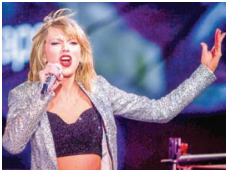
Taylor Swift performs in Times Square on New Year's Eve in New York, New York, US, on 31 December 2014.

It also looked at data from the Pollstar, the Recording Industry Association of America and tracking firm Nielsen SoundScan.— Reuters