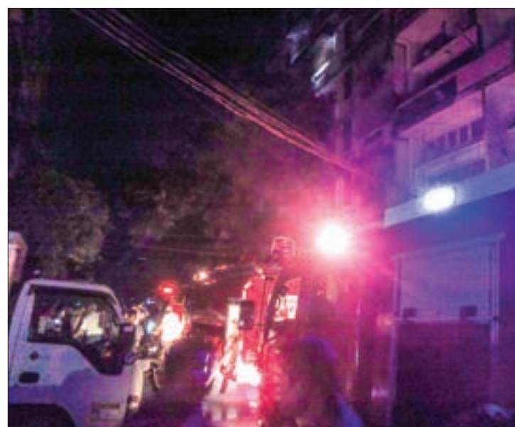
Fire engines are seen at the scene. PHOTO: MYITMAKHA NEWS AGENCY

The fire was brought under control by 50 firemen using 19 fire engines. No one was injured in the accident. The police have filed charges against the boy. The fire accident is the third within the first week of November in Yangon.— Myitmakha News Agency