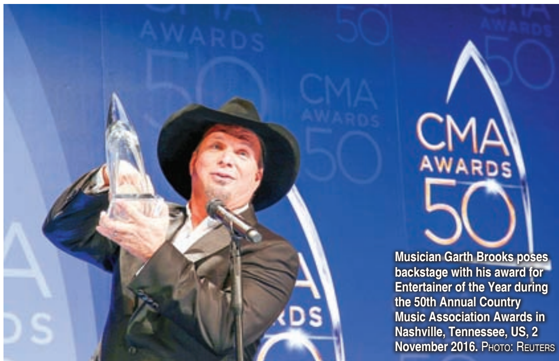
Musician Garth Brooks poses backstage with his award for Entertainer of the Year during the 50th Annual Country Music Association Awards in Nashville, Tennessee, US, 2 November 2016.