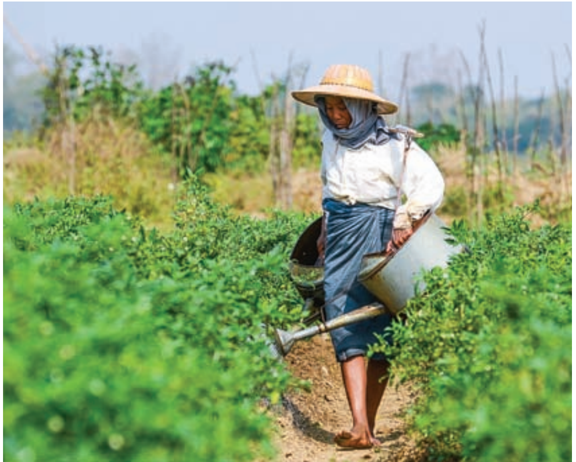
A farmer waters chili plants.

He added that growers have found it difficult to pay back the loan if crops are destroyed by natural disasters.