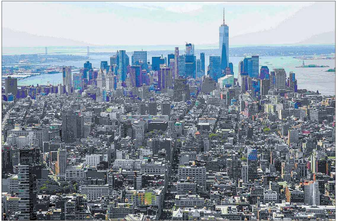
Lower Manhattan including the financial district is pictured from the Manhattan borough of New York, US on 1 June 2016.

Less than two weeks before the election, the GDP report was seen as bolstering Democratic presidential nominee Hillary Clinton, who has positioned herself as the best candidate to continue the more than six years of growth under President Barack Obama.