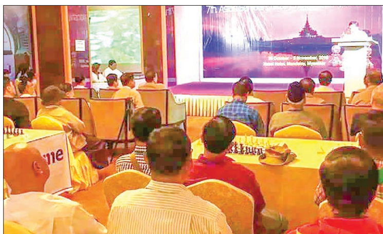
The opening ceremony of the 7th Asian Seniors Chess Championship tournament in progress.