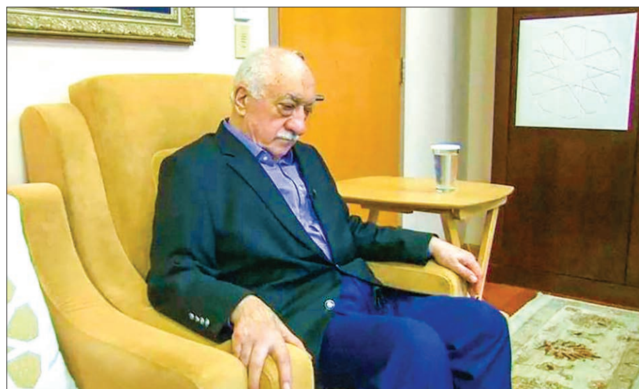
US-based cleric Fethullah Gulen, whose followers Turkey blames for a failed coup, pauses before speaking to journalists in this still image taken from video, at his home in Saylorburg, Pennsylvania on 26 July 2016.

Ankara wants the United States to detain and extradite Gulen so that he can be prosecuted in Turkey on a charge that he masterminded the attempt to overthrow the government. Gulen, who has lived in self-imposed exile in Pennsylvania since 1999, denies any involvement.—Reuters