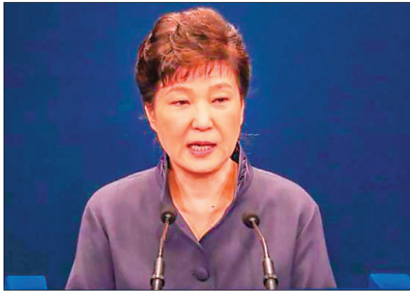
South Korean President Park Geun-hye releases a statement of apology to the public during a news conference at the Presidential Blue House in Seoul, South Korea, on 25 October 2016.