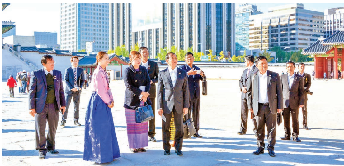
Myanmar delegation led by Pyithu Hluttaw Speaker U Win Myint visits Gyeongbok Palace.

A MYANMAR delegation led by U Win Myint, Speaker of Pyithu Hluttaw, visited Gyeongbok Palace and Museum in Seoul, South Korea, yesterday.