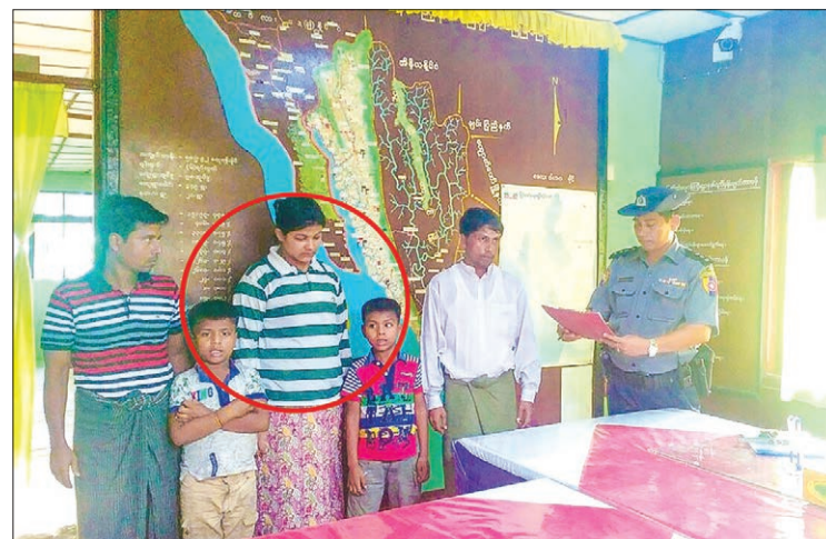
Authorities hand over released three young members of the Muslim community to town elders. PHOTO: MYAWADY

They were transferred to the head of Latha Village yesterday.—Myawady