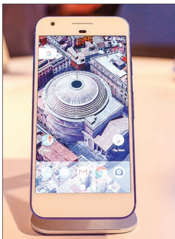
The Google Pixel phone is displayed during the presentation of new Google hardware in San Francisco, California, US on 4 October 2016.