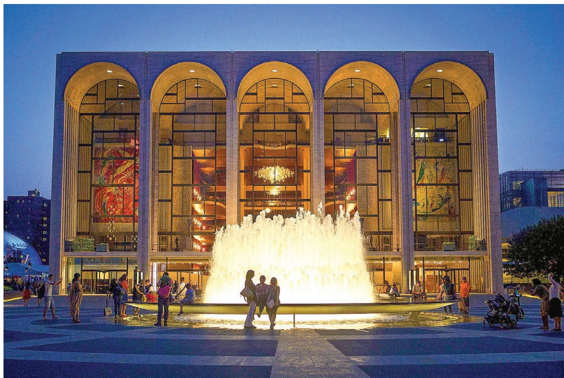
The Metropolitan Opera House is pictured at Lincoln Centre in New York July, in 2014.