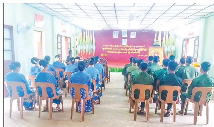
The vocational training course on the processing and production of fruit products in progress.

A total of 22 people who are members of Tatmadaw families attended the training, which lasted for 7 days from 24 to 30 October.—Shwe win (Pyay)