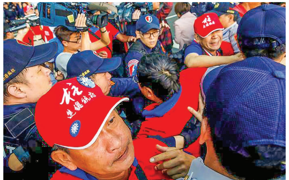
Pro-China supporters (red-cap) clash with police officers as they try to approach members of a Taiwanese independence group at the airport in Taoyuan, Taiwan, as Nationalist Party, or Kuomintang (KMT), chairwoman Hung Hsiu-chu departs for her first trip to China, where she is expected to meet China's President Xi Jinping, on 30 October, 2016.

"The Chinese government has put political conditions relevant to Taiwan surrendering our sovereignty and our right to determine our own future on the outflow of tourists to Taiwan and that's what makes this a