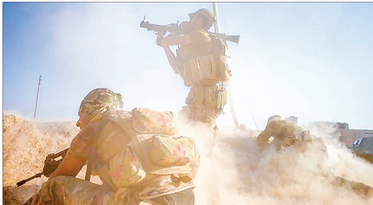
Members of Iraqi special forces police unit fire their weapons at Islamic State fighters in al-Shura, south of Mosul, Iraq on 29 October 2016.

Around 1.5 million people are still living in Mosul, and the United Nations has warned of a humanitarian crisis and possible refugee exodus as the fighting closes in on the city.—Reuters