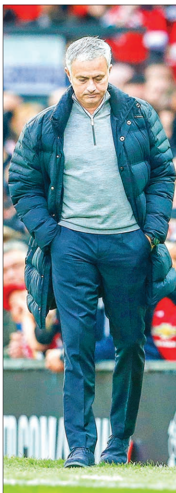
Manchester United manager Jose Mourinho.

Mourinho's relief after United's midweek League Cup derby win over City was short-lived as he began the second half behind the dug-out before being moved to the directors' box.—Reuters