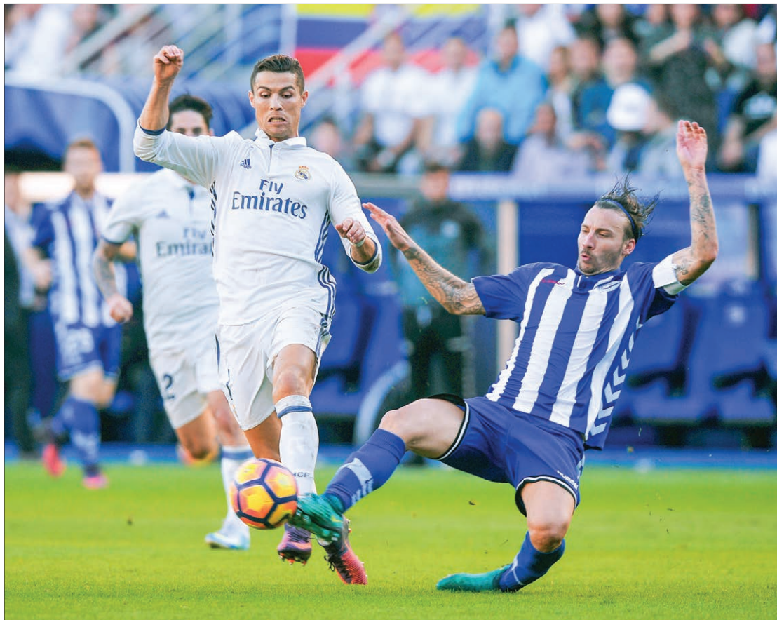
Deportivo Alaves' Alexis Ruano in action with Real Madrid's Cristiano Ronaldo (L) during Spanish Liga BBVA at Mendizorroza, Vitoria, Spain on 29 October 2016.

cannot win La Liga. We kept our heads cool even in difficult moments, which always occur in this league," said Zidane.