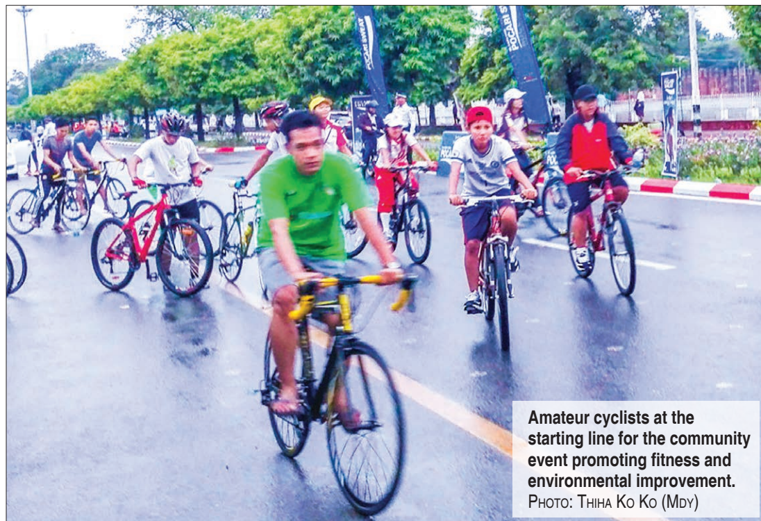
Amateur cyclists at the starting line for the community event promoting fitness and environmental improvement.