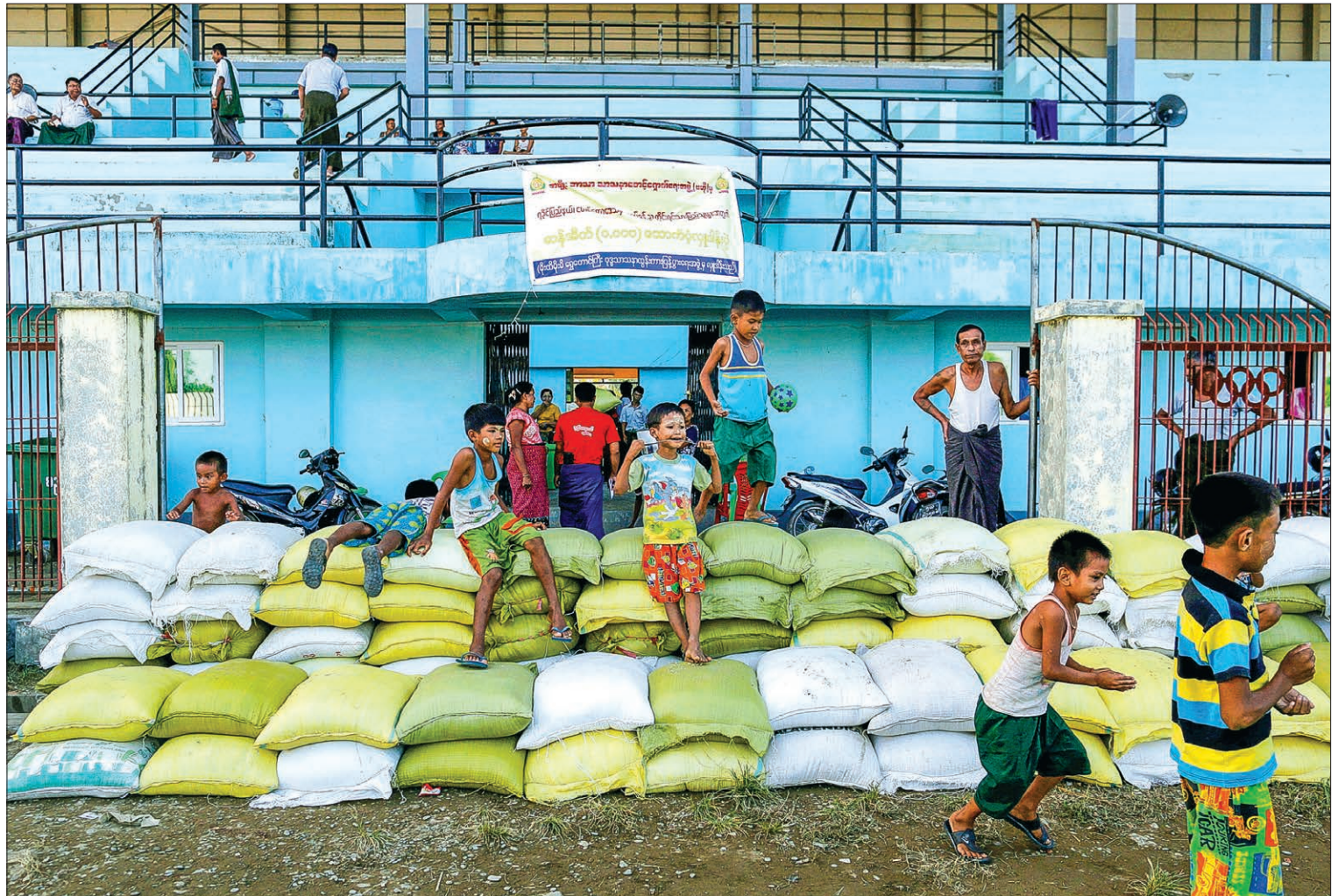
Rakhine Buddhists who have fled from violence in Maungdaw are passing their time in a temporary shelter at a stadium in Sittwe, Myanmar on October 25, 2016.

Security is of utmost importance for the local villages because, without safety, local people cannot live there peacefully and without fear.