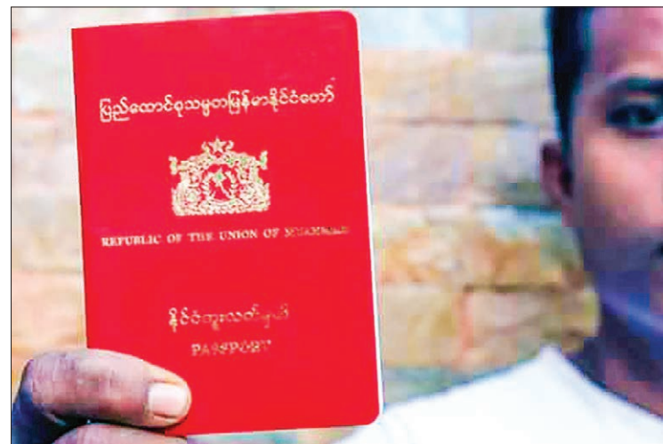
A man holding a passport.

Myanmar citizens in Thailand who want to apply for passports will have to come to Myanmar and can obtain passports in Yangon, Mawlamyine, Pha-An, and Dawe, it is learnt.—Kyaw Soe (Kawthaung)