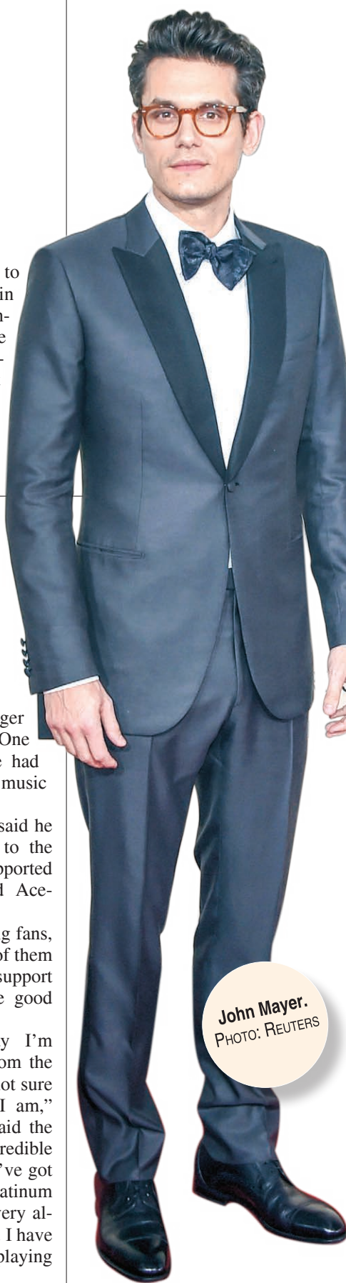
John Mayer.

split, he would be "open" to doing a song with her again in the future, reported E! Online. "If the right song came around. I look at great musicians — you write the right song, you send it to somebody, but I don't have anything in mind at the moment. —PTI