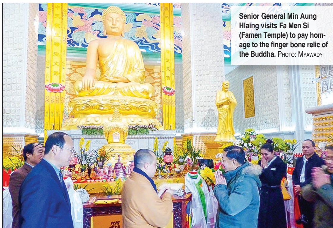
Senior General Min Aung Hlaing visits Fa Men Si (Famen Temple) to pay homage to the finger bone relic of the Buddha.