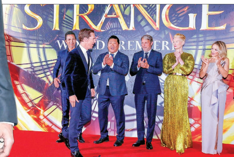
Cast member Benedict Cumberbatch (2nd L) walks by co-stars (L-R) Benjamin Bratt, Benedict Wong, Mads Mikkelsen, Tilda Swinton and Rachel McAdams at the premiere of "Doctor Strange" in Hollywood, California US, on 20 October 2016.

"I can honestly say I'm proud of a lot of stuff from the One Direction days. I'm not sure people realise that, but I am," Zayn said. The singer said the band will always be an incredible part of his life, adding, "I've got the memorabilia — the platinum discs we received with every album — all over my house. I have a wall dedicated to displaying them.