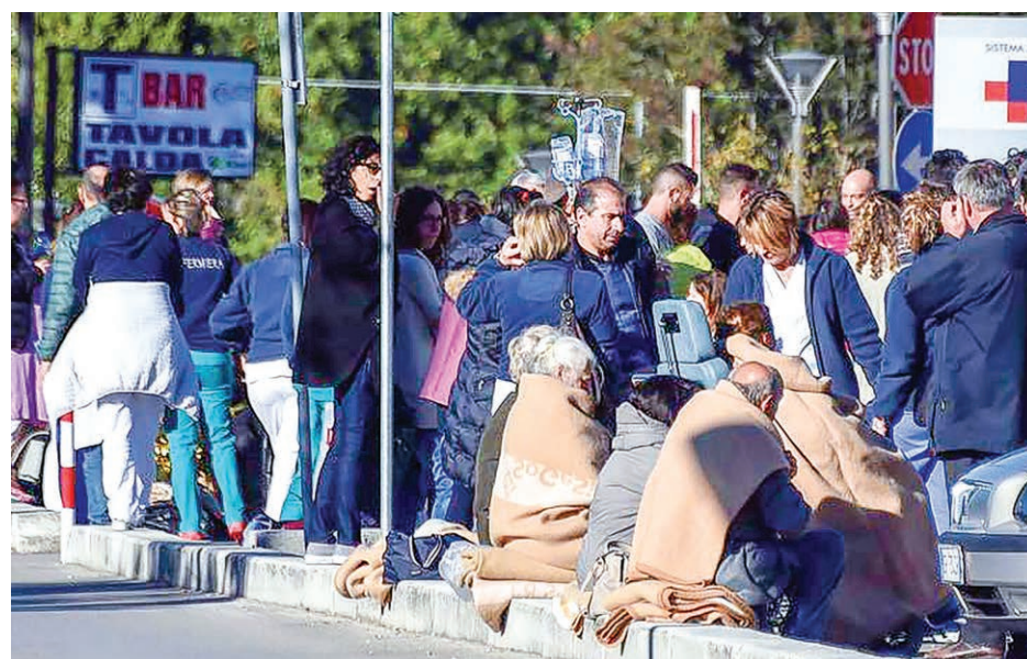
People are evacuated from a hospital following an earthquake in Rieti, Italy, on 30 October 2016. PHOTO: REUTERS

The earthquake was felt as far north as Bolzano, near the border with Austria and as far south as the Puglia region at the southern tip of the Italian peninsula.—Reuters