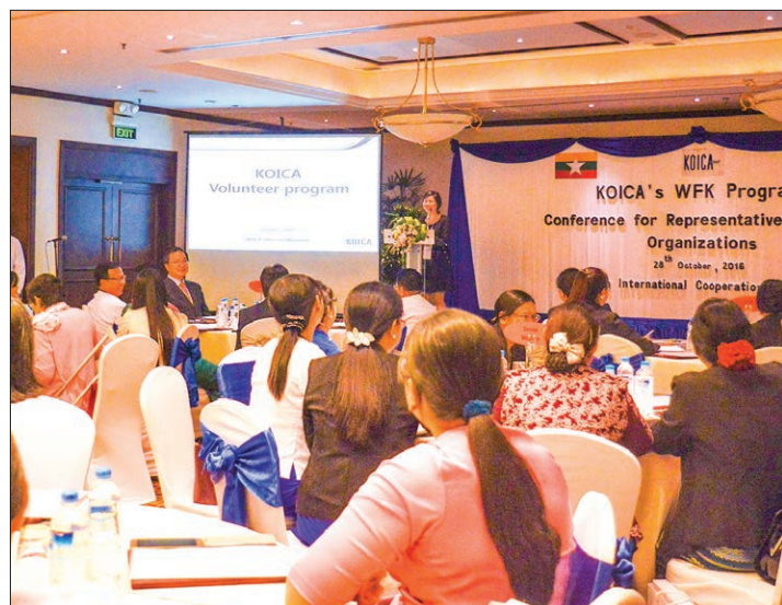
Workshop for Korea Volunteer program (WFK) is in progress.