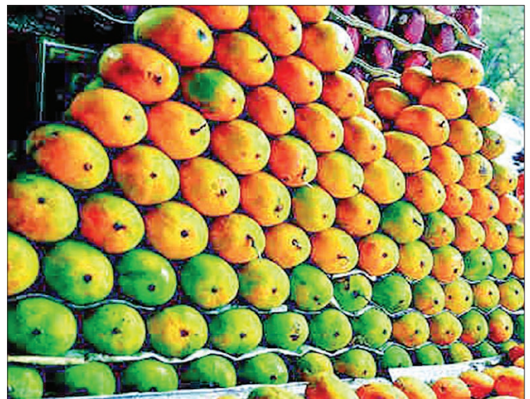
Mangoes being seen at a shop.

Mango is a seasonal, tropical fruit. It thrives in a wide range of climates, altitudes and soils. The mango tree is a hardy evergreen tree and can grow very large. — Aung Thant Khaing