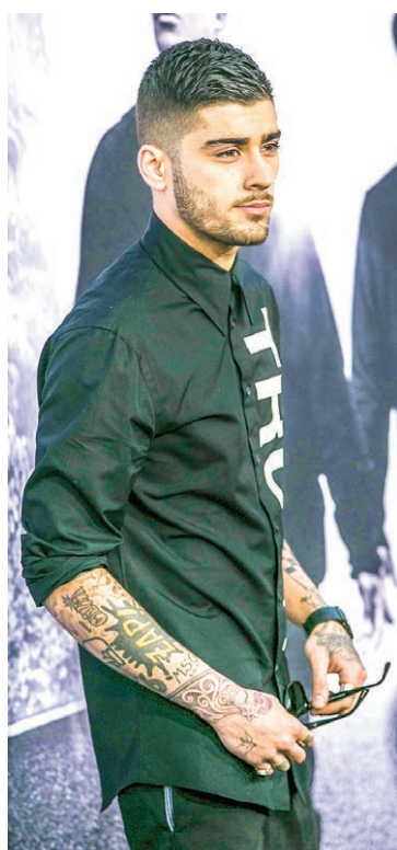
Singer Zayn Malik.

LOS ANGELES — Singer Zayn Malik may have left One Direction but he says he had an amazing time making music with the boy band.