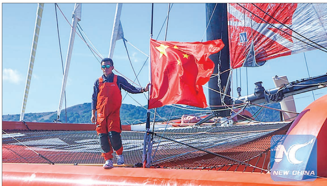
Guo Chuan preparing for his trans-Pacific sailing on 19 October 2016.

Before the accident, Guo was attempting to sail from San Francisco to Shanghai in 20 days or less for a new solo trans-Pacific world record. Guo already had a world record to his name for a 138-day solo non-stop circumnavigation in 2013.—Xinhua