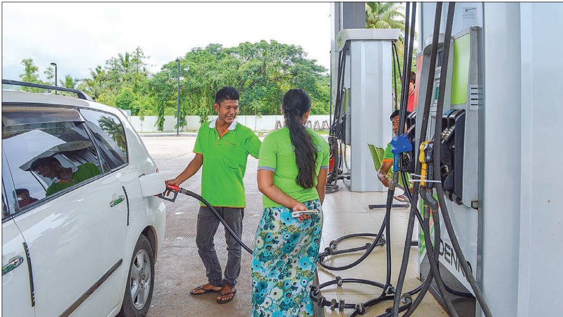
The price of fuel increased from 10 per cent to 14 per cent in the domestic market.