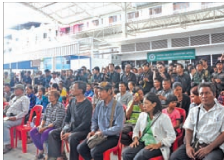
Myanmar internally displaced persons are seen at the ceremony to receive them in Myawady.

Meanwhile, a household comprising six refugees who wanted to go back home were handed over by the Thai authorities to the Myanmar side in Dawei, Taninthayi State, yesterday. — Myanmar News Agency