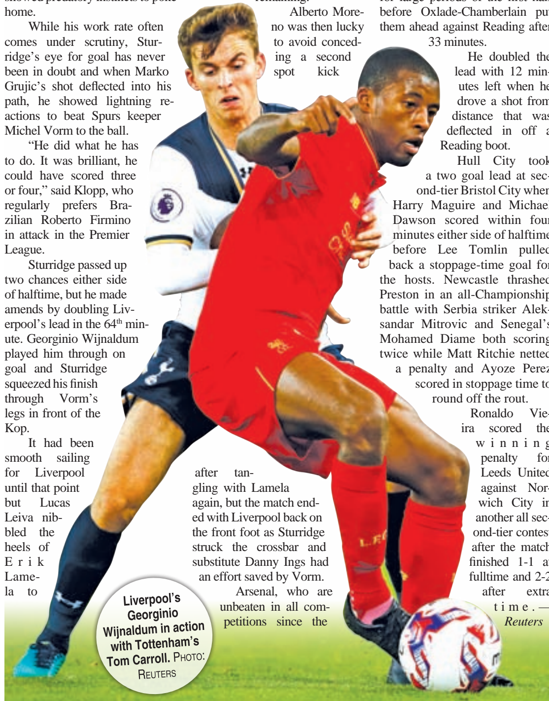
Liverpool's Georginio Wijnaldum in action with Tottenham's Tom Carroll.

Arsenal, who are unbeaten in all competitions since the