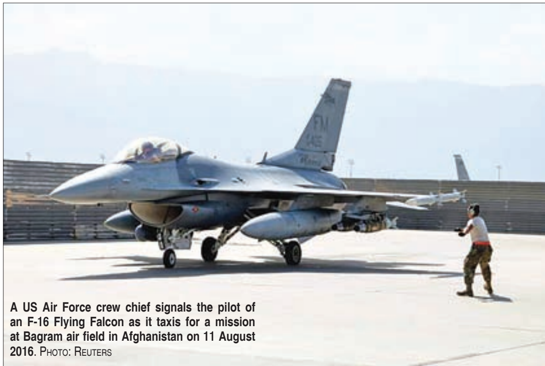
A US Air Force crew chief signals the pilot of an F-16 Flying Falcon as it taxis for a mission at Bagram air field in Afghanistan on 11 August 2016.

Top American military commanders in Afghanistan successfully pressed Obama to reverse earlier restrictions on the use of air strikes, clearing the way for a spike in attacks on Islamic State