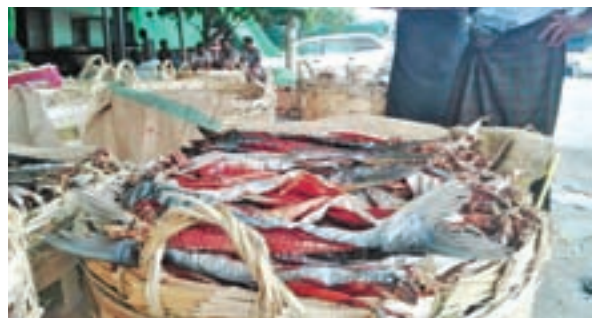
Dried fish displayed by the vendors.

Despite the low price of dried fish in the domestic market, the export price of the various dried fish has remained unchanged. Over 100,000 viss of shrimp paste is exported monthly to Thailand, it is learnt from the association.—200