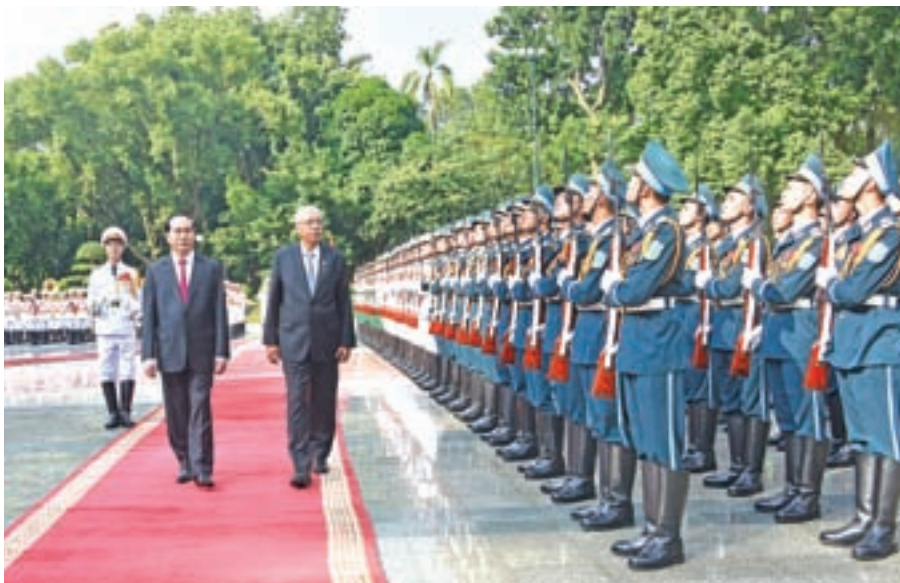
President U Htin Kyaw inspects the guard of honour in Hanoi.

At the meeting, President U Htin Kyaw and members, Vietnamese President Mr Tran Dai Quang and ministers and high-ranking officials, discussed promotion of bilateral relations, increased cooperation in economic and investment sectors and promotion of relations between the two countries' armies. A joint communiqué was released about promotion of bilateral relations, economic cooperation, promotion in invest-