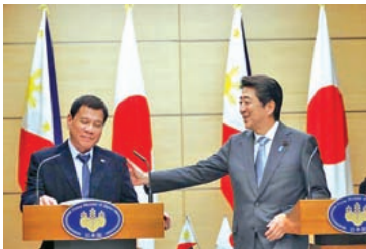
Philippine President Rodrigo Duterte (L) and Japan's Prime Minister Shinzo Abe attend a joint press conference at the prime minister's office in Tokyo, Japan, on 26 October 2016.

The volatile Philippine leader's visit to Japan comes amid jitters about his foreign policy goals after weeks of verbal attacks on ally the United States and overtures toward China. Duterte last week announced in China his "separation" from the United States, but then insisted ties were not being severed and that he was merely pursuing an independent foreign policy. His perplexing comments pose a headache for Japanese Prime Minister Shinzo Abe, who has tightened ties with Washington while building closer security relations with Manila and other Southeast Asian countries as a counter-weight to a rising China. "You know I went to China for a visit. And I would like to assure you that all there was, was economics. We did not talk about arms. We avoided talking about alliances," he told an audience of Japanese businessmen.