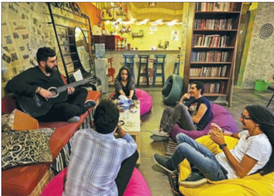
Visitors play music and talk together in the bookshop where the new ‘scream room’ is found, in Cairo, Egypt, on 23 October 2016.