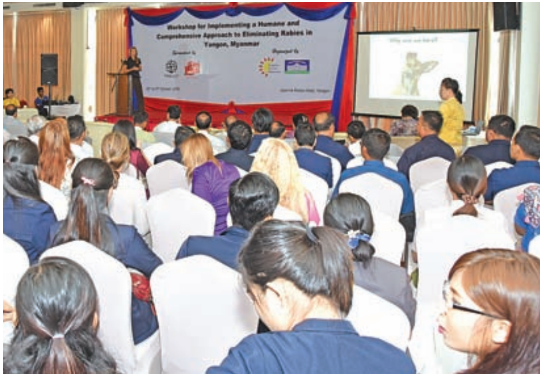
Workshop for eliminating rabies in progress.

FOLLOWING the successful achievement in fighting rabies in Lanmadaw Township, the CNVR (Catch, Neuter, Vaccination, Return) programme will be carried out in Sangyaung and Mingala Taungnyunt townships, according to the Yangon City Development Committee.