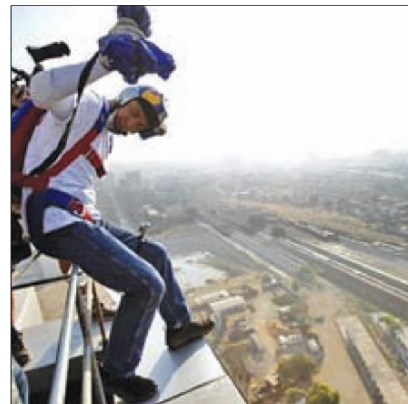
Russian base jumper Valery Rozov prepares to leap off a 29 storey-high (116 m) building, in attempt to express his solidarity with Pakistan for fighting against the Islamist militancy, in Pakistan’s southern city of Karachi on 1 November 2009.