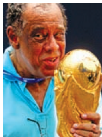
Former Brazilian soccer captain Carlos Alberto Torres holds the 2014 FIFA World Cup Brazil trophy on 21 November 2010.