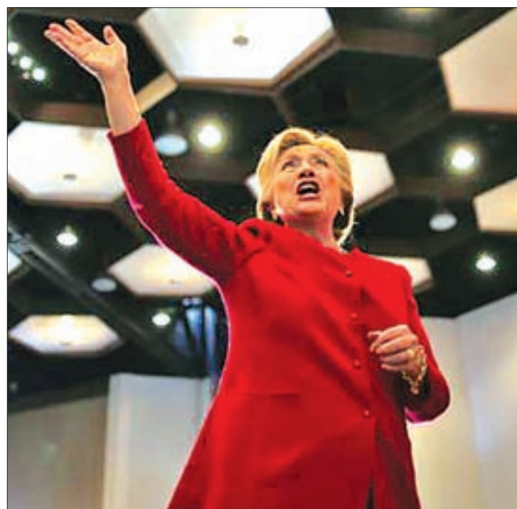
US Democratic presidential candidate Hillary Clinton waves as she leaves a rally in South Broward Area at Broward College-North Campus in Coconut Creek, Florida, US, on 25 October 2016.

But with polls showing Trump trailing Clinton, Trump has asked his campaign to cut back on work identifying candidates for