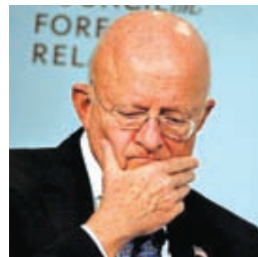
James Clapper, Director of National Intelligence speaks at the Council on Foreign Relations in New York City, US, on 25 October 2016.

Clapper said he got a good taste of how the world looks from North Korea's viewpoint when he went to Pyongyang on a mission in 2014 to secure the release of