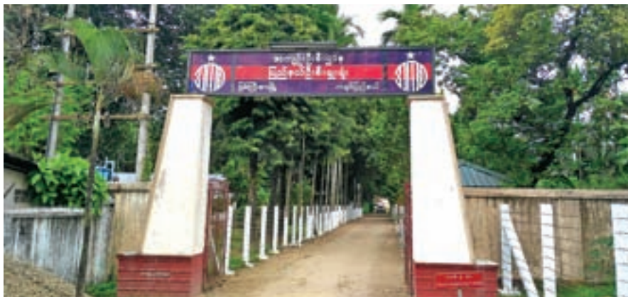
The correctional facility of Myitkyina, Kachin State.

That is why the prison authorities decided to move 400 inmates, including 100 women, to Monywa Correctional Facility in Sagaing Region in upper Myanmar. The authorities organised the transfer of 300 inmates between 17 and 23 October, with plans to move an additional 100 prisoners on 27 October, said U Hla Win