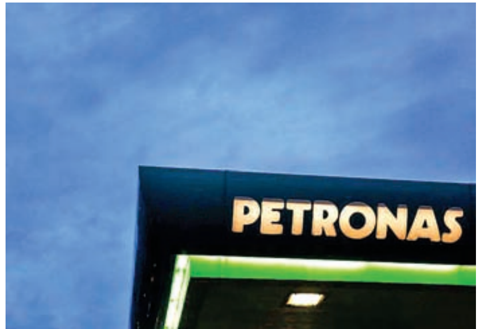
A logo of a Petronas fuel station is seen against a darkening sky in Kuala Lumpur, Malaysia on 10 February 2016.

The Gitanyow and Gitwiltgoots aboriginal