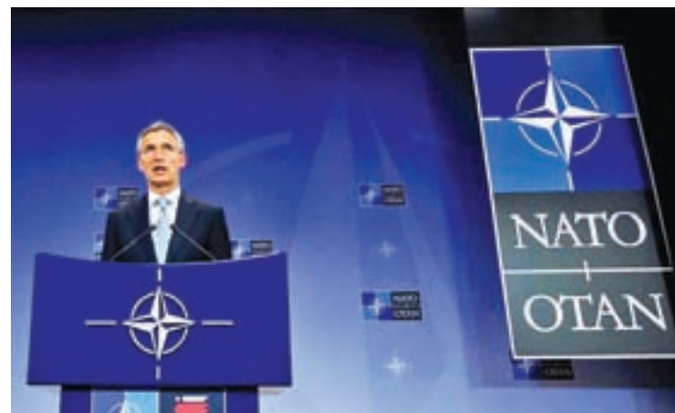
NATO Secretary-General Jens Stoltenberg.

“There is no danger to health. The radioactive dosage they have received is low,” he said, adding the crew had not received hospital treatment.—Reuters