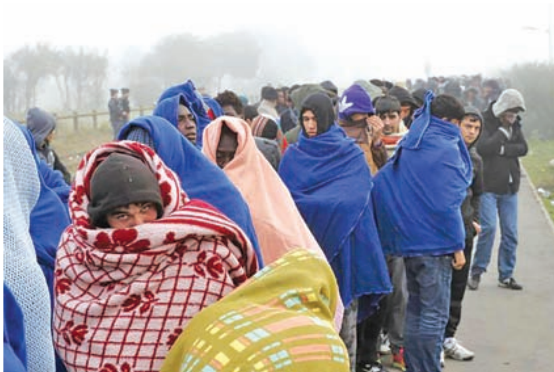
Migrants queue on the third day of their evacuation and transfer to reception centers in France, as part of the dismantlement of the camp called the 'Jungle' in Calais, France, on 26 October 2016.

CALAIS, (France) — The “Jungle” migrant camp near Calais woke up to a third day of a government operation to empty and clear it on Wednesday following a night of ritual tent and shelter-burning and some gas-bottle explosions.