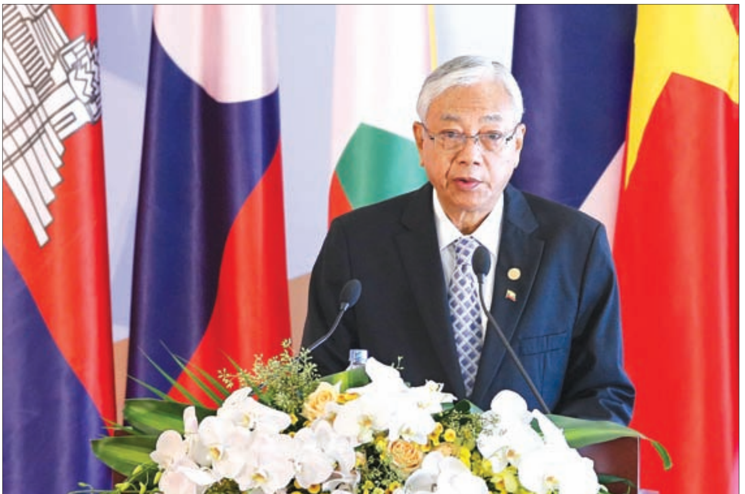
President U Htin Kyaw delivers a speech at the opening ceremony of the 8 th Cambodia-Laos-Myanmar-Viet Nam Summit (CLMV-8) and the 7 th Ayeyawady-Chao Phraya-Mekong Economic Cooperation Strategy Summit (ACMECS-7), in Hanoi, Viet Nam on 26 October 2016.

At the opening ceremony, Vietnamese Prime Minister Nguyen Xuan Phuc, Cambodian Prime Minister Mr Hun Sen and Prime Minister of Democratic People's Republic of Laos Mr Thongloun Sisoulith also gave welcoming speeches. See page 3 >>