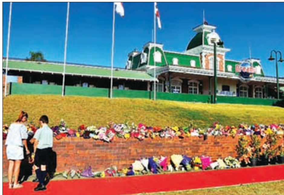
Members of the public leave floral tributes outside the main entrance to Dreamworld located on the Gold Coast, Australia, on 26 October 2016 after Tuesday's tragedy that saw four people killed on the Thunder River Rapids Ride at Australia's biggest theme park.

"There is a very persistent and long process of representation by my un-