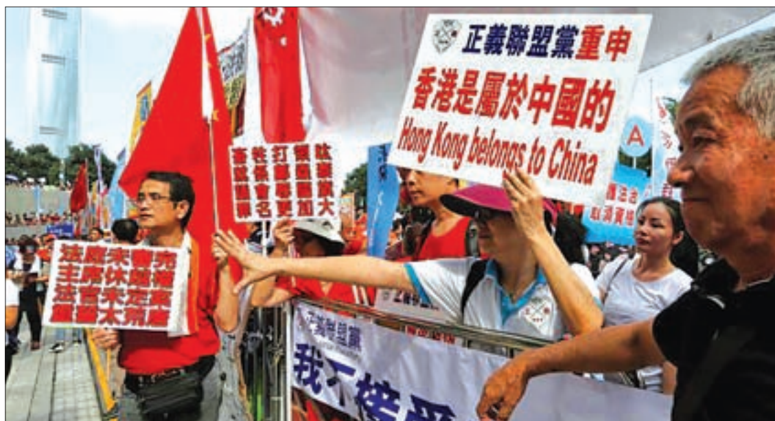
Pro-China protesters demonstrate outside the Legislative Council in Hong Kong, China, on 26 October 2016.

two and vacate their seats. Chief Executive Leung Chun-ying's decision to challenge the legislature via the judiciary demonstrates the steps the government is willing to take to quash advocacy for Hong Kong independence from China. —Reuters