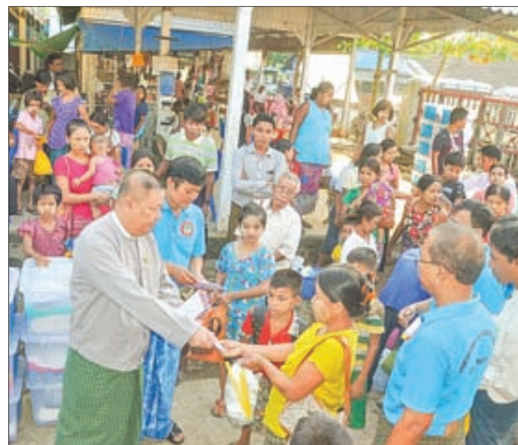
Displaced persons receive cash assistance from authorities in Sittway before they return home.

DISPLACED people who took refuge in camps in Sittway, Buthidaung and Maungdaw are returning home as their native place has become stable, according to the Rakhine State government.