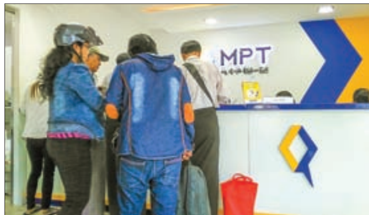
MPT 3G SIM Card users being seen at the MPT Sale Division in Mandalay.

In Southeast Asia and Oceania in 2015, only 5 per cent of all mobile subscriptions were 4G – but the figure is expected to increase to more than 40 per cent by 2021, according to the Ericsson Mobility Report 2016. Telecoms competitors Ooredoo and Telenor launched 4G networks earlier this year. — Thiha Ko Ko (Mandalay)