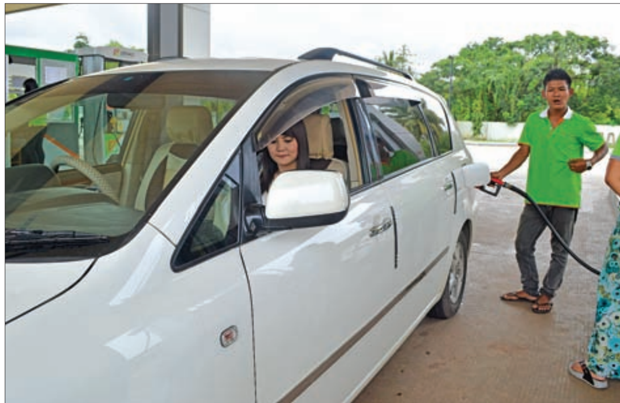
A worker fills a car with fuel at a filling station in Yangon on 26 August.

Those who are running the vehicles with diesel are happy with the lower price. However, the owners of the cars which use octane petrol are not satisfied with a high price.—Khin Saing