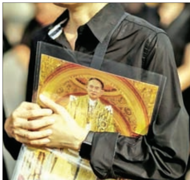
A mourner holds up a picture of Thailand's late King Bhumibol Adulyadej as she waits in line to offer condolences at the Grand Palace in Bangkok, Thailand, on 18 October 2016.

National police chief Jakthip Chaijinda said police were investigating 20 cases of royal insult, or lese-majeste, since the