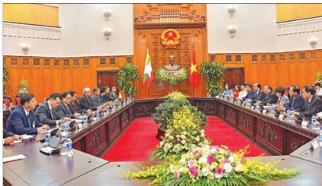
President U Htin Kyaw holds talks with Vietnamese Premier, discussing bilateral cooperation in the agricultural and fishery sectors and expansion of air flights.