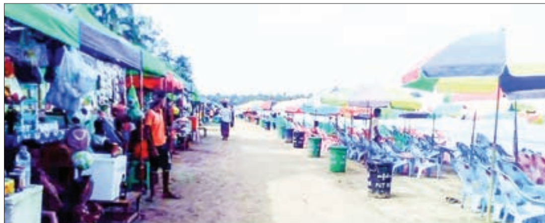
Stalls occupy the walking of the beach.

AUTHORITIES will not allow vendors to sell any goods along the walkway by the Chaungtha Beach beginning from November 1, according to officials.