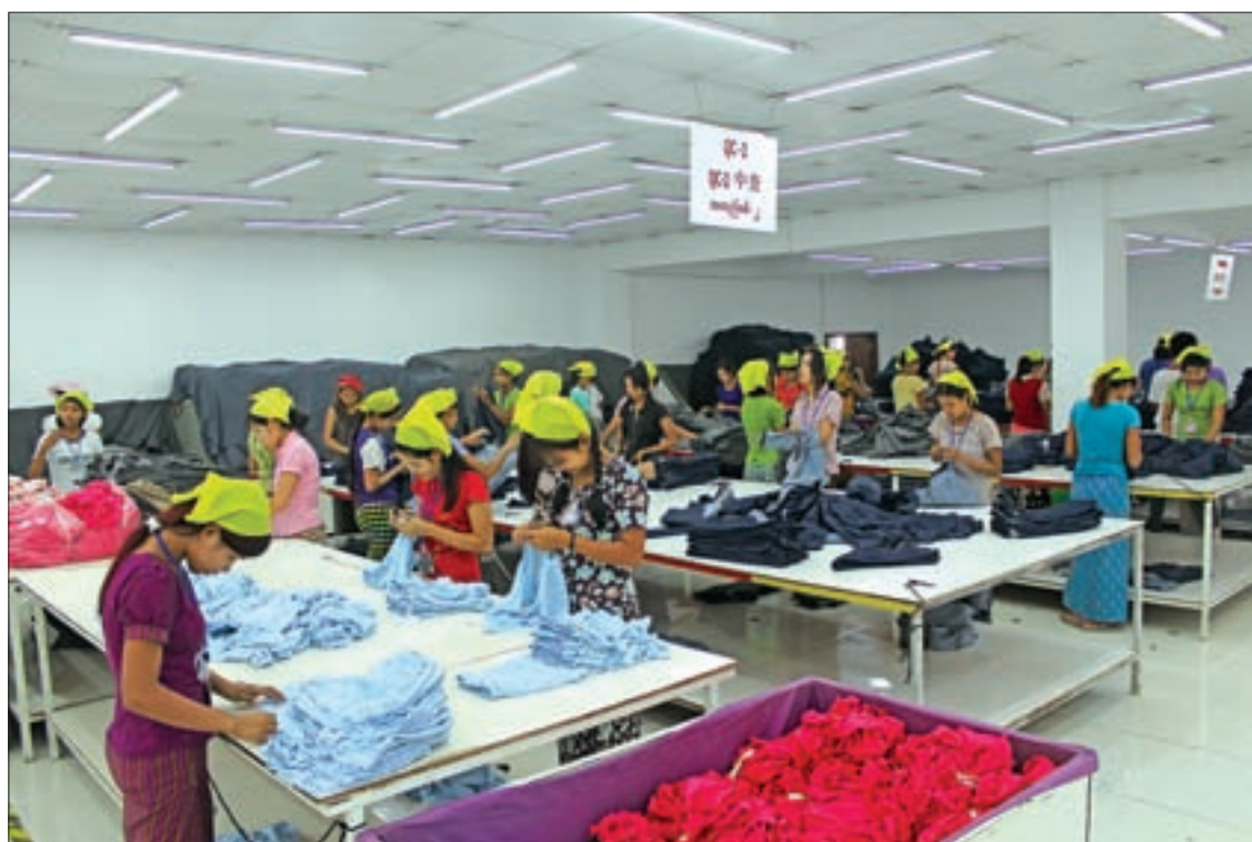
Workers are seen at the production line of a garment factory in Yangon.

Myanmar has the potential to follow the same path of inclusive growth as other high performing countries in the region, the