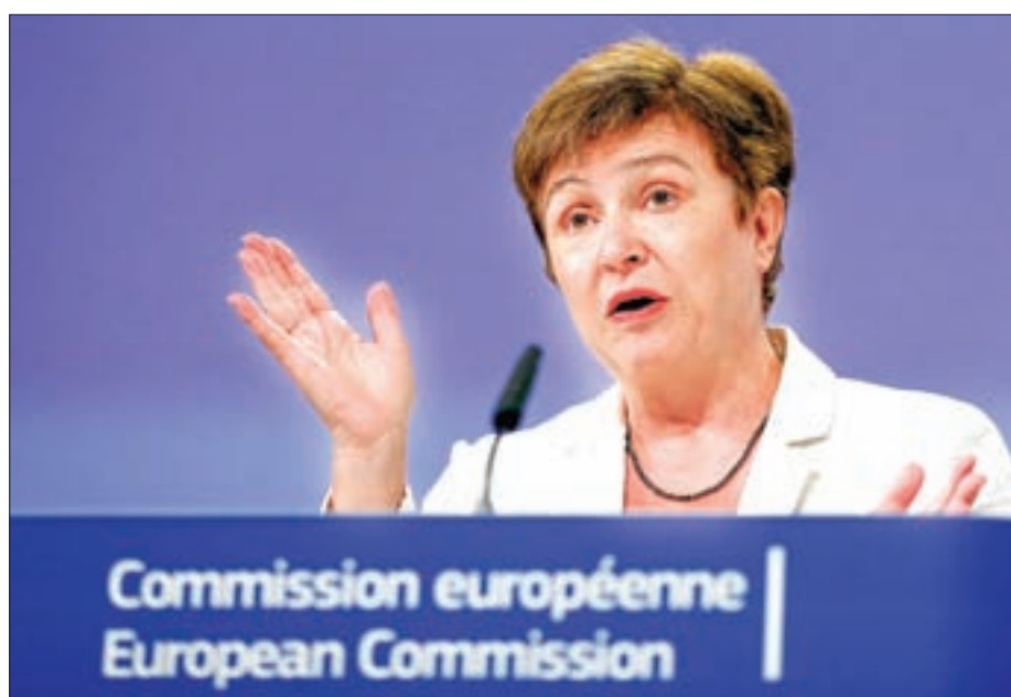
European Budget and Human Resources Commissioner Kristalina Georgieva holds a news conference after a meeting of the EU executive body in Brussels, Belgium, on 27 July 2016.

Foreign Minister Daniel Mitov said Bulgaria