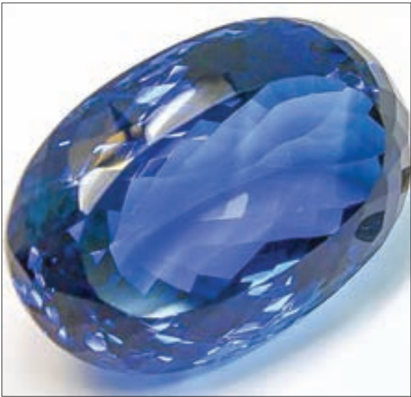
The largest known blue topaz stone, owned by philanthropist Maurice Ostro, is displayed to media at the Natural History Museum in London, Britain, on 27 September 2016.