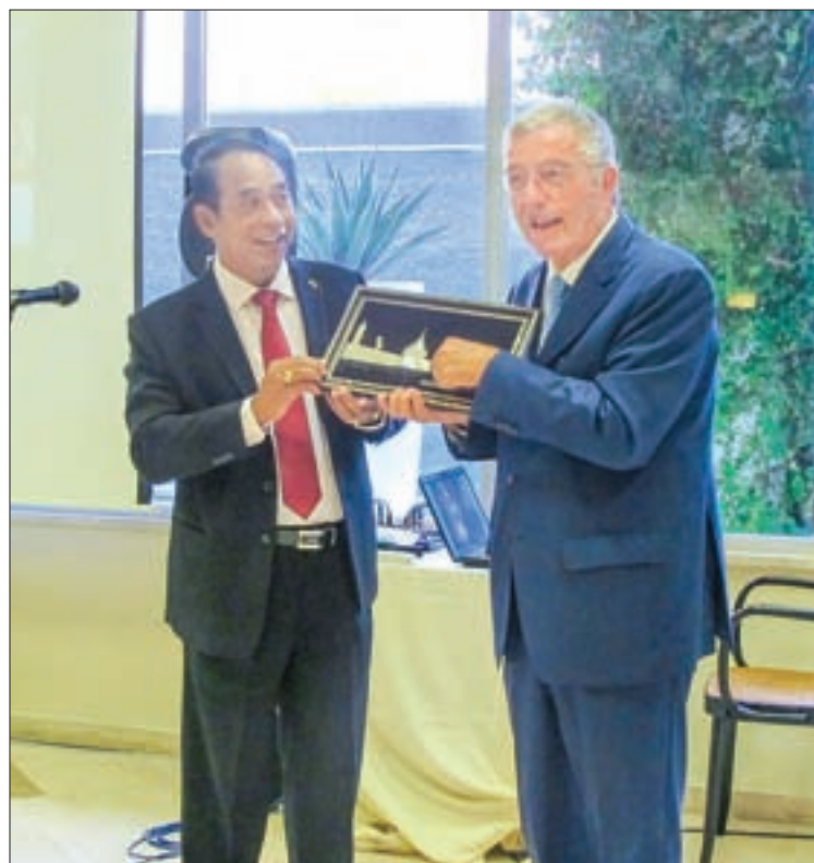
H.E Ambassador U Myint naung giving a sonvemir to the Anzio Mayor.

started the visit of Anzio from Villa Spigarelli, a privately owned villa not open to the public which seats on the fantastic ruins of a Roman villa of the second century before Christ. The ambassador U Myint Naung completed the visit at the city of Anzio on Sunday 25 visiting the Villa where Emperor Nero was born, the Archaeological Museum and the Museum of the Beach Head of World War II and the Anzio port very famous for fishing and leisure activities.