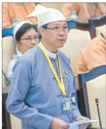
Dr Myo Thein Gyi. PHOTO: MNA