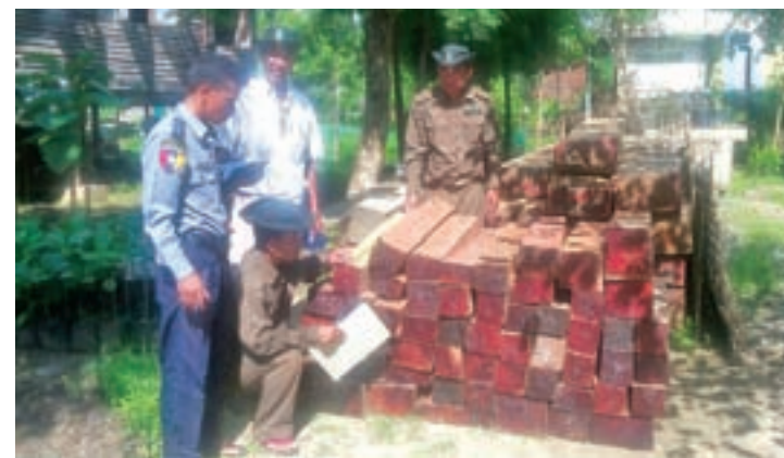
50 illegal logs confiscated near Myinmu toll gate being inspected.

with Gadon, 38, on board. Upon searching the vehicle police discovered 50 illegal logs weighing 0.6762 tonnes. When interrogated, the driver said that the vehicle belonged to one U Myint Lwin. The two suspects are being charged under section 6(1) of the Public Property Protection Act by police.— Ko Ko Naing