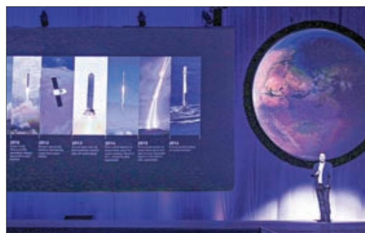
SpaceX CEO Elon Musk unveils his plans to colonize Mars during the International Astronautical Congress in Guadalajara, Mexico, on 27 September 2016.

Mars is typically 140 million miles (225 million km) from Earth and landing the first humans there, after what traditionally has been a six- to nine-month journey, is an extremely ambitious goal. Musk expects his rocket to be able to cut