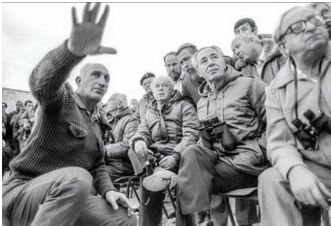
Israel's Deputy Prime Minister Yitzhak Navon, Prime Minister Shimon Peres (2 nd R), Defence Minister Yitzhak Rabin (3 rd R) are briefed by army Chief of Staff Moshe Levy (L) during a large scale military maneuver in Israel in this 4 December, 1985 file photo released by the Israeli Government Press Office (GPO).

He shared the 1994 Nobel Peace Prize with Israel's late prime minister Yitzhak Rabin and Palestinian leader Yasser Arafat for a 1993 accord that they and