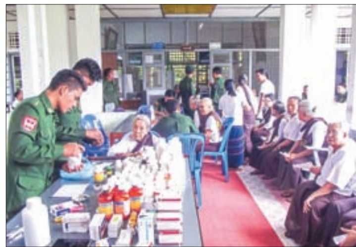
A medical team giving medical treatment to the old persons and volunteers of Taungwaing home for the aged in Mawlamyine.