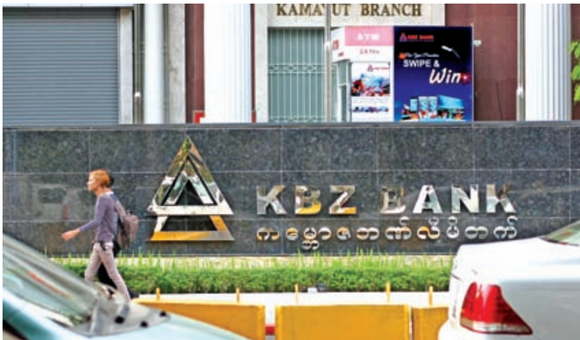
People walk past KBZ bank logo in Kamyut, Yangon.