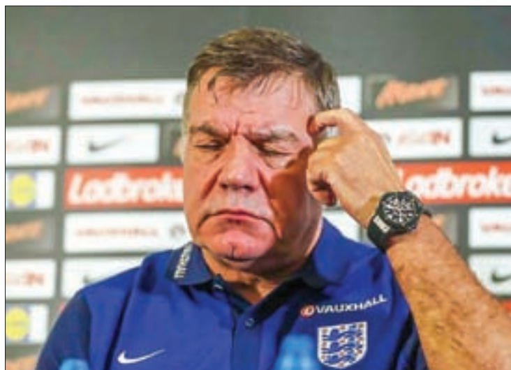
Sam Allardyce.

"Entrapment has won on this occasion and I have to accept that. I've apologised to (the Football