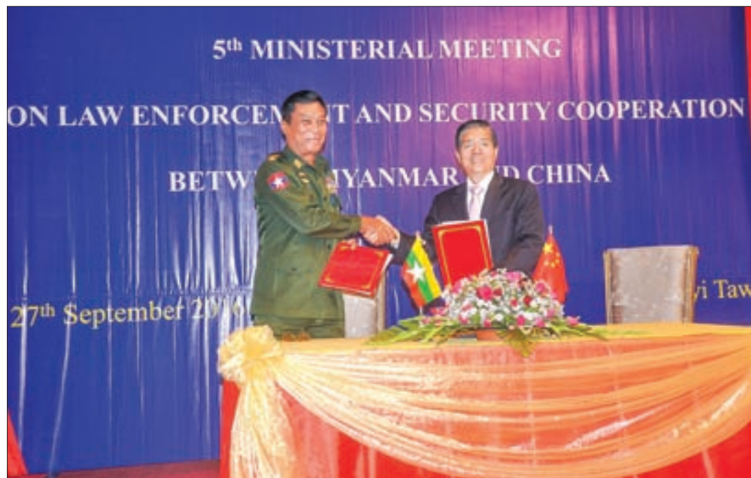
Union Minister for Home Affairs Lt-Gen Kyaw Swe shakes hands with Chinese Minister of Public Security Mr. Guo Shengkun at the fifth Myanmar-China Ministerial Meeting.