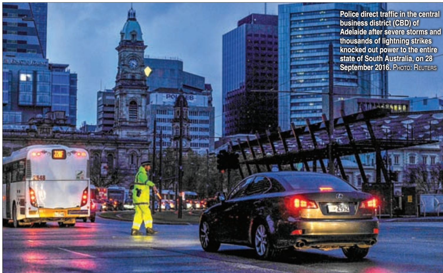
Police direct traffic in the central business district (CBD) of Adelaide after severe storms and thousands of lightning strikes knocked out power to the entire state of South Australia, on 28 September 2016.