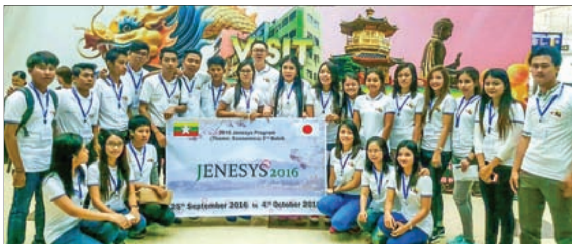
Myanmar young entrepreneurs delegation left for Japan to participate in the 2nd batch of the 2016-JENESYS program (theme-Economics) from 25th September to 4th October.