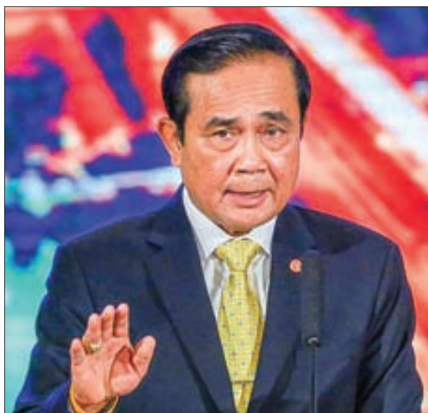
Thailand's Prime Minister Prayuth Chan-ocha speaks during an announcement the junta's two year accomplishments at Government House in Bangkok, Thailand, on 15 September 2016.

into such allegations have shown no indication of torture, I have seen no indication of torture and the Thai people have seen no indication of torture," Sansern told Reuters.