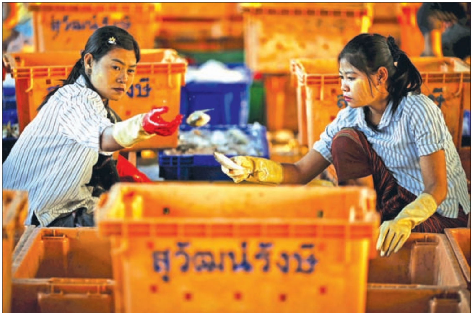
Workers from Myanmar sort fish at a port in the southern province of Pattani, Thailand.

on to say that punitive measures were taken against 20 agencies, including termination and suspension of licenses.