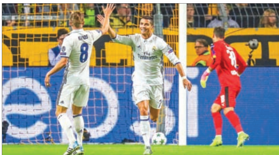
Real Madrid's Toni Kroos and Cristiano Ronaldo react after scoring during UEFA Champions League group stage, Group F at Signal Iduna Park stadium, Dortmund, Germany on 27 September.

"We suffered a little because Dortmund pressed us a lot, although we knew we were coming to a difficult ground against a difficult opponent.