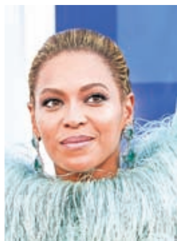
Beyonce and Justin Bieber.