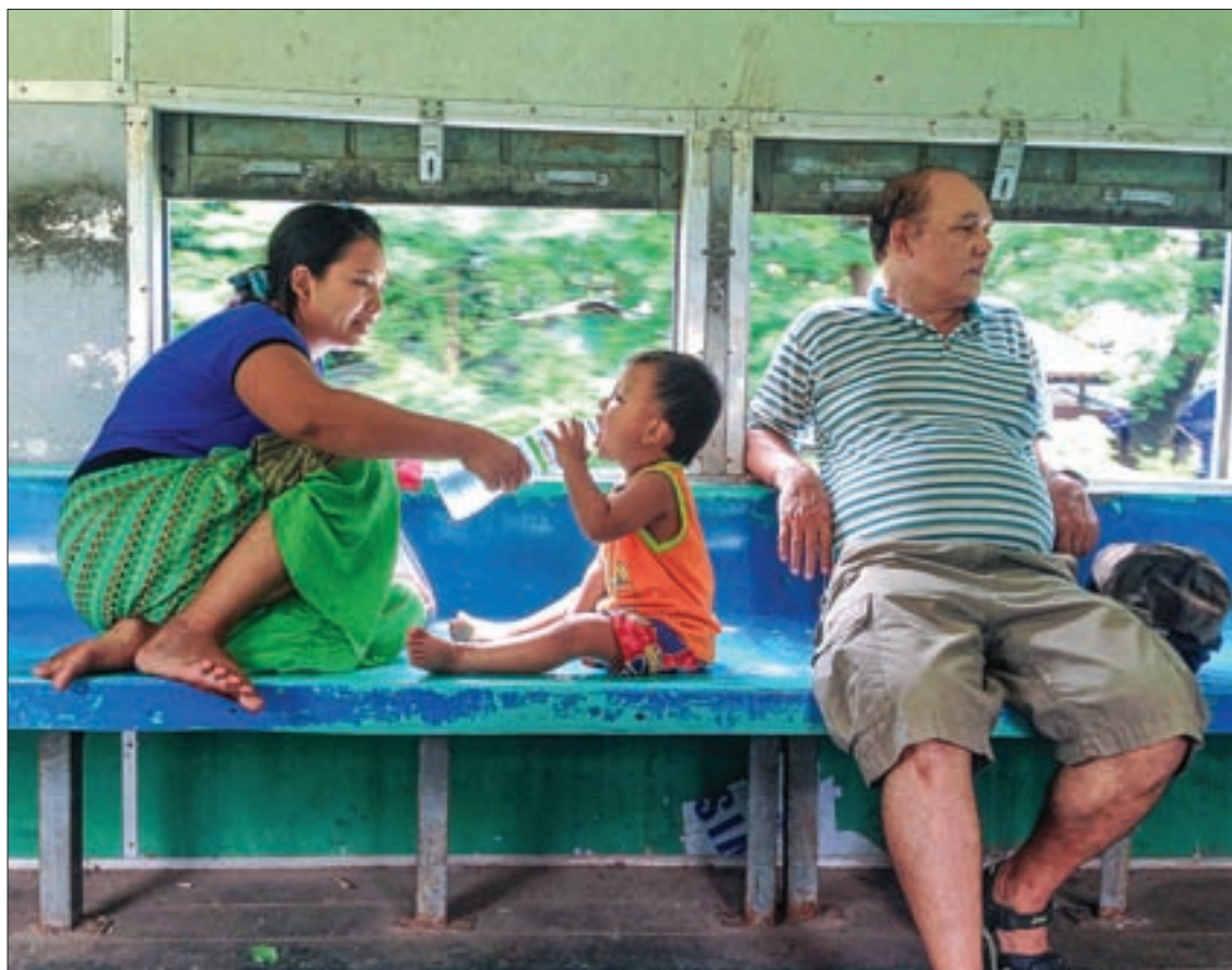
Passengers seen in a coach of a circular train.

ACCORDING to an official from Myanma Railway Division 7, the numbers of passengers increases when the Yangon circular train runs on time on holidays.