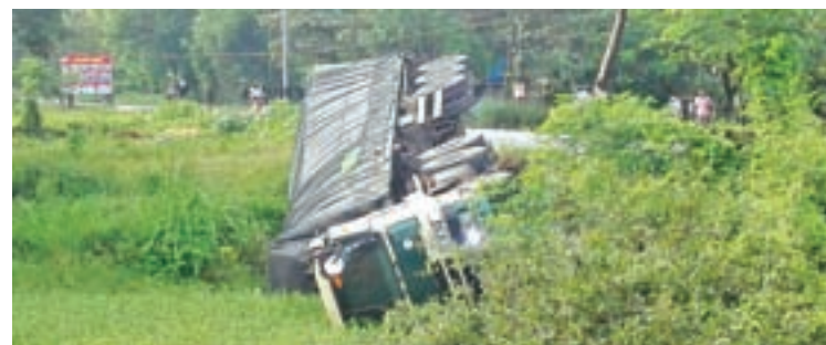
Vehicle seen after plunging down into a drain.

Police have opened a case presuming the driver guilty of careless driving.— Nay Lin (Nyaungglaybin)