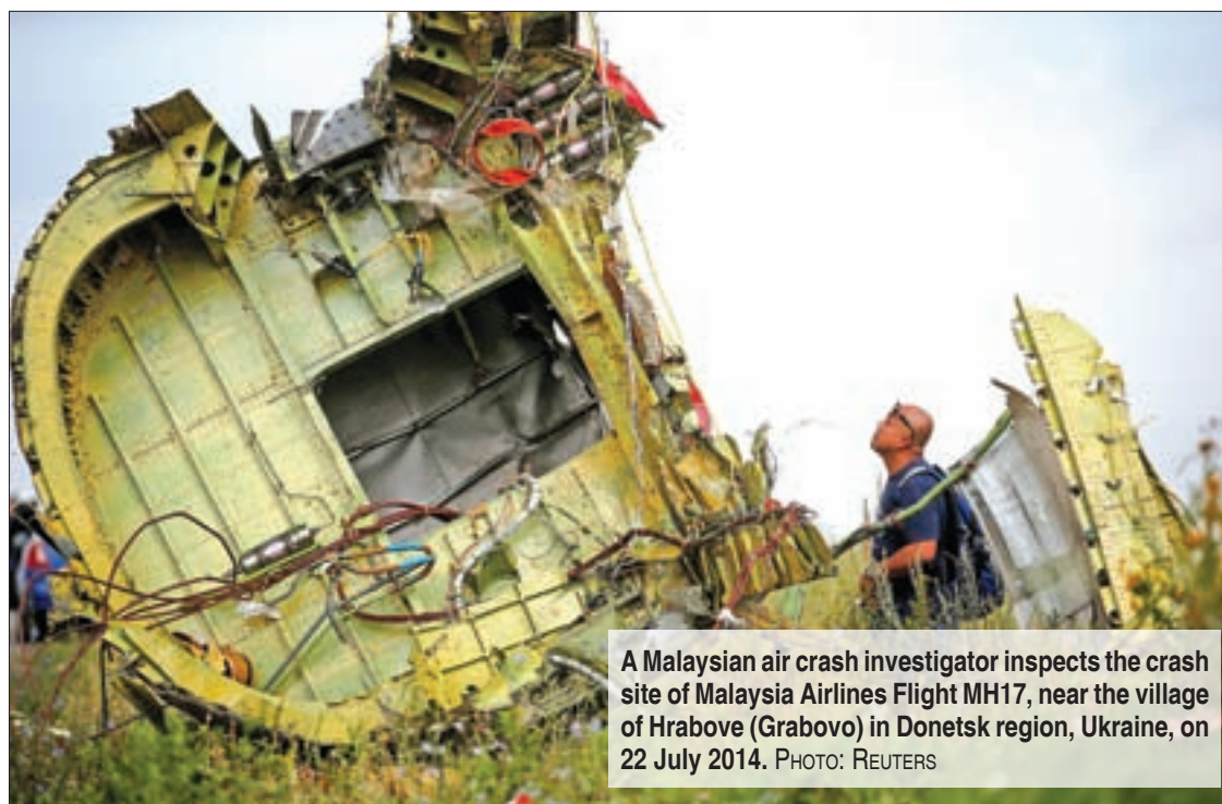
A Malaysian air crash investigator inspects the crash site of Malaysia Airlines Flight MH17, near the village of Hrabove (Grabovo) in Donetsk region, Ukraine, on 22 July 2014.

They told a news conference in the central Dutch city of Nieuwegein that the investigative team had identified 100 people who were described as being of interest to them but had not yet been formally identified individual sus-