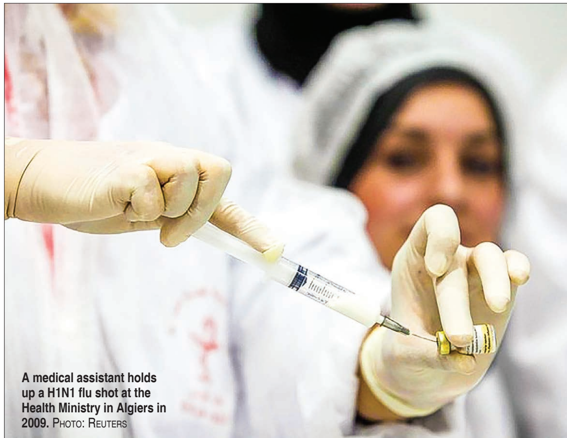
A medical assistant holds up a H1N1 flu shot at the Health Ministry in Algiers in 2009.