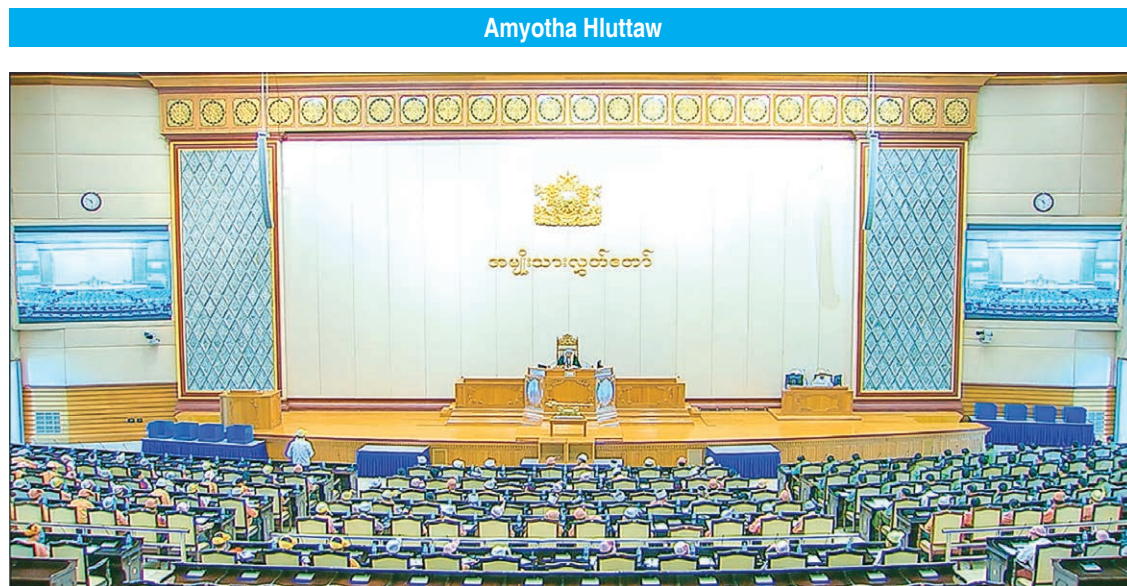
Amyotha Hluttaw being convened in Nay Pyi Taw.

So, the dictionary will not be published at the moment, said the