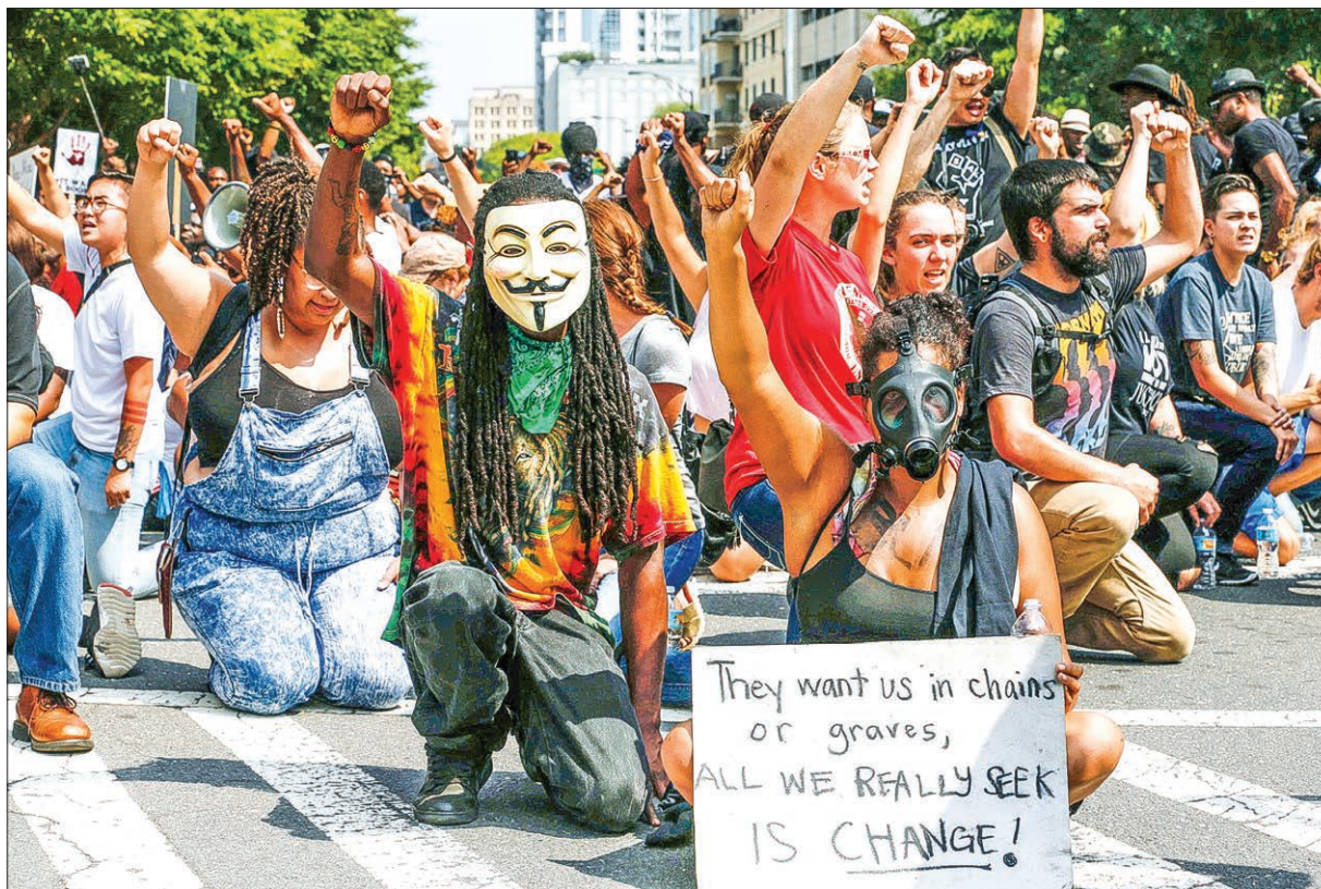
Marchers rally outside Bank of America stadium during an NFL game to protest the police shooting of Keith Scott in Charlotte, North Carolina, US on 25 September 2016.

bicycles, the marchers went through the centre of Charlotte and out into residential neighbourhoods on Sunday. The city lifted a midnight curfew that had been in effect, though irregularly enforced, for three days.