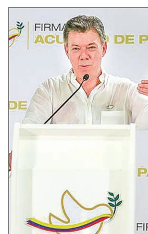
Colombia's President Juan Manuel Santos gestures during a news conference in Cartagena, Colombia, on 25 September 2016.

Guests include UN head Ban Ki-moon, Cuban President Raul Castro,