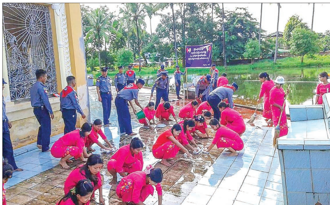
Family members of police officers help clean up the historic Myatsawnyinaung Pagoda in Taungoo.

of No 1 Security Police Force, led police and their families to carry out sanitation work in the compound of the ancient historic Myatsawnyinaung Pagoda in Taungoo. —017