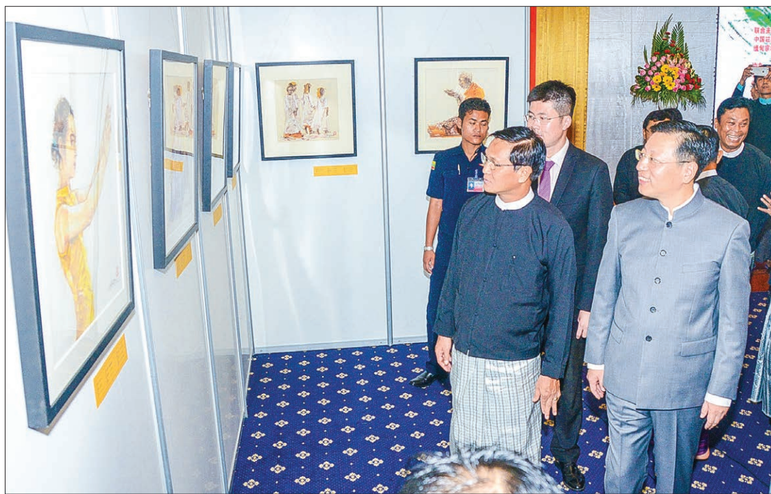
Vice President U Henry Van Thio visits the 67th Anniversary of the Founding of the People's Republic of China at the Myanmar National Convention Center-2 in Nay Pyi Taw.