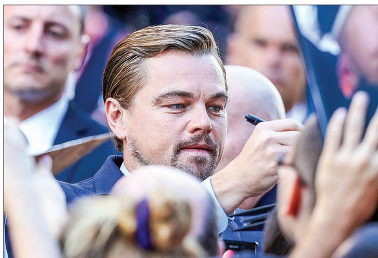
Actor Leonardo DiCaprio is surrounded by fans as he arrives for the premier of the film "Before the Flood" at TIFF the Toronto International Film Festival in Toronto, on 9 September 2016.

In limited release, "The Dressmaker," an Australian comedy with Kate Winslet, opened to $180,522 in 38 locations. Broad Green is distributing the film on behalf of Amazon Studios. Disney's "Queen of Katwe," an inspirational drama about a chess prodigy from Uganda, debuted in 55 theaters to $305,000. It will expand next weekend to roughly 1,500 locations.—Reuters