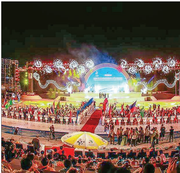
Photo taken on 24 September, 2016 shows the opening ceremony of the 5 th Asian Beach Games in Viet Nam’s central Da Nang City. The 5 th Asian Beach Games kicked off in Viet Nam’s central Da Nang City on Saturday evening, with the participation of nearly 10,000 people.