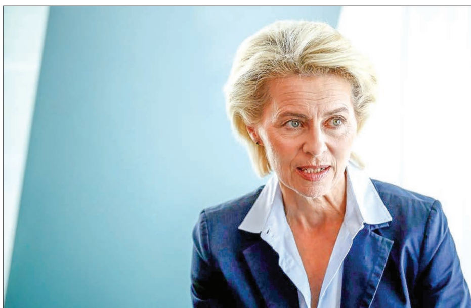
Germany's Defence Minister Ursula von der Leyen attends a cabinet meeting at the Chancellery in Berlin, Germany, on 8 June 2016.

However, von der Leyen told Reuters in an interview that she expected Britain to "make good its promise that it will not hinder important European