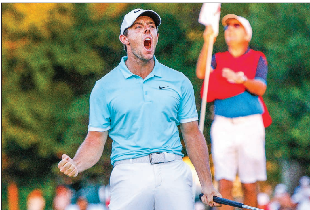
Rory McIlroy celebrates his win on the final playoff hole of the Tour Championship at East Lake Golf Club in Atlanta, GA, USA on 25 September 2016.

McIlroy then squandered a golden chance to win it at the first extra hole when he missed a six-footer. Chappell was eliminated on the first extra hole.