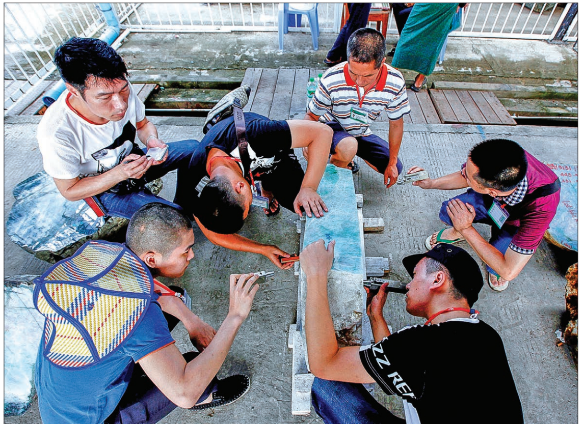
Merchants appraise a jade stone at the 53rd Myanmar Gems Emporium in Nay Pyi Taw.

THE floor prices of gems and jewelry are already set for competitive bidding and open tender system at Myanmar's gems and jewelry emporium which is slated to kick off from 20th to 29th November at Mani Yadana Jade Hall, Nay Pyi Taw, according to an announcement released by Myanmar gems expo committee.