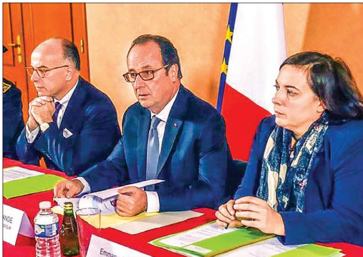
French President Francois Hollande (C), Interior minister Bernard Cazeneuve (L) and housing minister Emmanuelle Cosse (R) attend a meeting at the Sub-Prefecture of Calais as part of his visit to the northern French port which is home to the ‘Jungle’ migrant camp, on 26 September, 2016.

London and Paris have struck agreements on issues such as the recently begun construction of a giant wall on the approach road to Calais port in an attempt to try to stop migrants who attempt daily to board cargo trucks bound for Britain. —Reuters