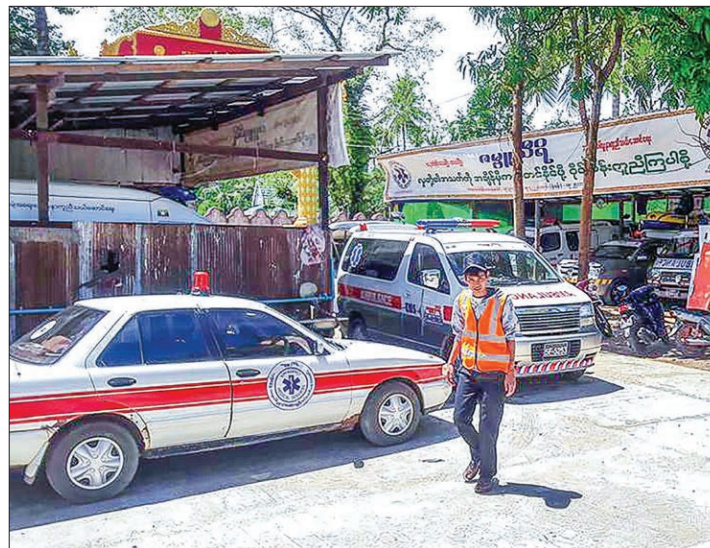
Emergency cars being seen.

URGENTLY needed cars and phones for emergency patients on Dawei district highway, located in Yayphu Township, Dawei district, Tanintharyi Region, will be provided by a local emergency patient organisation.