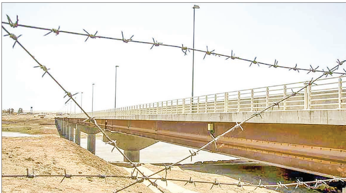
A view of a bridge to Afghanistan across Panj river in Panji Poyon border outpost, south of Dushanbe, Tajikistan, on 31 May, 2008.

China, which according to official statistics sells goods worth $2.5 billion a year to Tajikistan has already built one outpost on the Tajik-Afghan