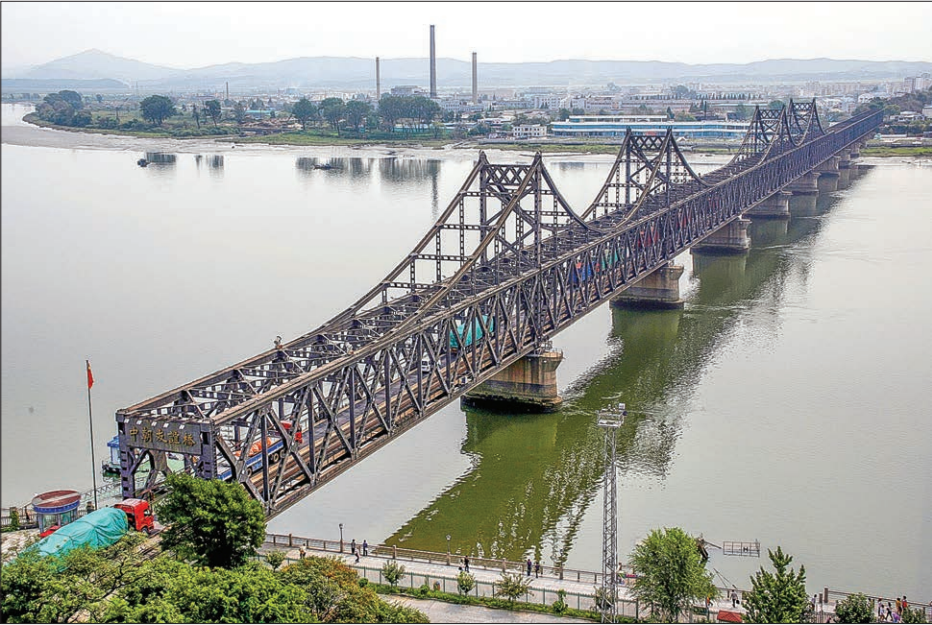
Trucks cross Friendship Bridge from China's Dandong, Liaoning Province, to North Korea's Sinuiju on 12 September 2016.

Angola, for one, has suspended all commercial trade with Pyongyang, banning North Korean companies from operating there since the UN toughened sanctions in March, a South Korean foreign ministry of-