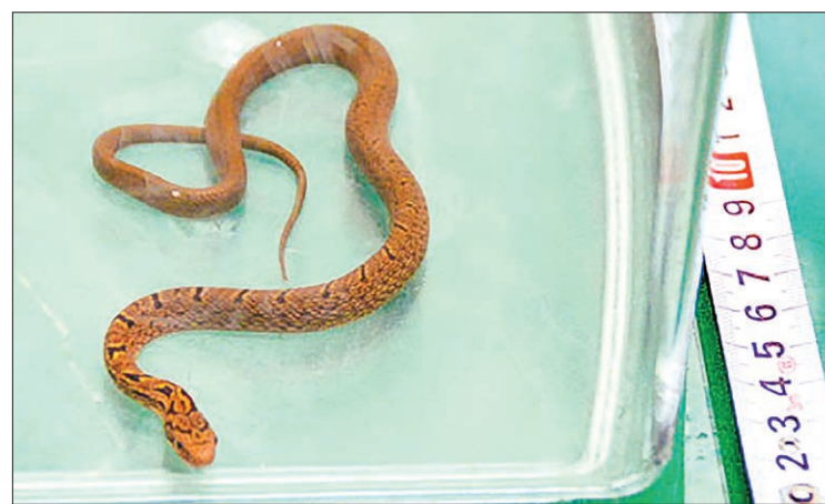
Photo shows a snake, believed to be a kind of python, that was found by a passenger on a Tokaido Shinkansen bullet train traveling from JR Tokyo Station to Hiroshima on 26 September 2016. The 30-centimetre-long snake was captured by police as the train made an emergency stop at JR Hamamatsu Station.

While train staff made announcements inside the shinkansen asking if any passenger had lost a snake, no one came