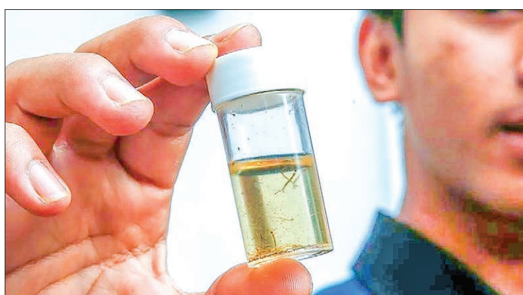
A member of a pest control team shows a container of mosquito larvae that they collected during their inspections at Zika clusters in Singapore on 5 September 2016.

history of travel to an affected country a month prior to the onset of their illness,” the department said in a statement.