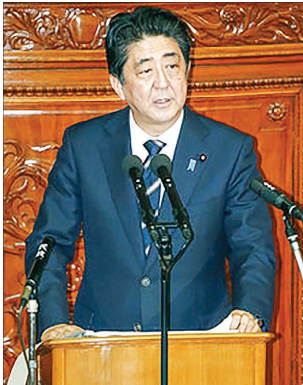
Japanese Prime Minister Shinzo Abe delivers a policy speech in Tokyo on 26 September, 2016, at the outset of a 66-day extraordinary parliamentary session. The session is likely to be dominated by the government's efforts to speedily ratify the Trans-Pacific Partnership trade pact, as well as debate on potential amendments to the Japanese Constitution.

TOKYO — Japan's Diet will convene a 66-day extraordinary session Monday, likely to be dominated by the government's aim for the speedy ratification of the Trans-Pacific Partnership trade pact and debate over potential amendments to the Japanese Constitution.