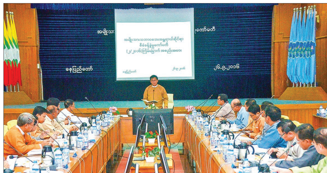
Vice President U Henry Van Thio addresses the meeting of the National Natural Disaster Management Committee in Nay Pyi Taw.

According to the NNDMC, the committee spent K5.4billion on disaster recovery during the period from 1 April to 21 September this year.—Myanmar News Agency