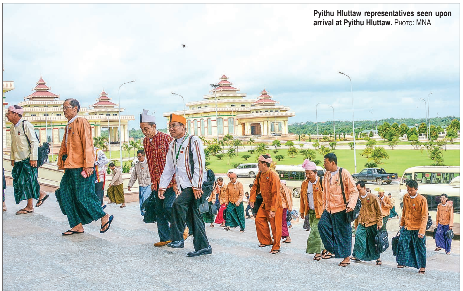
Pyithu Hluttaw representatives seen upon arrival at Pyithu Hluttaw.

PYITHU Hluttaw approved yesterday a proposal by MPs to take punitive action against some members of the Myanmar National Human Rights Commission (MNHRC) for their apparent failure to protect victims of human rights violations.