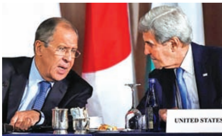
US Secretary of State John Kerry speaks with Russian Foreign Minister Sergei Lavrov during the International Syria Support Group meeting at the Palace Hotel in Manhattan, New York, US, on 22 September 2016.

Instead, he reiterated Moscow's view that Washington was failing to keep its end of a 9 Sep-