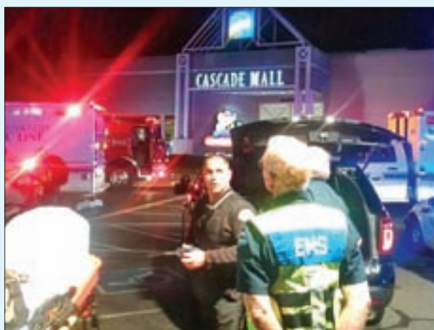
Medics wait to gain access to the Cascade Mall after four people were shot dead in Burlington, Washington, US, on 24 September 2016.

Local and state police officials were not immediately available for comment but were expected to hold a news conference later on Saturday morning. Francis said on Twitter that police and rescue