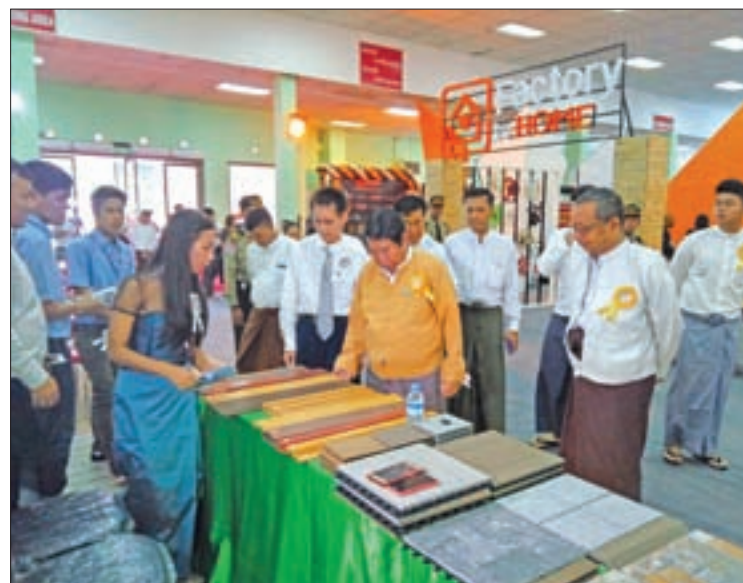
Yangon Mayor U Maung Maung Soe and dignitaries visit the Housing and Building expo 2016 in Yangon.

Modern decoration items for homes are on display at the exhibition which will end today. Experts from the real estate sector and banking sector will give talks during the exhibition daily. — Soe Soe Naing