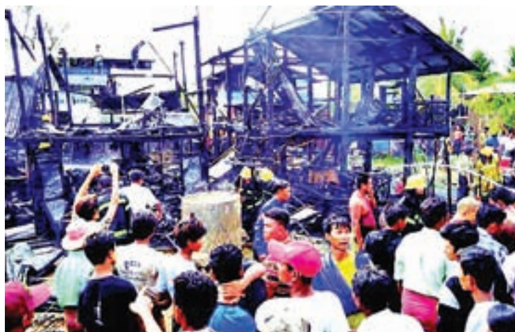
The scene of the outbreak of fire.