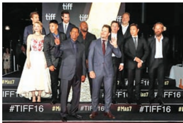
The cast poses on the red carpet for the film “The Magnificent Seven” during the 41st Toronto International Film Festival (TIFF), in Toronto, Canada, on 8 September 2016.

LOS ANGELES — Bringing the American Wild West to life was no easy task, just ask the cast of “The Magnificent Seven,” who endured scorching heat and torrential rain in wool costumes in