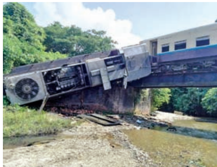
Train is seen after derailed.

Officials are making arrangements to transport the stranded passengers of the derailed train as well as those from other trains which arrived to the derailling