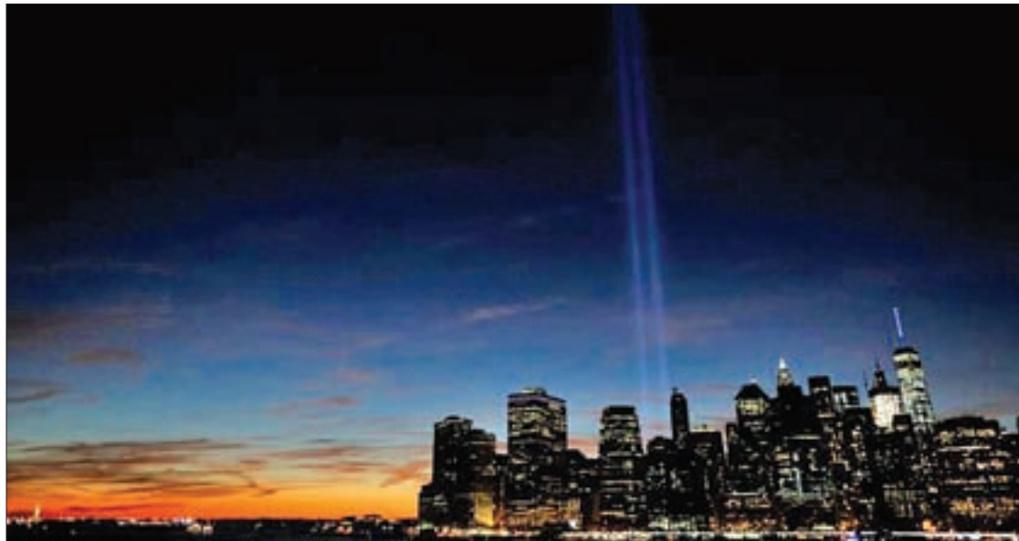
The Tribute in Light shines on the 15 th anniversary of the 9/11 attacks in Manhattan, New York, US, on 11 September, 2016.

WASHINGTON — President Barack Obama on Friday vetoed legislation allowing families of victims of the 11 September attacks to sue Saudi Arabia, which could prompt Congress to overturn his decision with a rare veto override, the first of his presidency.