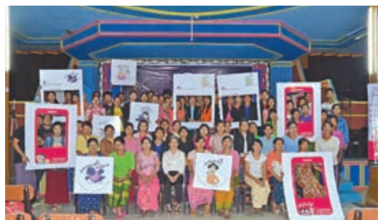
Participants in Myitkyina pose for a group photo.

The app has been developed with funding from UNDP Innovation Fund and the Governments of Sweden and Denmark.