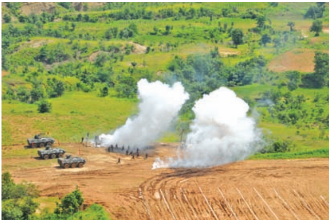
Troops participate in joint manoeuvres of army, air, artillery forces.

JOINT manoeuvres of the Army, air, and artillery forces of the Tatmadaw carried out at the Meiktila Station yesterday, with the presence of Commander-in-Chief of Defence Services Senior General Min Aung Hlaing.