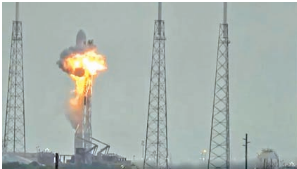
An explosion on the launch site of a SpaceX Falcon 9 rocket is shown in this still image from video in Cape Canaveral, Florida, US, on 1 September 2016.

The company traced that problem to a faulty bracket that was holding a bottle of helium in the oxygen tank of the rocket's upper stage. SpaceX replaced thousands of brackets throughout its fleet and resumed flying six months later. "We have exonerated any connection with last year's ... mishap," SpaceX said