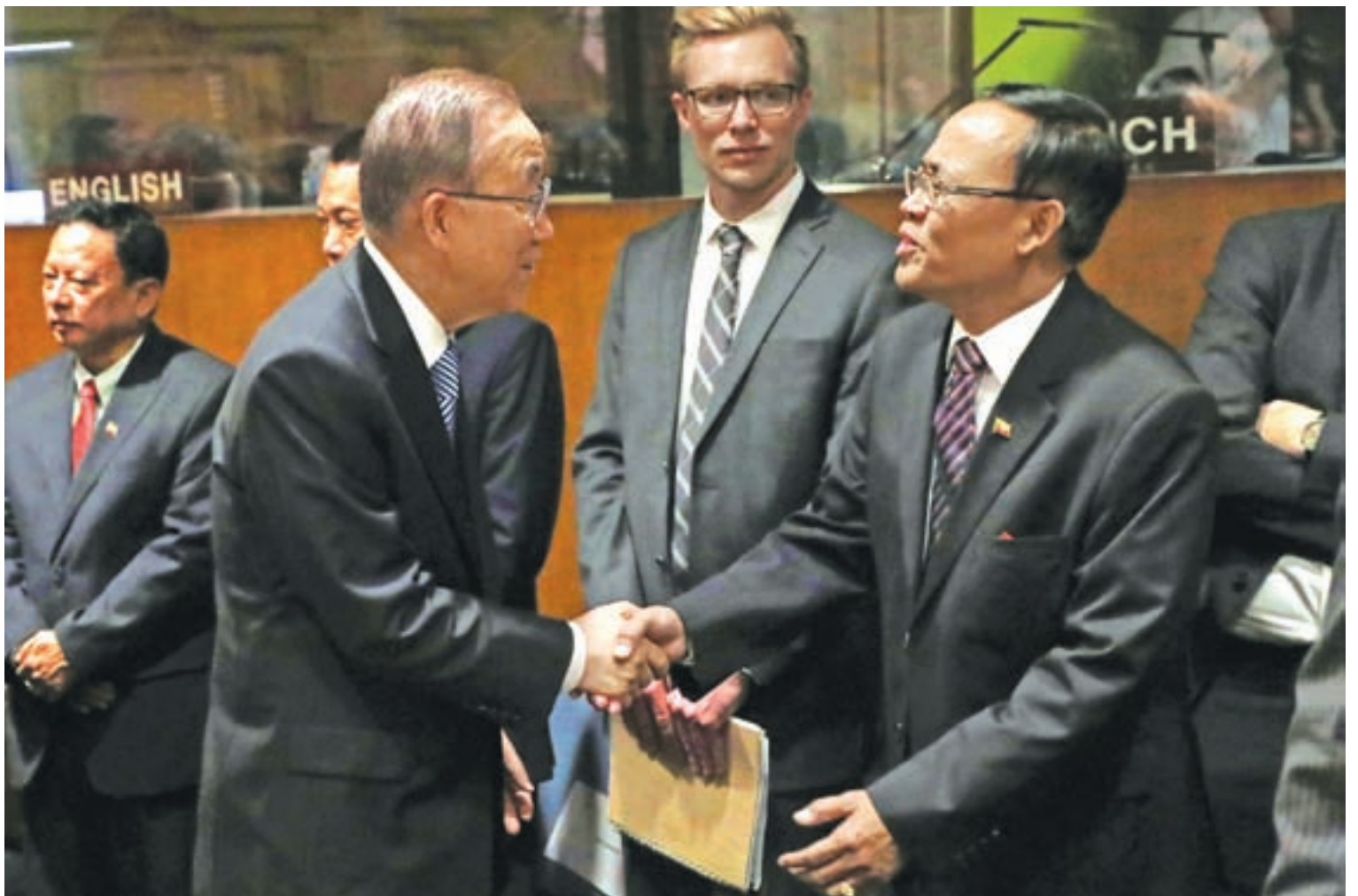
United Nations Secretary-General Ban Ki-moon (L) greets Minister of State for Foreign Affairs U Kyaw Tin before the Fortieth Annual Meeting of Ministers for Foreign Affairs of the Group of 77 ECOSOC at the 71st Session of the United Nations General Assembly in Manhattan, New York, U.S., September 23, 2016.