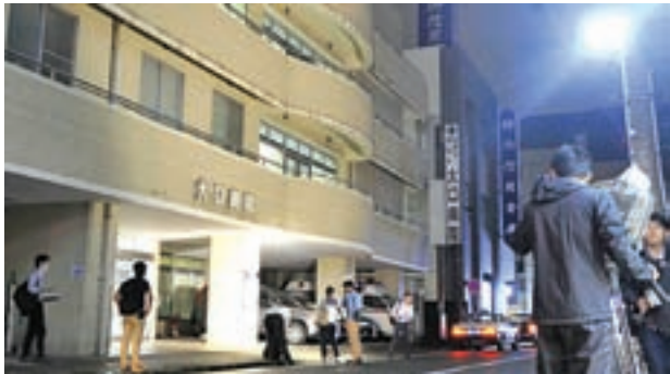
Photo taken on 23 September 2016, shows Oguchi Hospital in Yokohama, near Tokyo, at which an 88-year-old man died from poisoning after a medical drip was attached. Police have launched an investigation into the suspected murder.