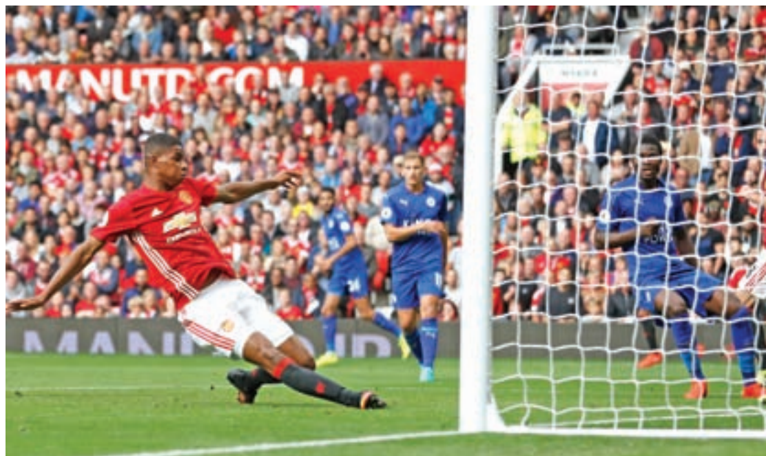
Manchester United's Marcus Rashford scores their third goal during Premier League at Old Trafford, on 24 September 2016.

Claudio Ranieri responded by replacing Jamie Vardy and Riyad Mahrez at halftime with substitute Demarai Gray looping a 20-yard shot over David de Gea for a 59th-minute consolation.— Reuters