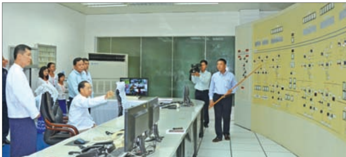
Vice President U Myint Swe hears report during his visit to Paunglaung hydropower project.

Following the meeting, Union Minister Dr Win Myat Aye handed over 22 fibre boats worth K22 million and the Myanmar Pharmaceuticals and Medical Equipment Entrepreneurs Association handed over medicines worth more than K7 million to the Rakhine State Planning, Economic and Finance minister and Rakhine State minister for social affairs.—Sittwe District Information and Public Relations Department