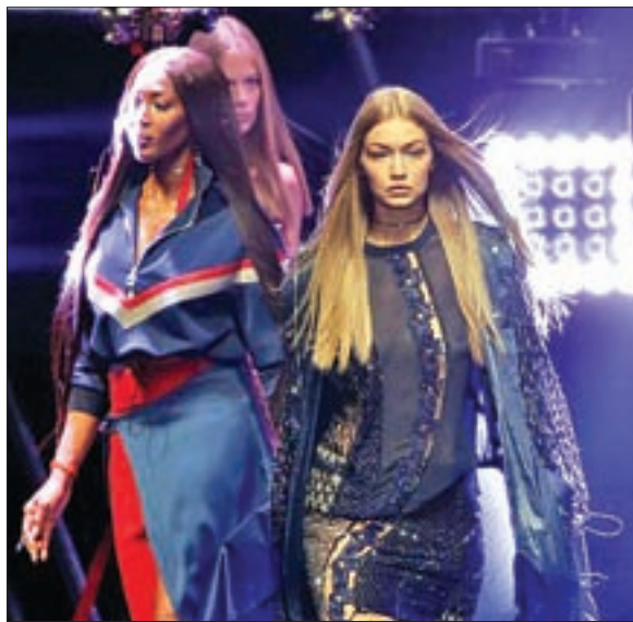
Models Gigi Hadid and Naomi Campbell present creations at the Versace fashion show during Milan Fashion Week Spring/Summer 2017 in Milan, Italy, on 23 September 2016.

For a complete change of style for the evening, Versace woman changed into clear-cut, black designs, with short dresses and skin tights suits, embellished by crystal details