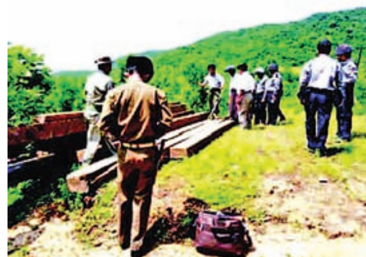
Illegal logs seized being seen.