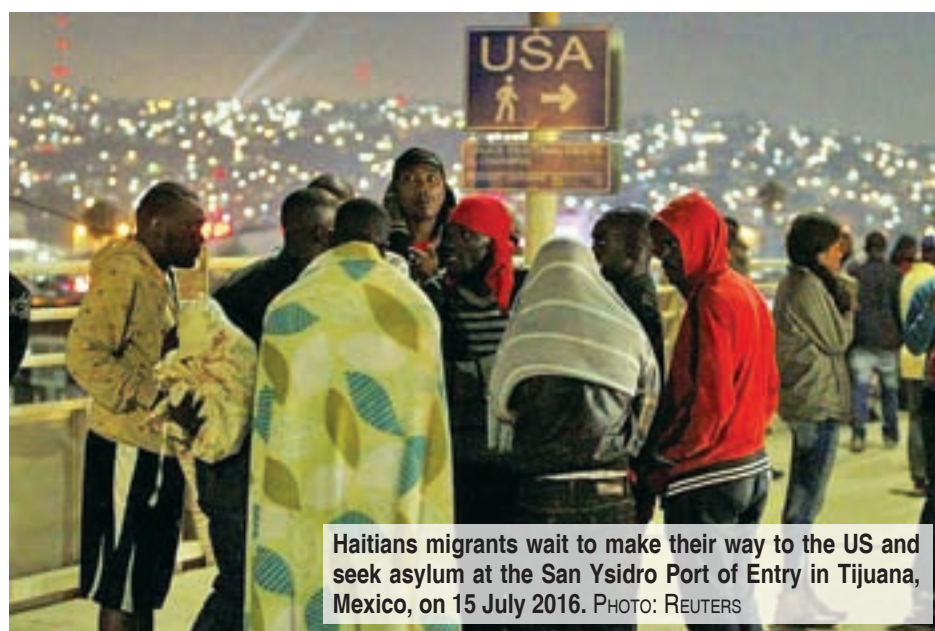
Haitians migrants wait to make their way to the US and seek asylum at the San Ysidro Port of Entry in Tijuana, Mexico, on 15 July 2016.

"The new leaders will urgently need to address the structural problems which persistently undermine Haiti's effort to move out of underdevelopment,"