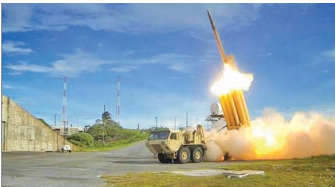
A Terminal High Altitude Area Defence (THAAD) interceptor is launched during a successful intercept test, in this undated handout photo provided by the US Department of Defence, Missile Defence Agency.

US Secretary of State John Kerry, meeting Southeast Asian leaders in New York on the sidelines of the UN General Assembly, said the United States would "do whatever is necessary to defend our own citizens and to honour our security commitments to our allies."