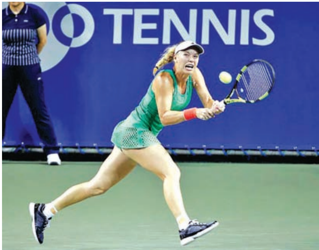
Caroline Wozniacki of Denmark returns a ball to Agnieszka Radwanska of Poland during Pan Pacific Open Women's Singles Semifinal match at Ariake Coliseum, Tokyo, Japan, on 24 September 2016.

"She played really well today and I was lucky to win that second set and then we just fought really hard, both of us, in the third."