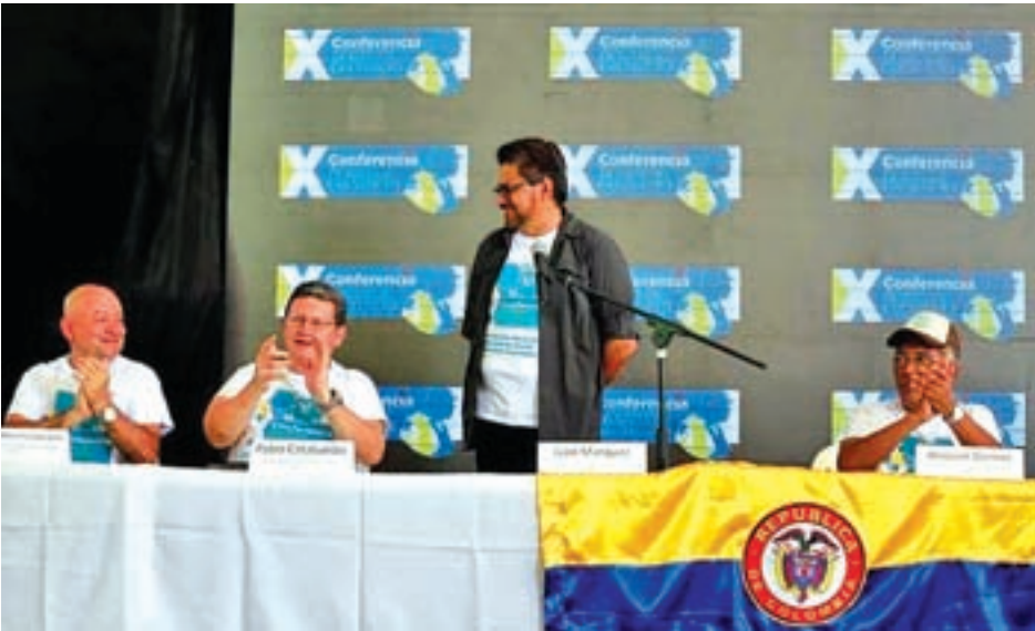
Revolutionary Armed Forces of Colombia (FARC) commander Ivan Marquez receives applause from Carlos Lozada, Pablo Catatumbo and Joaquin Gomez during a news conference at the camp where they prepare to ratify a peace deal with the Colombian government, near El Diamante in Yari Plains, Colombia, on 23 September 2016.

ment, the FARC will continue to push for social change as a political party, receiving 10 unelected seats in congress until 2026. FARC’s leaders have been coy on policy details but are expected to morph the group into a party rooted in Marxist ideals. Another congress to officially found the party will be held no later than May 2017, FARC commander Ivan Marquez said at the ceremony. Two-hundred delegates from FARC units around the country gathered at the Yari site, five hours by rutted road from the nearest provincial town, to review the accord and discuss re-organisation in peacetime. “We inform the country and the government and the governments and people of the world that the rebel delegates of the congress have given unanimous backing to the final accord,” Marquez said. The peace accord is due to be signed on Monday by President Juan Manuel Santos and Timochenko.