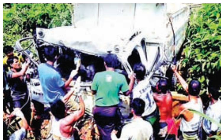
Vehicle seen being plunged into a drain.