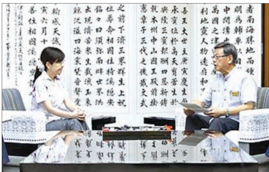
Defence Minister Tomomi Inada (L) meets with Okinawa Gov Takeshi Onaga at the prefectural government office in Naha, on 24 September 2016.

Under the relocation plan, which is based on a deal agreed between Japan and the United States in 1996, the Futenma base is expected to be transferred