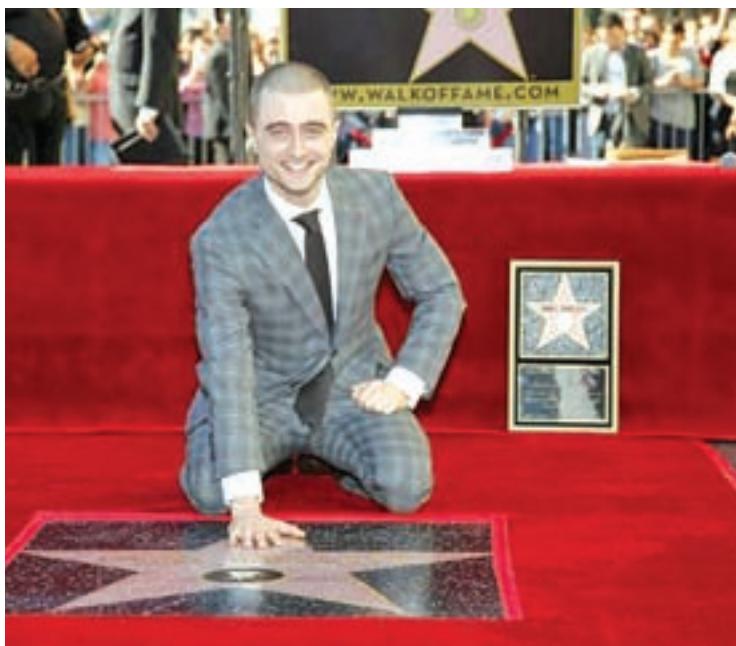
Actor Daniel Radcliffe poses during a ceremony honoring him with a star on the Hollywood Walk of Fame in Hollywood, California, in 2015.

“It’s not something I think I’d be interested in, and also if they do it now I feel they should just cast the people from the play,” said Radcliffe, who was just 11 years old when he was cast as Potter. Radcliffe was in London to open a three-day entertainment festival of films and family activities, including screenings of his two most recent indie movies “Swiss Army Man” and “Imperium.”—Reuters