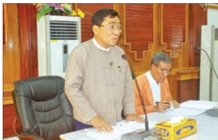
Union Minister Dr Win Myat Aye speaks at the meeting of the Work Committee for Regional Resettlement and Socio-economic Development.

THE Work Committee for Regional Resettlement and Socio-economic Development held its 3/2016 meeting in Sittwe, Rakhine State, discussing projects to be implemented in Rakhine State.