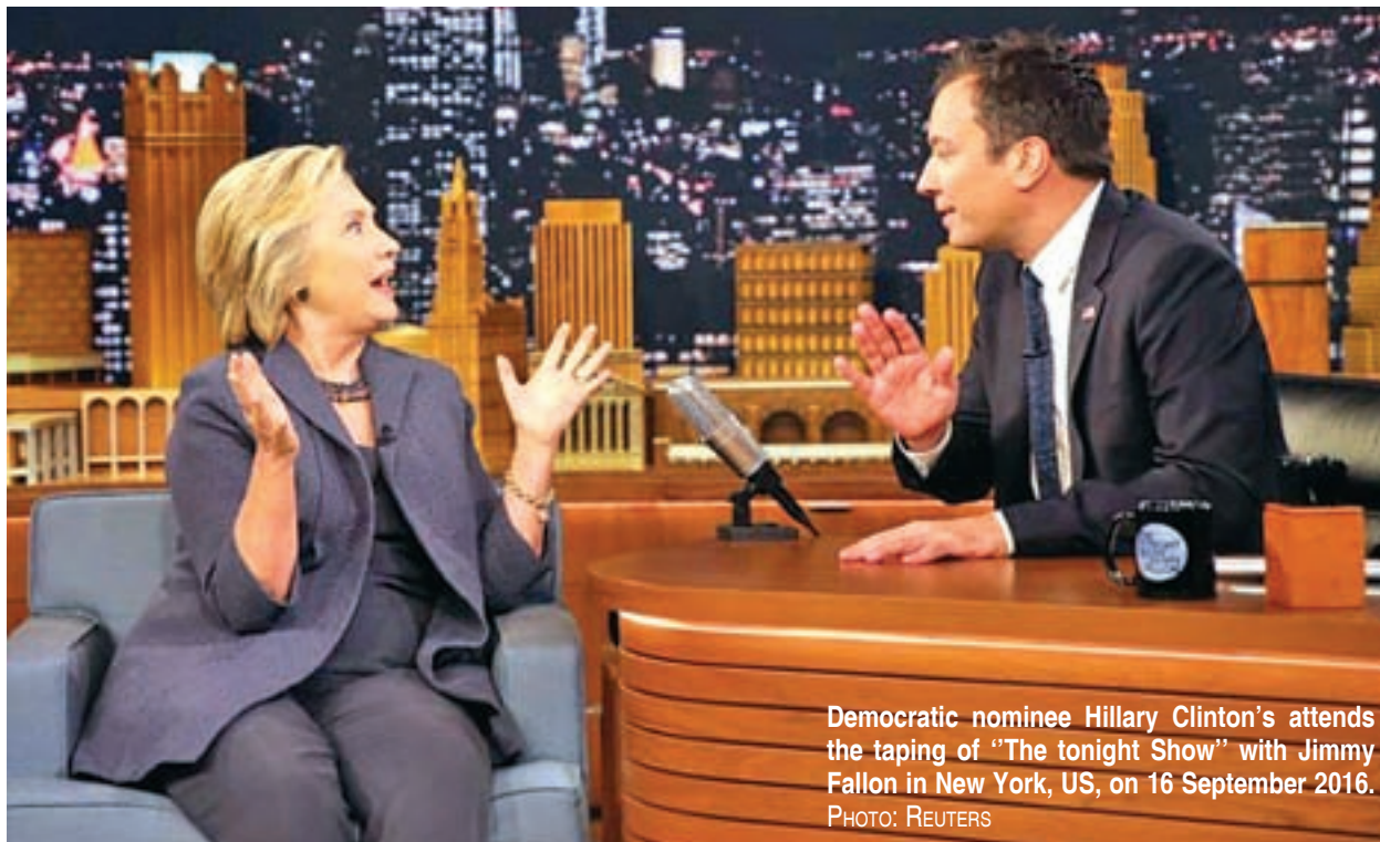
Democratic nominee Hillary Clinton's attends the taping of "The tonight Show" with Jimmy Fallon in New York, US, on 16 September 2016.

With just six weeks before the 8 November election, Monday's debate at Hofstra University in Hempstead, New York will be the first of three between the White House rivals. It presents a major opportunity for them to appeal to voters who have yet to commit to a candidate after a mostly negative race in which Clinton and Trump have sought to brand each other as untrustworthy and dangerous for the country.