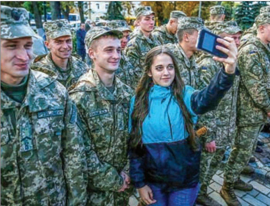
A woman takes a selfie with military cadets as they attend a Peace March to mark the International Day of Peace in Kiev, Ukraine, on 21 September 2016.

MINSK — Ukraine and Russian-backed separatists agreed on Wednesday to withdraw troops from three small towns on the front line in eastern Ukraine, a pilot de-escalation project that is part of the latest push to get a much-violated ceasefire to stick. Under the terms of the agreement, armed forces from both sides are banned from entering the three areas, which are four square kilometres each in size. The withdrawal must start within a month and be completed within three days. The move follows a new truce on 15 September that spurred hopes for the peace process, although it failed to stem all the violence in the region. The conflict has killed over 9,600 soldiers, civilians and pro-Russian rebels since April 2014. The plan was first announced during a visit by German and French foreign ministers to Kiev last week. The withdrawal will be observed along three sections of the 480 km front line, in the small towns of Stanytsia Luhanska and Zolote in the Luhansk region and Petrovske in the Donetsk region, the Organisation for Security and Cooperation in Europe (OSCE) said. German Foreign Min-