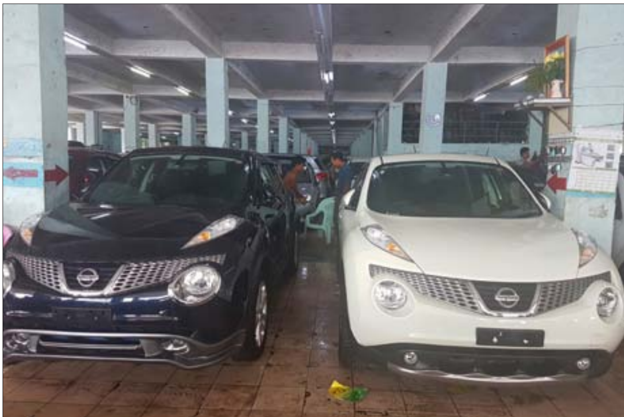
Cars sale centre at old Thiri Mingala Market.

THE income tax levied on permit-free cars reached about Ks13,743 million, according to the Internal Revenue Department.