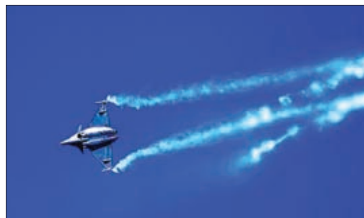
An Dassault Rafale from the French Air Force flies over San Lorenzo beach during an aerial exhibition in northern Spain.

Indian defence ministry officials have earlier said the value of the deal could be $8.5 billion to $9 billion.—Reuters