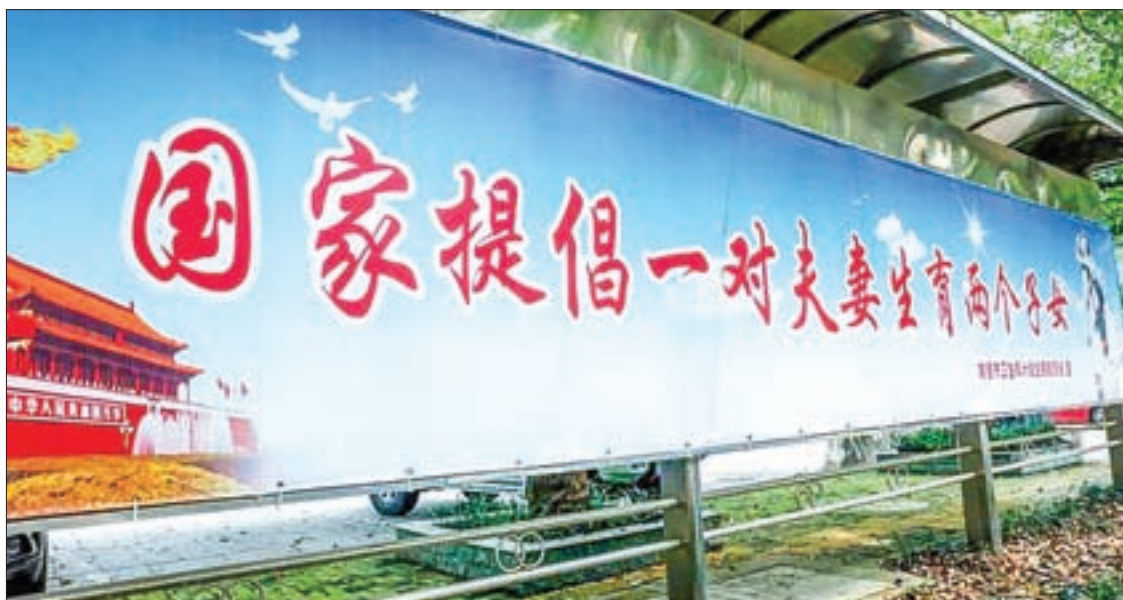
A poster advocating couples to have a second child, is seen in Changde, Hunan Province, China, on 14 July 2016. Red Chinese characters read "the nation advocates one couple to have two children".

Online, some people were more sceptical.—Reuters