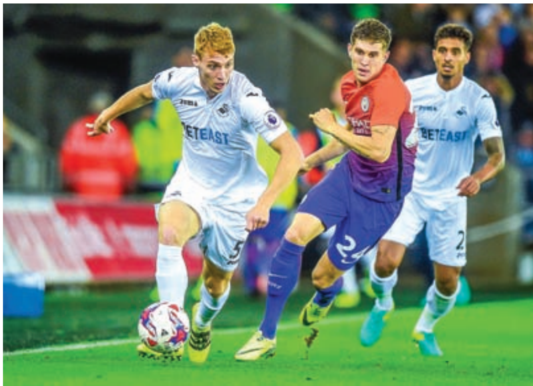
Manchester City's John Stones in action with Swansea City's Mike van der Hoorn during EFL Cup Third Round at Liberty Stadium, on 21 September 2016.

Tottenham made light work of third tier Gillingham, romping to a 5-0 victory, while West Ham needed a 96th-minute free kick from Dimitri Payet to beat Accrington Stanley 1-0.