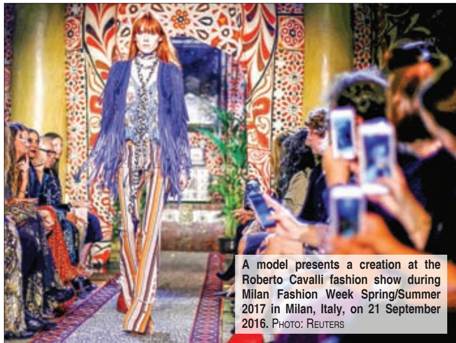
A model presents a creation at the Roberto Cavalli fashion show during Milan Fashion Week Spring/Summer 2017 in Milan, Italy, on 21 September 2016. PHOTO: REUTERS

Milan's six-day fashion events run until Monday. —Reuters