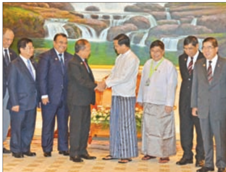
Vice President U Henry Van Thio welcomes ASEAN Energy ministers.