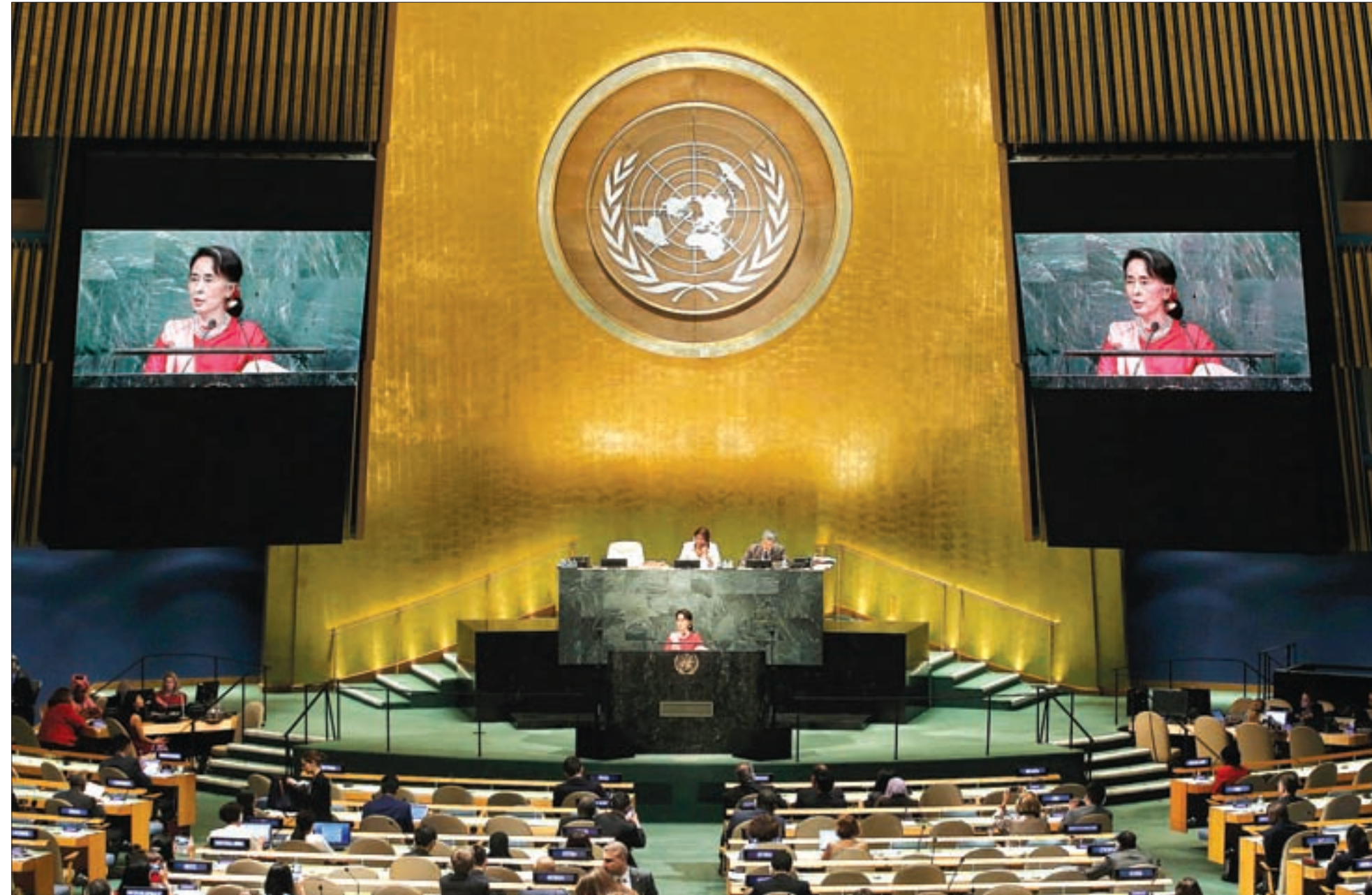
State Counsellor Daw Aung San Suu Kyi addresses the 71st United Nations General Assembly in Manhattan, New York, U.S. September 21, 2016.

Over the last few years, the world has focused its attention on the situation in the Rakhine