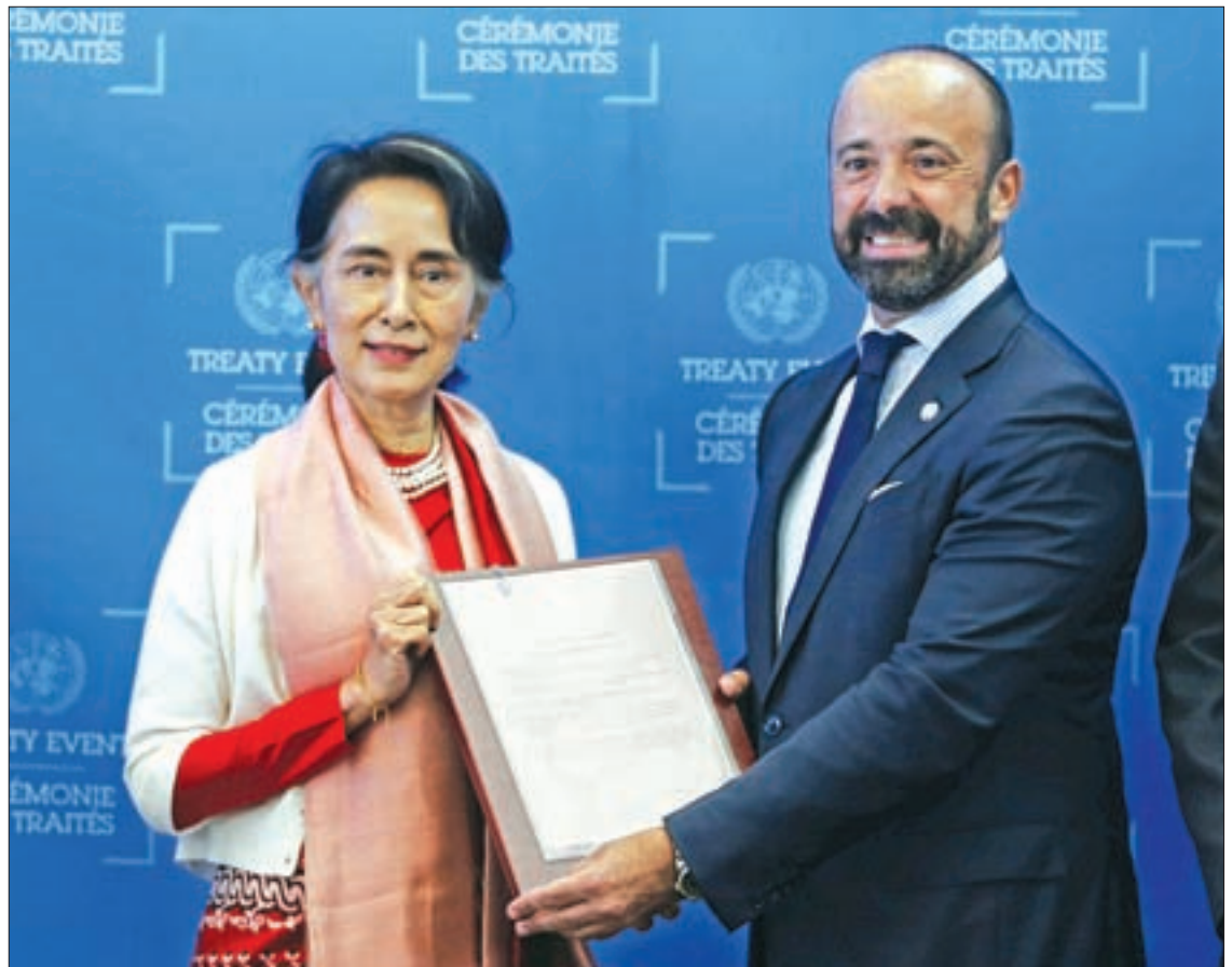
State Counsellor Daw Aung San Suu Kyi takes part in a ceremony celebrating the ratification of the Comprehensive Nuclear-Test-Ban Treaty (CTBT) during the General Assembly for the 71st session of the UN General Assembly at UN headquarters in New York, US, September 21, 2016.

Next, the State Counsellor was present at a ceremony concerned with the ratification of the Comprehensive Nuclear-Test-Ban Treaty at the 2016 Treaty Event. — Myanmar News Agency