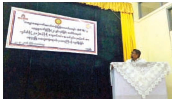
A personnel of the Brighter Future Myanmar clarifies purpose of the donation of adialysis machine and a water purifier.