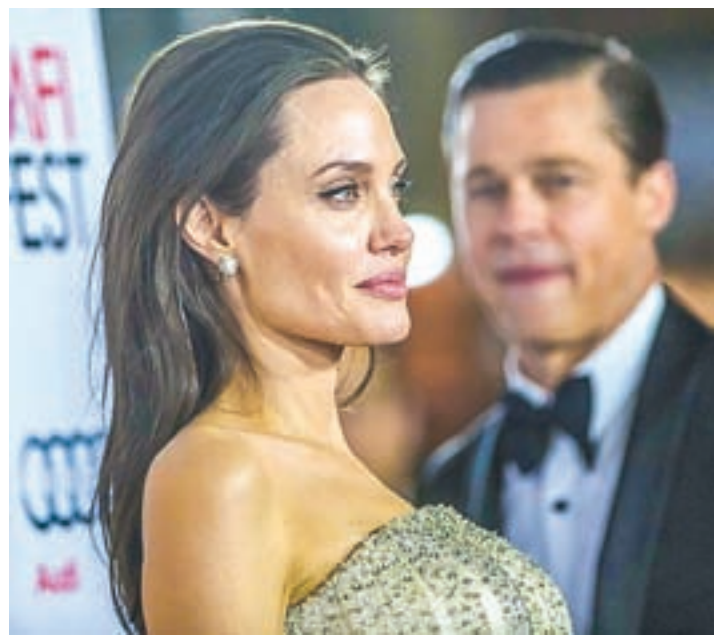
Angelina Jolie & Brad Pitt.

Some more notable artists, such as Ricky Martin and Juan Luis Guerra, failed to land nods this year.—Reuters