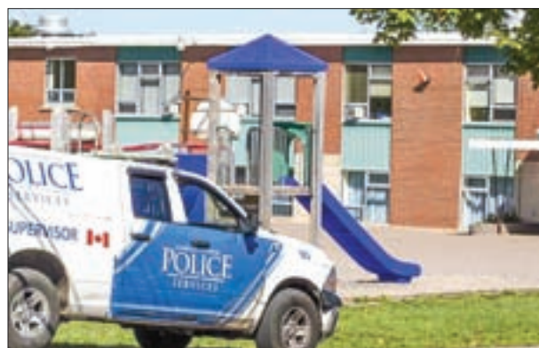
A Charlottetown Police vehicle drives into Sherwood Elementary School in Charlottetown, Prince Edward Island.