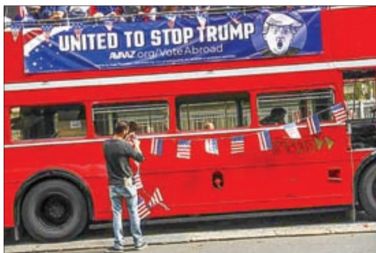
A campaigner attaches American flags to a ‘Stop Trump’ open-top double decker bus before touring London to urge Americans living abroad to register and vote, Britain, on 21 September 2016.

cans live abroad, of which more than 220,000 live in Britain. However, just 12 per cent of them vote, Avaaz said in a statement.