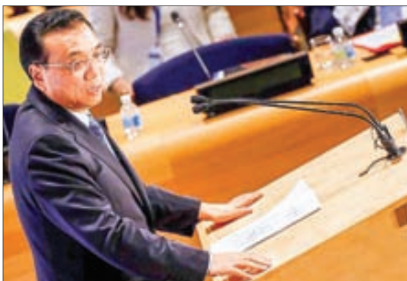
Chinese Premier Li Keqiang speaks during a High Level Leaders meeting on Refugees on the sidelines of the United Nations General Assembly at United Nations headquarters in New York, US, on 20 September 2016.

UNITED NATIONS — Chinese Premier Li Keqiang said on Wednesday that countries must remain committed to denuclearisation of the Korean peninsula while seeking a solution to the North Korean nuclear issue through dialogue.