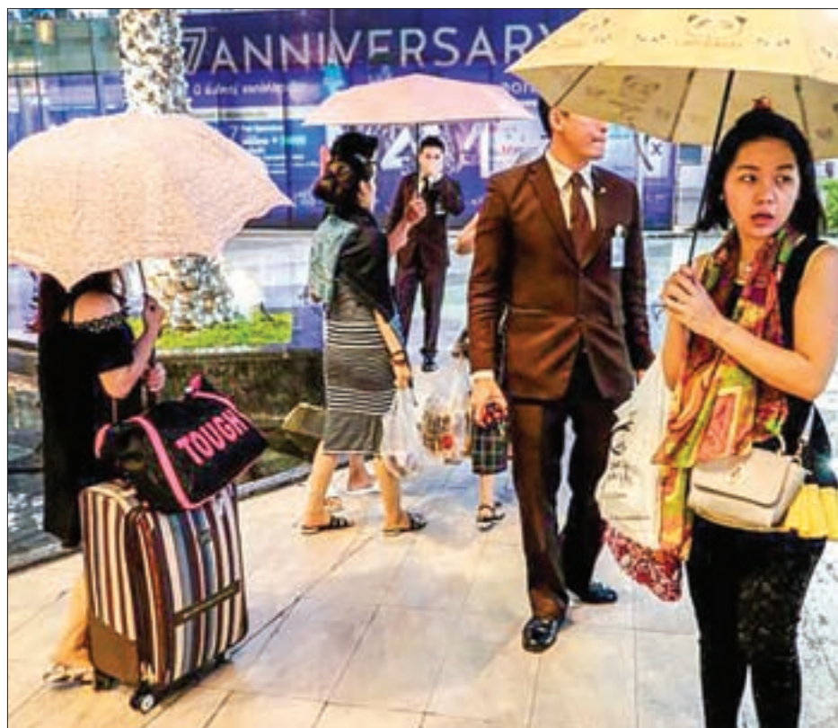
Tourists hold up umbrellas at a department store in Bangkok, Thailand, on 21 September 2016.

Tourism has been one of the rare bright spots for Thailand, Southeast Asia’s second-largest economy, which has grappled with weak consumer confidence and exports after a 2014 coup the military said was aimed at ending months of political unrest. Last month’s wave of bomb blasts in southern Thailand, which police have blamed on Muslim separatists, appears to have had a limited impact on tourism. Bangkok, also known as the ‘city of angels’, topped the 2016 listing of 132 cities, beating London, Paris and Dubai to become the city most visited by international travellers in the Mastercard Index of Global Destination Cities. “It isn’t a flash in the pan. Bangkok is in a strong position to be the top destination city for a long time,” Yuwa Hedrick-Wong, Mastercard chief economist, told Reuters. “There’s the