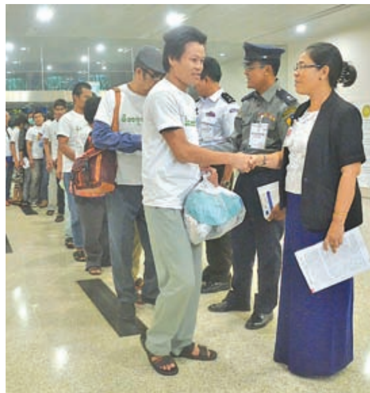
Detained workers are welcomed by officials.

A total of 1,099 detained Myanmar nationals have so far been brought back home from Malaysia. —Zaw Gyi