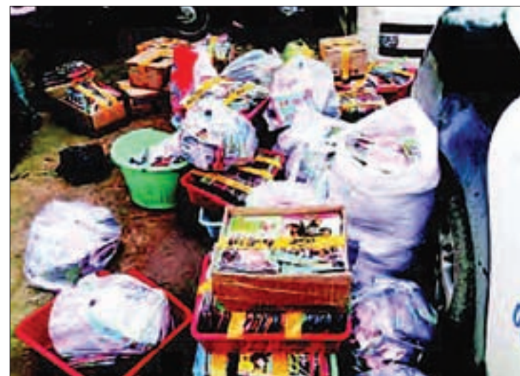
Seizures from uncensored movie sellers are seen in Mandalay.

by one Aung Thet Phyto in Yadanar road, Pyigyidagun township and seized 1,459 CDs/VCDs. Police also seized 23,475 CDs/VCDs from the shop of one Ma Aye San in Pyigyidagun township. Local police have filed charges against them under Television and Video Law Section 32(B). — 002