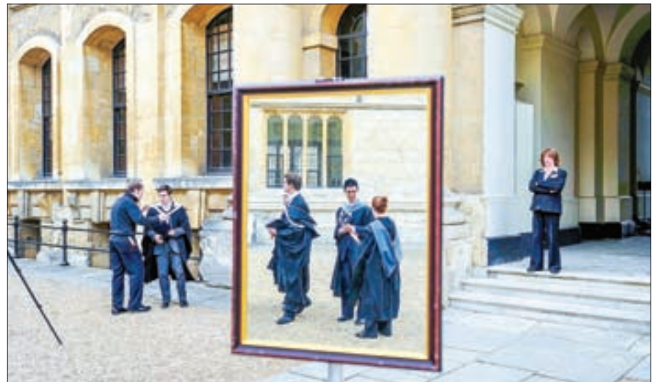
Graduates queue to have their photograph taken after a graduation ceremony at Oxford University, Oxford, southern England in 2011.

More broadly, the rankings showed institutions in Asia had made progress with two new Asian universities now in the 100 and another four joining the top 200. —Reuters