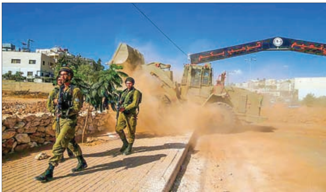
Israeli army soldiers keep guard as an Israeli military front loader opens the entrance of the West Bank village of Bani Na'im, near Hebron, on 21 September 2016.

UNITED NATIONS — In his first major United Nations speech eight years ago, President Barack Obama said he would not give up on Israeli-Palestinian peace.