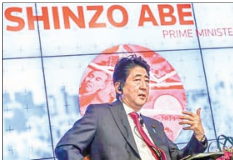
Japanese Prime Minister Shinzo Abe speaks during a Reuters Newsmaker conversation in Manhattan.

Abe has focused on mobilising women and the elderly