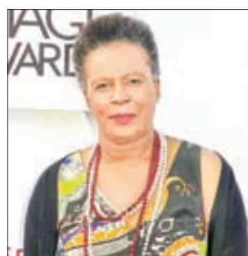
Claudia Rankine.

"The first piece in 'Citizen' was written right after Katrina,"