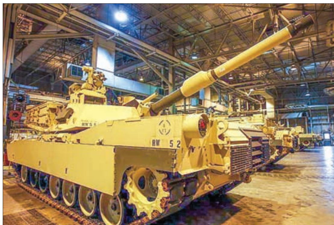
An Abrams battle tank during a tour of the Joint Systems Manufacturing Centre, Lima Army Tank Plant, in Lima, Ohio, in 2012.

"If you're serious about stopping the flow of extremist recruiting across this globe, then