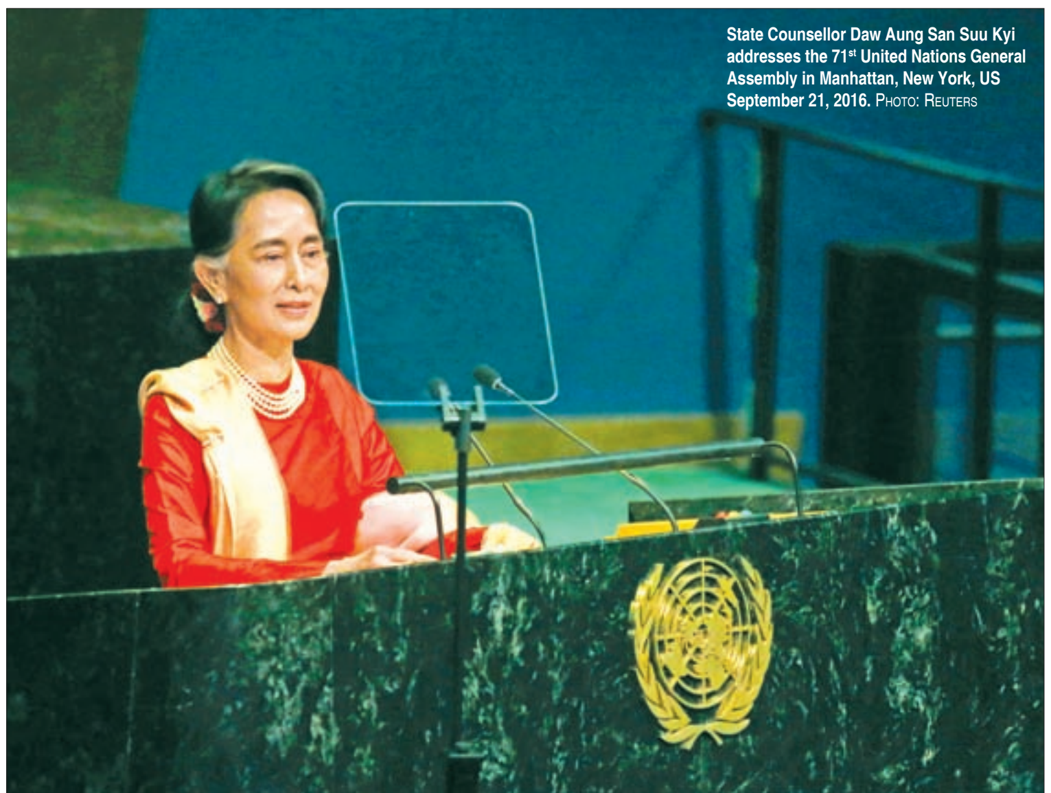
State Counsellor Daw Aung San Suu Kyi addresses the 71 st United Nations General Assembly in Manhattan, New York, US September 21, 2016.

Daw Aung San Suu Kyi stressed that for a country that has