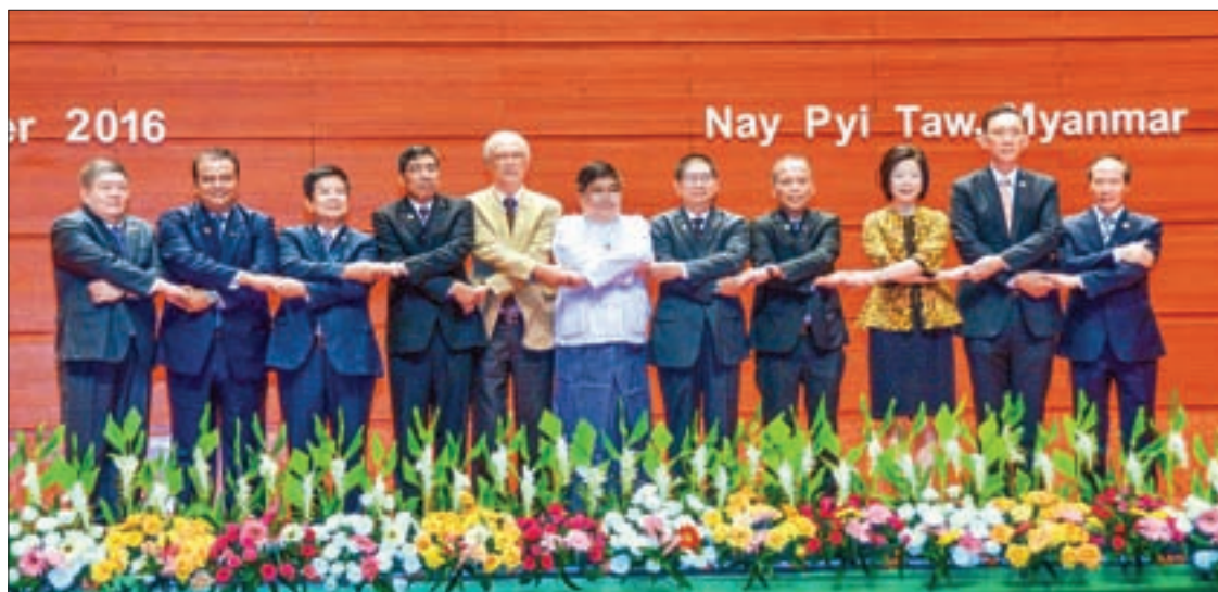
ASEAN Energy ministers pose for documentary photos in ASEAN way.

representatives from ASEAN countries and dialogue partners, regional and international organisations and local and foreign