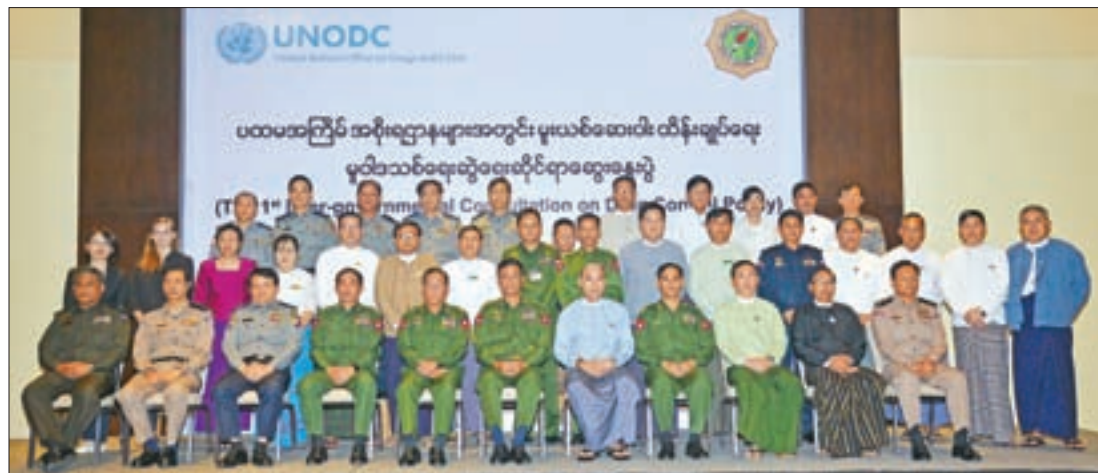
Officials posing for a group photo at the consultation on Drug Control Policy.

THE first Inter-governmental Consultation on Drug Control Policy, jointly-organised by the Central Committee on Drug Abuse Control (CCDAC) and United Nations Office on Drugs and Crime (UNODC), was held in Nay Pyi Taw yesterday.