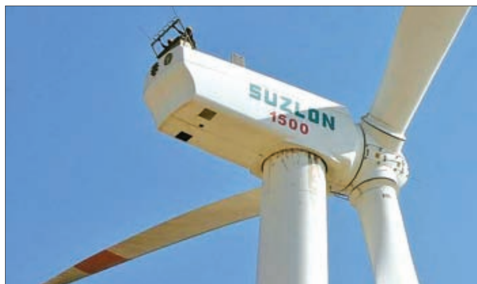
Maintenance engineers work on top of a power generating wind turbine at Suzlon wind farm in Surajbari village, about 275 km west of Ahmedabad, on 14 December, 2009.

"Everybody has a target of at least five countries," he said. In Australia, Suzlon has installed 764 megawatts of wind energy generation, around a fifth of the market share. Globally it has around 15 GW, which it expects to expand to 35 GW by 2020, he said. —Reuters