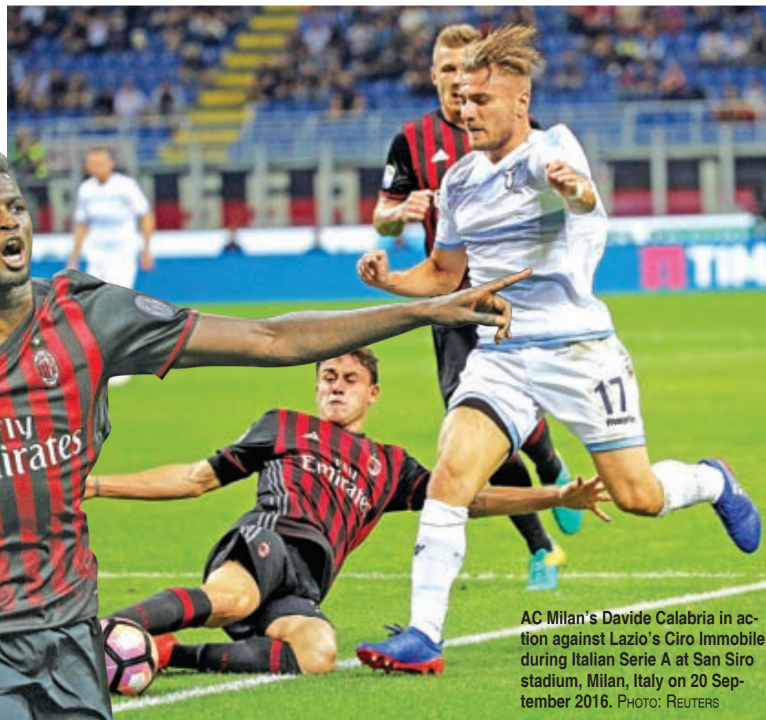
AC Milan's Davide Calabria in action against Lazio's Ciro Immobile during Italian Serie A at San Siro stadium, Milan, Italy on 20 September 2016.

Milan could have doubled their lead before halftime when Lazio's backline was exposed by the fleet-footed Suso and the nervous Strakosha was forced to parry the ball clear after the