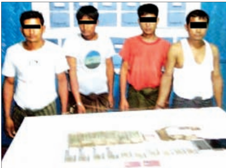
Criminal suspects seen together with seized counterfeit notes.