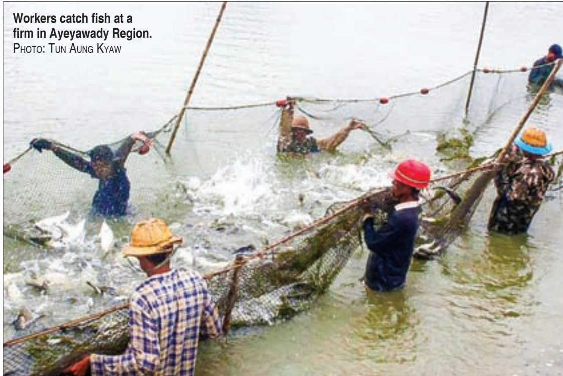
Workers catch fish at a firm in Ayeyawady Region.