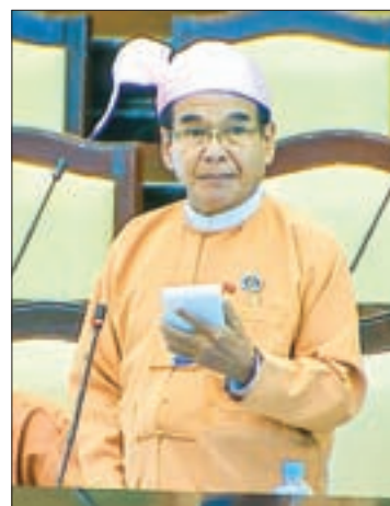
U Kyaw Naing.

Likewise, the deputy minister replied to questions regarding electrification in Chin State, saying that the installation of a 66KV Mindat-Matupi power line