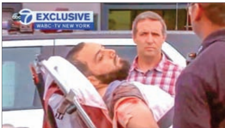
A still image captured from a video from WABC television shows a conscious man believed to be New York bombing suspect Ahmad Khan Rahami being loaded into an ambulance after a shoot-out with police in Linden, New Jersey, US, on 19 September 2016.

Rahami was apprehended on Monday in Linden, New Jersey,