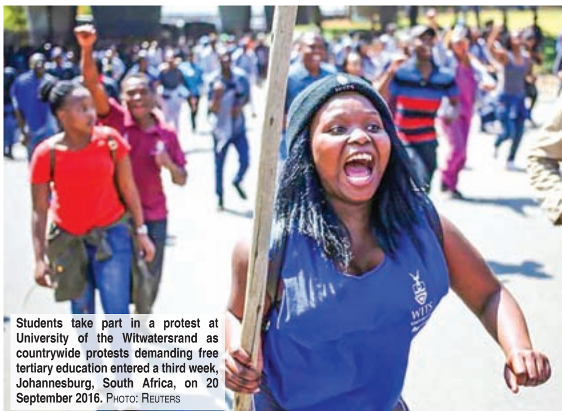
Students take part in a protest at University of the Witwatersrand as countrywide protests demanding free tertiary education entered a third week, Johannesburg, South Africa, on 20 September 2016.

Several students hurled rocks at the main building of the university known as "Wits", shattering windows, after they were prevented from entering by private security guards who retaliated by throwing rocks back at the students.—Reuters