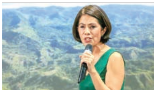
Philippines Environment and Natural Resources (DENR) Secretary Regina Lopez answers a question during a news conference at the department's headquarters in Quezon city, metro Manila, Philippines, on 11 August 2016.

The Southeast Asian nation, the world's top supplier of nickel ore, has already halted the operations of 10 mines, eight of them nickel producers, for environmental lapses since it launched