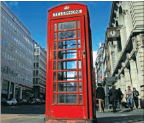
A traditional public red phonebox is illuminated by the sun in London in February 2012.