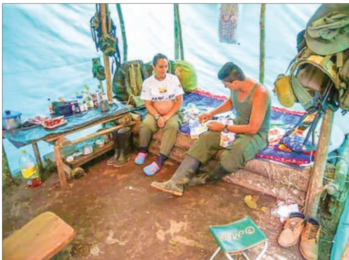
Revolutionary Armed Forces of Colombia’s (FARC) Tatiana, 36-year-old and six months pregnant, sits next to her husband and gifts for the baby at a camp where the FARC will ratify a peace deal with the Colombian government, near El Diamante in Yari Plains, Colombia, on 17 September 2016.

Now a final signature on the deal is near, FARC couples have begun to look forward to once-forbidden parenthood.