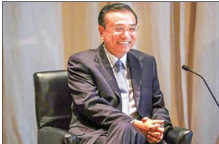
Chinese Premier Li Keqiang delivers remarks during a meeting with former New York City Mayor Michael Bloomberg and US business leaders at the Waldorf Astoria Hotel during the week of the United Nations General Assembly in Manhattan, New York, US, on 20 September 2016.

"This process of them becoming more mature is also a process for them to open up and the areas of the Chinese economy open to foreign investment will only in-