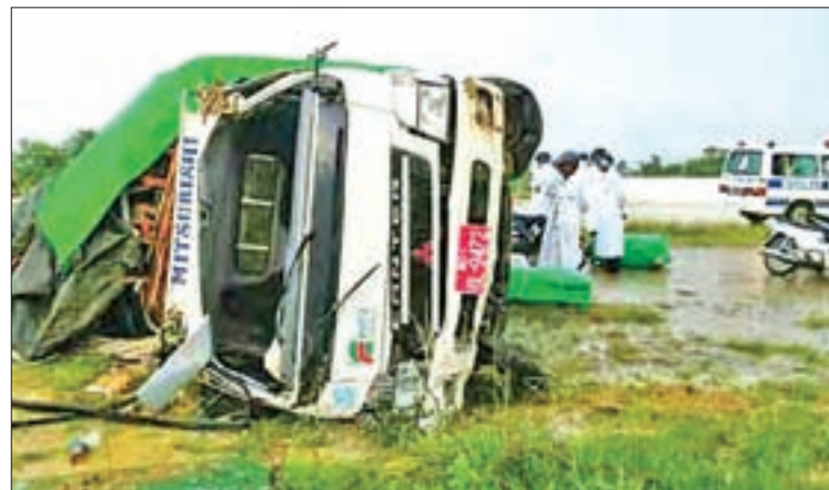
Six-wheel vehicle seen overturned on Yangon-Mandalay road.

A SIX-wheel vehicle carrying flowers overturned on the Yangon-Mandalay highway on Monday.