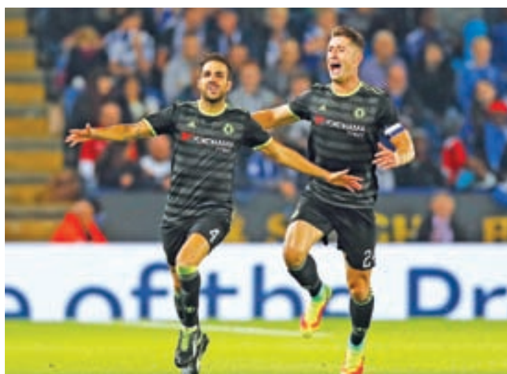
Chelsea's Cesc Fabregas celebrates scoring their fourth goal with Gary Cahill during EFL Cup third round at King Power Station, on 20 September.

It was a bad night, however, for Premier League sides Everton and Bournemouth, who exited the competition at the hands of second-tier opponents. Everton were dumped out 2-0 at home by Norwich City, while Bournemouth suffered a 3-2 home defeat by Preston North End. In the stand-out fixture, Chelsea seemed to be heading out when Leicester's Shinji Okazaki twice capitalised