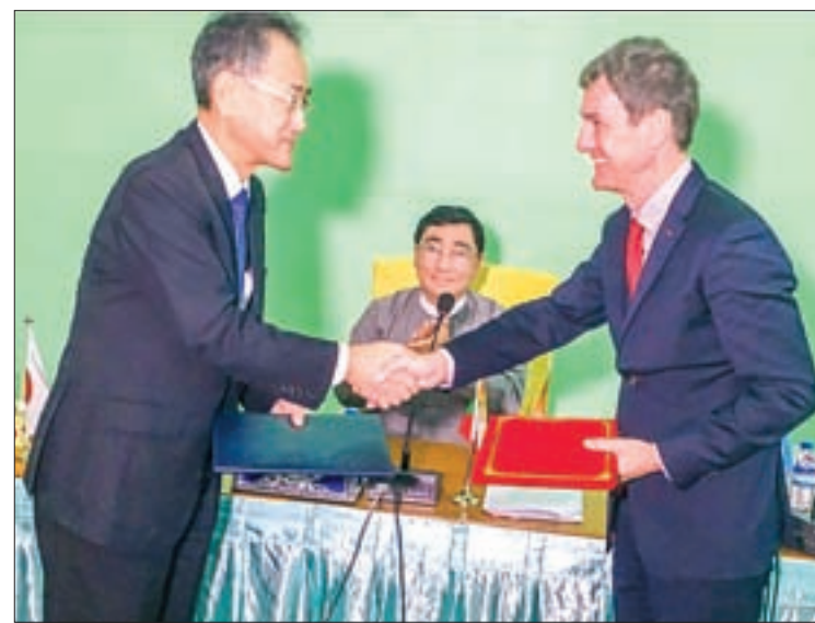
Japanese ambassador presenting donations to UNICEF Representative.