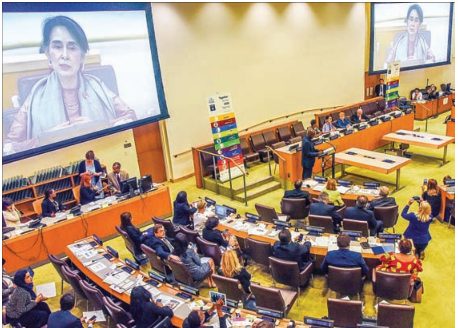
The State Counsellor participating in the high-level event at the UN headquarters.

Mr Donald Tusk, President of the European Council, hosted a dinner for the State Counsellor Tuesday evening. —Myanmar News Agency