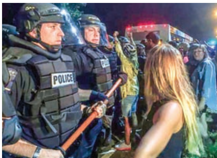
Police officers wearing riot gear block a road during protests after police fatally shot Keith Lamont Scott in the parking lot of an apartment complex in Charlotte, North Carolina, US on 20 September 2016.

Earlier in the evening, police in riot gear reportedly used