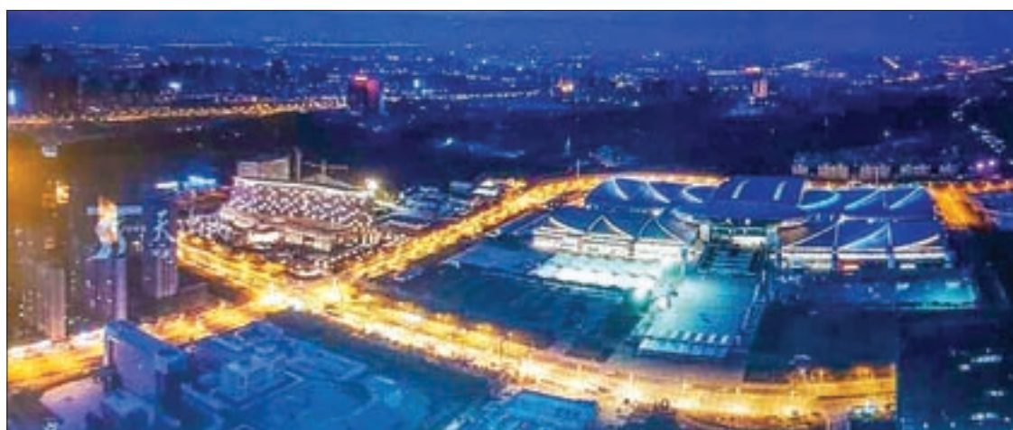
The building where the fifth China-Eurasia Expo is held is illuminated at night.

UNION Minister for Information Dr Pe Myint attended the opening ceremony of the fifth China-Eurasia Expo held with its theme of 'Mutual Discussions, Joint Development and Sharing Silk Road: Opportunities and Future' in Urumqi, capital of Xinjiang Uygur Autonomous