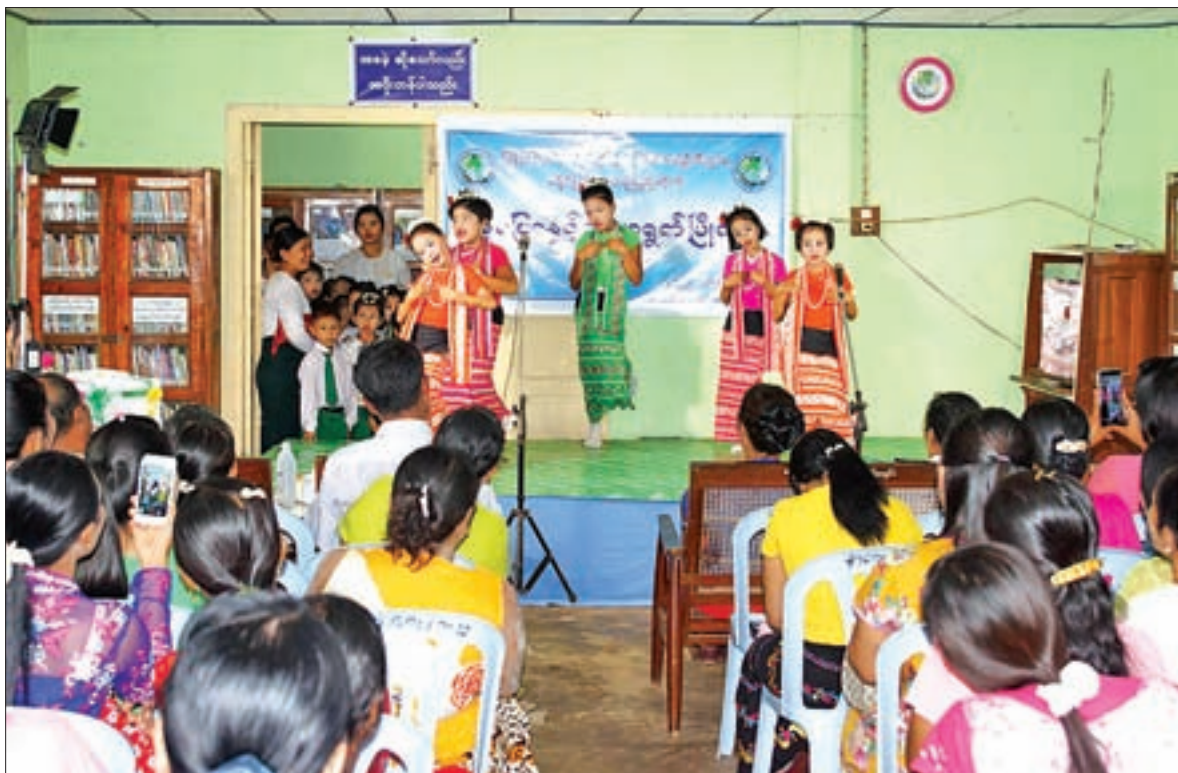
Students participating in a contest.

The Information and Public Relation Department organised the event. —Kyaw Soe (Kawthaung)