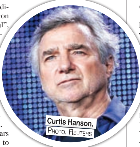
Curtis Hanson.

The film reproduced '50s Los Angeles, from the streets to the costumes, and Hanson used an ensemble cast that also included Kevin Spacey, Russell Crowe, Guy Pearce, James Cromwell,