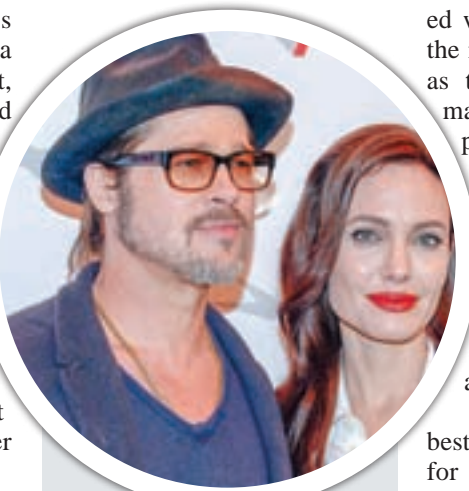
Actor Brad Pitt and actress/director Angelina Jolie pose at the AFI Awards 2014 honouring excellence in film and television in Beverly Hills, California, US, on 9 January 2015.

Jolie and Pitt, known collectively as "Brangelina," were one of the entertainment world's most visible couples, due to their