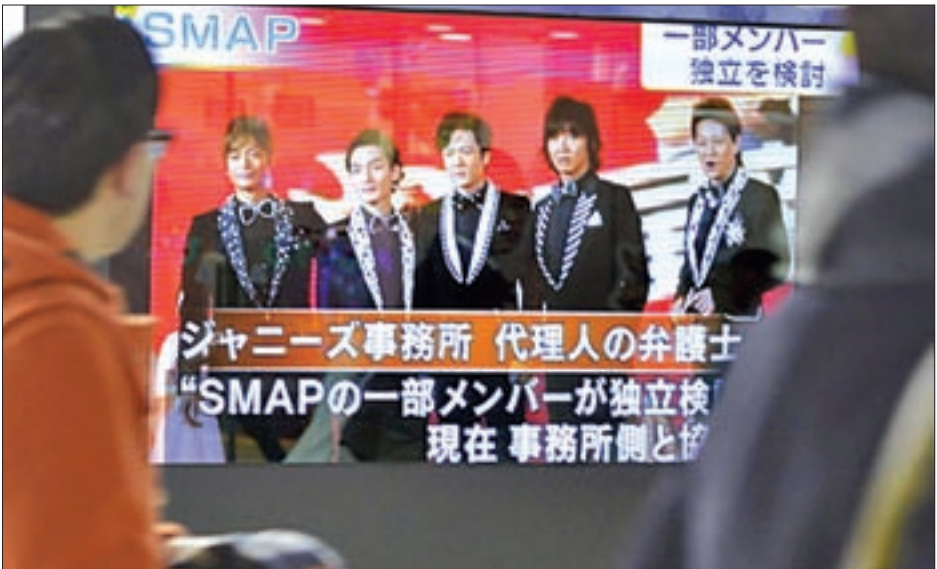
Photo taken in January 2016 shows pedestrians in Tokyo watching news that pop group SMAP is on the verge of breaking up. SMAP is scheduled to release a greatest hits album on 21 December 2016 — 10 days before its breakup.

without planning to release a new song, according to Victor. The group caused a brief media frenzy in January when the news of their potential breakup surfaced, before band members said later that month they would stick together. At the time, fans launched a campaign to express their support through the purchase of CDs of “Sekai ni Hitotsu Dake no Hana” (The Only Flower in the World), SMAP’s best known song, and as a result pushed the 2003 hit song to No. 1 again on a Japanese hit chart. But in August, talent agency Johnny & Associates Inc. said that SMAP will break up on 31 December and all the members — Masahiro Nakai, Takuya Kimura, Tsuyoshi Kusanagi, Goro Inagaki and Shingo Katori — will remain with the agency and focus on solo careers starting next year. — Kyodo News