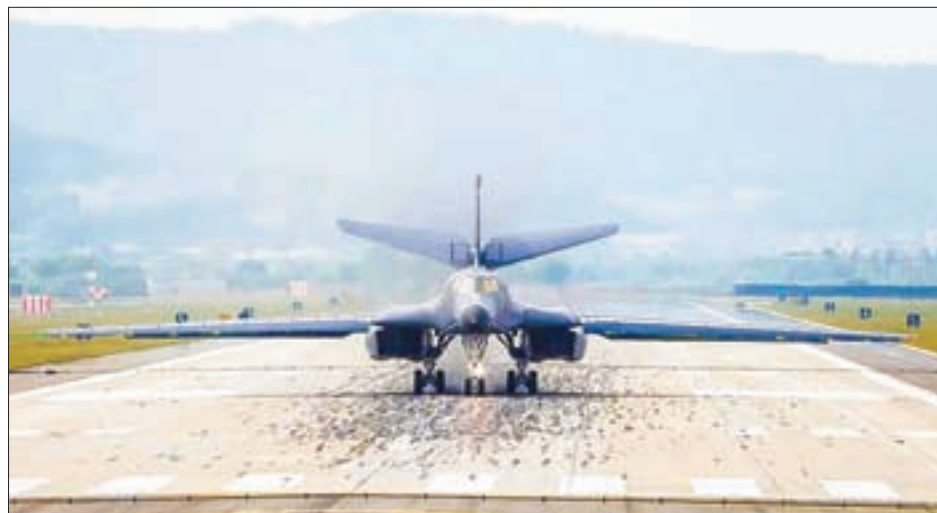
A US Air Force B-1B bomber lands Osan Air Base in Pyeongtaek, South Korea, on 21 September 2016.

UN diplomats say the two countries have begun discussions on a possible UN resolution in response to the latest nuclear test, but China has not said directly whether it would support tougher steps against North Korea. China, which has objected to a planned US deployment of a THAAD missile defence system in the South to counter the North's missile threat, called on "all parties to exercise restraint