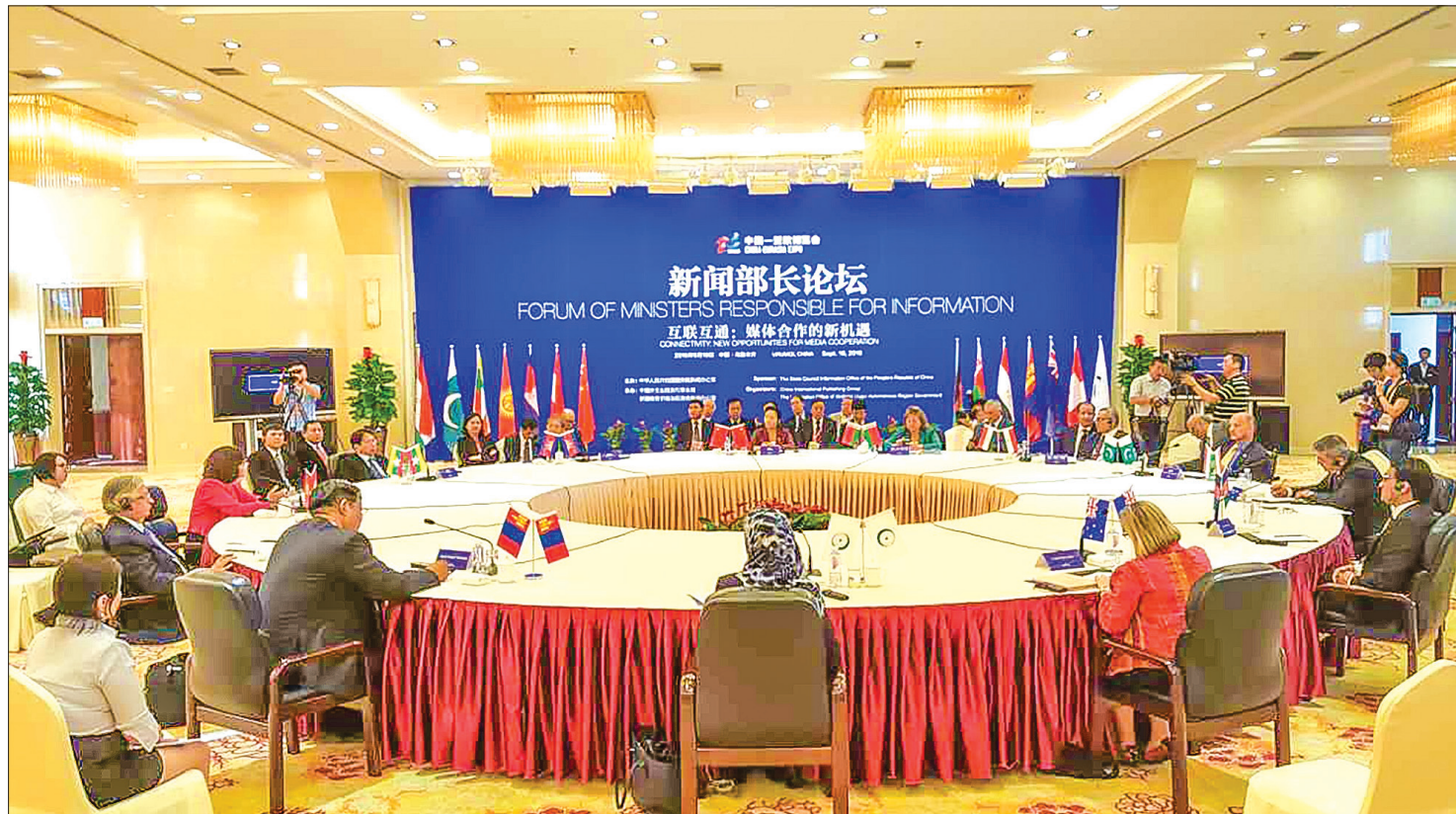
Forum of Ministers Responsible for Information in progress in China.