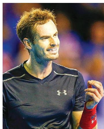
Andy Murray.

GLASGOW (Scotland) — Andy Murray is itching for a break after an exhausting few months, the world number two said, after defending champions Britain were knocked out by Argentina 3-2 in the Davis Cup semi-final.