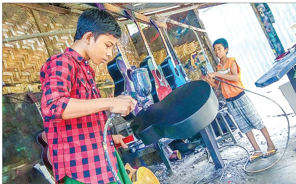
A young man seen making a guitar.