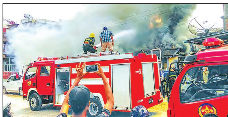
Fire fighters bringing the blaze under control.

The house owner is facing legal charges under the law. — Han Htay (Lashio)