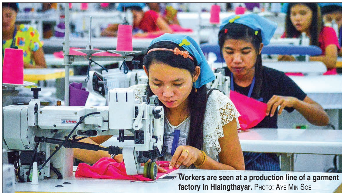
Workers are seen at a production line of a garment factory in Hlaingthayar.

THE Myanmar ministry of industry which had initially mooted the idea of creating a special zone for textile and garment industry earlier in August has decided to allocate 3,000 acres of land for the project.