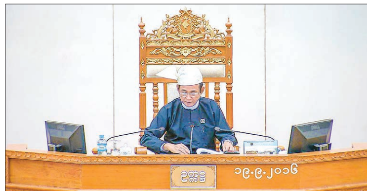
Speaker U Win Myint.

Actions have been taken against those who occupied land