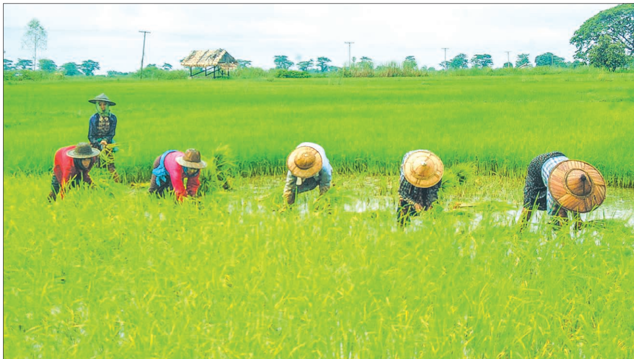
Farmers plant paddy traditionally at a field in Pauktal Village, Bago Region.

JCMC offices are slated to be opened in Kayin State in October. The JCMC consists of fourteen members including the group leaders, the commander, the authorities concerned and the public.