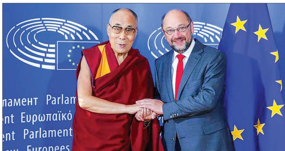
Tibet's exiled spiritual leader the Dalai Lama, is welcomed by European Parliament president Martin Schulz at the European Parliament in Strasbourg, France.