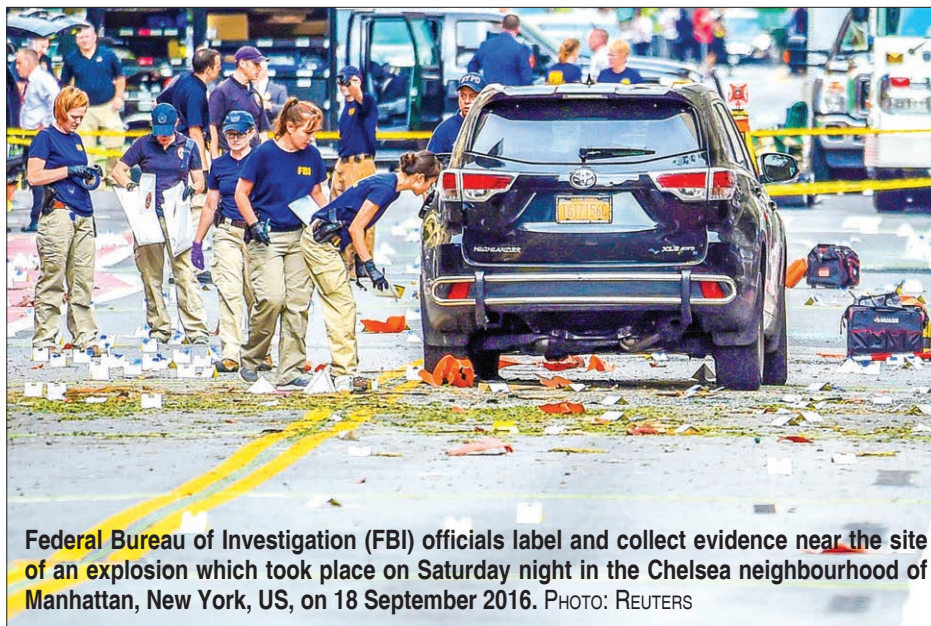
Federal Bureau of Investigation (FBI) officials label and collect evidence near the site of an explosion which took place on Saturday night in the Chelsea neighbourhood of Manhattan, New York, US, on 18 September 2016.

While officials described the weekend bombs and the Minnesota attack as deliberate, criminal acts and said they were investigating them as potential acts of terrorism, they stopped short of