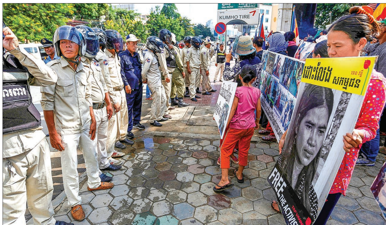
District Security Guards line up as protesters hold banners and a portrait of land activist Tep Vanny during a demonstration in front of the Municipal Court of Phnom Penh, Cambodia, on 19 September, 2016.

PHNOM PENH — Four women land rights activists were sentenced to six months in prison by a court in Cambodia on Monday for insulting and obstructing public officials during a 2011 violent land rights protest.