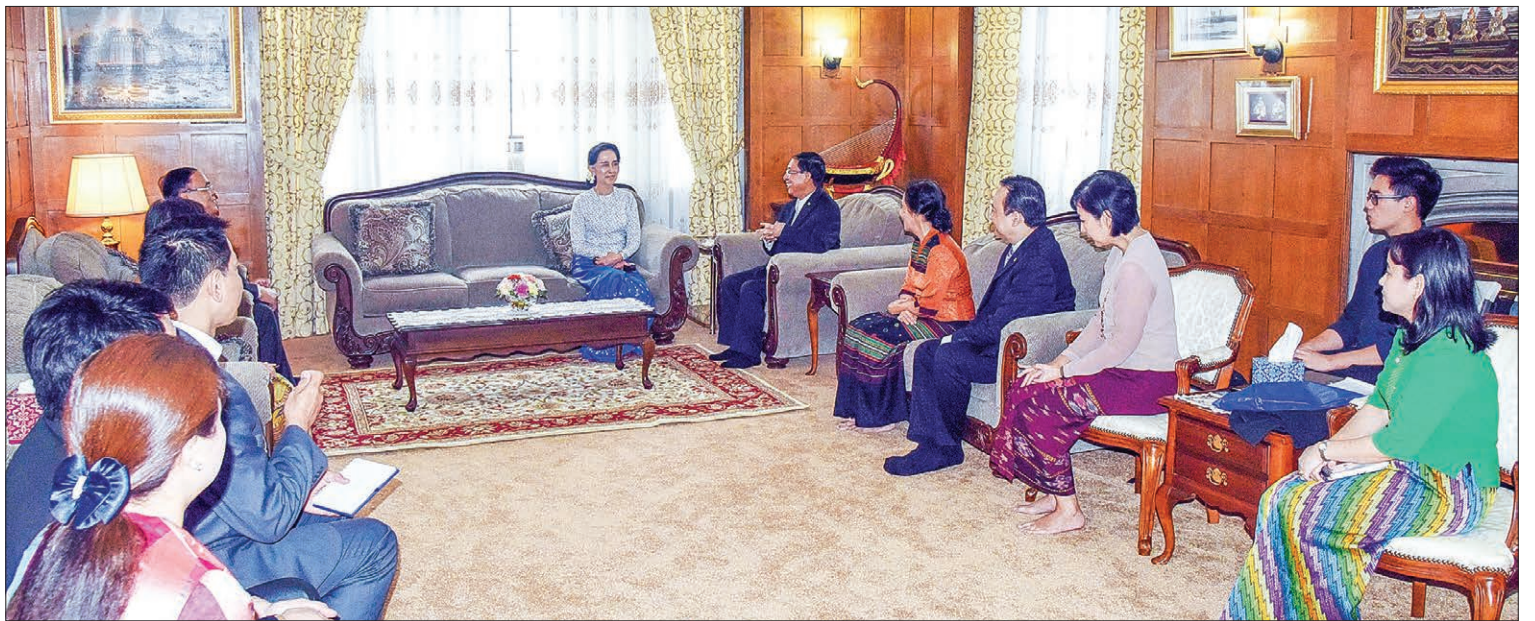
State Counsellor Daw Aung San Suu Kyi meets members of the Office of Myanmar Permanent Mission to the United Nations.

The State Counsellor and officials then discussed matters related to the 71st session of the United Nations General Assembly.— Myanmar News Agency