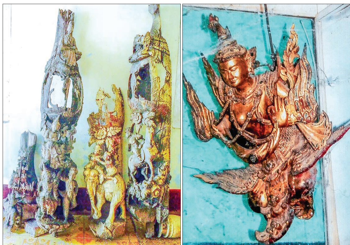
Sculptures dating back to Konbaung Era.