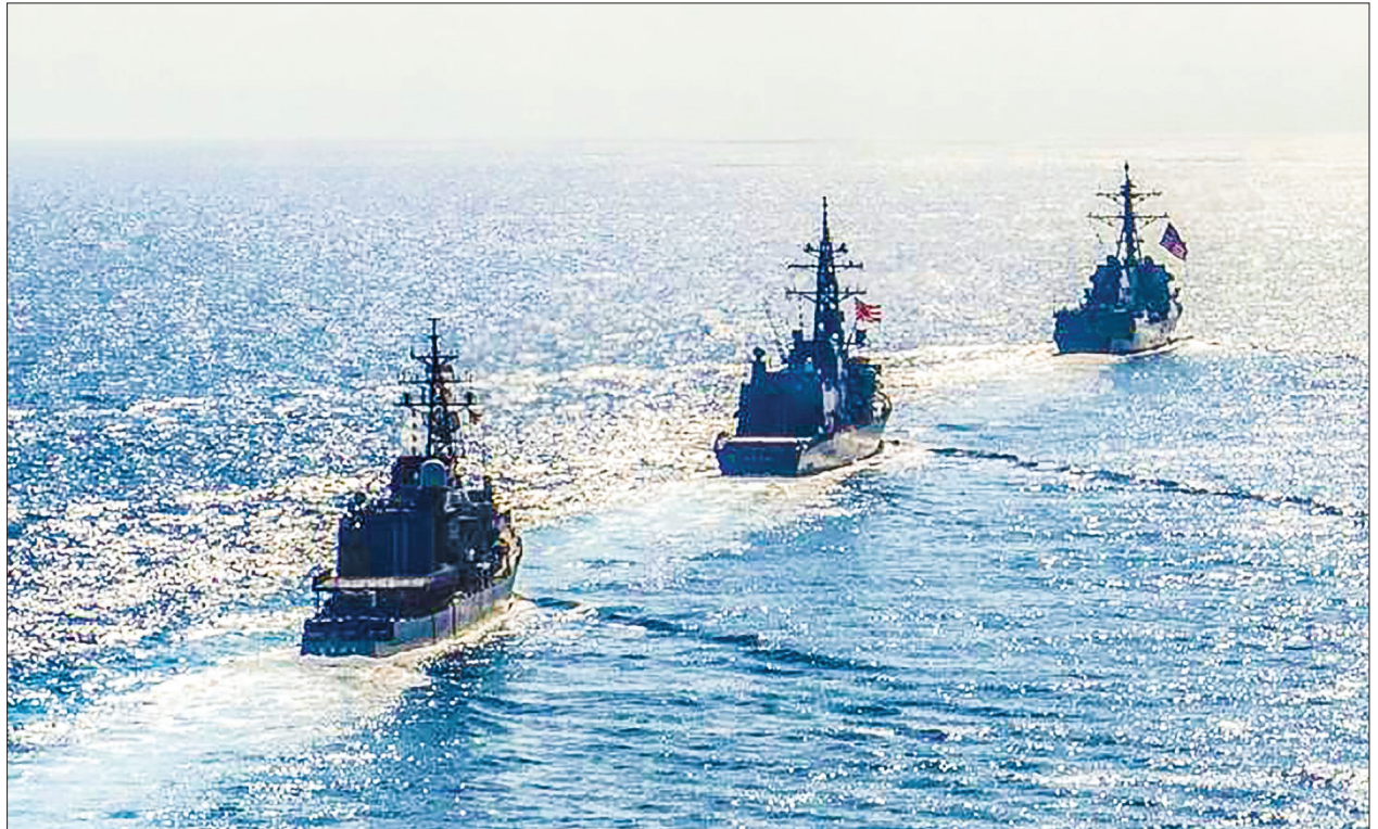
Arleigh Burke-class guided-missile destroyer USS Mustin (DDG 89) transits in formation with Japan Maritime Self-Defence Force ships JS Kirisame (DD 104) and JS Asayuki (DD 132) during bilateral training in South China Sea on 21 April, 2015.

BEIJING — China on Monday accused Japan of trying to “confuse” the situation in the South China Sea, after its neighbour said it would step up activity in the contested waters, through joint training patrols with the United States.