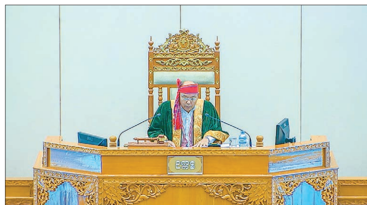
Speaker Mahn Win Khaing Than.

The Union minister elaborated on actions taken against illegal logging near Myanmar-China border posts, east of Khaunglanphu Township of Kachin State. A total of 1,939.86 tonnes of illegal logs were seized