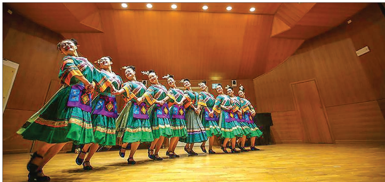
Chinese artists perform during the opening ceremony of Tocati in Verona of Italy, on 16 September 2016. The 14th edition of Tocati, an International Street Games Festival, kicked off Saturday in Italy's Verona and would last until 18 September. Artists from different places of China, the guest of honour of the 14th Tocati, brought traditional games, rituals, music and dances to the streets and squares of Verona's historical center.