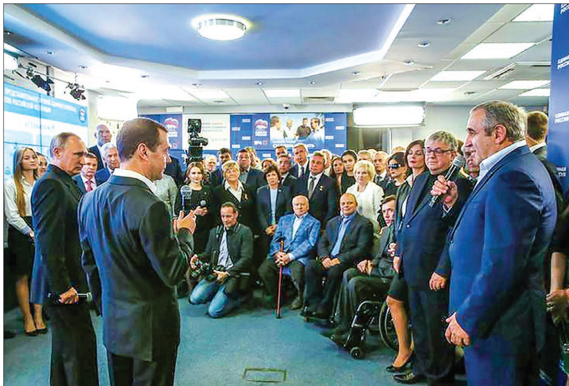
Russian President Vladimir Putin, Prime Minister and Chairman of the United Russia party Dmitry Medvedev and secretary of the United Russia party's General Council Sergei Neverov visit the party's campaign headquarters following a parliamentary election in Moscow, Russia, on 18 September 2016.