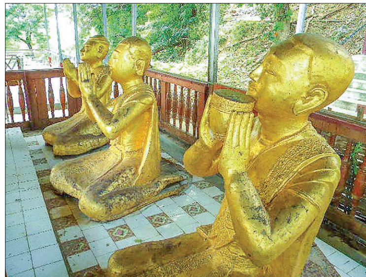
Statues dating back to Konbaung Era.

A museum dedicated not only to the pagoda but also to the history of Myanmar should be established in order to make historic items available for public viewing.— Kyaw Sein Win