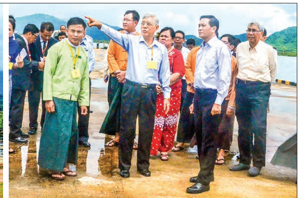
Vice President U Henry Van Thio visits Dawei Special Economic Zone project in Dawei, Taninthayi Region.