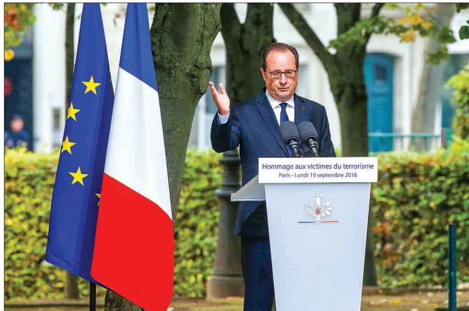
French President Francois Hollande delivers a speech during a ceremony in tribute to victims of terror attacks in Paris, France, on 19 September 2016. PHOTO: REUTERS

France has been under emergency law since the Paris attacks. Hollande's government has stepped up hiring of police and put thousands of extra police and soldiers on the streets to protect sensitive sites.—Reuters