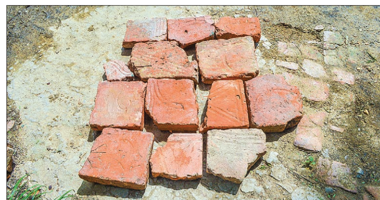
Bricks dating back to Pyu Era.