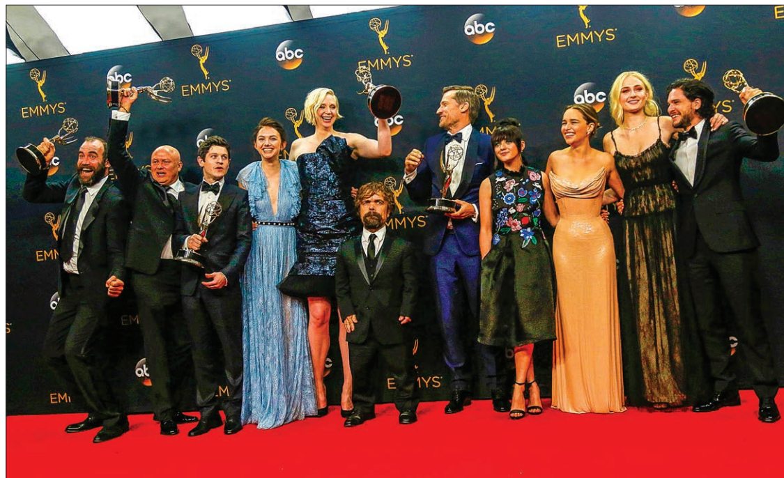
The cast of HBO's "Game of Thrones" pose backstage with their award for Outstanding Drama Series at the 68th Primetime Emmy Awards in Los Angeles, California US, on 18 September 2016.