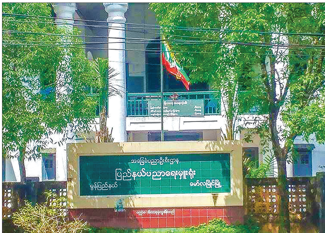
Office of the State Education Officer, Mawlamyaing, Mon State.

To provide better education services, the township general administration department, the construction department and relevant bodies are carrying out the construction as well as the renovation of school buildings. — Myitmakha News Agency