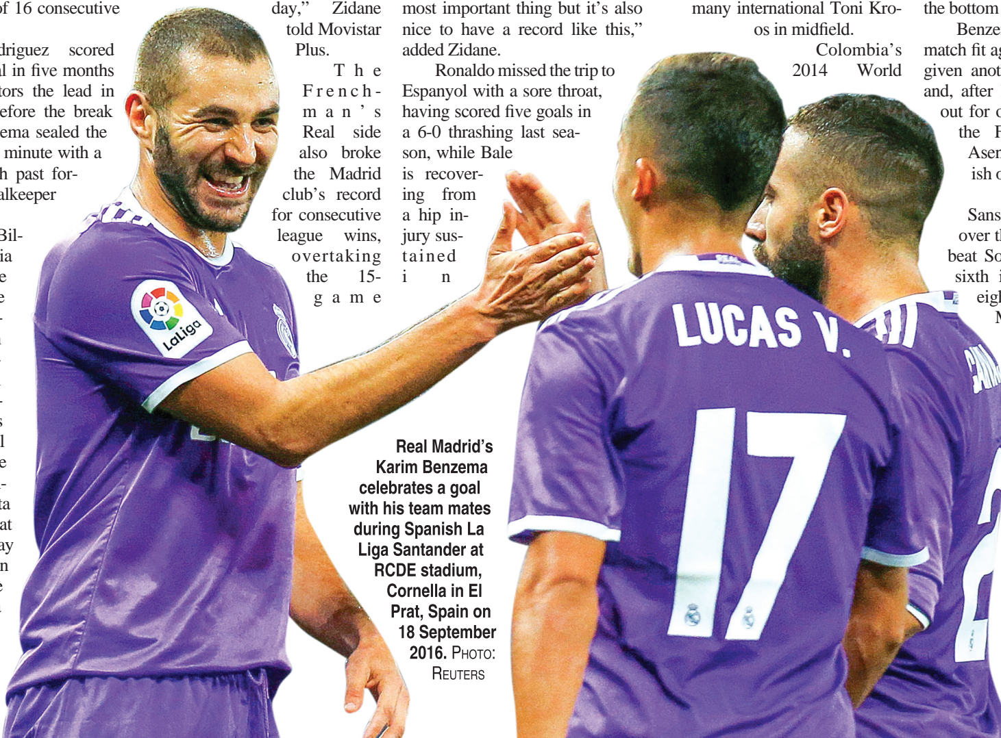
Real Madrid's Karim Benzema celebrates a goal with his team mates during Spanish La Liga Santander at RCDE stadium, Cornellà in El Prat, Spain on 18 September 2016.

Italian Sansone had also given the hosts the lead three minutes earlier from inside the box after the Brazilian former Chelsea striker Alexandre Pato had missed a penalty.—Reuters