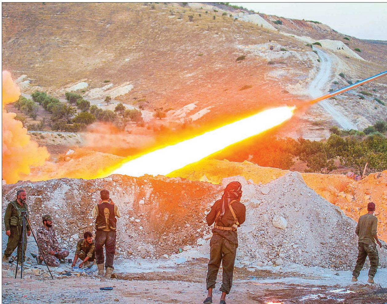
Free Syrian Army fighters launch a Grad rocket from Halfaya town in Hama province, towards forces loyal to Syria's President Bashar al-Assad stationed in Zein al-Abidin mountain, Syria, on 4 September 2016.

The panel said earlier this month that it has a database of some 5,000 detailed interviews and information, some of which is being shared with national jurisdictions seeking to prosecute their nationals serving as foreign fighters.—Reuters