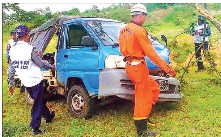
A light truck overturns on Yangon-Mandalay road.

The remaining passengers, including two children less than five years of age, sustained serious injuries. They have been