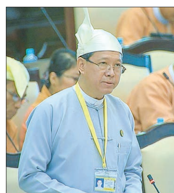
Dr Myo Thein Gyi.

his assurance that the plan is set to provide equal access to quality education, thus narrowing the rural-urban gap in education.