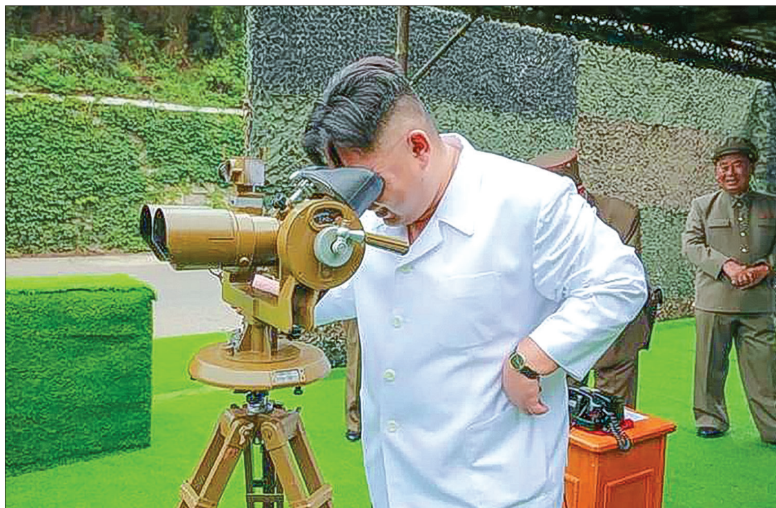
North Korean leader Kim Jong Un provides field guidance during a fire drill of ballistic rockets by Hwasong artillery units of the KPA Strategic Force, in this undated photo released by North Korea's Korean Central News Agency (KCNA) in Pyongyang on 6 September, 2016.

His trip comes amid a fresh push by the United States and South Korea for more sanctions