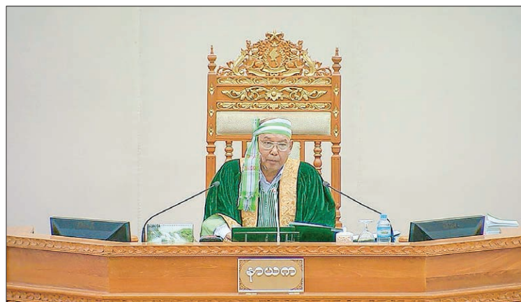
Speaker Mahn Win Khaing Than.

PYIDAUNGSU HLUTTAW approved the government's plan to borrow K3,090 billion from the Central Bank of Myanmar for the Union Government Deposit Account for 2016-2017 FY during its 11th day session yesterday.