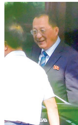
North Korean Foreign Minister Ri Yong Ho gets in a car at the North Korean Embassy in Beijing on 12 September 2016.

While noting that the nuclear issue boils down to the "conflict" between North Korea and the United States, she insisted that China has made relentless efforts to uphold peace and stability on the Korean Peninsula.—Kyodo News