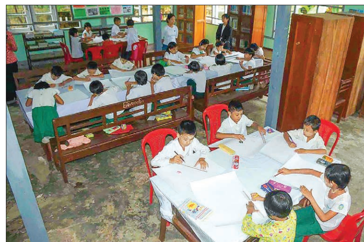
Children participating in Arts competition.