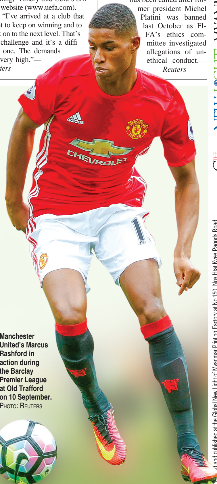
Manchester United's Marcus Rashford in action during the Barclays Premier League at Old Trafford on 10 September.

"The kid gave us what we had needed in the first half."— Reuters