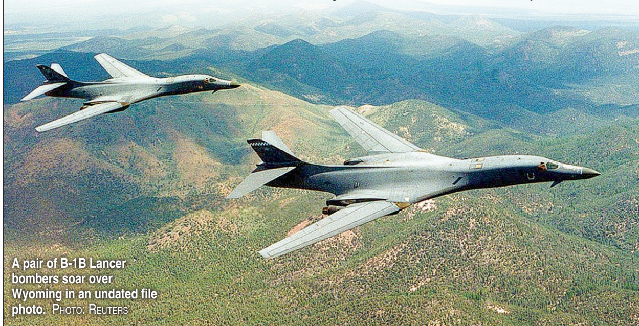
A pair of B-1B Lancer bombers soar over Wyoming in an undated file photo. PHOTO: REUTERS

delayed a planned US military B-1B bomber flight to the Korean peninsula that had been scheduled for Monday. — Reuters