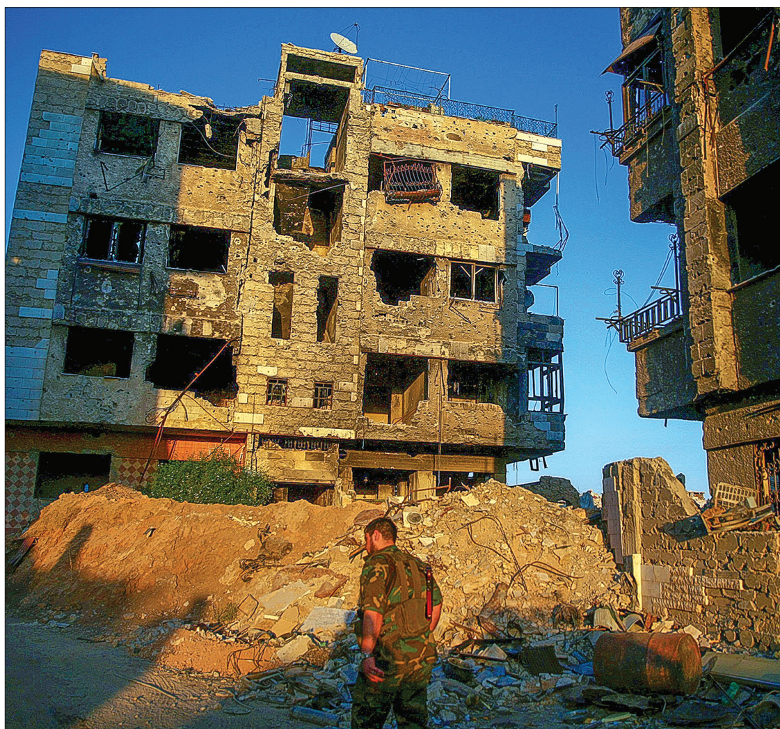
A fighter from the Free Syrian Army’s Al Rahman legion walks past damaged buildings in the rebel held Jobar, a suburb of Damascus, Syria on 6 September 2016.

Underscoring the war’s global impact, President Bashar al-Assad is backed by Russia’s air force, Iran’s Revolutionary