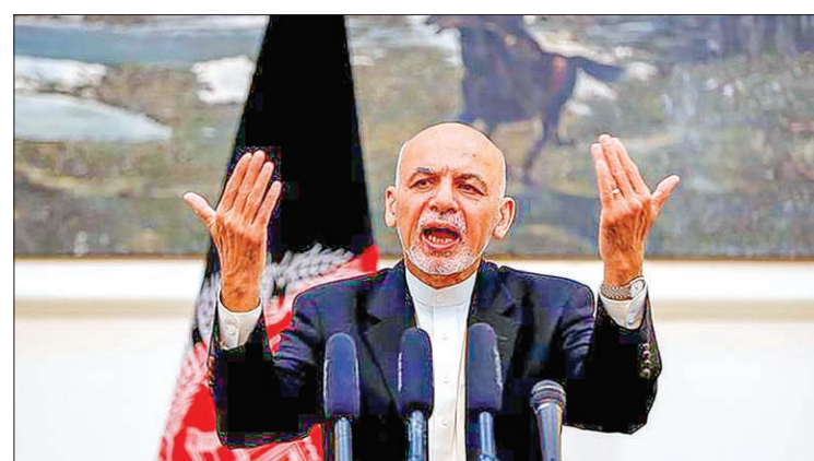
Afghanistan’s President Ashraf Ghani speaks during a news conference in Kabul, Afghanistan on 11 July 2016.

During the bloody civil war of the 1990s, Hekmatyar’s forces were accused of killing thousands of civilians in heavy bombardments of the Afghan capital and more recently, they were linked with several al Qaeda and Taliban attacks on international forces in Afghanistan and the Kabul government. Peace talks with the Taliban, the largest insurgent group in Af-