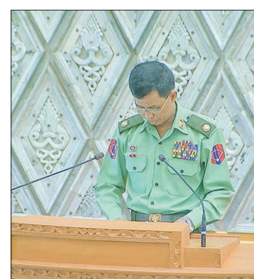
Brig-Gen Khin Maung Aye.

ister then elaborated on the ongoing National Education Sector Plan, calling on the parliament to put the proposal on record so there can be development in the education sector following the establishment of peace in all regions. A majority of the Amyotha Hluttaw decided not to approve the proposal. —Myanmar News Agency