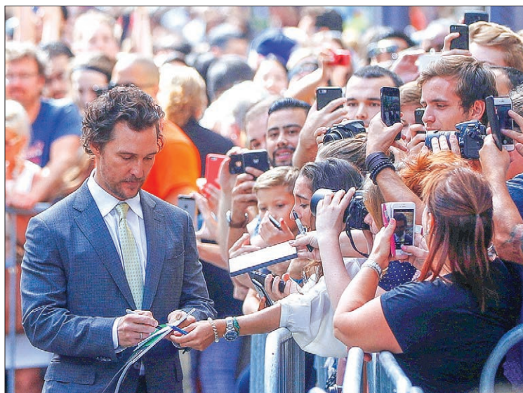
Actor Matthew McConaughey arrives on the red carpet for the film "Sing" during the Toronto International Film Festival (TIFF) in Toronto, Canada, on 11 September 2016.

TORONTO — Comedy animation feature "Sing" premiered at the Toronto Film Festival on Sunday to an enthusiastic reception from filmgoers before Academy award winner Jennifer Hudson and singer-songwriter Tori Kelly performed songs from the movie.