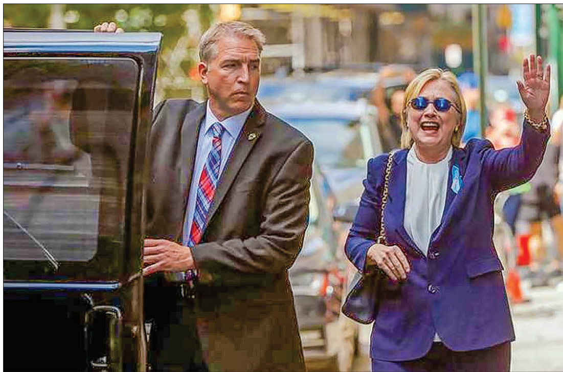
US Democratic presidential candidate Hillary Clinton leaves her daughter Chelsea's home in New York, United States on 11 September, 2016, after Clinton left ceremonies commemorating the 15 th anniversary of 11 September attacks feeling 'overheated.'

WASHINGTON — Democrat Hillary Clinton's bout of pneumonia, kept secret until she nearly collapsed on Sunday, has raised an element of uncertainty about her health going into the final weeks of presidential campaigning and risks feeding a narrative from rival Donald Trump about her stamina.