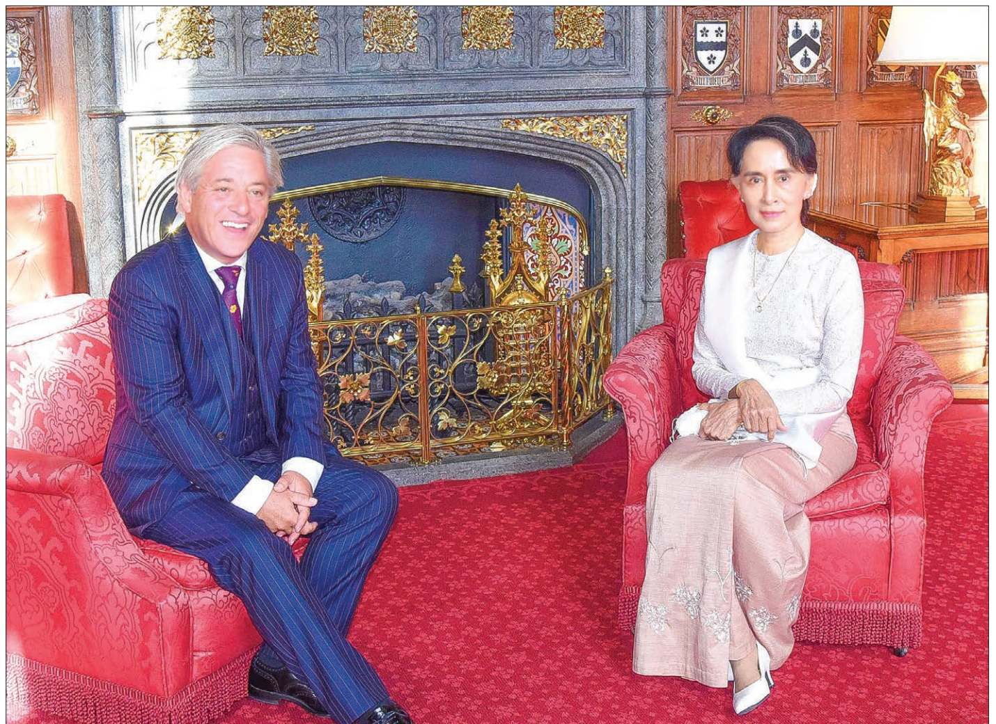
State Counsellor Daw Aung San Suu Kyi holds talks with the Speaker of the House of Commons, Rt Hon John Bercow MP.