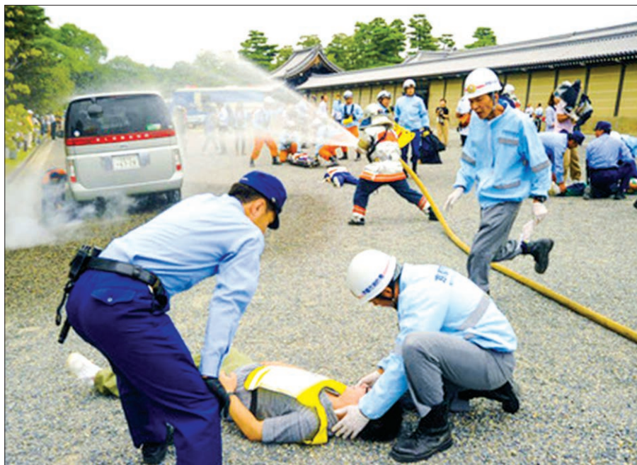
Photo taken on 12 September 2016, shows the first counterterrorism drill at the Kyoto Imperial Palace, which began allowing public access throughout the year in late July. Around 100 participants including police officers and firefighters confirmed steps for extinguishing fires, guiding evacuees and disposing of a bomb.

The Kyoto Imperial Palace started accepting vis-