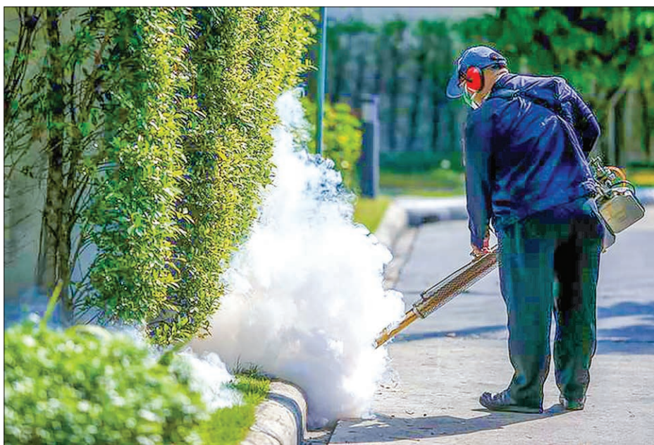
A worker sprays insecticide for mosquitos at a village in Bangkok, Thailand, January 13, 2016.