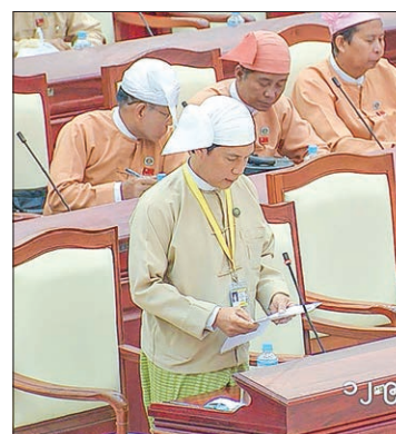
U Khin Maung Cho.

Landmine awareness education programmes and landmine clearance are being implemented in Kayin State in cooperation with local people, added the deputy minister. During the 31st day session, Union Minister for Industry U Khin Maung Cho also responded to questions about the return of a land plot used for the opening of the Win Thuzar shop in Mindon Township to the original owner and quicker implementation of an industrial zone project in Ponnagyun Township.