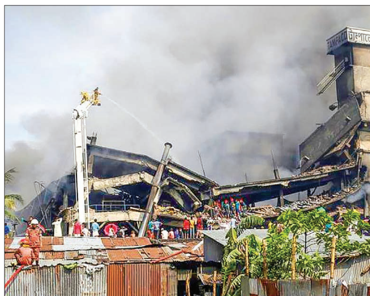
Firefighters extinguish a fire at a food and cigarette packaging factory outside of Dhaka, Bangladesh, on 10 September, 2016.

the Korean peninsula, a show of strength and solidarity with ally Seoul, scheduled for Monday. The flight from the US base in Guam would now take place on Tuesday, a US Forces in Korea official told Reuters, declining to identify the type of aircraft involved.—Reuters