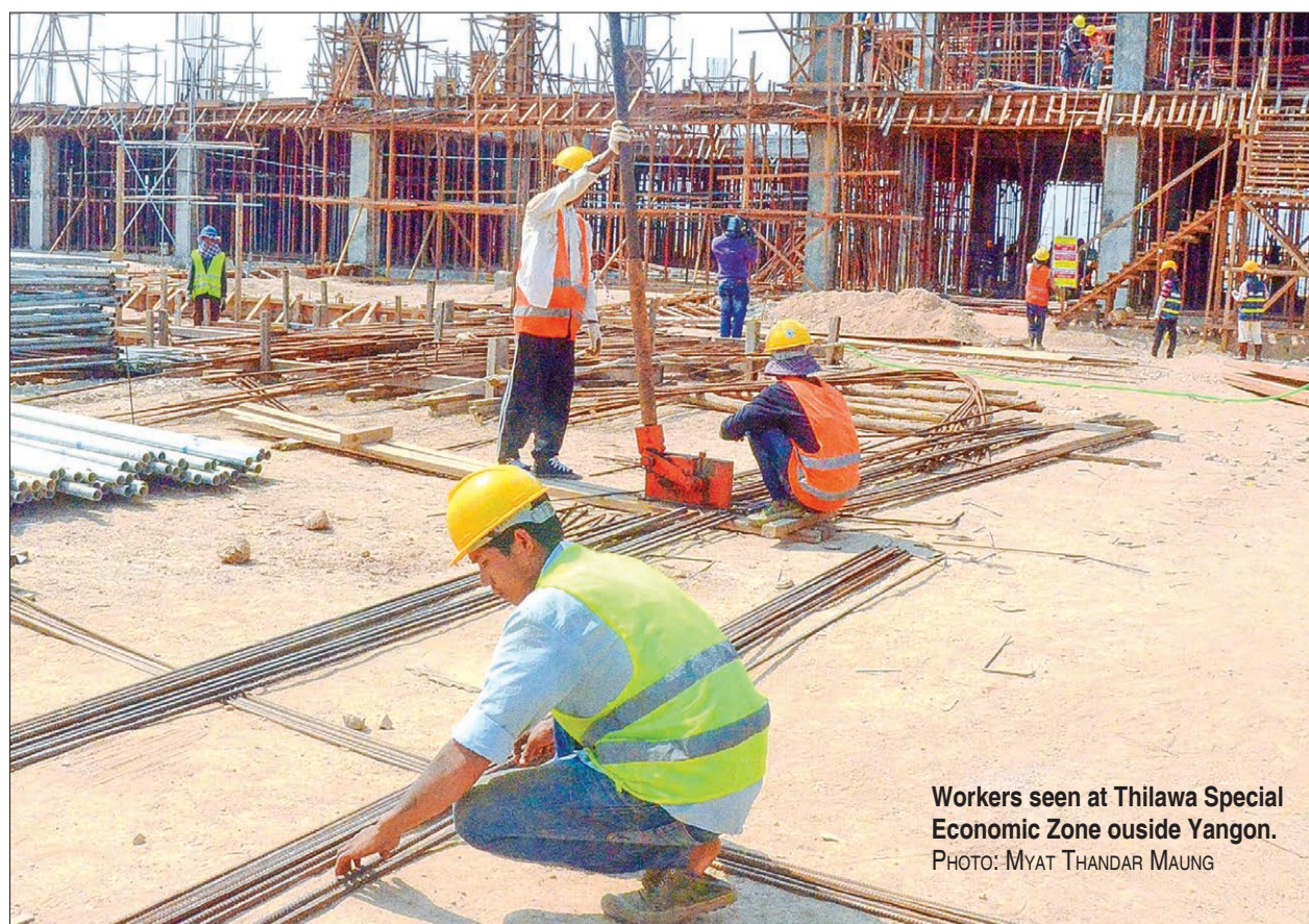
Workers seen at Thilawa Special Economic Zone outside Yangon.

The amount of citizen investment in the real estate sector constitutes over 30 per cent of the investments in various sectors, whereas FDI in this sector is about 5 per cent of FDI value in various sectors.—Mon Mon