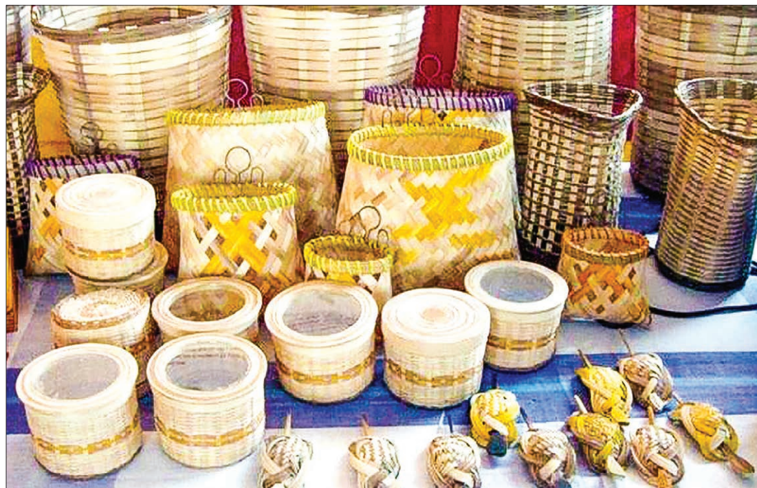
Bamboo products on display.

THE first-ever celebration in Myanmar of World Bamboo Day, which will be held at the International Business Center (IBC) in Yangon on 18 September between 9 a.m. and 5 p.m., according to the Myanmar Rattan and Bamboo Entrepreneurs' Association.