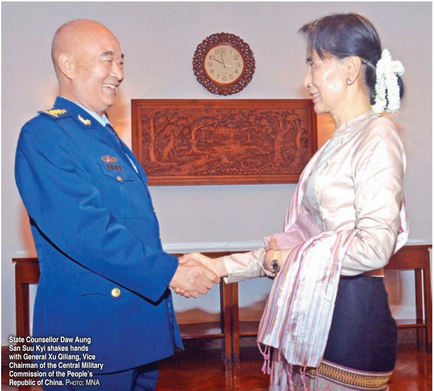
State Counsellor Daw Aung San Suu Kyi shakes hands with General Xu Qiliang, Vice Chairman of the Central Military Commission of the People's Republic of China.

The purpose of his visit to Myanmar is to cement bilateral ties, added the Central Military Commission Vice Chairman, highlighting the importance of people-to-people connectivity and cooperation between the two Defence Services.— Myanmar News Agency