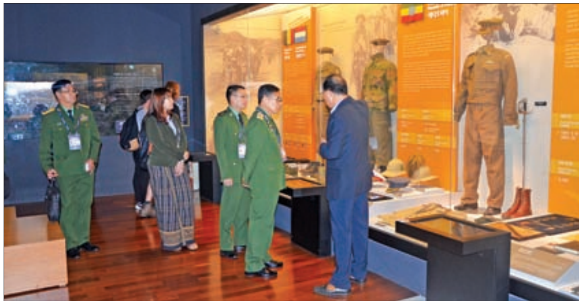
Vice Senior General observing Rok defence booth.