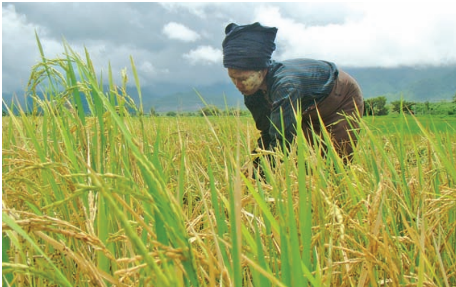
A farmer works at a field in Nay Pyi Taw.

The export of broken rice has also decreased by $191 million compared with the previous week.