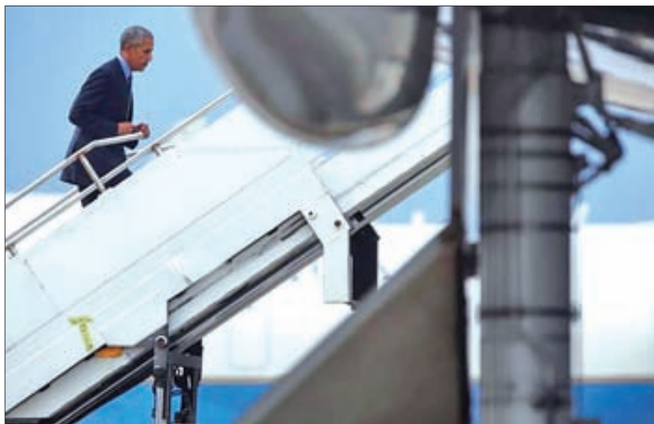
US President Barack Obama boards Air Force One to depart at the conclusion of his participation in the ASEAN Summits, from Wattay International Airport in Vientiane, Laos, on 8 September 2016.

Trump declared on Wednesday during a televised forum attended by mil-