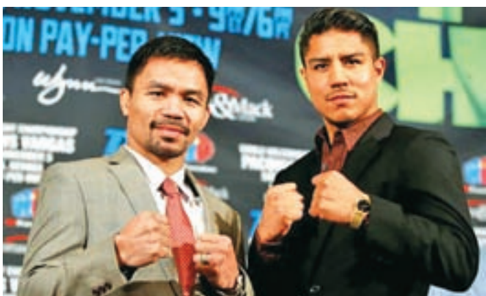
Manny Pacquiao & Jessie Vargas during the press conference at Beverly Hills Hotel, Beverly Hills, on 8 September.

"There will be a lot of challenges, the crowd will be behind us so it will be a good game."—Reuters