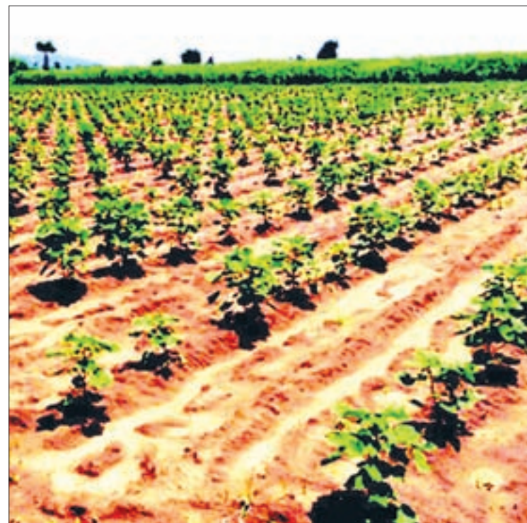
Indian cotton plantation in Myingyan Township .

Myingyan Township is situated in central Myanmar, where crops such as onion, peanut, sesame, cotton, pigeon pea, corn, chick pea, green gram, water melon and cucumber are also cultivated, it is learnt. —Than Zaw Min