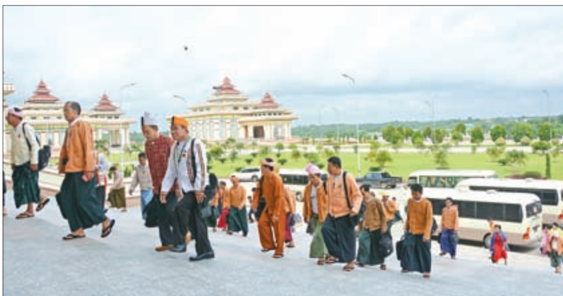
Pyithu Hluttaw representatives seen upon arrival at Pyithu Hluttaw.

He said that officials have clarified rules and regulations at government departments, saying that people have access to information