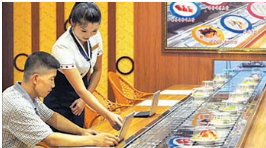
A customer (L) is assisted in placing orders with a touch panel at a newly opened sushi restaurant in Pyongyang on 7 September 2016. The two-story restaurant is equipped with a rotating conveyor belt to carry sushi to customers, a rare facility in the North Korean capital.

In North Korea, however, flash-freezing equipment is not yet common and many types of fish used for sushi are imported from China, according to restaurant operators in Pyongyang. —Kyodo News