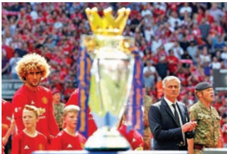
Manchester United manager Jose Mourinho and Marouane Fellaini line up with the Premier League trophy before the match, FA Community Shield, at Wembley Stadium, on 7 August 2016.

"This is my first fight since I was elected as a senator and it's a big challenge for me to try to get the belt and become a champion again, to win the fight as a senator.—Reuters