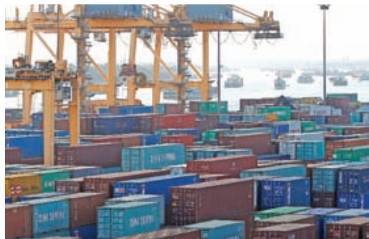
Containers are pictured at Asia World port in Yangon.

special goods at the prevailing market price. Both importers and exporters of special goods have to register, it has been learned from the Internal Revenue Department. Although the department has announced the deadline there are enterprises which have not yet sought permission. Those businesses will have action taken against them under the Commercial Tax Law, according to the department.— Ko Htet