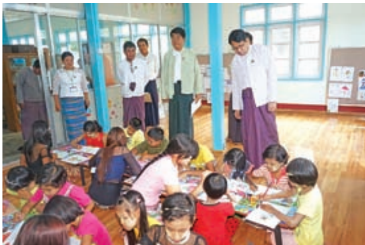
Union Minister Dr Pe Myint visits the children's library at the office of the Pyinmana Township Information and Public Relations Department.

During his visit to the office, the Union minister called on officials to allow children to use the library freely and invite librarians in basic education schools to observe children's activities in the library. He also called for turning the public library into a commu-