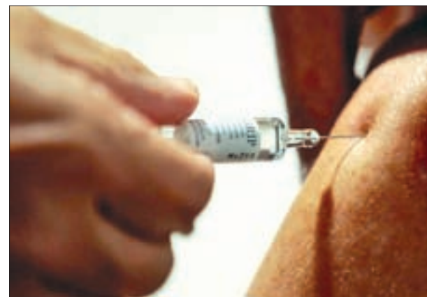
A nurse vaccinates a patient as part of the start of the seasonal influenza vaccination campaign in Nice, southeastern France, in 2015.

Vaccine refusal has been linked to outbreaks of diseases such as measles in the United States, Europe, Asia, the Pacific and Africa in recent years, and has also caused serious setbacks to global ambitions to eradicate polio. — Reuters