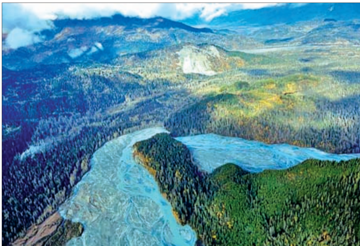
The Tsirku River winds through forest as seen in an aerial view near Haines, in southwestern Alaska, US in 2014.

They found that 11.6 million square miles (30.1 million square km) remain worldwide as wilderness, defined as biologically and ecologically intact regions