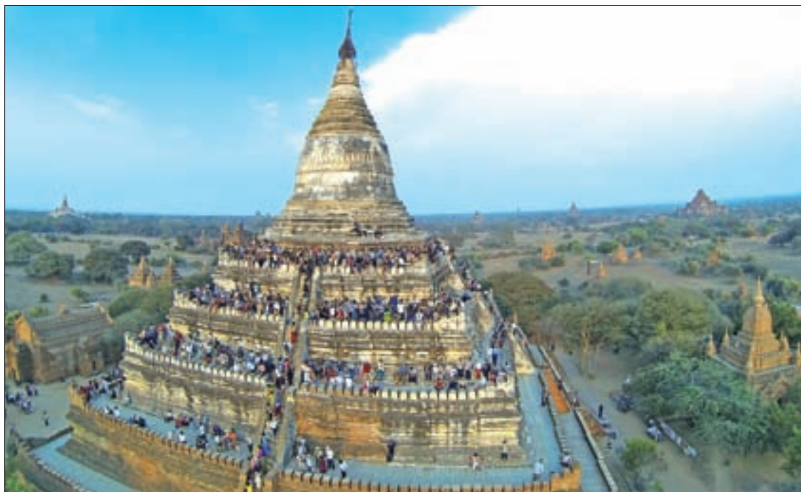
A Bagan pagoda being seen thronged with the pilgrims.

THE number of tourists visiting Bagan remains constant despite the recent earthquake that destroyed religious structures within the country's archaeological heritage site, according to the Ministry of Hotels and Tourism.