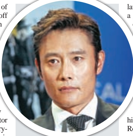
Actor Byung-hun Lee attends a press conference to promote the film The Magnificent Seven at TIFF the Toronto International Film Festival in Toronto, on 8 September 2016.

The film once again pairs Washington with Fuqua after working on 2001's "Training Day," for which Washington won a best actor Oscar, and 2014's