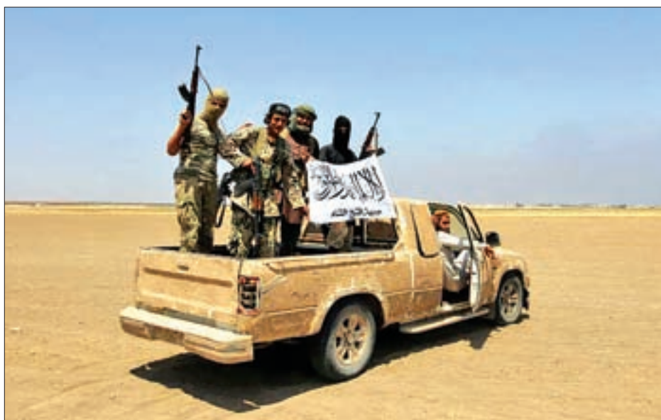
Fighters of the Syrian Islamist rebel group Jabhat Fateh al-Sham cheer on a pickup truck after a Russian helicopter was shot down in the north of Syria's rebel-held Idlib province, Syria, on 1 August 2016.

Since the US-led coalition was launched, air