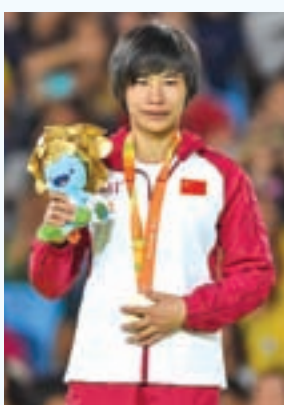
Li Liqing of China attends the medal presenting ceremony after the Women's Judo 48KG gold medal contest of Rio 2016 Paralympic Games in Rio de Janeiro, Brazil, on 8 September 2016. Li Liqing won the gold.

Song finished in 1 minute 21.43 seconds to