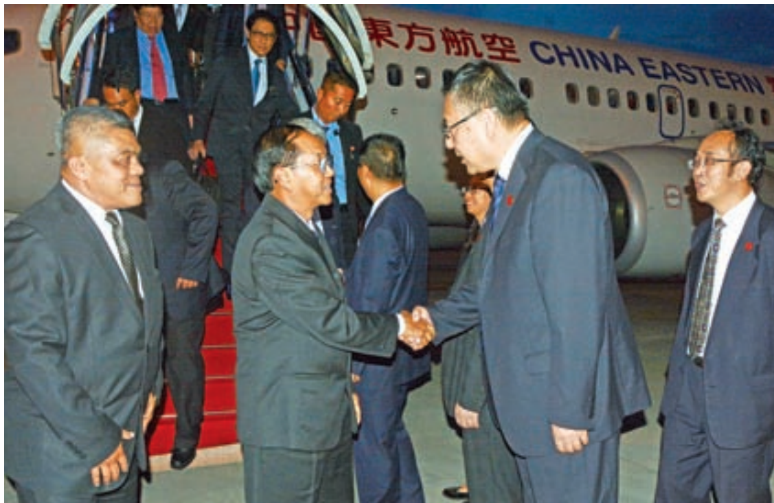
Vice President U Myint Swe is welcomed by officials in Nanning International Airport.