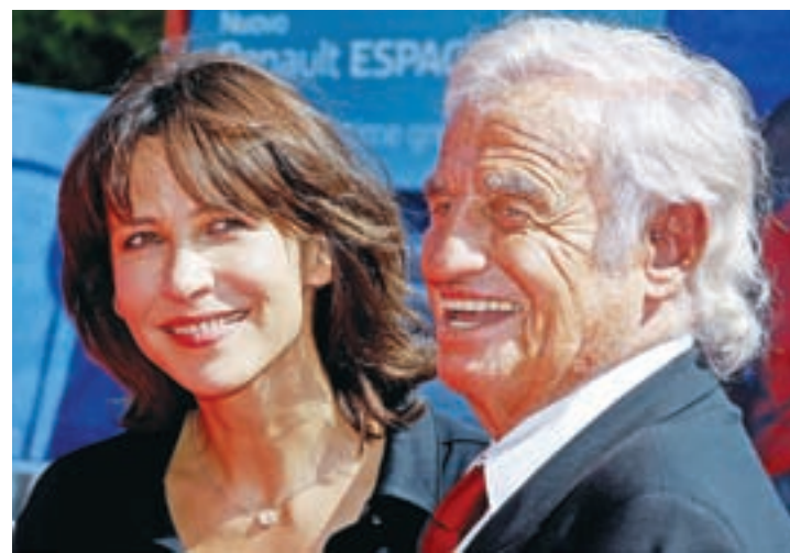
Jean-Paul Belmondo (R) and Sophie Marceau (L).

Asked which of the two he preferred, he said there was time for both. "I had fun doing both types of roles. Both are good. One day you laugh and the next day you cry, that's how it is," he said.—Reuters