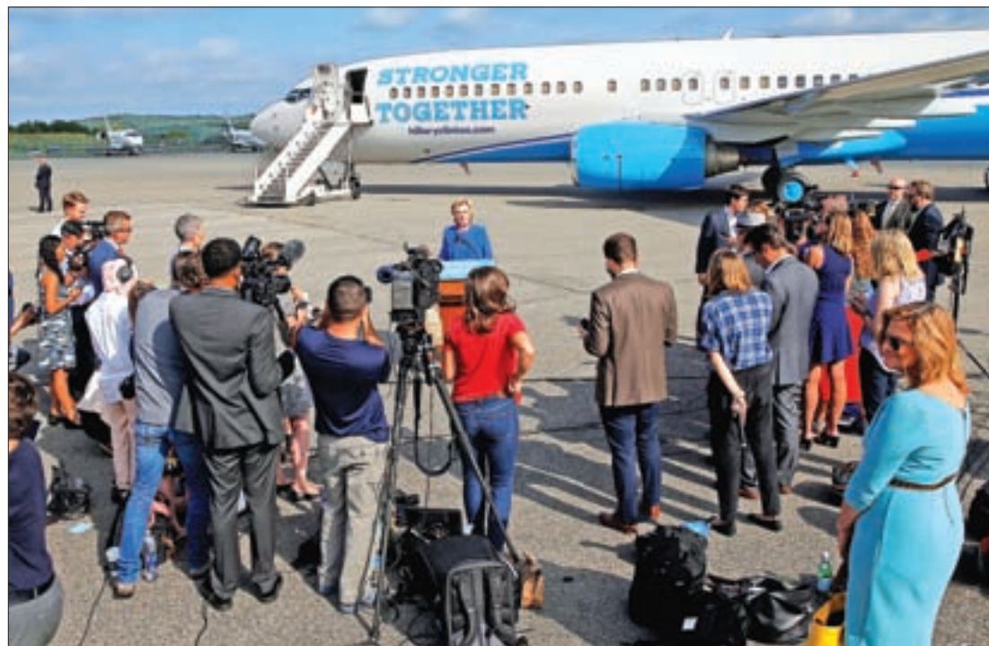
US Democratic presidential candidate Hillary Clinton holds a news conference on the airport tarmac in front of her campaign plane in White Plains, New York, United States, on 8 September 2016.

The intensifying political combat came as Clinton's lead in opinion polls has slipped in recent days. The current average of polls by website RealClearPolitics puts her at 45.6 per cent support, compared with Trump's 42.8 per cent. Obama also hit back at Trump for criticizing his foreign policy record, saying the Republican nominee was unfit to follow him into the Oval Office and the public should press Trump on his "outright wacky ideas." —Reuters