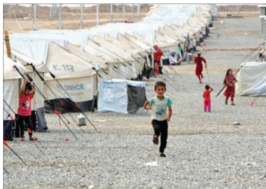
Displaced children, who fled from the Islamic State violence, are seen at Debaga Camp in the Makhmour area near Mosul, Iraq, on 30 August 2016.

Iraq's recapture over the summer of Qayyara airbase and surrounding areas along the Tigris river 60 km (nearly 40 miles) south of Mosul have set the stage for a big push on the city, which command-