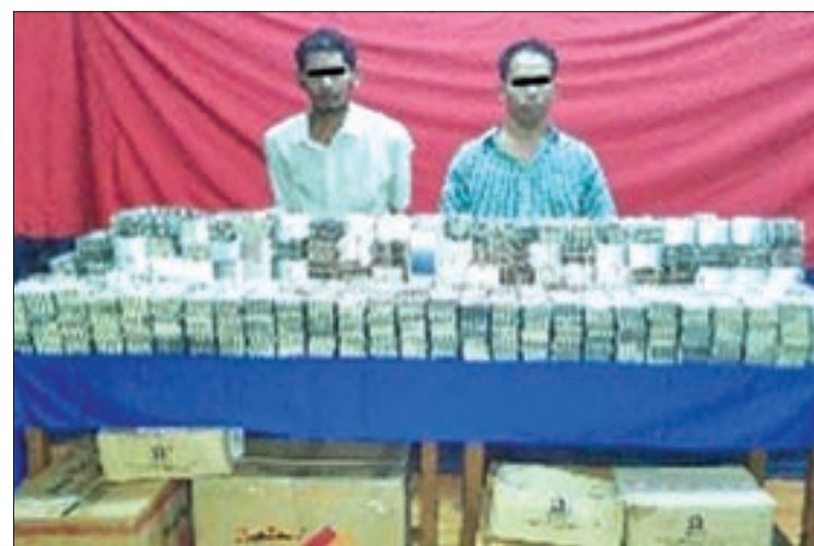
The drug dealers seen together with the drugs seized.

Police also seized 760 yaba pills from a man named Saw Tun who was onboard a passenger bus at Oriental toll gate, Lashio. Police have filed charges against all suspects under the Anti-Narcotic Drugs and Psychotropic Substances Laws. —Myanmar Police Force