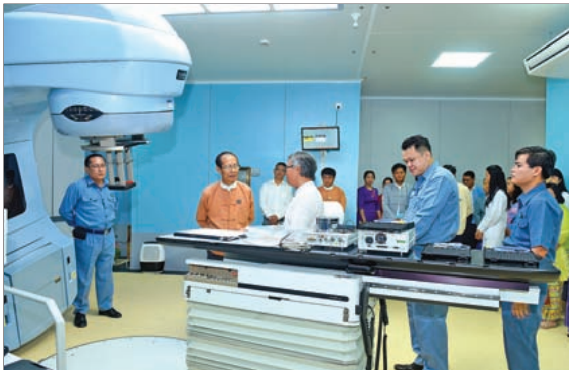
Mayor Dr Myo Aung being explained about the hospital.