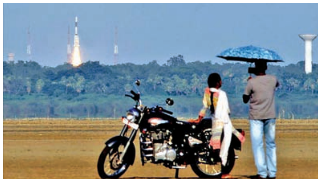
People watch as Geo-synchronous Satellite Launch Vehicle (GSLV) carrying advanced weather satellite INSAT-3DR takes off from the spaceport of Sriharikota in the southern state of Andhra Pradesh, India, on 8 September 2016. India on Thursday scripted a twin success by successfully launching its advanced weather satellite INSAT-3DR into space on board its heavy-duty rocket fitted with the indigenous cryogenic engine, which undertook its maiden operational flight.