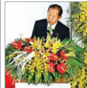
Toshihiro Nikai, secretary general of Japan's Liberal Democratic Party, speaks during the opening ceremony of the Viet Nam Japan University in Hanoi, on 9 September 2016.

"This (production levels) is a million-dollar question," said a source familiar with Iranian thinking. "The shuttle diplomacy is going on to clear which level is considered an aim for Iran."—Reuters