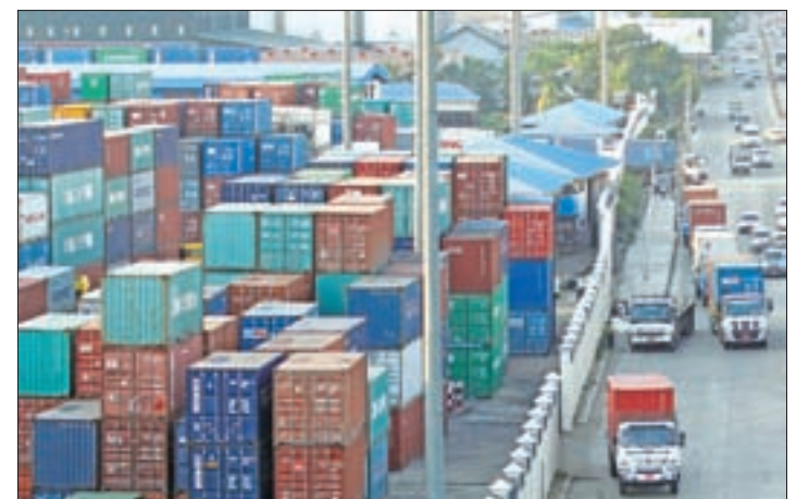
Containers are seen at Asia World port in Yangon.

According to central statistical organisation data, the trade deficit was US$91.9 million for the 2012-2013 FY, US$25,55.5 million for the 2013-2014 FY and UY$4,912.559 million for the 2015-2016 FY. Myanmar's trade deficit hit a record high in the 2015-2016 FY at US$ 5,407.464 million.— Min Thu