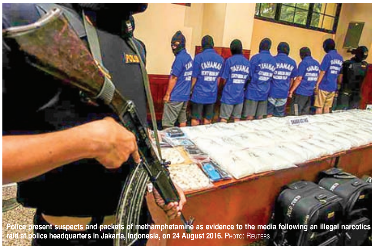
Police present suspects and packets of methamphetamine as evidence to the media following an illegal narcotics raid at police headquarters in Jakarta, Indonesia, on 24 August 2016.

China claims most of the potentially energy-rich sea, through which $5 trillion in ship-borne trade passes every year, and rejects the rival claims of Viet Nam, the Philippines, Brunei, Malaysia and Taiwan.—Reuters