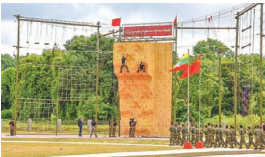
Senior General Min Aung Hlaing observing the training exercises of the special force. PHOTO: MNA

The training ground for the special force was opened on 8 April, 2016, offering training programmes including combatting urban terrorism. — Myanmar News Agency