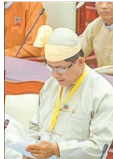
Deputy Minister for Planning and Finance U Maung Maung Win.

Next, the deputy minister replied to a question regarding the