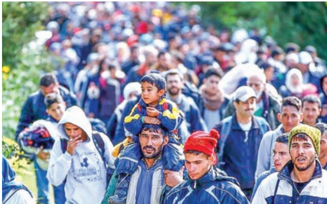
A migrant carries a child on his shoulders as they walk to cross the border with Austria in Hegyeshalom, Hungary, in 2015.