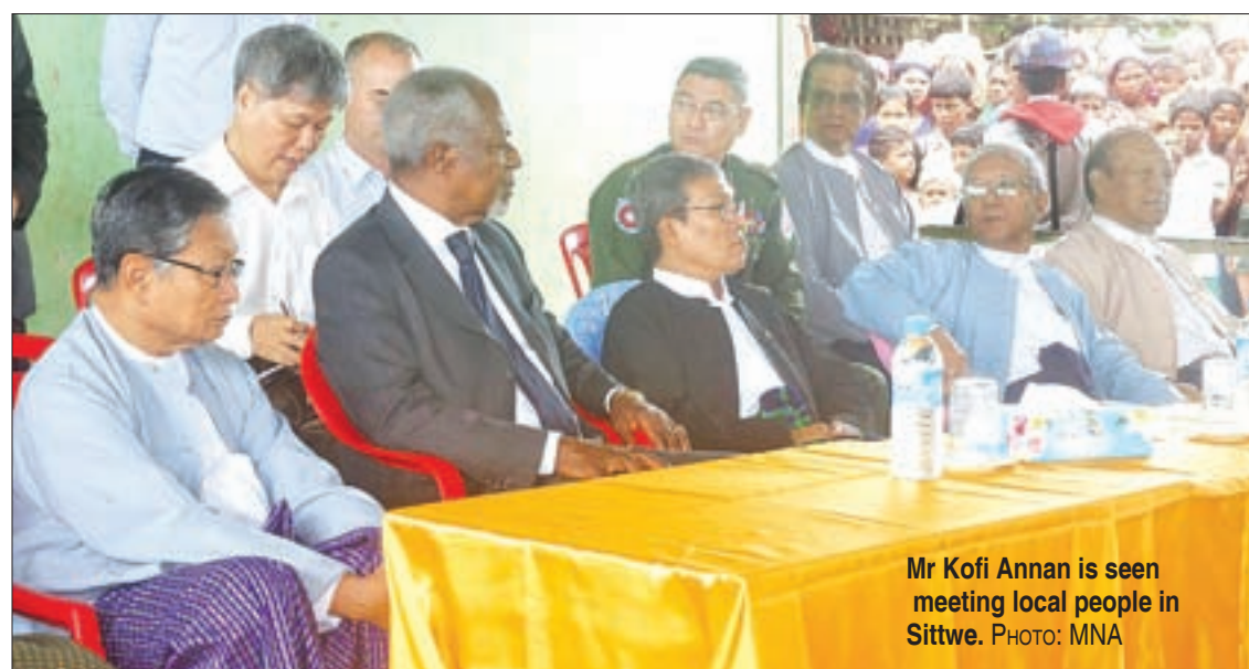
Mr Kofi Annan is seen meeting local people in Sittwe.

But this training is apparently just one of many the SME Development Department is implementing, reportedly inviting foreign experts from various fields to provide practical and theoretical training to a cross section of Myanmar's small and medium-size entrepreneurs. —Myitmakha News Agency