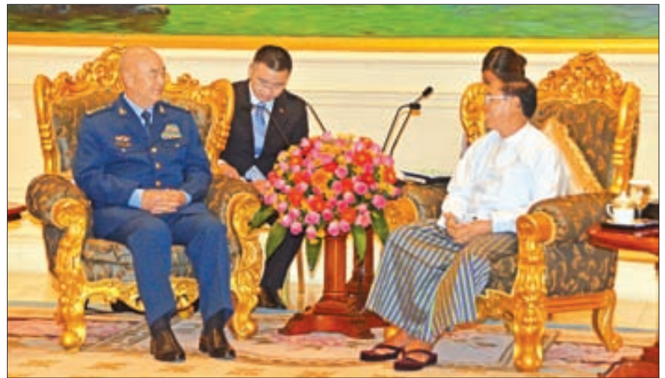
Vice President U Myint Swe holds talks with General Xu Qiliang.

During the call the two representatives held discussions on the promotion