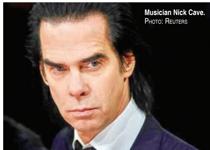
Musician Nick Cave.

Producers have said the movie is set decades after the original but little is known about the project. The cast includes Ford as well as Oscar winner Jared Leto and "House of Cards" actress Robin Wright.—Reuters