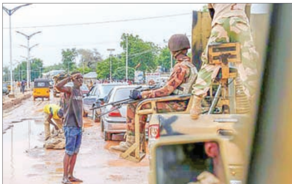
A boy salutes at a military truck in Maiduguri, Borno, Nigeria on 31 August 2016.

The military campaign has curbed an insurgency that has killed at least 15,000 people since 2009 but in a new phase of the conflict, the army now finds itself facing small groups of guerrillas operating in the sparsely