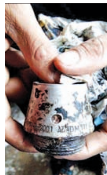
MA 7/60mm time bomb.

No one was injured in the accident, it has been reported, but two fire engines and the main office were destroyed in the explosion. According to a police investigation, the bomb was an MA 7/60mm time bomb. AN investigation is ongoing.—District IPRD