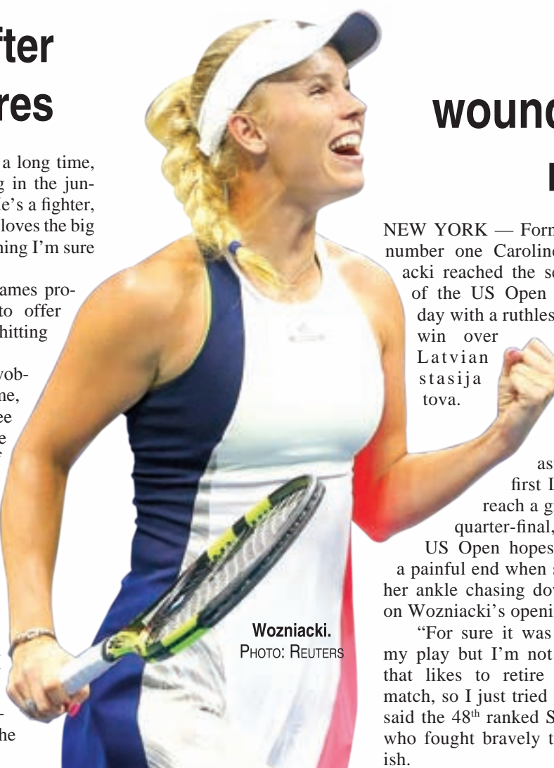
Wozniacki.

Tsonga said when he felt pain in his knee, he knew it was over. "It's something I had already in the past," he said.—Reuters