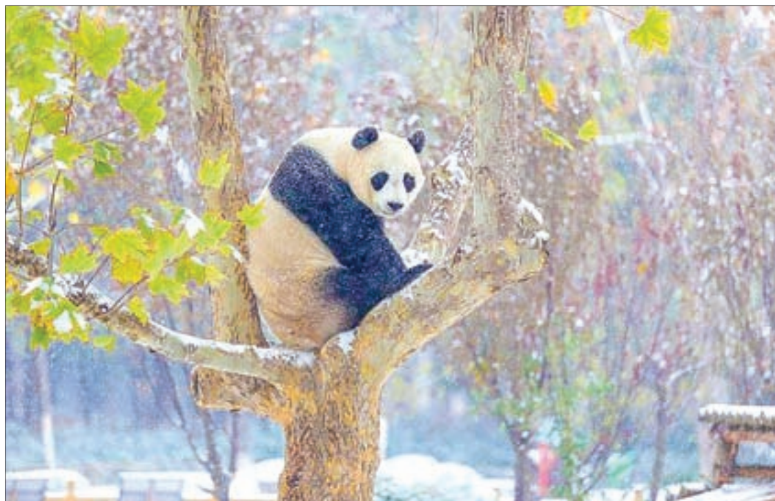
A giant panda sits on a tree during the first snow in Jinan, Shandong province, in 2015.

“The present protection achievements will be lost and some small sub-populations may die out.” Shi Xiaogang, of the Wolong National Nature Reserve in southwestern Sichuan province, China's main panda conservation centre, said pandas still needed continuous protection, according to Xinhua. It was good China's efforts had been recognised. “But as conservators, we know that the situation of the wild panda is still very risky,” Shi said.—Reuters