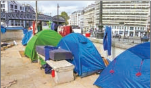
Migrants tents are seen at a makeshift camp on a street, northern Paris, France, on 6 September 2016.

"We have to come up with new ways of overcoming the situation. Things are saturated," Hidalgo told a news conference. "These migrant camps reflect our values." Hidalgo said the camps would be temporary and cost 6.5 million euros to set up, of which the Paris municipal authorities would cover 80 per cent. While France has been much less affected by Europe's migrant crisis than neighbouring Germany, thousands of asylum seekers use it as a transit point in the hope of reaching Britain. Truck drivers, farmers and Calais business owners on Monday blocked traffic on the motorway approach to Calais demanding a deadline for the dismantling of the "jungle".—Reuters