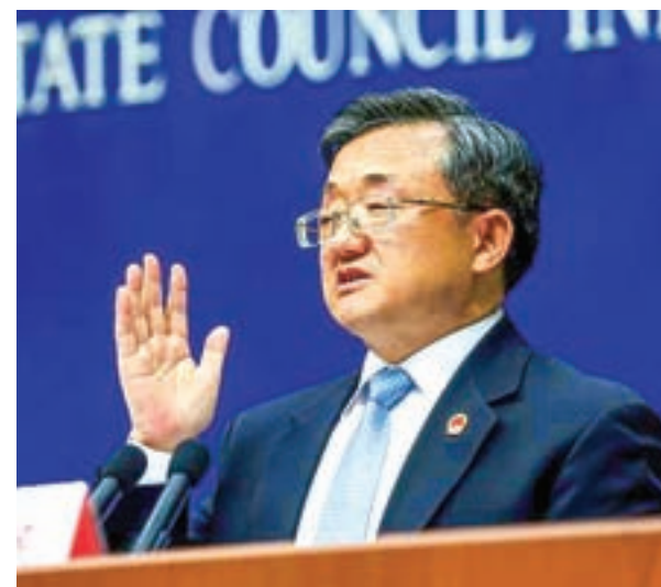
China's Vice Foreign Minister Liu Zhenmin speaks during a news conference in Beijing, on 13 July 2016.

He said the two countries were also looking into setting up a hotline to tackle emergencies in the disputed South China Sea. China and Southeast Asian