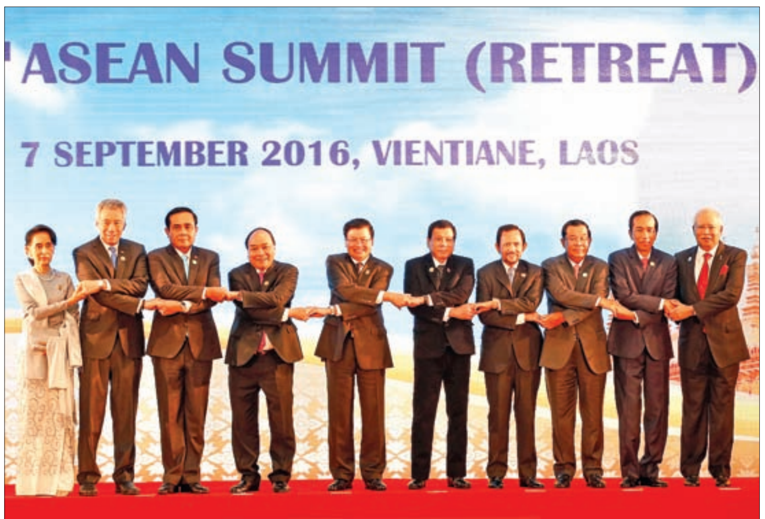
State Counsellor Daw Aung San Suu Kyi, left, with Asian leaders at the ASEAN Summit yesterday in Vientiane, Laos.

In the evening, the State Counsellor attended a dinner hosted by Laotian Prime Minister Mr. Thongloun Sisoulith and his wife in honour of the United Nations Secretary-General and ASEAN Heads of State/Government.— Myanmar News Agency