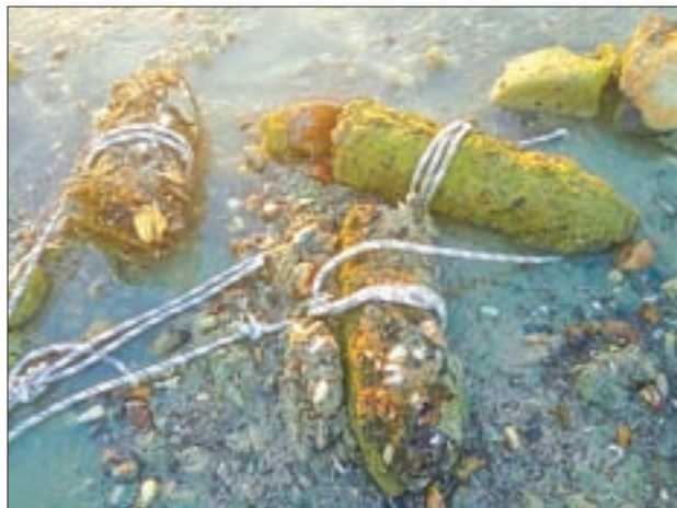
An Israeli police handout photograph shows what a police spokesperson says are World War I artillery shells discovered in the Sea of Galilee in Tiberias, Israel, made available by Israeli police, on 6 September 2016.