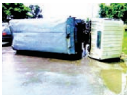
The bus being seen overturned.

NINE people were injured on Monday after a passenger bus went off the Yangon- Nyaungdon road and overturned near Aung Myay Thayar Pagoda road in Hlaing Thayar township, Yangon region.