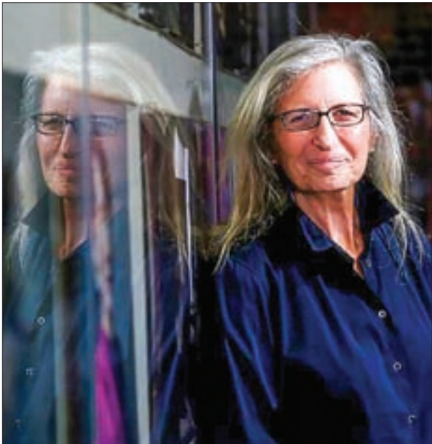
US photographer Annie Leibovitz is reflected in glass during a press preview of her exhibition ‘WOMEN: New Portraits’ at Wapping Hydraulic Power Station in London, Britain, on 13 January 2016.