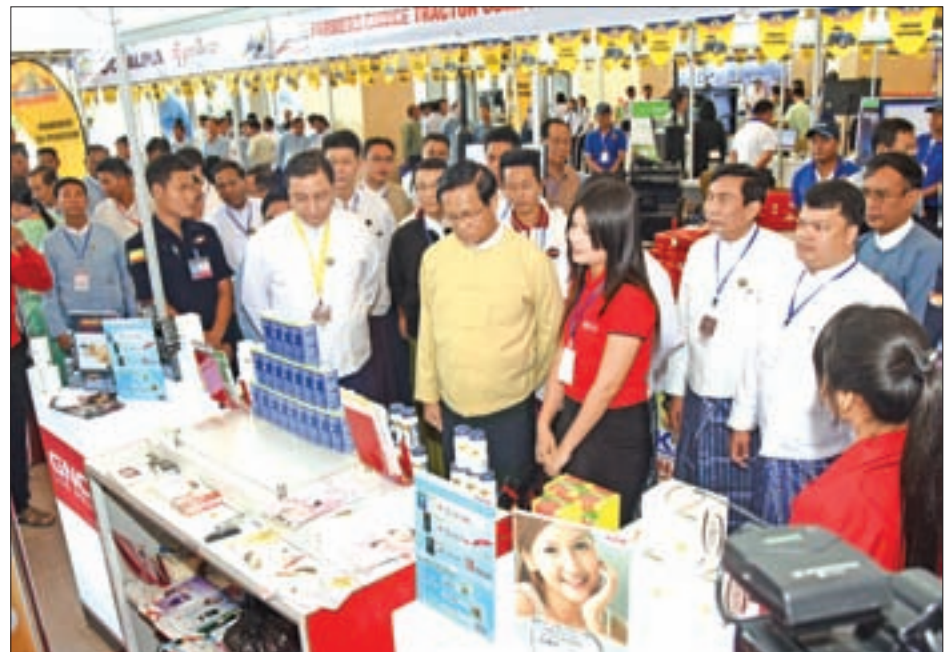
Vice President U Henry Van Thio visits the International Technology & Industry Show.

ed to visit the Show where a seminar on products will be held on Friday.— Myanmar News Agency