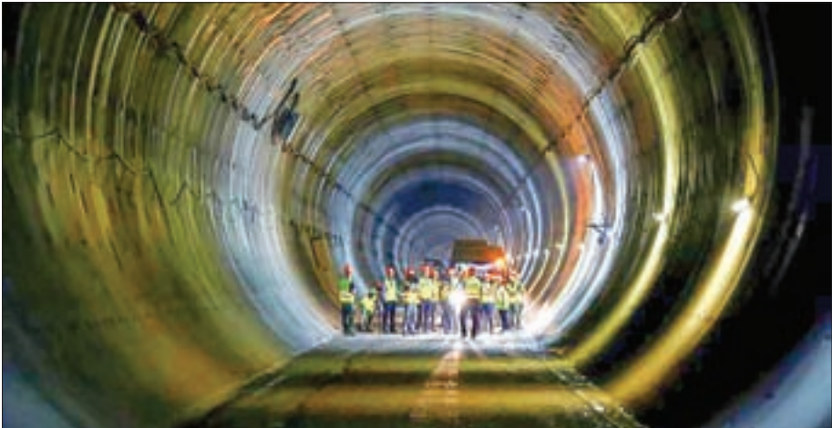
Members of the media interview an Israel Railways official during a media tour showcasing the last stages of the construction of a new high-speed railway between Tel Aviv and Jerusalem, near Jerusalem, on 6 September 2016.