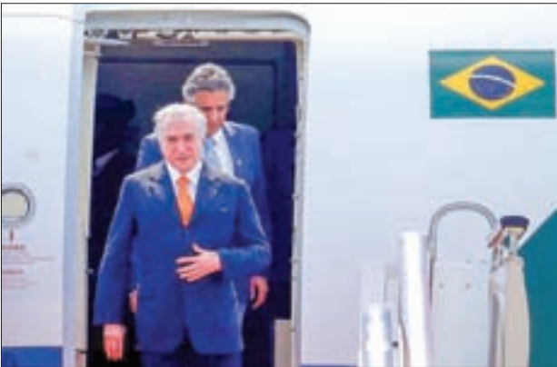
Brazil's President Michel Temer arrives at the Hangzhou Xiaoshan international airport before the G20 Summit in Hangzhou, Zhejiang Province, China, on 2 September 2016.

beef exporter. The coveted appointments of directors to the funds' boards were made by political parties and the probe is expected to spread to Brazil's political establishment, where some 50 politicians are already under investigation in the Petrobras scandal. Temer's office said the appointments were made during the 13 years of Workers Party rule that ended with Rousseff's removal from office last week, and the "irregularities" uncovered by the police had nothing to do with the current administration. "The Workers Party appointed the pension fund directors from the moment it took office in 2003 and they were closely linked to the unions," said a Temer aide who asked not to be named. "The Workers Party was responsible for the big loss suffered, ironically, by the workers of the state companies who were saving for their retirement," the aide said. "This has not even scratched the image