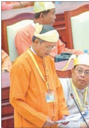
Union Minister for Hotels and Tourism U Ohn Maung.

minister, Myanmar was listed in 1987 but did not enjoy LDC benefits due to economic sanctions.