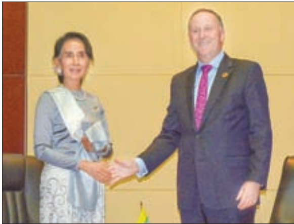
State Counsellor Daw Aung San Suu Kyi shakes hands with New Zealand Prime Minister Mr. John Key.

STATE Counsellor Daw Aung San Suu Kyi held talks with the Prime Ministers of Viet Nam, Japan and New Zealand at the National Convention Centre in Vientiane, Laos separately.