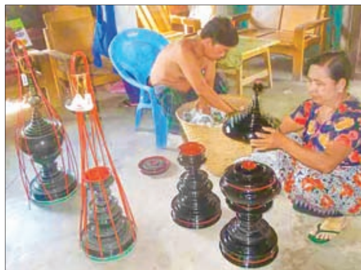
Myanmar lacquerware are mainly produced in Bagan.

Lacquerware rice bowls have been increasingly in demand. The