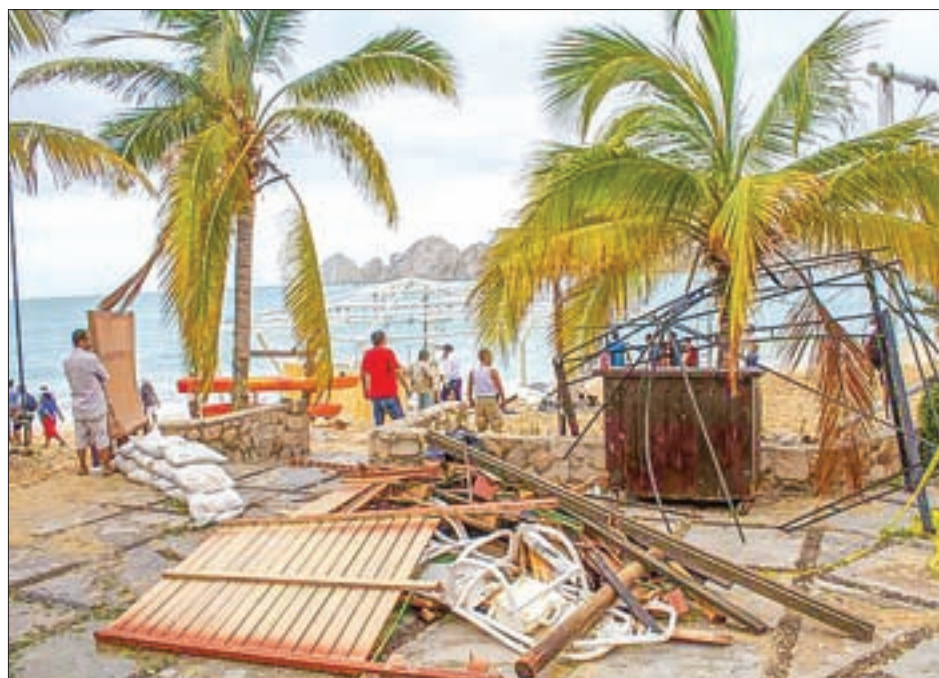
Residents stand next to debris of a restaurant in the aftermath of Hurricane Newton in Los Cabos, Mexico, on 6 September 2016.

Newton was expected to move north-northeast on Wednesday, and into southeastern Arizona by Wednesday afternoon, the NHC said. The storm should dissipate by early Thursday, it added.—Reuters