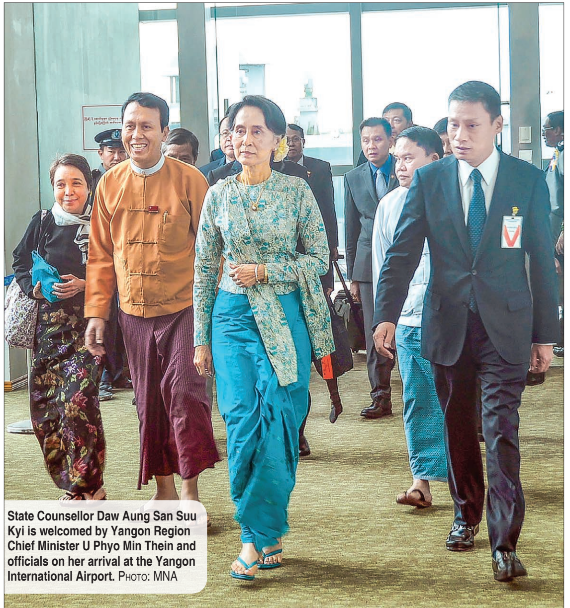
State Counsellor Daw Aung San Suu Kyi is welcomed by Yangon Region Chief Minister U Phyo Min Thein and officials on her arrival at the Yangon International Airport.