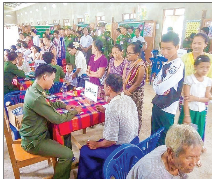
Military mobile medical team providing healthcare services to residents of Kayin State.