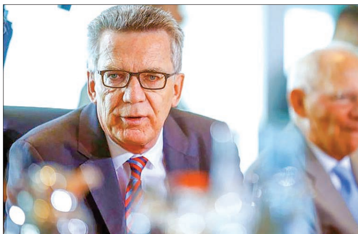
German Interior Minister Thomas de Maiziere attends the cabinet meeting at the Chancellery in Berlin, Germany, on 17 August 2016.

jihadist militant group Islamic State claimed two attacks in July, one on a train near Wuerzburg and one at a music festival in Ansbach, in which asylum-seekers injured 20 people.