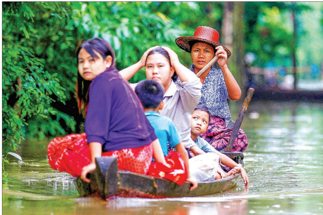
A family rows their boat through a flooded road in Kyaung Kone in Ayeyarwady Region, August 12, 2016.

Additionally, the Insurance Business Regulatory Board has been planning compensation under crop insurance. But it takes a year or a year and a half to formulate this. Myanma Insurance and private insurance businesses will jointly implement this, he continued. Myanma Insurance paid Ks1. billion in fire insurance compensation in the first six months of this year. Compensations have shot up this year compared to previous years. —200