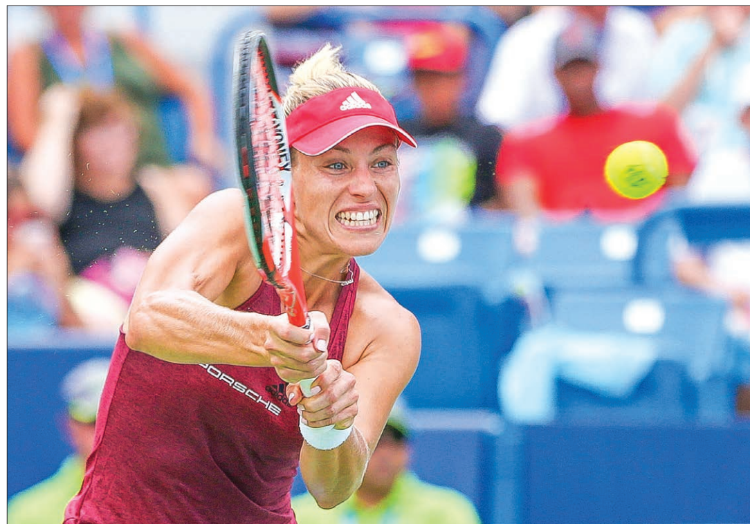
Angelique Kerber (GER) returns a shot against Simona Halep (ROU) in the semifinals during the Western and Southern tennis tournament at Linder Family Tennis Centre, Mason, OH, USA, on 20 August 2016.

"I was not thinking about that she's a French Open champion. This you cannot take on the court."—Reuters