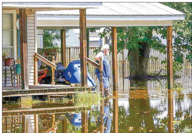
A man wades through flood waters in Sorrento, Louisiana, US, on 20 August 2016.

The National Weather Service reported that nearly 26 inches (66 cm) of rain have fallen at the Baton Rouge airport this month, making August the wettest on record since 1893.—Reuters