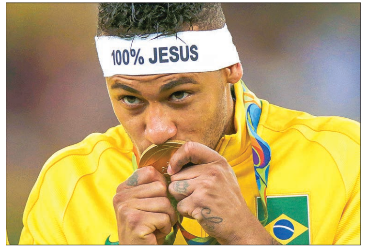
Neymar (BRA) of Brazil kisses his gold medal during Men's Football Tournament Victory Ceremony at Maracana in Rio de Janeiro, Brazil on 20 August 2016.

hind them, Brazil took the game to their opponents and dominated possession and territory.