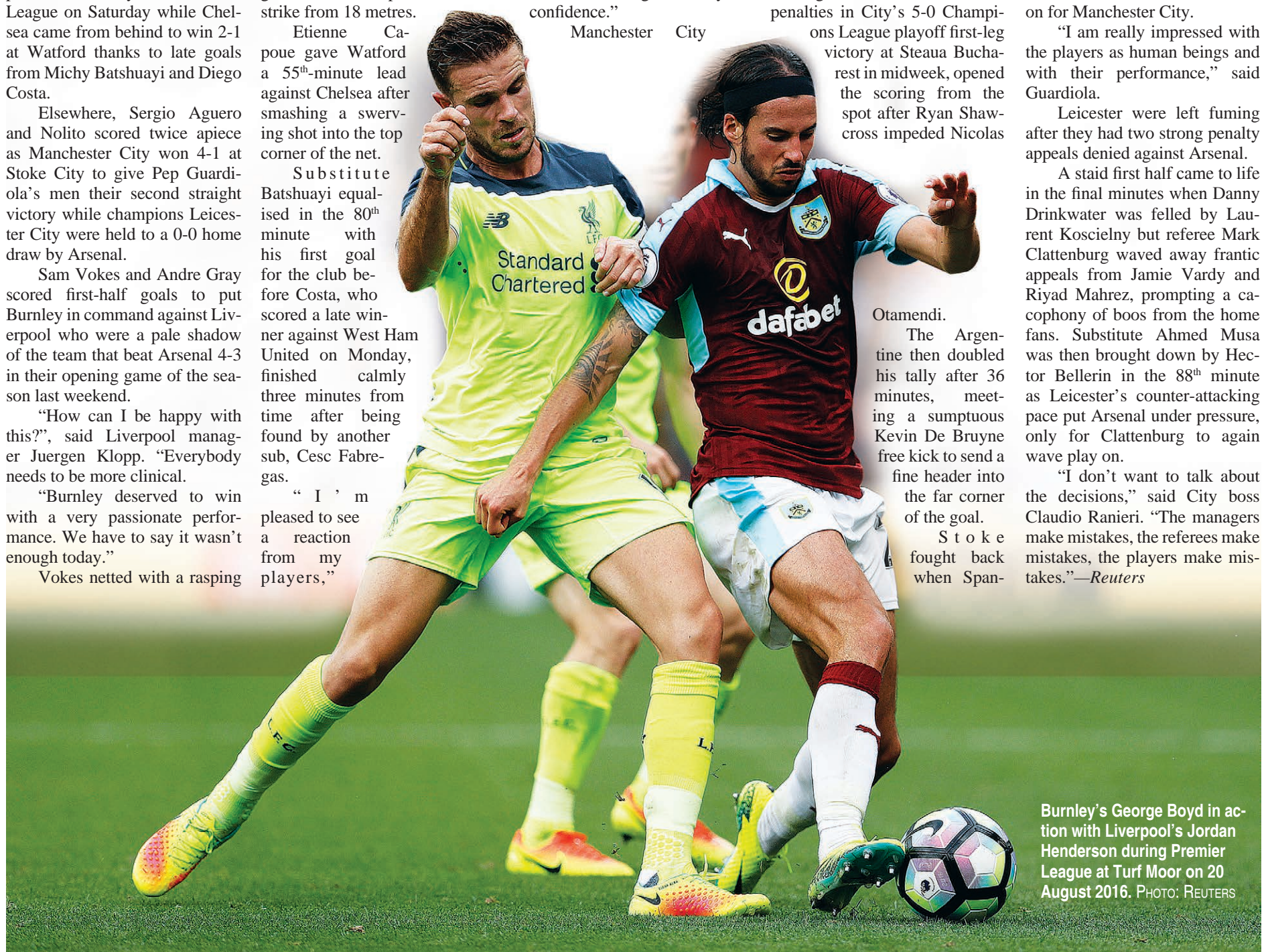
Burnley's George Boyd in action with Liverpool's Jordan Henderson during Premier League at Turf Moor on 20 August 2016.

"I don't want to talk about the decisions," said City boss Claudio Ranieri. "The managers make mistakes, the referees make mistakes, the players make mistakes."