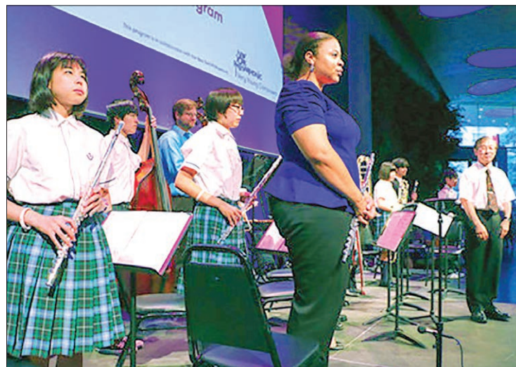
Eight young music students from Japan's Fukushima Prefecture perform their original compositions with members of the New York Philharmonic in New York on 20 August 2016.

NEW YORK — Eight young music students from Japan's Fukushima Prefecture performed their original compositions with members of the New York Philharmonic on Saturday as the culmination of a programme that brought them to New York City for six days of cultural exchange and mentorship.