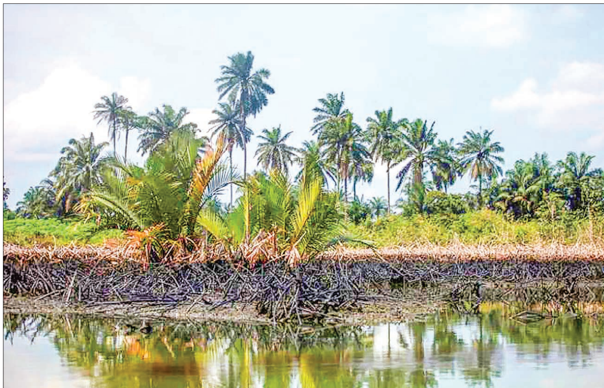
An oil slick clots the bottom of mangroves in Bodo creek in Ogoniland, near Nigeria's oil hub city of Port Harcourt in 2012.

"People are giving up in the short term," one oil industry source told Reuters of a resumption in exports of key Nigerian grades such as Forcados or Qua Iboe, adding that you "can't get anything" out of the majors, including Shell (RDSA.L),