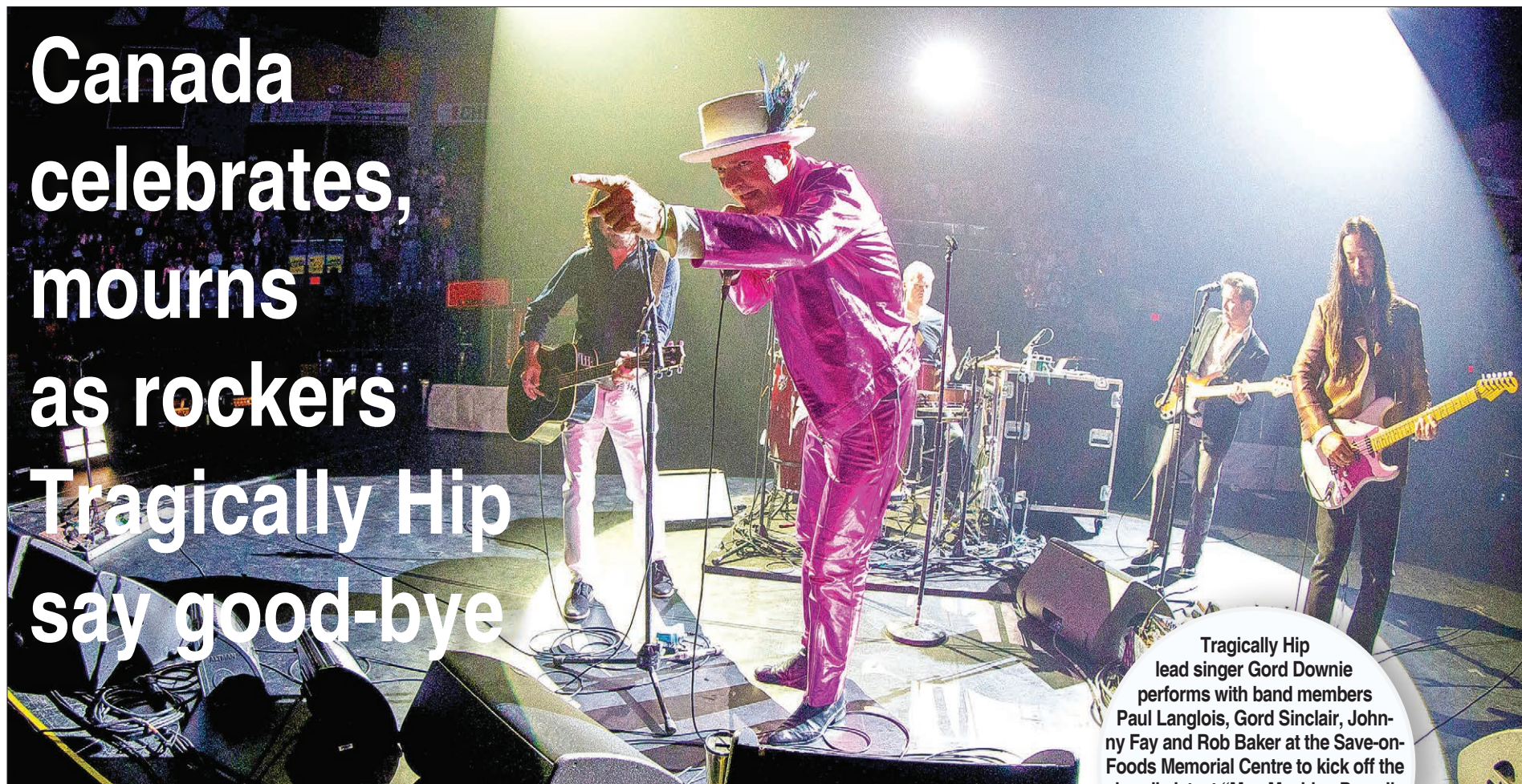
Tragically Hip lead singer Gord Downie performs with band members Paul Langlois, Gord Sinclair, Johnny Fay and Rob Baker at the Save-on-Foods Memorial Centre to kick off the band's latest "Man Machine Poem" tour in light of Downie's brain cancer diagnosis, in Victoria, B.C., Canada on 22 July 2016.