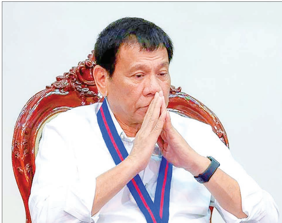
Philippine President Rodrigo Duterte attends the 115 th Police Service Anniversary at the Philippine National Police (PNP) headquarters in Quezon city, metro Manila, Philippines, on 17 August 2016.

The news conference was broadcast by local media and the full version was posted on Facebook by