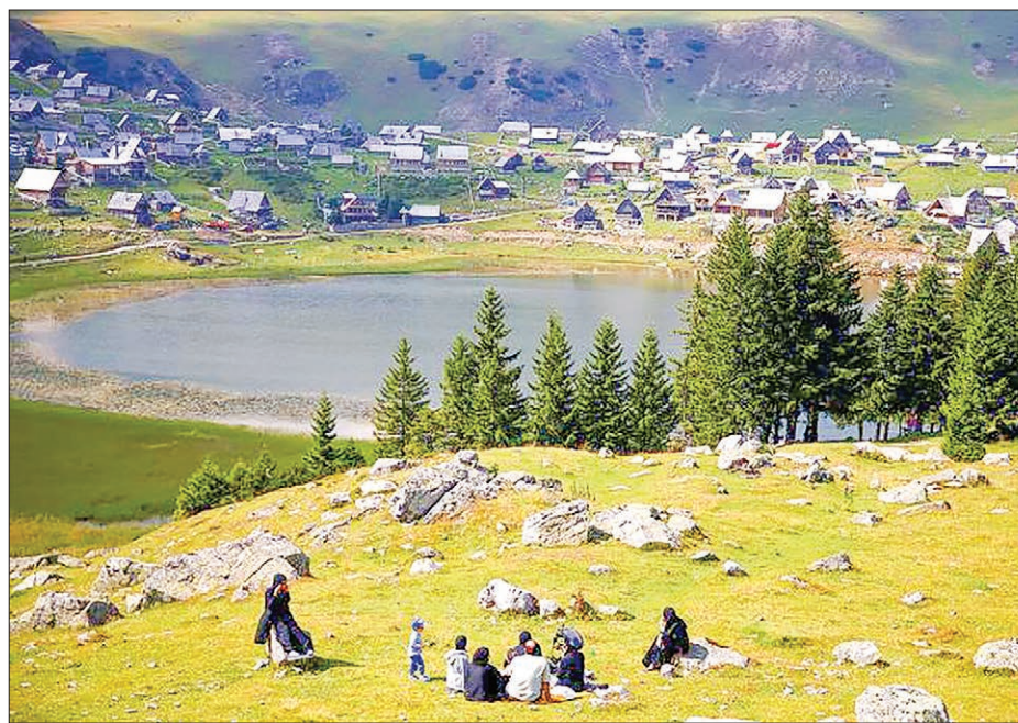
Tourists from the Middle East enjoy along the Prokosko Lake near Fojnica, Bosnia and Herzegovina, on 20 August 2016.

The number of visitors from the United Arab Emirates surged to 13,000 in the first seven months of this year from 7,265 last year, according to ho-