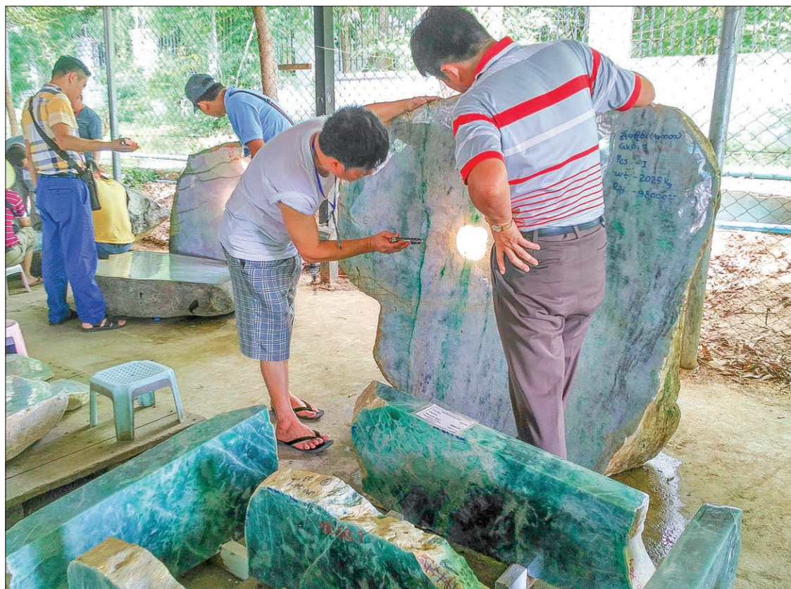
Traders evaluate jade stones during an emporium in Nay Pyi Taw.

"Since we only have the capacity domestically to produce uncut jade, it's all exported to China. China then cuts the jade