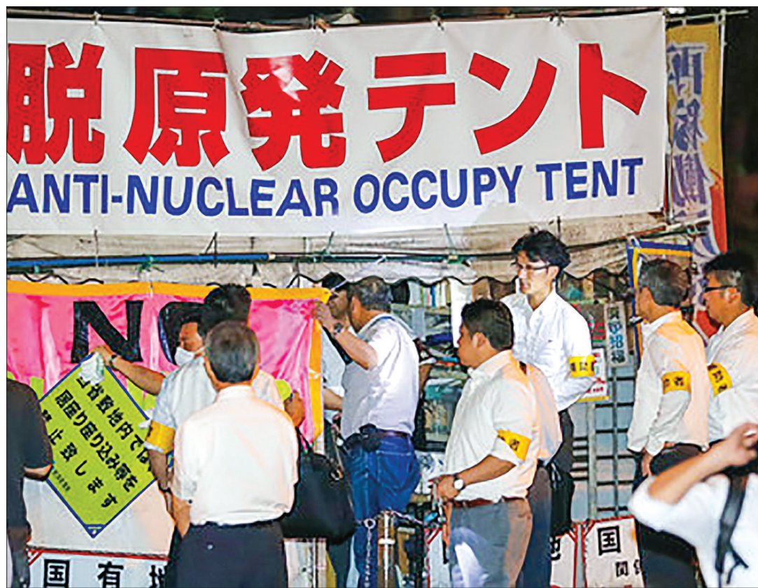
Tokyo District Court officials remove three tents, erected after the 2011 Fukushima nuclear crisis, from the premises of the economy ministry in Tokyo in the early morning of 21 August, 2016, amid strong opposition by antinuclear campaigners as a court order for their dismantlement was enforced. The first tent had stood there for more than 1,800 days.

The forcible removal by the court officials took place in the early hours of Sunday. About 10 citizens including some who were staying in the tents overnight protested while the officials put fences around the encampment and blocked the road around the premises before disassembling the tents.