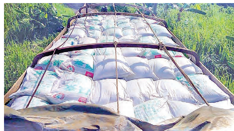
Ammonium nitrate bags seized being seen. PHOTO: 067

Police are still investigating the case in an effort to arrest the owners of the illegal bags of ammonium nitrate, who fled the scene.—067