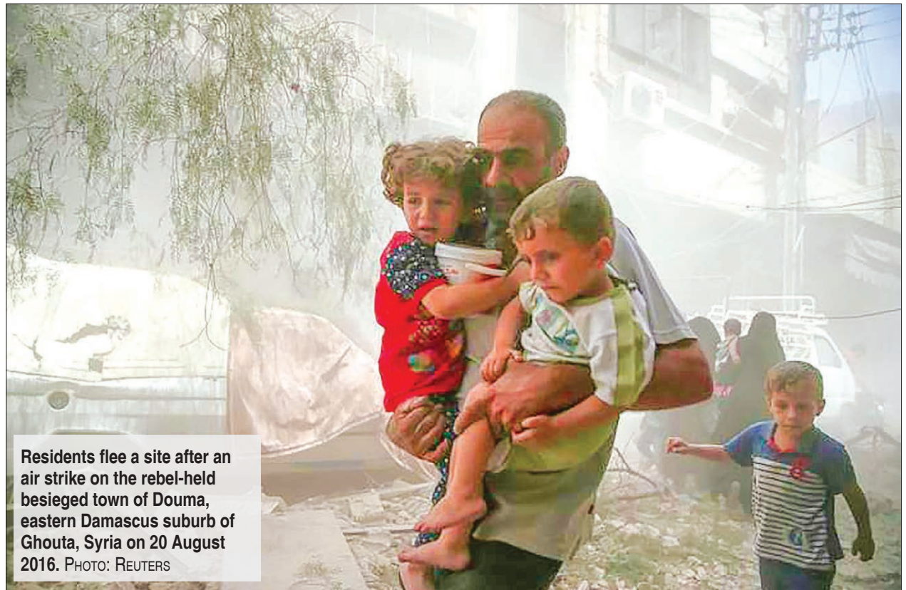
Residents flee a site after an air strike on the rebel-held besieged town of Douma, eastern Damascus suburb of Ghouta, Syria on 20 August 2016.

Ground fighting intensified late on Friday when Kurdish YPG fighters battled Syrian forces, whose