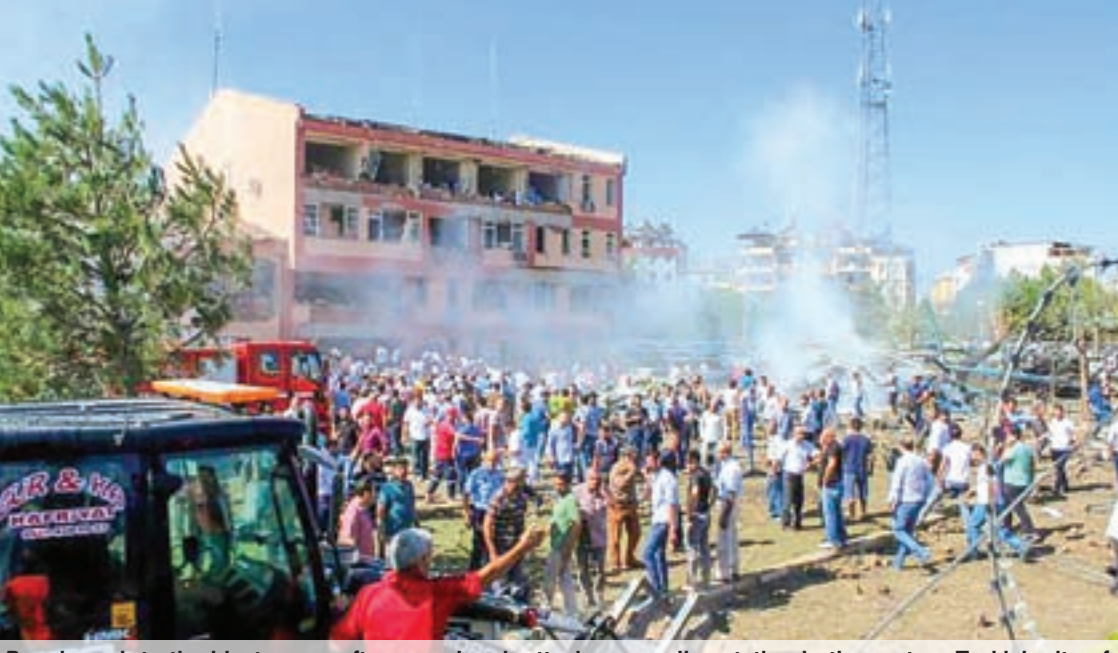
People rush to the blast scene after a car bomb attack on a police station in the eastern Turkish city of Elazig, Turkey on 18 August, 2016.

"The (PKK) terror group has lost its chain of command. Its elements inside (Turkey) are carrying out suicide attacks randomly wherever they get the opportu-