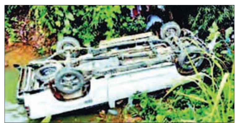
A vehicle overturns on Mandalay-Muse road.

Mandalay-Muse Pyihtaungsu road near Yaywine village, Nawnghkio township on Tues-