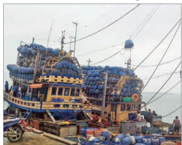
A fishing boat is seen in Kyaukpyu, Rakhine.

ENTREPRENEURS of fishery businesses along the Rakhine State coastline have voiced favor over the pressing of legal charges against fishing vessels and trawlers which employ the use of Thai-produced drag nets and fishing nets with small openings.