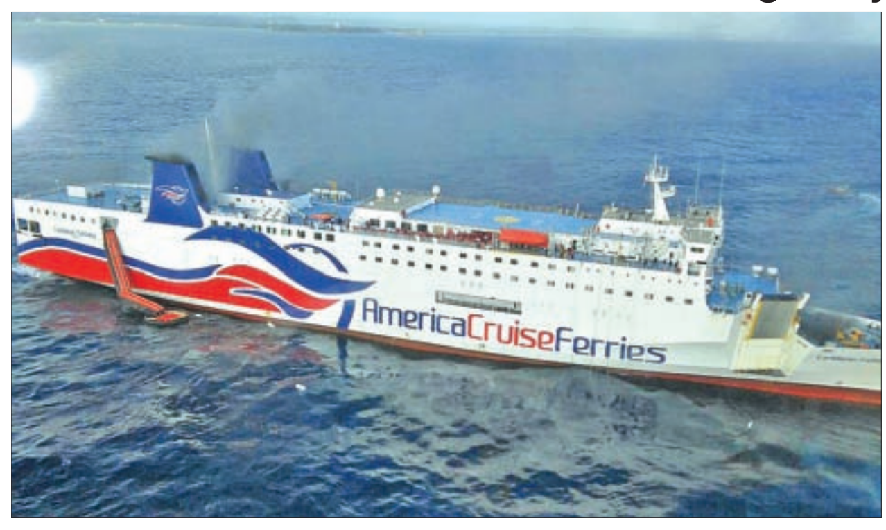
A passenger ferry with hundreds of passengers has caught fire off Puerto Rico and the US Coast Guard and local crews were rescuing people aboard, officials said, on 17 August 2016.

SAN JUAN (Puerto Rico) room of the ship and spread Hundreds of people were rescued from a smouldering passenger ferry ship that caught fire off Puerto Rico on Wednesday, the US Coast Guard said.