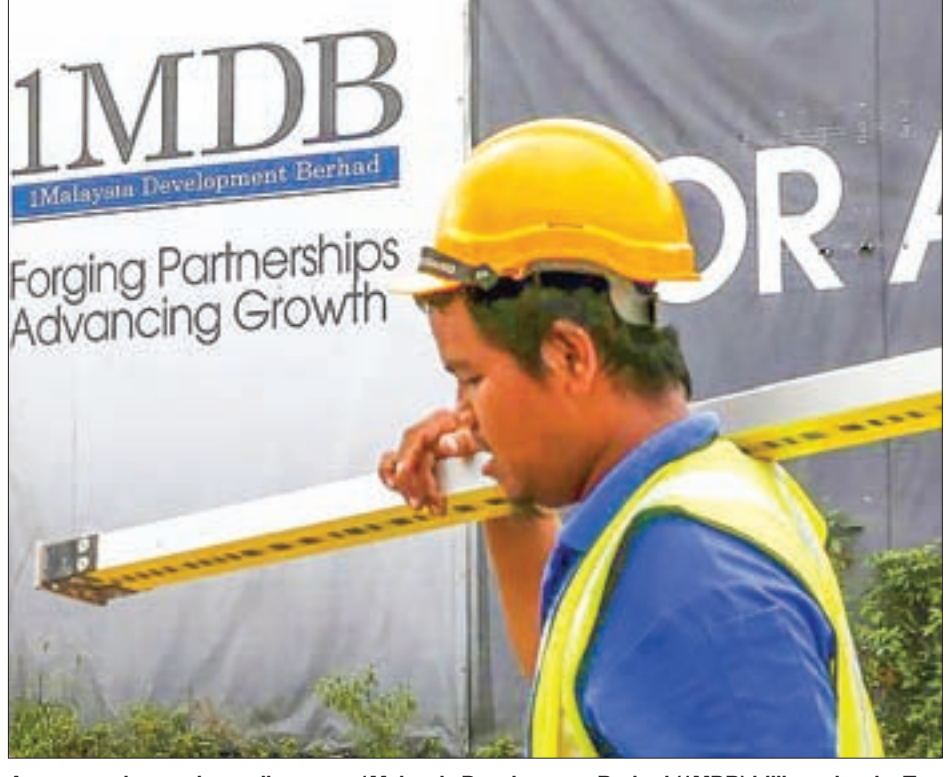
A construction worker walks past a 1Malaysia Development Berhad (1MDB) billboard at the Tun Razak Exchange development in Kuala Lumpur, Malaysia on 3 February 2016.

"Our enforcement agencies and the attorneygeneral must cooperate fully with all international agencies to deal with the matter in an appropriate manner in order to allay negative perception and restore the trust and confidence of the people for the government," he said, according to the official text