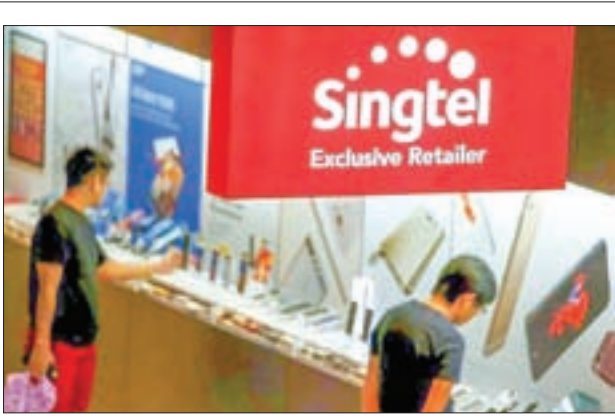
People look at mobile handsets at a Singtel retailer shop in Singapore on 11 February 2016. PHOTO: REUTERS

The Thai stake has stoked controversy for Temasek. In 2006, a Temasek-led $3.8 billion investment in Shin Corp, then owned by the family of former Thai Prime Minister Thaksin Shinawatra, triggered a prolonged political crisis in Bangkok that led to Thaksin's ouster in a bloodless coup. Shin Corp later became Intouch Holdings. Singtel said it will appoint an independent financial adviser on the deals. They require shareholder and regulatory approvals, and are expected to be completed by December, 2016, it said. Singtel shares rose 1 per cent in a flat market, while both AIS and Intouch were up 1.2 per cent.—Reuters