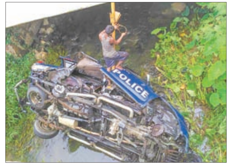
A police car plunges into a gorge in Nay Pyi Taw.

The local traffic police station said it would file charges against the driver for reckless driving. -Thein Ko Lwin