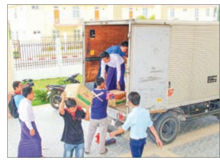
Volunteers from the KBZ's Brighter Future Myanmar Foundation transports aid to Sagaing Region Government to send them the peoples in Naga Self-Administrative Zone.

Between 1 June and 12 August, 42 people in Lahe and nearby villages in the Naga Self-Administered Zone in northern Sagaing Region were killed by communicable diseases including measles, diarrhea, malaria and seasonal flu, according to official figures released by the