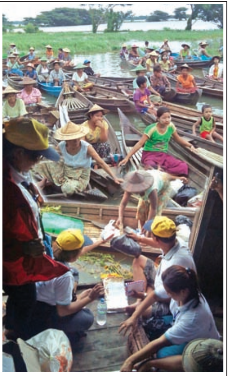
Myat Saydana philanthropic association from South Okkalapa Township donate cash and kind to flood victims at Maydaing village in Taikkyi Township, Yangon on 7 August.

In Myanmar U-Report currently works on social media throughFacebook Messenger - https://www.facebook. com/UReportMyanmar. It will be available soon via SMS on even a basic mobile phone.—