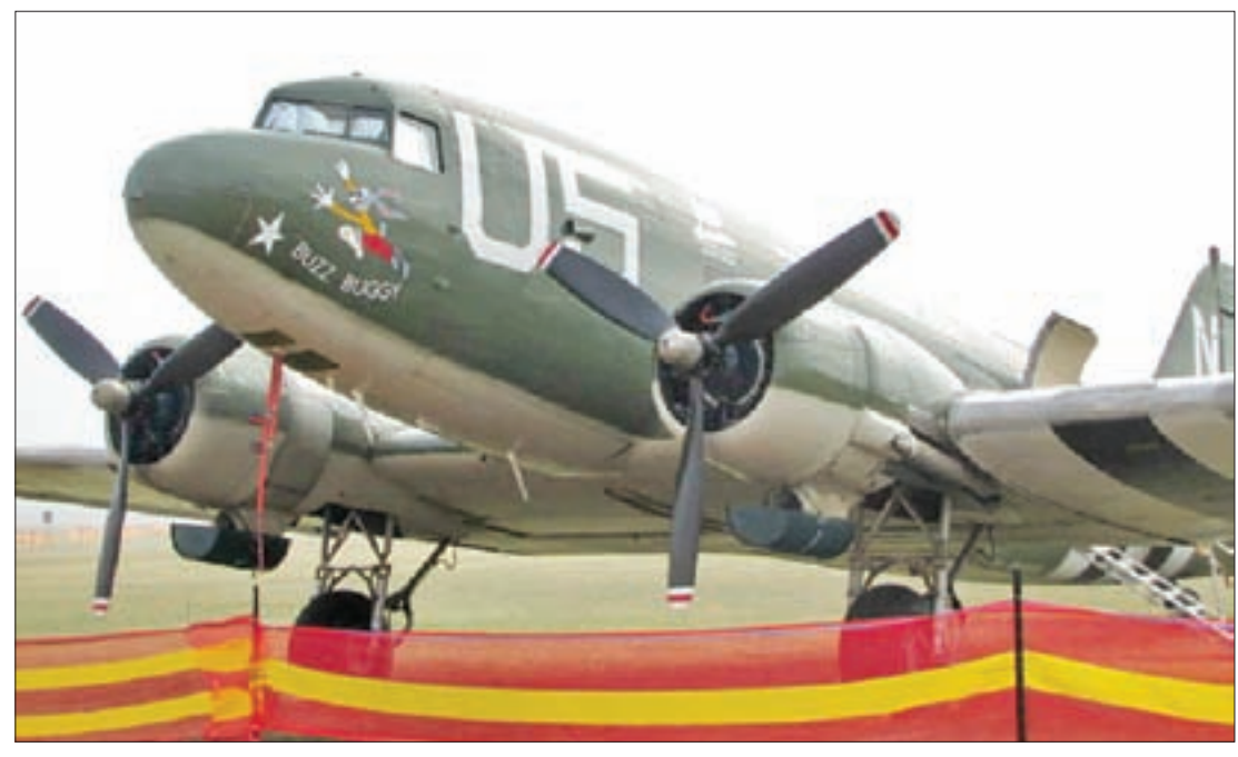
WWII-era C-47 aircraft which will land in Mandalay on way to Flying Tiger Heritage Museum in Guilin, China on 20 August.