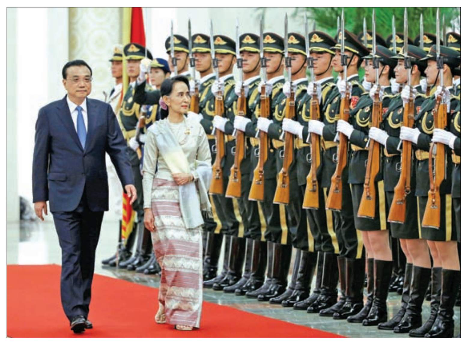
State Counsellor Daw Aung San Suu Kyi and Chinese Premier Li Keqiang review the honour guard during a welcoming ceremony at the Great Hall of the People in Beijing, China, 18 August 2016.

After the discussions, the two countries agreed to a deal on further promotion of bilateral economic and technical cooperation. The deal was signed by Finance Union Minister U Kyaw Win and Chinese Commerce Minister Mr