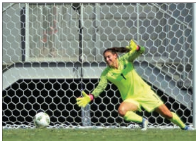
Stina Blackstenius (SWE) of Sweden (not pictured) scores a goal past goalie Hope Solo (USA) of USA during Women's Football Tournament Quarterfinal at Mane Garrincha Stadium in Brasilia, Brazil, on 12 August 2016.

She had little to do against Sweden as the United States struggled to break down their opponents, who tried to hit them