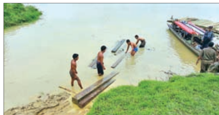
Local police and forest rangers seize illegal timber in Bago.

Aided by the Bago regional government, a concerted effort was made by government departments concerned to collect information on, and to reveal the whereabouts of illegal logging activities in the region; before conducting parameter sweeps in large groups to arrest,