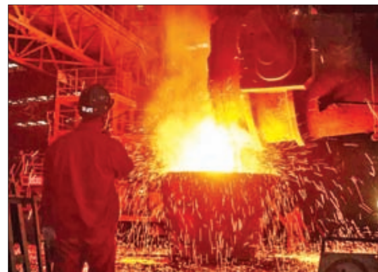
An employee works at a steel factory in Dalian, Liaoning Province, China, on 27 June 2016.

China plans to close 45 million tonnes of annual crude steel capacity this year, and 250 million tonnes of coal production, but only a third of the closures were completed by the end of July, the National Development and Reform Commission said.—Reuters