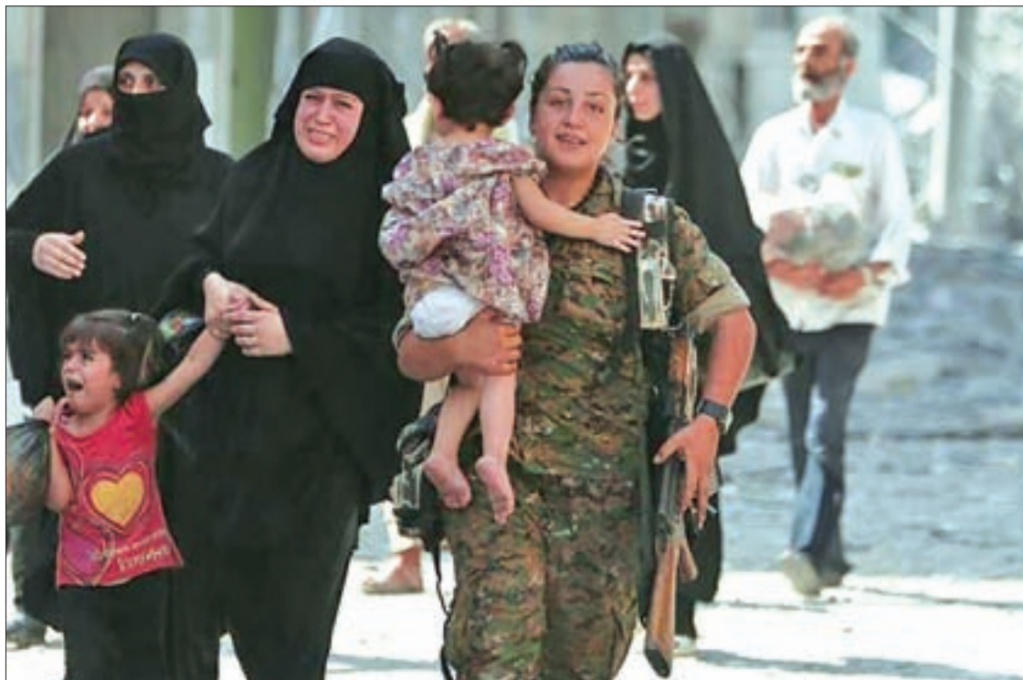
A Syria Democratic Forces fighter helps civilians who were evacuated by the SDF from an Islamic State-controlled neighbourhood of Manbij.

The Manbij operation in which US special forces have played a significant role on the ground marks the most ambi-