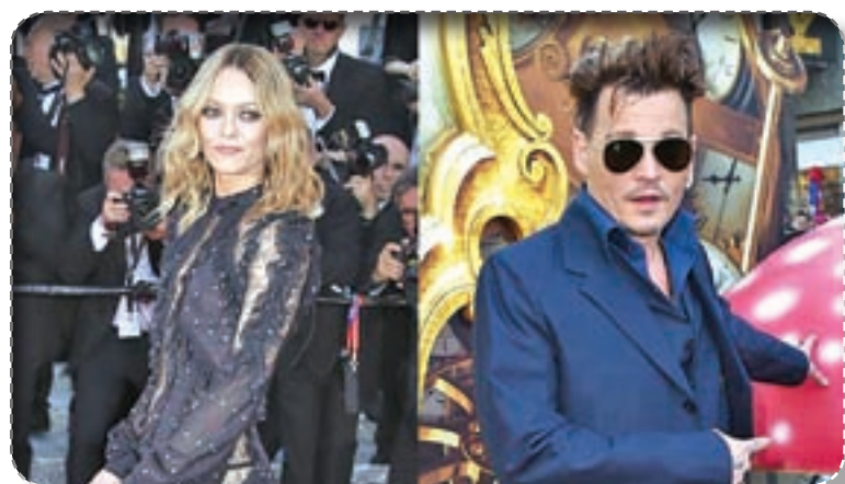
Johnny Depp's family wants Depp to reunite with ex-wife Vanessa Paradis.

LOS ANGELES — Actor Johnny Depp's family and friends are reportedly rooting for him to reunite with ex Vanessa Paradis, amid his stalled divorce with Amber Heard. The 53-year-old actor and the Paradis, 43, were together for 14 years before they separated in 2012, reported Aceshowbiz.