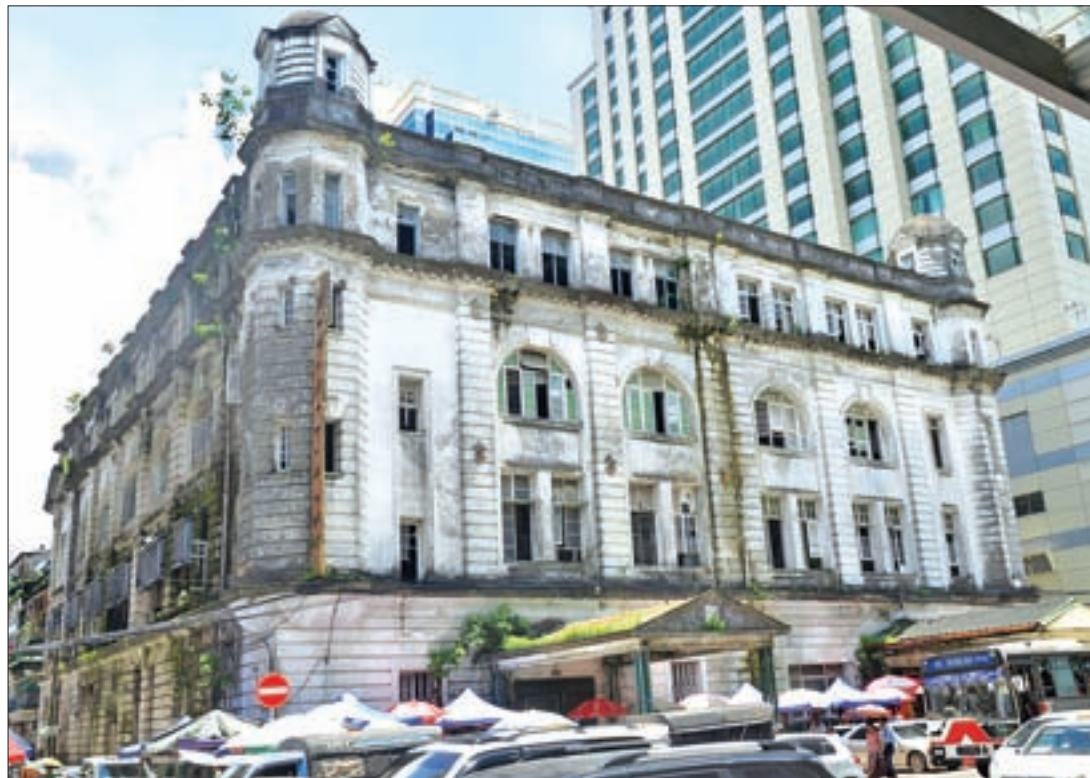
The historic building belonging to Burma Oil Corporation (BOC) during the colonial era is chosen for the new location for the National Library.