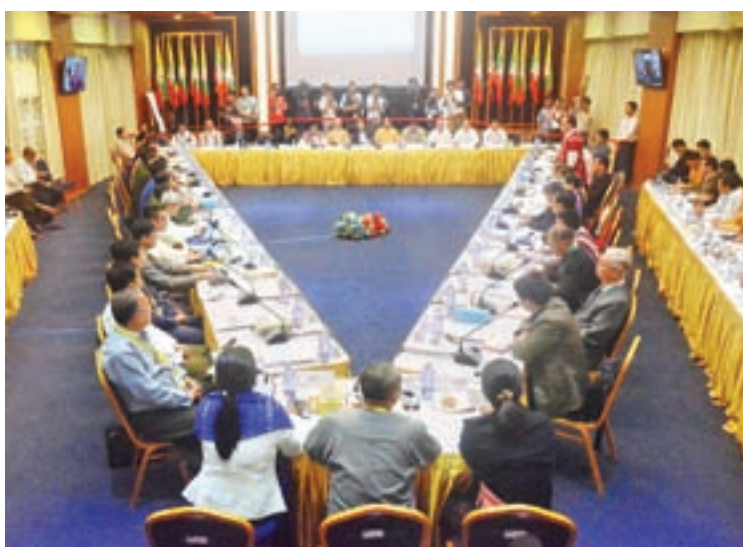
The tripartite meeting in progress to review the political dialogue framework.

THE three-day meeting to review the political dialogue framework ended yesterday in Yangon and outcomes of the discussion will be put forward to the meeting of the Union Peace Dialogue Joint Committee meeting in Nay Pyi Taw on Monday.