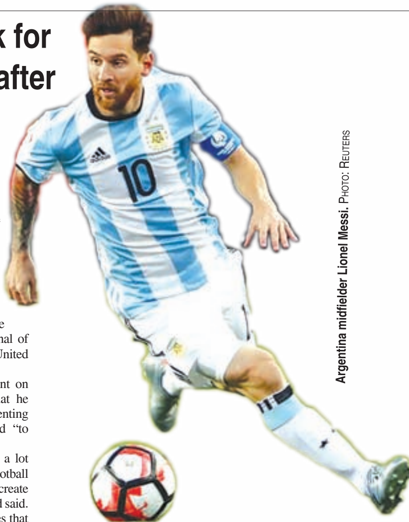
Argentina midfielder Lionel Messi.

A few hours later Messi was named in new coach Edgardo Bauza's squad to face Uruguay and Venezuela in 2018 World Cup, South American qualifiers to be held in the first week of September. Bauza, who replaced