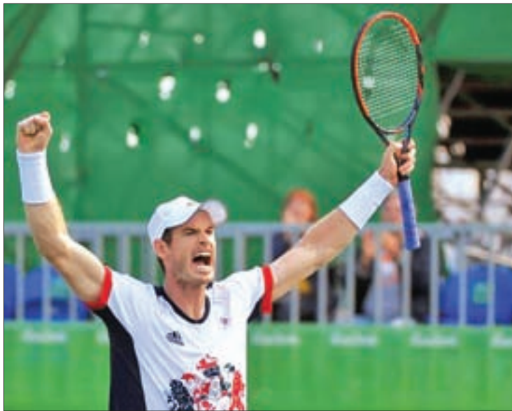
Andy Murray (GBR) of Britain celebrates after winning his match against Steve Johnson (USA) of USA at Olympic Tennis Centre in Rio de Janeiro, Brazil, on 12 August 2016.

"It was a very tough match and I just managed to turn it around in the end," Murray told