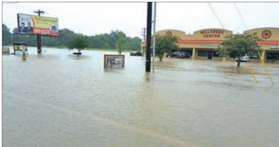
Verot School Rd is seen covered in floodwaters in this handout picture taken by the Louisiana Department of Transportation and Development in Lafayette Parish, Louisiana, US on 12 August 2016. PHOTO: REUTERS

The Tangipahoa, Biloxi and Pearl rivers all were flooding, he said.—Reuters