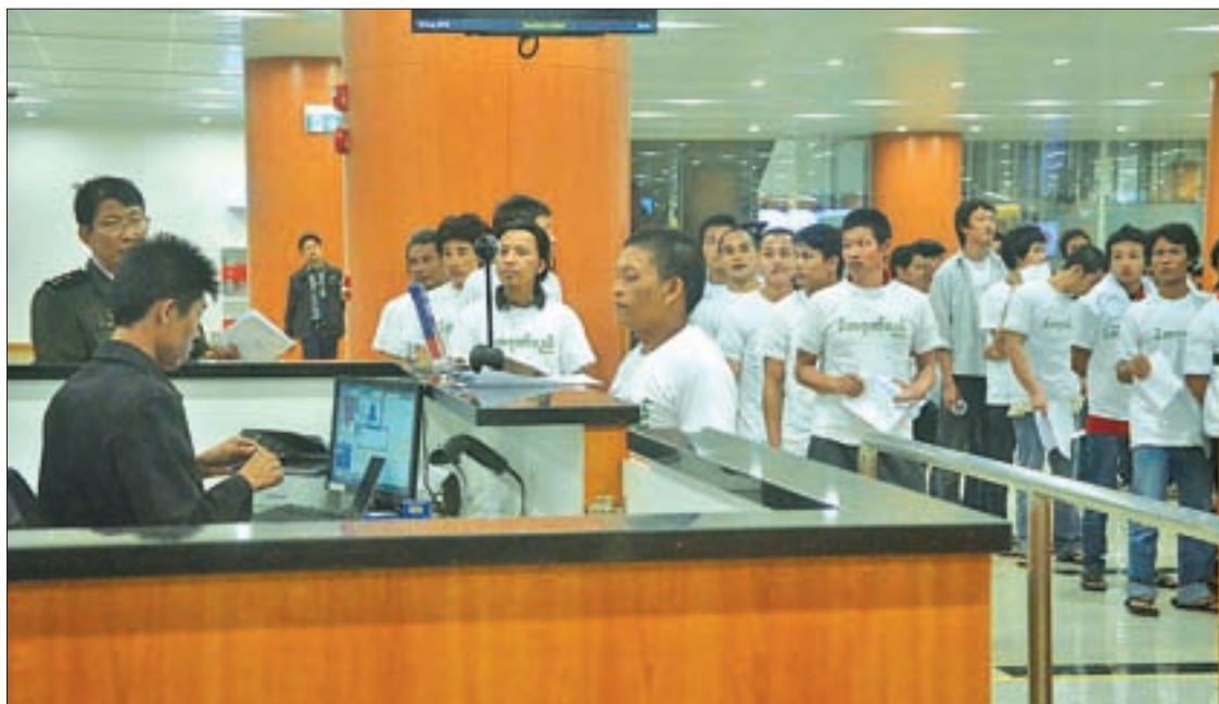
Second batch of detained Myanmar workers arrives back in Yangon from Malaysia.

According to sources, 2,294 Myanmar citizens were detained for various reasons in 11 camps in Malaysia.— Myanmar News Agency