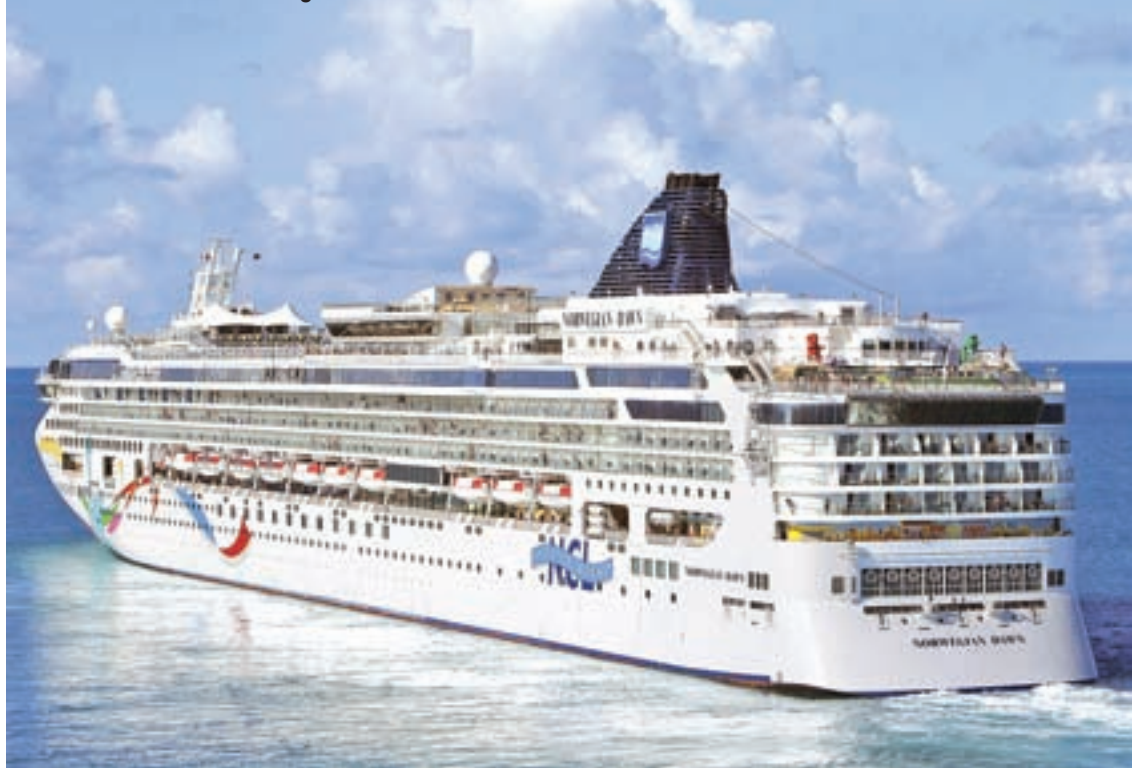
An american-based Norwegian cruise.

Myanmar seafarers will work together with those from European countries as well as Indonesia, The Philippines and Singapore. Those interested can visit the website of this cruise line via https://www.ncl.com/ for further information—200