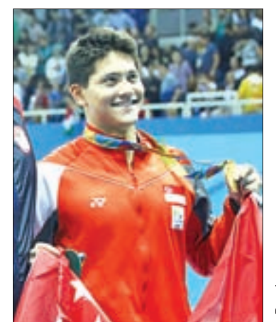
Joseph Schooling of Singapore shows his 100-meter butterfly gold medal at the Rio de Janeiro Olympics on 12 August, 2016.

Despite being Southeast Asia's most economically ad-