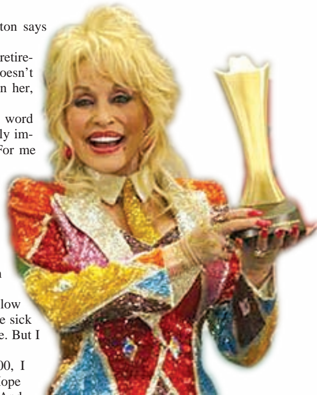
Singer Dolly Parton poses backstage with her Tex Ritter Award at the 51st Academy of Country Music Awards in Las Vegas, Nevada, on 3 April 2016.

Parton released her 43 rd studio album "Pure & Simple" this month.