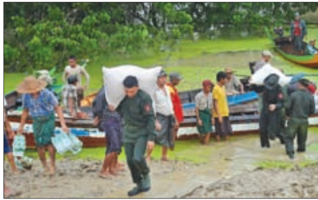
Military personnel carrying foodstuffs for flood victims, and a military mobile medical team offering medical check-ups to Buddhist monks and local residents of Nyaungdon Township.

LOCAL military members donated foodstuffs to flood victims in the villages of Nyaungdon township, Ayeyawady