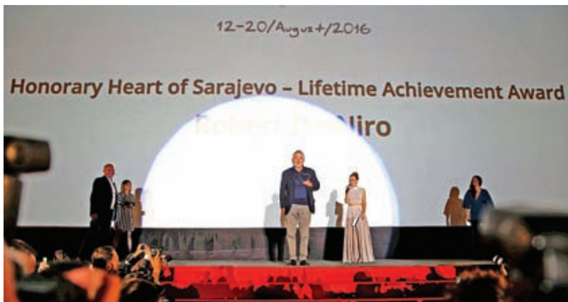
Actor Robert De Niro poses with the Heart of Sarajevo honorary award during the 22 nd Sarajevo Film Festival in Sarajevo, Bosnia and Herzegovina, on 12 August, 2016.

The Sarajevo Film Festival, launched in 1995, has become a leading cultural event in the Balkan region. Some 100,000 fans were expected to visit Sarajevo during the event, according to organisers.—Xinhua