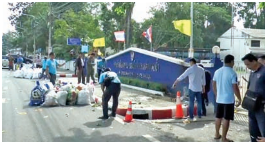
Officials check the scene after bomb blasts in the southern province of Surat Thani, Thailand, on 12 August 2016.

BANGKOK/HUA HIN (Thailand) — The Thai political party whose governments have been overthrown by the country's ruling generals denied on Saturday having any role in the bomb attacks on popular tourist destinations that killed four people and wounded dozens.