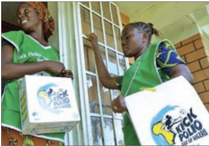
Volunteer Health officials wait to immunise children at a school in Nigeria's capital Abuja in 2010.

The polio virus, which invades the nervous system and can cause irreversible paralysis within hours, spreads rapidly among children, especially in