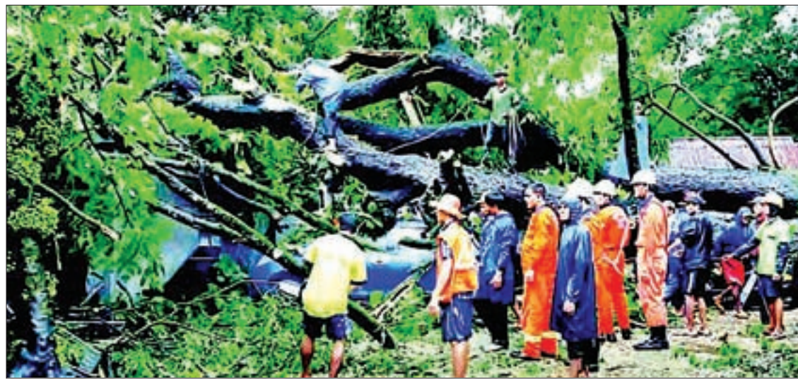
Members of the rescue team clearing up the falling tree.

A 62-year-old woman died on Friday when an old tree fell on her near the Myawaddy housing estate, Minglataung