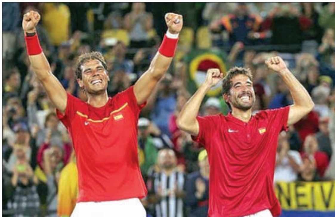
Rafael Nadal (ESP) of Spain and Marc Lopez (ESP) of Spain celebrate after winning their match against Florin Mergea (ROU) of Romania and Horia Tecau (ROU) of Romania.

Nadal said his partner was a close friend even though they had little experience of playing together and were tested by a experienced Romanian pair.