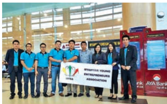
MYEA delegation poses for a group photo before leaving for ASEAN-China YE Forum 2016.

The 8 th ASEAN-China Young Entrepreneurs Forum 2016 is set to last for three days until Sunday. —MYEA