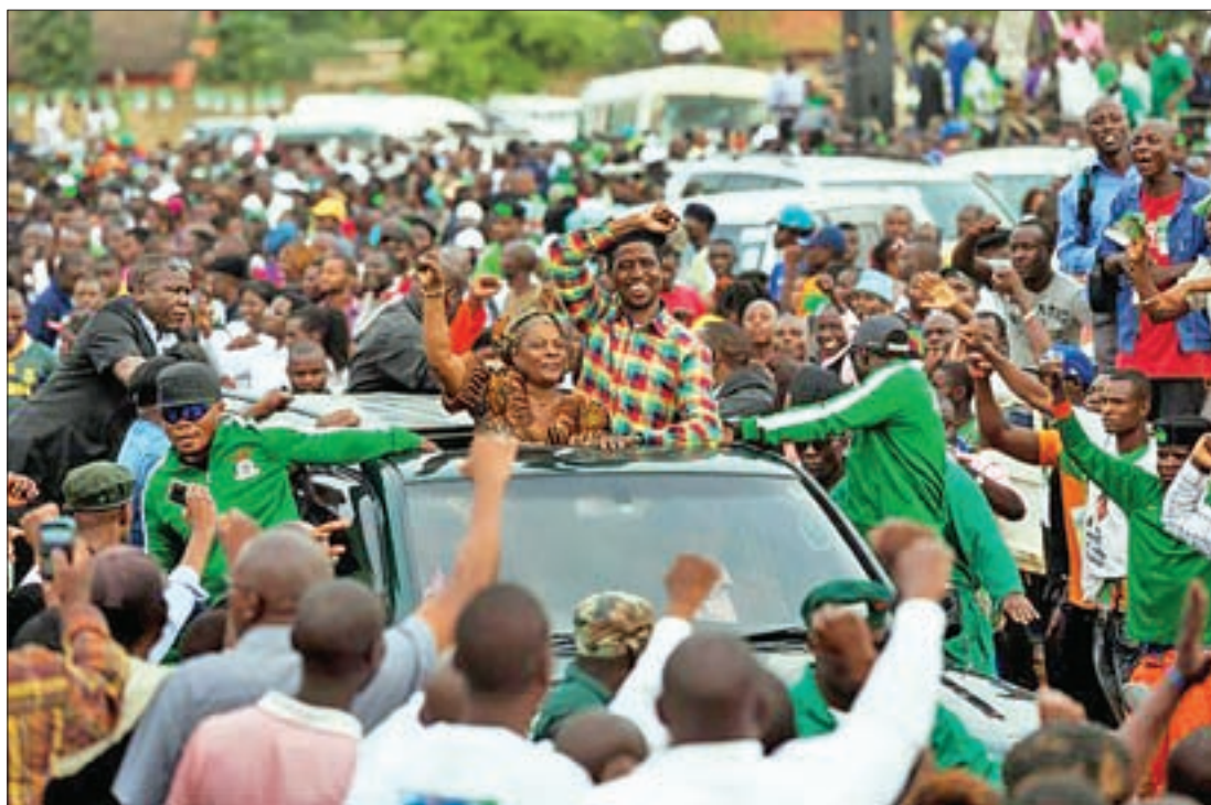
Patriotic Front (PF) Presidential candidate Edgar Lungu and his wife Esther Lungu leave a rally in Lusaka in 2015.

If no candidate fails to win more than 50 per cent this time, Zambia will have to hold a second round of elections.