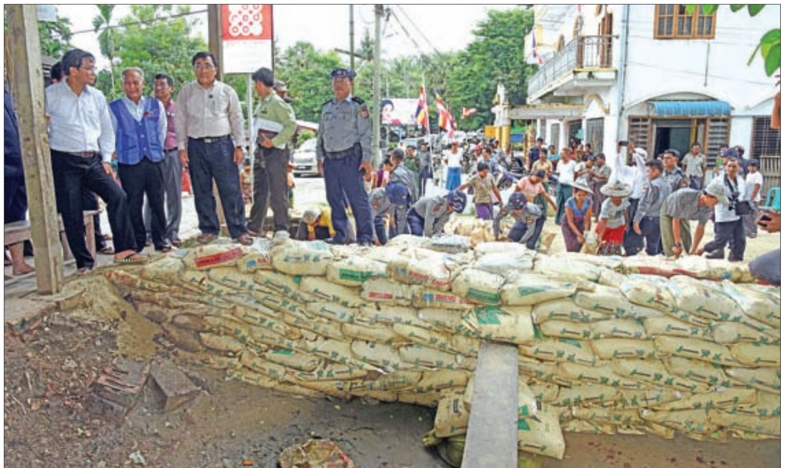
Vice President U Henry Van Thio assists in preparedness to the flooding in Danubyu, Ayeyawady Region.

submerged more than 202,000 acres of farmland with paddy plants, according to the General Administration Department of