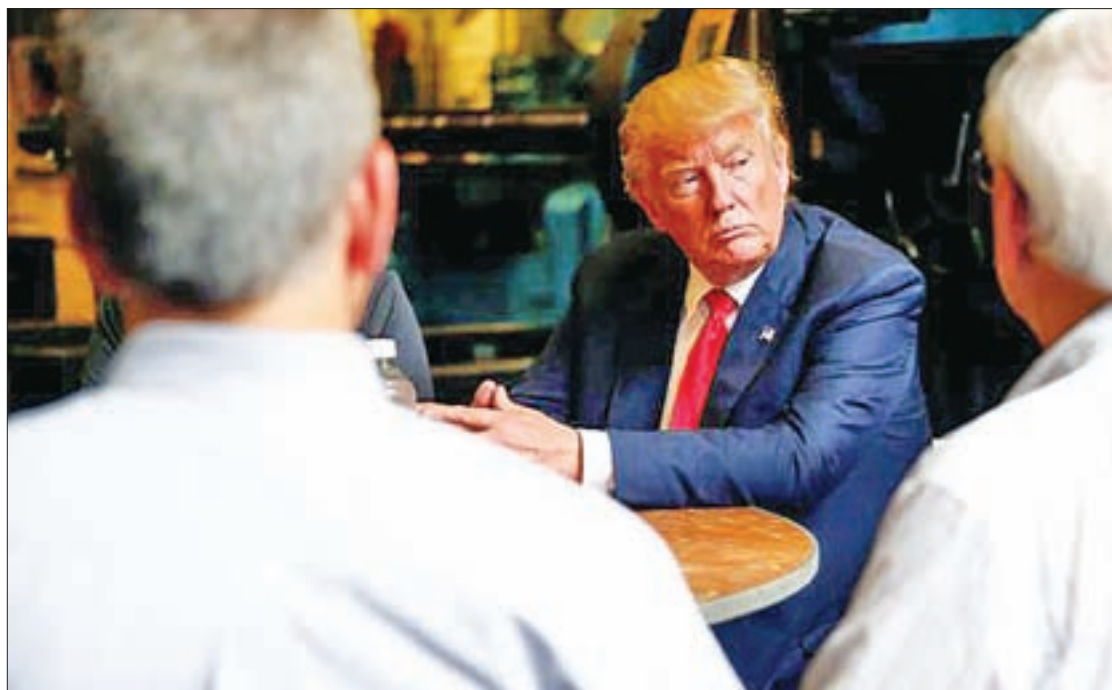
Republican US presidential nominee Donald Trump visits McLanahan Corporation headquarters in Hollidaysburg, Pennsylvania, on 12 August 2016.

ALTOONA (Pa.) — Republican Donald Trump on Friday backed away from comments calling President Barack Obama and Democratic nominee Hillary Clinton the founders of the militant group Islamic State, while the Republican Party sought to project unity behind their candidate.