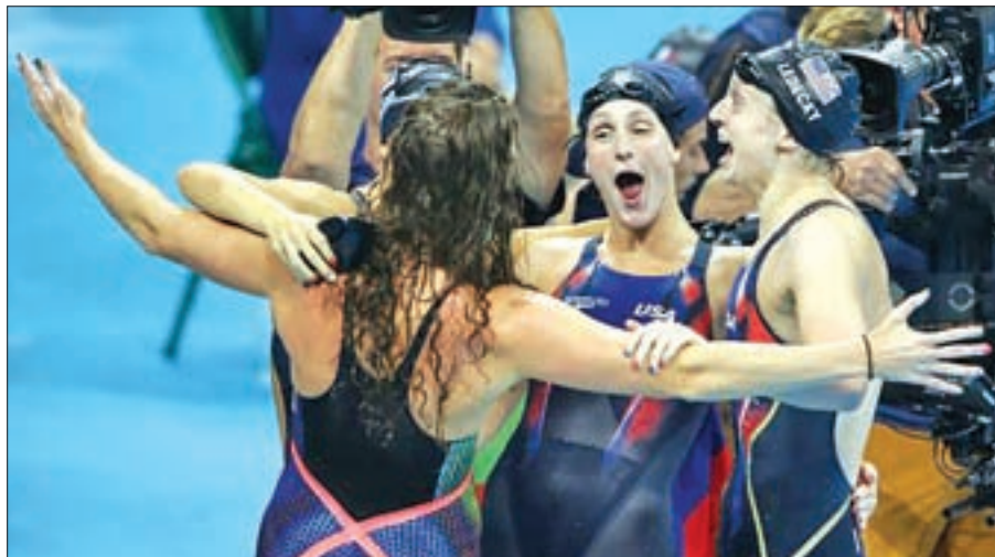
USA's Katie Ledecky, Maya DiRado, Leah Smith and Allison Schmitt celebrate winning gold.

RIO DE JANEIRO — Freestyle queen Katie Ledecky won her third gold medal of the Rio Olympics by anchoring the US women to victory in the 4x200 metres freestyle relay on Wednesday while struggling Missy Franklin opened her account without being in the water for the final.