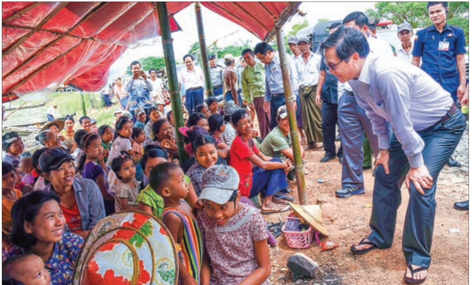
Vice President U Henry Van Thio talks to flood-affected people in Moenyo, Bago Region, during his visit.