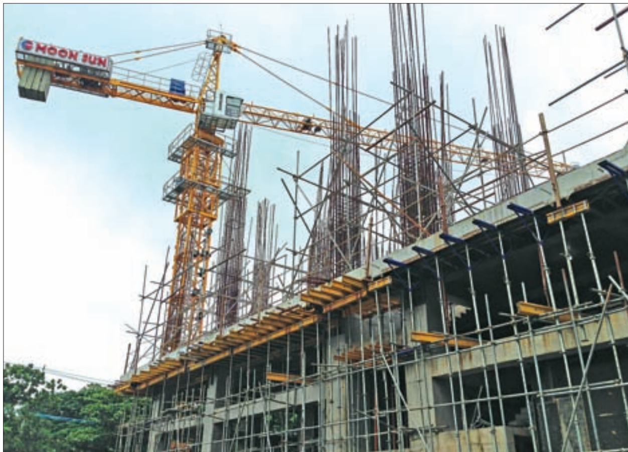
A construction site seen in downtown Yangon on 10 August 2016.

These projects are required to seek additional