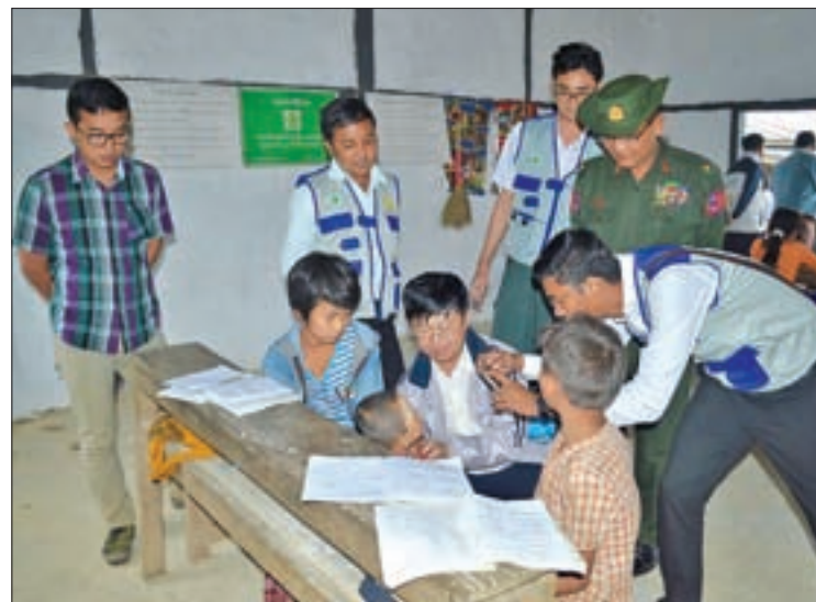
The medical team of the Tatmadaw provides health care services to children in Naga Self-Administrative Zone.