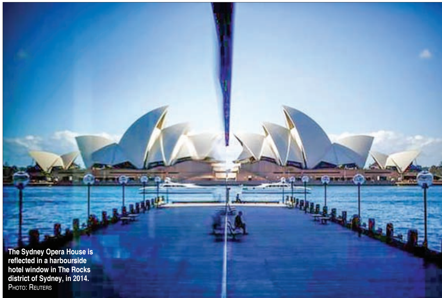
The Sydney Opera House is reflected in a harbourside hotel window in The Rocks district of Sydney, in 2014.