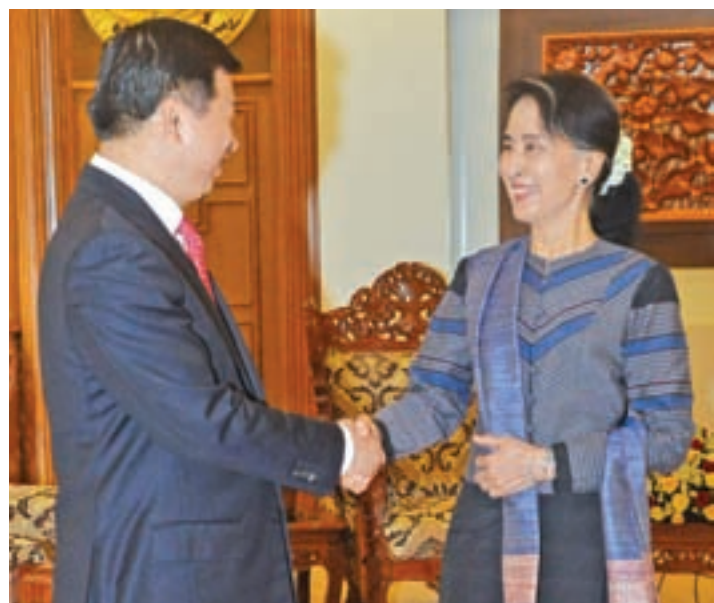
State Counsellor Daw Aung San Suu Kyi welcomes Mr Song Tao in Nay Pyi Taw.

At the meeting, they exchanged views on enhancing the bilateral relations and cooperation between Myanmar and the People's Republic of China.—MNA