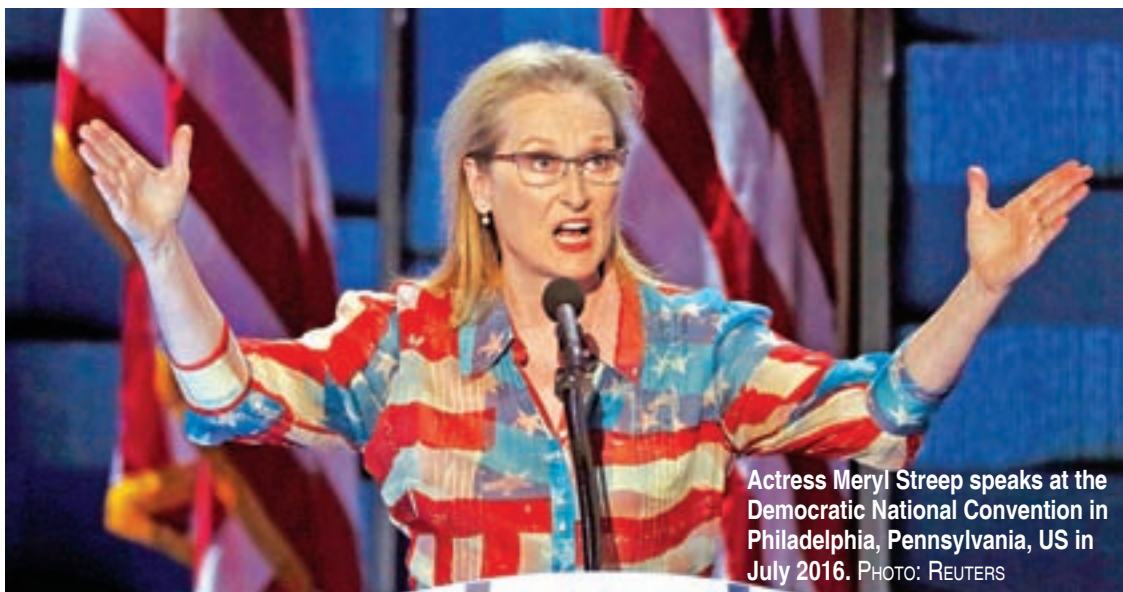
Actress Meryl Streep speaks at the Democratic National Convention in Philadelphia, Pennsylvania, US in July 2016.