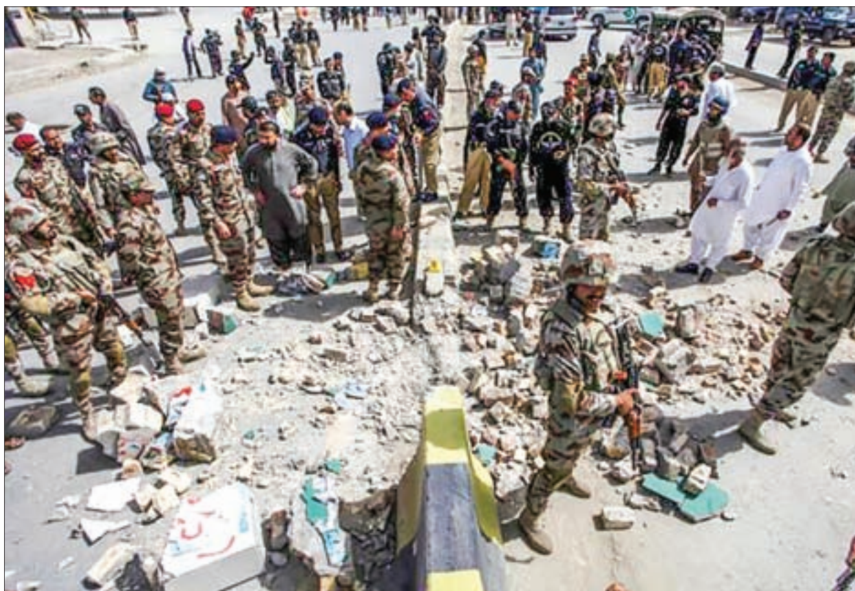
Security officials gather at the site of a bomb explosion in Quetta, Pakistan, on 11 August 2016.

TV warned viewers not to gather at the scene on Zarghoon Road in central Quetta for fear of a second bombing like the one on Monday. That attack hit a large group of lawyers gathered at the hospital to mourn the head of the Baluchistan bar association