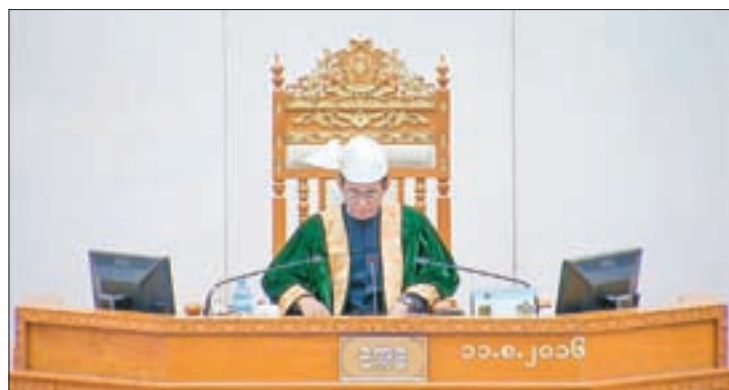
Speaker of Pyithu Hluttaw U Win Myint.