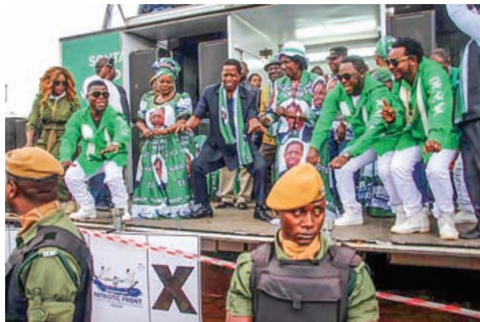
Edgar Lungu (C, in black suit), leader of the Patriotic Front party (PF), dances before addressing his supporters during a rally ahead of Thursday's presidential elections in the capital, Lusaka, Zambia, on 10 August 2016.

"I have been on probation for one year, six months and I think I have done very well. I promise to serve you