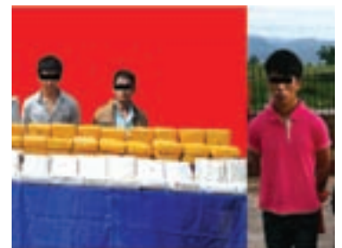
Suspects arrested in connection with seizure of brown opium in Hsenwi.

Similarly, police from Tachilek police station seized raw opium weighing 1.5 kilograms