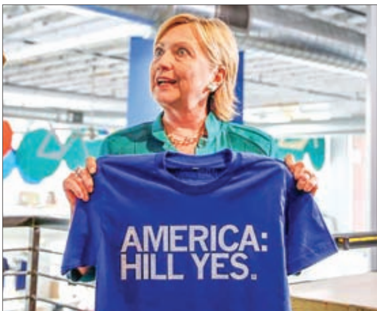
US Democratic presidential nominee Hillary Clinton holds a t-shirt while visiting Raygun, a clothing store, in Des Moines, Iowa, on 10 August 2016.

a website for Republicans and political independents to sign up to pledge their support, listing 50 prominent Republicans and independents who have endorsed her.