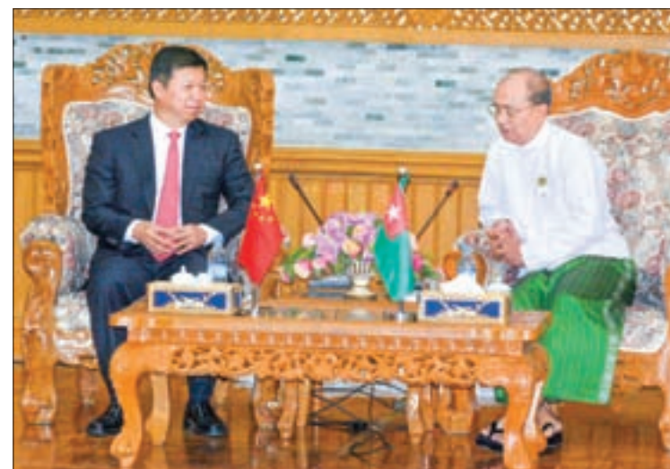
USDP Chairman U Thein Sein holds talks with Mr Song Tao Chinese Minister of the International Department of the communist party of the PRC.

A Chinese delegation led by Mr Song Tao, the Minister of the International Department of the Communist Party of the People's Republic of China, called on U Thein Sein, the Chairman of the Union Solidarity and Development Association, at the