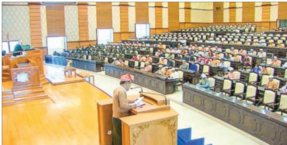
Amyotha Hluttaw is being convened in Nay Pyi Taw.

He called for quick implementation of a territorial sea boundary between Myanmar and Bangladesh and the signing of a