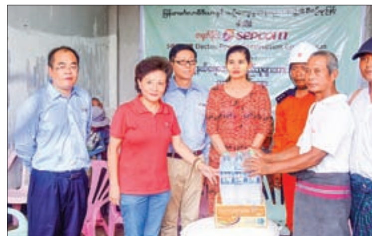
Aid reaches flood victims in Moenyo.