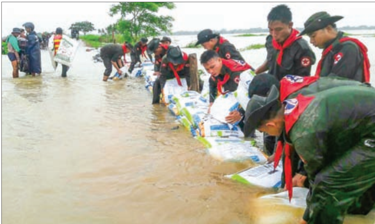
Tatmadawmen lay sandbags to reduce the amount of floodwater entering.

TATMADAW members of Yangon Region Military Command on Monday provided food to flood victims from Nyaungdon Township of Ayeyawady and Taikkyi Township of Yangon Region. The flood victims were then relocated by service members. Soldiers also shored up Uto-Ahphyauk road