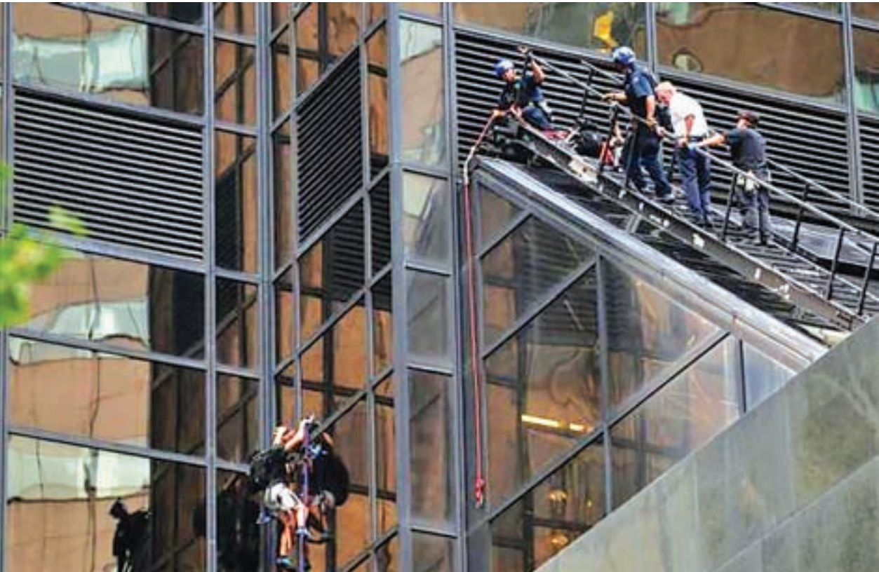
Officers from the NYPD watch as a man climbs the outside of Trump Tower in New York, US, on 10 August 2016.

NEW YORK — A 20-year-old Donald Trump supporter who scaled the Trump Tower in Midtown Manhattan on Wednesday for three hours using suction cups and a climbing harness was pulled inside through a window by police who had tried to coax him into the building throughout the escapade. The man reached the 21 st story of the 58-story tower on Fifth Avenue which is headquarters for the election campaign of Donald Trump, the US Republican presidential nominee. As the climber from Virginia who wore a back-