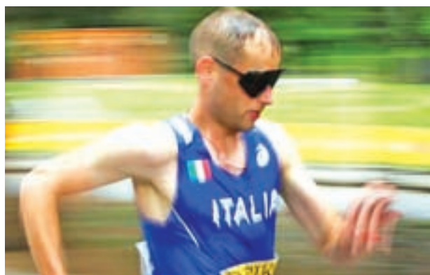
Alex Schwazer of Italy walks on his way to win the 50 kilometres race walk at the World Race Walking Team Championships in Rome, Italy, on 8 May 2016.

Schwazer asked CAS to treat his appeal as an urgent request ahead of the Rio Olympics but this was dismissed and sport's highest court instead initiated an expedited arbitration procedure to rule on the case.—Reuters