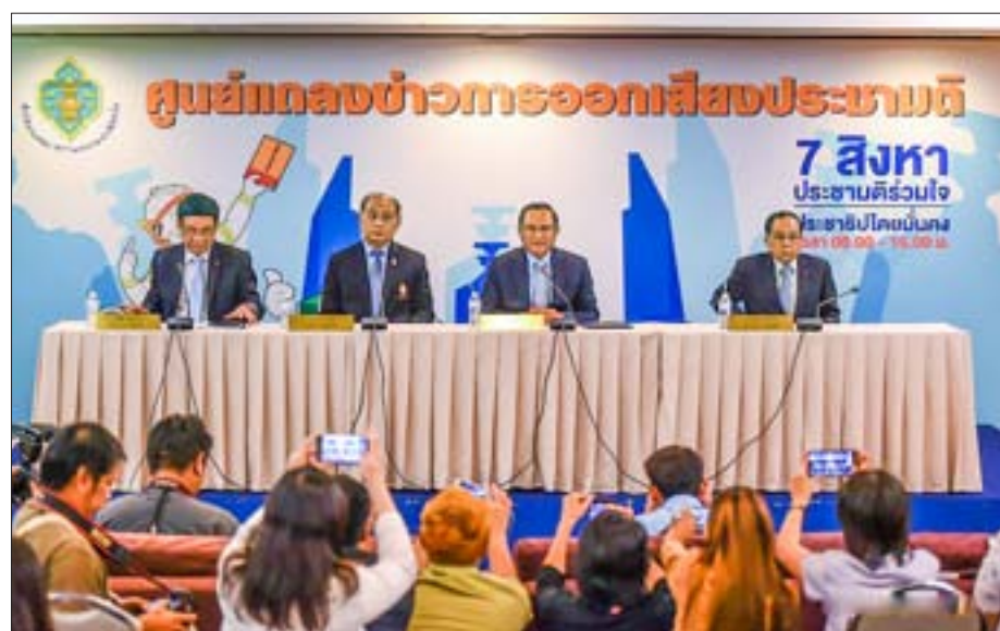
Thailand's Election Commission announces the result of the referendum during a news conference in Bangkok, Thailand, on 10 August 2016.

According to Prayut, the 2014 interim constitution will be replaced by the new one after its promulgation and CDC will work on 10 organic laws, especially four of them that are necessary for a general election, dur-