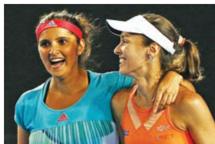
Switzerland's Martina Hingis and India's Sania Mirza celebrate after winning their doubles final match at the Australian Open tennis tournament at Melbourne Park, Australia, on 29 January.

"Perhaps, because of our great past results, we have had very high expectations from our partnership and unfortunately did not get the results we desired recently," they added. The pair will, however, reunite to defend their WTA Finals title in Singapore at the end of October.—Reuters