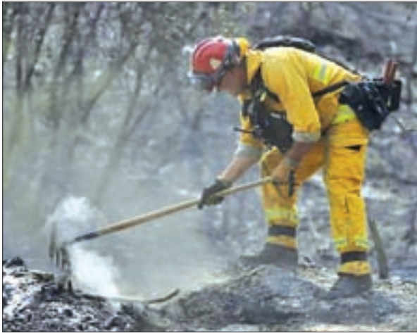
A firefighter from the Sonoma Valley Fire & Rescue Authority work on a a hotspot during the Rocky Fire near Clearlake, California, in 2015.