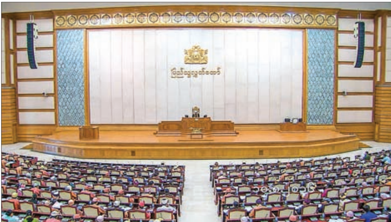
Pyithu Hluttaw is being convened in Nay Pyi Taw.