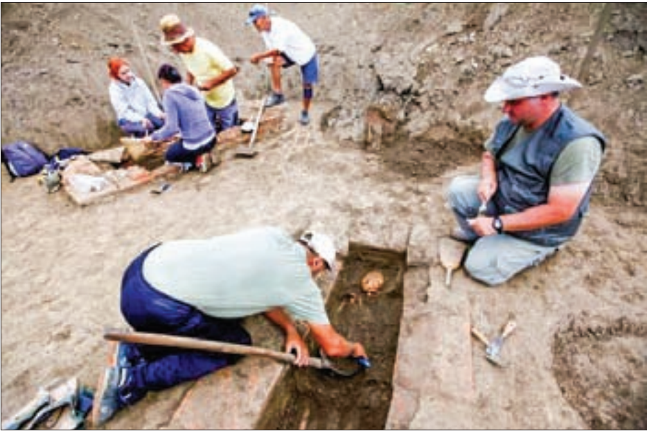
Archaeologists work at the Viminacium site, around 100 km east from Belgrade, Serbia on 8 August, 2016.