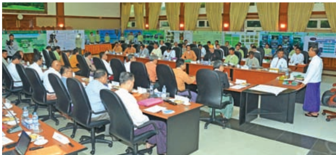
Vice President U Myint Swe addresses the coordination meeting organised by the Central Committee for National Environmental Conservation and Climate Change in Nay Pyi Taw.

VICE President U Myint Swe has shed light on the impact of economic growth on environment in the undertaking of national development at a coordination meeting in Nay Pyi Taw, calling for effective efforts toward environmental protection.