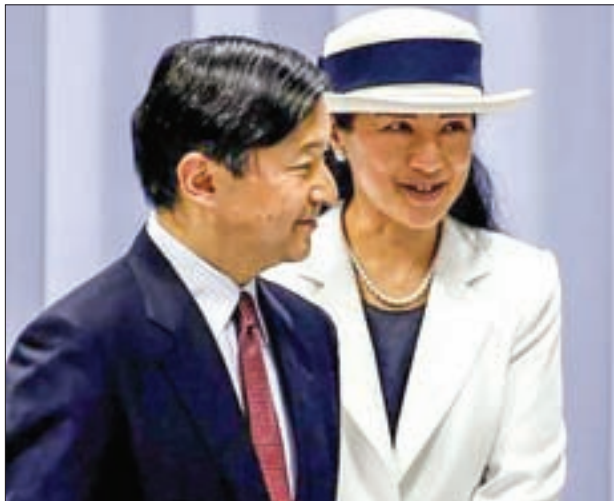
Japan's Crown Prince Naruhito and Crown Princess Masako make an appearance before Japanese athletes during a team-forming ceremony ahead of the Japanese team's departure to the Rio 2016 Olympic Games, in Tokyo, Japan, on 3 July 2016.

While the earnest Naruhito, 56, is seen as ready for the succession and has taken on more official duties, Masako, 52, who turned down his first two proposals during a long courtship beginning nearly 30 years ago, has struggled as Crown Princess. Harvard-educated Masako, who reluctantly abandoned a diplomatic career to marry, has for more than a decade battled depression, as she grappled with the prescriptions and pro-