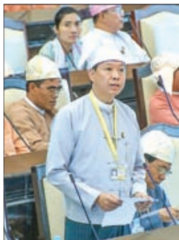
Union Minister for Education Dr Myo Thein Gyi.

SAFE staff quarters will be built for teachers working in the country's remote areas, Union Minister for Education Dr Myo Thein