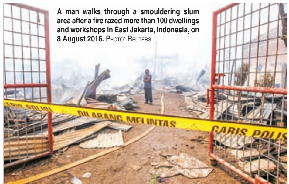
A man walks through a smouldering slum area after a fire razed more than 100 dwellings and workshops in East Jakarta, Indonesia, on 8 August 2016.

"It is not enough just to respond when the shock arrives. What is most important is how can we work together in the spirit of risk reduction," the head of IFRC said.—Reuters