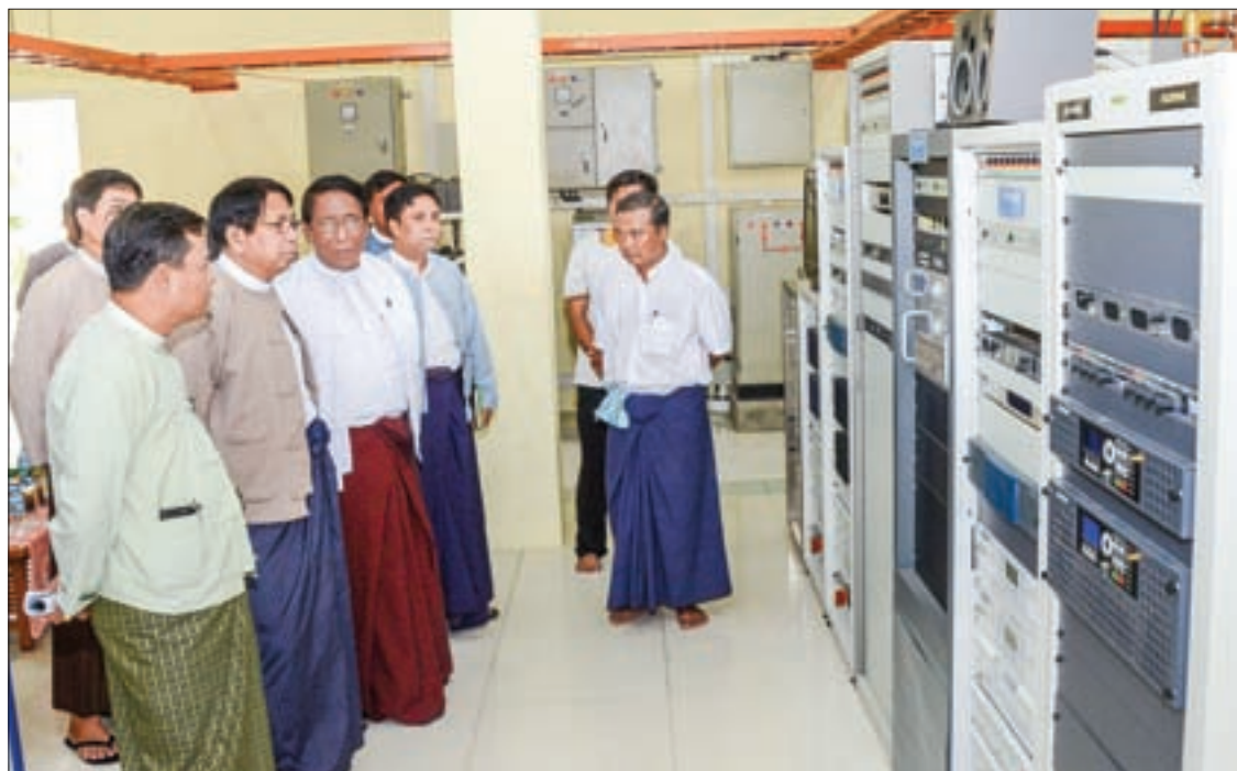
Union Minister for Information Dr Pe Myint visits the MRTV relay station (Thabyetaung).

A similar tank was established at a training school for employees of the YCDC under the arrangement of Mitsubishi Rayon Co Ltd and Myanmar Water Engineering Product Co Ltd in 2015.