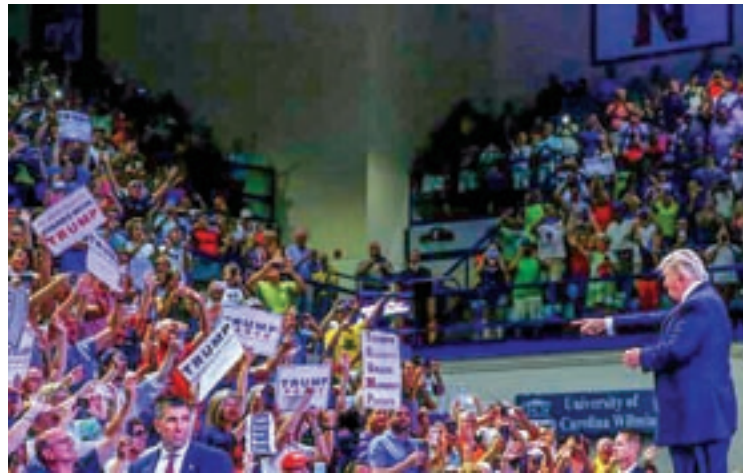
Donald Trump attends a campaign rally at the Trask Coliseum at University of North Carolina in Wilmington, North Carolina.

Immediately after Trump made his comment, many on social media accused him of effectively calling for Clinton's assassination. In just three hours, 2 nd amendment