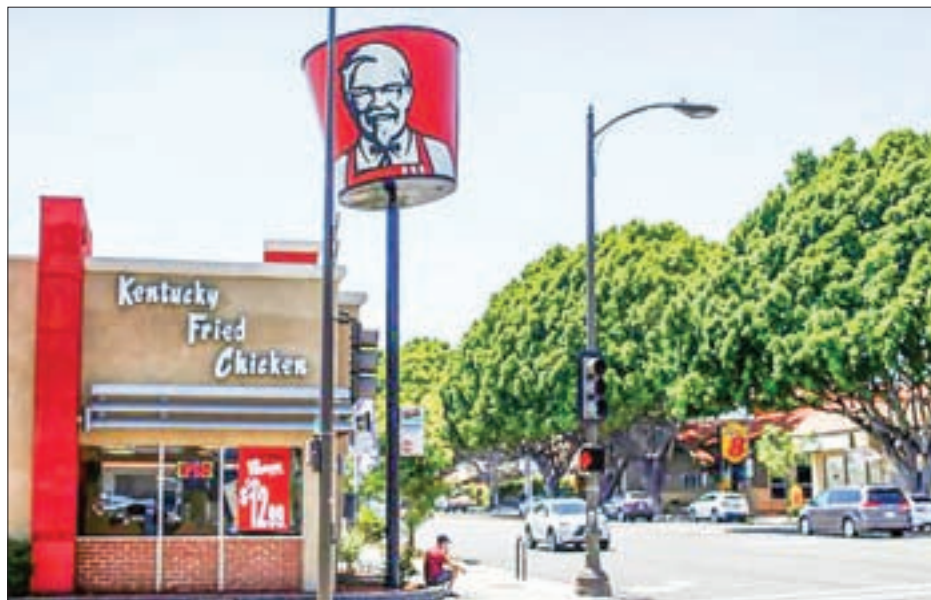
A KFC fast food restaurant, which is owned by Yum Brands Inc, is pictured ahead of their company results in Pasadena, California, US, in July 2016.

As per federal government guidance, KFC does