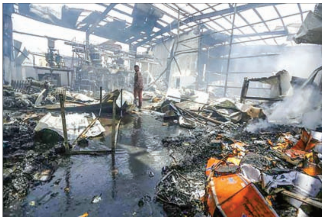
An employee walks inside a snack food factory after a Saudi-led air strike hit it in Sanaa, Yemen, on 9 August 2016.

Saudi Arabia and an alliance of mostly Gulf Arab allies have launched thousands of air strikes against the Houthis and their allies in Yemen’s army since they intervened in Yemen’s civil war on behalf of the exiled government. The Saudis are backing an offensive by pro-government fighters aiming to advance on Sanaa from the north and east.—Reuters