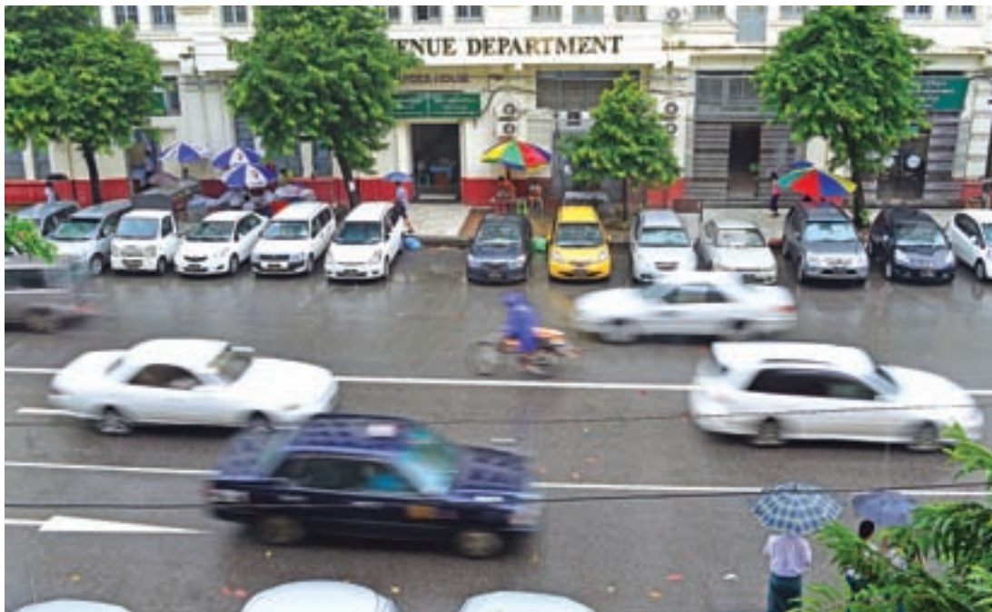
Car sales in Yangon have slumped due to the suspension of vehicle permits.

Car dealers from the old Thirimingalar car market have stated that only slips which permit the importation of vehicles not for commercial use might increase in