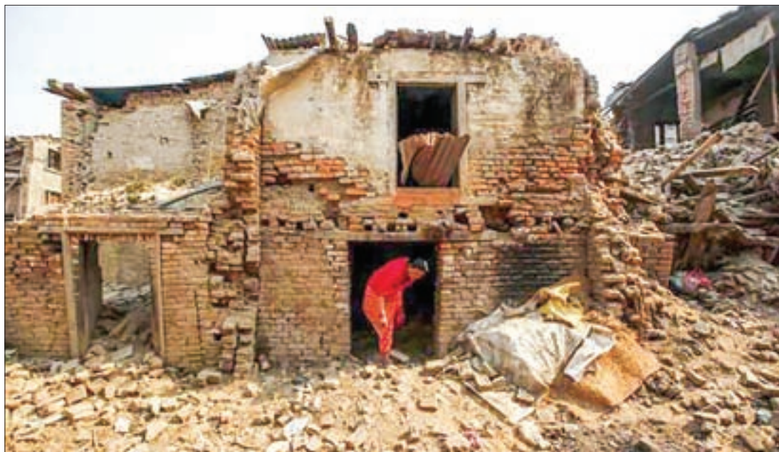
A woman walks out from her house damaged during the 2015 earthquakes in Bhaktapur, Nepal, on 25 April 2016.

The migration of millions of young Nepali men overseas to find jobs has also led to an in-