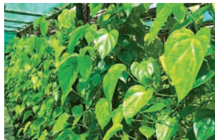
Betel leaves.

Pantanaw betel leaf is famous among betel quid connoisseurs and is cultivated across the nation. Other varieties of betel leaf are entering the market to fill the mouths of customers.—200