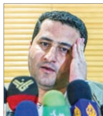
Iranian scientist Shahram Amiri speaks to journalists as he arrives at the Imam Khomeini Airport in Tehran, on 15 July 2010.

Her son’s closed-door trial was unfair and he was not prop-