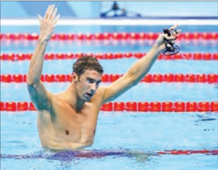
Michael Phelps (USA) of USA reacts after his team won the gold medal during Men's 4 x 200m Freestyle Relay Final at Olympic Aquatics Stadium in Rio de Janeiro, Brazil, on 9 August 2016.