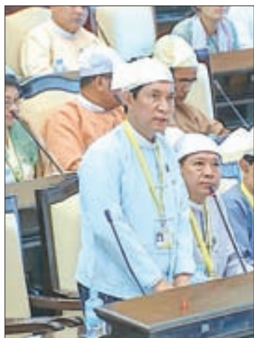
Union Minister for Industry U Khin Maung Cho.

SAFE staff quarters will be built for teachers working in the country's remote areas, Union Minister for Education Dr Myo Thein