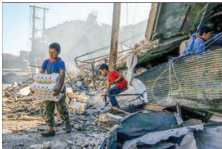
Boys salvage goods from a site hit by airstrikes in the rebel held town of Atareb in Aleppo Province, Syria.