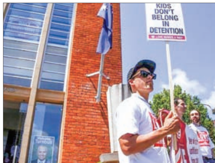
A group of around twenty protesters stand outside and occupy Australian Prime Minister Malcolm Turnbull's electoral office, as they demand the end to the policy of offshore detention of asylum seekers, in the Sydney suburb of Edgecliff, Australia, on 14 October 2015.

SYDNEY — More than 2,000 incidents, including sexual abuse, assault and attempted self-harm, were reported in about two years at an Australian detention centre for asylum seekers in Nauru, more than half involving children, a newspaper reported on Wednesday.