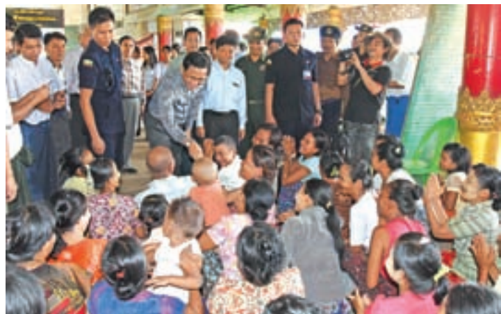
Vice President U Henry Van Thio visits the shelter-2 in Aunglan.

He also expressed special thanks to everyone for offering help in relief efforts and pledged the government's commitment to providing assistance to post-disaster recovery.— Myanmar News Agency