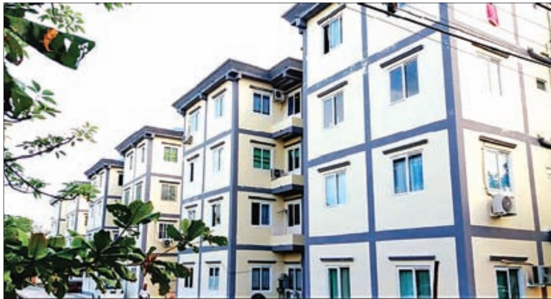
50 per cent of the apartment will go to education staff.