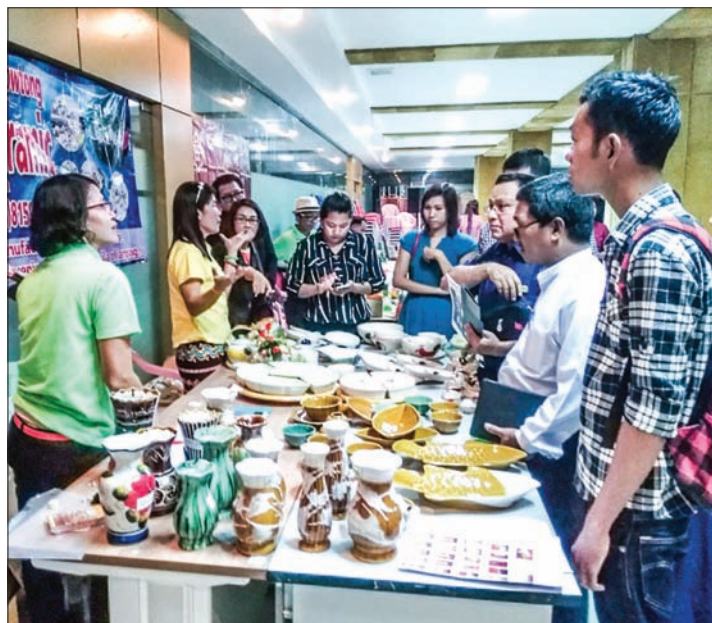
Ceramic wares from Chiang Mai Province of Thailand being displayed.