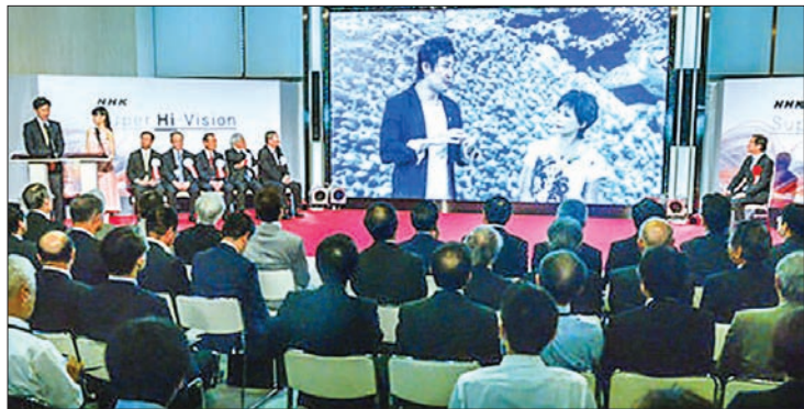
Japan's public broadcaster NHK holds a commencement ceremony for 4K and 8K super high-definition test broadcasting on its BS satellite channels on 1 August 2016, at its broadcasting centre in Shibuya, Tokyo. NHK, officially known as Japan Broadcasting Corp., aims to verify the technology and popularize it in time for the 2020 Tokyo Olympics and Paralympics. Testing of 8K broadcasting, which is making its world debut, includes broadcasting of the opening ceremony and some games of the Rio de Janeiro Olympics starting 5 August.

The Ministry of Internal Affairs and Communications is planning to start 4K and 8K broadcasting by 2018 and popularize it in time for the Tokyo Olympics.— Kyodo News