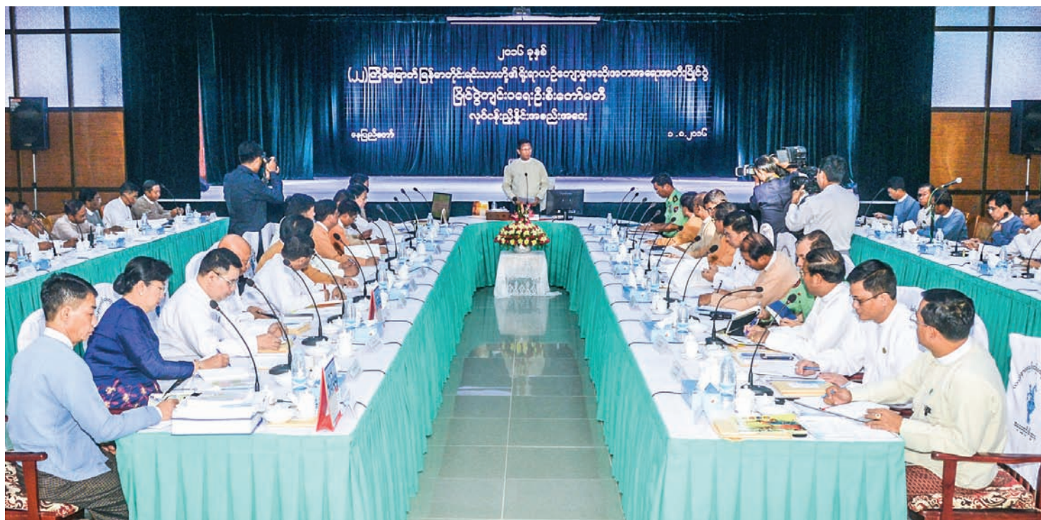
Vice President U Henry Van Thio addresses the meeting of 22nd Myanmar Traditional Performing Arts Competitions.

A WORK coordination meeting of the leading committee on the 22 nd Myanmar Traditional Performing Arts Competitions was held at the Ministry of Religious and Cultural Affairs in Nay Pyi Taw yesterday, with an address by Vice President U Henry Van Thio, patron of the committee.