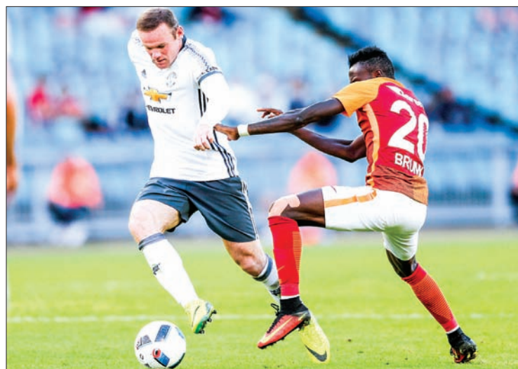
Manchester United's Wayne Rooney during Pre Season Friendly at Ulllevi Stadium, Gothenburg, Sweden on 30 July 2016.