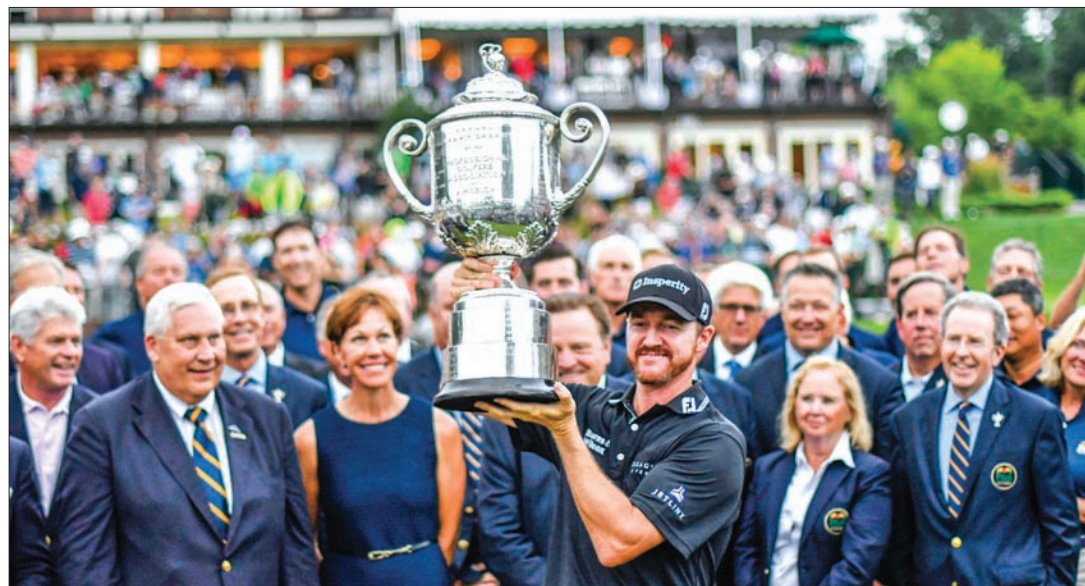
Jimmy Walker holds up the Wanamaker trophy during the Sunday round of the 2016 PGA Championship golf tournament at Baltusrol GC at Lower Course, Springfield, NJ, USA, on 31 July 2016.

Said Day: "It was nice to get the eagle, just to try and make Jimmy think about it, but obviously Jimmy just played too good all day. The birdie on 17 was key for him."—Reuters