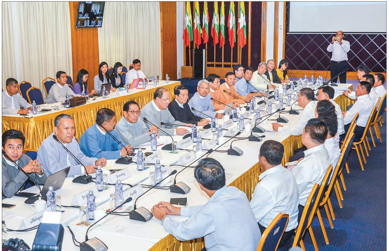
National Democratic Alliance Army-NDAA (Mongla) and Myanmar Peace Commission hold talks in Yangon.

The peace commission also invited the NDAA (Mongla) leaders to participate in the political framework review meeting which is scheduled to be held in the first week of August.