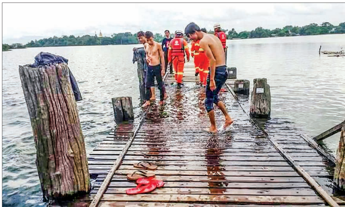
Volunteers and firemen inspect U Bein Bridge.

The 22nd Myanmar Traditional Performing Arts Competitions is scheduled to be held in Nay Pyi Taw Yezin this October.— Myanmar News Agency