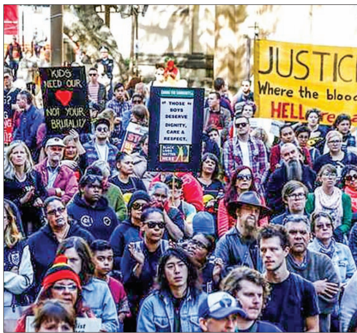
Demonstrators gather outside Sydney's Town Hall to protest against alleged child abuse in Australia's Northern Territory detention centers, on 30 July, 2016.

Since the broadcast of the prison video last week, the United Nations Human Rights High Commission has called on Australia to compensate the victims and protests have been held in Australian capitals.— Reuters