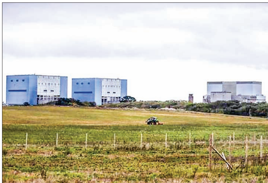
A tractor mows a field on the site where EDF Energy's Hinkley Point C nuclear power station will be constructed in Bridgwater, southwest England in this file photograph taken on 24 October 2013.

China General Nuclear Power, which would hold a stake of about a third in the