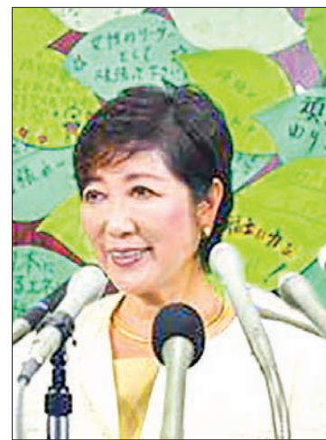
Former Defence Minister YuriKo Koike attends a press conference at her election campaign office in Tokyo on 1 August 2016, a day after winning the Tokyo gubernatorial election. In the background are messages from supporters written on paper "green leaves" decorating the office. Koike, also a former environment minister, chose green as the symbol of her campaign to promote her environment-friendly stance.

"We need to coordinate (with the governor) for the good of the