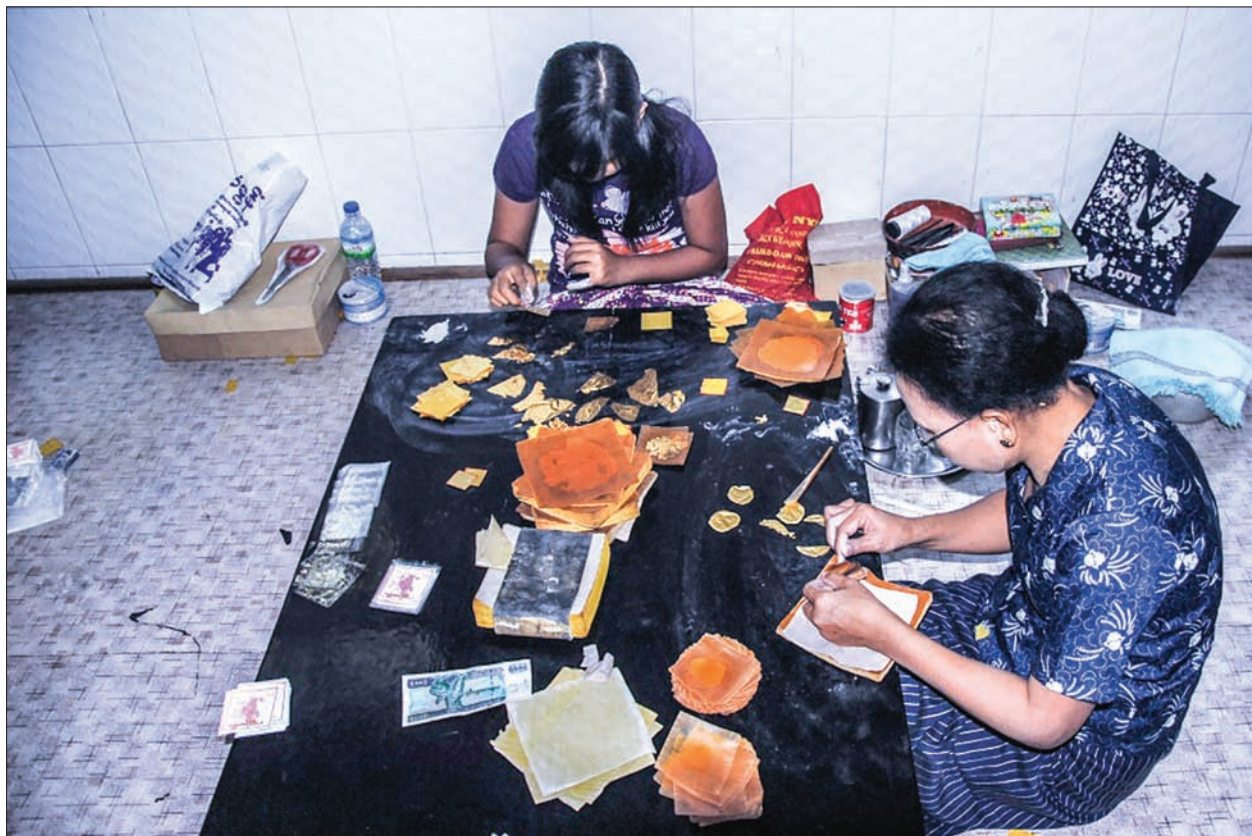
Workers make gold foil traditionally in Mandalay.

They offer a higher price because it is hard to find the seaweeds in the rainy season. Those seaweeds fetch from Ks20,000 to Ks30,000 per viss. Hotels use those seaweeds to make a dish, he added. Salon people live in Myeik, Kyunsu, Palaw, Taninthayi, Kawthaung and Bokepyin townships and Don Kyun and Zardetgyi Kyun, Makyongalat and Nyaungwi village.—200