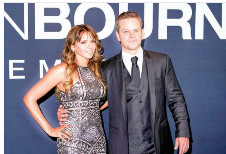
Luciana Barroso and actor Matt Damon arrive for the Universal Pictures movie premiere of “Jason Bourne” at Caesars Palace hotel-casino in Las Vegas, Nevada, US, on 18 July 2016.

“Jason Bourne” marks the series’ second highest opening, behind “The Bourne Ultimatum’s” $69.3 million debut. When adjust-