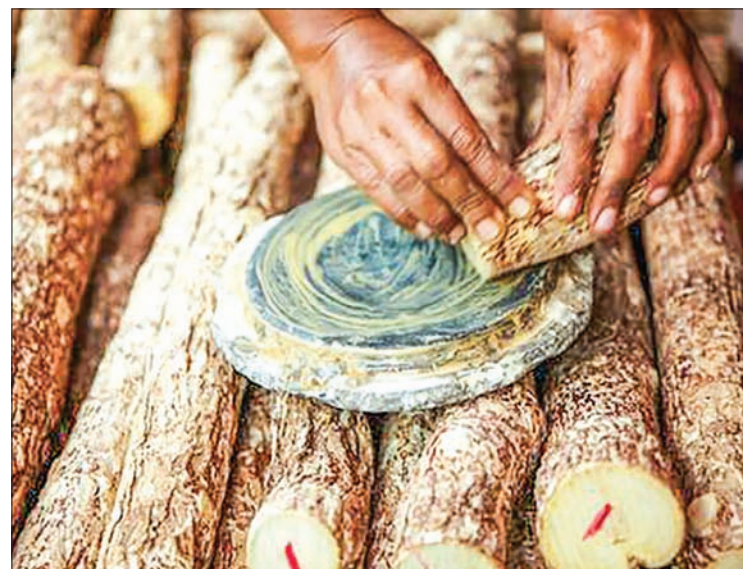
The Thanaka is used for sun protection and acne treatment.

Acne is a disease that affects the skin's oil glands. Acne is not a serious health threat, but it can cause scars.—GNLM