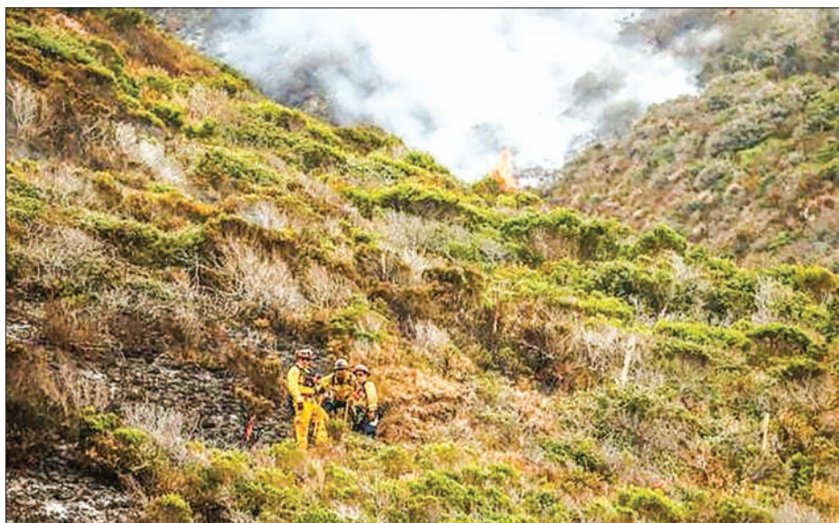
Firefighters stand on steep terrain while fire crews create fire breaks at Garrapata State Park during the Soberanes Fire north of Big Sur, California, US, on 31 July.

They had hoped that favourable weather condi-