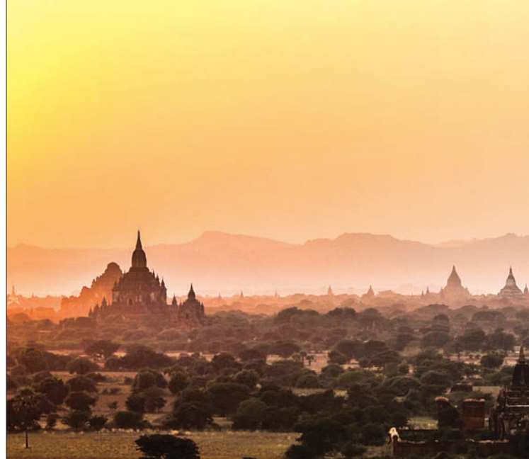
The sunset in Bagan.

Business Aviation Center is conducting joint operation with state-owned Myanmar National Airline (MNA). Myanmar MJETS Business Aviation Center was located at the hangar owned by MNA. Myanmar MJETS Business Aviation Center was opened on 1st August, 2014 at Yangon International Airport. Those who come to Myanmar with private jets can use Myanmar MJETS Business Aviation Center for both arrival and departure instead of using main terminal of Yangon International Airport.—200