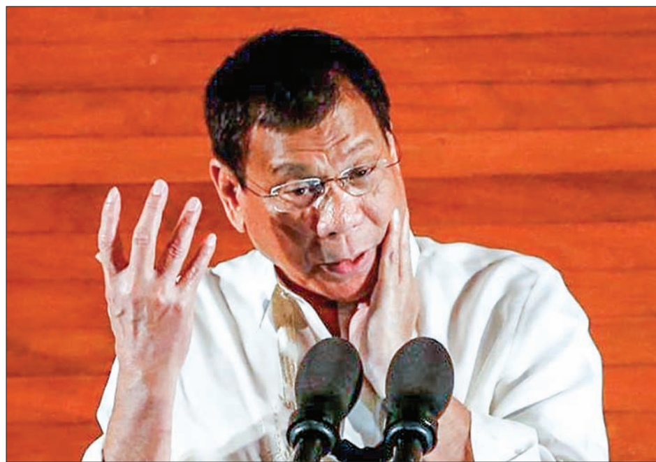
Philippine President Rodrigo Duterte speaks during his first State of the Nation Address at the Philippine Congress in Quezon city, Metro Manila, Philippines, on 25 July 2016.

MANILA — Philippine President Rodrigo Duterte on Monday warned mining companies to strictly follow tighter environmental rules or shut down, saying the Southeast Asian nation could survive without a mining industry.