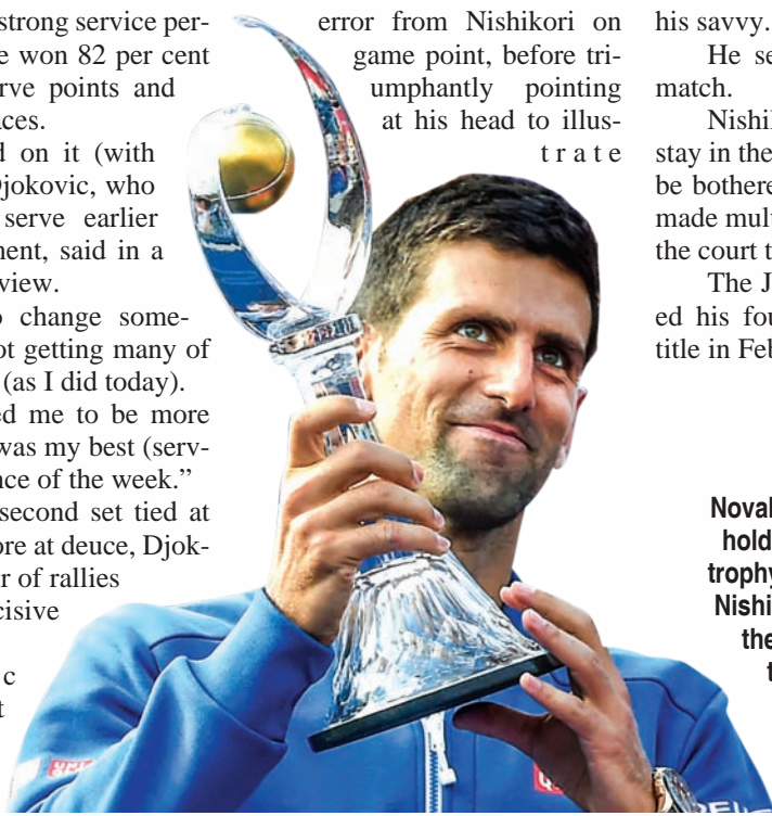
Novak Djokovic of Serbia holds up the champions trophy after defeating Kei Nishikori of Japan to win the Rogers Cup tennis tournament at Aviva Centre, Toronto, Ontario, Canada, on 31 July 2016.

"Hopefully I'll get at least one medal."—Reuters