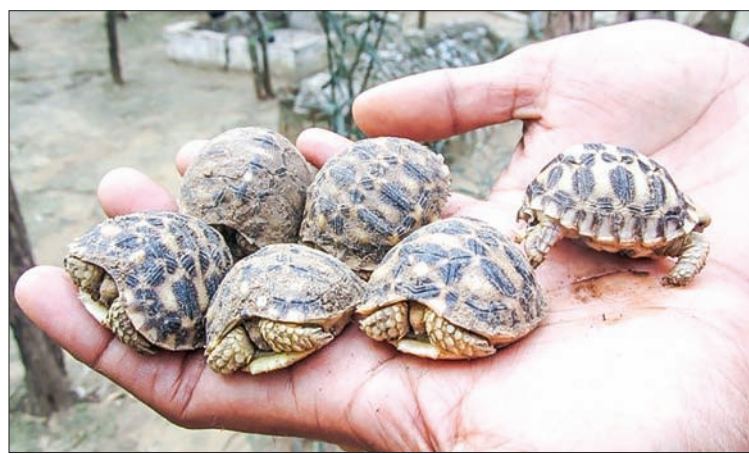
Baby star tortoises ( Geochelone platynota) are seen before released to conservation area.