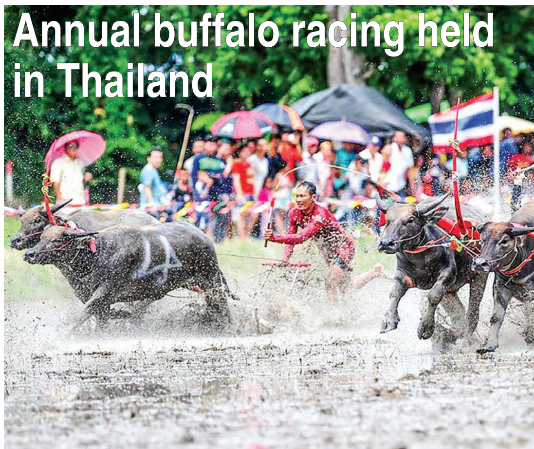
Thai buffalo racers compete during an annual buffalo racing in Chonburi Province, Thailand, on 31 July 2016.