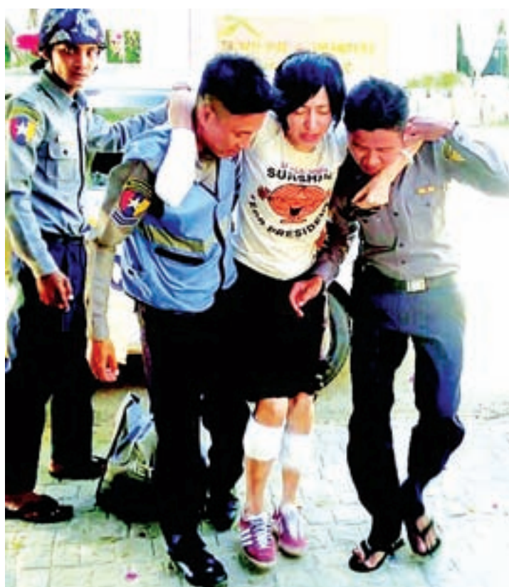
The Taiwanese woman being helped by the police.

According to an investigation two men and two women approached the Taiwanese woman while she was drawing a picture near the pagoda before asking her for money. When she refused to give the group any cash they beat her and stole what little money was in her possession in addition to her passport. Police are still investigating.— Ye Thura Aung (Nyaung Oo)