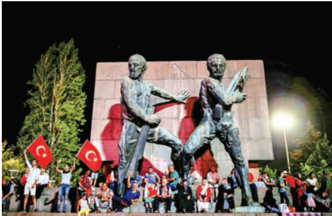
People sit in front of a statue as they gather in solidarity night after night since the 15 July coup attempt in central Ankara, Turkey, on 27 July 2016.

reported that more than 15,000 people, including around 10,000 soldiers had been detained so far over the coup, citing the interior minister. Of those, more than 8,000 were formally arrested pending trial, it said.