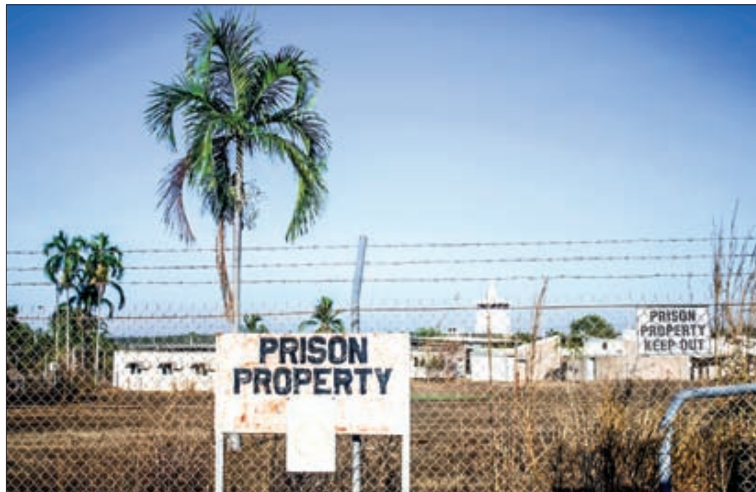
Barbed wire fences surround the Don Dale Youth Detention Centre located near Darwin in the Northern Territory, Australia, on 27 July 2016.