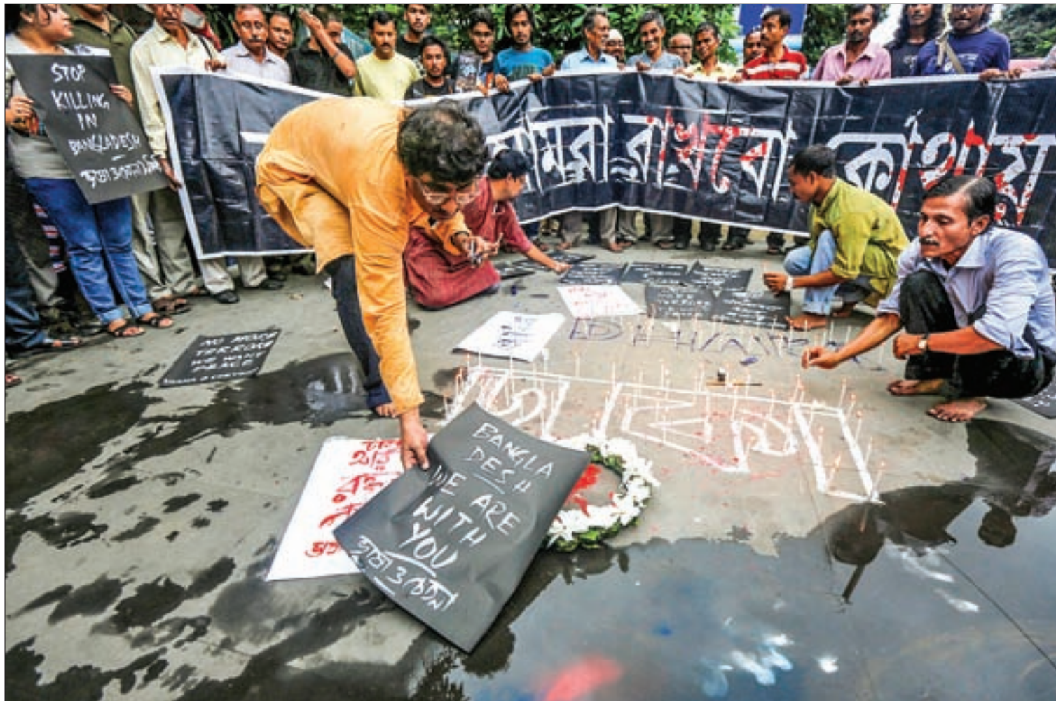
A man places a sign as others light candles during a vigil in Kolkata, India, to show solidarity with the victims of the attack at Holey Artisan restaurant after Islamist militants attacked the upscale cafe in Dhaka, Bangladesh, on 2 July, 2016.