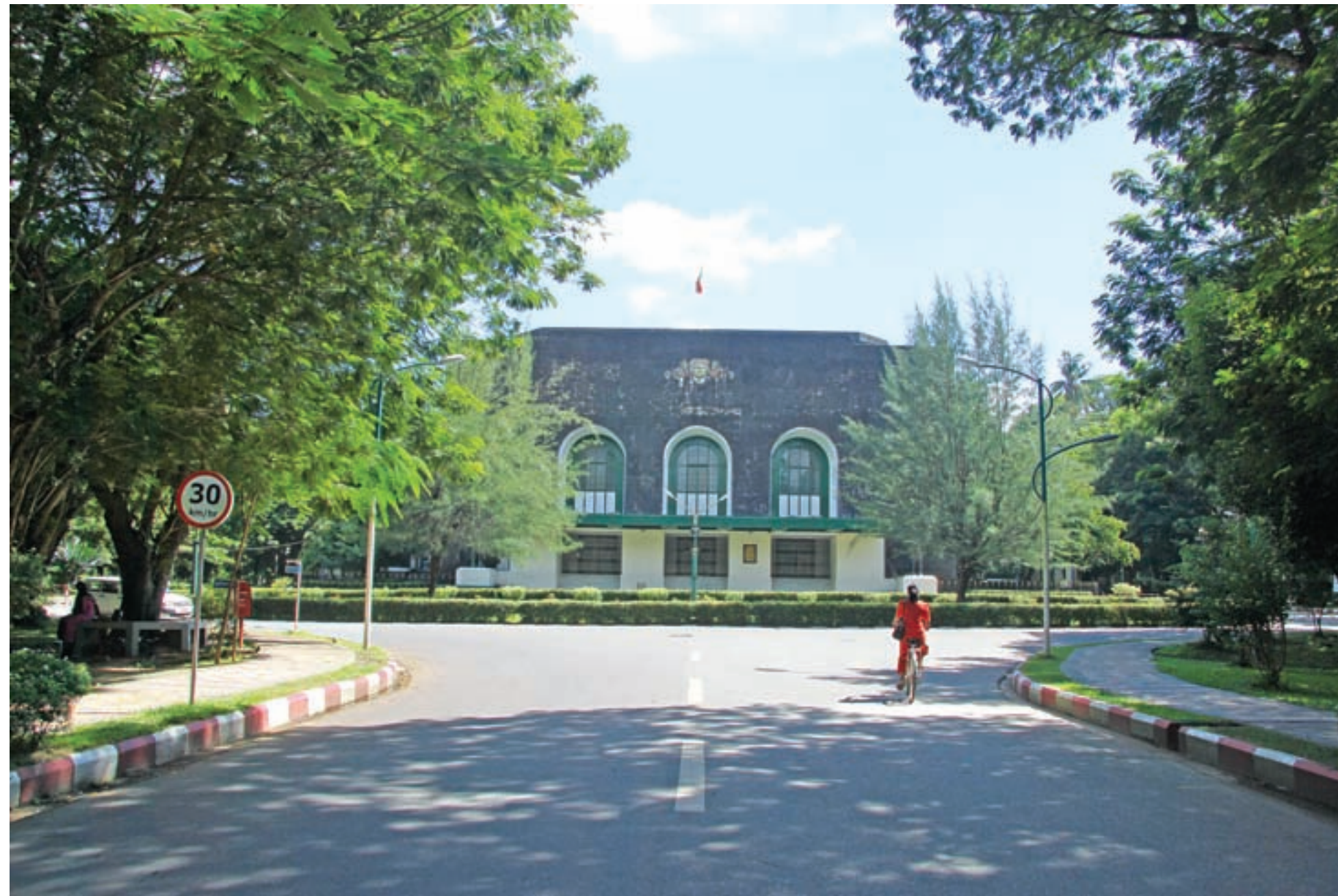
The convocation hall on Chancellor's Road.