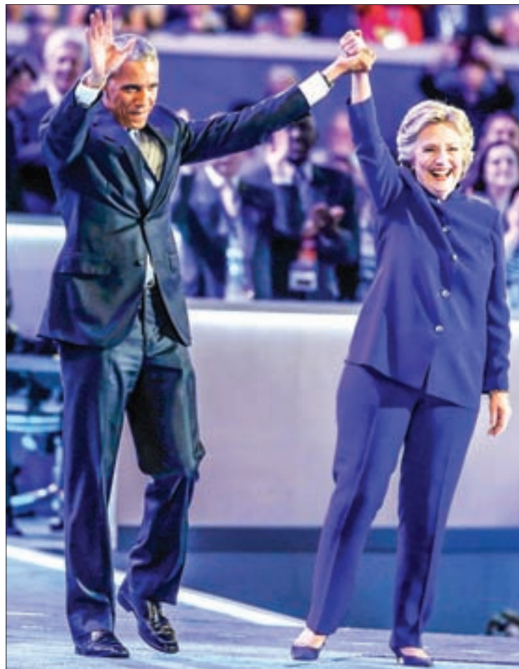
Democratic presidential nominee Hillary Clinton joins President Barack Obama after his speech at the Democratic National Convention in Philadelphia, Pennsylvania, US on 27 July 2016.

PHILADELPHIA — President Barack Obama painted an optimistic picture of America's future and offered full-throated support for Hillary Clinton's bid to defeat Republican Donald Trump in a speech that electrified the Democratic National Convention.