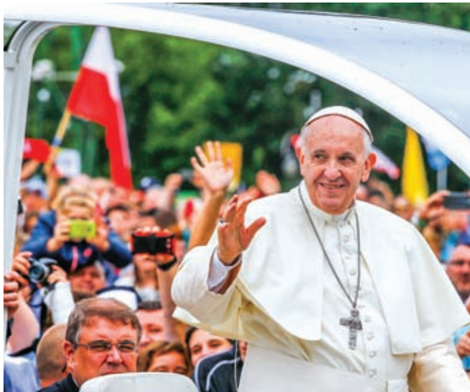
Pope Francis greets the faithful as he arrives at the Jasna Gora shrine in Czestochowa, Poland on 28 July 2016.

Poland's political landscape has undergone a big shift since October