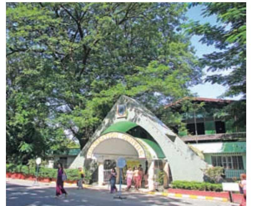
Recreation Centre on Chancellor's Road.

When the university was reopened, I proceeded to the second years honours class. I noticed that a few friends of mine did not turn up. No definite information about them was available to us. With more constraints imposed on the students, we hardly felt freedom and happiness. Commodity-prices were some times higher than those before 1988. Due to the economic set-back, most parents were hard up. So students came to focus more on their study to be able to graduate from the university as early as possible. I graduated from Yangon University with my honours degree in 1992. Thus my university life at Yangon University came to an end. Anyway, the days I spent at Yangon University are the most carefree and happiest moments in my life. I wish that my Alma Mata, under the management of the first civilian democratic government, would be rejuvenated with promising, fresh generation students and higher academic prestige in a few years to come.