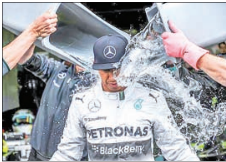
McLaren Mercedes team members dump buckets of ice water onto Formula One driver Lewis Hamilton of Britain as he takes part in the 'Ice Bucket Challenge' after the first practice session at the Belgian F1 Grand Prix in Spa-Francorchamps in 2014.

"It is a prime example of the success that can come from