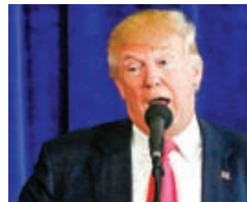
Republican Donald Trump.

Trump was referring in his remarks to a private email system Clinton kept while secretary of state from 2009 to 2013. She handed over thousands of emails in 2015 to US officials probing