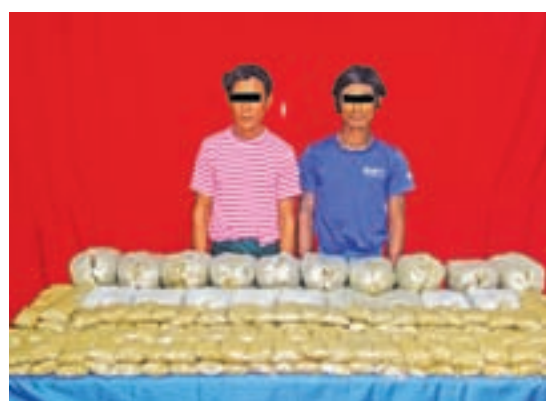
The criminal suspects being seen.