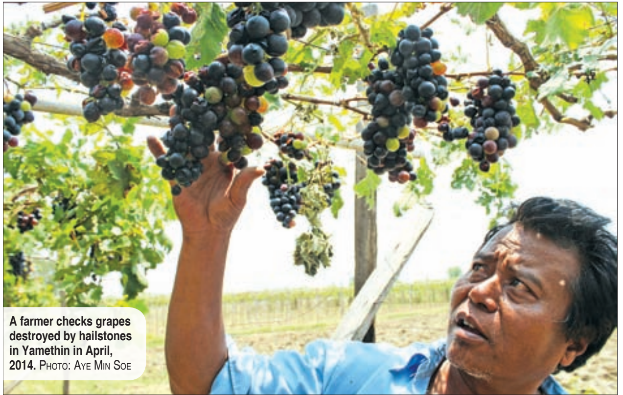
A farmer checks grapes destroyed by hailstones in Yamethin in April, 2014.