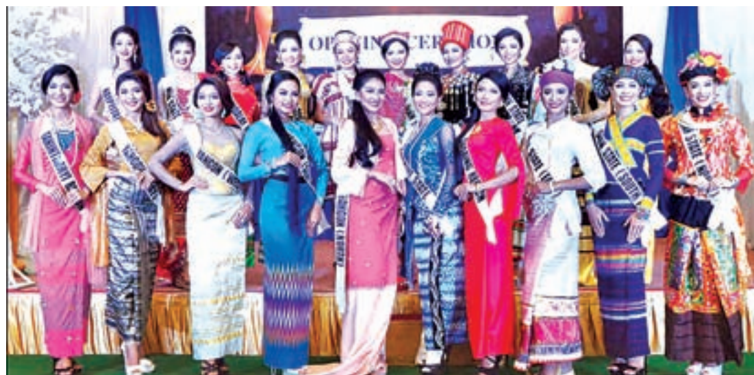
Miss Golden Land Myanmar final lists posing for a group photo.