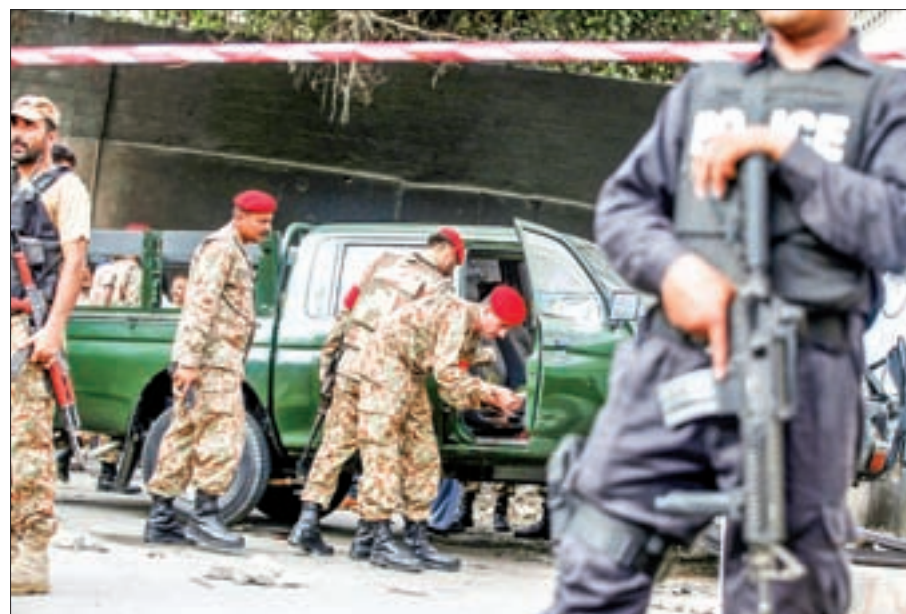
Military soldiers collect evidence from an army vehicle after two army personnel were killed by attackers on a motorcycle in Karachi, Pakistan, on 26 July, 2016.

The crackdown has boosted security in Karachi, although in recent months, a popular Sufi musician, Amjad Sabri, was shot dead and the son of the provincial chief justice was kidnapped, but later rescued.—Reuters