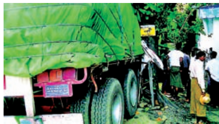
The truck seen after crashing into a house in Kyaukdaga.

The home was badly damaged but no one was injured in the accident. The driver has been charged by police.— Khin Ko (Kyaukdaga)