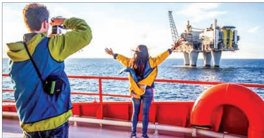
People observe an oil platform during a cruise in the North Sea, Norway, in this handout picture on 21 July 2016. PHOTO: REUTERS

Many were curious to see Norway's oil production first hand. Oil brought wealth to a once-poor country of 4.2 million within a generation, and is still its top industry. But the bulk of the work is unseen as it takes place offshore.—Reuters