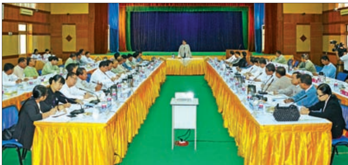
A work coordination meeting to hold press conferences of the ministries in progress.

A WORK coordination meeting to hold press conferences of the ministries regarding the new government's work performance for the first 100 days was held in Nay Pyi Taw yesterday.