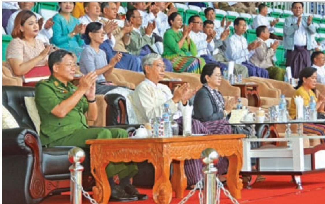
President U Htin Kyaw and Commander-in-Chief Senior General Min Aung Hlaing watch the final match of Inter-ministry Men's Football Championship.