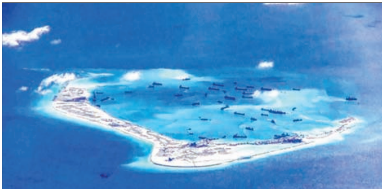
Chinese dredging vessels are purportedly seen in the waters around Mischief Reef in the disputed Spratly Islands in the South China Sea in this still image from video taken by a P-8A Poseidon surveillance aircraft provided by the United States Navy on 21 May 2015.