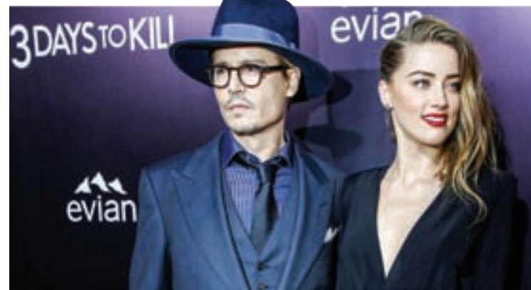
Johnny Depp and Amber Heard.

LOS ANGELES — Actress Amber Heard has alleged that her former husband Johnny Depp is trying to delay their divorce by insisting she signs a non-disclosure agreement before he submits financial documents to the court.