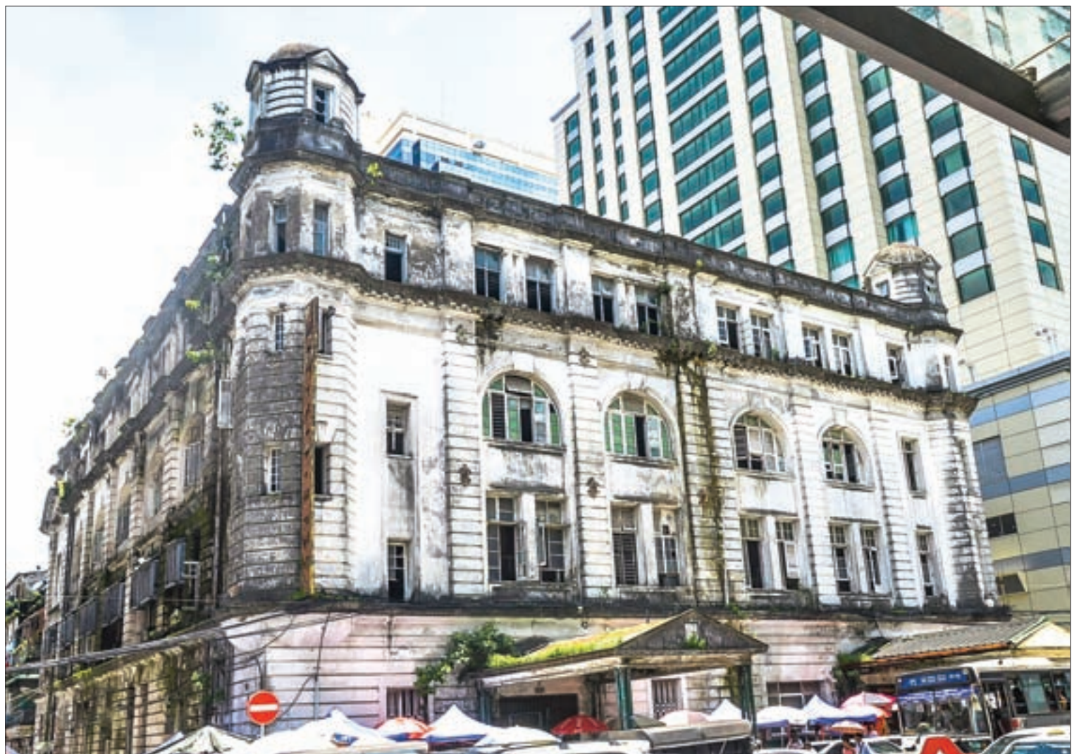
See page 3 >> The historic building belonging to Burma Oil Corporation (BOC) during the colonial era is chosen for the new location for the National Library.

The National Library has a large collection of books, periodicals, manuscripts and other rare books, holding 172,556 books, 435,580 periodicals, 12,323 palm-leaf manuscripts, 345 hand-written letters, 25,468 rare books and other literary materials.