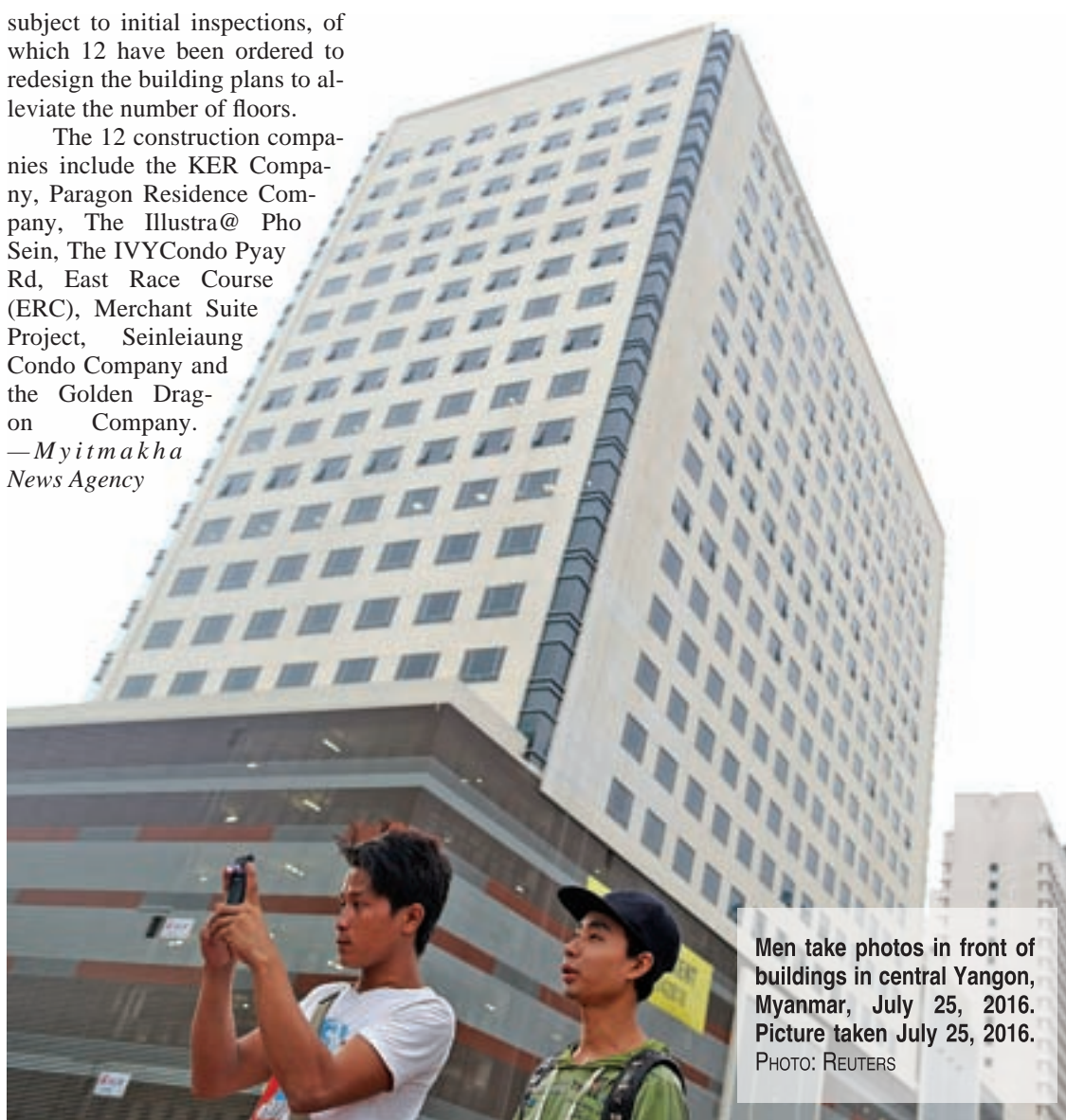
Men take photos in front of buildings in central Yangon, Myanmar, July 25, 2016. Picture taken July 25, 2016.