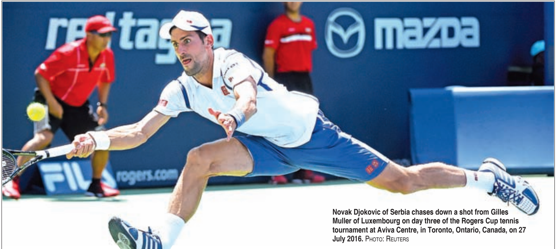
Novak Djokovic of Serbia chases down a shot from Gilles Muller of Luxembourg on day three of the Rogers Cup tennis tournament at Aviva Centre, in Toronto, Ontario, Canada, on 27 July 2016.

TORONTO— Novak Djokovic was given a scare in his North American hardcourt season opener but managed to prevail with a 7-5, 7-6(3) victory over Luxembourg's Gilles Muller on Wednesday to reach the third round of the Rogers Cup.