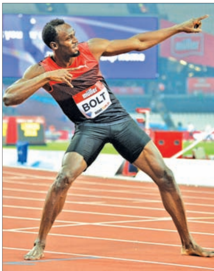
Usain Bolt (JAM) poses after winning the 200m in 19.89 in the London Anniversary Games during an IAAF Diamond League meet at Olympic Stadium, London, on 22 July 2016.

KINGSTON — Jamaica's Usain Bolt has landed in Rio de Janeiro more than a week before the Olympics opening ceremony to fine tune his preparations for his attempt at an unprecedented triple-triple of gold medals in the men's sprints.