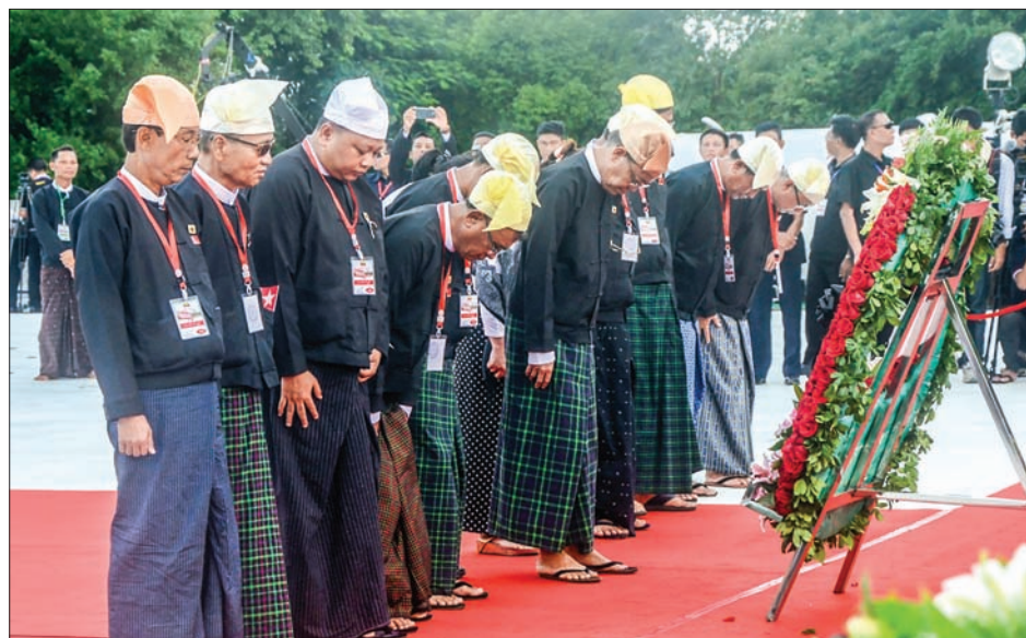
Yangon Hluttaw pay tribute to martyrs at mausoleum.