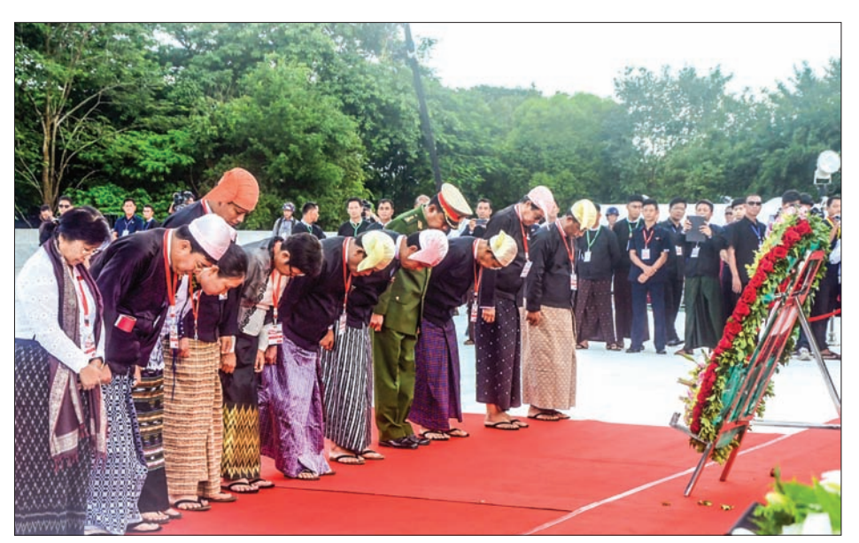
Yangon Region Government pay tribute to martyrs at mausoleum.