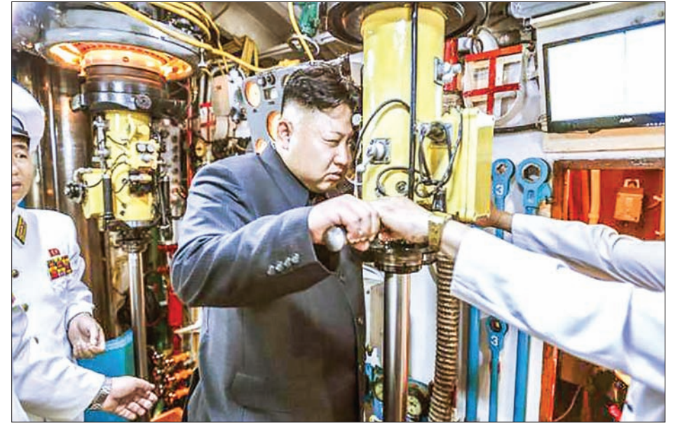
North Korean leader Kim Jong Un looks through a periscope of a submarine during his inspection of the Korean People's Army (KPA) Naval Unit 167 in this undated photo released by North Korea's Korean Central News Agency (KCNA) in Pyongyang in 2014.

"The ballistic missiles' flight went from 500 km to 600 km, which is a distance