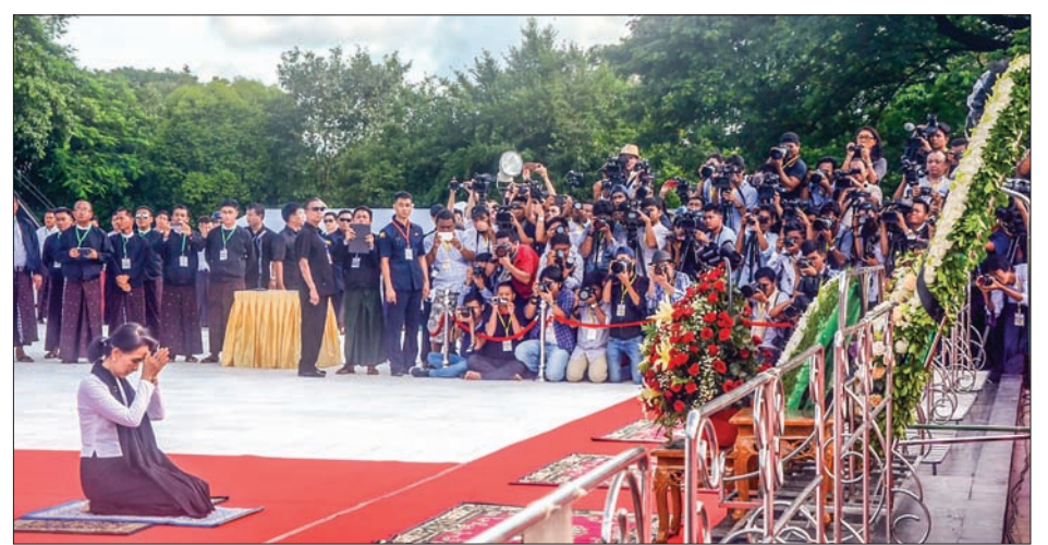
Daw Aung San Suu Kyi pays tribute to national leader General Aung San.