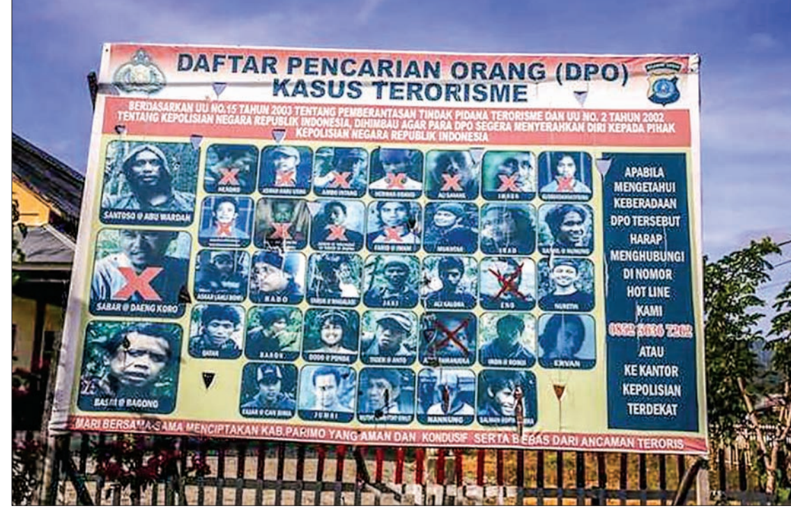
A police billboard showing a list of individuals, including the country's top militant Santoso (top L), wanted in relation with terrorism cases in Poso, Indonesia's Central Sulawesi province, on 19 December 2015.

Presidential spokesman Johan Budi said on Monday that Santoso was believed to be one of two militants killed in an exchange of fire with police on Sulawesi island, where he was thought to be hiding.