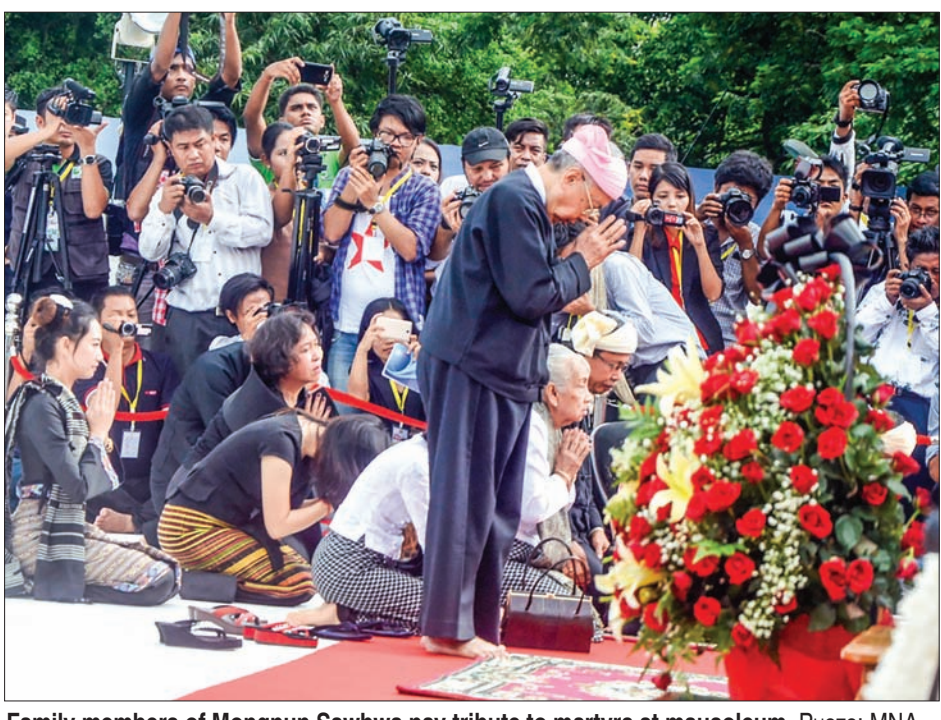
Family members of Mongpun Sawbwa pay tribute to martyrs at mausoleum.