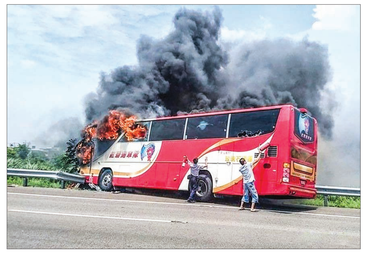
A tourist coach caught fire on a highway near Taoyuan Airport, on 19 July 2016, killing 26 people on board, including 24 mainland tourists from northeastern Liaoning Province.

"We are highly concerned about the safety of our mainland compatriots," Ma said, adding that a working team will be dispatched to Taiwan to assist with handling the aftermath of the accident. — Xinhua