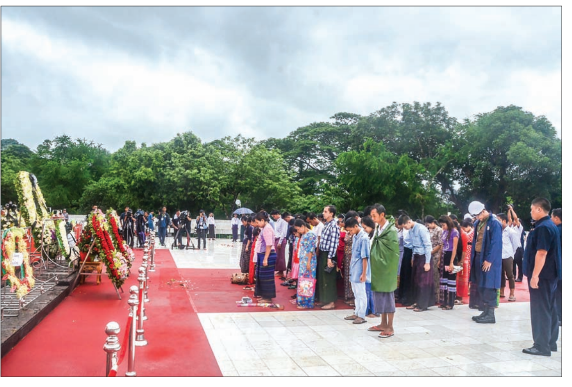
General public pay tribute to martyrs at mausoleum.