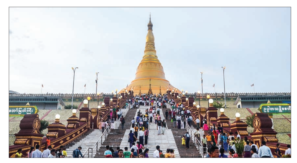
Uppatasanti Pagoda is crowded with Buddhist devotees on the Dhammacakka Day.