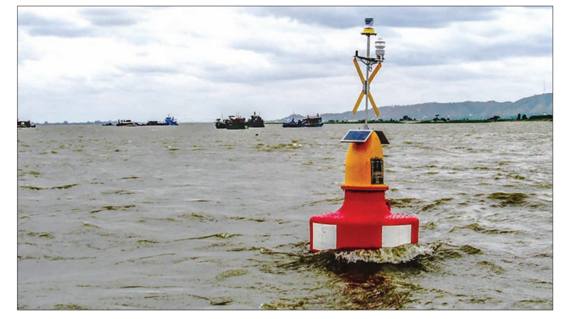
A weather station buoy being seen at Gaw Wein.

The Australia Company has donated a total of three weather measuring pieces to Myanmar: one buoy with a weather sensor at Mandalay Jetty, a radar device at Innwa (Sagaing Bridge) to measure the water level and speed of the Ayeyawady and another buoy in the Yangon River with a weather sensor and water quality measuring apparatus. —Aung Thant Khine