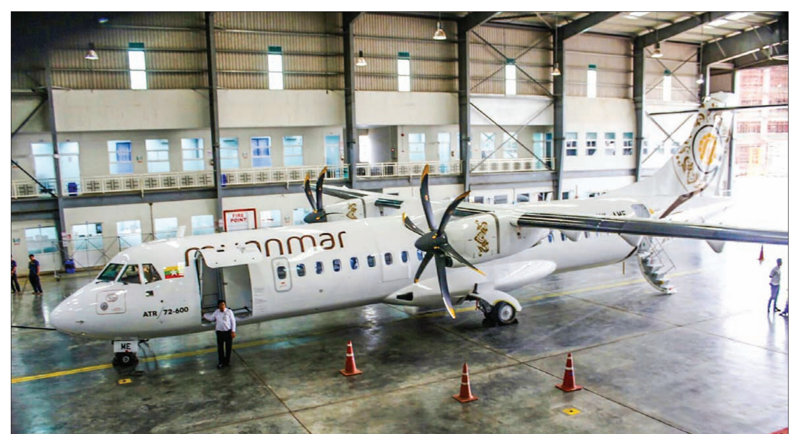
New aircraft ATR72-600 of Myanmar National Airlines seen at Yangon International Airport.

According to the MNA, the arrival of the new aircraft will help the airline provide its customers with better services and new destinations.-GNLM