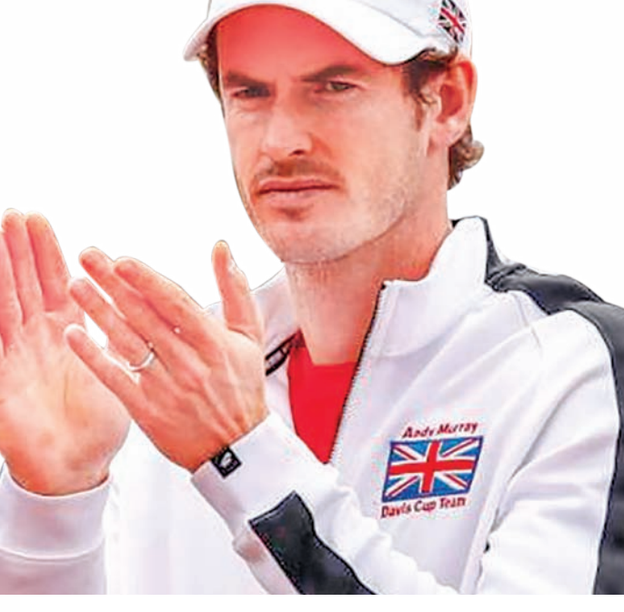
Great Britain's Andy Murray. PHOTO: REUTERS

consider banning all sportsmen and women entered by the Russian Olympic Committee for next month's Rio Olympics. The McLaren report revealed evidence of widespread state-sponsored doping by Russian athletes at the 2014 Sochi Olympics, and said Moscow concealed hundreds of positive doping tests in many sports ahead of the Sochi games. The Russian Olympic committee said on Tuesday that allegations required fuller investigation and it was ready to provide full assistance in such an investigation. -Reuters