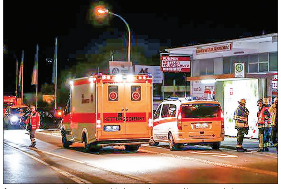
German emergency services workers work in the area where a man with an axe attacked passengers on a train near the city of Wuerzburg, Germany early 19 July, 2016.

Unlike neighbours France and Belgium, Germany has not been the victim of a major attack by Islamic militants in recent years, although security officials say they have thwarted a large number of plots. Germany welcomed roughly 1 million migrants in 2015, including thousands of unaccompanied minors. Many were fleeing war in Syria, Iraq and Afghanistan.—Reuters