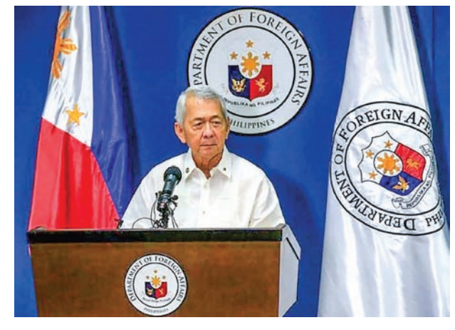
Philippine Foreign Secretary Perfecto Yasay gives a brief statement regarding the tribunal ruling on the South China Sea during a news conference at the Department of Foreign Affairs headquarters in Pasay city, metro Manila, Philippines on 12 July 2016.

Manila wanted to enforce the points of the complex ruling step-by-step but as a priority had asked China to let its fishermen go to the Scarborough Shoal without being harassed by its coastguard, Yasay said.