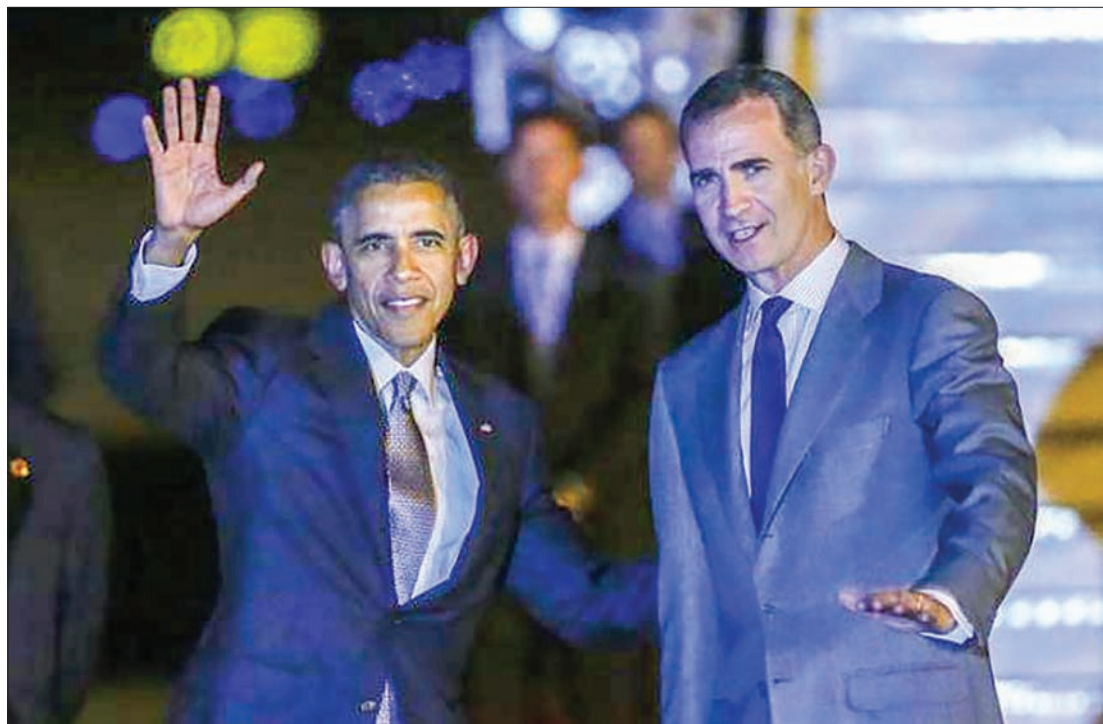
US President Barack Obama waves as is welcomed by Spain's King Felipe, following his arrival aboard Air Force One at the Torrejon airbase, outside Madrid, Spain, on 9 July, 2016.