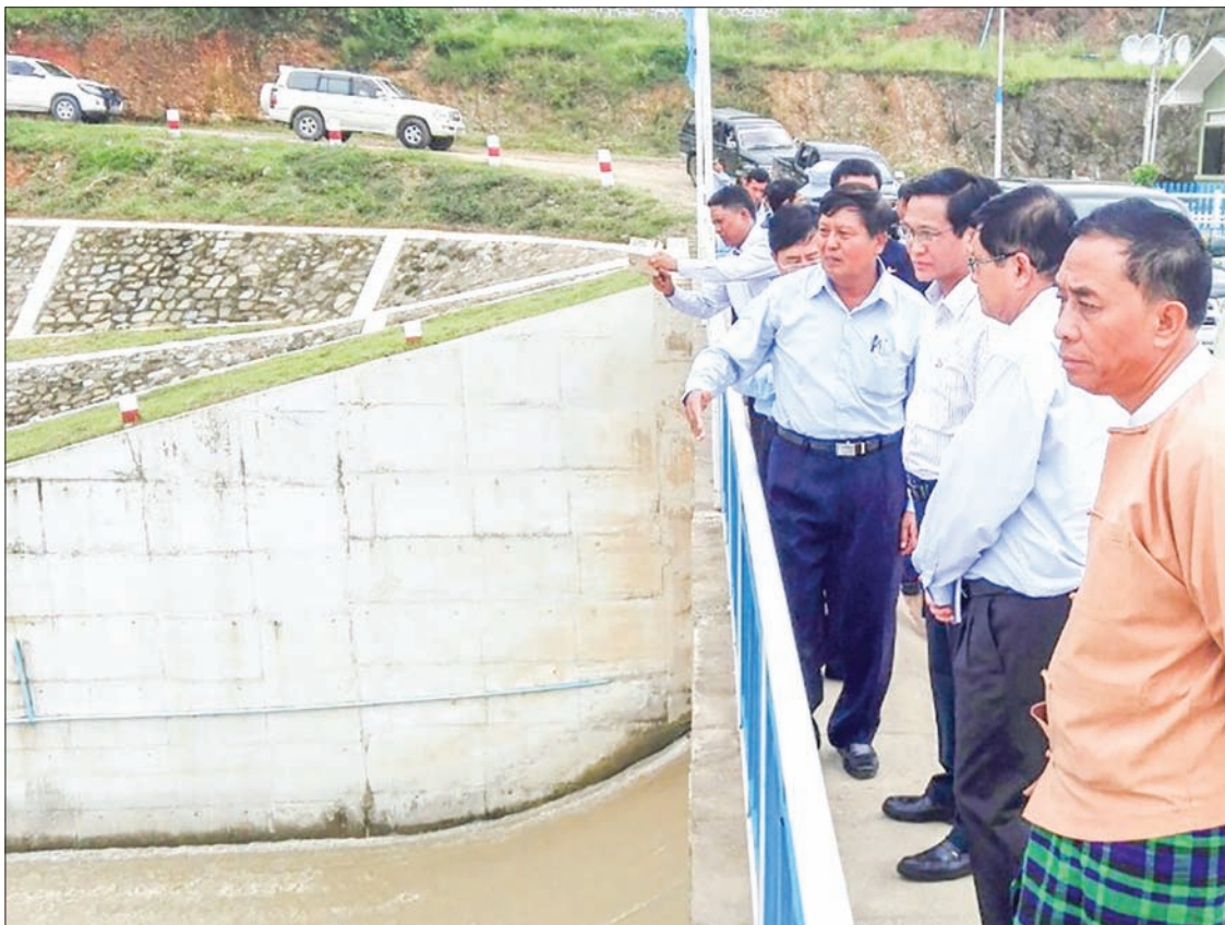
Vice President U Henry Van Thio inspects the Yazagyo Dam in Sagaing.

U Henry Van Thio also inspected the reclamation of creeks and the construction of bridges in nearby villages. — Myanmar News Agency