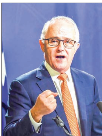
Australian Prime Minister Malcolm Turnbull speaks during a news conference in Sydney, Australia, on 10 July 2016.