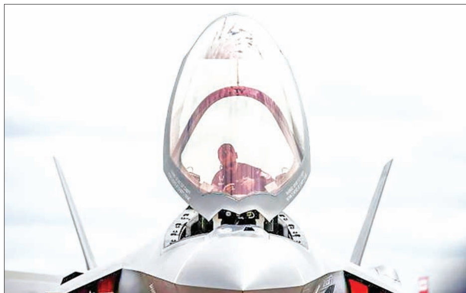
A RAF Lockheed Martin F-35B fighter jet taxis along a runway after landing at the Royal International Air Tattoo at Fairford, Britain on 8 July 2016.