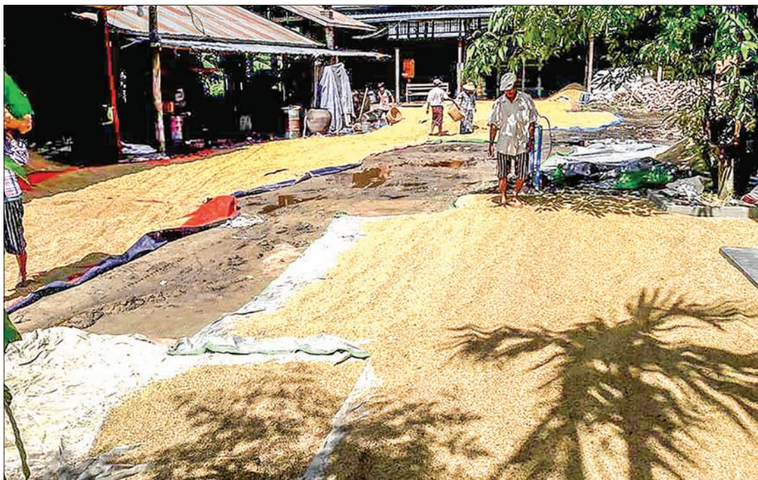
Paddy being seen dried in the sun.