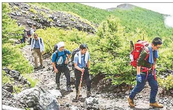
Climbers walk on the Fujinomiya trail for Mt. Fuji in Shizuoka Prefecture, central Japan, on 10 July, 2016.