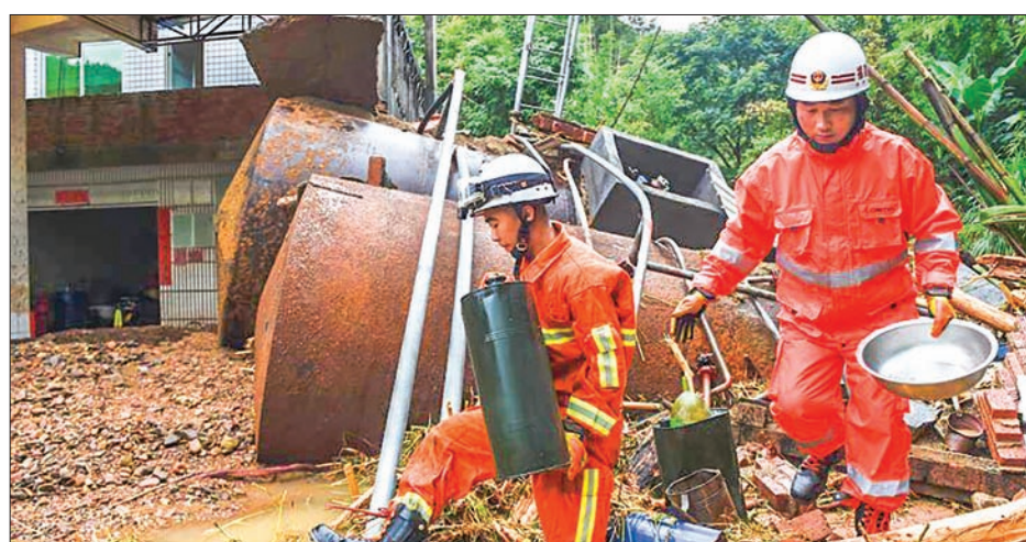
Firemen carry out rescue work at a gas station destroyed by landslide in Zhangping, southeast China’s Fujian Province, on 10 July 2016.

Nearly 49,000 hectares of crops were damaged by the typhoon, 4,500 hectares of which were totally destroyed. Nearly 400 flights were canceled, and more than 300 bullet trains