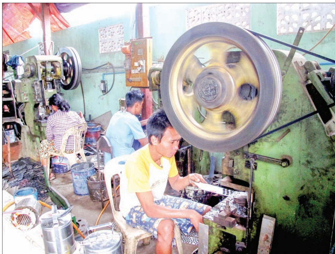
A small enterprise being seen in Mandalay.

At the moment, 90 per cent of Myanmar Businesses are SMEs. The Small and Medium