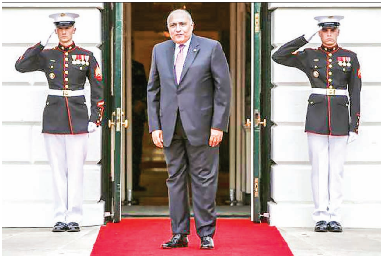
Egypt's Foreign Minister Sameh Shoukry arrives for a working dinner with heads of delegations for the Nuclear Security Summit at the White House in Washington on 31 March 2016.

the visit in public remarks on Sunday at the weekly meeting of his cabinet. He said he would hold two meetings during the day with Shoukry.