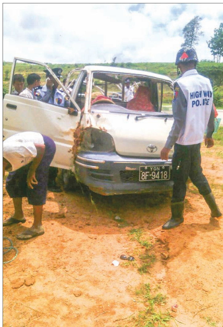
Highway police looks into the light truck after the accident.

The driver and a retired school teacher were killed in the disaster. The injured people were taken to a hospital in Nay Pyi Taw an hour later, with a doctor saying that four were in serious conditions.— Than Oo (Layhmyatnar)