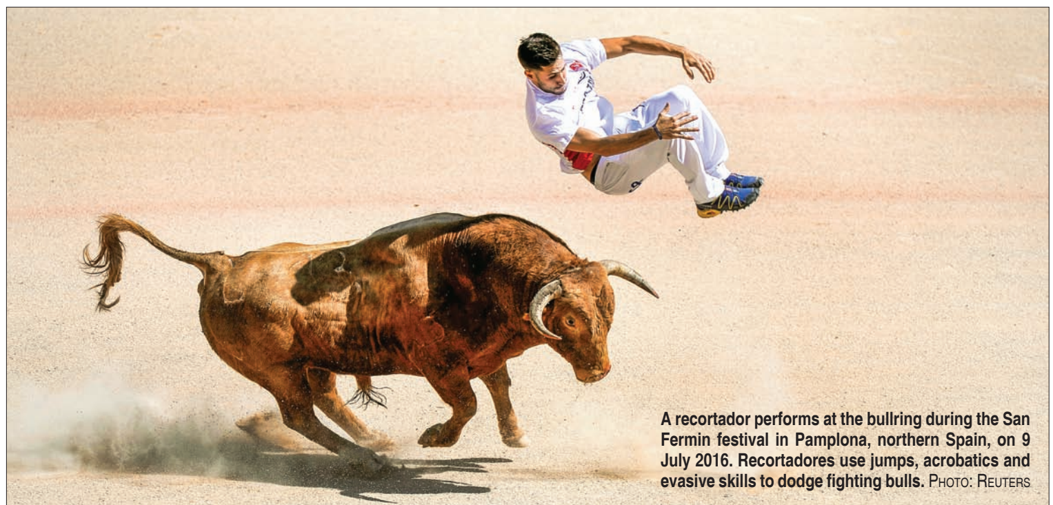
A recortador performs at the bullring during the San Fermin festival in Pamplona, northern Spain, on 9 July 2016. Recortadores use jumps, acrobatics and evasive skills to dodge fighting bulls.

A bull's horn pierced his lung and heart as he was trying to help another runner during the event, in which a man was killed last year, a spokesman for the regional government said.