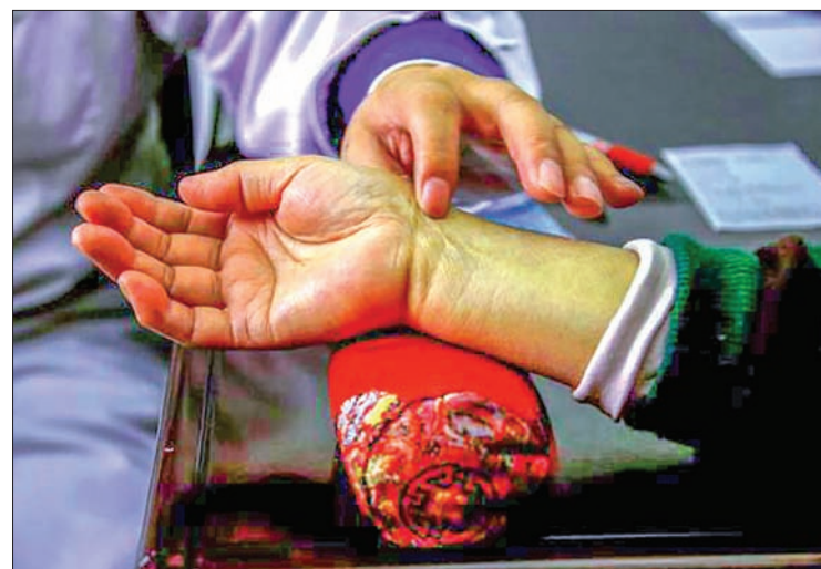
A diabetes patient has her pulse checked by a diabetes specialist doctor during a medical check-up at a hospital in Beijing, China in 2012.

The stress is particularly apparent in lower-tier cities and