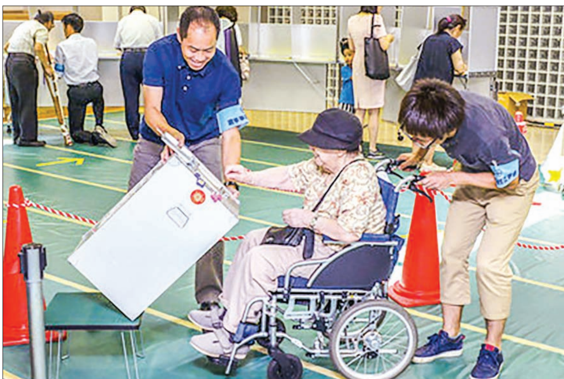
A woman in a wheelchair casts her ballot with the help of election officials in Japan's House of Councillors election at a polling station in central Tokyo on 10 July, 2016. At stake are half the 242 seats in the Diet's upper house, as staggered elections are held every three years for seats and six-year terms. A total of 389 candidates are running for the 121 seats up for grabs.

The main opposition Democratic Party has campaigned together with the Japanese Communist Party and others, citing the need to protect the Constitution — and particularly the