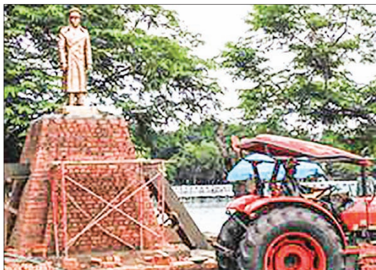
Bogyoke Aung San memorial park in Pyinmana is under renovation.

Local people funded the works and the park would be opened to coincide with the ceremony to commemorate the 69th