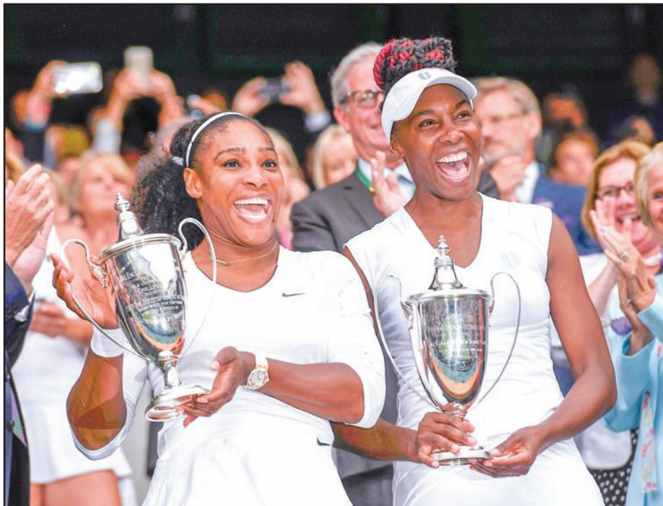
USA's Serena Williams and Venus Williams celebrate winning their womens doubles final against Hungary's Timea Babos and Kazakhstan's Yaroslava Shvedova with the trophies at All England Lawn Tennis & Croquet Club, Wimbledon, England on 9 July 2016.