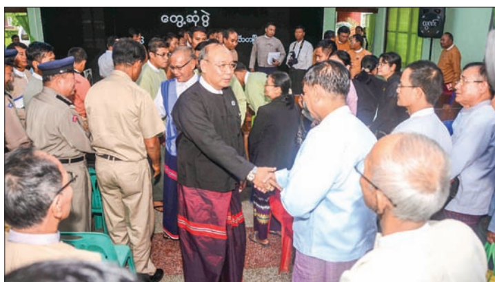
Mahn Win Khaing Than greeting locals.

Parliamentary representatives are to serve the people and make their voices heard in parliament, Mahn Win Khaing Than, Speaker of both Pyidaungsu Hluttaw and Amyotha Hluttaw, said in a meeting with local residents in Hinthada, Ayeyawady Region, on 9 July.