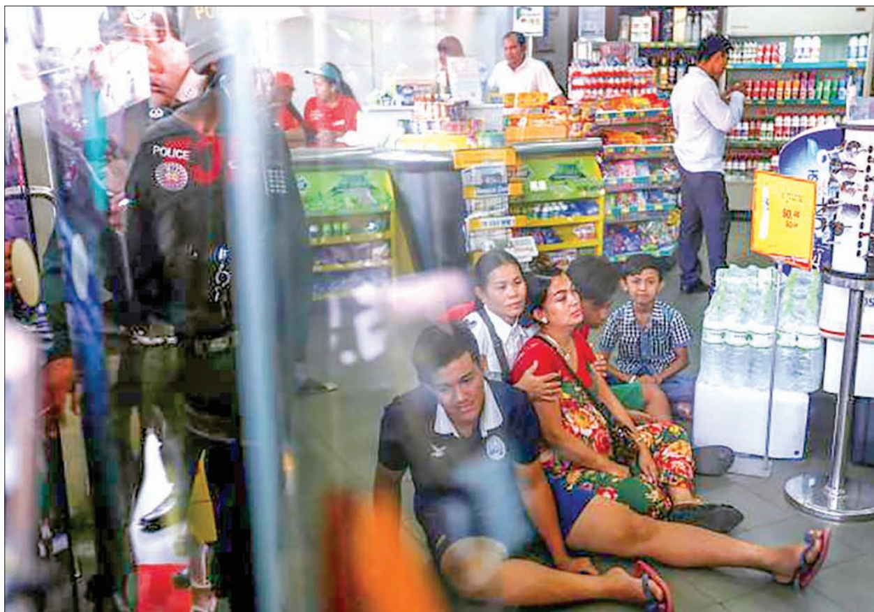
Relatives of Kem Ley, anti-government figure and the head of a grassroots advocacy group, ‘Khmer for Khmer’ sit inside a gas station after he was shot dead in Phnom Penh July 10, 2016.

A Reuters witness saw Kem Ley’s body lying in a