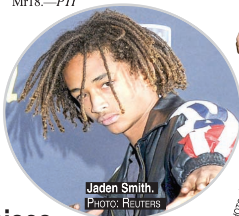
Jaden Smith.

photo of him holding baby Jaden. Jada posted, “Jaden, You are the prince of my heart. I have no doubt that you were born to me to show me how deeply I can love. You are one of the brightest lights of my life. You are my son, my friend, a walking embodiment of my soul, my treasure. Happy Birthday Mr18.—PTI