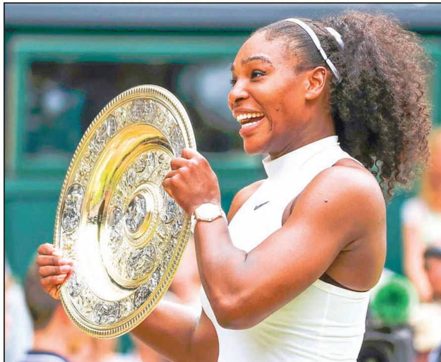
Serena Williams (USA) reacts during her match against Angelique Kerber (GER) on day 13 of the 2016 The Championships Wimbledon, London, United Kingdom, on 9 July 2016.