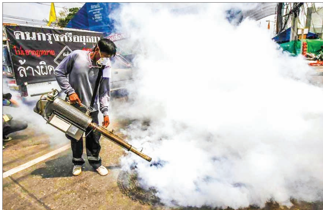
An anti-government protester carries out fumigation to prevent the spread of dengue fever during a rally near the Government Complex in Bangkok in 2014.

In 2015, a spike in cases of dengue fever in Asia — including the Philippines, Myanmar, Malaysia, Taiwan and Viet Nam — put medical services under strain.—Reuters