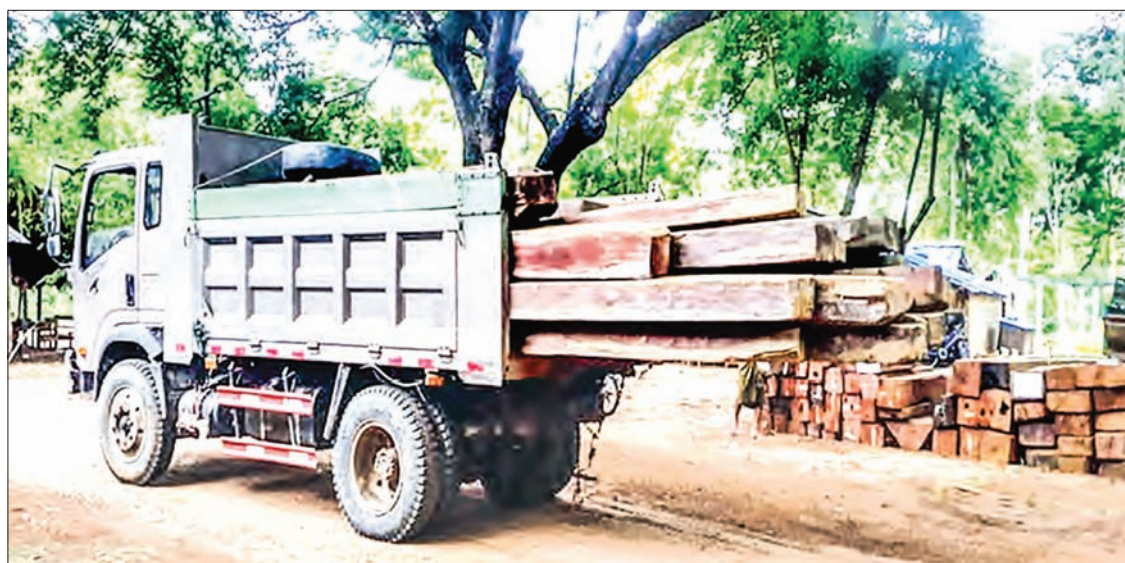
The truck loaded with illegal hardwoods.