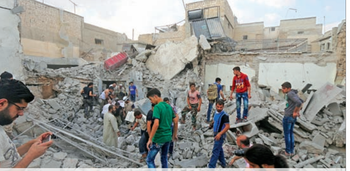
Men look for survivors under the rubble of a damaged building after an airstrike on Aleppo's rebel held Kadi Askar area, Syria on 8 July 2016.

Fighting has intensified since a February ceasefire deal unravelled.-Reuters