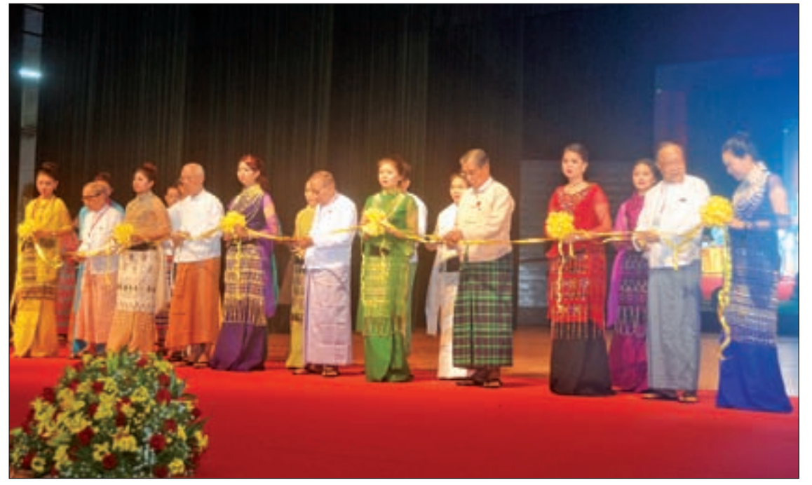
NLD Patron Thura U Tin Oo formally opening the awareness event of OAG.