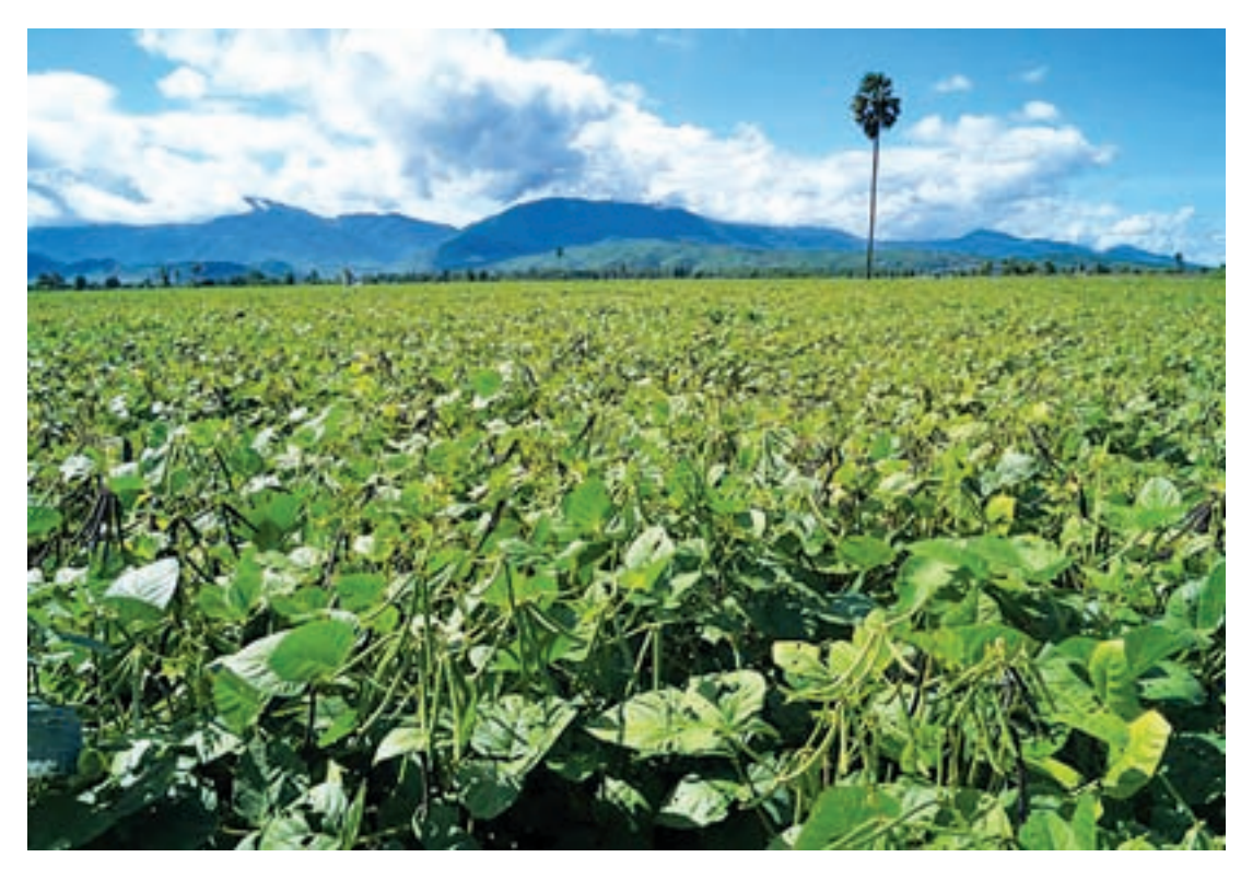
A green bean plantation being seen.

GREEN bean exports to the EU hurts because of El Niño, with the green bean prices declining this financial year, according to an official from the Myanmar Pluses, Beans and Sesame Seeds Merchants Association.