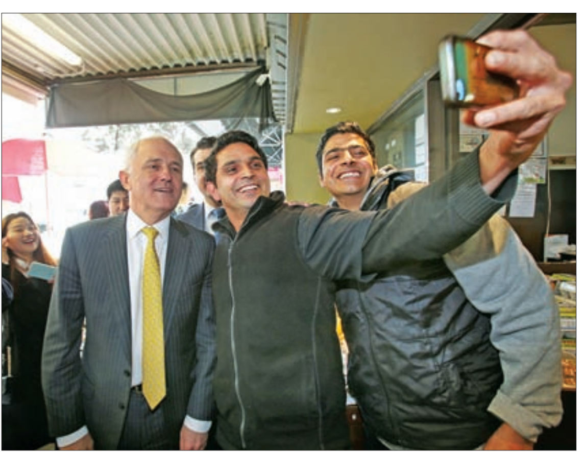
Australian Prime Minister Malcolm Turnbull poses for a selfie during a street walk in Melbourne's outer east, Australia, on 8 July 2016.

"He's going to be hostage to the right wing of his party and have to promote more of the Abbott supporters into his government, which will lead to greater division and instability," said Bill Shorten, leader of the opposition Labour Party.—Reuters