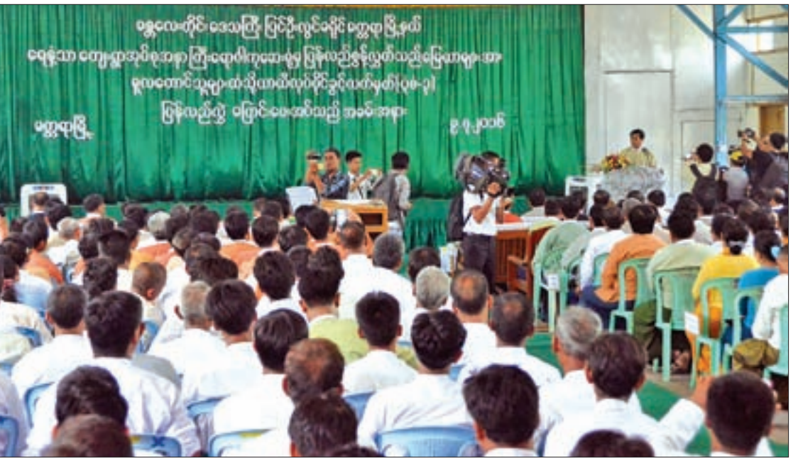
The farmland returning ceremony in progress.

In Mandalay Region, more than 35,000 acres of land were seized and some 32,000 acres have been returned.—Aung Thant Khaing