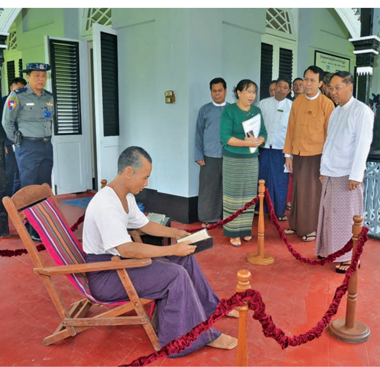
Vice President U Myint Swe and Yangon Region Chief Minister observing the silicon statue of Bogyoke Aung San.

The vice president also went to the Ministers' Office, formerly known as the old Secretariat, where he inspected the flagpole from which the British Union Jack Flag was taken down and replaced with the Myanmar Flag on 4 January 1948. He also went on an inspection tour of the conference hall in which the national leaders were assassinated and inspected the stone plaque erected in honour of the fallen national leaders. – Myanmar News Agency