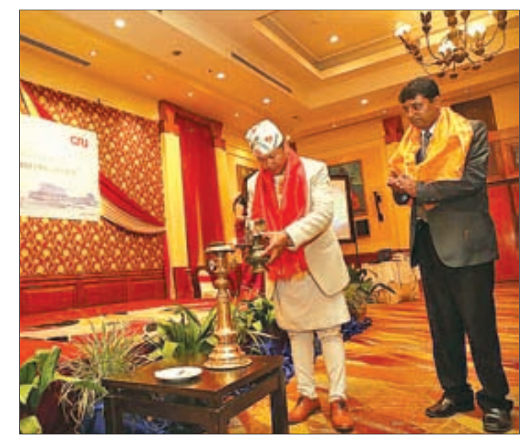
Nepalese Minister for Information and Communications Sherdhan Rai (L) inaugurates the premiere of the documentary "Nepal China Sister Cities", produced by Nepal Television and China Radio International, in Kathmandu, Nepal, on 8 July 2016. Sherdhan Rai said on Friday that bilateral relations between Nepal and China have reached a new height.

The documentary has already been aired in China whereas it started broadcasting in Nepal from Friday. — Xinhua