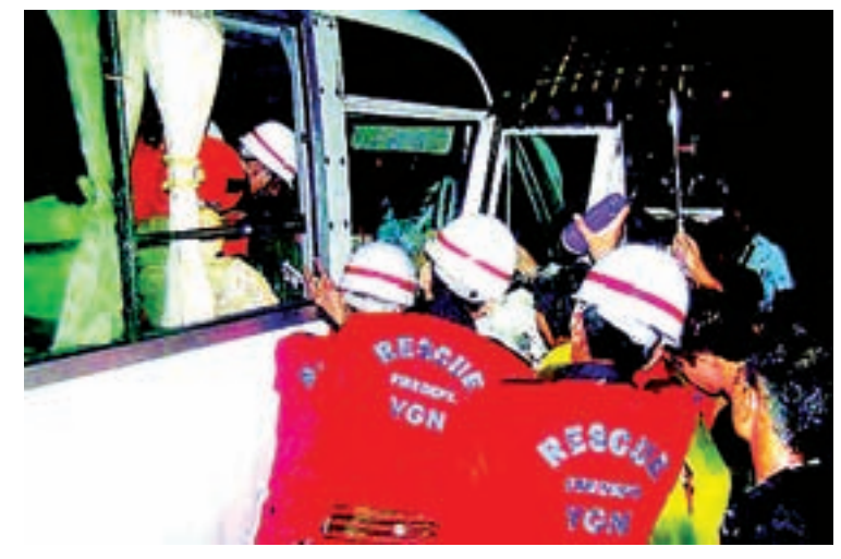
The driver being removed from the car.

The section of the road where the accident occurred is a bend. It