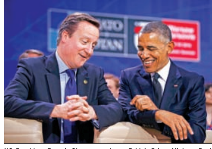
US President Barack Obama speaks to British Prime Minister David Cameron during the NATO Summit in Warsaw, Poland on 8 July 2016.

Obama discussed the procedure for Britain's withdrawal with the heads of the main EU in-