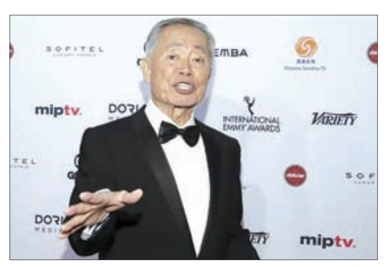
Actor George Takei attends the International Emmy Awards in Manhattan, New York, on 23 November, 2015.

Cho told the newspaper that the decision to make Sulu gay was to pay homage to Takei, a longtime advocate lesbian, gay, bisexual and transgender rights.