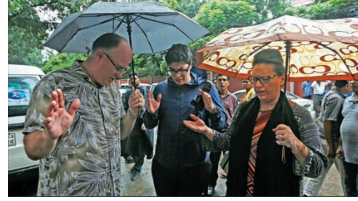
A US family residing in Bangladesh prays for their friends who were killed in the attack on the Holey Artisan Bakery and the O'Kitchen Restaurant, at a makeshift memorial near the attack site, in Dhaka, Bangladesh, on 5 July 2016.

The head of Bangladesh's counter terrorism police, Monirul