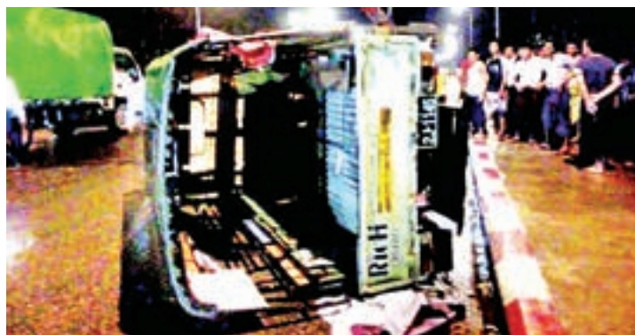
The car being seen overturned.

Police are still investigating the case in an effort to arrest the reckless driver who fled on the scene.— Soe Win