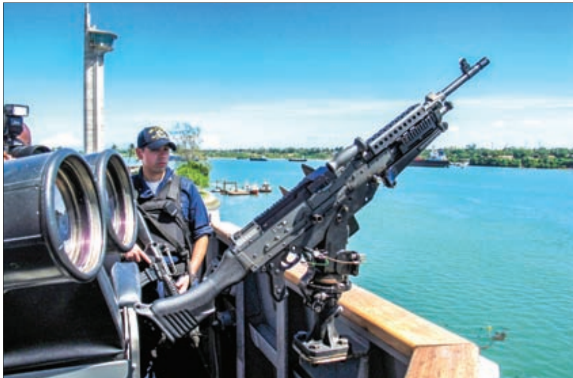
A machine gun is mounted on US Destroyer USS Momsen (DDG92) as it docks in the Indian Ocean in Mombasa, in 2008.

WASHINGTON/BEIJING — The United States should do nothing to harm China's sovereignty and security in the South China Sea, China's foreign minister told US Secretary of State John Kerry, ahead of a key court ruling on China's claims in the disputed waterway.