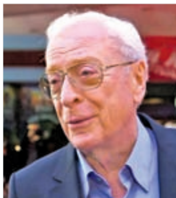
Veteran actor Michael Caine.

LONDON — Veteran actor Michael Caine rehearses every line of his scripts 1000 times.