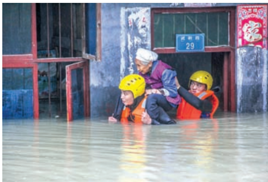
Rescuers save a resident from a flooded building in Chongqing, China. Flooding, an annual problem in China, has been exacerbated by urban sprawl and poor drainage infrastructure in many cities.

Xinhua said more than 1.9 million hectares (4.7 million acres) of cropland had been damaged and another 295,000 hectares had