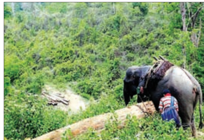
An elephant being made reading to pull the logs. PHOTO: 200

Bago Yoma is known to be rich in teak trees. Previously, 12 trees out of 100 were teak. However, now only around 8 teak trees grow per 100 due to illegal timber production over recent decades. —200