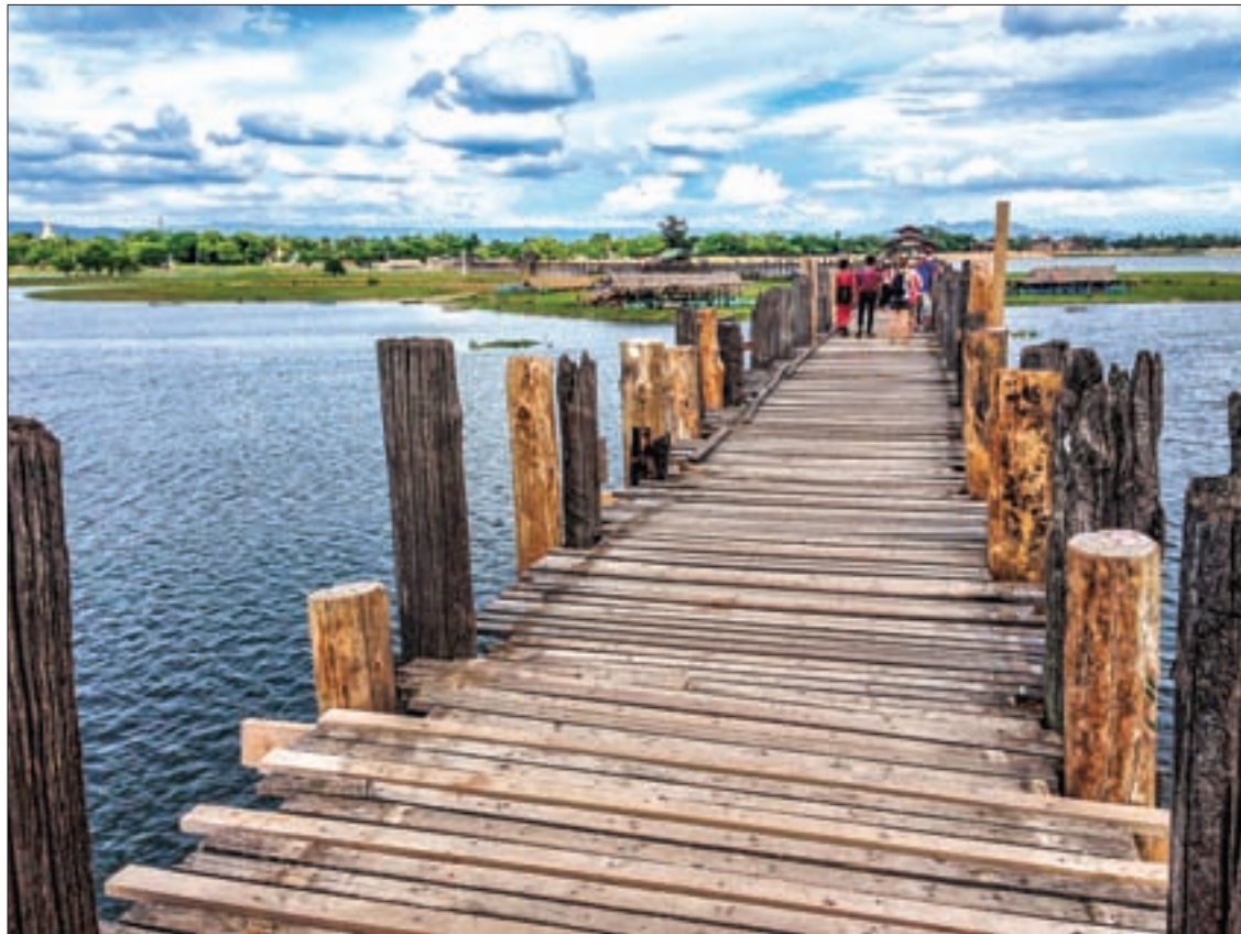
U Bein Bridge.