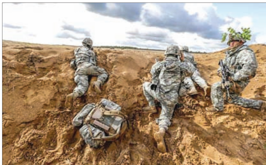
Paratroopers of the 173 rd Airborne Brigade of the US Army in Europe take part in military exercise 'Black Arrow' in Rukla on 14 May, 2014.

BRUSSELS — NATO leaders meet in Warsaw on Friday to cement a new deterrent against what they see as an emboldened Russia, returning to Cold War-style defence with Washington again taking the part of Europe's protector.