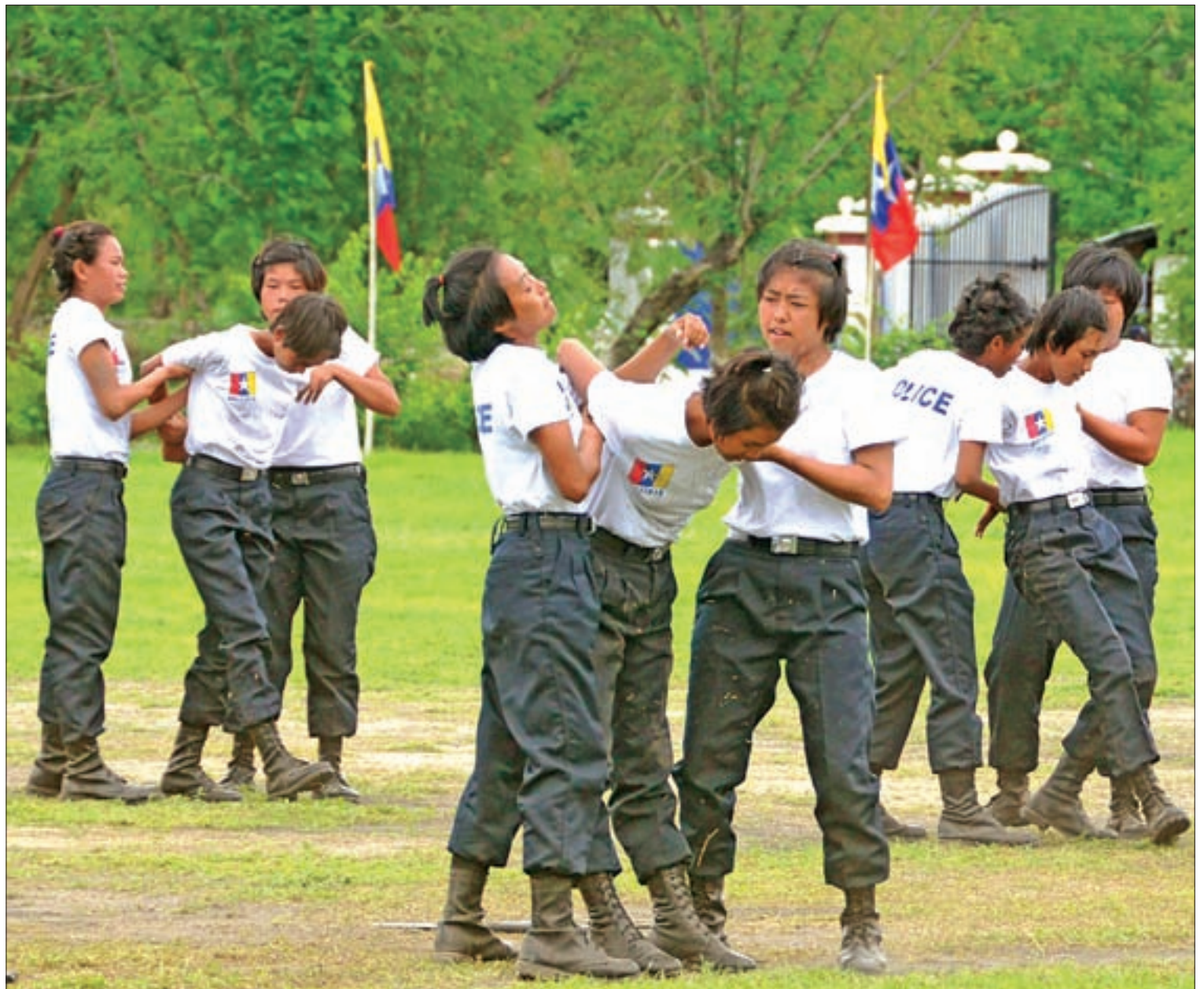
Policewomen are undergoing further training in mob control at Number 1 Police Training School, Yamethin.

The meeting was scheduled to last for three days, ending today, covering capacity building programmes to promote Myanmar's cooperation in the fight against terrorism both domestically and internationally.—MNA