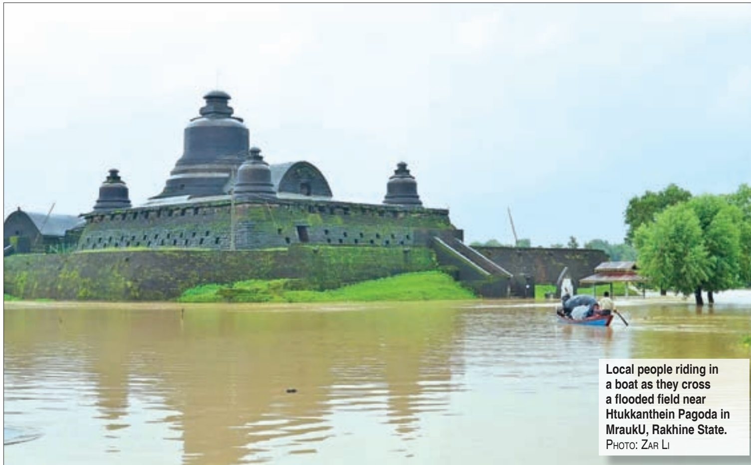
Local people riding in a boat as they cross a flooded field near Htukkanthein Pagoda in MraukU, Rakhine State.