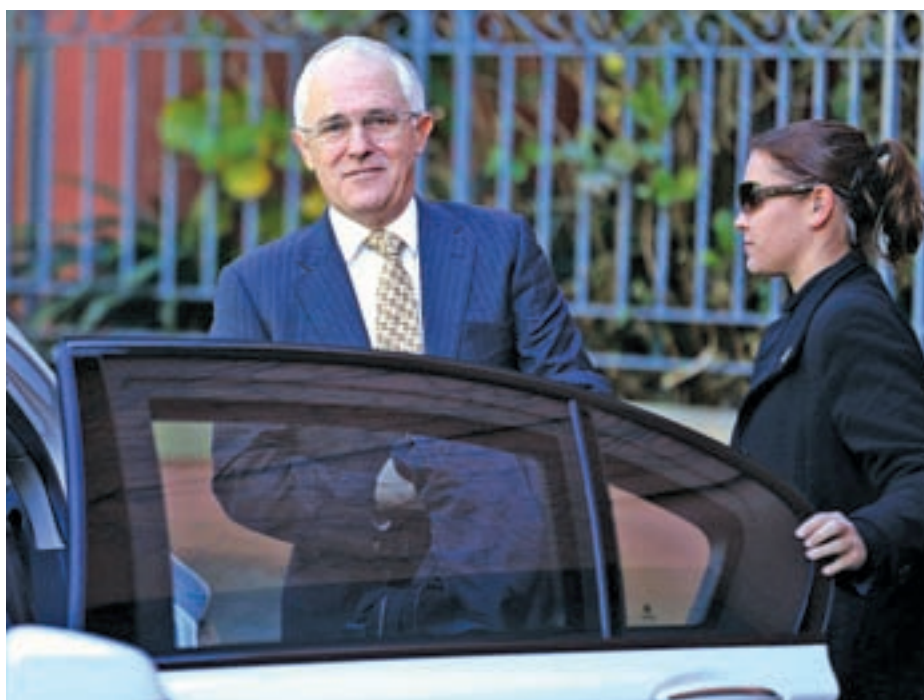
A security official assists Australian Prime Minister Malcolm Turnbull get into a car outside his home in Sydney, Australia, on 6 July 2016.

Turnbull, however, will realistically only scrape through with the slimmest of margins and faces an even more hos-