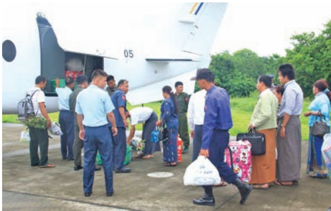
Passengers boarding a military aircraft.

FOR the convenience of government servants as well as local staff and families of Tatmadawmen who are assigned to Coco Island, Myanmar, the Tatmadaw has been arranging for the transport of passengers and goods with