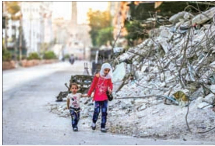
Children walk past the rubble of damaged buildings on the first day of the Muslim holiday of Eid al-Fitr, which marks the end of the holy month of Ramadan, in the rebel held Douma neighbourhood of Damascus, Syria, on 6 July 2016.

on the official Syrian opposition High Negotiations Committee (HNC).