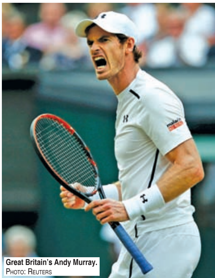
Great Britain's Andy Murray.

Those fears vanished in a high-quality opening set in which Murray was dragged into an epic 22-point tiebreak despite forging ahead with an early break of serve.—Reuters