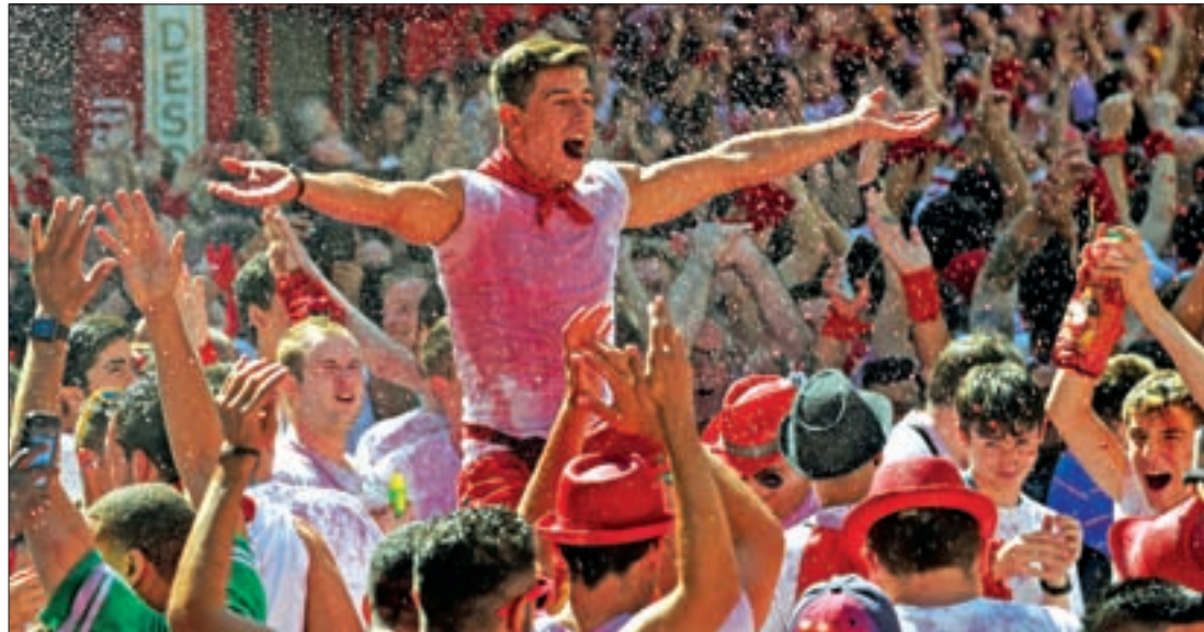
Revellers celebrate during the start of the San Fermin festival in Pamplona, Spain on 6 July 2016.