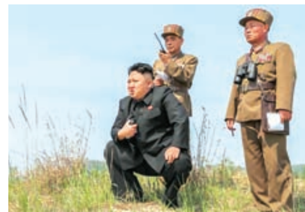
North Korean leader Kim Jong Un guides the multiple-rocket launching drill of women's sub-units under KPA Unit 851, in this undated photo released by North Korea's Korean Central News Agency (KCNA) in 2014.