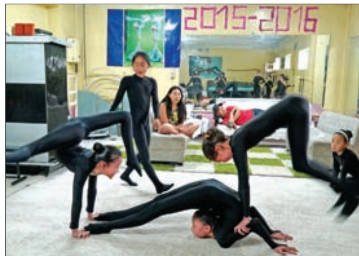
Young contortionists practice at a training school in Ulaanbaatar, Mongolia, on 4 July 2016.

"It's the Mongolian people's dream to introduce Mongolian national culture and art to the whole world, so that's why I want to be the best contortionist in the world," she said.—Reuters