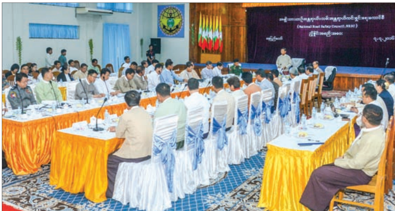
Vice President U Henry Van Thio addresses the work coordination meeting of the National Road Safety Council in Nay Pyi Taw.

He also emphasised the importance of wearing seatbelts while driving to reduce road deaths, calling for actions to tackle the issues of drink-driving and the use of mobile phones while driving.