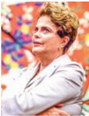
Suspended Brazilian President Dilma Rousseff.

Rousseff has said her budget manoeuvring was no different than under previous presidents. But critics have said Rousseff borrowed far more money from state banks than her predecessors to plug budget gaps and hide the real state of Brazil's economy. Rousseff's suspension in May had ample political support because her popularity had plunged amid Brazil's worst recession since the 1930s and public outrage over a string of corruption scandals involving her government. A recent poll showed interim President Temer is also highly unpopular. "What most hurts right now is the injustice,"