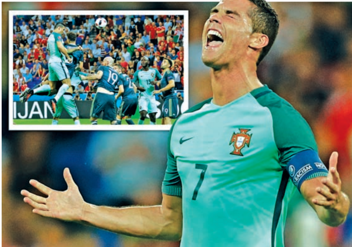
Portugal's Cristiano Ronaldo celebrates scoring their first goal during the EURO 2016 Semi Final at Stade de Lyon, Lyon, France, on 6 July.

"I have always said my dream was to win a trophy with Portugal. We are closer to doing it and I believe we will win," he told reporters after coming out on top in his battle with Real Madrid