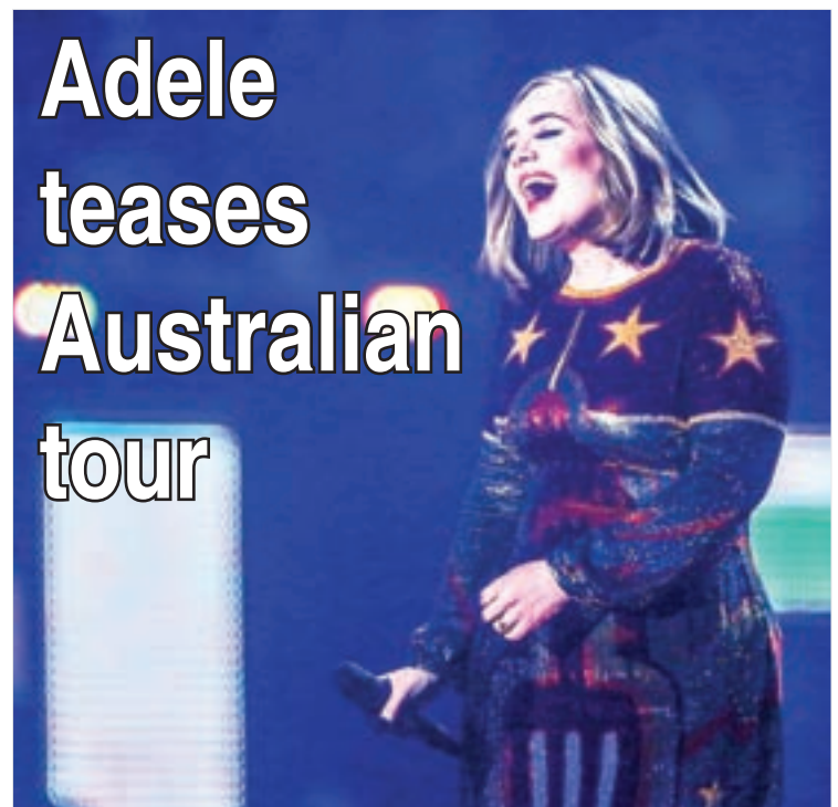
Adele.

"We never set out to write a love letter to California but while we were recording it we just kept finding ourselves referencing very specific California things," Hoppus told Reuters. "California has this endless energy and opportunity and hope and ambition but there's also a dark, twisted side underneath it and that's how the record feels.—Reuters