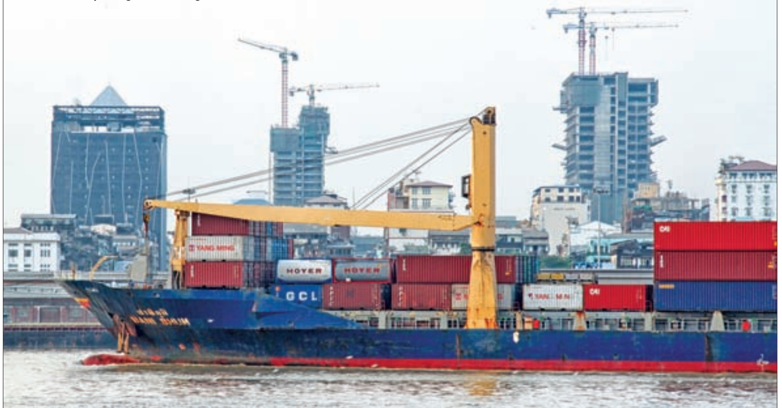
A container ship being seen in Yangon River.

The action comes after negotiation between the Myanma Port Authority, Customs Department and Myanmar Container Association.—200