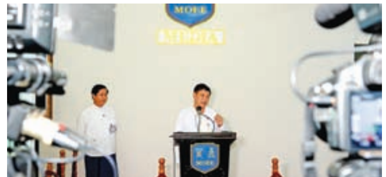
A representative of Ministry of Electricity and Energy talks to media at the press conference in Nay Pyi Taw.

THE Ministry of Electricity and Energy held a press briefing in Nay Pyi Taw yesterday in connection with the topic of fuel distribution and safety measures.