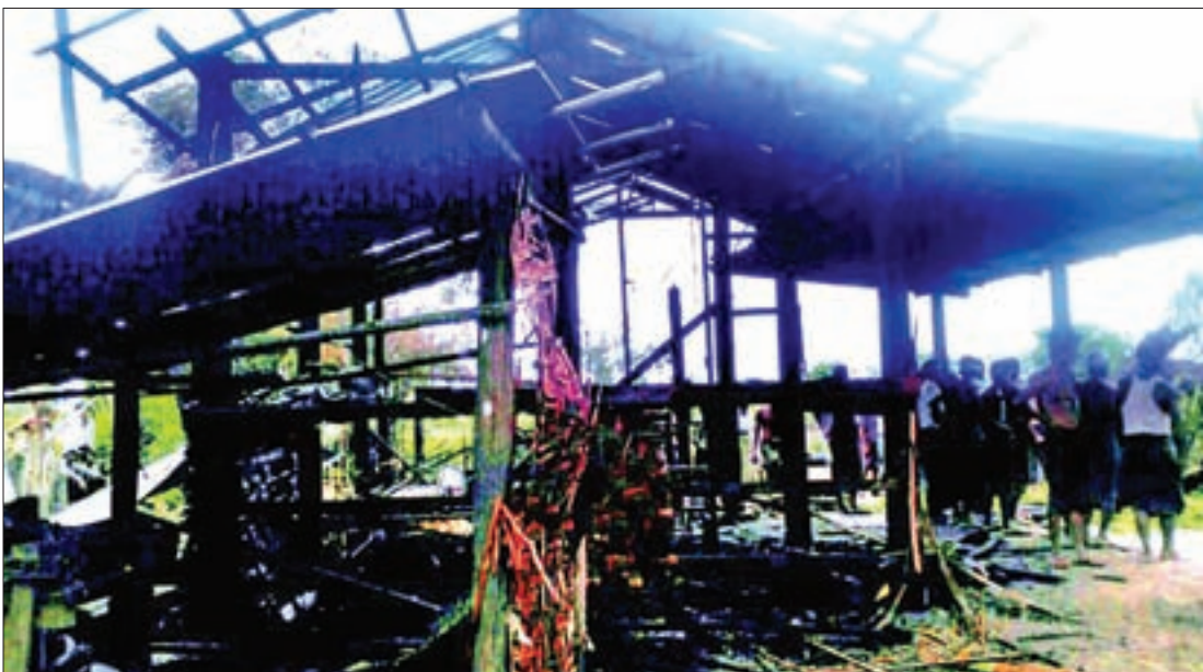
The scene of the outbreak of fire.

A HOUSE fire broke out in Hsin Swe Taung village, Yinmabin township, Sagaing region on 3 July, destroying one family home. It is reported that the fire