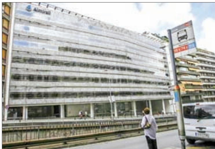
A woman waits for a bus outside Spanish pharmaceutical company Almirall's headquarters in central Barcelona, in 2008.