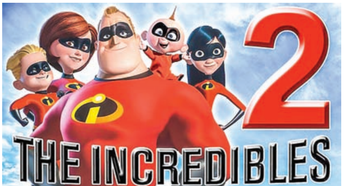
Pixar has announced that they are not planning any more sequels of "The Incredibles" after the second installment of the movie.