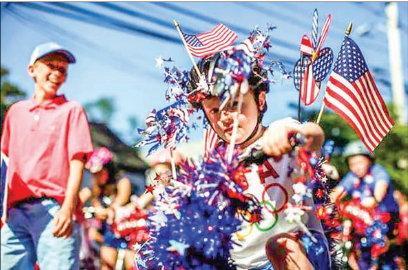
A boy wears decorations as he rides his bicycle through Barnstable Village, on Cape Cod during the annual Independence Day parade celebrations in Barnstable, Massachusetts, US, on 4 July 2016.

History was made in the traditional hotdog-eating contest at New York’s