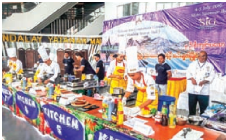
1 st Upper Myanmar International Level Cooking Competition in progress.

Participants from hotels and foodstuff businesses as well as organisations competed by cooking Myanmar, Chinese, European and Indian cuisines.— Thiha Ko Ko (Mandalay)