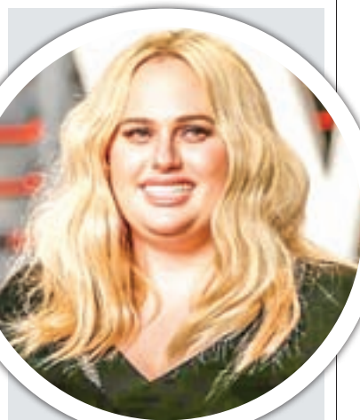
Actress Rebel Wilson.

they're like 'yeah Rebel's just like come up in 'Bridesmaids' or 'Pitch Perfect' ... and a lot of people think ... you are those characters because they've seen them a lot," she said.