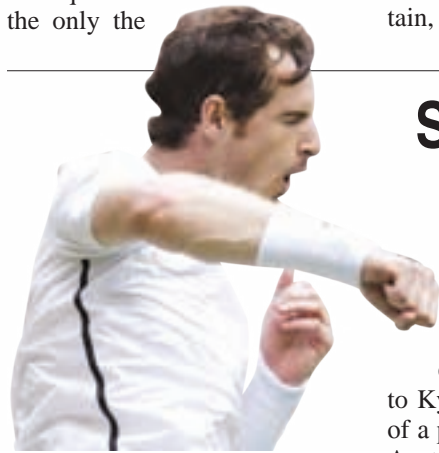
Great Britain’s Andy Murray celebrates winning his match against Australia’s Nick Kyrgios.

“Gareth is clearly a special player. For us he is special, not just because of his talent but what he represents when he plays for Wales. “He appreciates what he has around him and they appreciate they have a super talent. It’s a good blend.” —Reuters