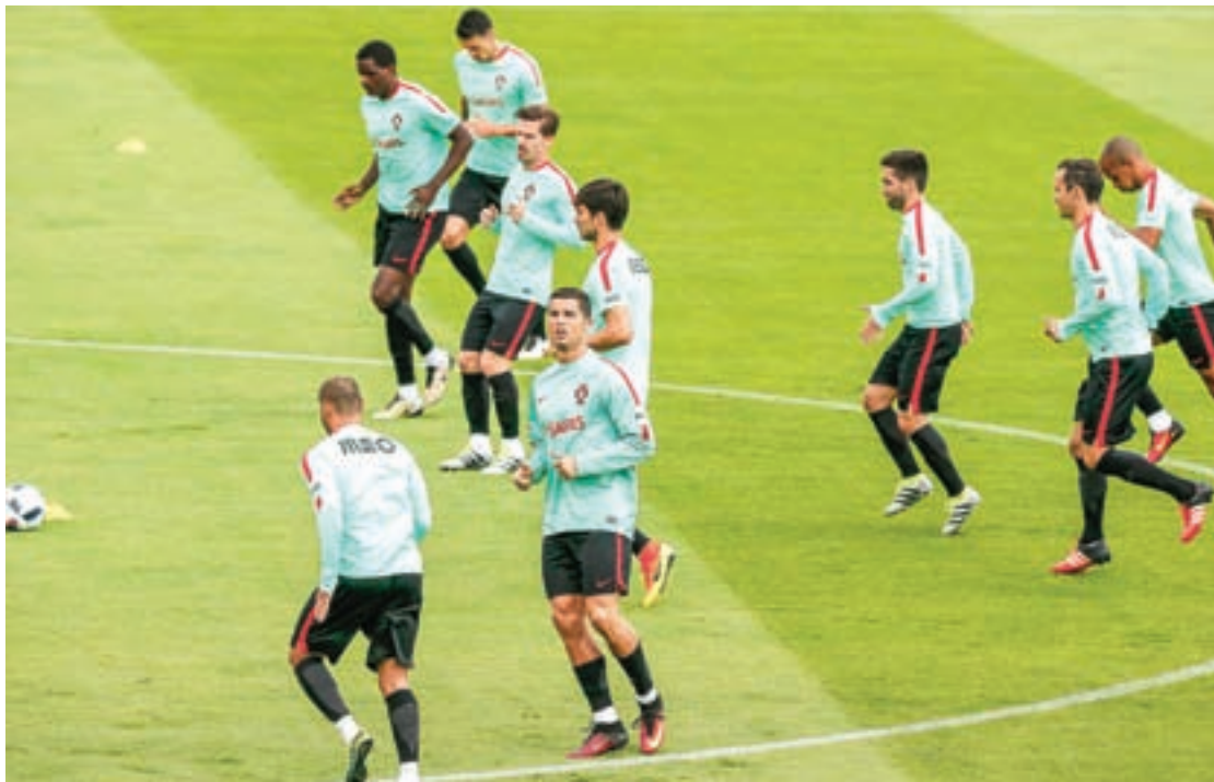
Portugal’s Cristiano Ronaldo and team mates attend the training in Marcoussis, France on 3 July.

“Cristiano has worked for the squad and it’s the only he