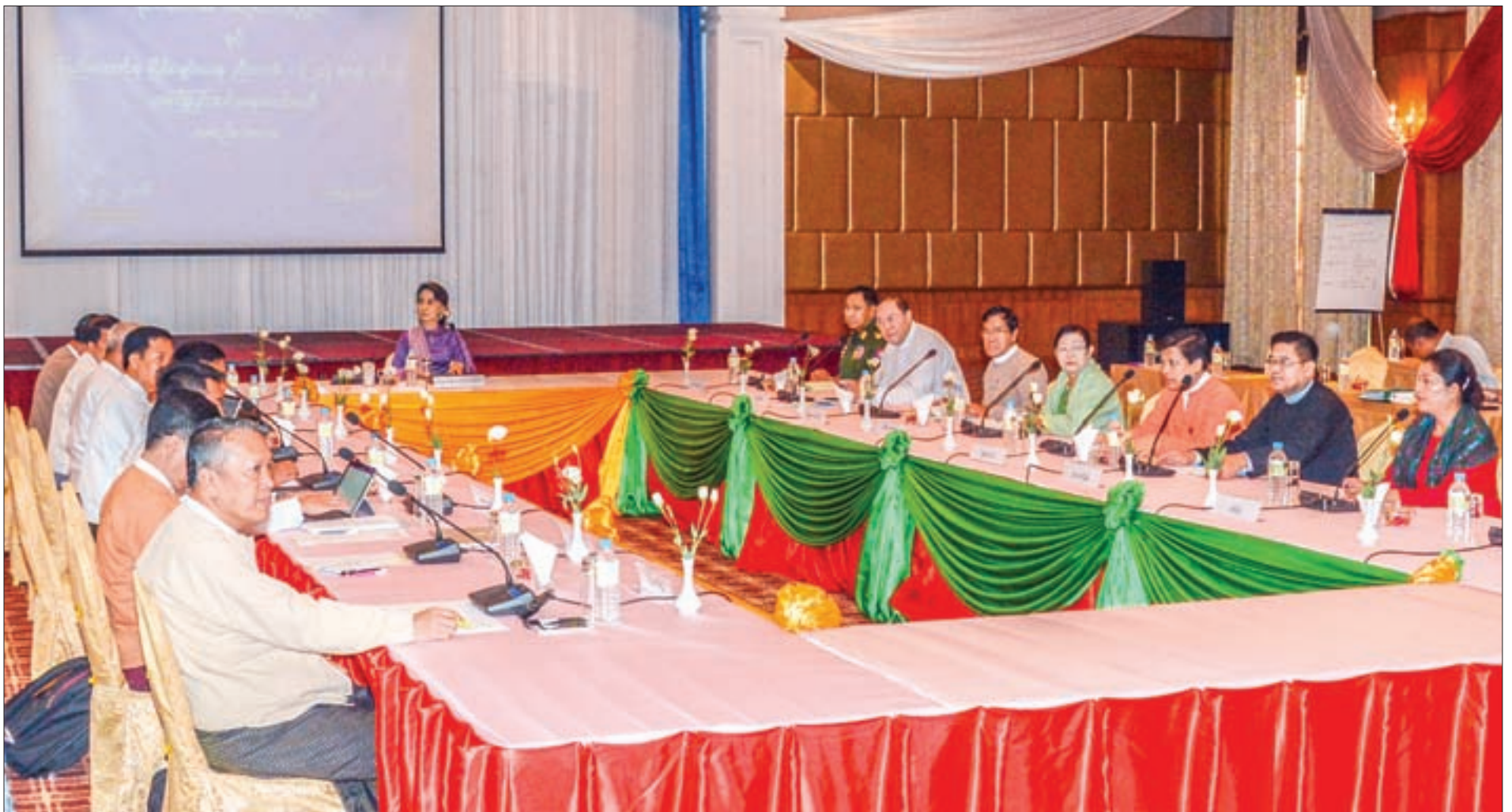
State Counsellor Daw Aung San Suu Kyi holds the Union Peace Conference — 21st Century Panglong Preparatory Committee meeting in Nay Pyi Taw.