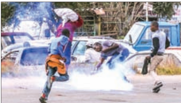
Residents of Epworth suburb flee as riot police fire teargas after a protest by taxi drivers turned violent in Harare, Zimbabwe, on 4 July 2016.

A Reuters witness said taxi operators teamed up with residents in Epworth township, south of central Harare, to attack police with stones. Police fired teargas, beat up protesters and broke down doors at some houses, saying they were looking for organisers of the protest.—Reuters