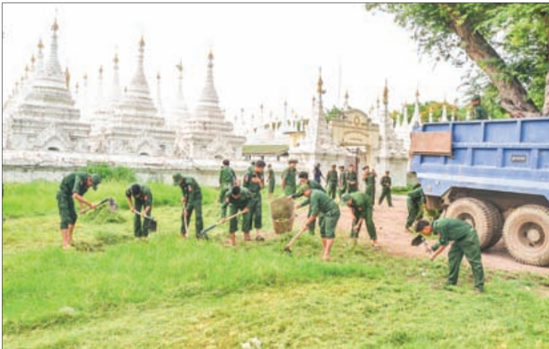
UTC students and faculty members cleaning the pagoda precinct in Mandalay.

UNIVERSITY Training Corps (UTC) students and faculty members contributed their precious time and energy over the weekend to pull away weeds and undergrowth slated for destruction and cosmeti-