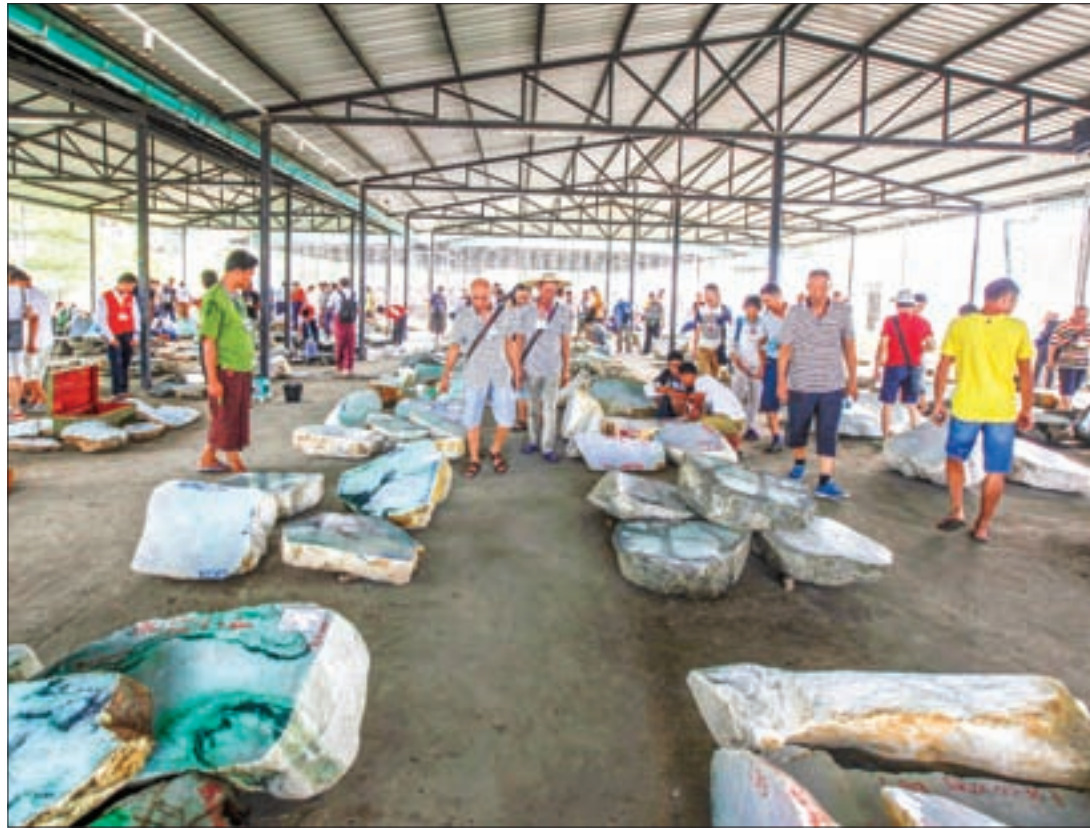
Merchants are seen during the 53rd Myanmar Gems Emporium in Nay Pyi Taw.

46 more lots of jades go on sale through a competitive bidding system today, the final day of the emporium.— Myanmar News Agency