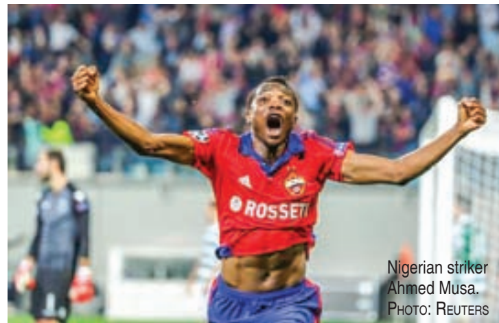
Nigerian striker Ahmed Musa.

Thereafter Kyrgios went walkabout, the Briton breaking him twice in a second set that flew by in 26 minutes. He broke once more in the third, closing out the contest with an ace on his third match point. The Australian, who described his performance after the first set as “pretty pathetic”, has now — in common with a multitude of Britons — hitched his wagon to the Murray camp.—Reuters