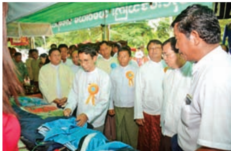
Union Minister Dr Aung Thu visits 94 th International Day of Cooperatives in Nay Pyi Taw.

During the International Co-operative Day celebration, outstanding cooperative syndicates were presented awards.— Myanmar News Agency