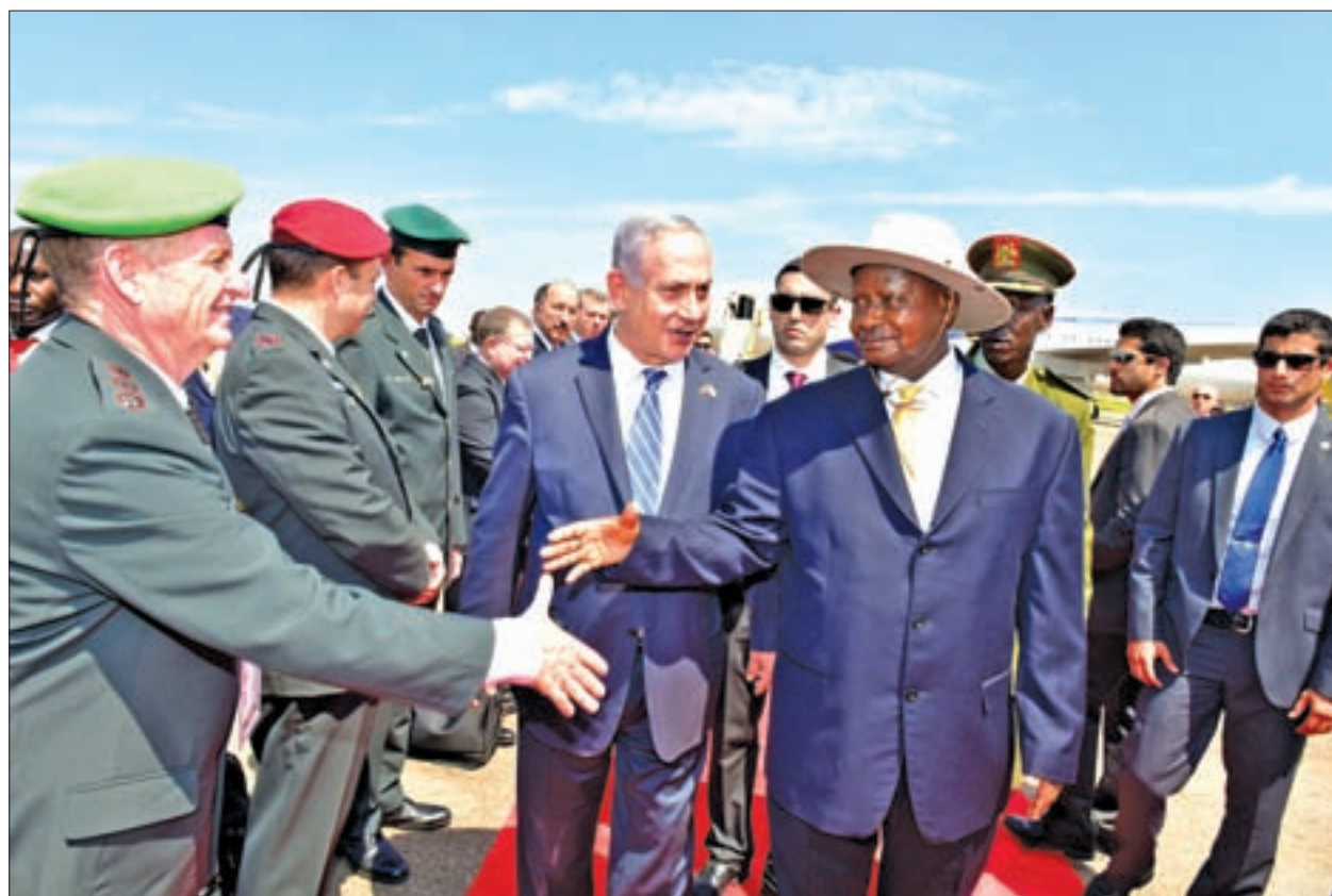
Israeli Prime Minister Benjamin Netanyahu (C) introduces members of his delegation to Uganda’s President Yoweri Museveni after arriving to commemorate the 40th anniversary of Operation Entebbe at the Entebbe airport in Uganda, on 4 July, 2016.

elder brother was the only Israeli soldier killed in the 1976 raid. The hijackers, three hostages and dozens of Ugandan soldiers died. More than 100 mostly Israeli hostages were