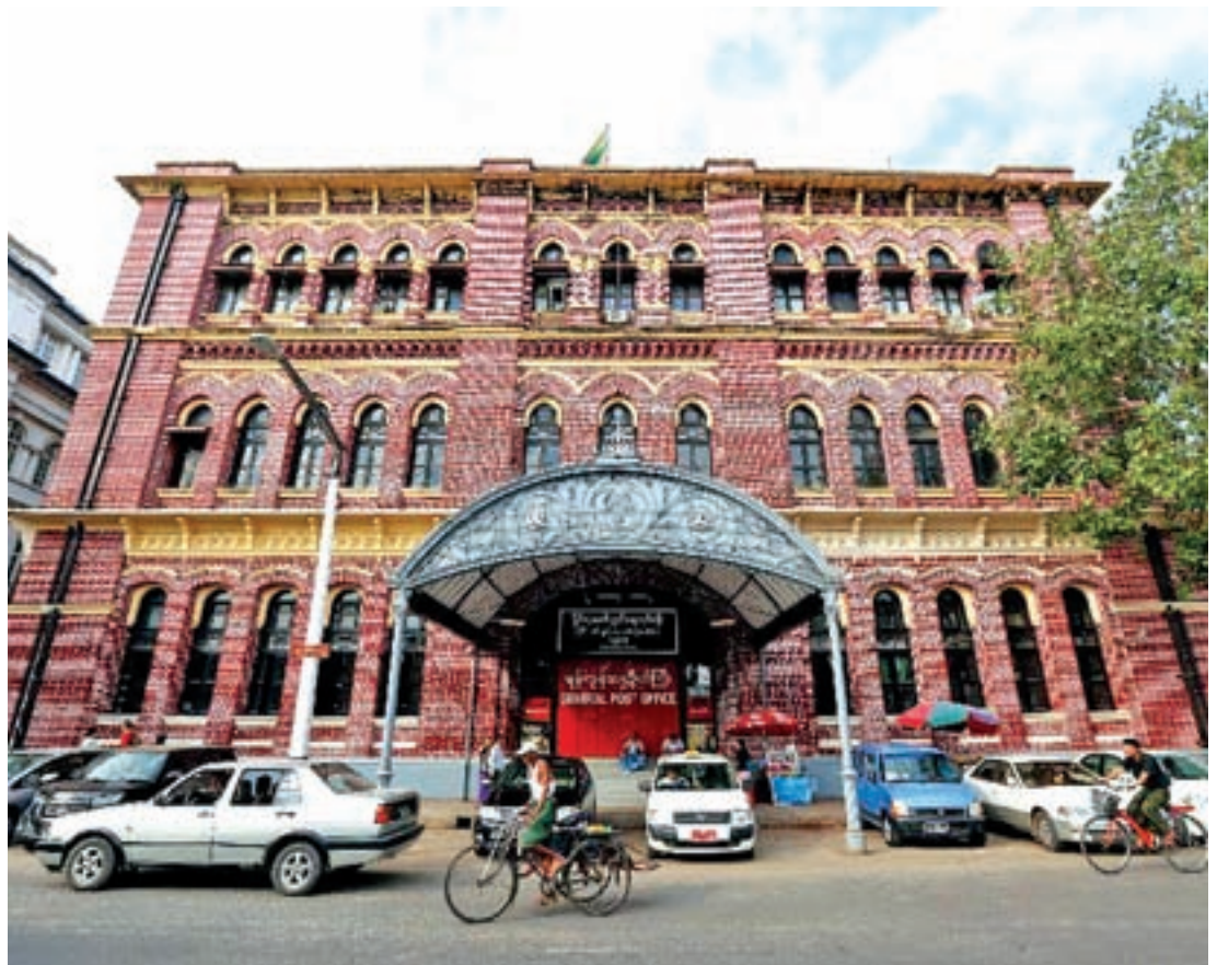
Yangon Central Post Office.

Admission is free for the final match between Myanmar (A) and Thailand and the third-place playoff between Myanmar (B) and Indonesia is being held today.— Myanmar News Agency