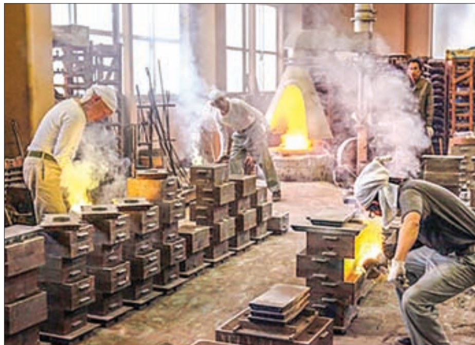
Photo taken on 18 March, 2016 in Takaoka, Toyama Prefecture, shows craftsmen working on samurai warrior helmets at a casting company.