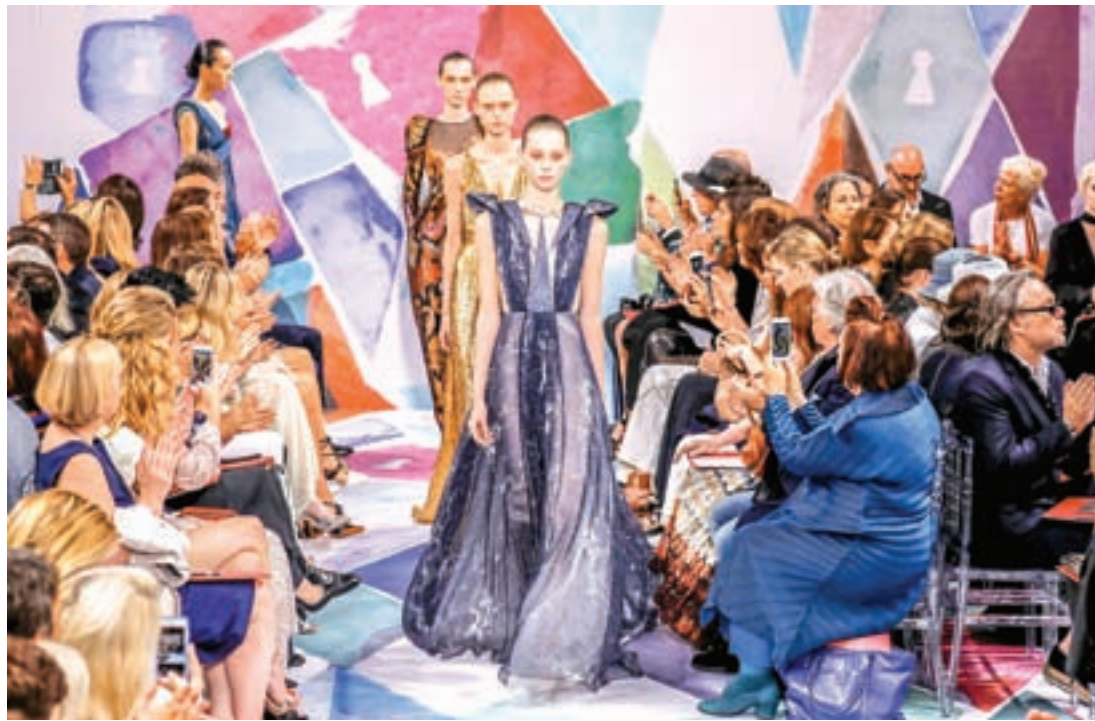
Models present creations by French designer Bertrand Guyon as part of his Haute Couture Fall Winter 2016/2017 fashion show for Schiaparelli in Paris, France, on 4 July.

"Monsieur Dior himself adored the juxtaposition of the two: 'White,' he said, 'is simple, pure and goes with everything,' while declaring, 'I could write a whole book about black,'" the brand said in show notes of its founding de-