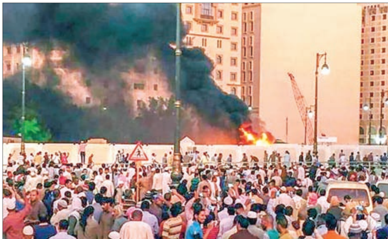
Muslim worshippers gather after a suicide bomber detonated a device near the security headquarters of the Prophet's Mosque in Medina, Saudi Arabia, on 4 July 2016.