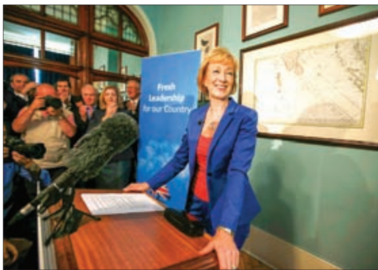
Andrea Leadsom, a candidate to succeed David Cameron as British prime minister, smiles during a news conference in central London, Britain, on 4 July.

However, May supported Britain staying in the EU and many Conservatives have argued the next prime minister who will need to negotiate Britain's exit from the bloc after 43 years membership needed to be someone