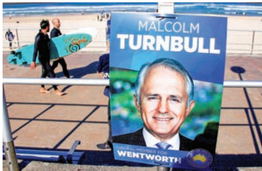
Surfers walk past an election poster promoting Australian Prime Minister Malcolm Turnbull outside a voting station located in the South Bondi Lifesaving Club, at Sydney's Bondi Beach, Australia, on 2 July.

SYDNEY — Embattled Australian Prime Minister Malcolm Turnbull defended his performance after widespread calls for his resignation and said on Tuesday he was confident of retaining office after vote counting resumed in a cliffhanger election.