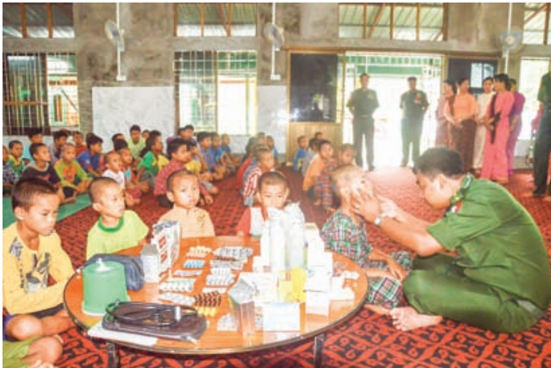
Monks and orphans receive healthcare services in Southern Command.