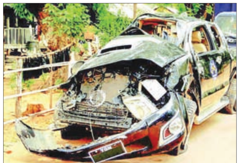
Toyota Hilux being seen damaged.

Passenger Myo Khine was killed in the accident while the driver and the other passenger were seriously injured. The injured are undergoing medical treatment at Pakokku general hospital. The police have filed charges against the driver.—District IPRD