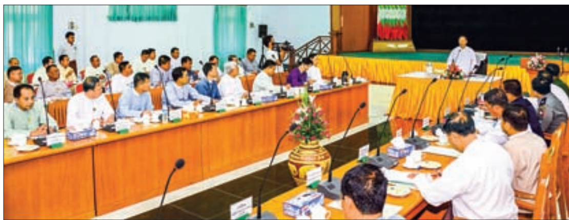
Vice President U Myint Swe chairs the leading committee for the holding of a Waso robe offering ceremony.

THE LEADING committee for the holding of Waso robe offering ceremony held a coordination meeting in Nay Pyi Taw yesterday.