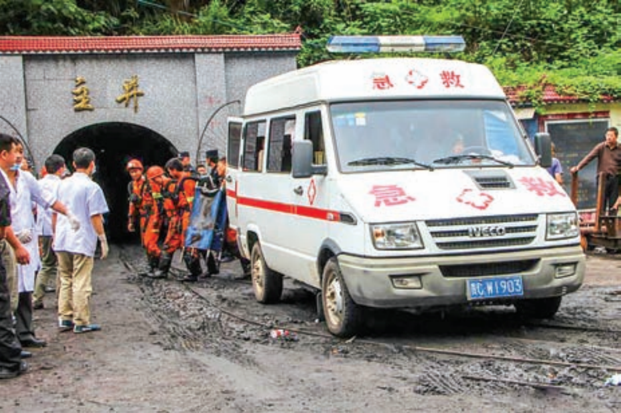
An ambulance is seen at the site of a coal mine flooding in Zheng’an County, southwest China’s Guizhou Province, on 29 June, 2016. Five people died and two were missing after a coal mine in Guizhou Province was flooded early Wednesday, local authorities said.

GUIYANG — Five people died and two were missing after a coal mine in southwest China’s Guizhou Province was flooded early Wednesday, local authorities said. The accident occurred at about 1am when water from a nearby abandoned mine shaft flooded the Tiedingyan Coal Mine in Zheng’an County, the county publicity department said in a press release. The county has been lashed by heavy rains during the past few days, it added. Eight of 15 safety inspectors who were then underground checking for potential safety hazards during the raining season managed to escape. Five were killed and two were missing. The rescue operation is under way.—Xinhua