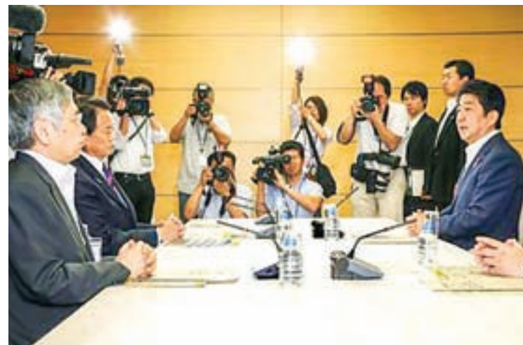
Japanese Prime Minister Shinzo Abe (far R), Bank of Japan Governor Haruhiko Kuroda (far L), and Finance Minister Taro Aso (2 nd from L) attend a meeting in Tokyo on 29 June 2016. In the meeting to discuss countermeasures following Britain’s decision to leave the European Union, Abe said the government will “mobilise all policy measures” to limit any adverse impact on the domestic economy. PHOTO: KYODO NEWS

BOJ chief Kuroda separately told reporters that there is “no problem” with procurement of foreign currency by Japanese banks. “We have a system to supply (funds) whenever needed,” Kuroda said, referring to the bank’s dollar fund supplying operation conducted Tuesday.— Kyodo News