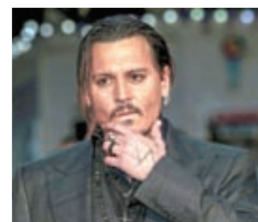
Actor Johnny Depp.