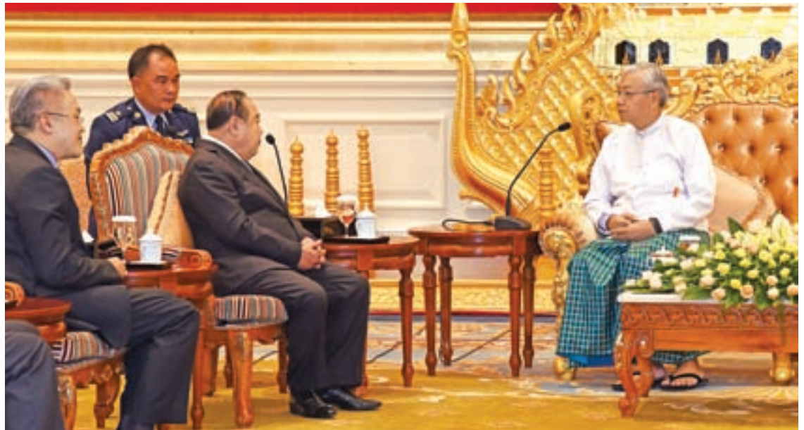
President U Htin Kyaw receives General Prawit Wongsuwon, Deputy Prime Minister and Minister of Defence of Thailand, at the Presidential Palace in Nay Pyi Taw.

PRESIDENT U Htin Kyaw stressed the need of respect for and adherence to laws, rules and regulations by each other's citizens working in each country during a meeting with General Prawit Wongsuwon, Deputy Prime Minister and Minister of Defence of Thailand at the Presidential Palace in Nay Pyi Taw yesterday.