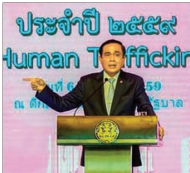
Thailand's Prime Minister Prayuth Chan-ocha speaks during the National Anti-Trafficking in Persons Day at the Government House in Bangkok, Thailand, on 6 June, 2016.

WASHINGTON/BANGKOK — The United States has decided to remove Thailand from its list of worst human trafficking offenders, officials said, a move that could help smooth relations with Bangkok's military-run government.