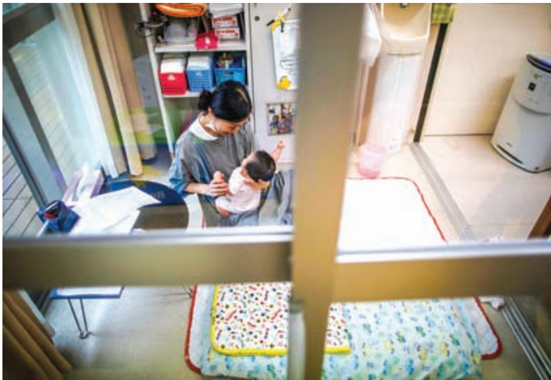
A baby is cared for by a nurse at Futaba Baby Home in Tokyo, Japan, on 21 June 2016.

TOKYO — A baby lies in a metal-bar cot drinking from a bottle perched on his pillow in a Tokyo orphanage. There's no one to hold and feed him or offer words of comfort.