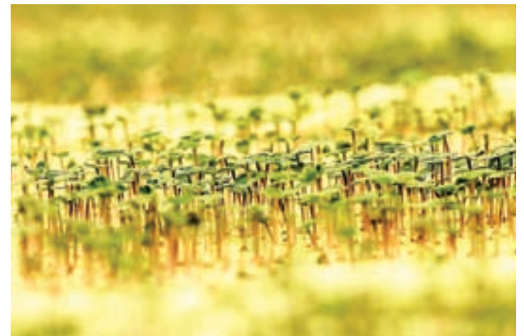
Watercress seedlings grow on AeroCloth, a growing material, in a vertical farming bed beneath light emitting diode (or "LED") lamps and using a patented growing algorithm of controlled light, nutrients and temperatures for growing a variety of baby greens at an AeroFarms Inc. indoor vertical farming facility in a former indoor paintball arena in Newark, New Jersey, on 24 June 2016.

Oshima declined to say how much the Newark operation produces, but said the firm hopes to develop 25 more farms, in the United States and abroad, over the next five years. —Reuters