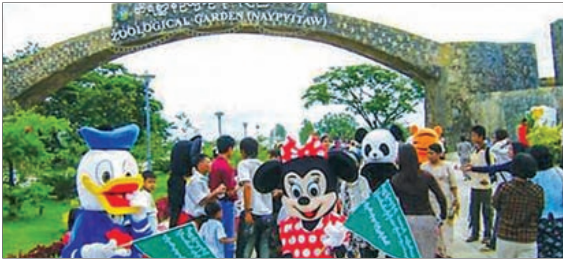
Zoological Garden (Nay Pyi Taw). PHOTO:200

THE Nay Pyi Taw Zoological Garden has announced that it will keep seals from Uruguay and that there will be 3-D drawings of the animals in five places within the Yangon Zoological Garden to attract more visitors to Nay Pyi Taw, according to U Tin Mon Hsan, administrator of Yangon Zoological Garden.