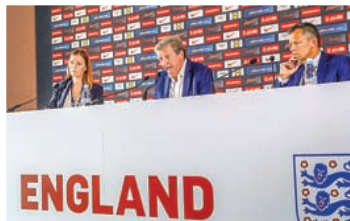
England head coach Roy Hodgson and FA chief executive Martin Glenn during the press conference during EURO 2016 at Auberge du Jeu de Paume, Chantilly, France on 28 June 2016.

"There was no indication that they weren't behind us, that they weren't behind the game plans and trying hard to execute," said a visibly tense Hodgson before an Football Associ-