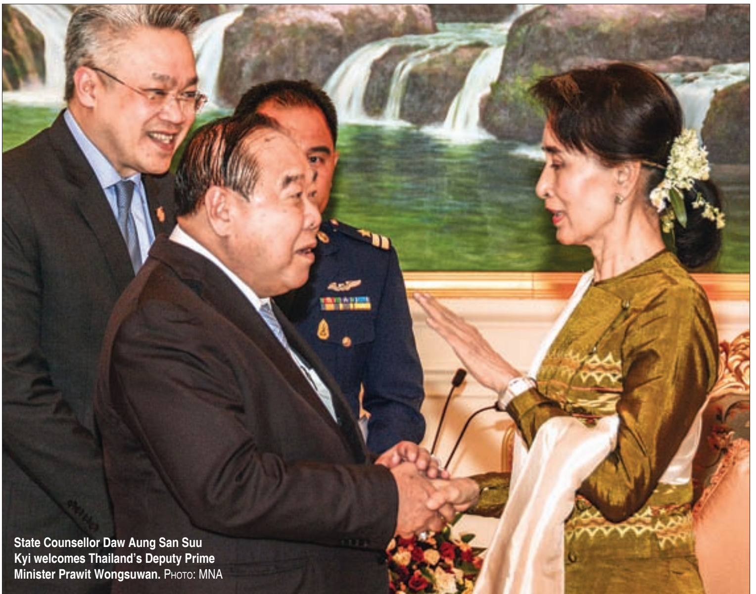
State Counsellor Daw Aung San Suu Kyi welcomes Thailand's Deputy Prime Minister Prawit Wongsuwan.

The State Counsellor and the Thai deputy prime minister discussed matters relating to promoting the amity between the two peoples to brotherly ties, earliest holding of joint border committee meetings in Myanmar to be able to draw demarcation lines, protection of Myanmar workers according to the law and settlement of disputes and remedy of grievances, acceleration of Dawei special Economic Zone construction activities for mutual benefits, exchange of training programmes for the two police forces and sending of a Myanmar government delegation to scrutinize citizenship in order that those 196 Myanmar migrants wishing to return to Myanmar can be called back and resettling them.— Myanmar News Agency