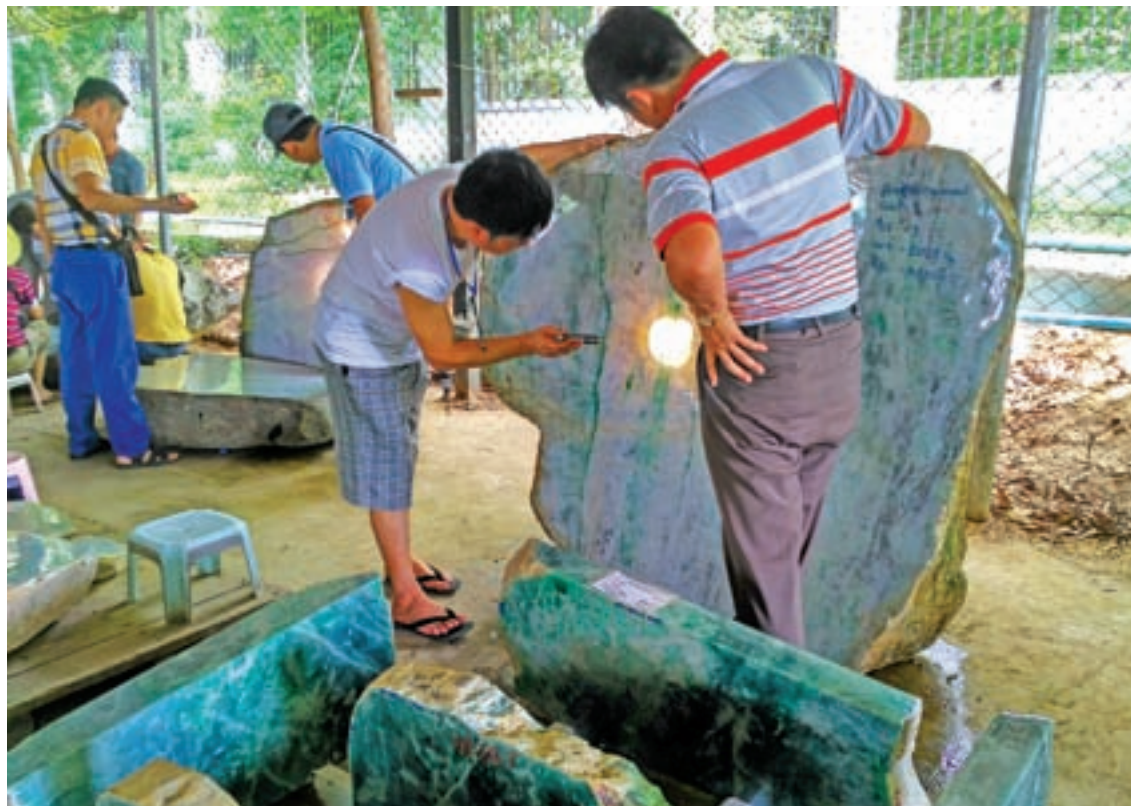
Merchants appraise jade stones at the 53 rd Myanmar Gems Emporium in Nay Pyi Taw.

Each 1000 lots of jade will go on sale to buyers daily till 3 July and sales of lots of jade with reserve price of 200,001 Euros per item are set for sale between 4 and 6 July.— Myanmar News Agency