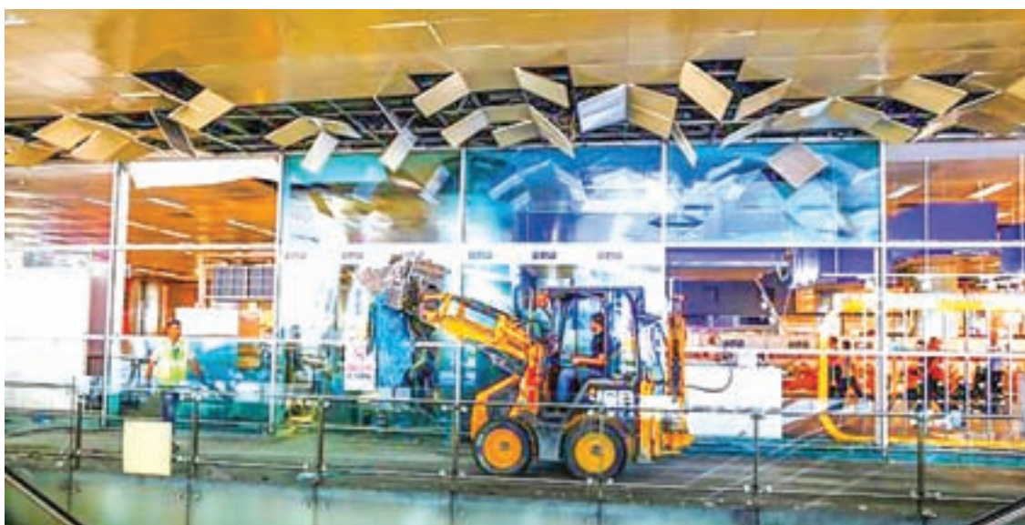
Workers clear debris from yesterday's blasts at Turkey's largest airport, Istanbul Ataturk, Turkey, on 29 June 2016.

The attack bore similarities to a suicide bombing by Islamic State militants at Brussels airport in March that killed 16 people. A coordinated attack also targeted