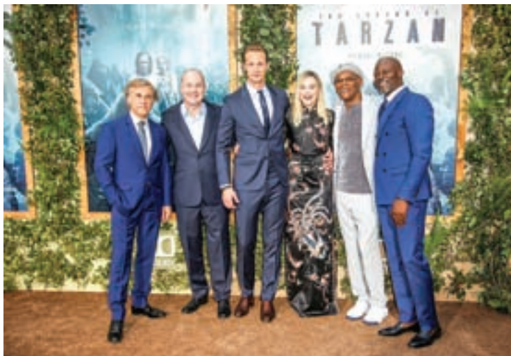
Director David Yates (2 nd L) poses with (L-R) cast members Christoph Waltz, Alexander Skarsgard, Margot Robbie, Samuel L. Jackson and Djimon Hounsou at the premiere of the movie “The Legend of Tarzan” in Hollywood, California, on 27 June 2016.

The film follows the story of Tarzan’s life in England after he leaves the jungle, but he is lured back to the Congo unwittingly by the villainous Leon Rom (Christoph Waltz) and accompanied