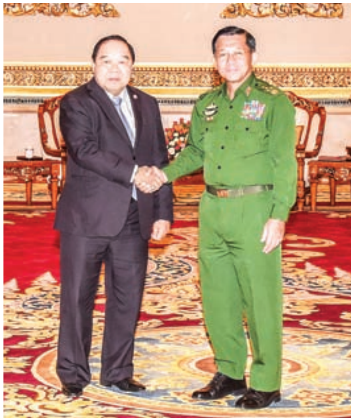
Senior General Min Aung Hlaing greeting Thailand's Deputy Prime Minister and Defence Minister General Prawit Wongsuwan.

Union Defence Minister Lt-Gen Sein Win met his Thai counterpart at his office on the same day to discuss border issues, defence cooperation and training, and internally displaced persons. — Myanmar News Agency