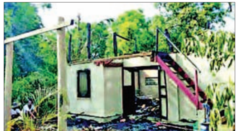
The house seen damaged by the fire.

living room of one U Thein Lwin. The fire quickly got out of control and spread to two other rooms. It took two fire engines to put out the blaze with the assistance of neighbours. Local police have filed charges against U Thein Lwin.— Tin Tin Htway (Sintgaing)