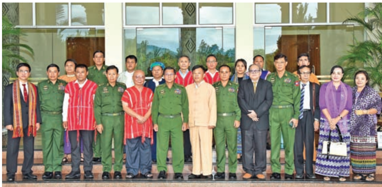
Senior General Min Aung Hlaing and Peace Process Steering Team pose for documentary photo.