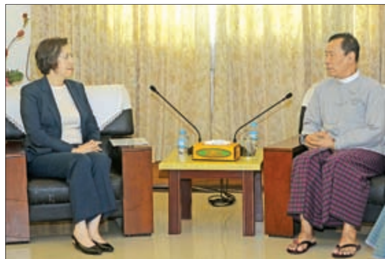
Ms Yanghee Lee holds talks with Thura U Shwe Mann, chairman of the Pyidaungsu Hluttaw Legal Affairs and Special Cases Assessment Commission.