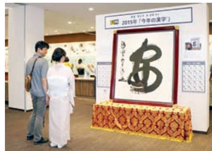
Photo taken in the western Japan city of Kyoto shows visitors looking at a calligraphy of the kanji character “an,” meaning safety or peace, which was chosen as a symbolic character of the year 2015, at the Japan Kanji Museum & Library on 29 June 2016, the day of its opening. The museum, launched by the Japan Kanji Aptitude Testing Foundation, allows visitors to deepen their knowledge about the shape, sound and meaning of each Chinese character through interactive exhibitions.