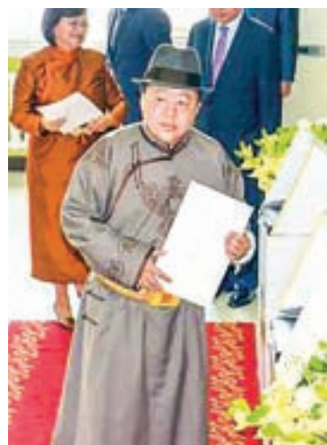
Mongolian President Tsakhiagiin Elbegdorj casts his ballot at a polling station in Ulan Bator on 29 June, 2016, in the country’s general election.

ULAN BATOR — Mongolians headed to the polls on Wednesday to choose new parliamentarians amid a prolonged economic slump, with some observers predicting that the Democratic Party could lose its majority in the unicameral legislature ahead of next year’s presidential election.