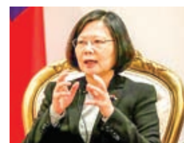
Taiwan's President Tsai Ing-wen speaks during an interview in Luque, Paraguay, 28 June 2016.

But China has insisted she recognise a pact called the "1992 consensus" between its Communists and Taiwan's then-ruling Nationalists, by which both agreed there is only one China, with each having its own interpretation of what that means. On Saturday, China said