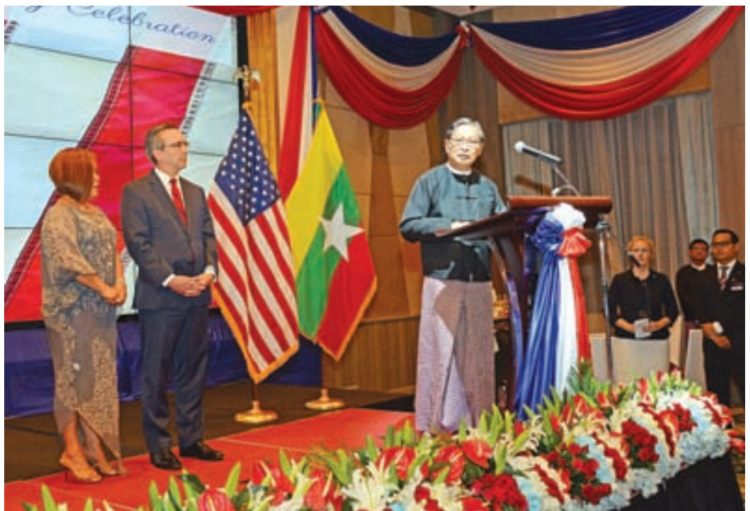
U Kyaw Tint Swe, Union Minister for the State Counsellor's Office, delivers an address at a ceremony to mark the 240th Anniversary of the Independence of the United States of America held at Hilton Hotel in Nay Pyi Taw on 29 June, 2016.