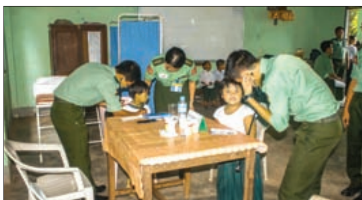
Tatmadaw medical team provide health care to students.

The students were subjected to tests for eye diseases, dental diseases, ear and nose and throat diseases and an educational talk. —Office of the Commander-in-Chief of Defence Services