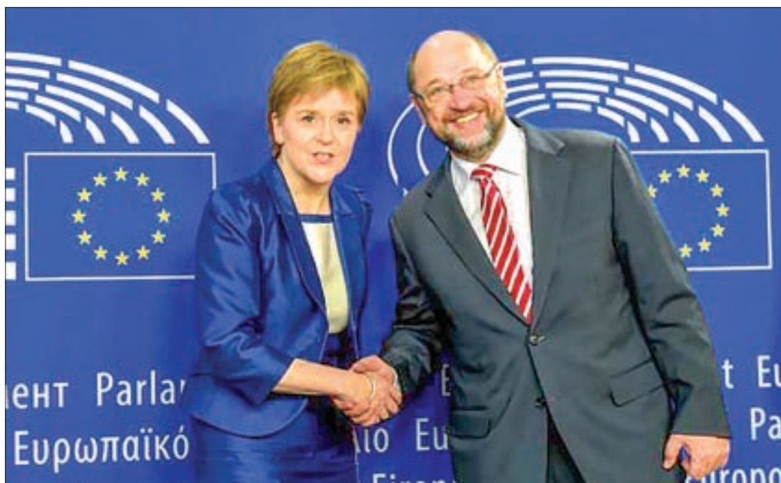
Scotland's First Minister Nicola Sturgeon is welcomed by European Parliament President Martin Schulz ahead of a meeting at the EP in Brussels, Belgium, on 29 June, 2016.

The Scottish Nationalist premier was to meet European Parliament president Martin Schulz first in Brussels to discuss the way