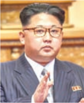
North Korean leader Kim Jong Un. The country is scheduled to convene its first parliamentary session of the year on 29 June, 2016, with attention fixed on whether Kim’s regime will unveil another major overhaul of its opaque power structure.

BEIJING — North Korea was scheduled Wednesday to convene its first parliamentary session of this year, with attention fixed on whether leader Kim Jong Un’s regime will unveil another major overhaul in its opaque power structure. Earlier this month, North Korea’s state media reported the date for the session of the Supreme People’s Assembly, without saying what will be on the agenda or providing other details. Some North Korea watchers believe that one of the titles of North Korean leader Kim Jong Un — that of the first chairman of the National Defence Commission — could be altered to help elevate his status. They say that the “first” could be dropped. The assembly normally meets once a year in April to rubber-stamp budgetary and personnel matters decided by the ruling Workers’ Party of Korea. This year, it did not take place as usual, apparently because the ruling party held its first congress in 36 years in May. At the congress, Kim’s