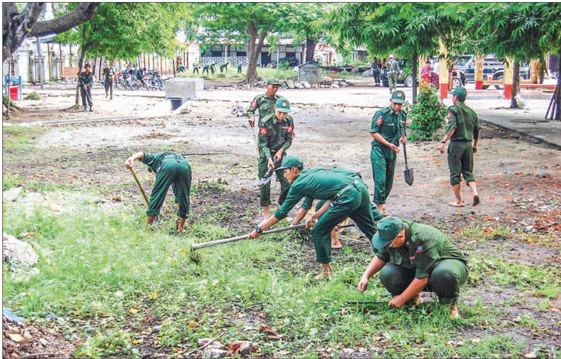
Teachers and students belonging to UTC crops seen carrying out sanitation work.