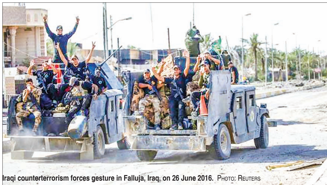
Iraqi counterterrorism forces gesture in Falluja, Iraq, on 26 June 2016.

Saidi said radio intercepts suggested the militants were run-