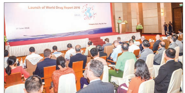
A ceremony to launch World Drug Report 2016 is held in Nay Pyi Taw.

Myanmar's previous governments have held drug fueled bonfires as a sign to the international community of its dedication to preventing the growth, production and distribution of illicit substances in its borders, after it was suspected by foreign governments that the country supported the production under previous governments.— GNLM