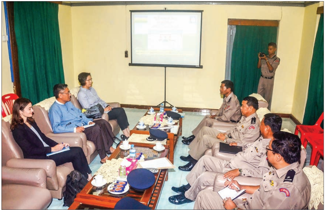
Ms Yanghee Lee holds talks with officials of Insein Correctional Department in Yangon.