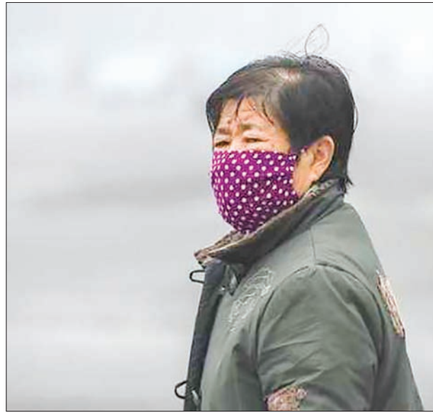
A woman wearing a mask stands by the side of a street amid heavy smog in Tianjin, China, in 2015.

gas emissions should continue to fall in industrialised countries and recent signs of decline in China should continue, but emissions are set to rise in India, southeast Asia and Africa as energy demand growth dwarfs efforts to improve air quality.