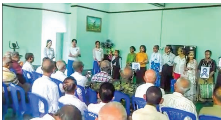
World Elder Abuse Awareness Day in progress.

I must admit my ignorance about the existence of such a day. Though I'm in my eighties now, I have never experienced or thought there are such abuses committed against elderly persons. Most of us have heard of the child abuses and exploitations quite often, as such activities or crimes are being made aware extensively on the media—on the broadcast as well as in the print media. After watching those video clips, my curiosity to learn more