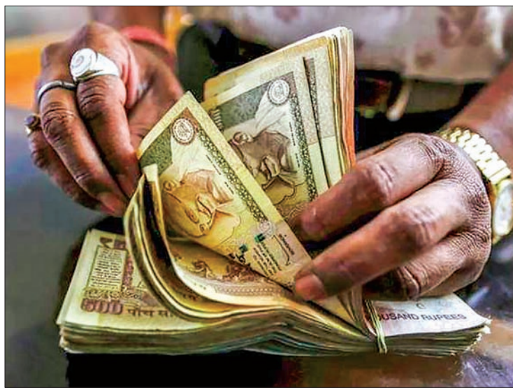
A money lender counts Indian rupee currency notes at his shop in Ahmedabad, India, in 2015.

MUMBAI — India's decision to relax foreign direct investment in sectors including defence, aviation, and retail is a positive development for the country's sovereign ratings, said Moody's Investors Service on Monday.