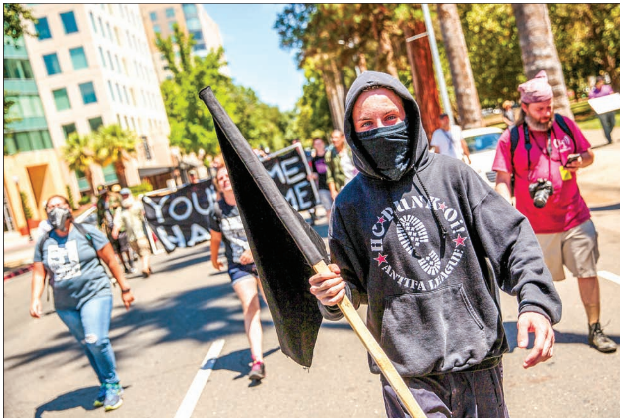
Anti-fascist counter-protestors parade through Sacramento after multiple people were stabbed during a clash between neo-Nazis holding a permitted rally and counter-protestors on Sunday at the state capitol in Sacramento, California, United States, on 26 June 2016.

“With the eyes of the world’s media on both Philadelphia and Cleveland, no doubt there will be significant protests,” said