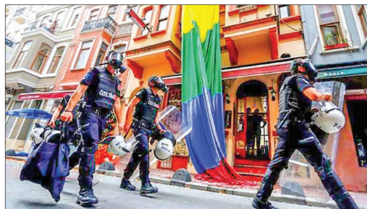
Riot police, with a rainbow flag in the background, chase LGBT rights activists as they try to gather for a pride parade, which was banned by the governorship, in Istanbul, Turkey, on 26 June.

Volker Beck, a member of the German Bundestag and a veteran gay rights activist, was among those briefly detained. Two other German citizens were also detained. "They did nothing wrong. They were put into a police car," he told Reuters as police officers once again tried to force him into a taxi telling him he should hold his news conference in his own country.