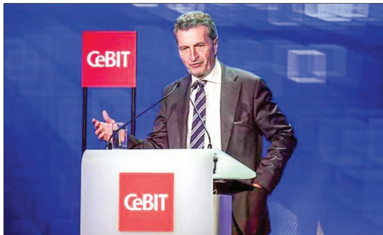
Guenther Oettinger, European Commissioner for Digital Economy and Society, speaks during the welcome night at the world's biggest computer and software fair CeBIT in Hanover, Germany, on 14 March, 2016.

Oettinger said he doubted that Britain's decision to leave the EU would be reversed. He also urged the remaining EU countries to focus on strengthening the EU and working on real problems, such as the migration crisis, instead of debating contractual changes. Germany should "lead as part of a European team", Oettinger said.—Reuters