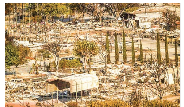
Burned residences line a neighborhood following the Erskine Fire in South Lake, California, US, on 26 June 2016.