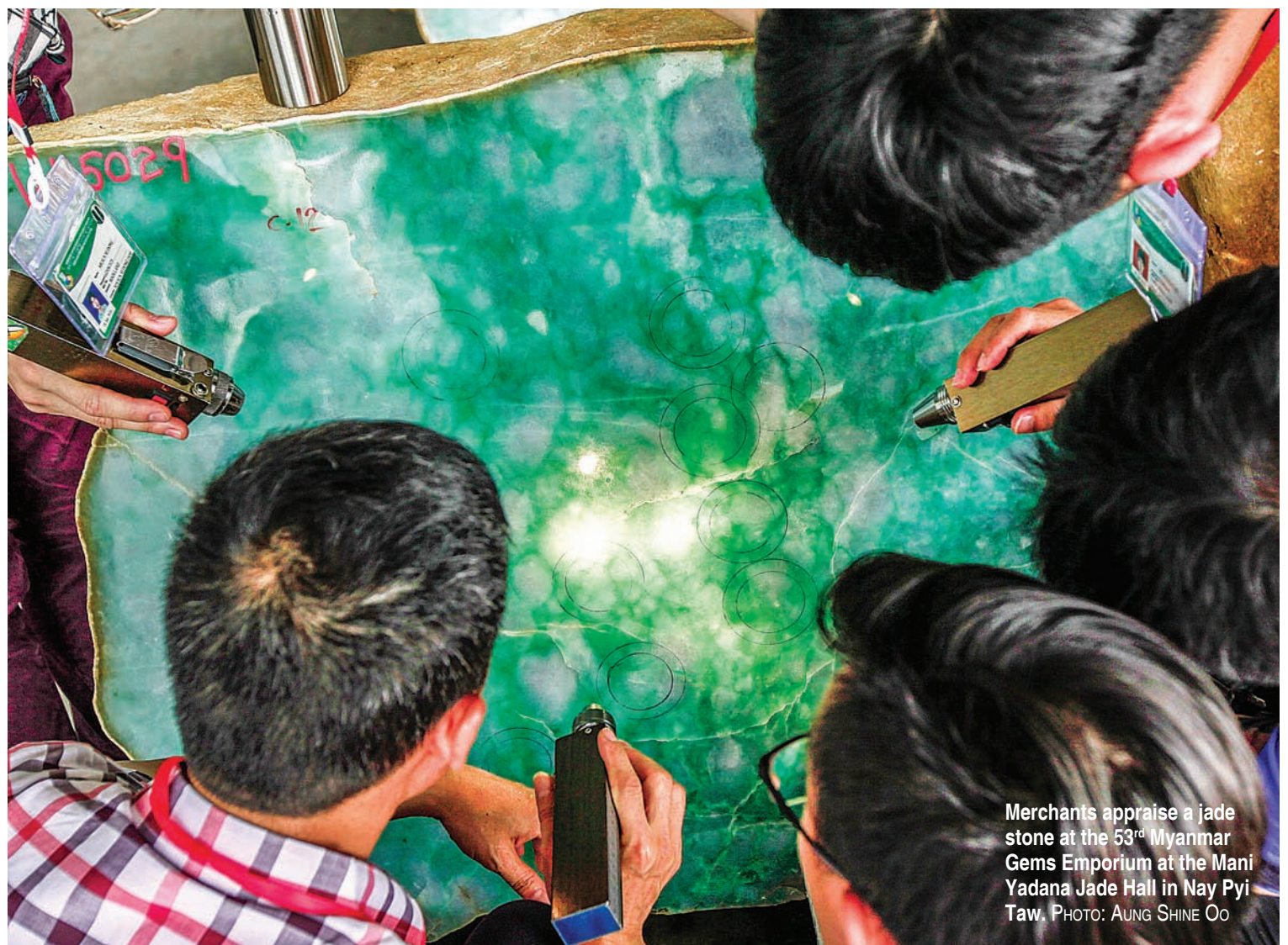
Merchants appraise a jade stone at the 53 rd Myanmar Gems Emporium at the Mani Yadana Jade Hall in Nay Pyi Taw.

Recently, the value of cut and uncut jade products within