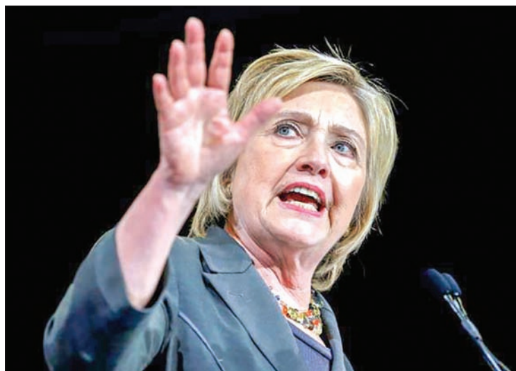
Democratic US presidential candidate Hillary Clinton speaks during a campaign event at the North Carolina State Fairgrounds in Raleigh, North Carolina, 22 June, 2016.

"Every president is tested by world events, but Donald Trump