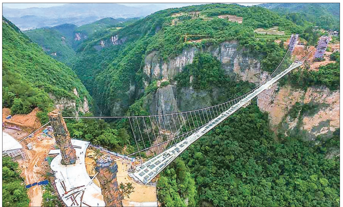
An aerial photo taken on 17 May, 2016 shows the construction site of a glass bridge at the Grand Canyon of Zhangjiajie National Forest Park, central China's Hunan Province. The 430-metre-long, 6-metre-wide bridge is expected to be put into a trial operation in May. The structure has undergone nearly 100 safety tests to ensure that it can support the weight of 800 people.

The Grand Canyon Scenic Area in Zhangjiajie received more than 1.2 million visitors from home and abroad in 2015.—Xinhua