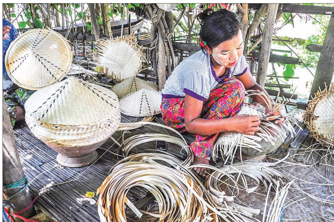
A woman makes conical bamboo hats in Mandalay.

saloon with the use of SKD system. The required raw auto parts in the manufacturing process will be imported from Japan. The price of that model Nissan Sunny Almera is not known yet.—200