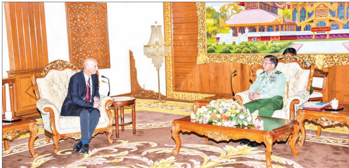
Senior General Min Aung Hlaing receiving Israeli SIBAT Director.