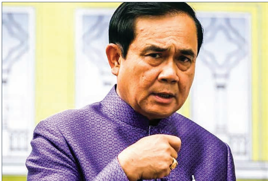
Thailand's Prime Minister Prayuth Chan-ocha speaks before a weekly cabinet meeting at Government House in Bangkok, Thailand, on 21 June.

BANGKOK — Thailand's Prime Minister Prayuth Chan-ocha said on Monday he would not resign if Thais reject a military-backed draft constitution when they vote in a referendum in August.