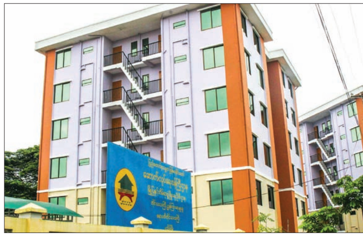
Manaw Thuka housing project is seen in Pathein.

MANAW Thuka housing project is left to the mercy of the Pathein public after a decision from the Ayeyarwaddy Regional government. The current Pathein Pyitawthar Housing Estate was to be destroyed and work begun on implementation of the five-hundred roomed Manawthuka housing project by the Department of Housing Development.