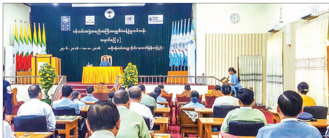
Photo shows a ceremony to open Management Course No.3 for heads of service organisations at Central Institute of Civil Service (Upper Myanmar) in Pyin-Oo-Lwin.