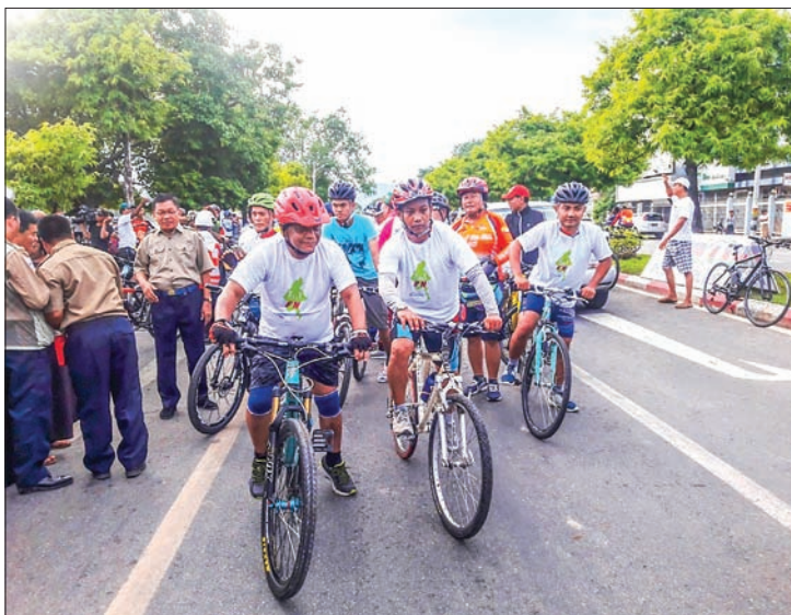
Mandalay Region Chief Minister being seen together with amateur cyclists.

The event will be held in the last week of every month as a mass activity around the Mandalay's Nan Myoe Moat.