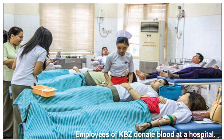
Employees of KBZ donate blood at a hospital.

The theme of this year's World Blood Donor Day, 14 June 2016, is "Blood connects us all". It focuses on thanking blood donors.— GNLM