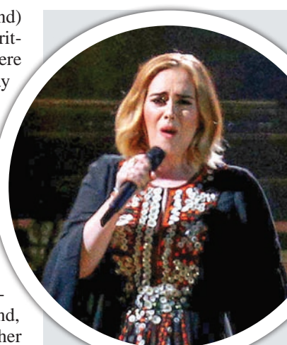
Singer Adele performs on The Pyramid stage at Worthy Farm in Somerset during the Glastonbury Festival, Britain, on 25 June.

star Adele, 28, known for her chart-topping hits on heartbreak such as "Someone like you" and "Rolling in the Deep", forms part of an all-British line-up of headliners at this year's festival.