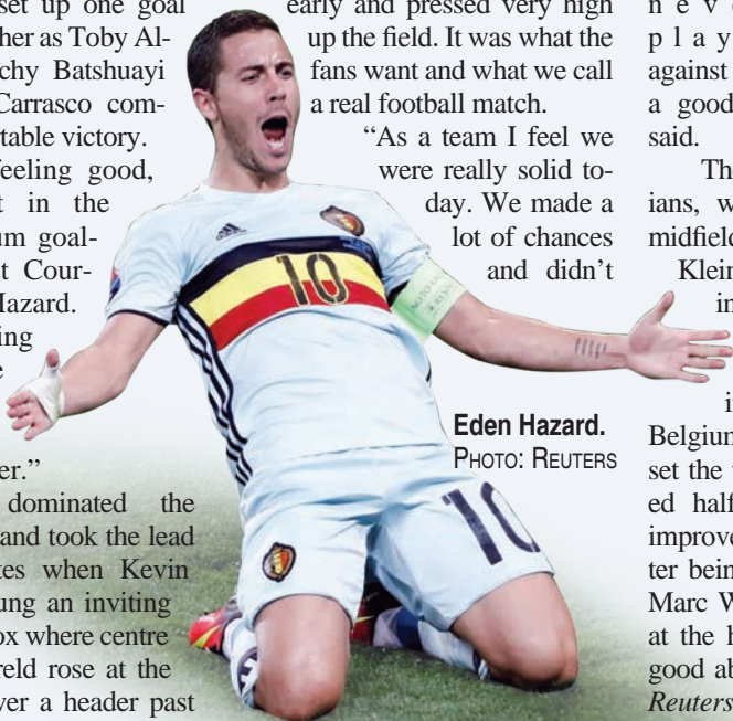
Eden Hazard.

The Hungarians, who lost key midfielder Lazlo Kleinheisler to injury in the warm-up, ceded the initiative early as Belgium found space and set the tone for a one-sided half. De Bruyne has improved significantly after being criticised by coach Marc Wilmots and was again at the heart of much that was good about Belgium's play. — Reuters