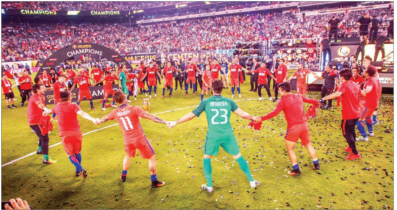
Chile celebrates after winning the championship match of the 2016 Copa America Centenario soccer tournament against Argentina at MetLife Stadium in East Rutherford, NJ, USA, on 26 June. Chile defeated Argentina 0-0 (4-2).

"Before them today was the number one team in the world,