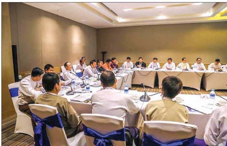
Football federations formation meeting in progress.

The MFF will reportedly acquire permission to form the township level football federations from concerned government departments. The federations can be established as soon as permission has been granted.— Myitmakha News Agency