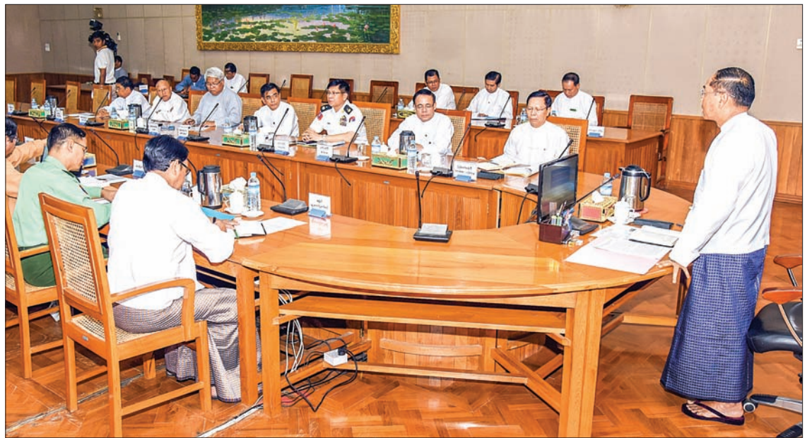
Vice President U Myint Swe addressing a meeting to hold a ceremony to commemorate the 69 th anniversary Martyrs' Day.

After hearing reports on general matters, U Myint Swe concluded the event.— Myanmar News Agency