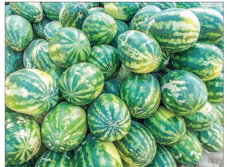
Watermelons in Natogyi.

Initially, a total of 5,000 shares will be sold only to the members of Watermelon and Cucumber Growers, Exporters Association with an initial price of Ks10,000 per unit. Shares will be sold to the public later.—Chan Chan with Myawaday.