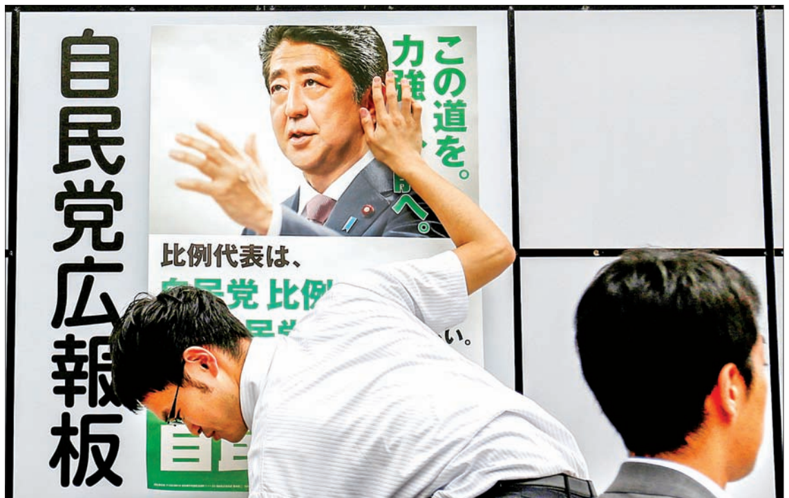
A staff member of Japan's ruling Liberal Democratic Party (LDP) posts a poster for the July 10 upper house election with the image of Shinzo Abe, Japan's Prime Minister and leader of the LDP, at the LDP headquarters in Tokyo, Japan, on 22 June.

Abe's campaign pitch echoed that by Australian Prime Minister Malcolm Turnbull, who on Sunday used Brexit shockwaves to urge voters to return his government with a majority at a 2 July election, arguing only stable government can deliver jobs,