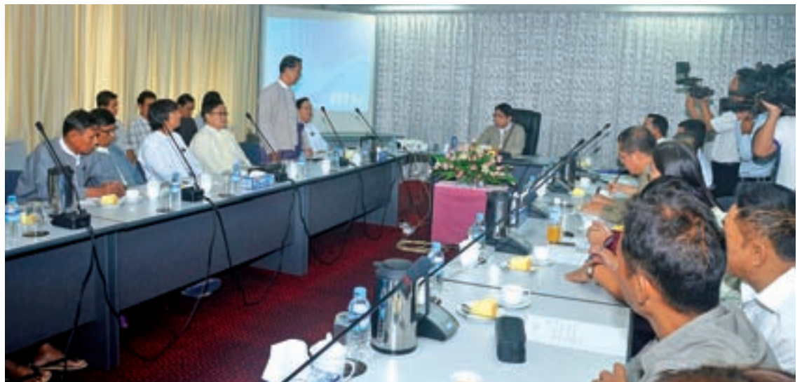
Union Minister Dr Pe Myint holds a meeting with seasoned composers.

INFORMATION Union Minister Dr Pe Myint met seasoned songwriters at the Myanmar Radio and Television centre in Yangon yesterday to request them to compose new songs that will reflect the