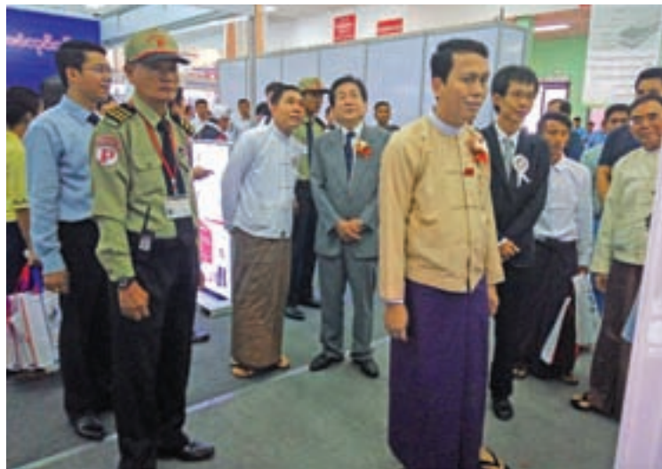
Yangon Region Chief Minister U Phyo Myin Thein.

THE 2nd Myanmar Education & Career Fair 2016, which kicked off on Friday at the Tatmadaw Hall on U Wisara Road in Yangon, has offered job opportunities and options of studying at vocational schools.