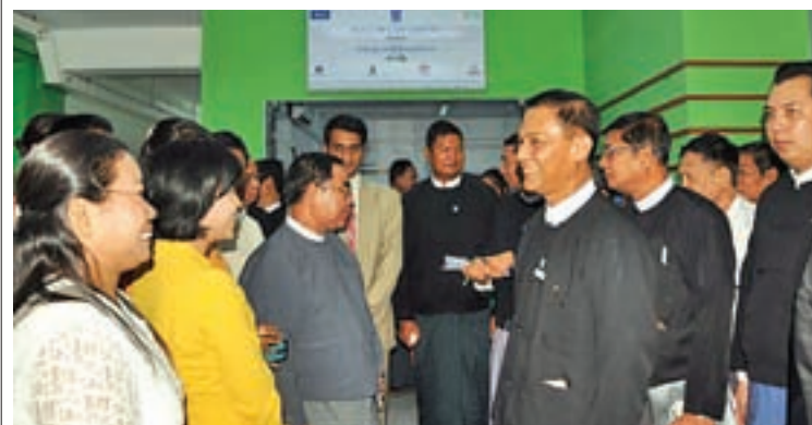
The Union Attorney General visits Yangon Rule of Law Centre.

THE Union Attorney General H.E. U Tun Tun Oo visited the Yangon Rule of Law Centre on Friday 24 June where he met with staff and graduates from the rule of law courses and observed an ongoing 'training of trainers' course.