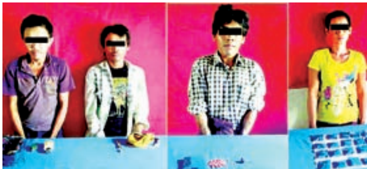
Criminals seen together with drugs seized.