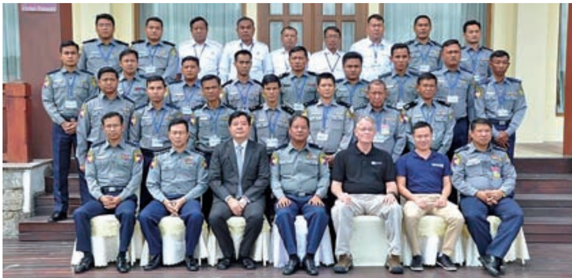
Officers posing for a group photo at the course completion ceremony.

A CONCLUSION ceremony for the course on combating illegal trafficking in wildlife and timber, jointly organised by the Myanmar Police Force (MPF) and the United Nations Office on Drugs and Crime (UNODC), was held at the Aureum Palace Hotel in Nay Pyi Taw on Friday with opening speeches delivered by Police Brigadier General Myint Htoo and Pro-