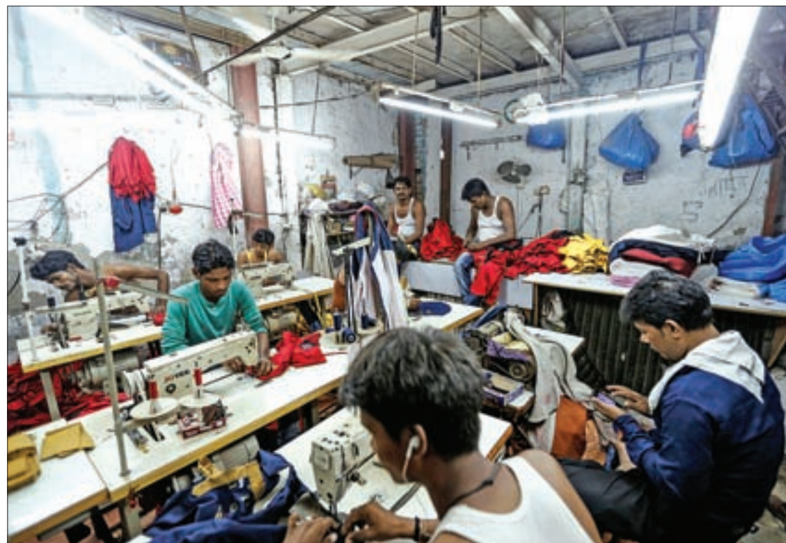
Employees work inside a garment factory in Mumbai, India, on 1 June.