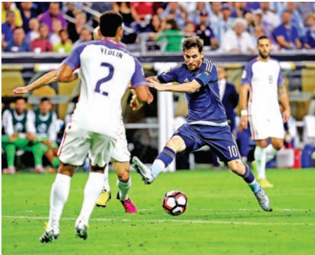
Argentina midfielder Lionel Messi (10) kicks the ball as United States defender DeAndre Yedlin (2) defends during the second half in the semifinals of the 2016 Copa America Centenario soccer tournament at NRG Stadium, Houston, TX, USA, on 21 June.

of the year has been outstanding at the Centenary Copa America, even though he played the first three games as a substitute after injuring his back in a warm-up game. His sublime free kick in the 4-0 win over the United