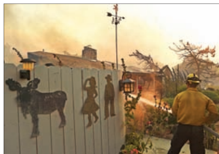
A firefighter sprays a smoldering home as the Erskine Fire burns near Weldon, California, US, on 24 June 2016.

Fire officials said they had five percent containment of the Erskine Fire as of Friday night, which was being driven by high temperatures and bone-dry vegetation from a five-year California drought.—Reuters