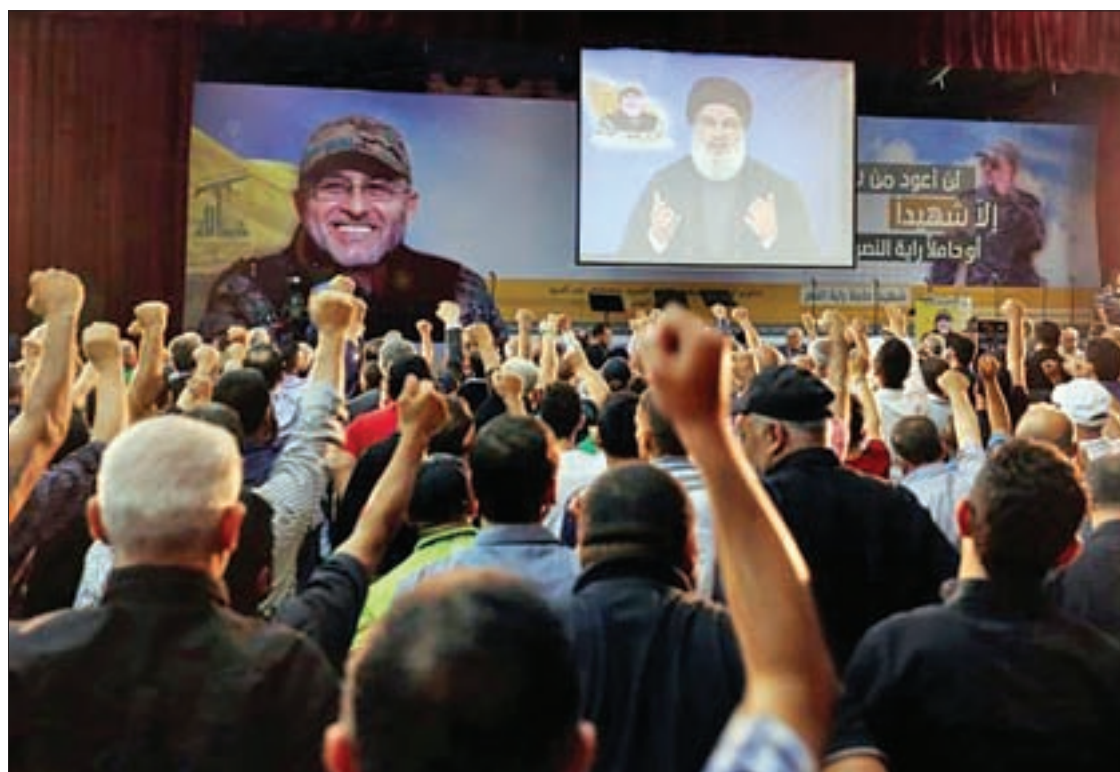
Supporters of Lebanon's Hezbollah leader Sayyed Hassan Nasrallah react as he addresses them from a screen during a ceremony marking the 40 th day after Hezbollah commander Mustafa Badreddine (picture on banner) was killed in an attack in Syria, in Beirut's southern suburbs, Lebanon on 24 June, 2016.

Aleppo has been a focus of intensified fighting in the months since peace talks in Geneva broke down and a ceasefire