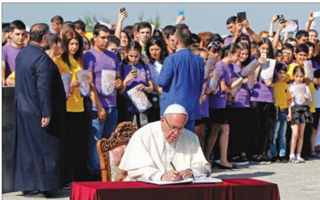
Pope Francis signs a visitors' book during a commemoration ceremony for Armenians killed by Ottoman Turks, at the Tzitzernakaberd Memorial Complex in Yerevan, Armenia, on 25 June 2016.

After the memorial service the pope flew to say a Mass in the provincial city of Gyumri, near the border with Turkey and within sight of Mount Ararat, where the Bible says Noah's Ark landed after the Great Flood.—Reuters