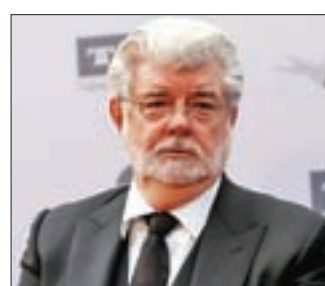
Director George Lucas.

group that filed suit last year to stop the museum project, did not immediately respond to requests for comment. The group argued the museum would be an eyesore on the waterfront and that it violated public use policy governing development on the shore of Lake Michigan.