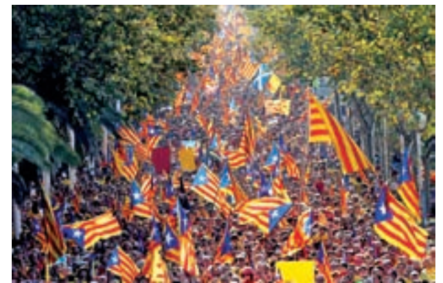
People hold Catalan separatist flags known as 'Esteladas' during a gathering to mark the Catalonia day 'Diada' in central Barcelona, Spain, in September 2014.

message of support to Scotland, whose first minister Nicola Sturgeon said on Friday a second Scottish independence referendum was "highly likely."