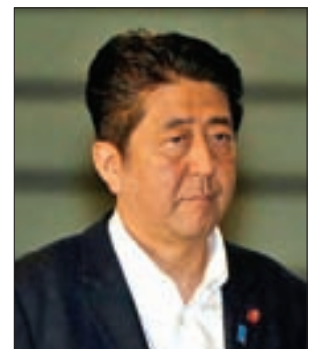
Japan's Prime Minister Shinzo Abe arrives at his official residence for attending a meeting of relevant cabinet ministers to discuss Britain's exit from the European Union, in Tokyo, Japan, on 24 June 2016.

Newspaper surveys said on Friday Abe's ruling bloc along with like-minded allies could get a two-third majority in the upper house as a result of the July election, in which half of the chamber's 242 seats will be up for grabs.