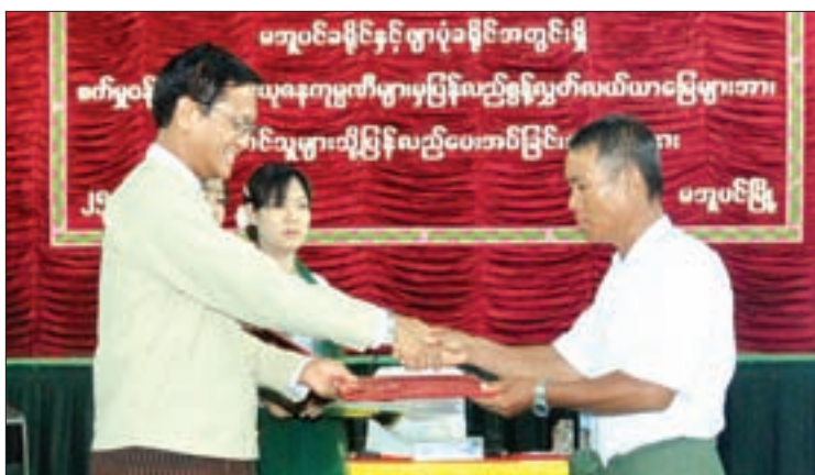
Vice President U Henry Van Thio presents document to a farmer at the ceremony to return farmland to farmers in Ayeyawady Region.