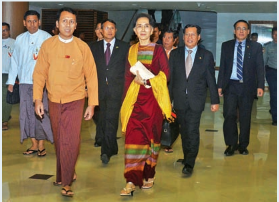
State Counsellor Daw Aung San Suu Kyi is welcomed by Yangon Region Chief Minister U Phyo Min Thein as she arrives back at Yangon International Airport on 25 June, 2016.

strong and weak points for a ceasefire in Shan State, cooperation with neighboring countries in fighting against trafficking in persons and drug trafficking and plans for building a dam over the Thanlwin River.— Shan State Information and Public Relations Department