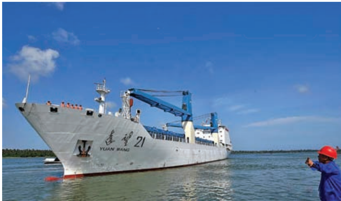
The "Yuanwang 21" transport ship carrying the Long March-7 carrier rocket arrives at Qinglan Harbor in Wenchang, south China's Hainan Province, on 14 May 2016.

accommodates the heavy-lift Long March-5. It has 14 floors above ground and one underground. Its steel door, 81 metres high, is Asia's largest. The home of the medium-lift Long March-7, is slightly smaller but still impressive.