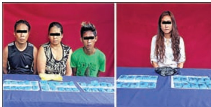
Criminals seen together with drugs seized.

On the same day, a local police squad from Lashio seized Yaba from a passenger near Oriental toll gate, Nawnghkio en-