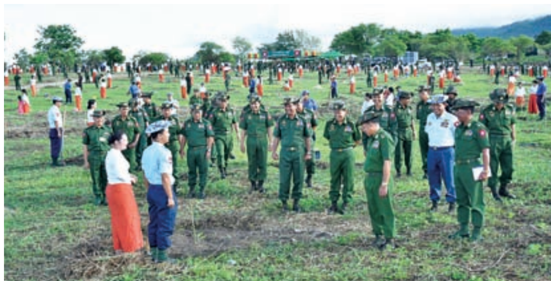
Senior General Min Aung Hlaing observing the trees being planted.

GROWING trees provides cool shade and protects the environment and protects against natural disaster, Commander-in-Chief of Defence Services Senior General Min Aung Hlaing said at a tree-planting ceremony in Nay Pyi Taw yesterday.