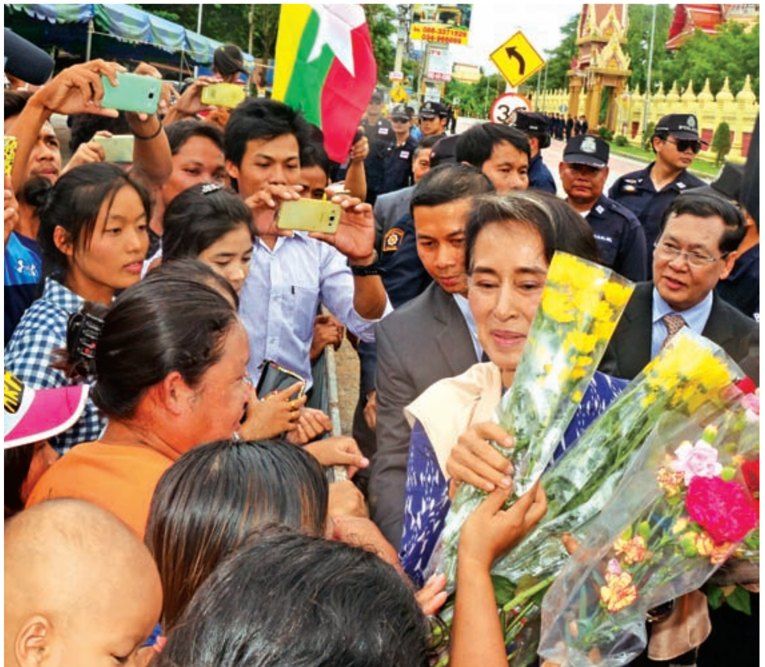
Daw Aung San Suu Kyi being welcomed by Myanmar workers during her visit to Nakhon Pathom province, Thailand.

The state counsellor left Bangkok in the evening. On arrival back at the airport in Yangon, the state counsellor and her entourage were welcomed by Yangon Region Chief Minister U Phyo Min Thein, Yangon Mayor U Maung Maung Soe and officials. — Myanmar News Agency