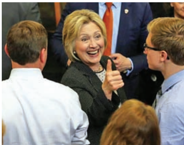
Democratic US presidential candidate Hillary Clinton gives the thumbs up to the crowd after speaking at a campaign rally in Columbus, Ohio, US, on 21 June, 2016.

Campaign finance disclosures released earlier this week showed Trump started June with a war chest of just $1.3 million, a fraction of Clinton's $42 million. Trump sought to ease concerns among his allies by saying