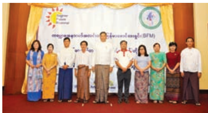
Group photo session at an awareness course on autism jointly conducted by MAA and BFM. PHOTO: THURA LWIN

According to statistics, boys are four times more likely than girls to have autism. World Autism Day is held globally every year on 2 April.— Thura Lwin