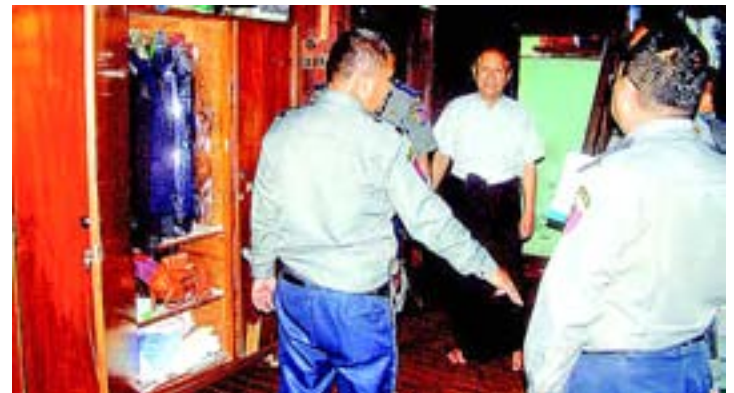
Police Officers investigating at the scene of accident.