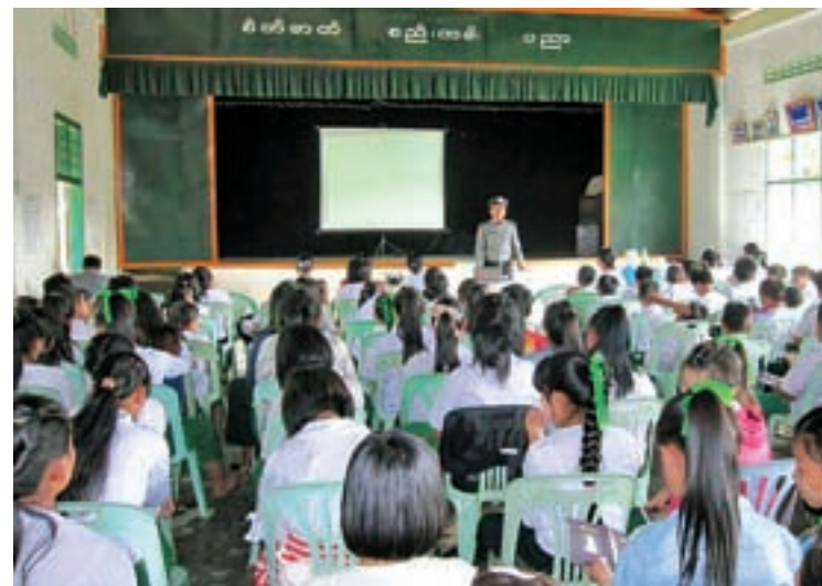
An anti-human trafficking awareness session in progress.

man trafficking police force explained the differences between human trafficking and human smuggling, methods of recruitment used by human traffickers, the history of human trafficking, the process of human trafficking, human trafficking laws and the punishment for those convicted of human trafficking related crimes. The police force gave out education pamphlets to 1,824 teachers and students, 66 trainees, 85 workers and 60 others who attended the ceremony.—Ye Zarni