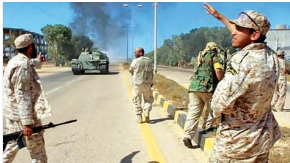
Soldiers from a force aligned with Libya's new unity government walk along a road during an advance on the eastern and southern outskirts of the Islamic State stronghold of Sirte on 9 June 2016. PHOTO: REUTERS

Misrata city forces, among the most powerful military brigades, are aligned with the UN-backed unity government that arrived in Tripoli in March. It is seeking to replace two other rival governments that were set up in Tripoli and the east in 2014, and to unite Libya's many political and armed factions.—Reuters