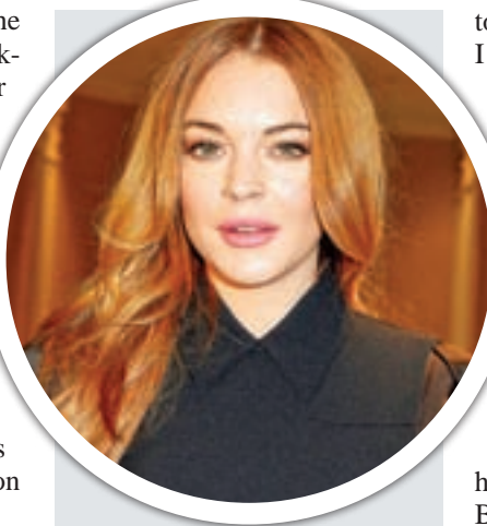
Actress Lindsay Lohan.

As the sun rose in the United Kingdom and the BBC declared