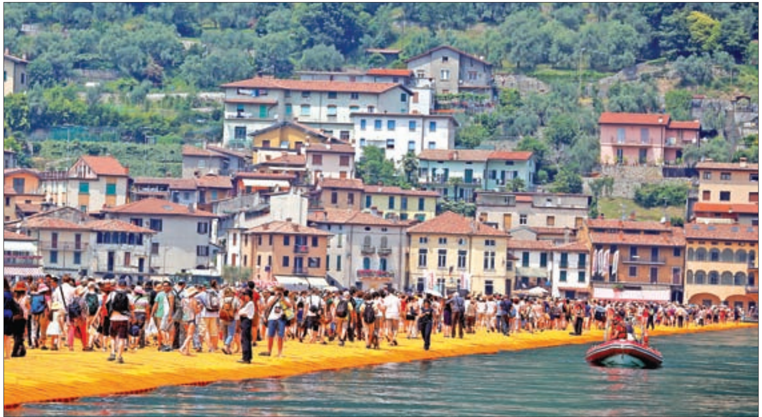
People walk on the installation ‘The Floating Piers’ by Bulgarian-born artist Christo Vladimirov Yavachev, known as Christo, on the Lake Iseo, northern Italy, on 24 June 2016.

Authorities in the area 100 km (60 miles) northeast of Milan had expected around 40,000 visitors a day and to keep the walkway open around the clock. But after 97,000 came on Wednesday