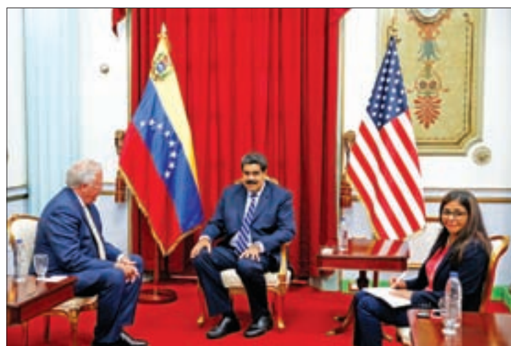
Venezuela's President Nicolas Maduro attends a meeting with US diplomat Thomas Shannon at Miraflores Palace, next to Venezuela's Foreign Minister Delcy Rodriguez, in Caracas, Venezuela, on 22 June 2016.

"The hope (is) that this can be used not only to address political differences but also to create a platform from which both the government and the opposition can ask for help from the international community to address some of the very significant crises that Venezuela faces now," Shannon told reporters.