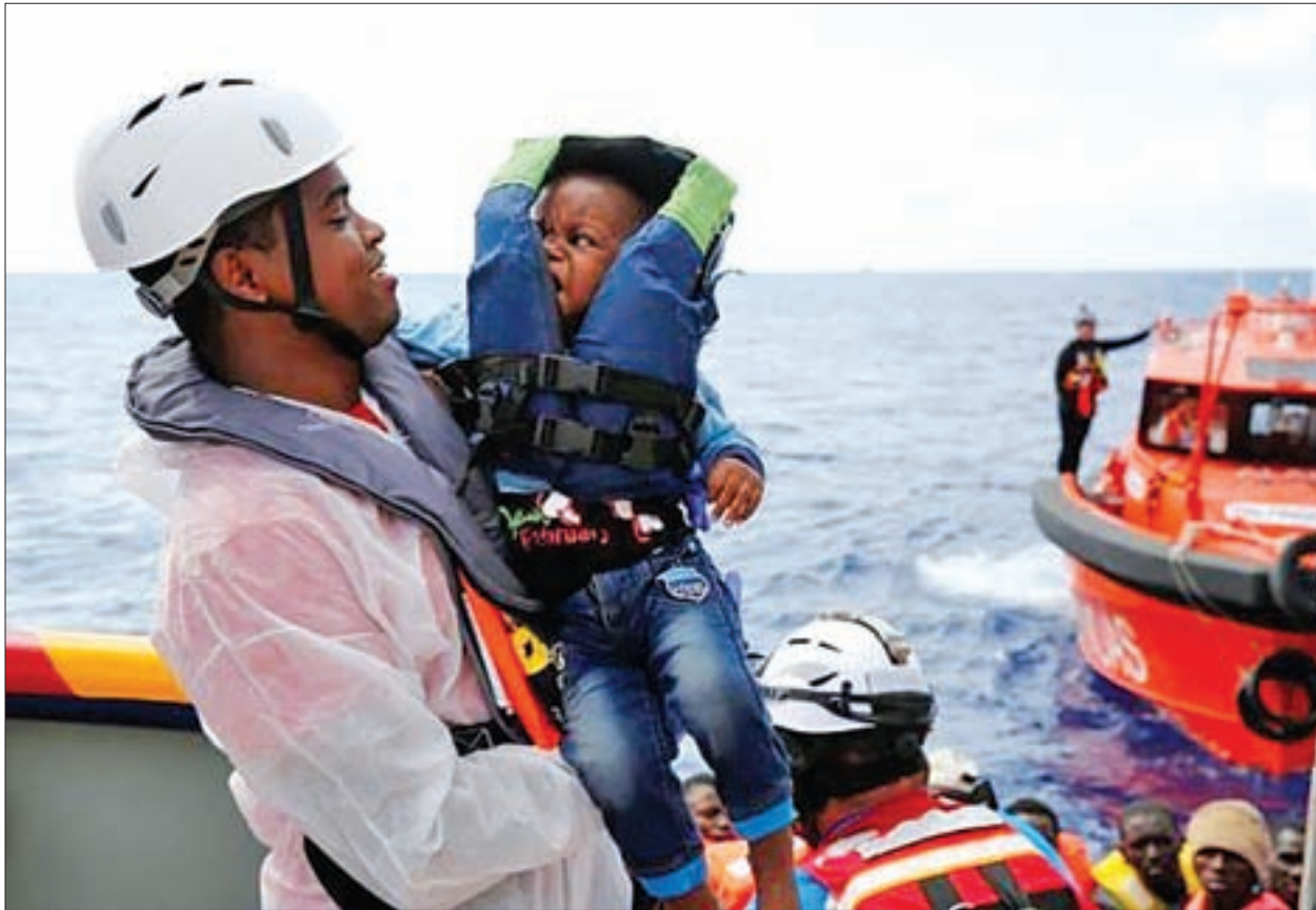
A cultural mediator from Italian NGO EMERGENCY carries a migrant baby on board of the Migrant Offshore Aid Station (MOAS) rescue ship Topaz Responder around 20 nautical miles off the coast of Libya, on 23 June 2016.