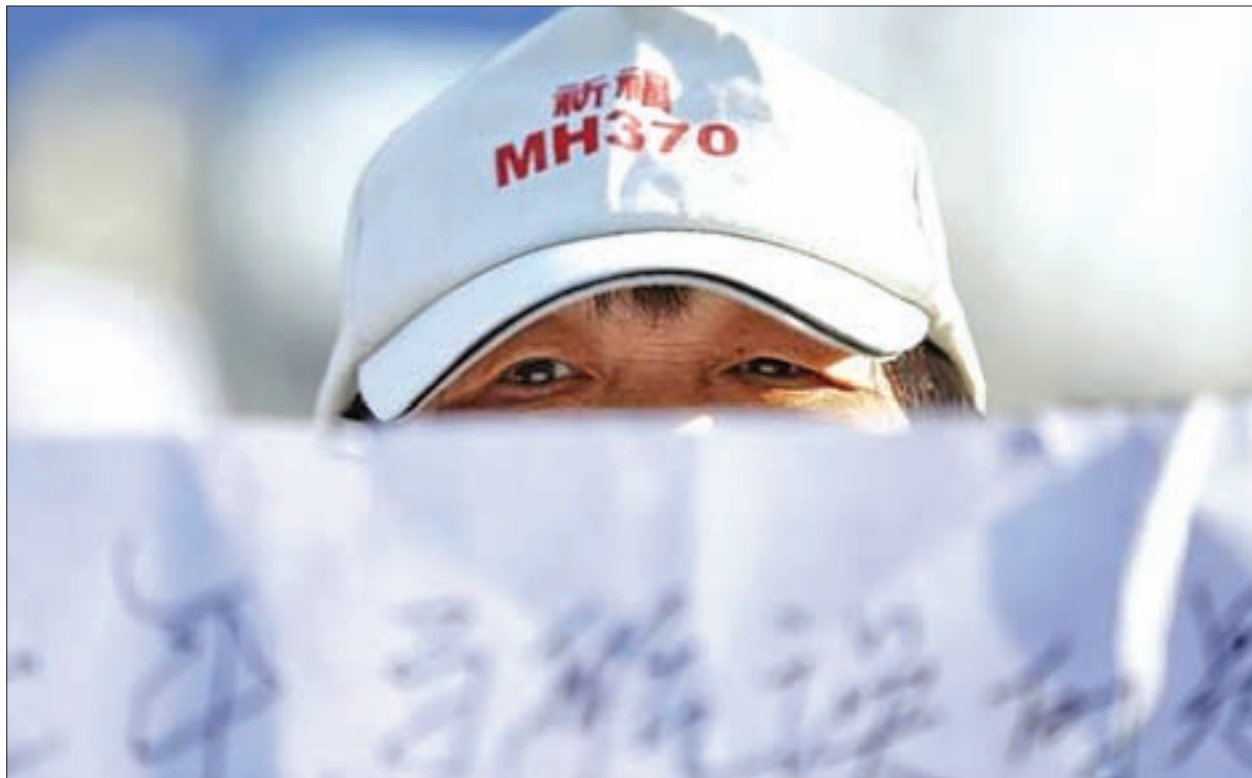
A family member of a passenger onboard Malaysia Airlines flight MH370 which went missing in 2014 holds a banner during a gathering in front of the Malaysian Embassy on the second anniversary of the disappearance of MH370, in Beijing, China, on 8 March 2016.