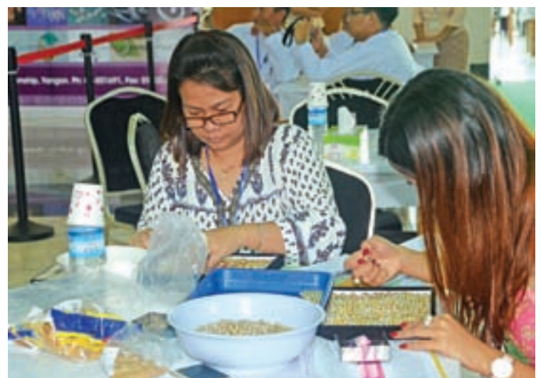
Traders appraise pearl lots at 53rd Myanmar Gems Emporium.

The duration of the emporium is possibly to be extended depending on the number of uncut jade lots and gem lots to be exhibited by sellers, according to the committee responsible for holding the emporium.— Myanmar News Agency