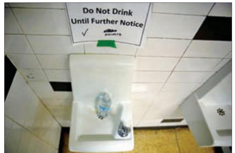
A sign is seen next to a water dispenser at North Western High School in Flint, Michigan, on 4 May 2016.

The agency urged residents to use filters on their faucets to get water for drinking, cooking and brushing teeth. It said regular tap water could be used for bathing and showering because lead is not absorbed into the skin, but