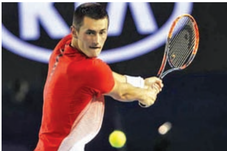
Australia's Bernard Tomic.

Allegations of giving up, or tanking, have dogged him in recent years and reached fever pitch when he faced match point at the Madrid Open in May with his racket upside down.—Reuters