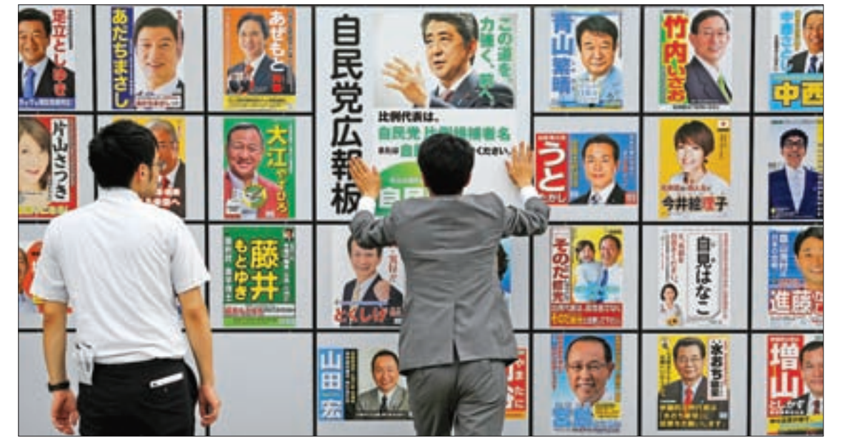
A staff member of Japan's ruling Liberal Democratic Party (LDP) posts a poster for the 10 July upper house election with the image of Shinzo Abe, Japan's Prime Minister and leader of the LDP, and other candidates' posters at the LDP headquarters in Tokyo, Japan, on 22 June, 2016.

ner, the Komeito party, were on track to exceed their target of 61 seats, or a majority of those up for grabs, the Nikkei said. The Democrats, who have struggled to regain trust after a rocky 2009-2012 rule, looked likely to win around 30 seats, the surveys suggested.