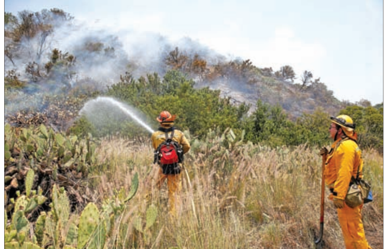
Firefighters mop up after helicopters dropped water on a fire in the San Gabriel mountains near Azusa, California, US on 21 June 2016.

There were no immediate reports of injuries, though Kern County Fire Captain Tyler Townsend said some residents flouted evacuation orders. Up to 350 fire personnel were battling the blaze and hundreds more were en route, according to InciWeb. Nearly 5,000 firefighters elsewhere around the state battled to control several major wildfires raging from the Klamath National Forest near Oregon to desert brush near the Mexico border. Authorities said the danger was still high in some areas, despite making enough progress to lift evac-