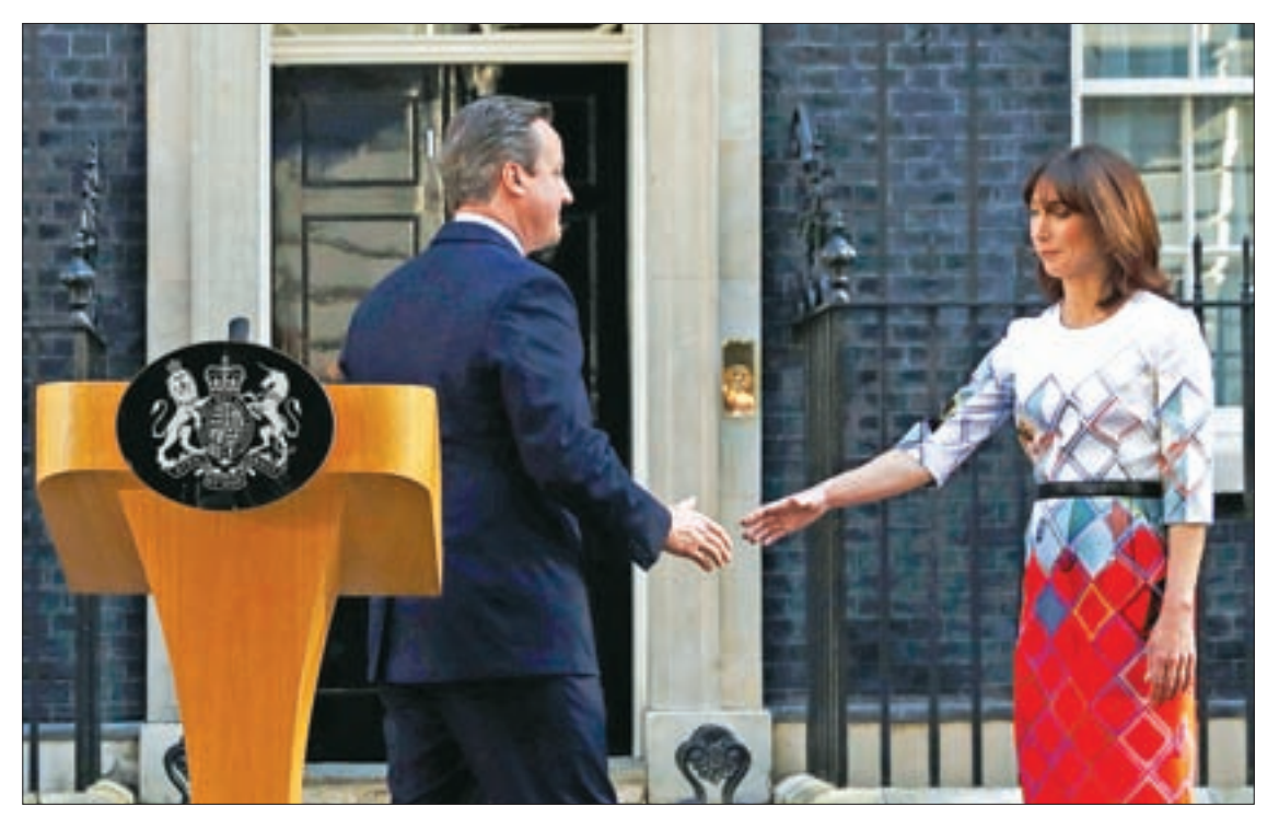
Britain's Prime Minister David Cameron his wife Samantha walk back into 10 Downing Street after he spoke about Britain voting to leave the European Union, in London, Britain on 24 June 2016.

LONDON — Britain has voted to leave the European Union, forcing the resignation of Prime Minister David Cameron and dealing the biggest blow to the European project of greater unity since World War II.