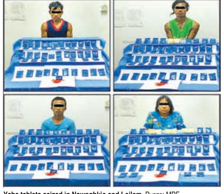
Yaba tablets seized in Nawnghkio and Loilem.

Police from Lashio station seized 600 yaba pills when searching one Aye Thidar Soe on board a passenger bus belonging to the Nam Kham Mahn bus line near the Oriental toll