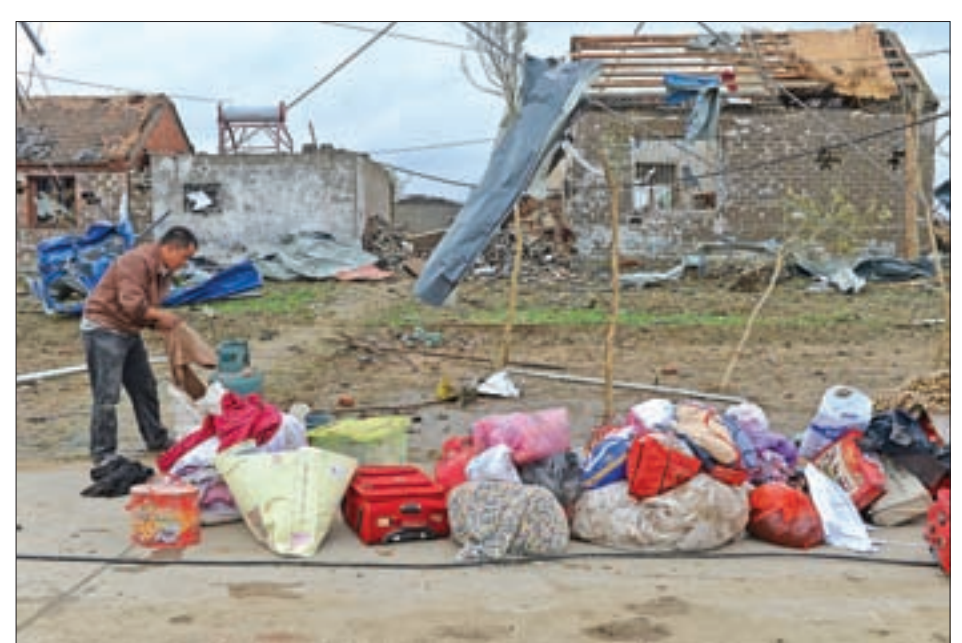
A men takes out his belongings from his damaged house after a tornado hit Funing on Thursday, in Yancheng, Jiangsu Province, on 24 June, 2016.

GCL System Integration Technology Co Ltd, a $5.22 billion market cap solar cell module maker, said a 40,000 square meter factory it part-owned had collapsed due to the tornado. Firefighters were doing emergency rescue work on the scene and the company was assessing the extent of the damage.-Reuters