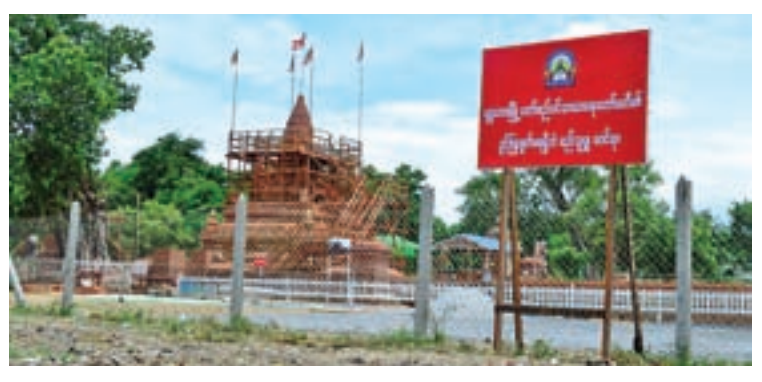
The controversial site of the tomb of a Thai king at Linzin hill.

According to researchers and archaeologists from Myanmar and Thailand, ancient Thai King Udumbara was believed to have been buried in the graveyard on the Linzin hill in Amarapura.