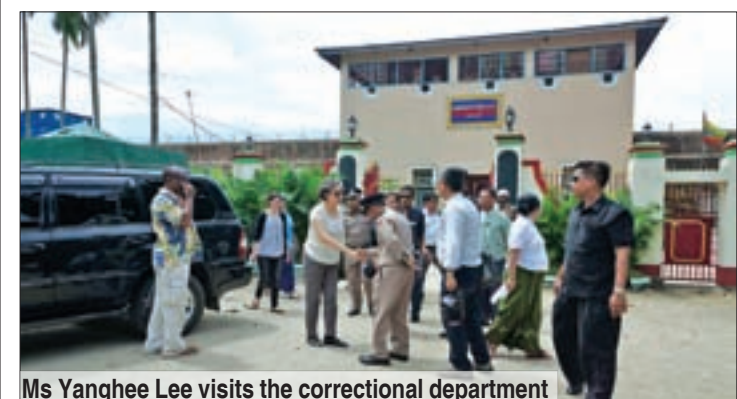
in Myitkyina.

The chief minister of Kachin State promised to cooperate in the promotion of human rights, saying that the success of the conference would help solve human rights issues. The UN special rapporteur also visited correctional facilities and shelters for internally displaced persons where she met with the victims of armed conflict.-Kachin State IPRD