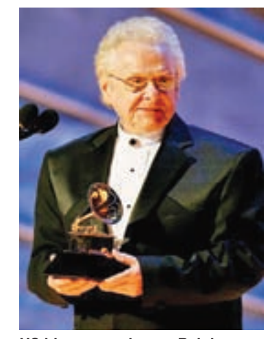
US bluegrass pioneer Ralph Stanley.

"I wrote 20 or so banjo tunes, but Carter was a better writer than me," Stanley said in a 2008 inter-