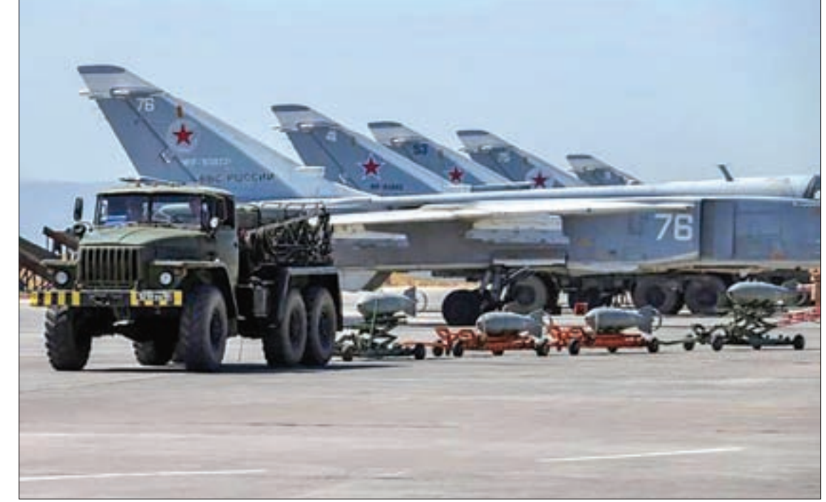
Russian military jets are seen at Hmeymim air base in Syria, on 18 June 2016.

Hijab alleged that "thermite, which ignites while falling, has been likened to 'mini nuclear