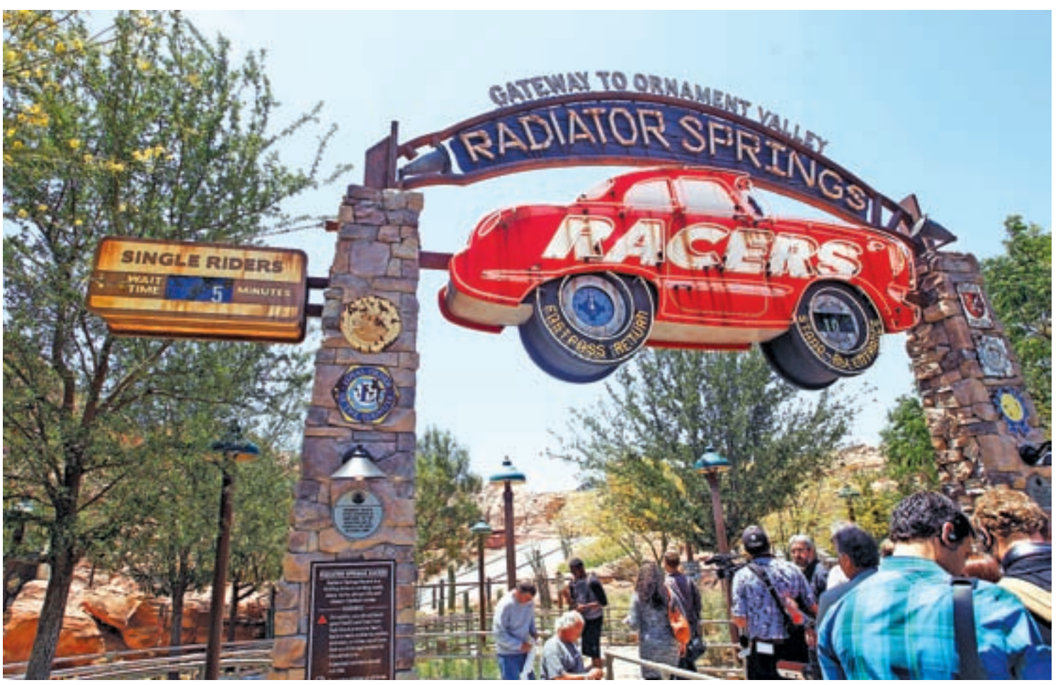
Expanded Disneyland California Adventure Park features a new attraction in Cars Land called Radiator Springs Racers, which gives guests a scenic tour of Ornament Valley in racing convertibles in Anaheim, California in 2012.