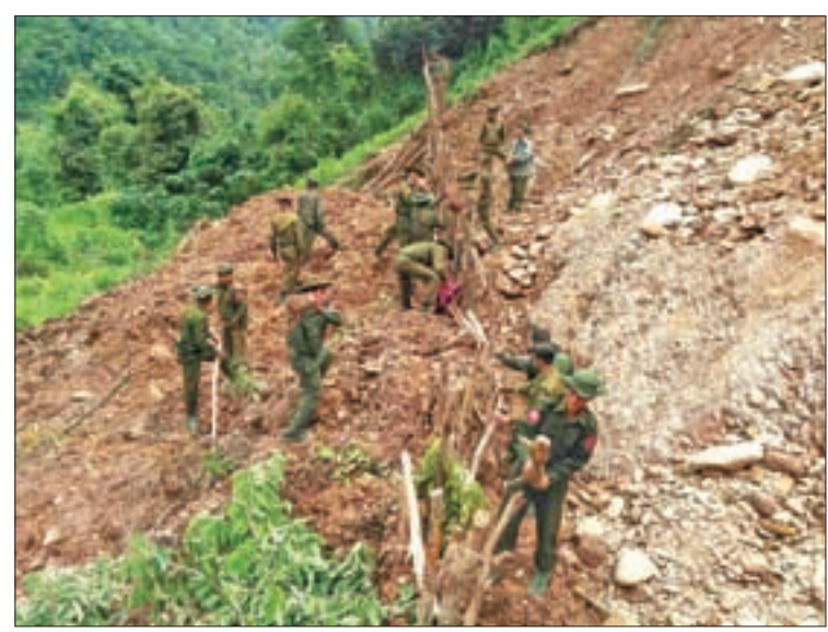
Tatmadawmen repairing the earth retaining wall of drain in Matupi.

RECENT heavy rain in Chin State caused the collapse of the retaining earth wall of a drain connected with the Bontala hydro power plant and Bontala water-fall in Matupi town, Chin State.