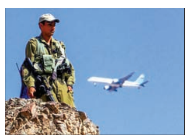
A plane flies overhead as an Israeli soldier stands guard near the Israeli-Egyptian border in 2011.

Jordan sounds less upbeat, however. "We do not want to stand in the way of Israeli projects, but we have our concerns regarding our own airport, and there is also the matter of keeping the spirit of our peace agreement," said a Jordanian official who declined to be identified. The official was referring to a proposal, discussed in conjunction with the treaty, of building a joint Israeli-Jordanian airport. Katz said such a facility was an "option" that had gone unexercised. Opened in 1972, King Hussein underwent expansions after the 1994 peace accord to meet what the airport's website said was the rising demand of air traffic. Katz said Israel was therefore free to open Ramon on its side of the border.—Reuters