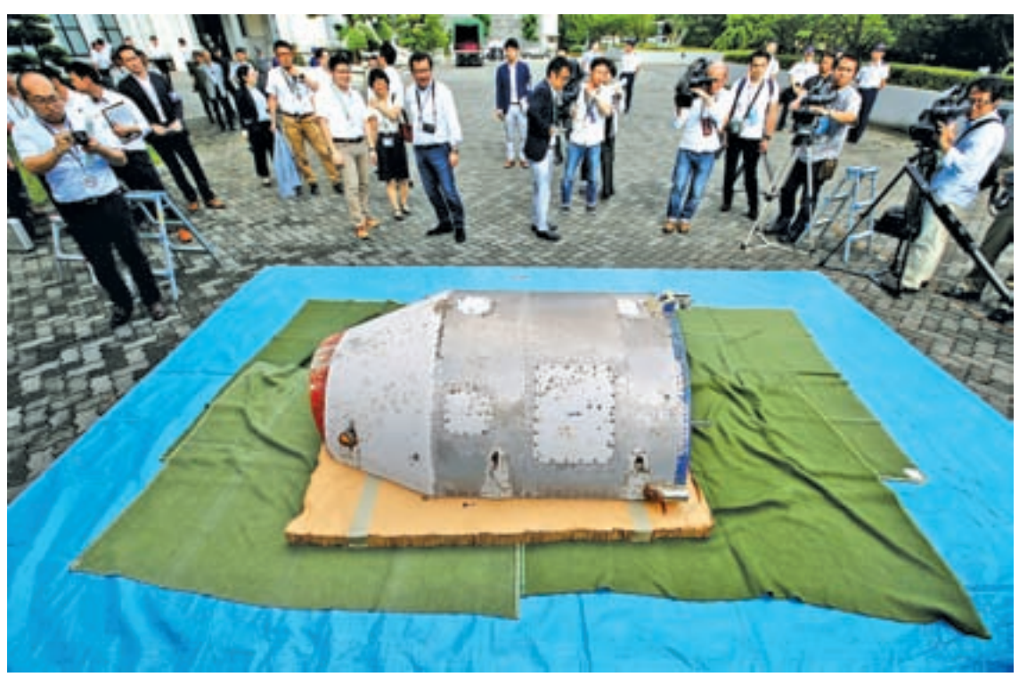
An object, suspected to be half of a nose cone from a North Korean rocket launched in February, that washed up on a Japanese beach, is shown to the media at the Defence Ministry in Tokyo, Japan on 23 June, 2016.

Concern that North Korea is getting closer to perfecting its ballistic missile technology heightened on Wednesday after it fired what appeared to be two intermediate range ballistic mis-