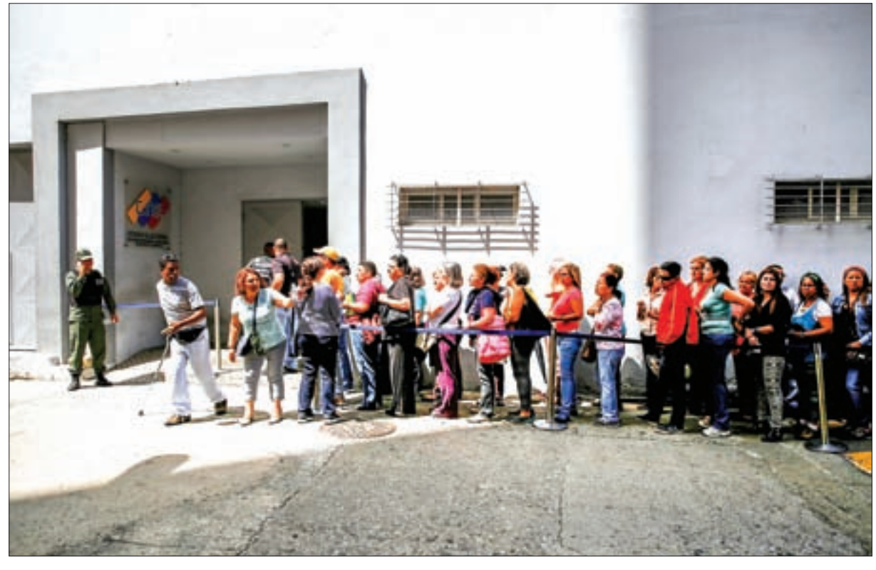
People stand in line as they gather outside a validation centre during Venezuela's National Electoral Council (CNE) second phase of verifying signatures for a recall referendum against President Nicolas Maduro, in Caracas, Venezuela, on 21 June 2016.

If the electoral council considers the signatures valid, it must call a referendum within 90 days. In order to push Maduro out,