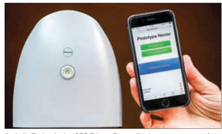
Aryballe Technologies CEO Tristan Rousselle shows a prototype of NeOse, a universal portable odour detection device connected to a database on a mobile phone, in Paris, on 20 April 2016.

California-based Aromyx, for example, is working with major food companies to help them capture a digital profile for every odor, using its EssenceChip. Wave some food across the device and it captures a digital signature that can be manipulated as if it were a sound or image file.— Reuters