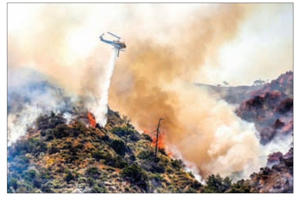
A helicopter drops water on a wildfire in the San Gabriel mountains as it attacks the flames near Duarte, California, US June on 21 2016.

Just 15 per cent of few miles apart early on