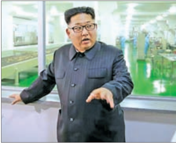
North Korea leader Kim Jong Un visits the remodeled Pyongyang Cornstarch Factory in this undated photo released by North Korea's Korean Central News Agency (KCNA) on 16 June 2016.

fired from mobile launchers, has a design range of deliberately raised the an-