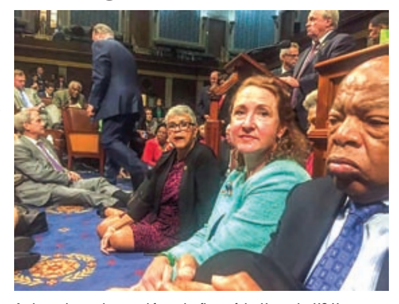
A photo shot and tweeted from the floor of the House by US House Rep. David Cicilline shows Democratic members of the US House of Representatives, including Rep. John Lewis (R) staging a sit-in on the House floor "to demand action on common sense gun legislation" on Capitol Hill in Washington, United States, on 22 June, 2016.

During the protest, sever-Republican representatives charged the chamber floor and