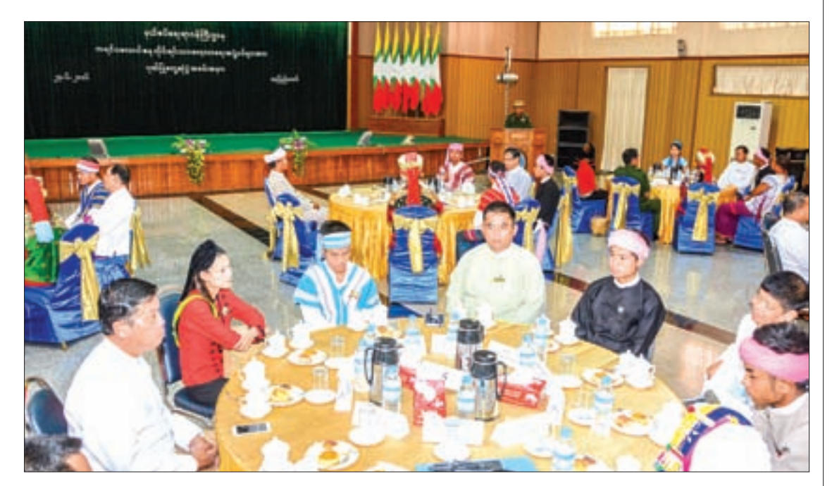
Ethnic people from border areas are attending a welcoming party by Ministry of Border Affairs.

Deputy Minister Maj-Gen Than Htut presented cash awards to a national race cultural troupe who performed traditional dances at the ceremony. - Myanmar News Agency