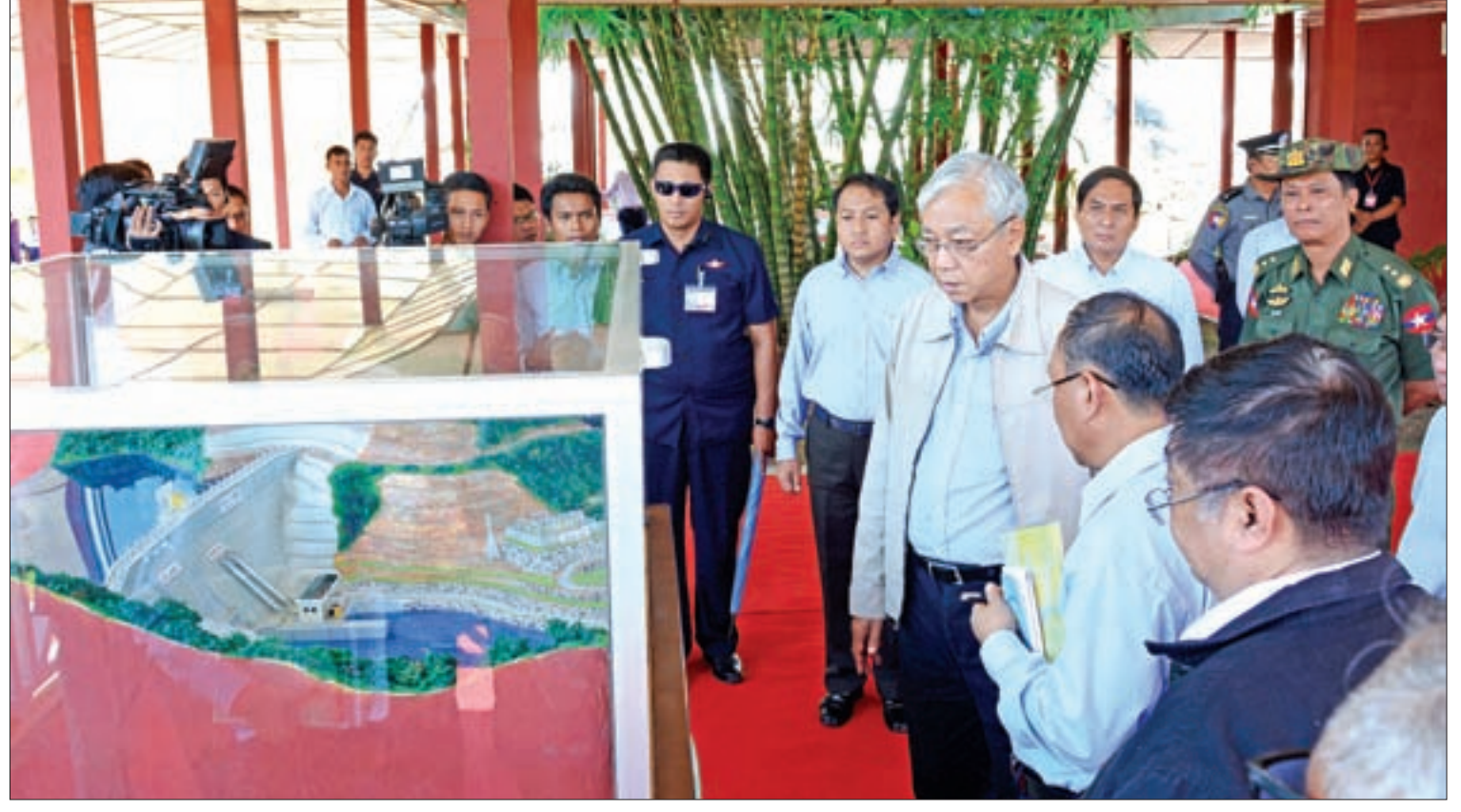
President U Htin Kyaw visits Upper Paung Laung Hydropower Project in Nay Pyi Taw.

dropower project began implementation during the 2004-2005 FY with the process being completed in November 2014.