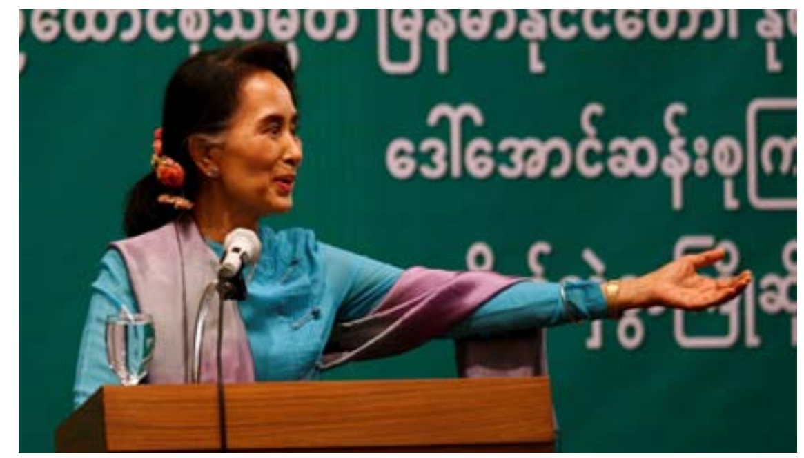
State Counsellor Daw Aung San Suu Kyi speaks during a meeting with migrant workers at the coastal fishery centre of Samut Sakhon, outside Bangkok, Thailand on 23 June, 2016.

During her stay in Thailand Daw Aung San Suu Kyi will meet with the Thai Prime Minister, the Foreign Affairs Minister of Thailand, students and faculty members from Universities in Thailand, including Myanmar teachers and students from Assumption University.—GNLM with Myanmar News Agency