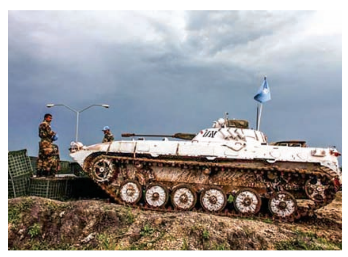
United Nations peacekeepers guard a United Nations base in Malakal in 2014.

UNITED NATIONS United Nations peacekeeping chief Herve Ladsous said on Wednesday troops would be sent home from a UN mission in South Sudan due to their response to deadly violence at a compound.