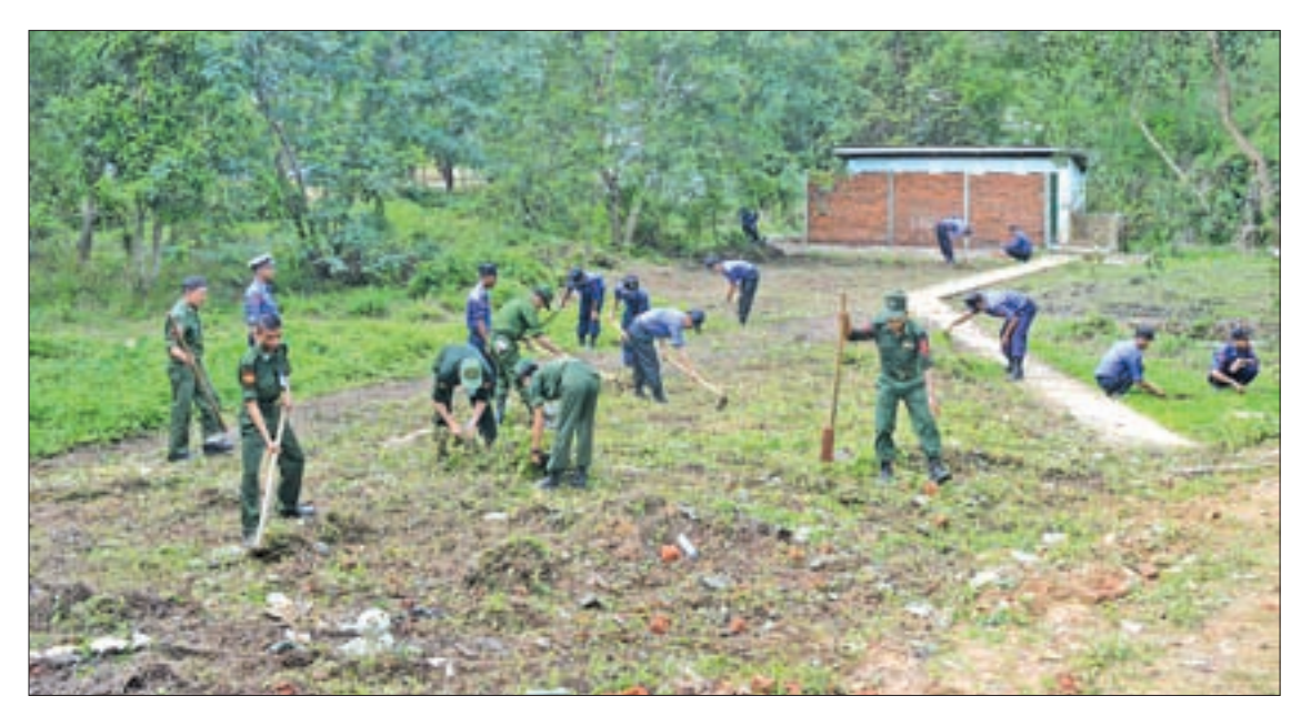
Tatmadawmen clearing weeds and bushes.

TATMADAW members (Army and Navy in Thanlyin) carried out sanitation work at a school in Thanlyin township on