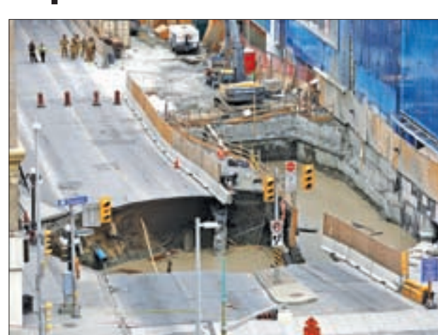
Emergency workers look at a large sinkhole in Ottawa, Ontario, Canada, on 8 June.

Officials said there were no reports of injuries or missing people. The Canadian Broadcasting Corporation showed footage of a van parked on the