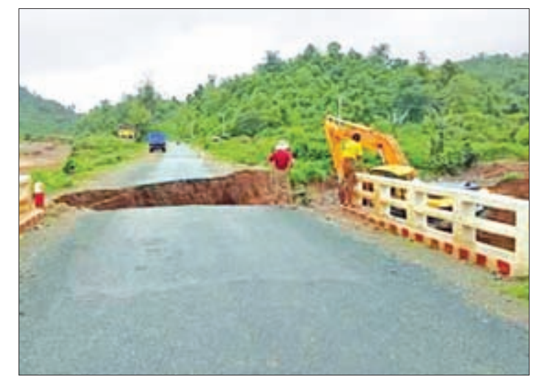
Flash floods damaged several bridges in Wuntho.

TWO people are reported dead following flooding in Sagaing Region yesterday as incessant rain battered Katha, Wuntho and Kawlin townships.