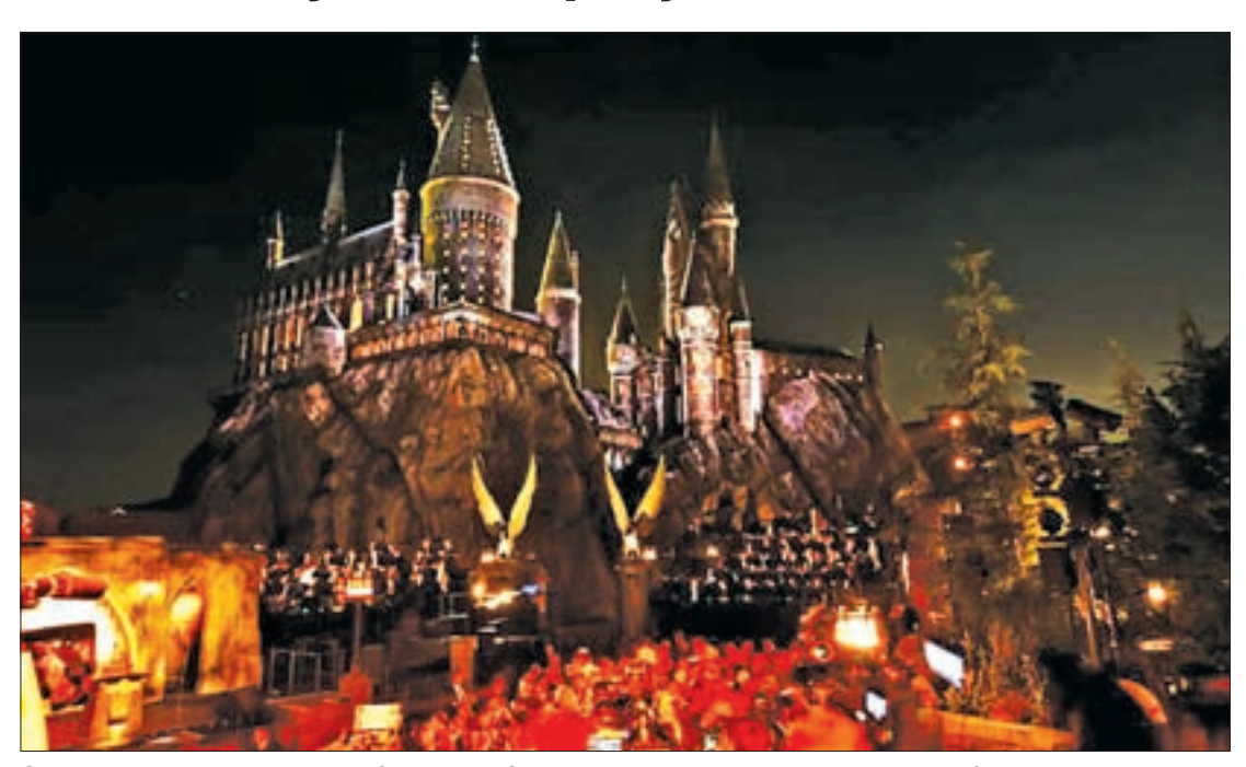
Guests wait by a reproduction of Hogwarts Castle during a special preview opening of "The Wizarding World of Harry Potter" attraction at Universal Studios Hollywood in Universal City, California on 5 April 2016.

LONDON — Dressed in Hogwarts robes and waving wands, eager fans got a first glimpse of the next instalment in the Harry Potter saga, giving a new London stage production glowing reviews.