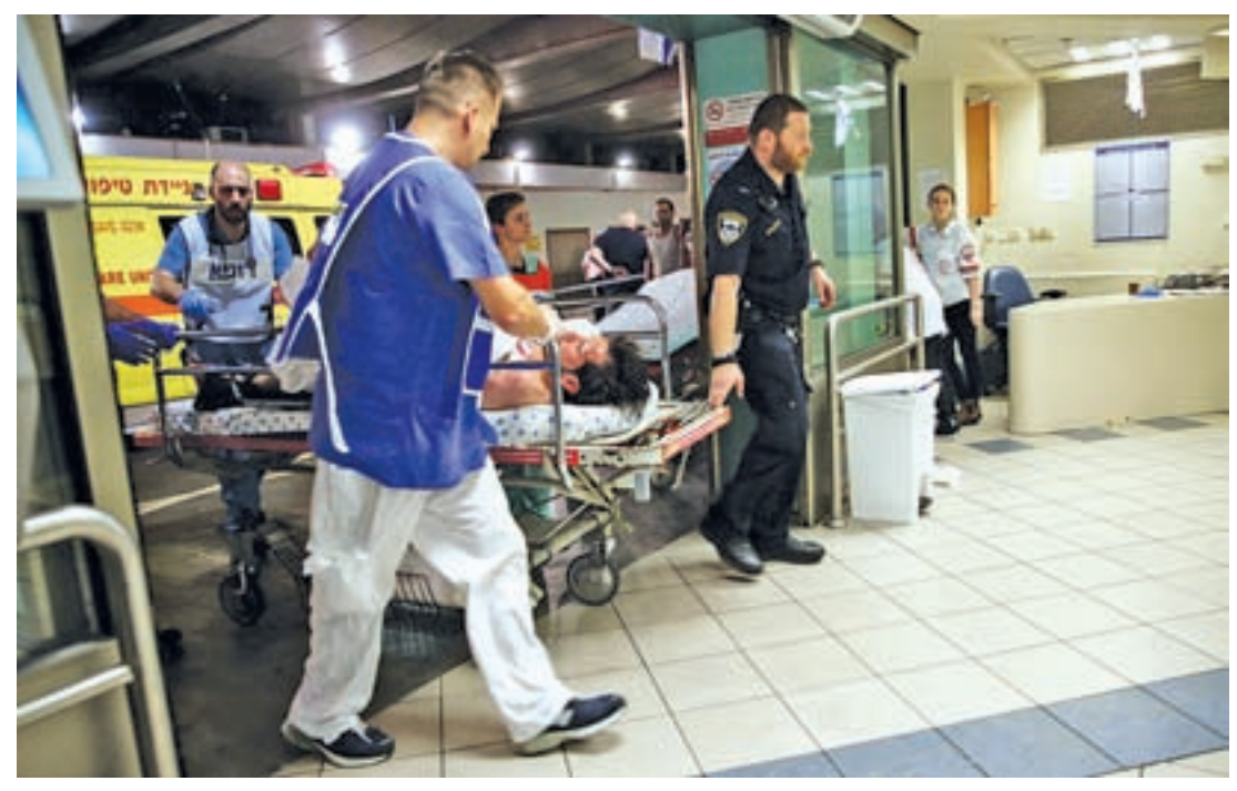
An injured man is taken into the emergency room following a shooting attack that took place in the centre of Tel Aviv, on 8 June.

"We held a consultation about the series of offensive and defensive measures that we will implement to act against the grave phenomenon of shootings. They certainly challenge us, but we will provide an answer," Netanyahu