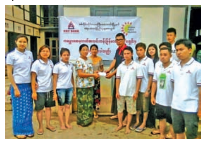
Members of BFM present aids to victims in flood-hit areas.

Torrents of water swept into Kawlin and Wuntho in the early morning and inundated the towns. The rain yesterday reached 10.35 inches.— Thiha Tun