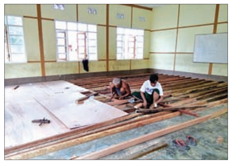
A KG classroom being repaired.

"We are planning to construct separate buildings for KG classes and there will be separate rooms for KG classes at all schools by the 2020 academic year," said an assistant township education officer.