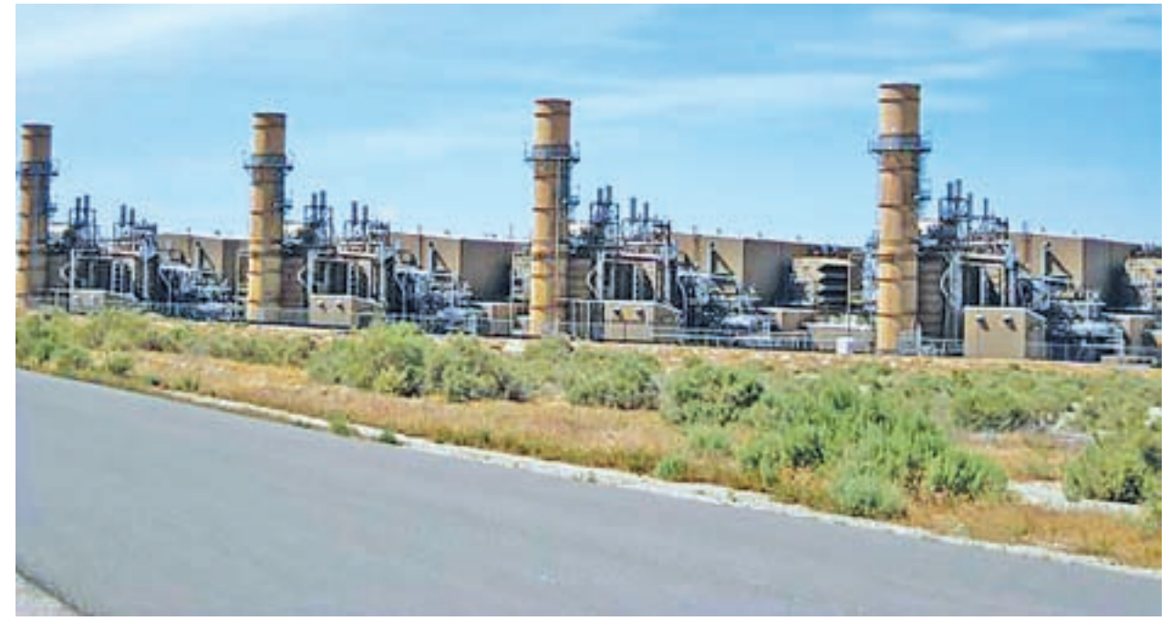
The La Paloma natural gas-fired generating plant is shown in McKittrick, California, US, in April 2009.

An unexpected combination of oversupply of natural gas and a boom in solar and other renewable energy has depressed power prices and threatened the viability of natural gas plants that sell power into the Golden State's electricity market. These develop-