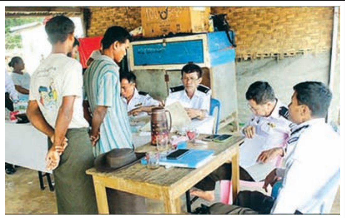
National Verification Cards (NVC) were issued to 109 men and 143 women in Kyaukphyu township and 29 men and 55 women in Myaybon township, Rakhine State, on 9 June.