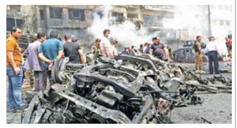
People gather at the site of car bomb attack in Baghdad al-Jadeeda, an eastern district of the Iraqi capital, on 9 June.

A suicide car bomb also targeted a main army checkpoint in Taji, just north of Baghdad, killing seven soldiers and wounding more than 20 others, he said.-