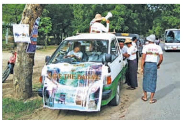
Activists seen demanding for conservation of Bagan.

The major aim of the campaign is to urge the government to conserve Bagan's cultural heritage. The campaign will continue for 45 days, beginning from 7 June.—Aung Thant Khaing