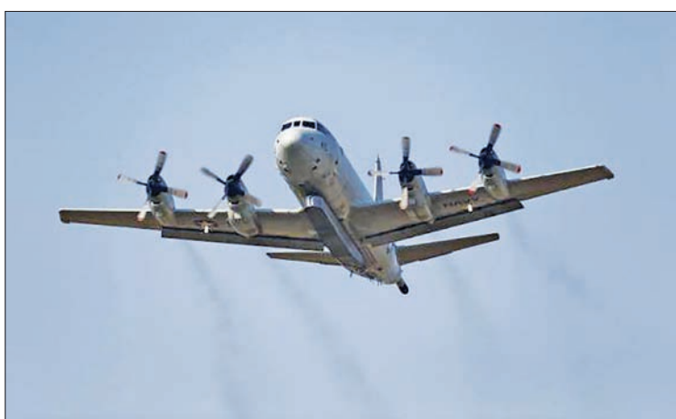
A US Navy P-3 Orion maritime patrol aircraft takes off from Incirlik airbase in the southern city of Adana, Turkey, in 2015.

A senior Vietnamese military official told Reuters over the week-