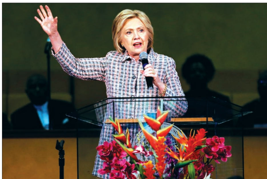
US Democratic presidential candidate Hillary Clinton speaks to the congregation at Greater Saint Paul Baptist Church in Oakland, California, United States, on 5 June 2016.

She and Sanders, the US senator from Vermont, are in a dead heat in California. But delegates in the state are awarded on a proportional basis, so even a loss there for Clinton would not be likely to