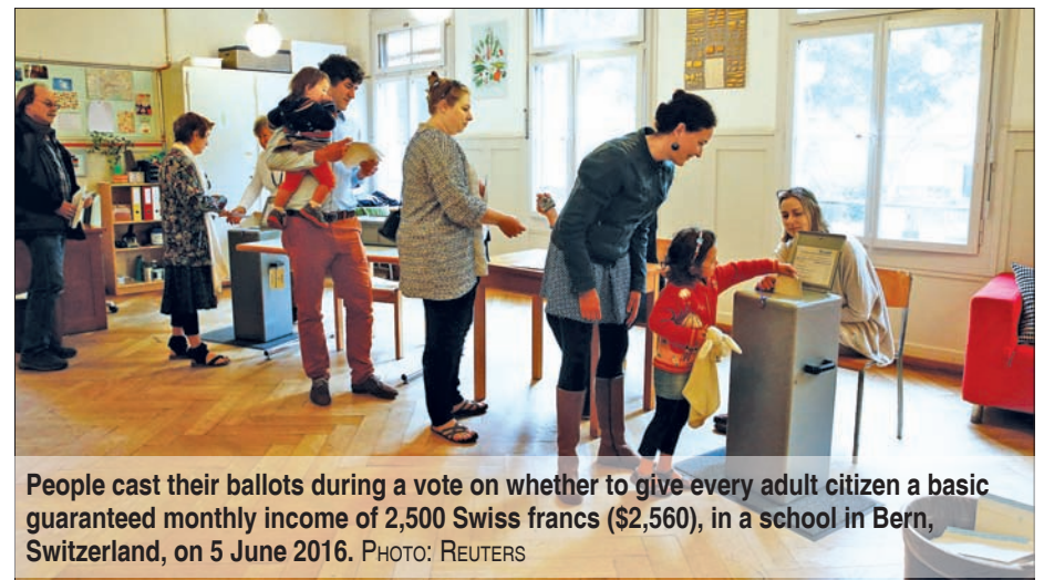
People cast their ballots during a vote on whether to give every adult citizen a basic guaranteed monthly income of 2,500 Swiss francs ($2,560), in a school in Bern, Switzerland, on 5 June 2016.

"For me it would be a great opportunity to put my focus on my passion and not go to work just for a living," he said.—Reuters