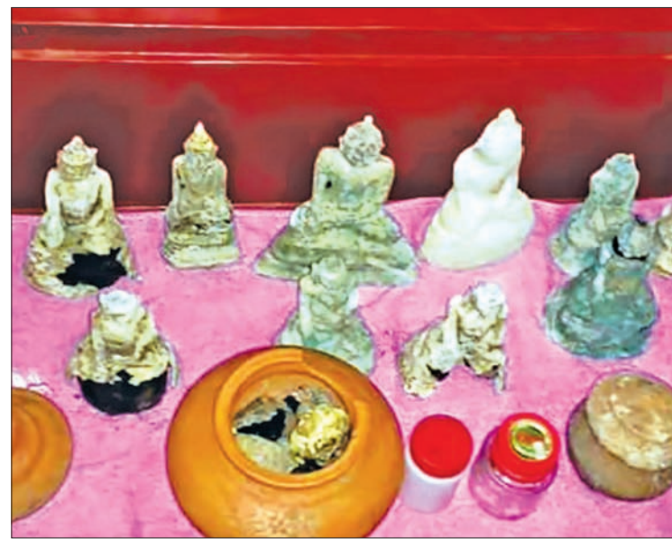
Small Buddha images being seen.