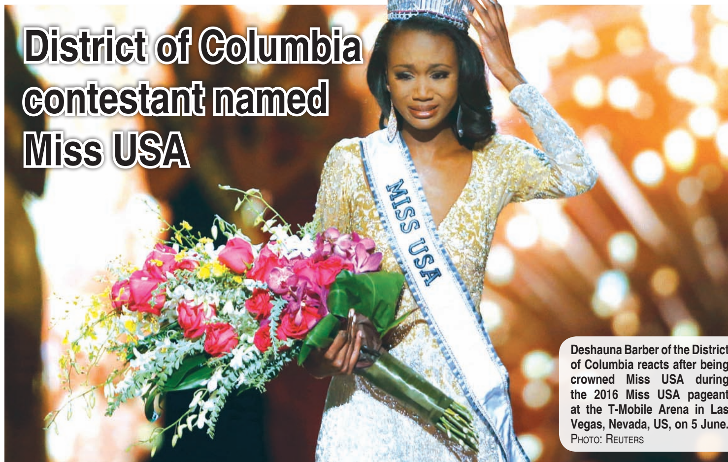
Deshauna Barber of the District of Columbia reacts after being crowned Miss USA during the 2016 Miss USA pageant at the T-Mobile Arena in Las Vegas, Nevada, US, on 5 June.

LAS VEGAS — A 26-year-old Army officer from the District of Columbia was crowned winner of the Miss USA pageant on Sunday.