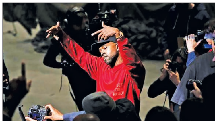
Kanye West dances during his Yeezy Season 3 Collection presentation and listening party for the "The Life of Pablo" album during New York Fashion Week on 11 February 2016.

West's Sunday afternoon concert on Randall's Island in New York's East River had earlier been canceled due to bad weather.