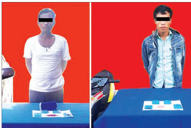
Two criminal suspects seen together with sized drugs.

Police are still investigating the case.— Ko Gyi Tin