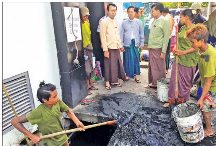
Yangon Region Chief Minister U Phyo Min Thein visits the area where sanitation is carried out in Yangon.

Private work groups have been undertaking the sanitation work. Yangon Region Chief Minister U Phyo Min Thein inspected the progress of the effort to unblock drains to allow the proper flow of water in Yangon on 6 June.— Lin Aung Htet