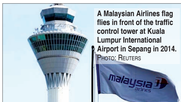
A Malaysian Airlines flag flies in front of the traffic control tower at Kuala Lumpur International Airport in Sepang in 2014.

A "small number" of injured passengers and crew on the flight, an Air-