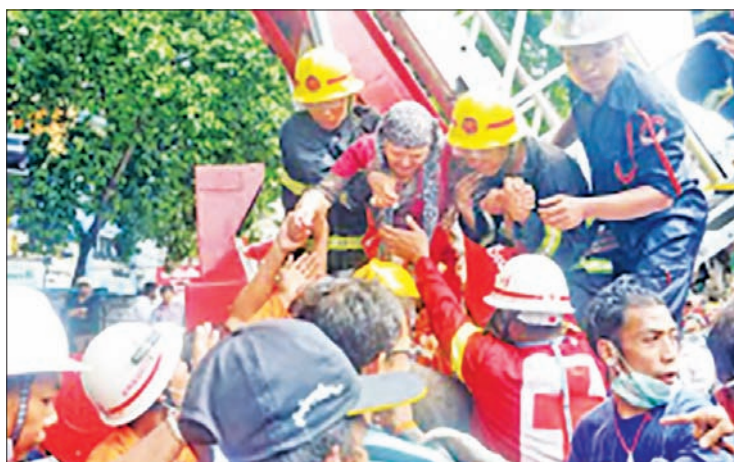
Firefighters rescue people from the burning shop.

Action is being taken against the shop owner, who will be charged by the township police.