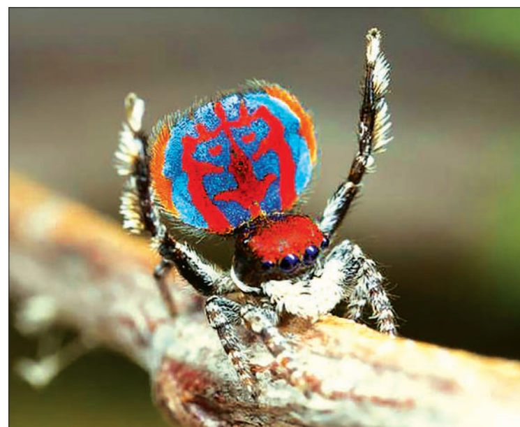
A specimen of the newly-discovered Australian Peacock spider, Maratus Bubo , shows off its colourful abdomen in this undated picture from Australia.

"People who hate spiders confess that they actually can't help loving these ones and in time this will just change the opinions people have of spiders, I hope."—Reuters