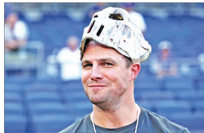
Canadian actor Stephen Amell on the field at Yankee Stadium before a game between the New York Yankees and the Toronto Blue Jays at Bronx, NY, USA on 25 May.

So far, the situation overseas is more promising. The film opened in 40 international markets, includ-