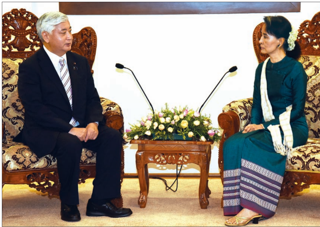
Union Minister for Foreign Affairs Daw Aung San Suu Kyi holds talks with Japanese Defence Minister Mr Gen Nakatani in Nay Pyi Taw.

Likewise, the Union minister held talks with Japanese Defence Minister Mr Gen Nakatani and his delegation at 11:30am.— Myanmar News Agency