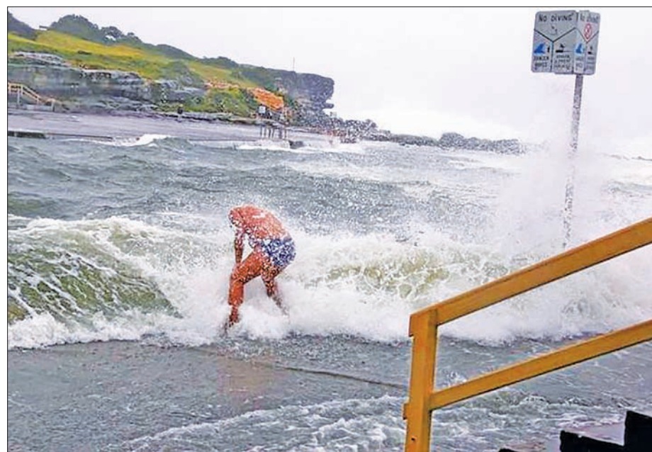
A swimmer is hit by a wave as he enters the water as severe weather, bringing strong winds and heavy rain, hits the eastern coast of Australia at Clovelly Beach in Sydney, on 5 June 2016.