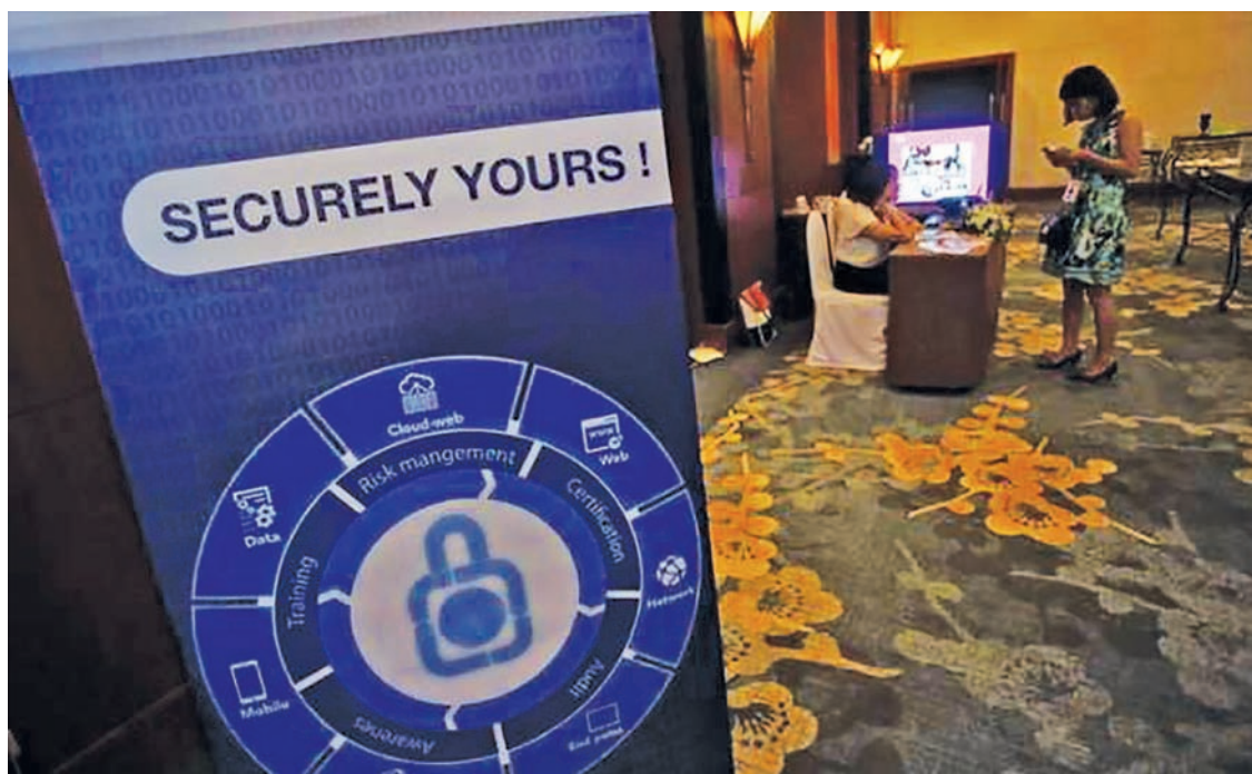
An advertising billboard of a cyber security company is seen during the annual Banking Vietnam 2016 forum in Hanoi, Viet Nam on 19 May 2016.