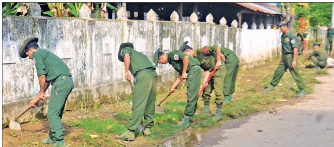
Tatmadawman being seen clearing weeds and bushes.

OFFICERS of the Western Command, along with a mobile medical team from the State Command, paid respect and donated gifts and cash to the Township Sangha Nayaka Sayadaw of Myo Oo Monastery at Airport Ward in Ann Township, Rakhine State,