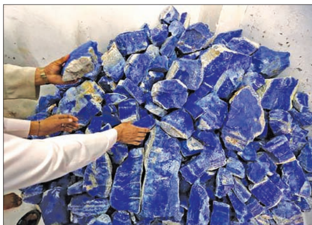
Men sort lapis lazuli inside a shop in Kabul, Afghanistan on 5 June 2016.