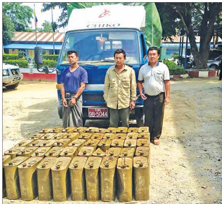
KIA members seen with 50 metal boxes of gunpowder.

Arrangements are being made to charge the KIA members in accordance with the law after handing over the seized gunpowder boxes and the vehicle to the Muse Myoma Police Station.— Myawady