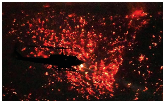
A helicopter is silhouetted by glowing embers as it makes a water drop at the "Old Fire", which burned in Calabasas, California, US, on 4 June 2016.