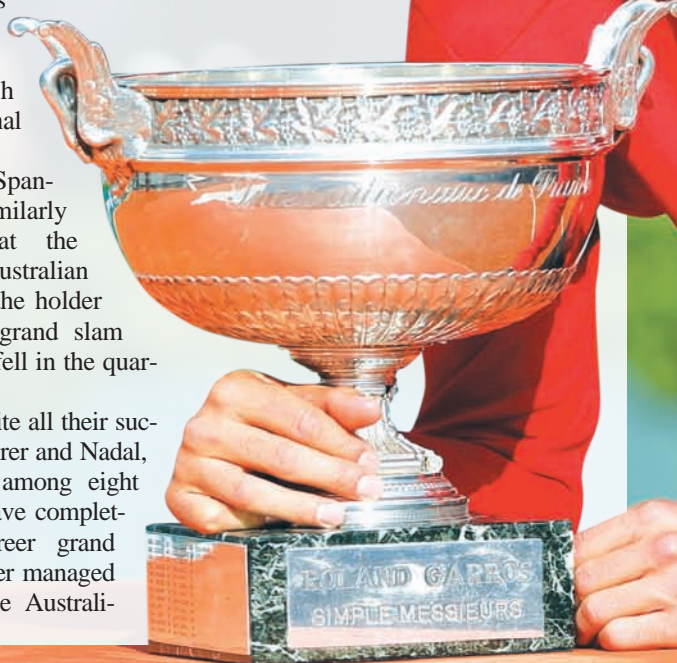
Djokovic celebrates with trophy on 5 June 2016.