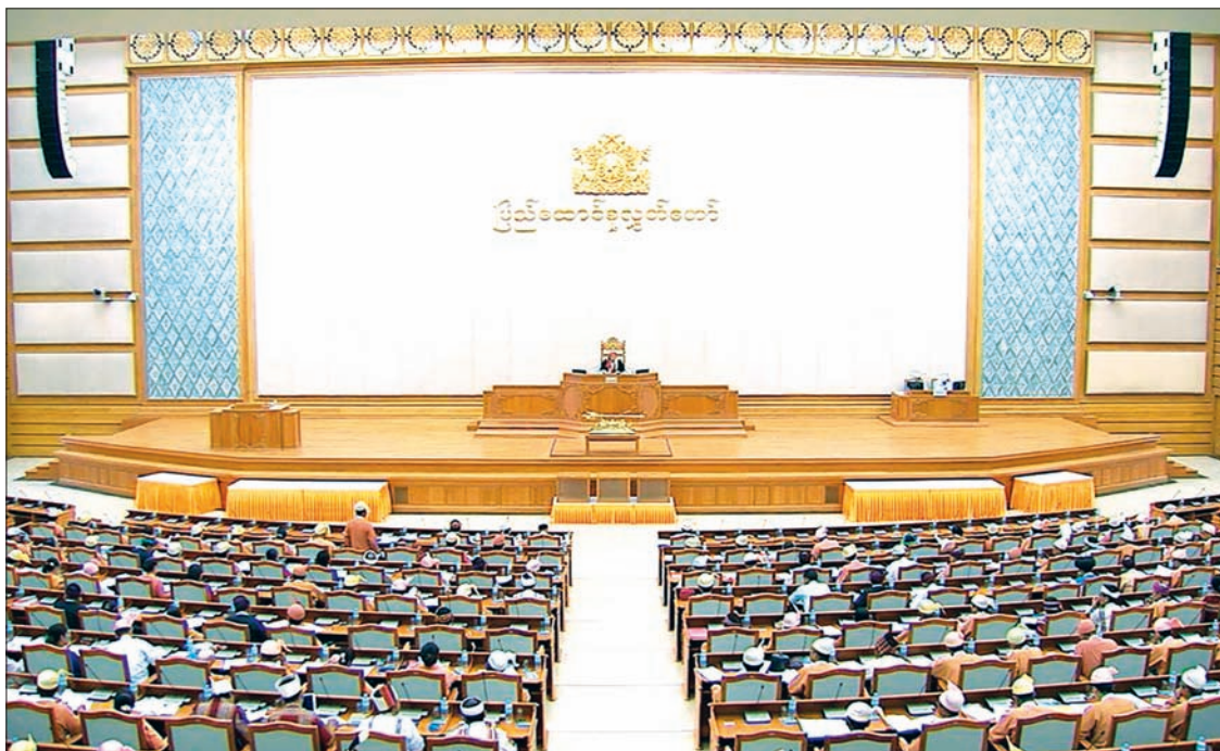
Pyidaungsu Hluttaw is convened in Nay Pyi Taw.

During the 26th day session of the Pyidaungsu Hluttaw, bills to amend the Pyithu Hluttaw, Amyotha Hluttaw and Region/State Hluttaw election laws, which are deemed to have been passed by the Pyidaungsu Hluttaw, were documented.— Myanmar News Agency