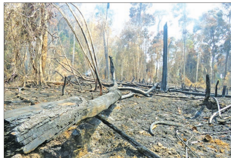
Land clearing in southern Taninthayi presumed to be for oil palm plantation in April 2016.

Village administrator U Maung Soe said those statues and ancient objects have been placed at the village Pagoda named Yadanamino, inviting people to visit the place and observe them.—Min Khant Soe (Zeyamye)