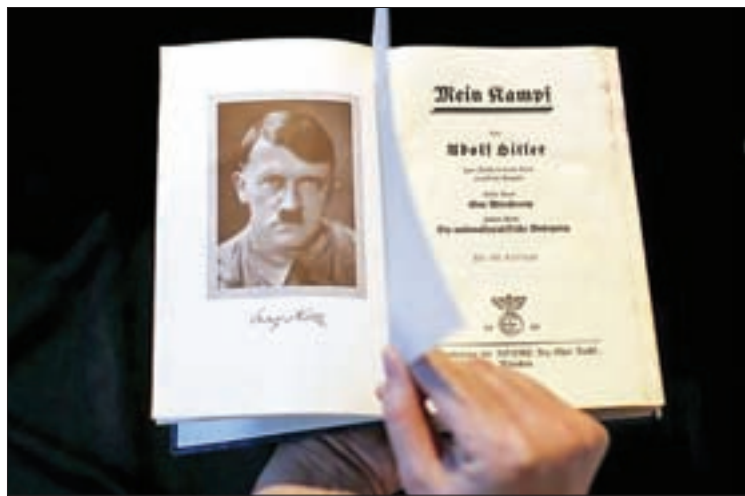
A copy of Adolf Hitler's book "Mein Kampf" (My Struggle) from 1940 is pictured in Berlin, Germany, in this picture taken on 16 December 2015.