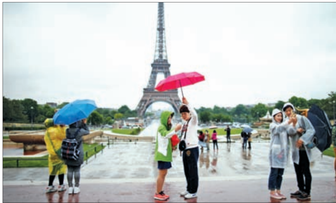
Tourists stroll on the Trocadero square, in front of the Eiffel Tower during a rainy day in Paris, France, on 30 May.

PARIS — As Paris tourism struggles to overcome last November's Islamist attacks, the world's most visited city faces a new threat: a wave of protests and further planned strikes, tourism officials warned on Monday.