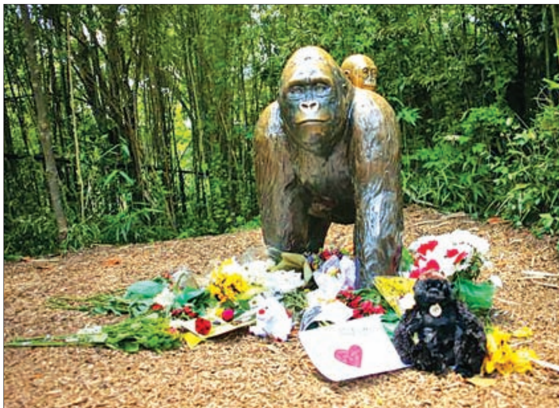
Flowers lay around a bronze statue of a gorilla and her baby outside the Cincinnati Zoo’s Gorilla World exhibit, two days after a boy tumbled into its moat and officials were forced to kill Harambe, a Western lowland gorilla, in Cincinnati, Ohio, US on 30 May.

accreditation standards, published on its website, said “some means of deterring public contact with animals (e.g., guardrails/barriers) must be in place.”