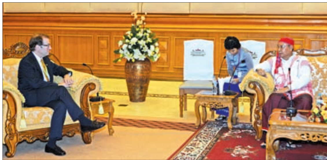
Speaker Mahn Win Khaing Than receives Mr Peter Roskam.

MAHN Win Khaing Than, Speaker of Pyidaungsu Hluttaw and Speaker of Amyotha Hluttaw, and Mr Peter Roskam, Chairman of the US House of Representatives' Democracy Partnership, held talks in Nay Pyi Taw yesterday over establishing friendly relations between the parliaments of the two countries and the US's