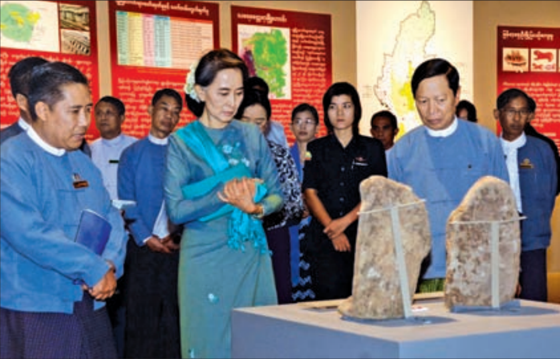
State Counsellor visits National Museum (Nay Pyi Taw).

STATE Counsellor Daw Aung San Suu Kyi stressed the need for international coordination to develop museums and make sure museums run successfully with the exhibition of items of historical significance including cultural heritage objects during her tour of the National Museum in Nay Pyi Taw yesterday. The State Counsellor visited halls with displays of objects from prehistoric times and observed primate exhibits and fossils. Union Minister for Religious Affairs and Culture Thura U Aung Ko and Permanent Secretary Dr Daw Nanda Hmum conducted her around the museum. The National Museum (Nay Pyi Taw) is located on Yaza Thingaha Road in Ottarathiri Township and has been open to the public since 5 July, 2015.— Myanmar News Agency