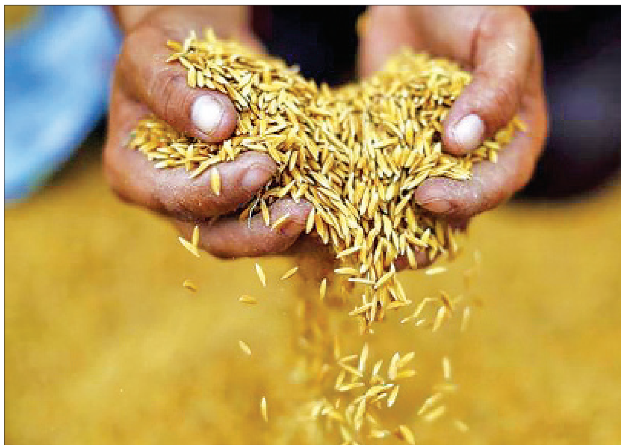
A rice mill worker holds up rice fallen onto the ground in Udon Thani, Thailand, in 2015.