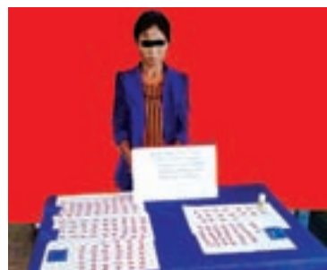
Yaba and heroin seized.