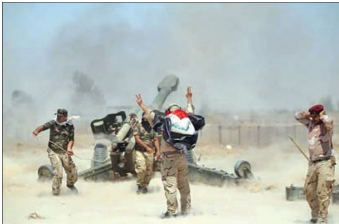
Shi'ite fighters and Iraqi security forces fire artillery during clashes with Islamic State militants near Falluja, Iraq, on 29 May.

Falluja has been under siege for more than six months. Foreign aid organisation is not present in the city, but are providing help to those who manage to exit