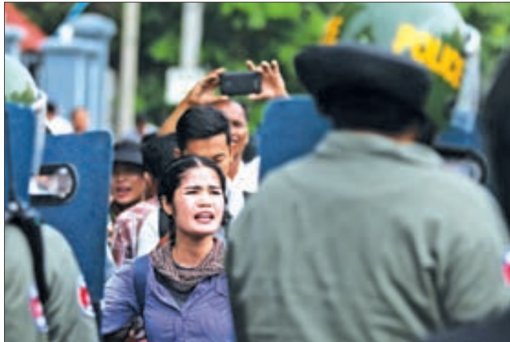
A supporter of opposition Cambodia National Rescue Party (CNRP) takes part in a march to deliver petition to the parliament and King Norodom Sihamoni to intervene in their country's current political crisis in Phnom Penh, Cambodia, on 30 May.

Party leader Sam Rainsy, a former finance minister, lives in self-exile to avoid arrest for an old defamation case he was pardoned for. His party has denounced the new warrant as politically motivated.