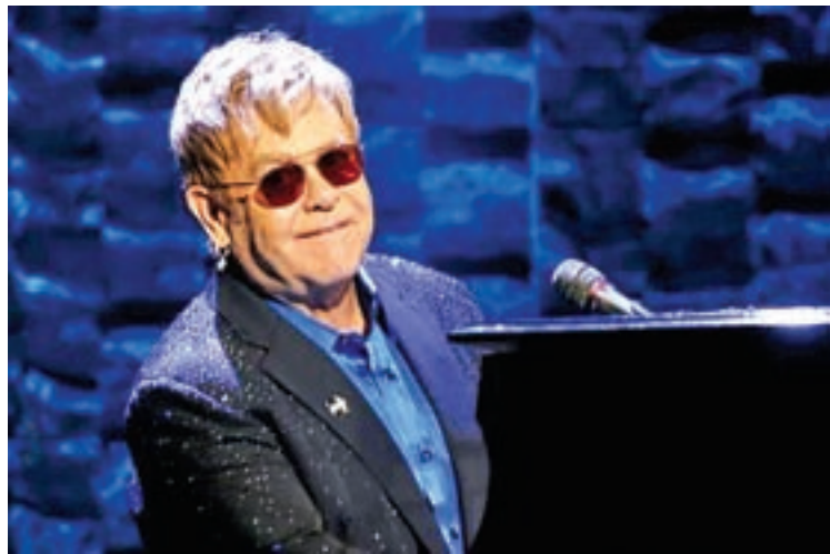
Singer Elton John performs at the Hillary Victory Fund "I'm With Her" benefit concert for US Democratic presidential candidate Hillary Clinton at Radio City Music Hall in the Manhattan borough of New York City, on 2 March, 2016.

MOSCOW — British singer Elton John told a concert in Moscow he still wanted to meet President Vladimir Putin to discuss his concerns about gay rights and AIDS in Russia despite the Kremlin leader not having time to meet him this time round.