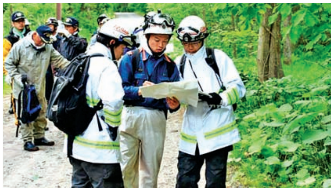
People search for a seven-year-old boy who went missing two days earlier, in Nanae town on the northernmost Japanese main island of Hokkaido, Japan, on 30 May 2016.

alone in the woods like that, my heart aches," said one person posting on social media.