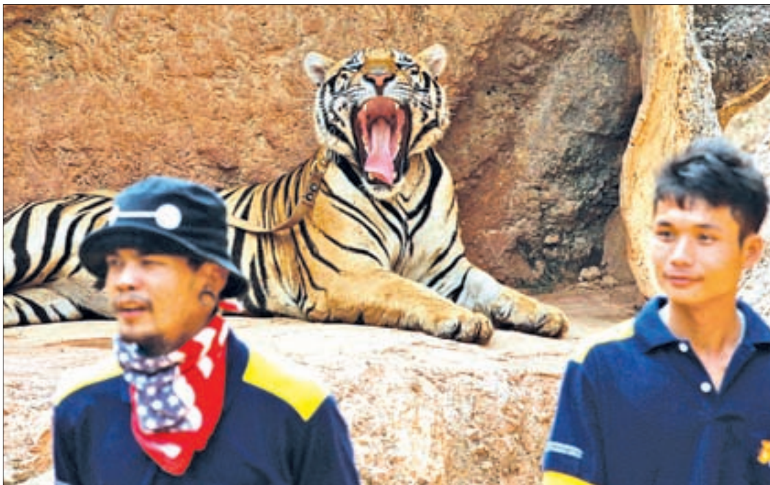
A tiger yawns before the officials start moving them from Thailand's controversial Tiger Temple, a popular tourist destination which has come under fire in recent years over the welfare of its big cats in Kanchanaburi Province, west of Bangkok, Thailand, on 30 May.

"We have a court warrant this time, unlike previous times,