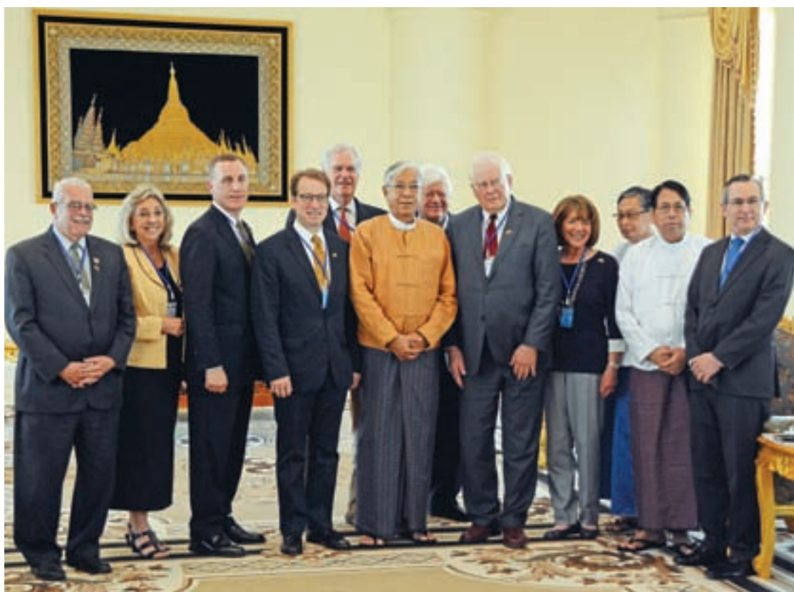
President U Htin Kyaw and Union Ministers pose for documentary photo with the delegation of the United States' House of Representatives .

The US delegation will meet cabinet members, Hluttaw representatives and CSOs, it has been learned.— Myanmar News Agency