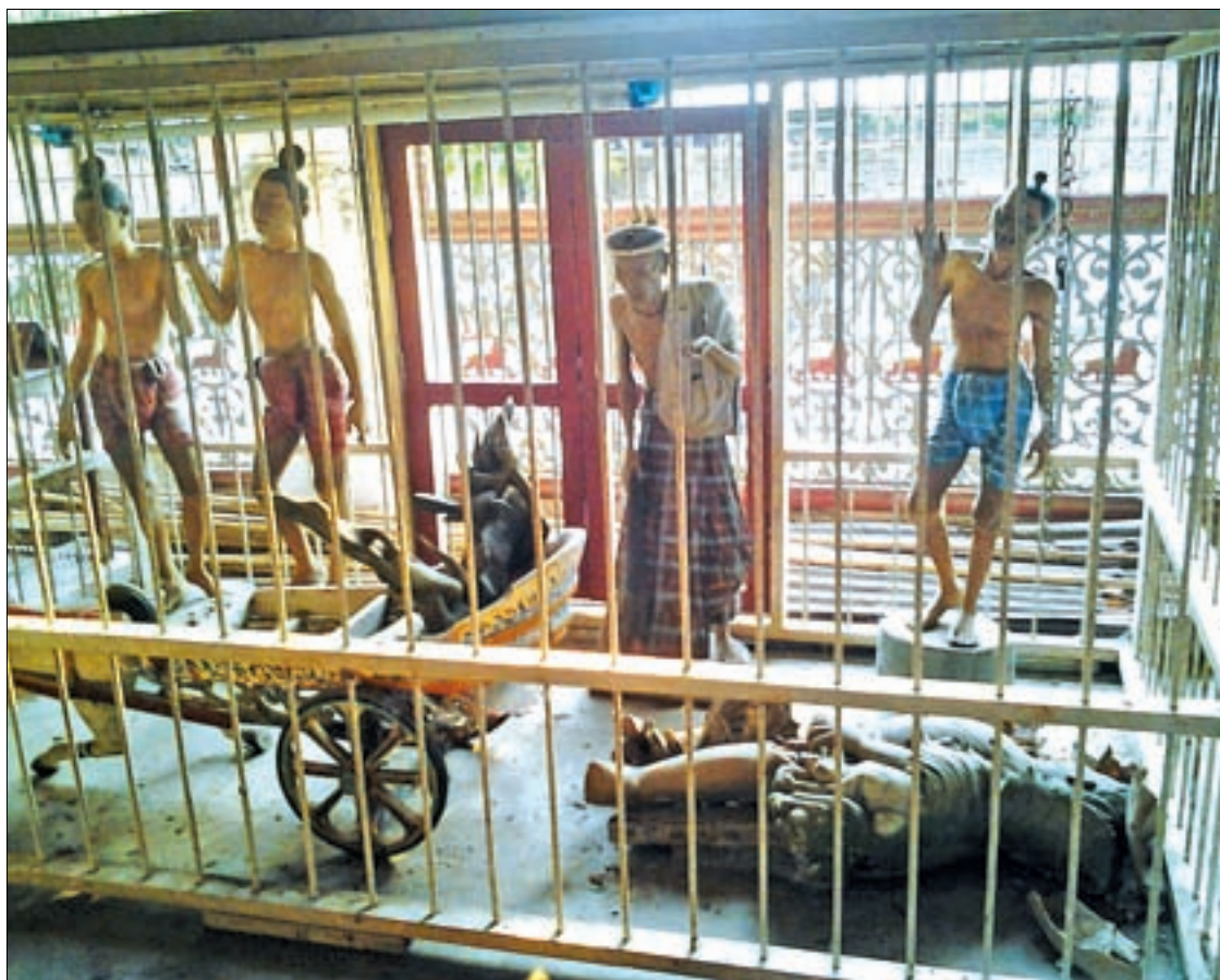
Picture shows statues depicting Four Noble Truth in Thun Pagoda in Nyaungdon Town.

S INCE 2011, there have been interests and actions for cultural heritage in Myanmar. Among the others, a very recent initiative on intangible cultural heritage was overtaken by the new government with the UNESCO, in the near past among the others: the projects for the recognition (2014) of UNESCO Pyu's Ancient Cities supported by Italy, the ones in INLE lake area undertaken by Norway, and some others. As usual in situations like Myanmar, the projects have been focused on specific sites with specific tasks, aiming to protect the buildings and their artworks (paintings, etc.), to create awareness about the conservation and restoration issues and to build skills and competencies on specific technologies such as GIS (Geographic Information System), as the mentioned UNESCO project did (2012-2013). Based on the several decades of consulting experience for Italian Ministry of Culture and designing decision support information systems for public authorities based on geo-