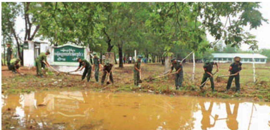
Soldiers seen carrying out cleaning operation in compound of BEHS in Taikkyi township.