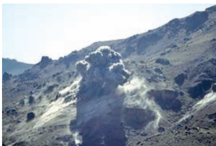
File photo of smoke billowing from a military arms depot after it was hit by a Saudi-led air strike on the Nuqom Mountain overlooking Yemen's capital Sanaa, in 2015.

The Houthis describe their capture of the capital, Sanaa, in 2014 and their advance on Aden as part of a revolution against corruption and to end attacks by