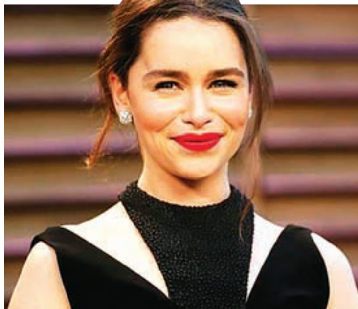
Actress Emilia Clarke.

The number of people registered HIV-positive passed the 1 million mark earlier this year and the country's top AIDS specialist warned the rate of infection had reached record levels.