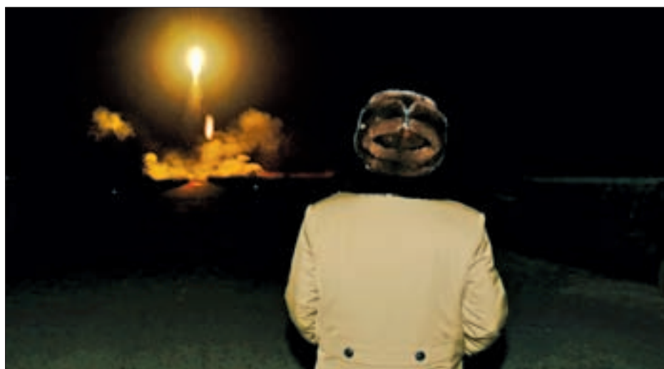
North Korean leader Kim Jong Un watches the ballistic rocket launch drill of the Strategic Force of the Korean People's Army (KPA) at an unknown location, in this undated file photo released by North Korea's Korean Central News Agency (KCNA) in Pyongyang on 11 March.

“We have no reports of any damage in Japan. We are gathering and analyzing data. The defence ministry is prepared to respond to any situation,” Japanese Minister of Defence Gen Nakatani told a media briefing.