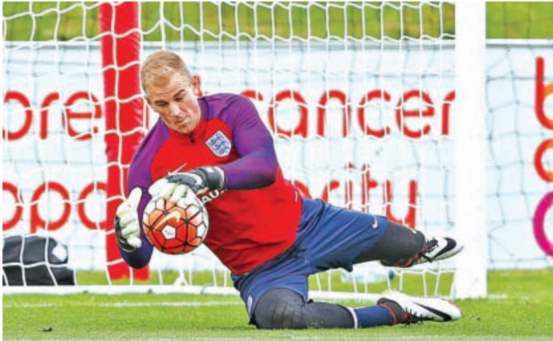
England's Joe Hart during training at St George's Park, Burton on Trent on 20 May 2016.