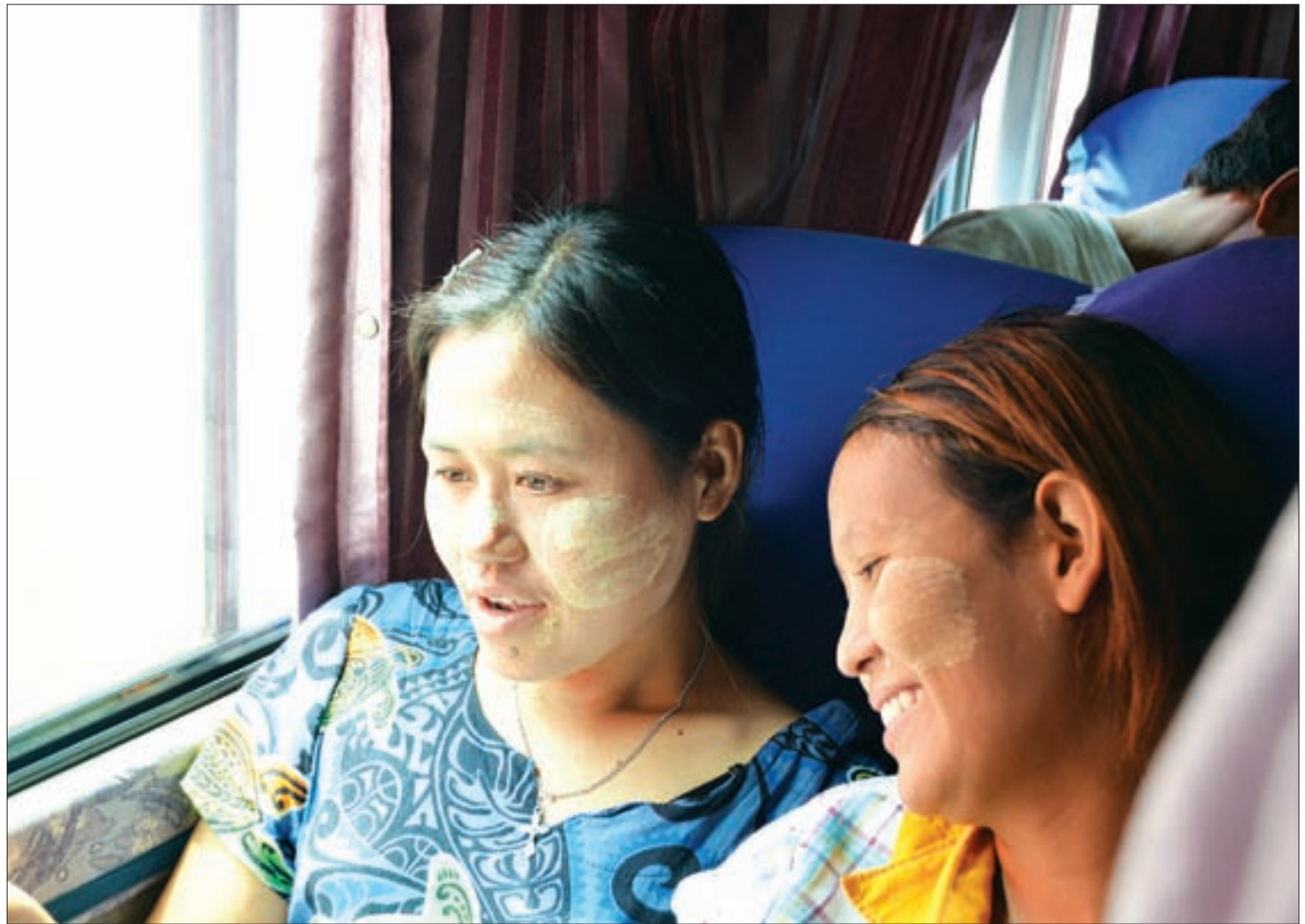
Released protestors being taken home to Sagaing.

However, the protestors ultimately rejected the offer from the Nay Pyi Taw Council chairman to negotiate with five labour leaders and attempted to pass the barricades.