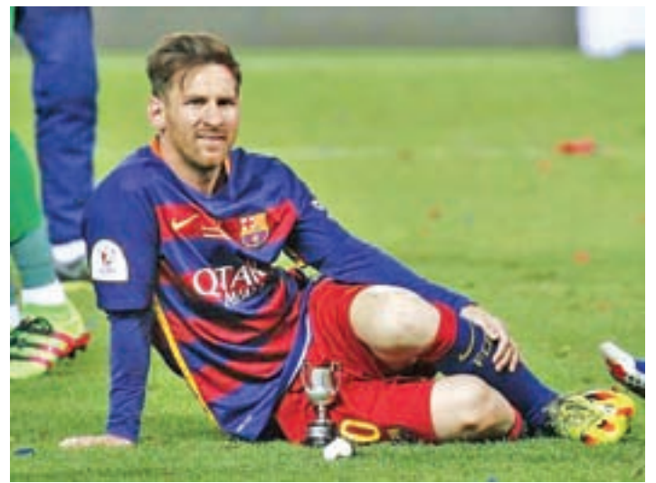
Barcelona's Lionel Messi celebrates after winning the Copa del Rey Final at Vicente Calderon, Madrid, Spain on 22 May 2016.

Messi and his father paid five million euros to the tax authorities as a "corrective" measure after being formally investigated in June 2013. Messi has been resident in Barcelona since 2000 and has had Spanish citizenship since 2005.— Reuters