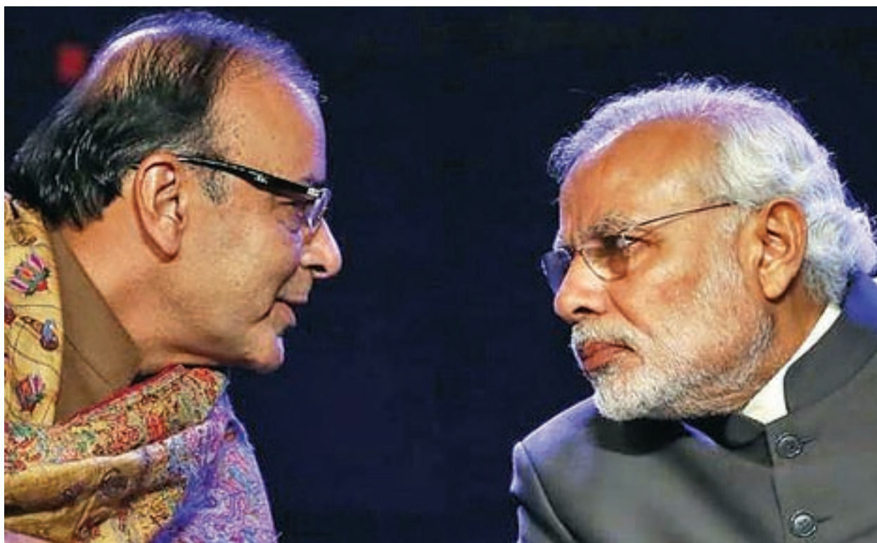
Prime Minister Narendra Modi listens to Finance Minister Arun Jaitley during the Global Business Summit in New Delhi on 16 January, 2015.

"We hope it will lead to an interpretation of the Indian Patent Act that respects