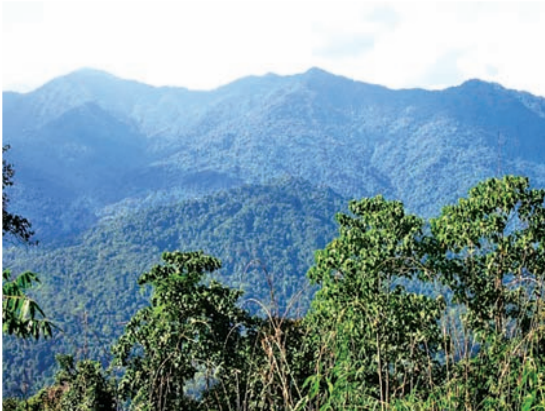
Hukaung Valley Wildlife Sanctuary in Myanmar.