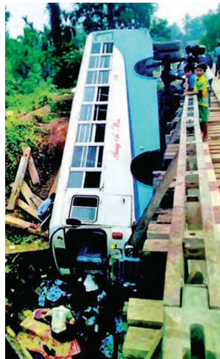
Passenger vehicle plunged down into the creek.