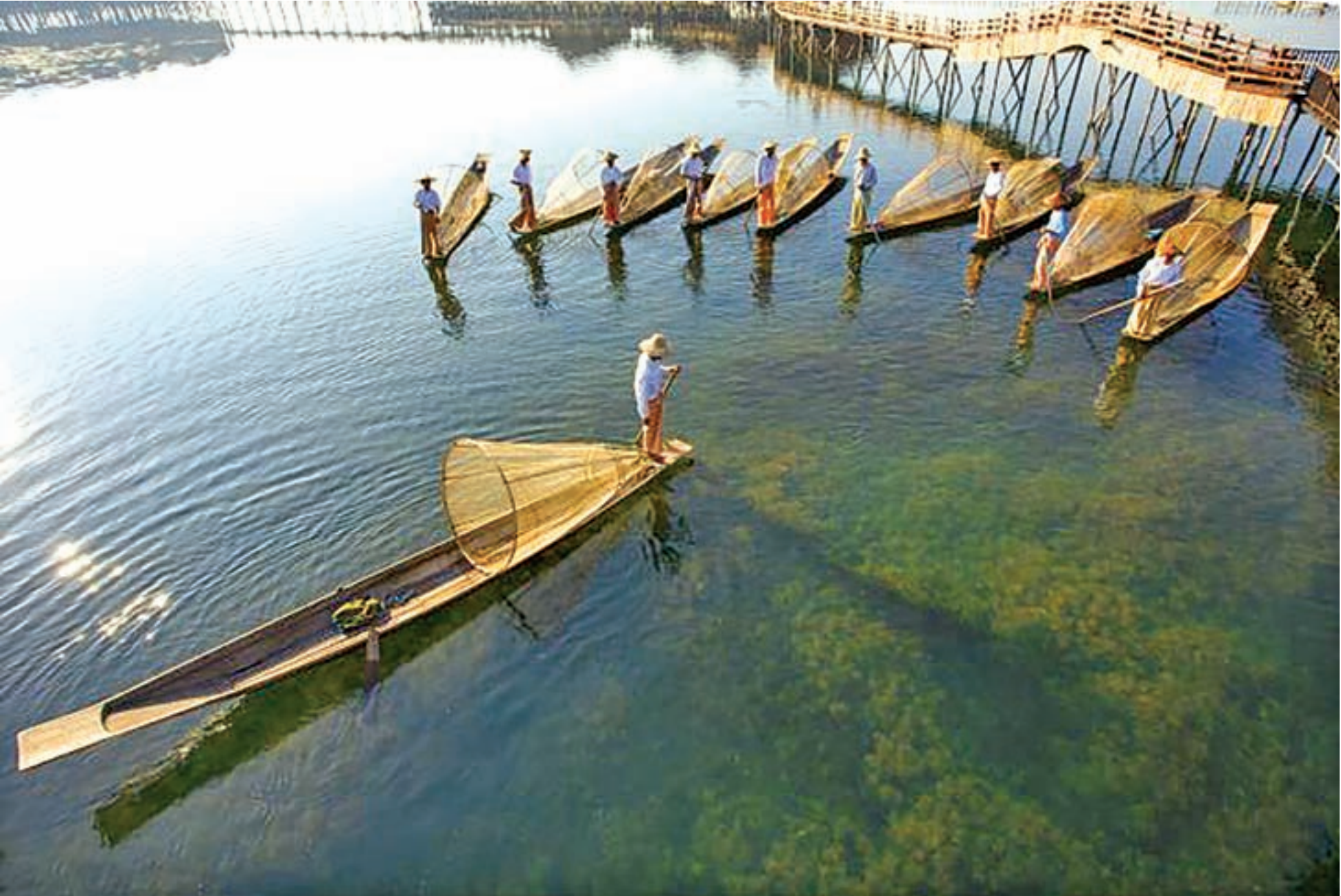
The group of fishermen from the Inle lake of Myanmar.

on the days of offering provisions and various articles to monks col- lectively by the local community, and the two groups used to have engagements with songs, side by side on the banks of a creek or one in the boat on water and the other in their houses on the beach, by turns, in a dialectical manner. In making decision as to the winning group of a duet, the leading fact or main theme raised by the proposers' group had to be refuted by the rivals in a short time and the defenders must be defeated when they couldn't deliver any rebuttal of the point to the proposer's sat- isfaction. In the case, the failure group tended to be mocked by the onlookers including the prompters and the choral singers of the win- ning group. However, in studying the heart of such duets and the intention of the match, it can be found that the singing of rhyming words in Myanmar traditional lyrical composition or the strophe and the antistrophe, rather than the decision of the winners or the losers in the dual singing, is to be empha- sized. This dominant trend of the duets can be examined in the lead and chorus in antiphorical singing of the lad and the lass in turns as: