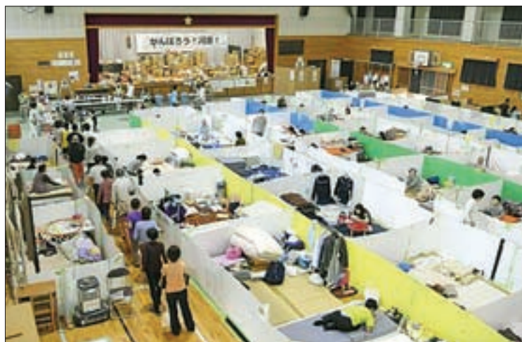
People are seen inside an evacuation center in Nishihara, Kumamoto Prefecture, southwestern Japan on 13 May 2016. Despite some signs of recovery including resumption of railway and expressway operations, more than 10,000 people are still taking refuge at such shelters, as May 14 marks one month after the first of a number of strong earthquakes rocked the area.

Nearly 80 per cent of 100 evacuees in Kumamoto said they cannot return home as their houses were destroyed, according to a Kyodo News survey conducted