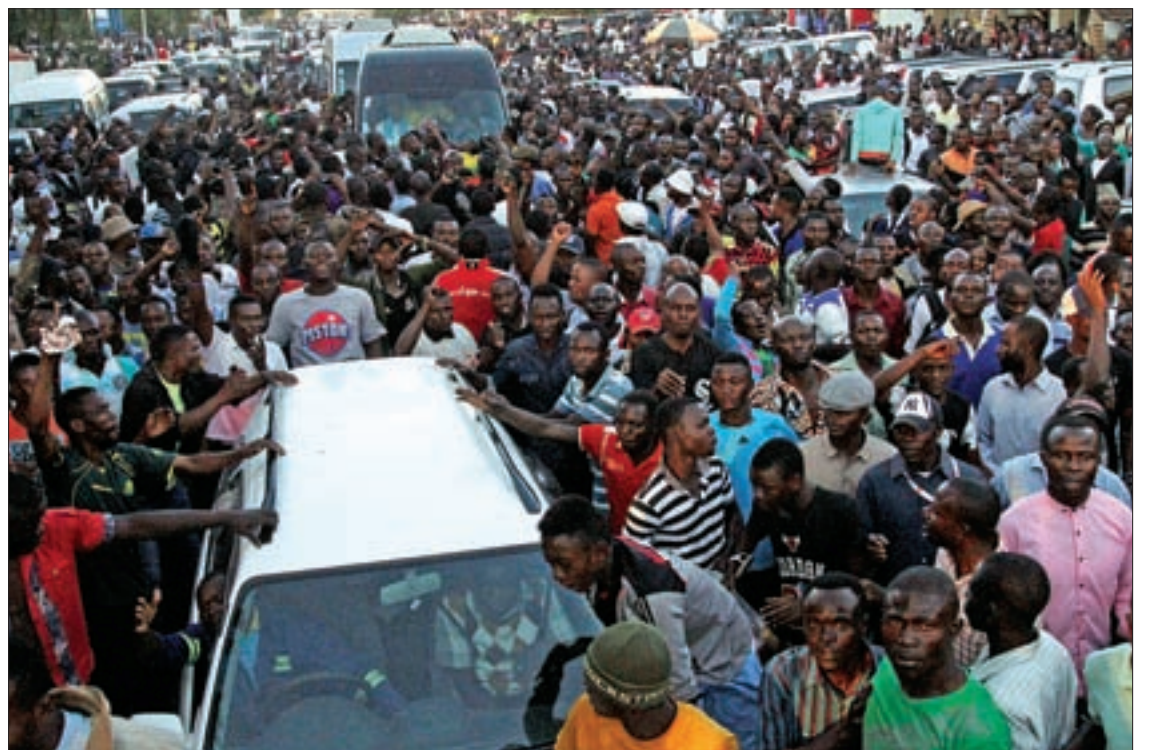
Supporters of Democratic Republic of Congo's opposition Presidential candidate Moise Katumbi escort him as he leaves the prosecutor's office in Lubumbashi, the capital of Katanga province of the Democratic Republic of Congo, on 11 May 2016.

"It's sad that there is not a state of law — police officers who throw stones and wound my older brother," Katumbi said before finally entering the building.—Reuters