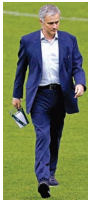
Former Chelsea manager Jose Mourinho walks during a friendly soccer match between FIFA Football Legends against Mexican all-stars as part of the 66 th FIFA Congress and 50 th anniversary of the Azteca stadium, at Azteca stadium in Mexico City, Mexico, on 11 May 2016.

LONDON — Former Chelsea manager Jose Mourinho has no agreement in place to take over at Manchester United, Sky Sports television said on Friday quoting unnamed sources.