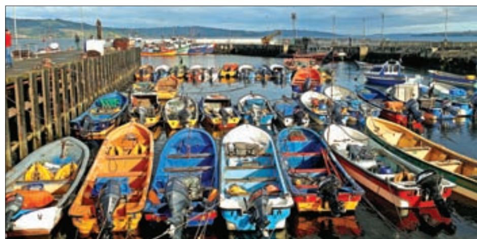
Fishworkers’ boats are seen moored at a fishing bay in the aftermath of a harmful algal bloom at Chiloe island in Chile, on 12 May 2016.

“A team of five excellent professionals has been formed that will be working on the task of examining the link between the dumping of salmon and the red tide phenomenon,” Economy Minister Luis Felipe Céspedes said in a statement. Fishermen have blockaded the principal access point to the island of Chiloe for the past three weeks, largely isolating its population of around 140,000 and stranding some tourists.— Reuters