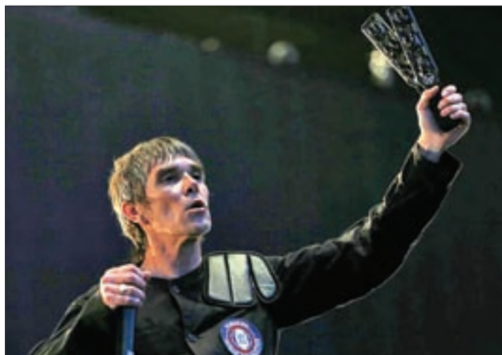
Stone Roses lead singer Ian Brown performs at Finsbury Park in London, in 2013.

NEW YORK — The Stone Roses, the English band that influenced a generation of others including Oasis, has released its first original single in 21 years to mixed reviews.