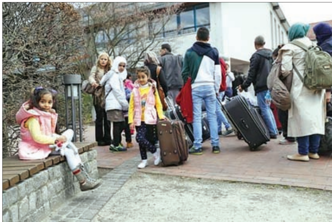
Syrian refugees arrive at the camp for refugees and migrants in Friedland, Germany, on 4 April.