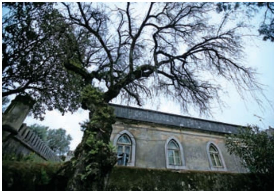
The Quinta Nova da Assuncao mansion, where Reflexo theatre company performs the show "Casa Assombrada" (haunted house), is seen in Belas, near Sintra, Portugal on 9 April 2016.

LISBON — At the Quinta Nova da Assuncao mansion near Lisbon, all is not quite right.