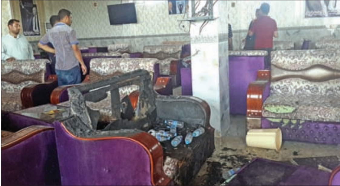
People gather at a cafe after an attack in the predominately Shi'ite Muslim town of Balad, Iraq, on 13 May 2016.

TIKRIT (Iraq) — Shooting and bomb attacks claimed by Islamic State killed at least 16 people north of Baghdad on Friday, days after Islamic State's deadliest blasts so far this year in the capital stirred public criticism of government security measures.