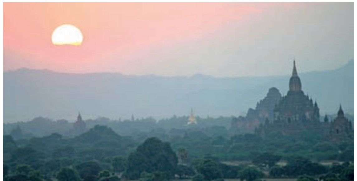
Sun sets in Bagan.

Kerry's visit to Myanmar is his first since the party of Aung San Suu Kyi, the country's Nobel laureate, swept to power following a landslide election win in November. A constitution drafted by the country's former military rulers bars her from becoming president.