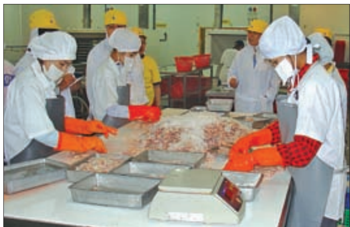
Workers sort out prawns at a factory.

Previously, countries from the ASEAN region such as Thailand, Viet Nam, China, South Korea and Japan made contracts with factories with this system and then more countries such as the USA, Brazil, Norway and France also joined hands with cold-storage factories.— Chan Chan