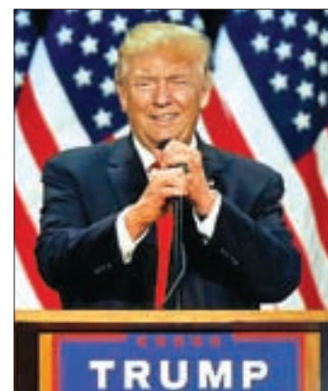
Republican US presidential candidate Donald Trump speaks at a campaign rally in Eugene, Oregon, US on 6 May 2016.

Trump has said the Internal Revenue Service was auditing his