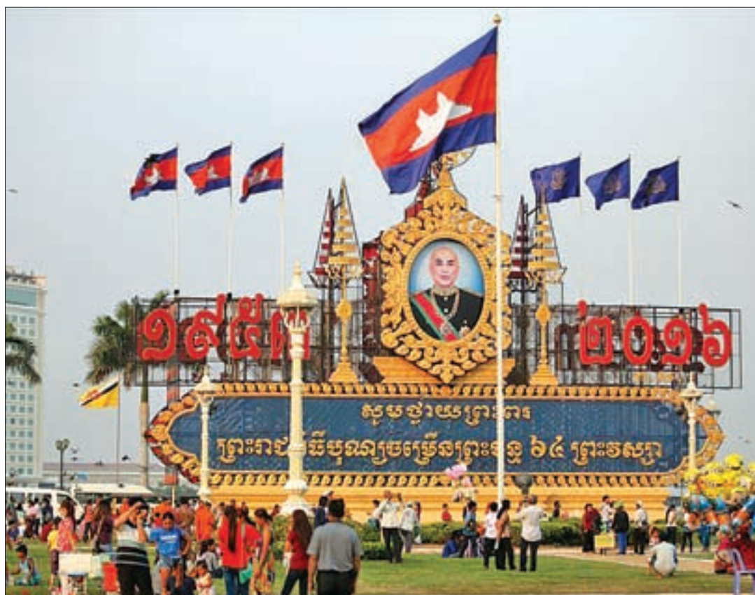
Photo taken on 13 May, 2016 shows the portrait of Cambodian King Norodom Sihamoni at the Royal Palace in Phnom Penh, Cambodia. Cambodia began the three-day celebrations of the 63 rd birthday of King Norodom Sihamoni on Friday.