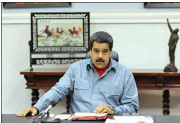
Venezuela's President Nicolas Maduro attends a Council of Ministers meeting at Miraflores Palace in Caracas, Venezuela, on 13 May 2016.

Washington has had an acrimonious relationship with Caracas for years, especially follow-