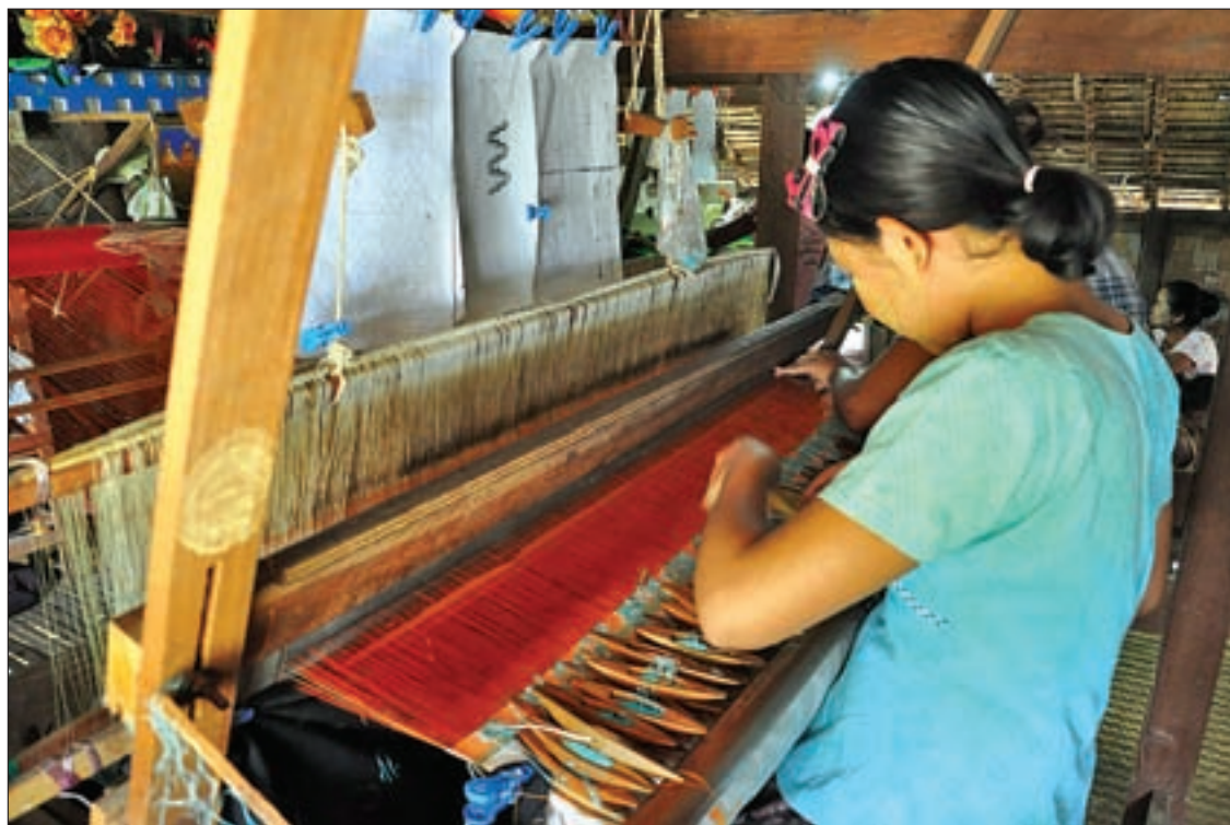
A woman seen working at a small enterprise.

THE International Labour Organisation (ILO) is planning to assist in training instructors for management teaching courses for small and medium sized enterprises (SMEs), it has been learned.