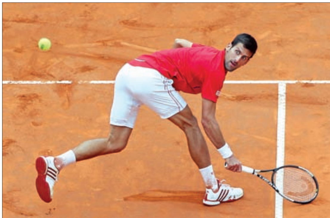
Djokovic returns the ball during Italy Open Men's Singles Quarterfinal match at Rome, Italy on 13 May 2016.

She plays American Madison Keys who overcame Czech Barbora Strycova 6-4, 4-6, 6-3. Romania's Irina-Camelia Begu saw off Misaki Doi of Japan 6-2, 7-6 (3) and next faces world number one Serena Williams or Russia's Svetlana Kuznetsova. —Reuters