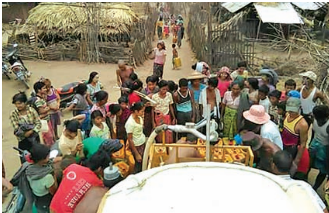
Villagers collecting water distributed by the DRD and RTD.

TO aid local people suffering from water scarcity issues caused by the rising heat that accompanies El Niño, the Department of Rural Development (DRD) of Natmauk Township together with the Road Transportation