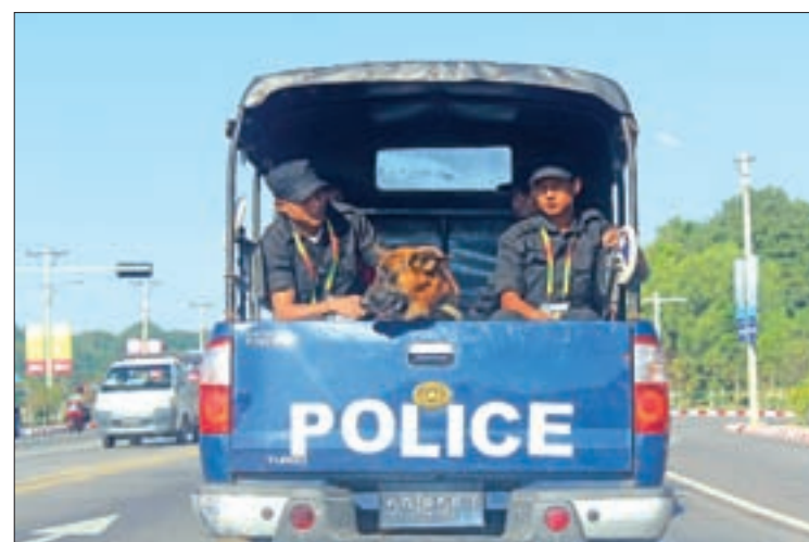
Security police are seen in Nay Pyi Taw .

It is known alliance organizations the Police Department will work together with as part of the crime reduction initiative include the General Administration Department (GAD); Department of Law; Law Courts; Department of Information; Department of Health; Special Branch (SB); Department of Immigration and National Registration;