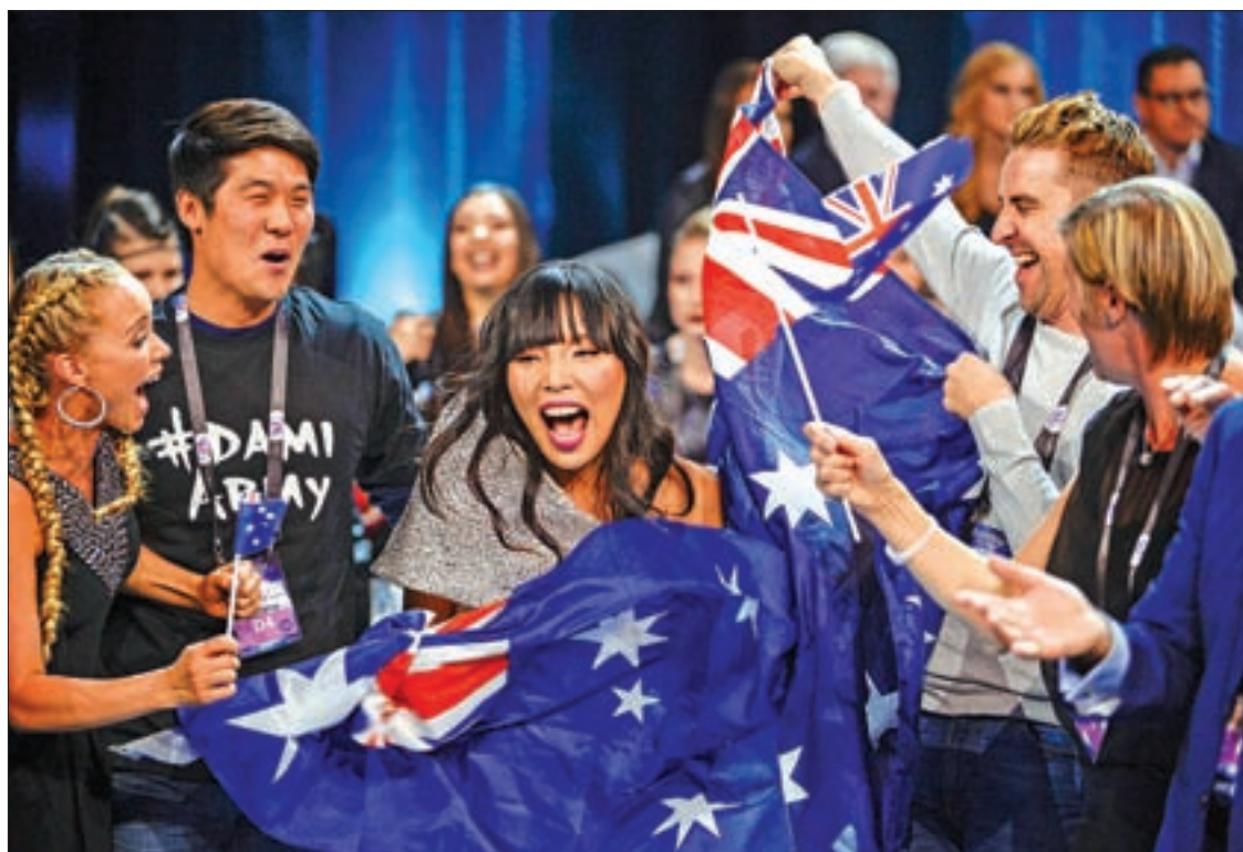
Australia’s Dami Im and her team cheer in the Green Room during the Eurovision Song Contest 2016 semi-final 2 at the Ericsson Globe Arena in Stockholm, Sweden, on 12 May 2016.

Meanwhile, Russia, is tipped to win with a breezy europop number “You are the Only One”, by Sergey Lazarev. A victory for Russia, which started competing